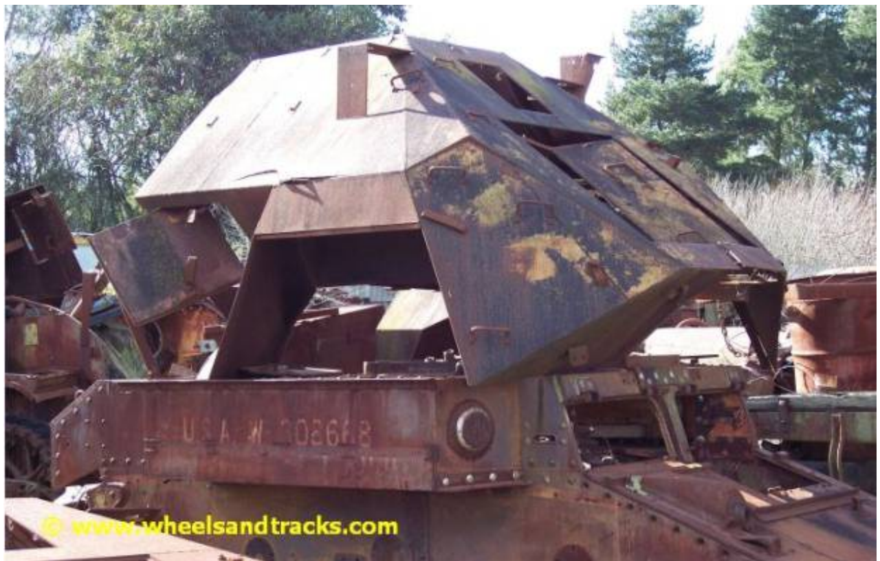
Some Rover Light Armoured Car armour parts Nungarin Heritage Machinery & Army Museum, Nungarin, WA (Australia)