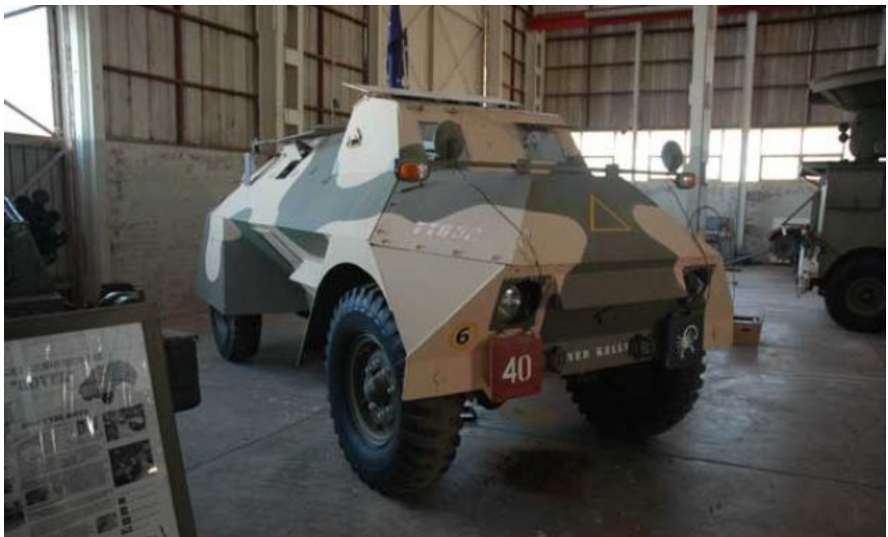
Rover Light Armoured Car – Australian Armour and Artillery Museum Cairns, QLD (Australia)

Keith Webb - http://www.imagecontrol.com.au/oldcmp/MVCSSA_acars.html#Anchor-47857