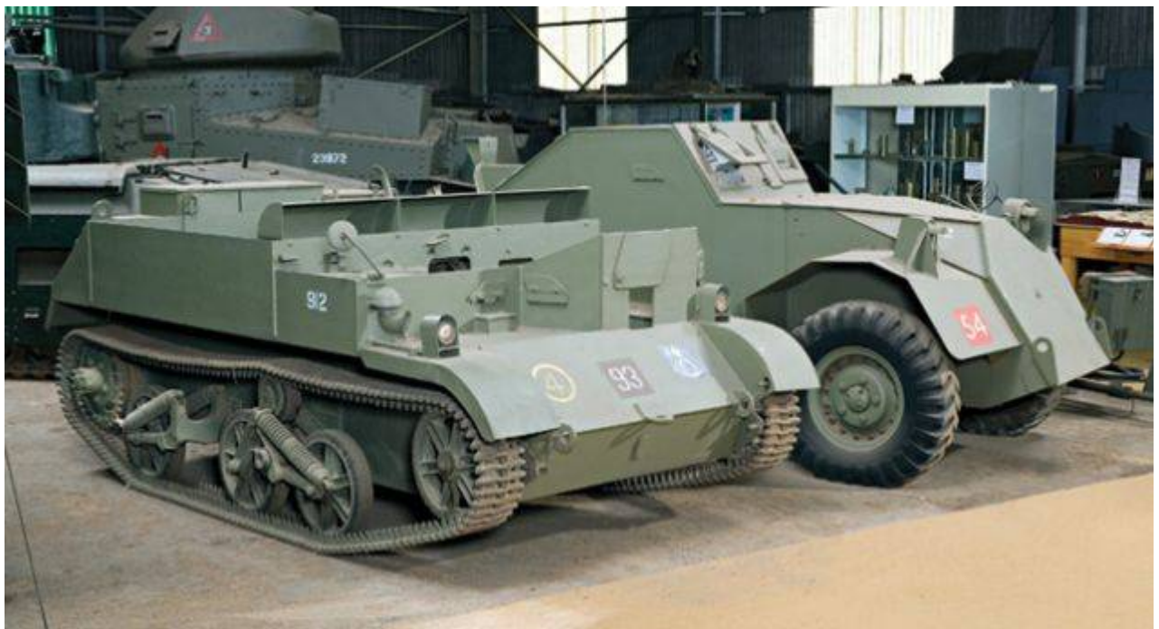
Australian Dingo Scout Car – Private collection, North Maleny, QLD (Australia)