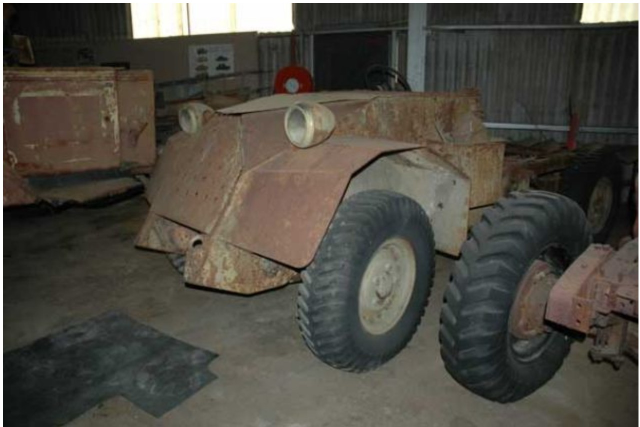
Keith Webb, 2007 - http://www.imagecontrol.com.au/oldcmp/Belf_dingo.html#Anchor-49575