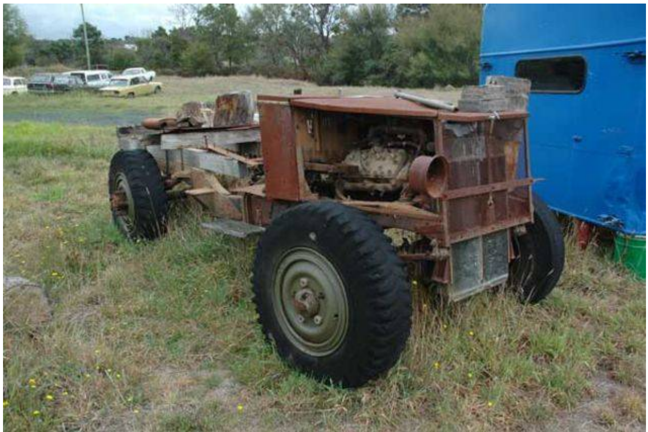
Australian Dingo Scout Car wreck