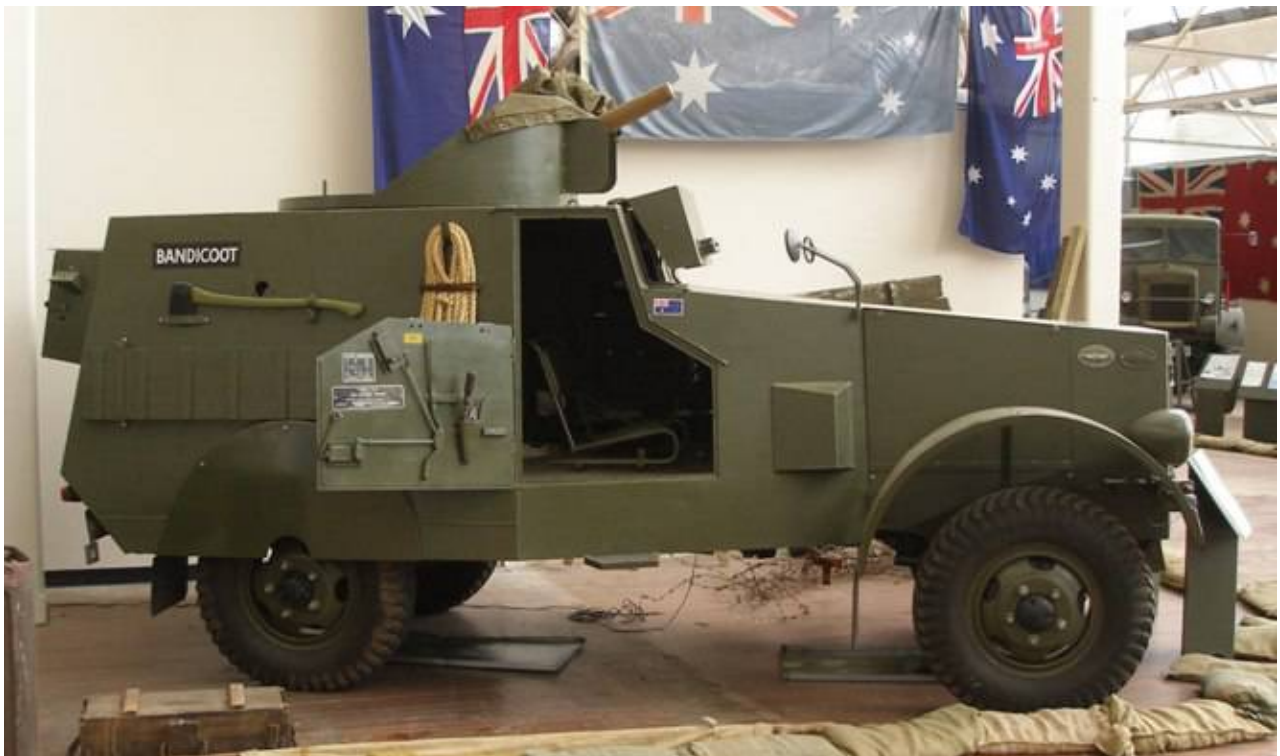
Ley Reynolds - http://www.warwheels.net/LocalPattern4AussieREYNOLDS.html