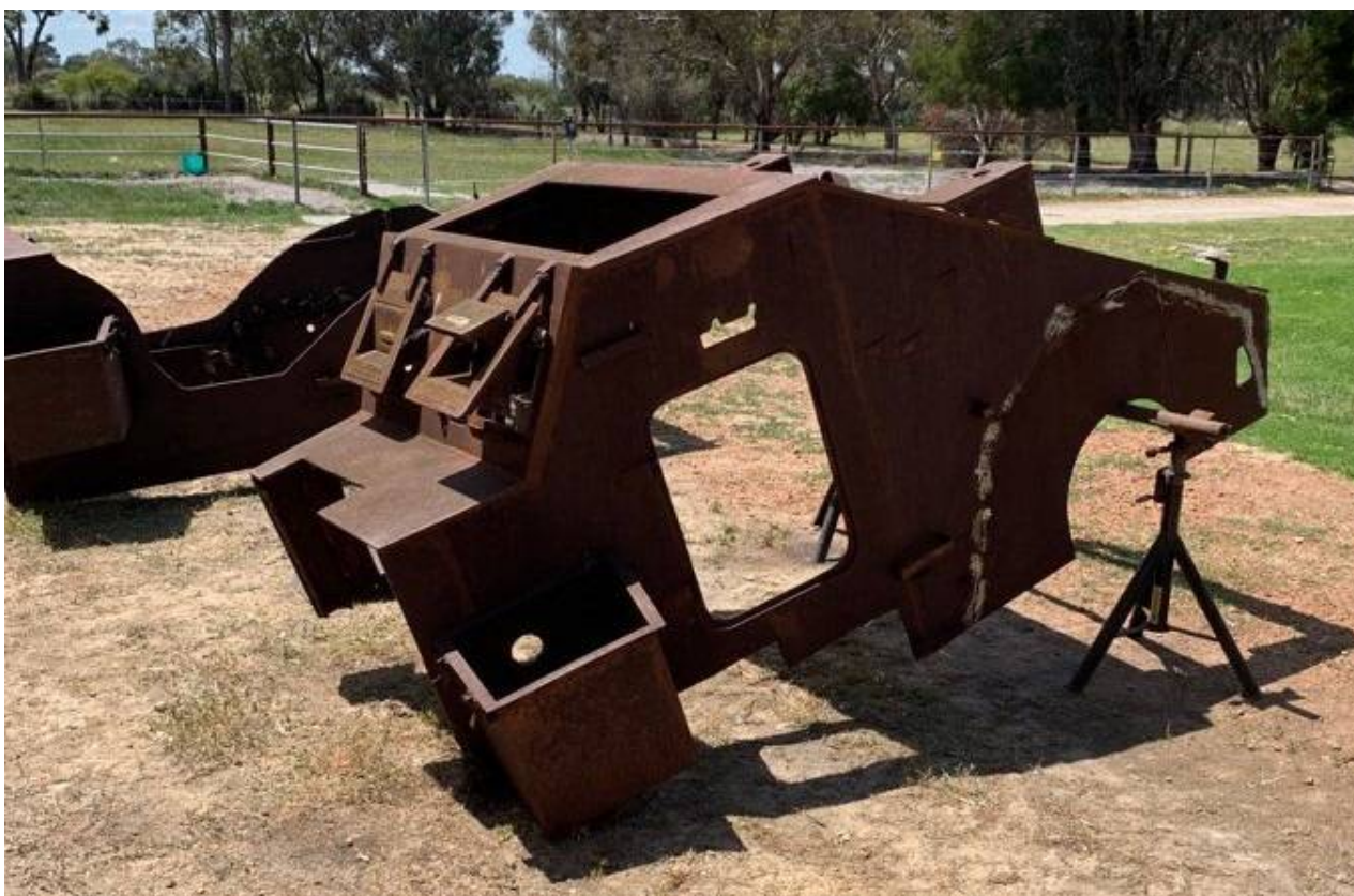
Australian Dingo Scout Car chassis – John Belfield Collection (Australia) Chassis number 2C 14482F (OLDCMP.net)

https://www.facebook.com/groups/66266488488/permalink/10158822609618489/