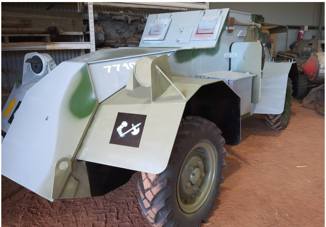
Australian Dingo Scout Car – Nungarin Heritage Machinery and Army Museum, Nungarin, Western Australia (Australia)

https://www.facebook.com/photo?fbid=5152045328142101&set=gm.3097957897085131