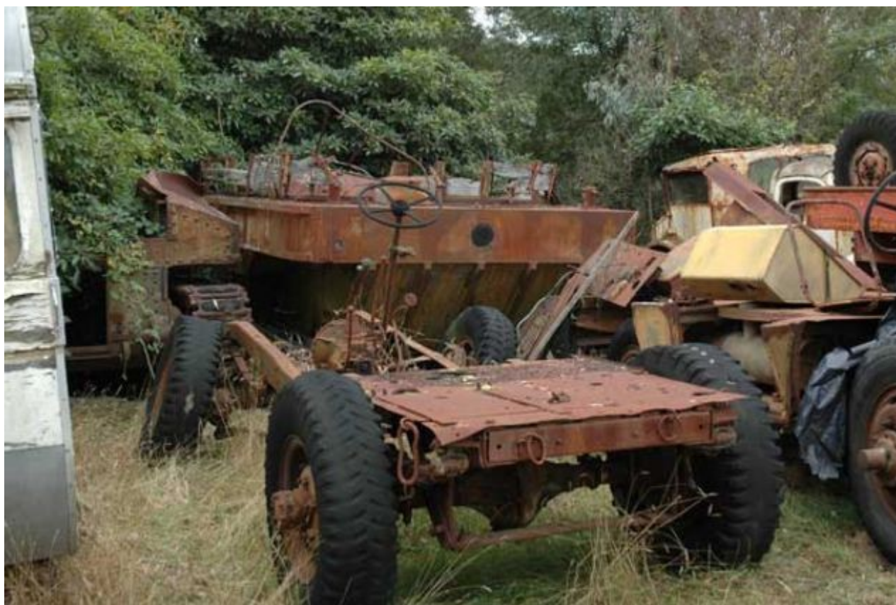
Australian Dingo Scout Car chassis – John Belfield Collection (Australia) Chassis number 2C 10320F (OLDCMP.net)

Keith Webb, 2007 - http://www.imagecontrol.com.au/oldcmp/Belf_dingo.html#Anchor-49575