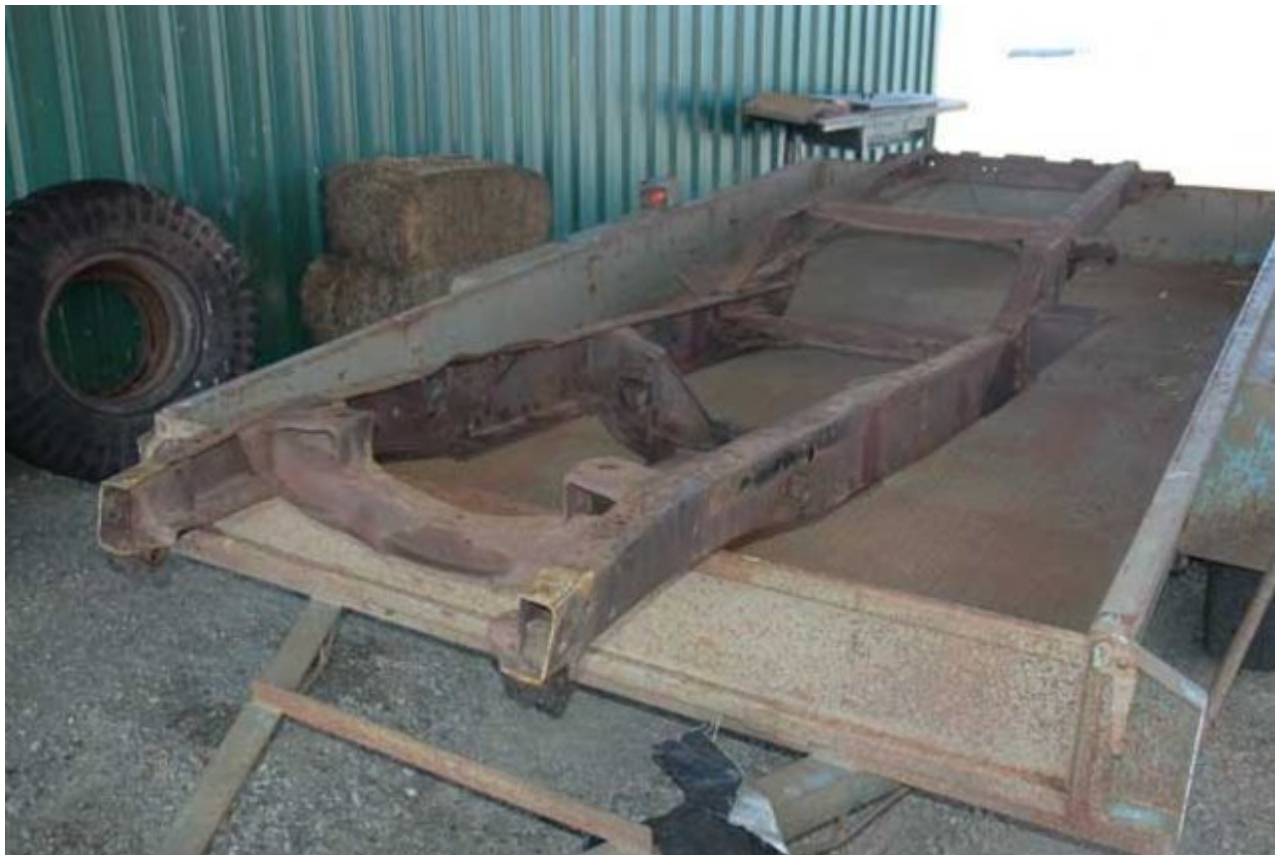
Australian Dingo Scout Car resto. project – Private collection, WA (Australia)

http://www.imagecontrol.com.au/oldcmp/Dingo_1.html#Anchor-49575