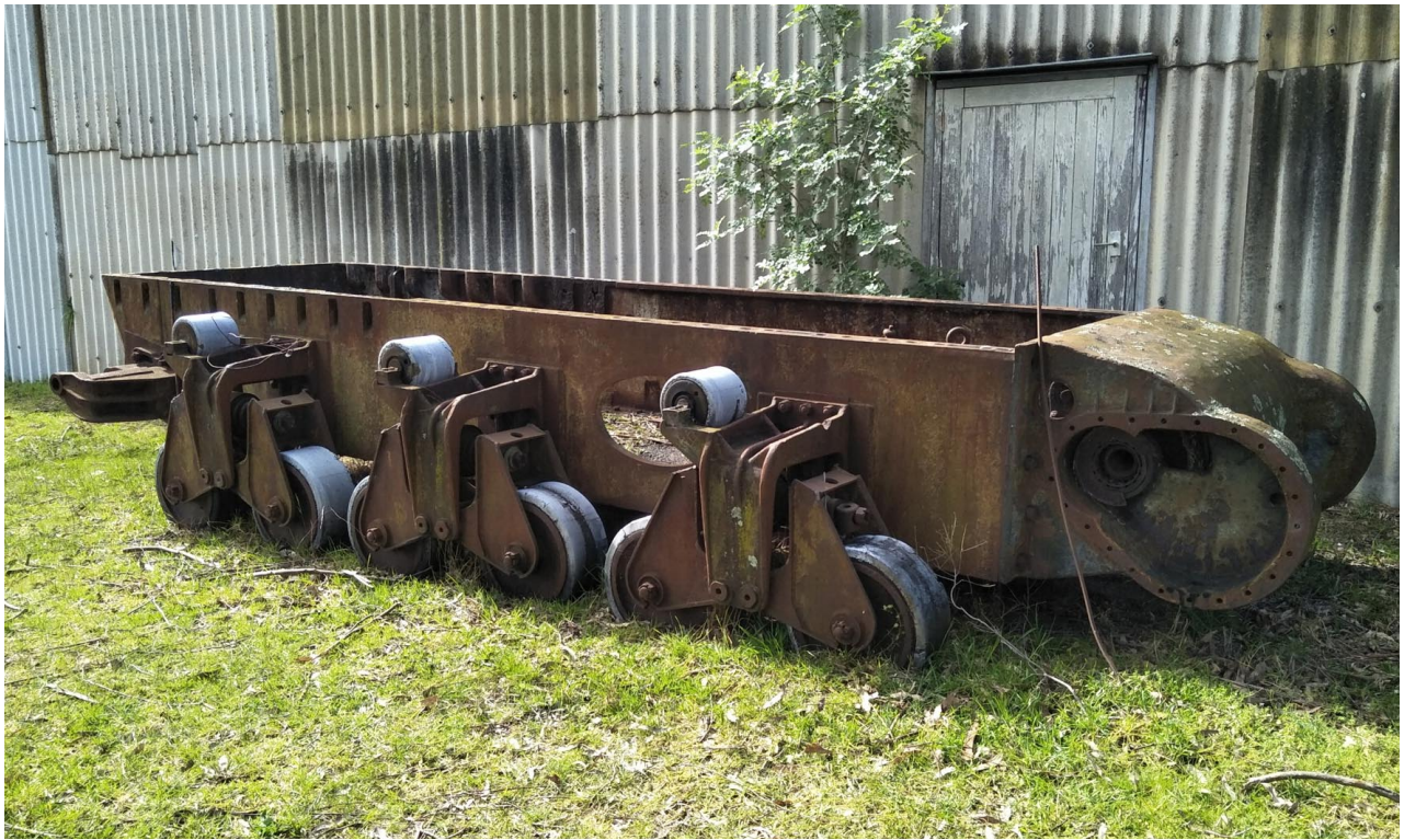
"Luke", September 2018