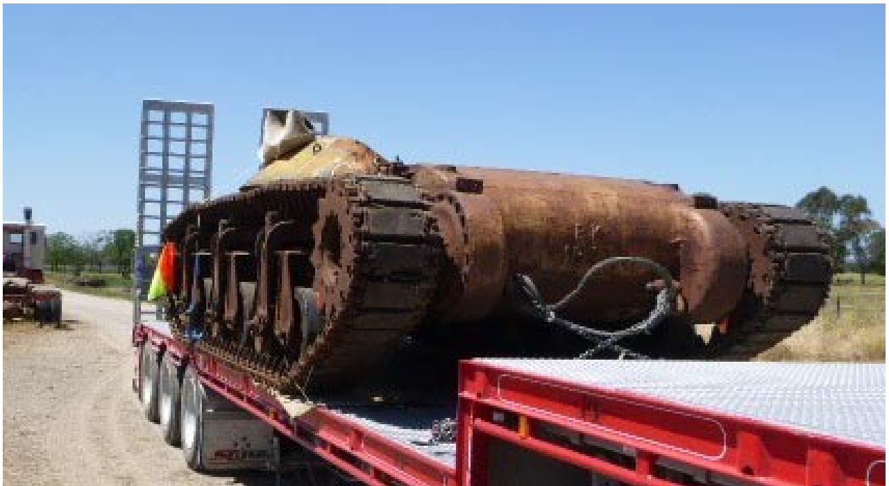
Rod Bellars, October 2014

This hull is Serial Number 8001. The lower hull is 'complete', i.e. uncut, it is designed such that different upper hulls can be bolted to it for testing (Robert Stewart)