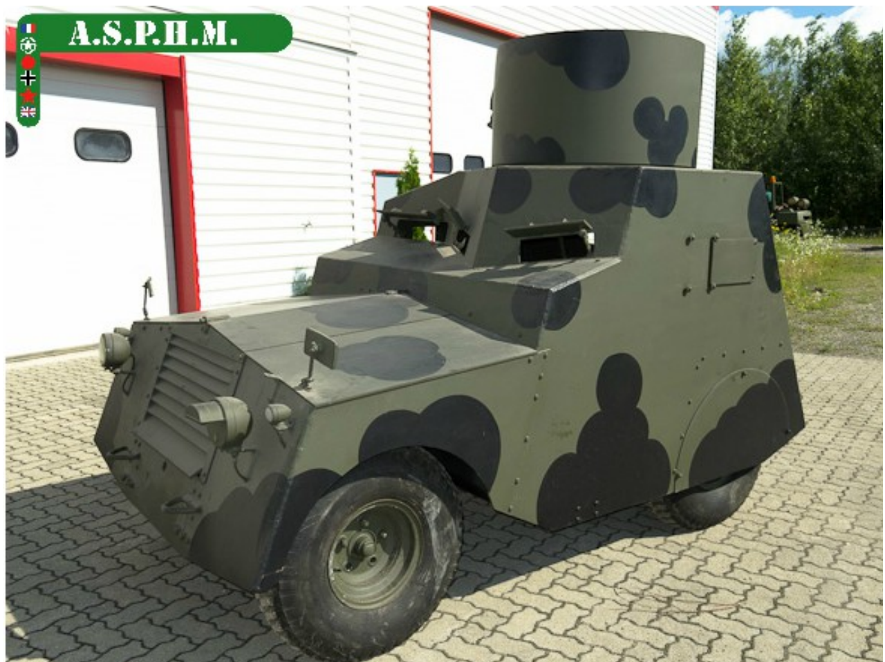
Beaverette Armoured Car Mk IV – Stichting Nationaal Militair Museum, Soesterberg (Netherlands)

http://www.asphm.com/vehicules/standart_beaverette/standart_beaverette.html