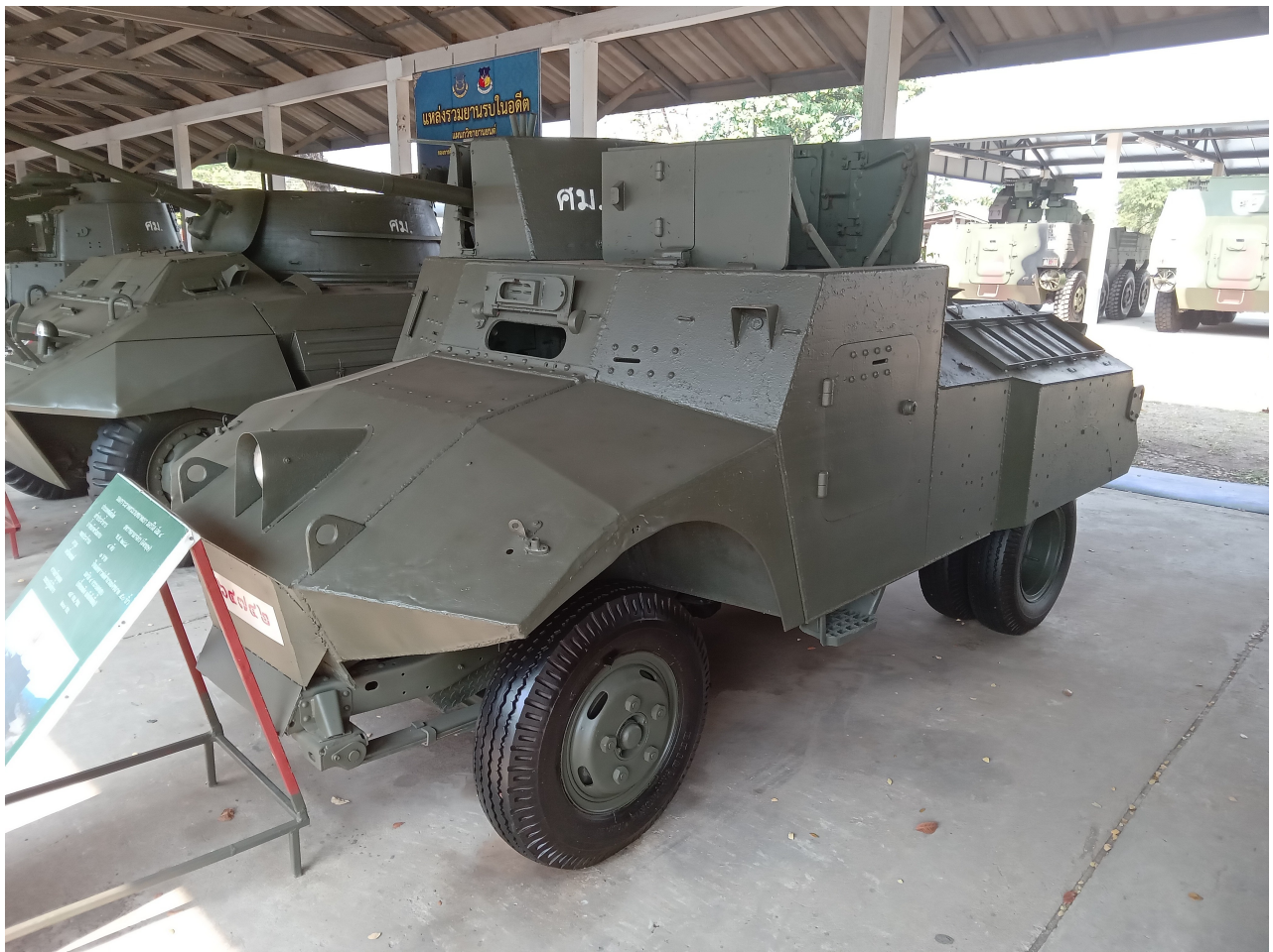
Jim Goetz, January 2023