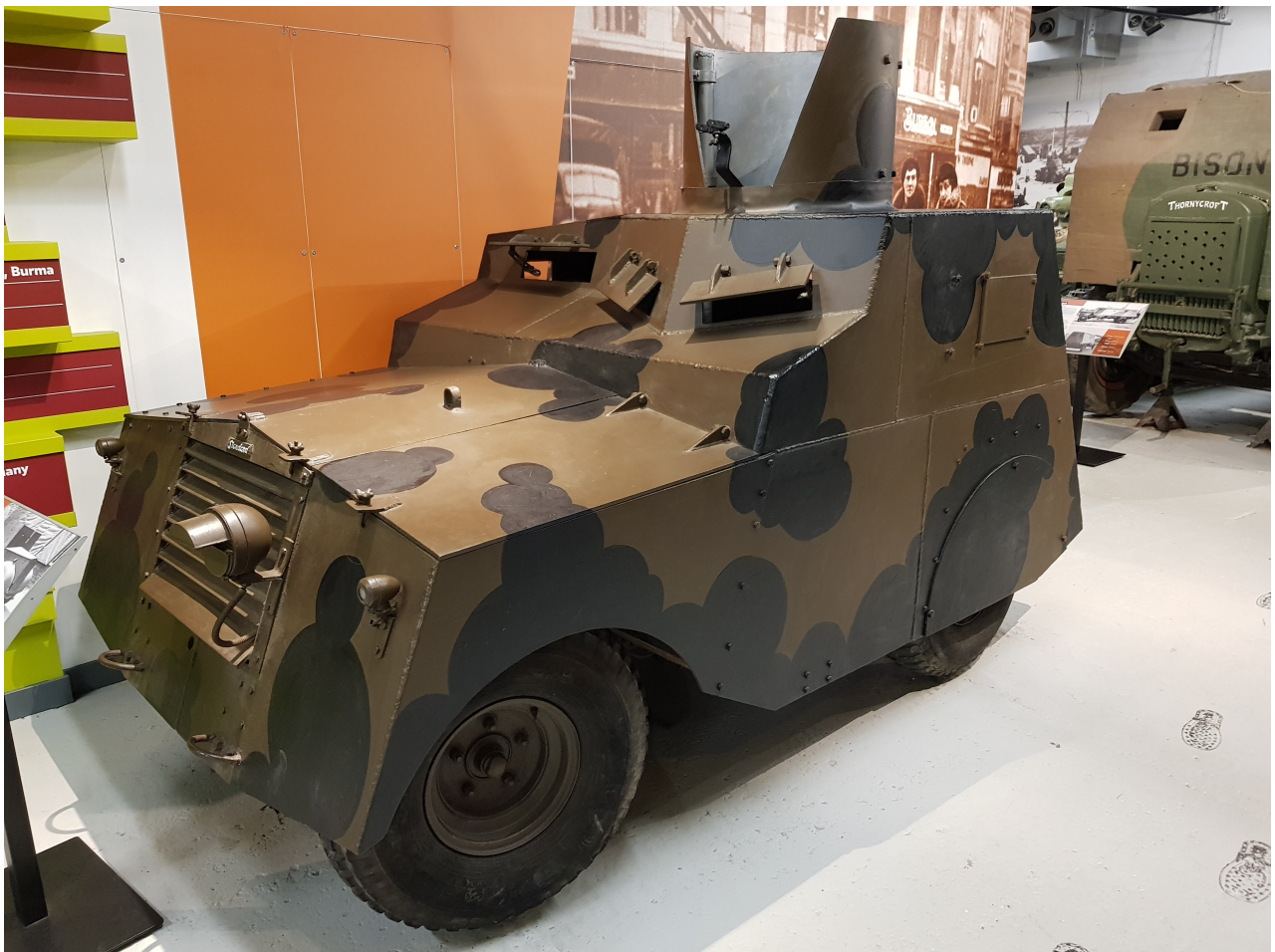
Lanchester Armoured Car Mk II – Bovington Tank Museum (UK)

"Megashorts", April 2009 - http://www.flickr.com/photos/megashorts/3425084380/in/set-72157609057315170/