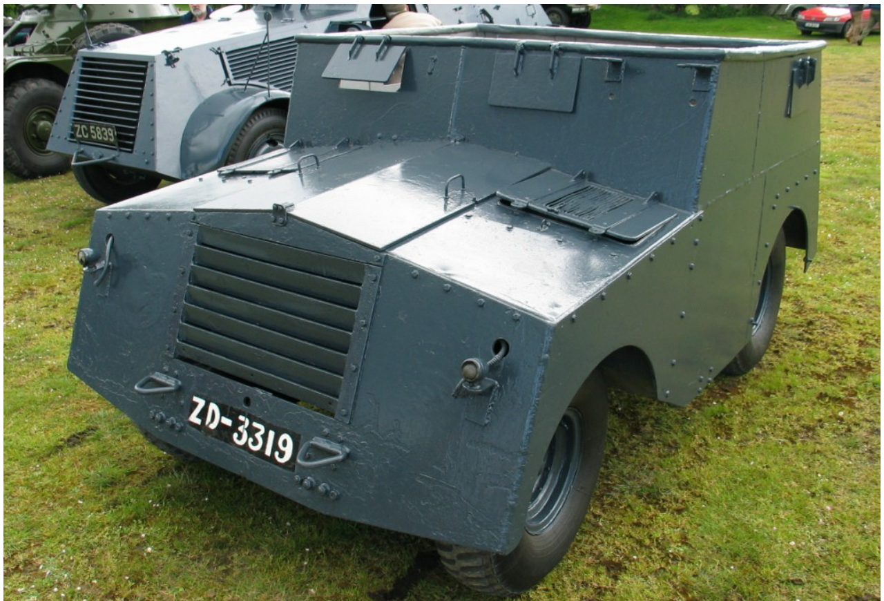
"ACTIVEARMOUR", May 2008 - http://www.flickr.com/photos/westrat/6139497687/in/set-72157627528055969

Beaverette Armoured Car Mk III – Irish Defences Forces Training Centre, Curragh Camp, The Curragh (Ireland)