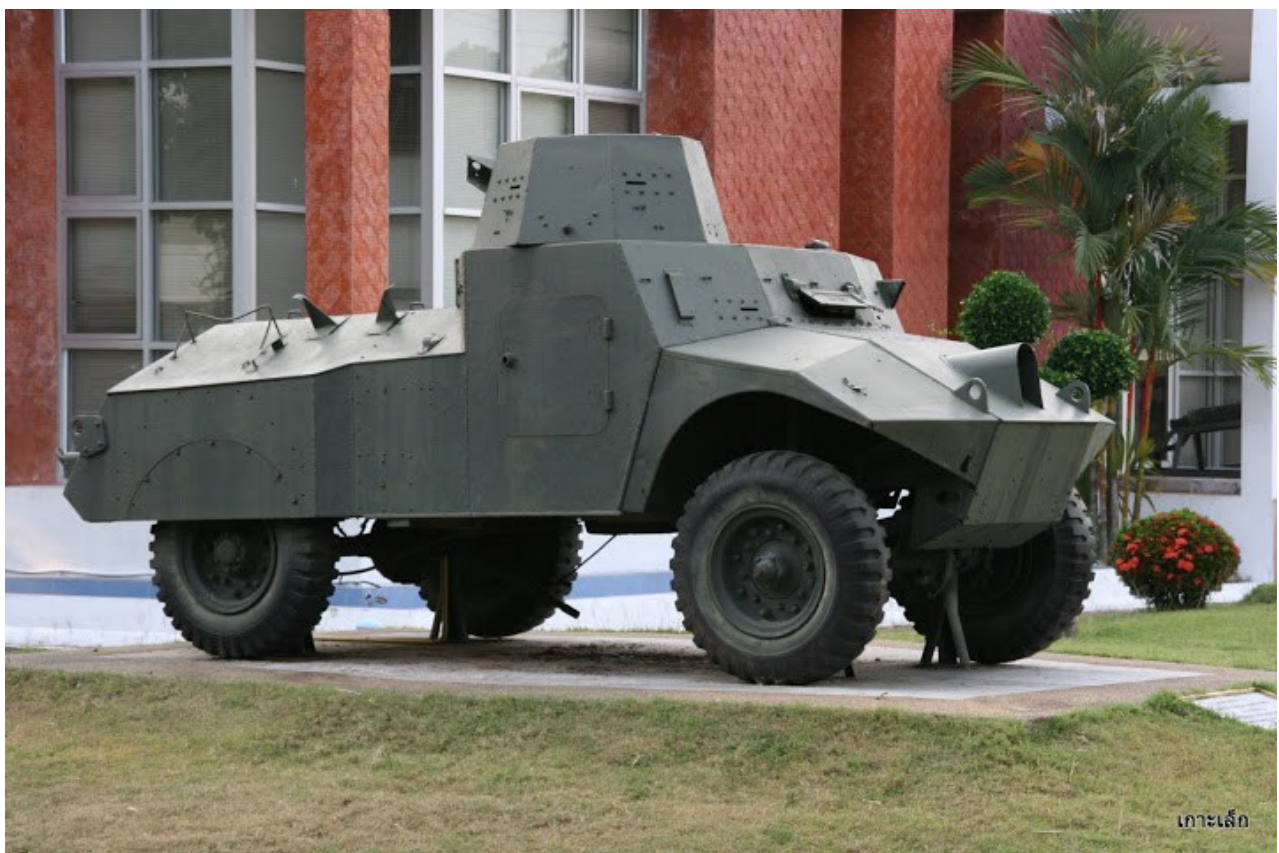
Two Morris Light Reconnaissance Cars – Royal Thai Army Special Forces Museum at Ft. Narai Lopburi province (Thailand)

"Lek", March 2011 - https://picasaweb.google.com/101515277404418496096/WirathaiMonument