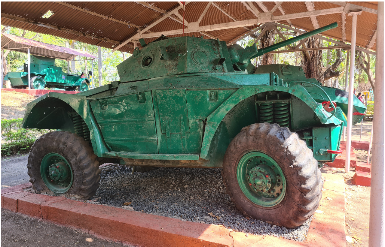
Coventry Armoured Car – Bovington Tank Museum (UK)