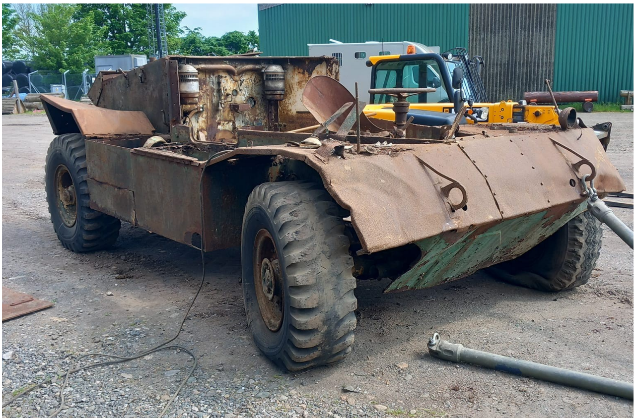
AEC Armoured Car – Patriot Park, Kubinka (Russia)

https://www.facebook.com/groups/374483227141849