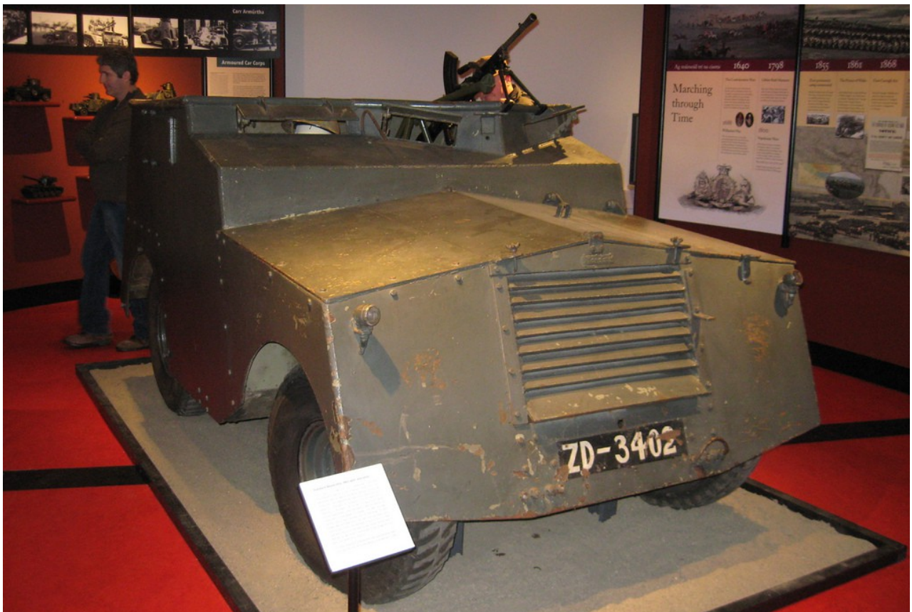
"ACTIVEARMOUR", November 2010

Beaverette Armoured Car Mk III – Irish Defences Forces Training Centre, Curragh Camp, The Curragh (Ireland)