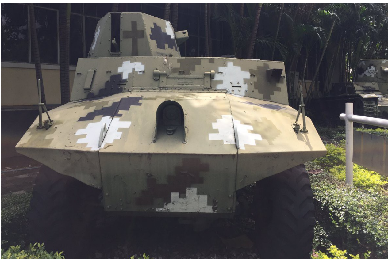
Morris Light Reconnaissance Car – Malaysian Army Museum, Port Dickson (Malaysia)

"Deep Blue Sea", May 2017 - https://twitter.com/WassanaNanuam/status/868725632305315840