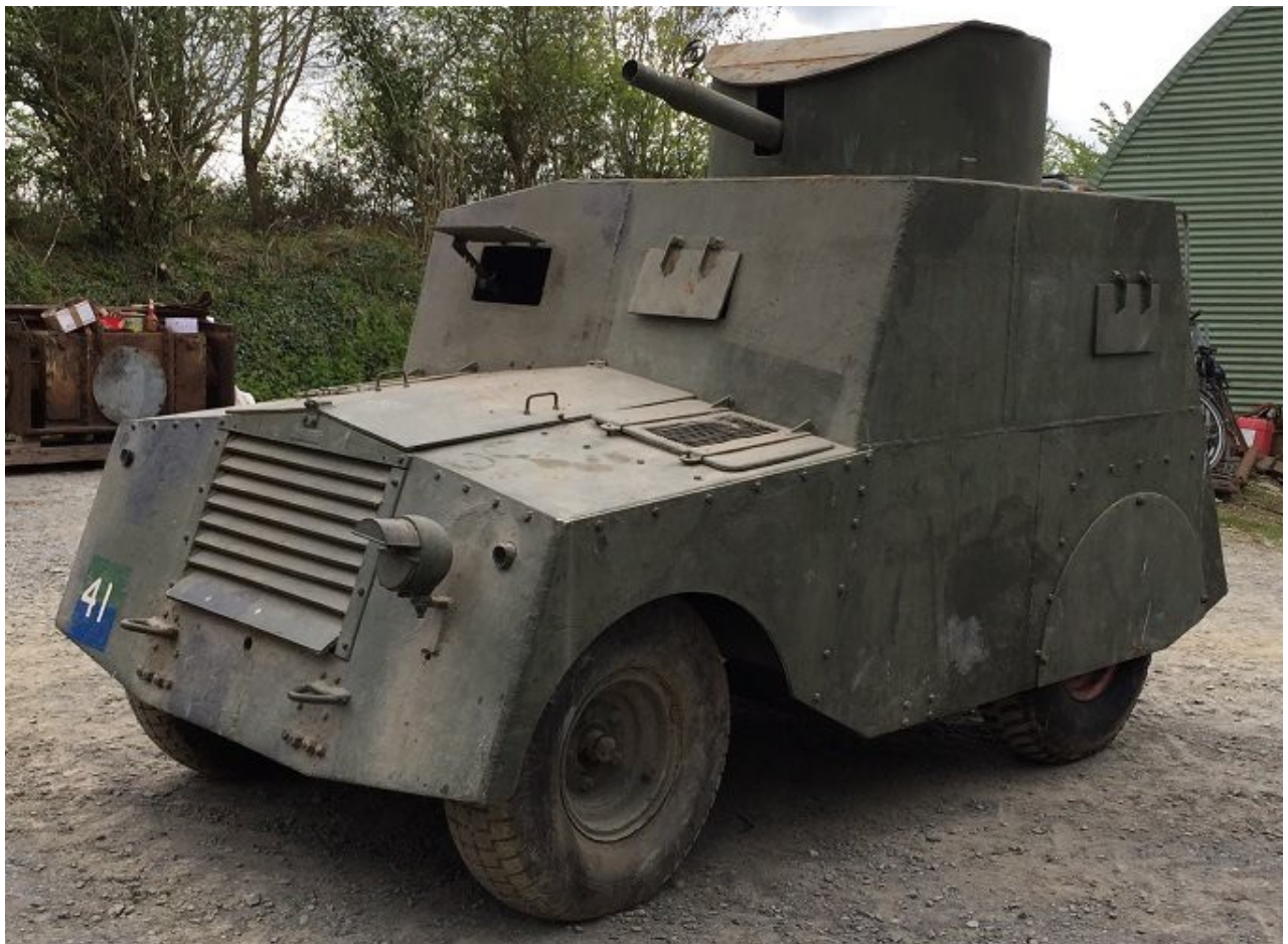
Beaverette Armoured Car Mk III – Imperial War Museum, Duxford (UK)

https://www.facebook.com/113173945423511/photos/pcb.1457720930968799/1457718754302350/?type=3&theater