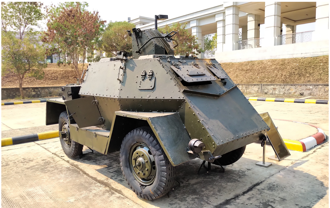
Armoured Carrier, Wheeled, India Pattern, Mk IIC or Mk III Armoured Corps Museum, Ahmednagar, Maharashtra (India)

https://twitter.com/tms313/status/1228945870252412928