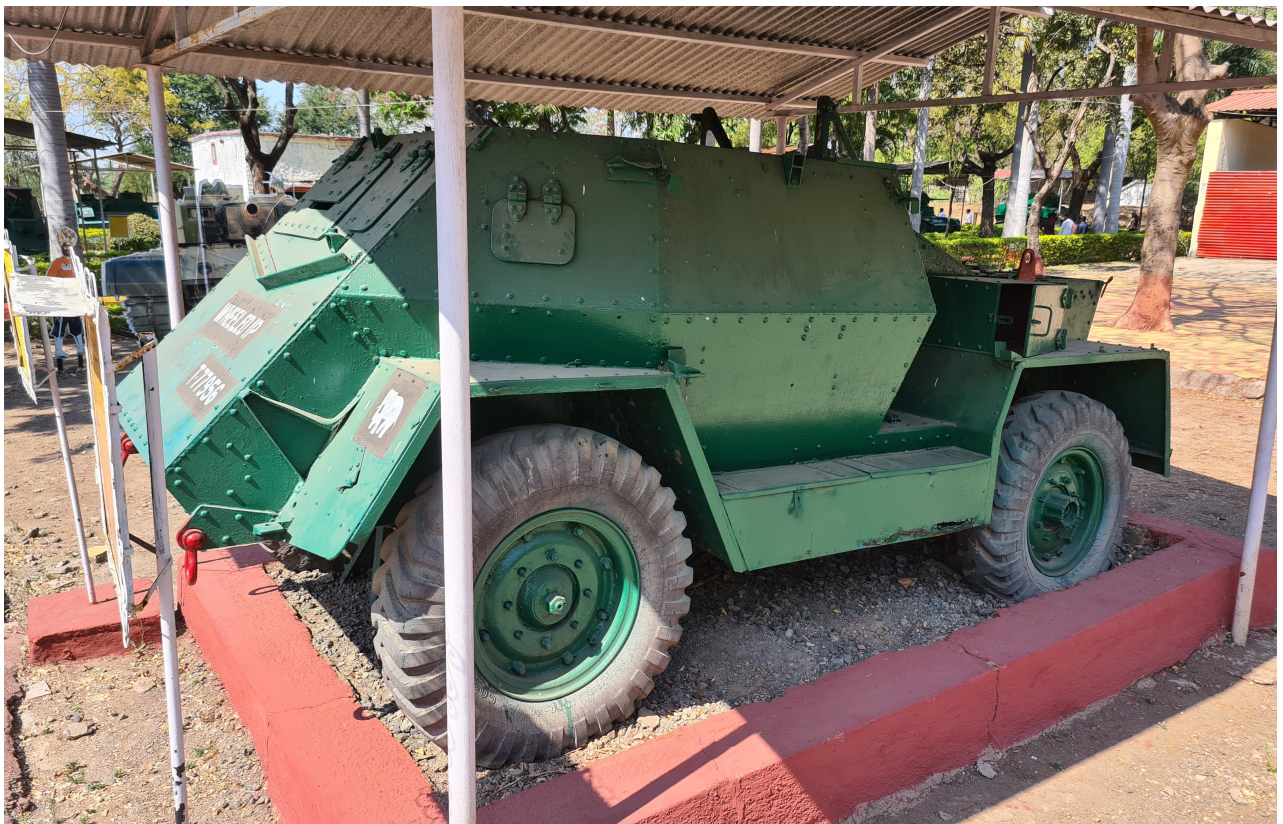
Armoured Carrier, Wheeled, India Pattern, Mk I or Mk II Afghan Army logistic base, Kabul (Afghanistan)