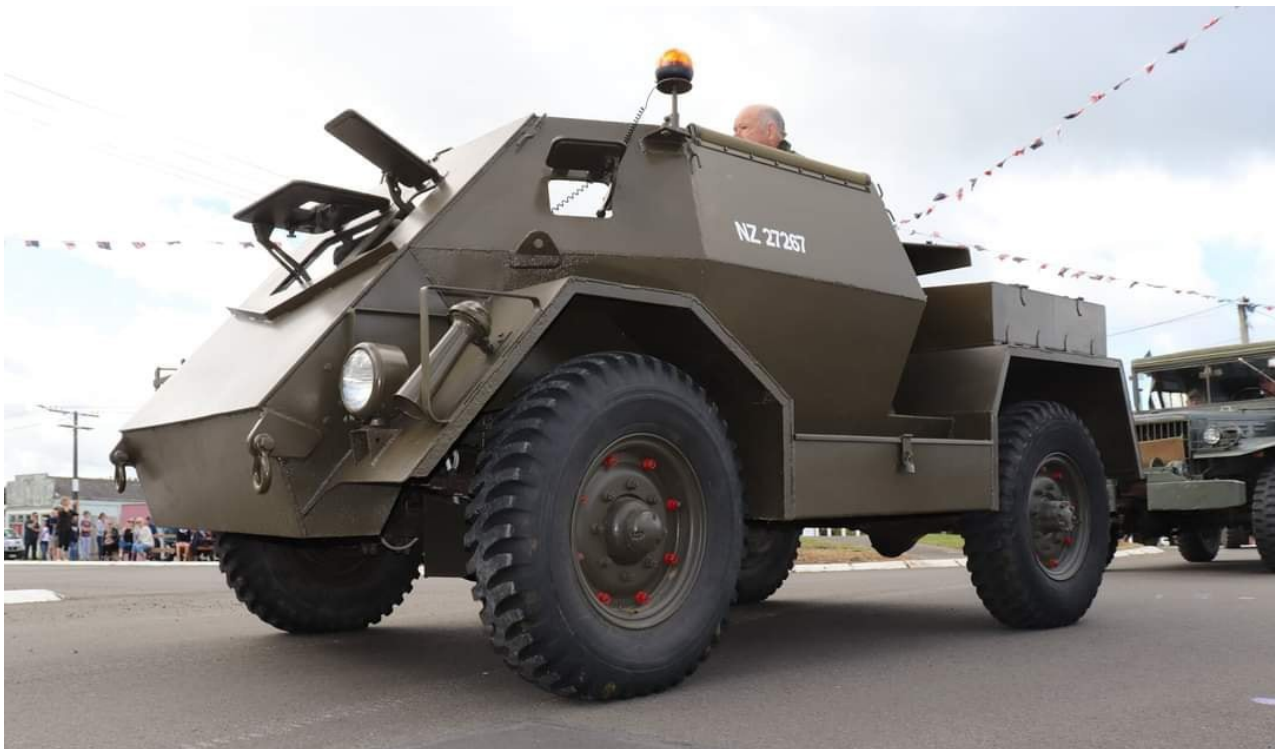
Armoured Carrier, Wheeled, NZ Pattern – Private collection (New Zealand)

https://www.facebook.com/photo/?fbid=10208791648426359&set=gm.1413229039075854