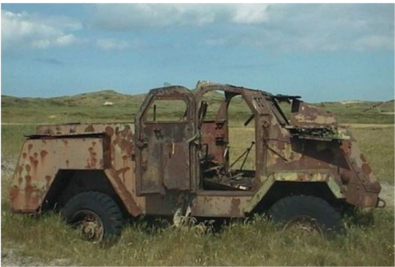
Sten Boye Poulsen, 2000 - http://www.c15ta.dk/

C15TA wreck – Tranum Skydeterræn Range (Denmark)