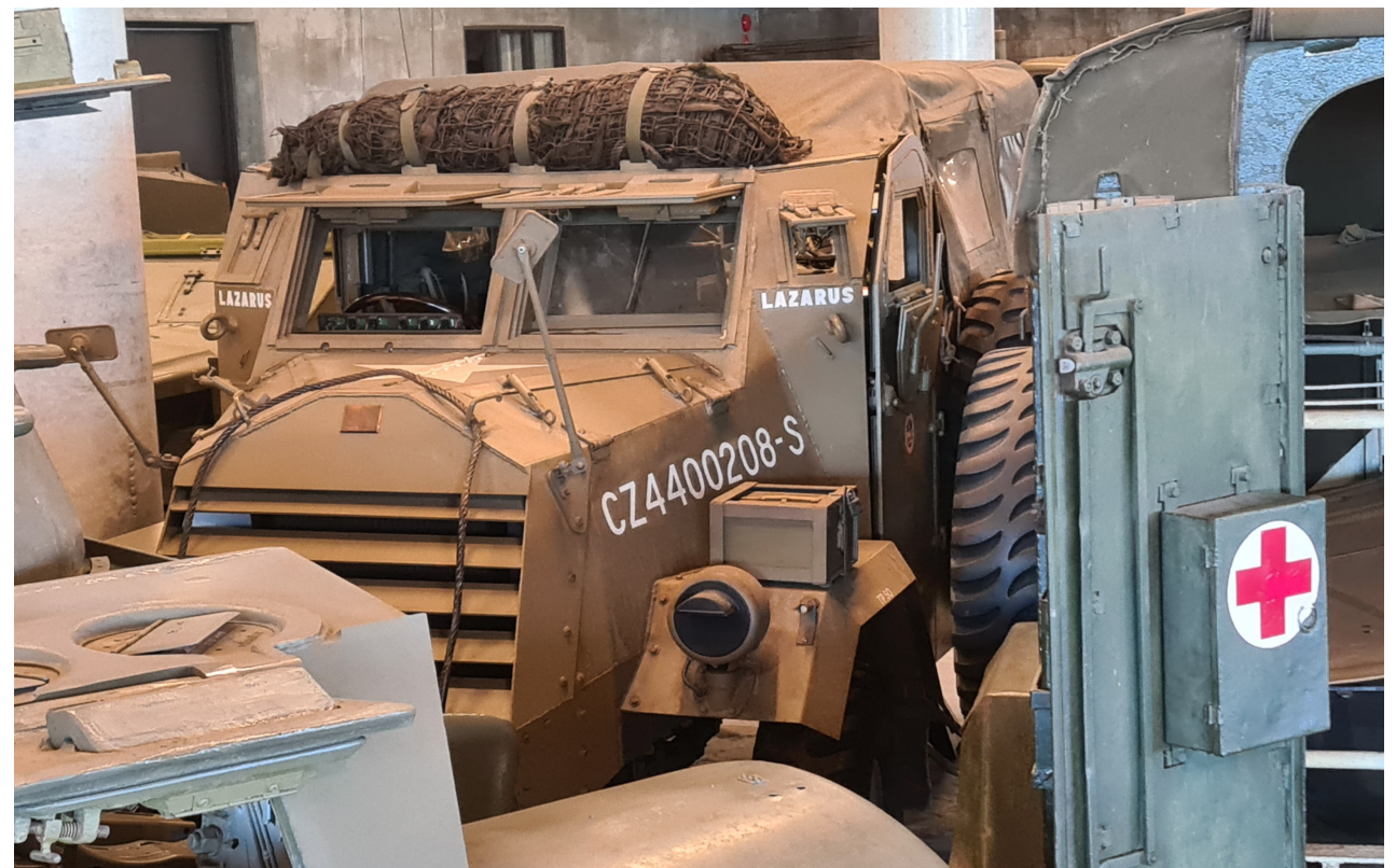
Pierre-Olivier Buan, September 2024