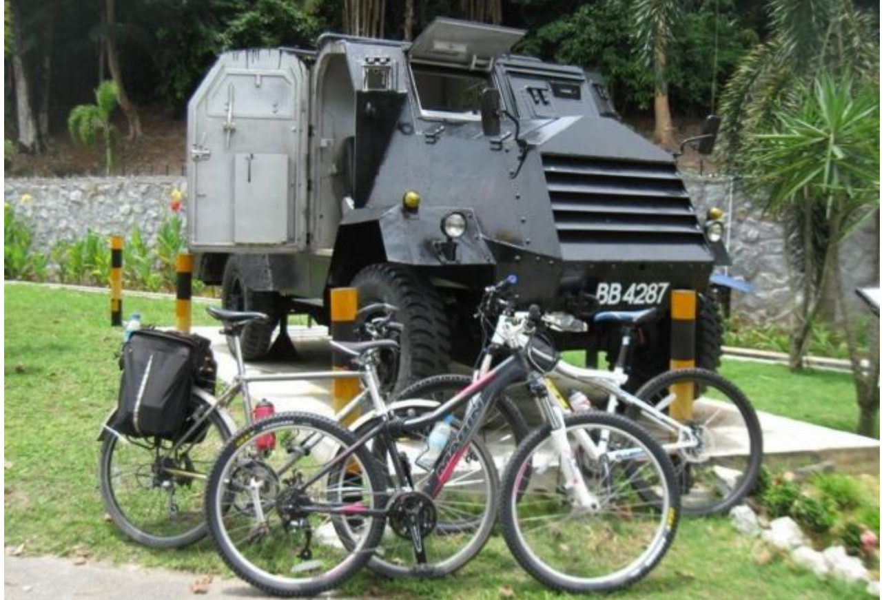
Azizan Zolkipli - http://akubasikaldansesuatu.blogspot.com/2012_05_01_archive.html