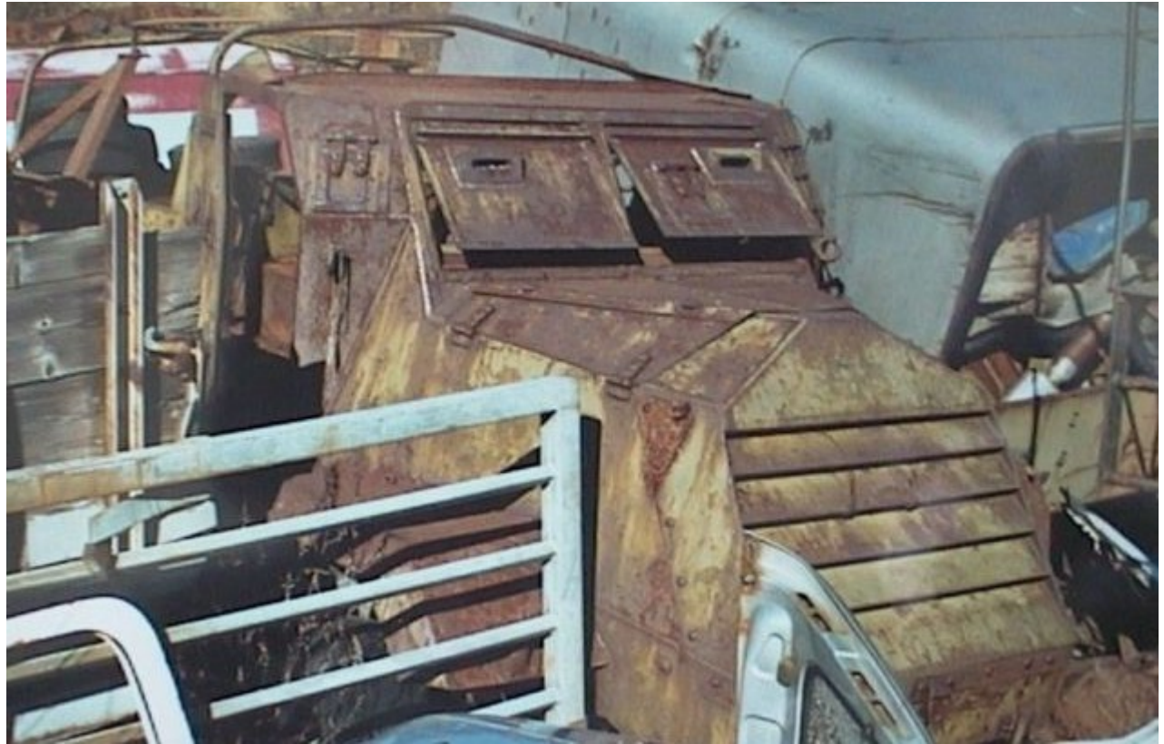
Sten Boye Poulsen - http://www.geocities.ws/cmpvehicles/c15ta_reg.html