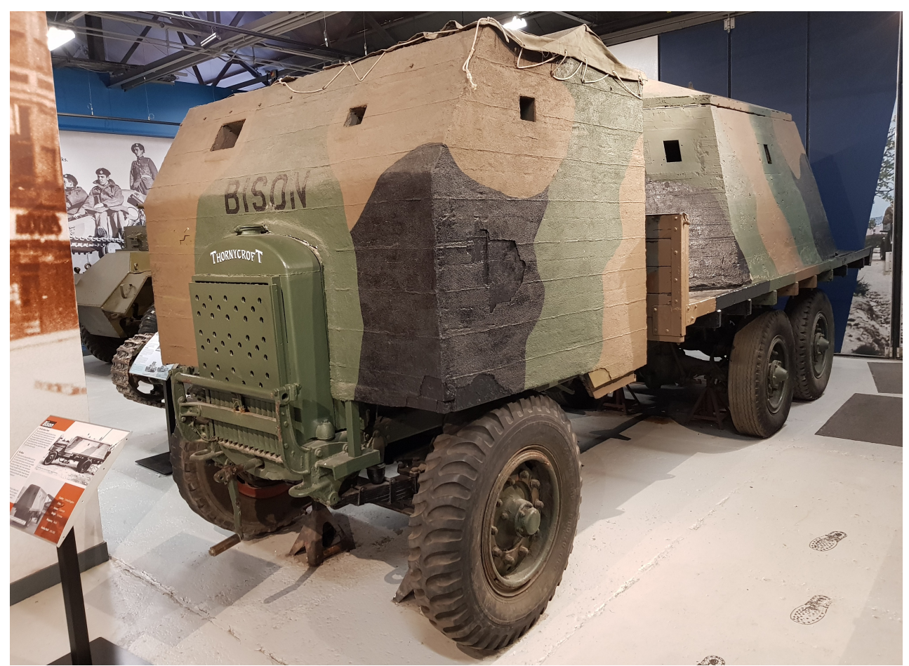
AEC 6x6 Armoured Command Vehicle – Rex & Rod Cadman Collection (UK) Currently being restored to running condition