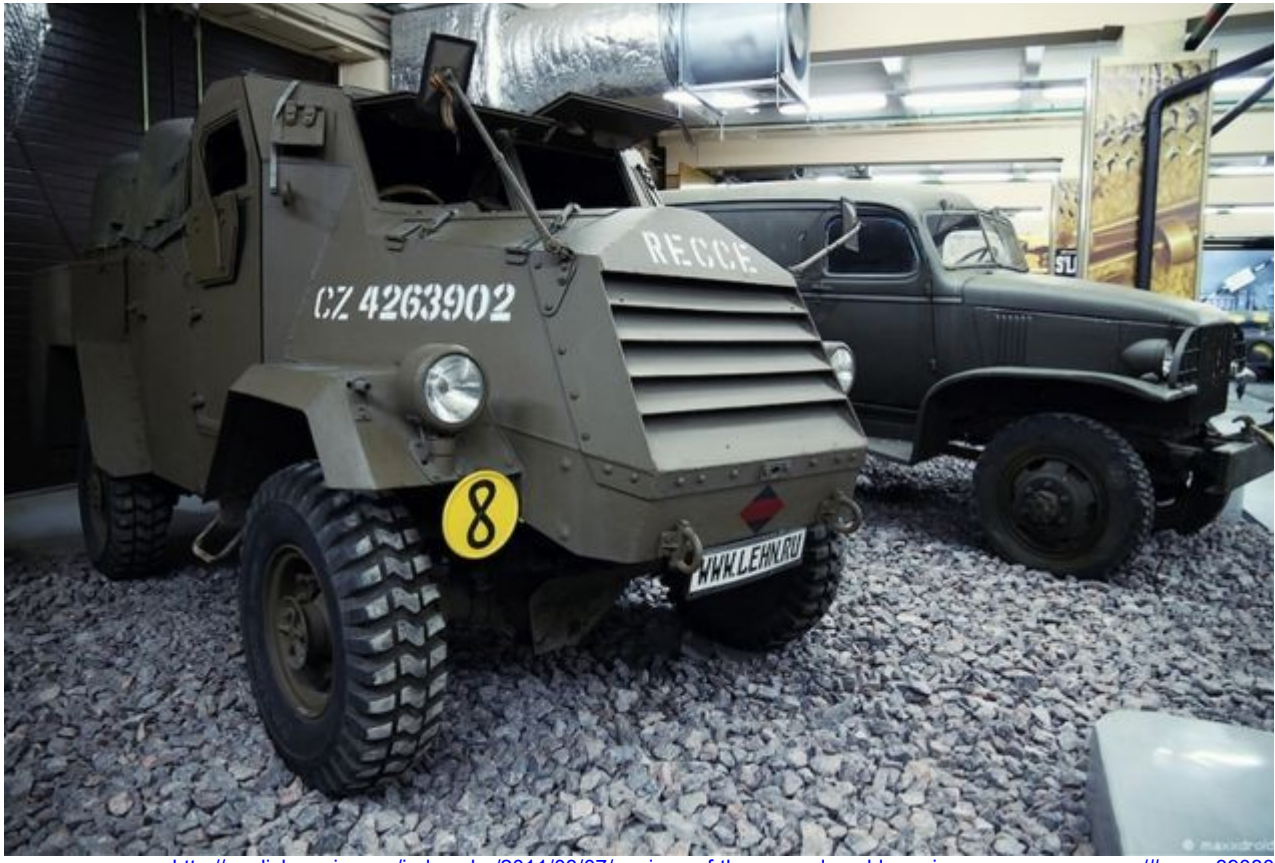
C15TA – School of Armour Museum, Tempe Bloemfontein, Free State province (Republic of South Africa)

http://englishrussia.com/index.php/2011/03/07/engines-of-the-second-world-war-in-a-moscow-museum/#more-39030