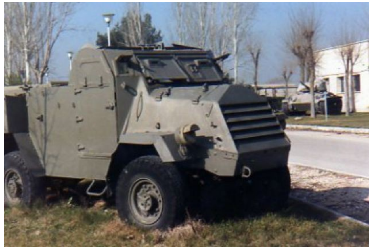
"juantono carro 001"

C15TA – Unknown location (Spain) Previously displayed at El Goloso Museum, Madrid (Spain)