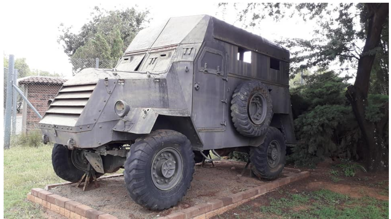
Pierre-Olivier Buan, March 2020