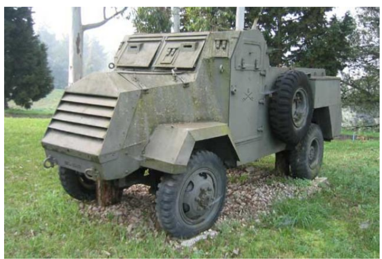
"skipper" - http://www.armorama.com/modules.php?op=modload&name=SquawkBox&file=index&req=viewtopic&topic_id=41932

C15TA – Unknown location (Portugal) Previously it was part of Museum of Portuguese Army's School of Cavalry, Santarém (Portugal)