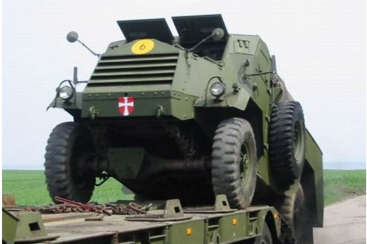
Vivian Eriksen, 2003 - http://www.drostrup.com/