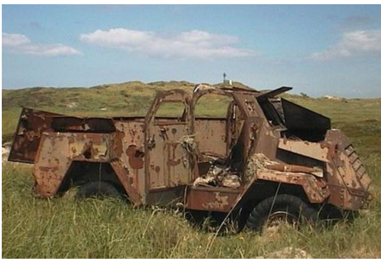
Sten Boye Poulsen, 2000 - http://www.c15ta.dk/

C15TA wreck – Tranum Skydeterræn Range (Denmark)