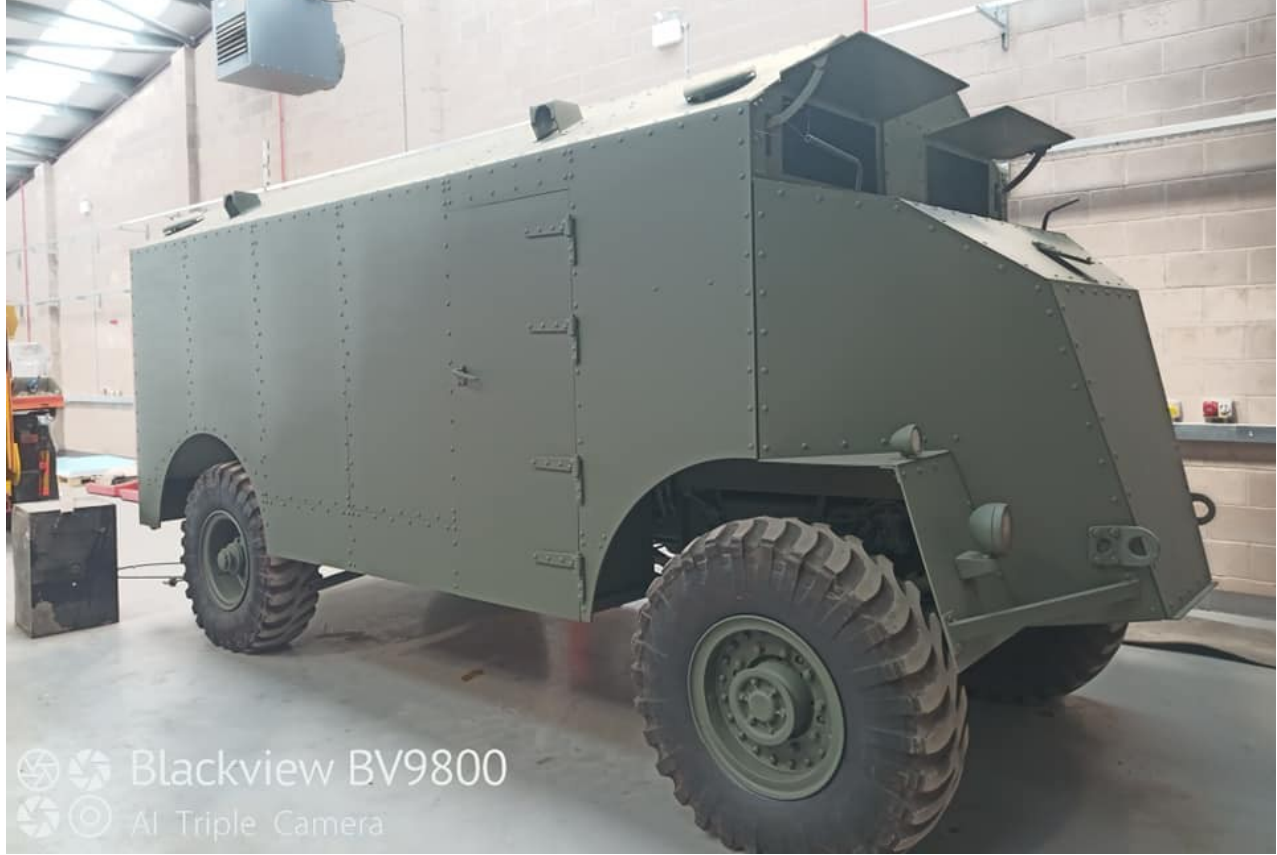
Matthew Pritchard, July 2021

AEC 4x4 Armoured Cmd Vehicle – The Crouch Collection, near Market Harborough (UK) Believed to be one of a pair vehicles that were later converted to Armoured Fire Fighting Vehicles for use in the Royal Ordnance Factory at Bishopton, Renfrewshire