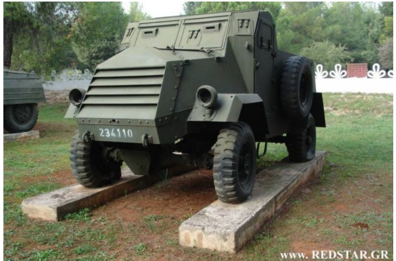
Κωνσταντίνου Πανιτσίδη - <u>http://www.redstar.gr/Foto_red/Exibition/MuseumGR_Aulon.html</u>