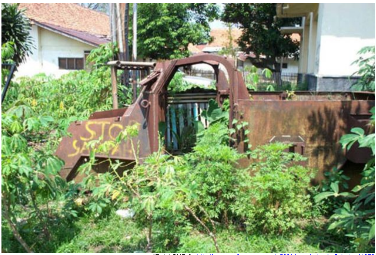
C15TA wreck – Unknown location (Vietnam)