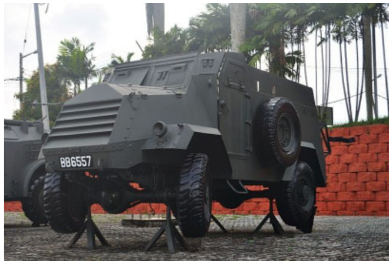
January 2014 - https://duacongkak.wordpress.com/2014/01/