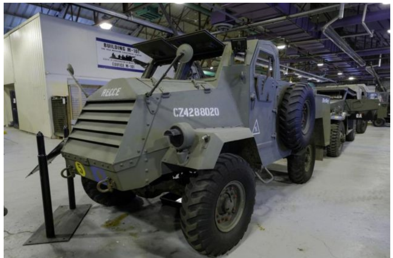
P&L, November 2015 - http://www.vgbimages.com/AFV-Photos/Canadian-Artillery-Museum-CFB-Sh/n-9brsX/i-xxrPHxw