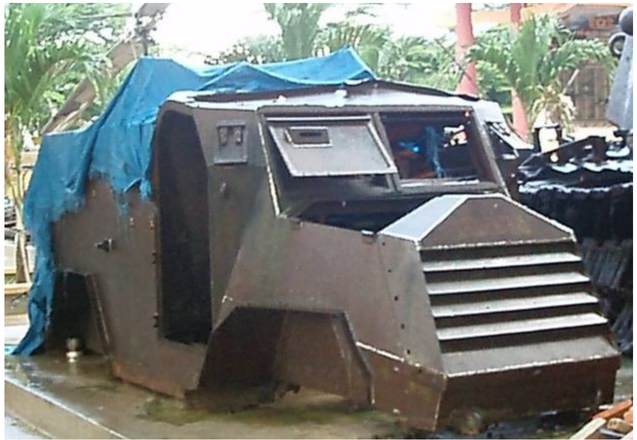
"PVND09" - http://ttvnol.com/gdqp/528007/page-46