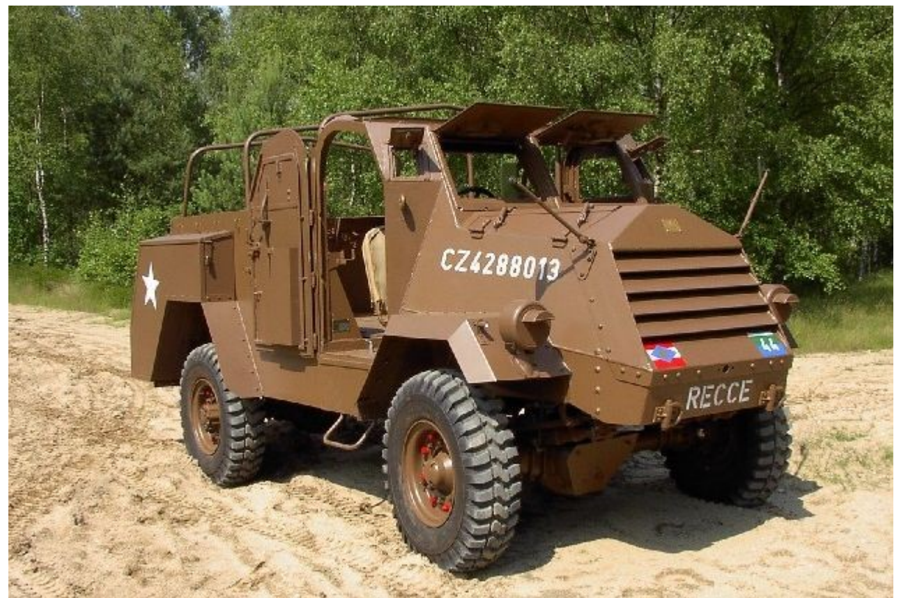
"DutchCMPs" - http://www.surfacezero.com/g503/showphoto.php?photo=24690&ppuser=442