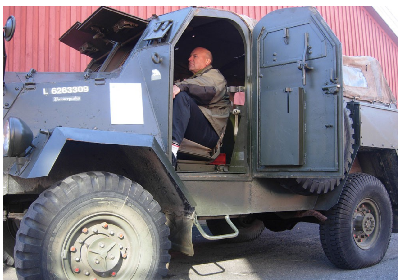
C15TA – Norwegian Army Museum, Trandum (Norway)