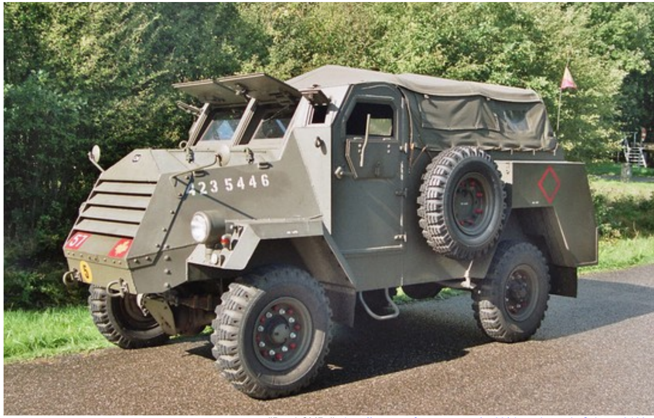
C15TA – Harry Bruin Collection (Netherlands)

"DutchCMPs" - http://www.surfacezero.com/g503/showphoto.php?photo=24607