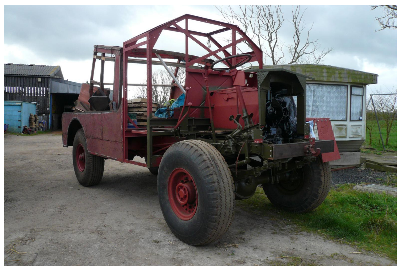
"doug fleet", March 2017 - http://hmvf.co.uk/forumvb/showthread.php?51592-matador-restoration/page16