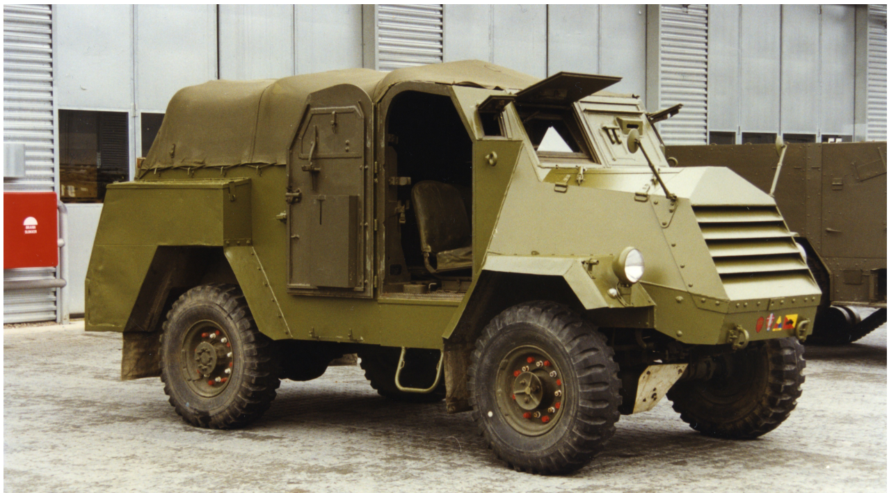
"Mud & Snow" (1/1998), Magazine of the Norwegian MV association - http://www.geocities.ws/cmpvehicles/c15ta_reg.html

Listed here are the British and Commonwealth Armoured Trucks and Armoured Command Vehicles that still exist today.