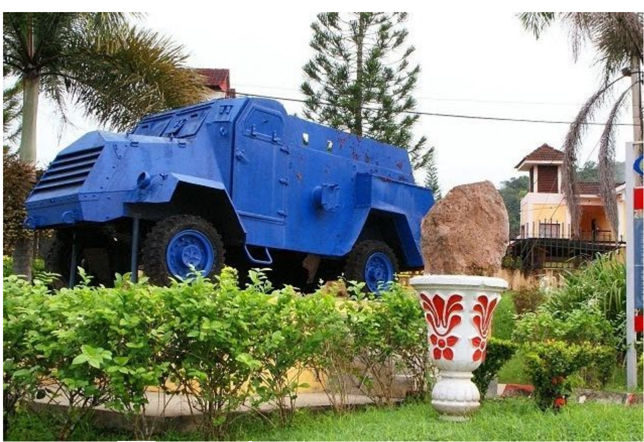
"@det77", December 2010 - http://detphotofolio.blogspot.com/2010/12/lengong-bercuti-di-lengong-perak-1.html