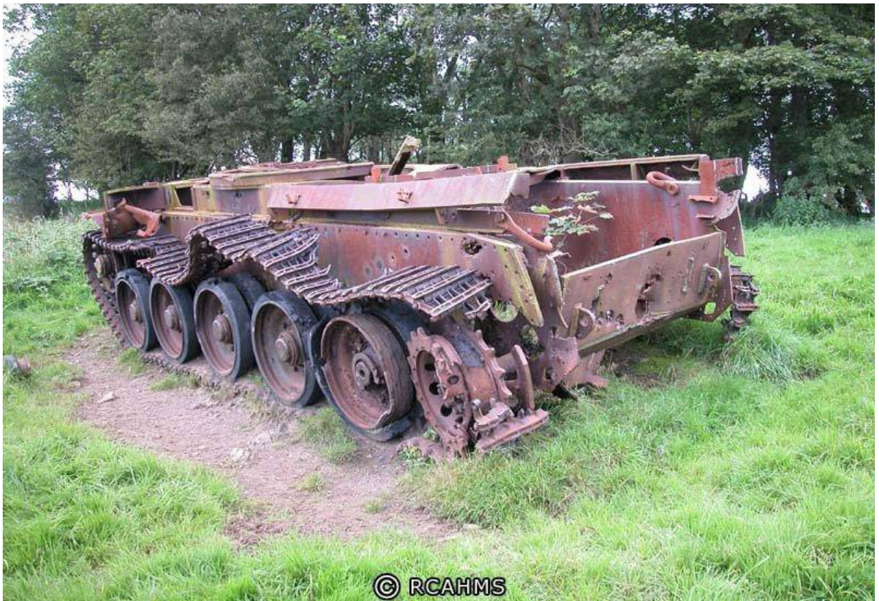
Comet hull wreck (187) – Kirkcudbright training area (UK)

http://canmore.rcahms.gov.uk/en/site/240905/digital_images/kirkcudbright+training+area/