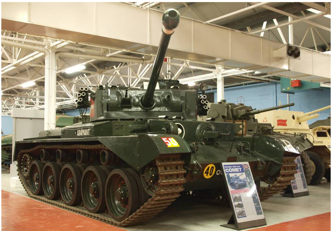
Comet – Bovington Tank Museum (UK) – running condition

"Megashorts", November 2008 - http://www.flickr.com/photos/megashorts/3029529371/in/set-72157609057315170/