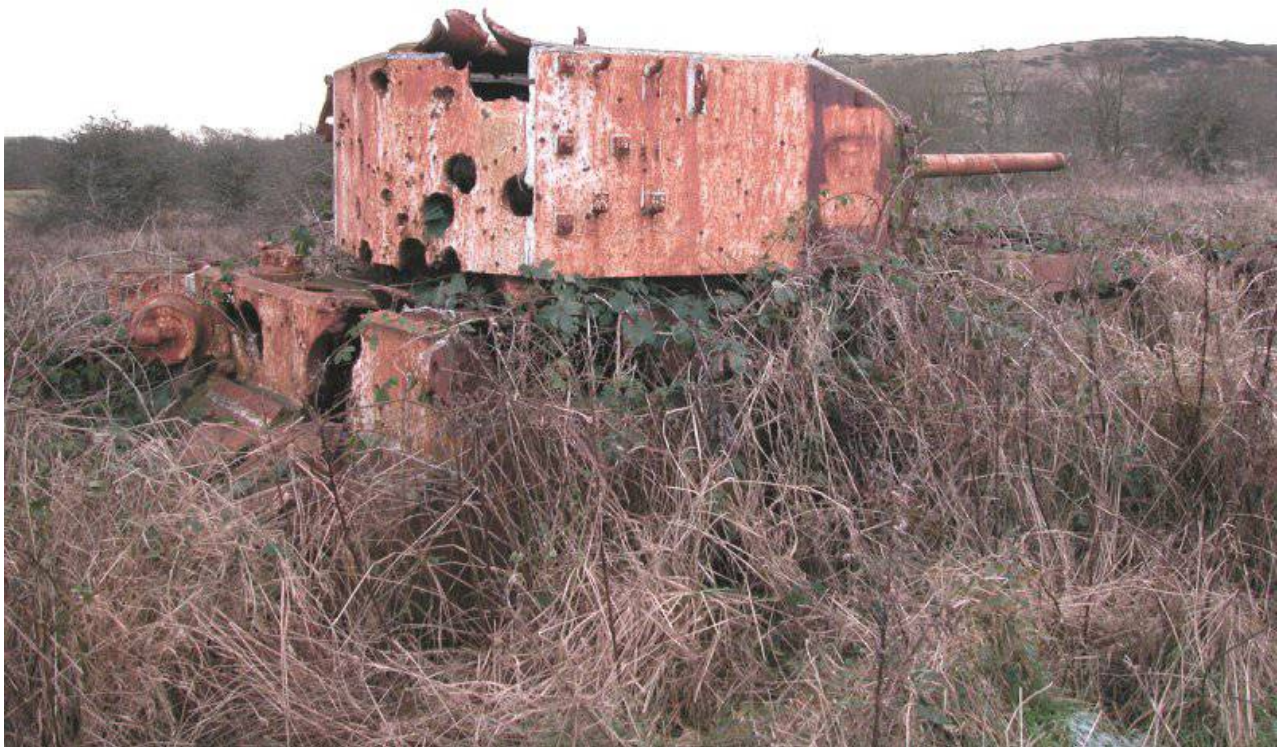
Comet wreck (234) – Kirkcudbright training area (UK)

http://canmore.rcahms.gov.uk/en/details/963741/