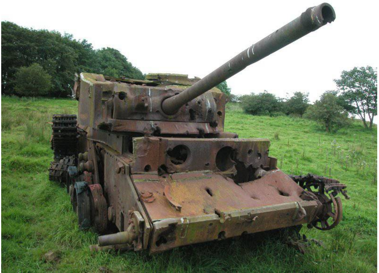
Comet wreck (264) – Kirkcudbright training area (UK)

http://canmore.rcahms.gov.uk/en/details/963571/