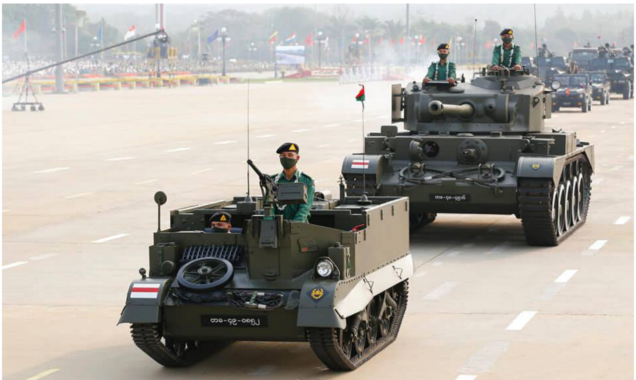
Comet – Defence services museum, Naypyidaw (Burma / Myanmar)

https://www.facebook.com/photo?fbid=10157669003950964&set=pcb.3669978429738268