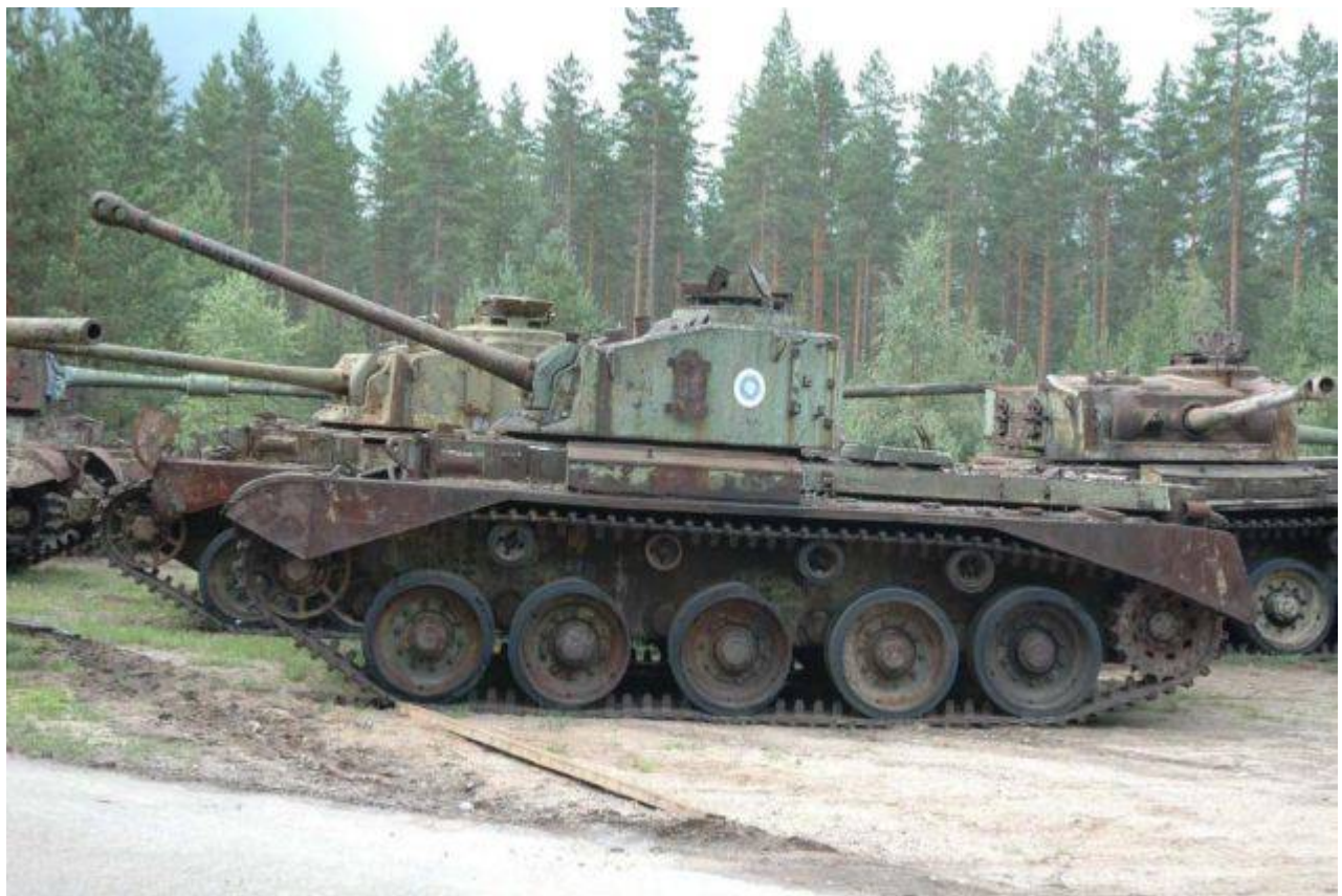
Comet (Ps. 252-24) – Lappeenranta (Finland)

http://www.mil.fi/liite/Psv-huutokauppa_luettelo_ENG.pdf