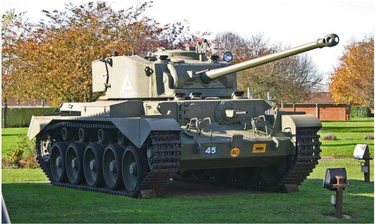
"Cold War Warrior", October 2004