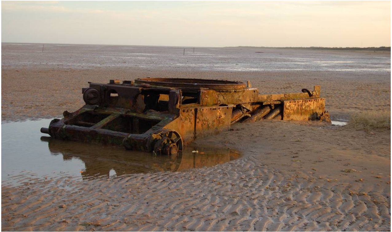
"Ford Prefect22", January 2008