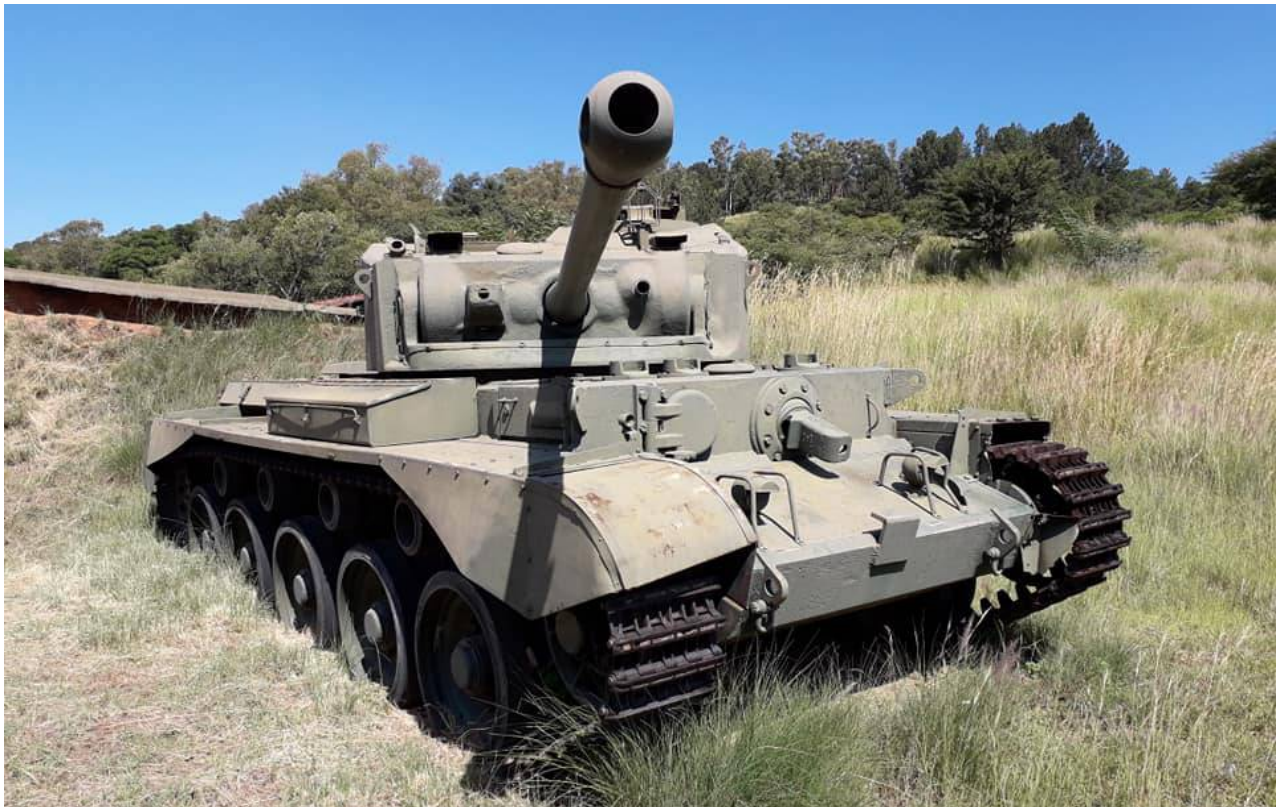
Pierre-Olivier Buan, March 2020