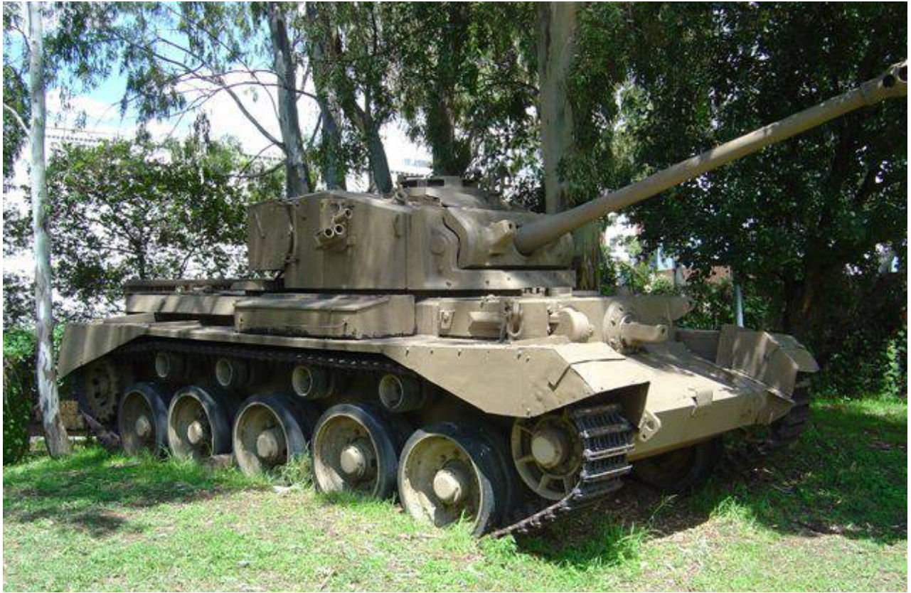
FJR Louw, February 2011