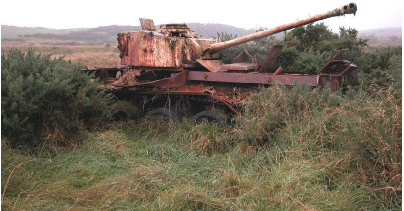
Comet wreck (244) – Kirkcudbright training area (UK)

http://canmore.rcahms.gov.uk/en/details/963602/