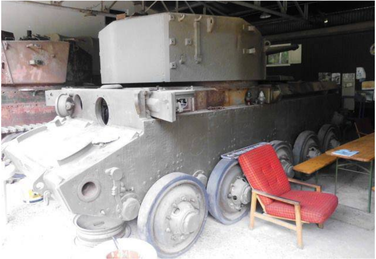
"Patrik", July 2015