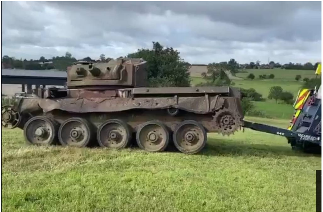
Comet hull wreck (194) – Kirkcudbright training area (UK)

https://www.facebook.com/TrackandWheel/videos/763976334174182/