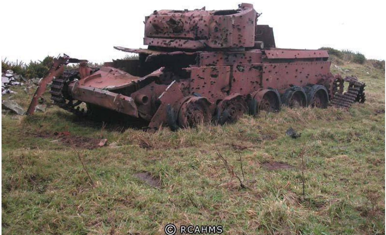
Comet wreck (191) – Kirkcudbright training area (UK)

http://canmore.rcahms.gov.uk/en/site/240905/digital_images/kirkcudbright+training+area/