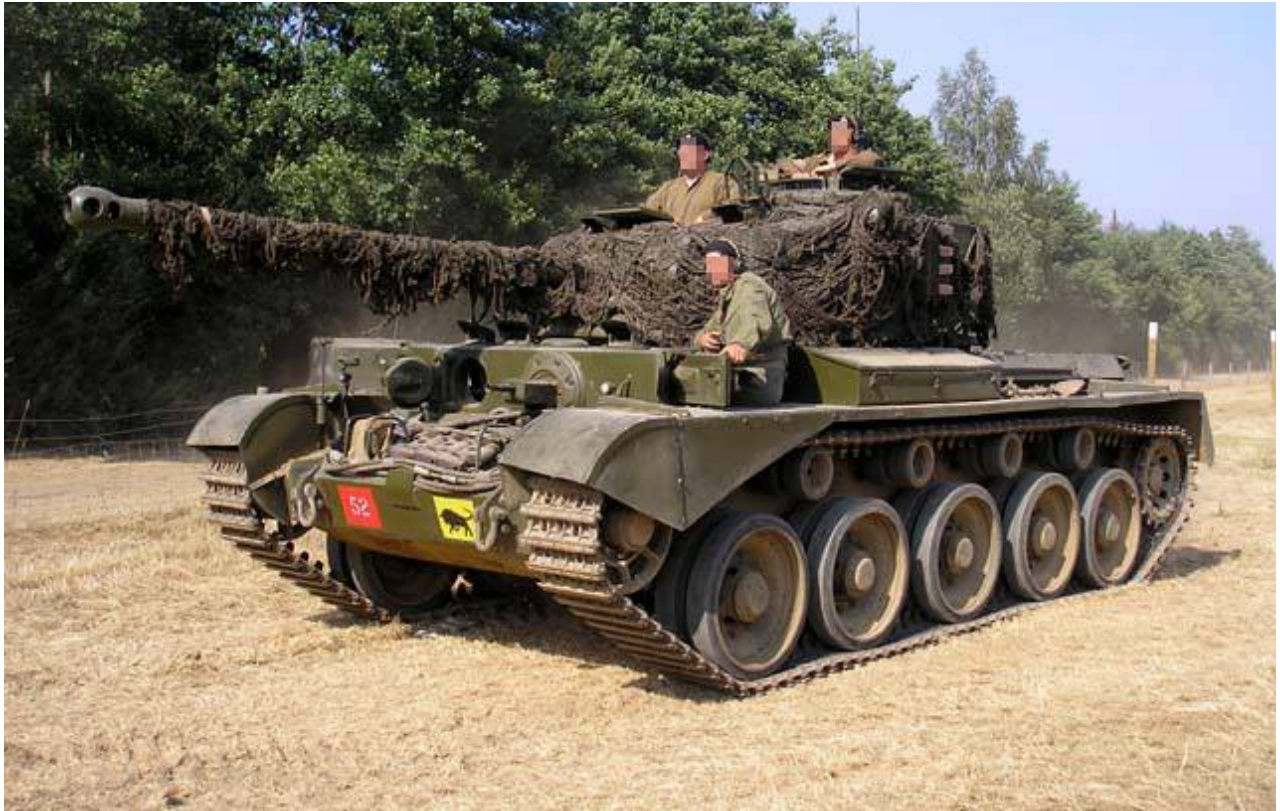
Stephen Drew, photo taken at Beltring War & Peace show - http://www66.tok2.com/home2/tankguy/beltring06/comet02.html