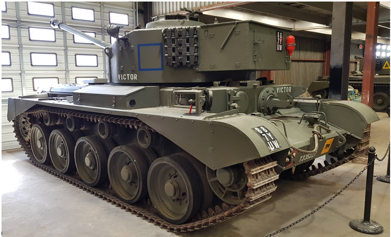
Pierre-Olivier Buan, September 2022