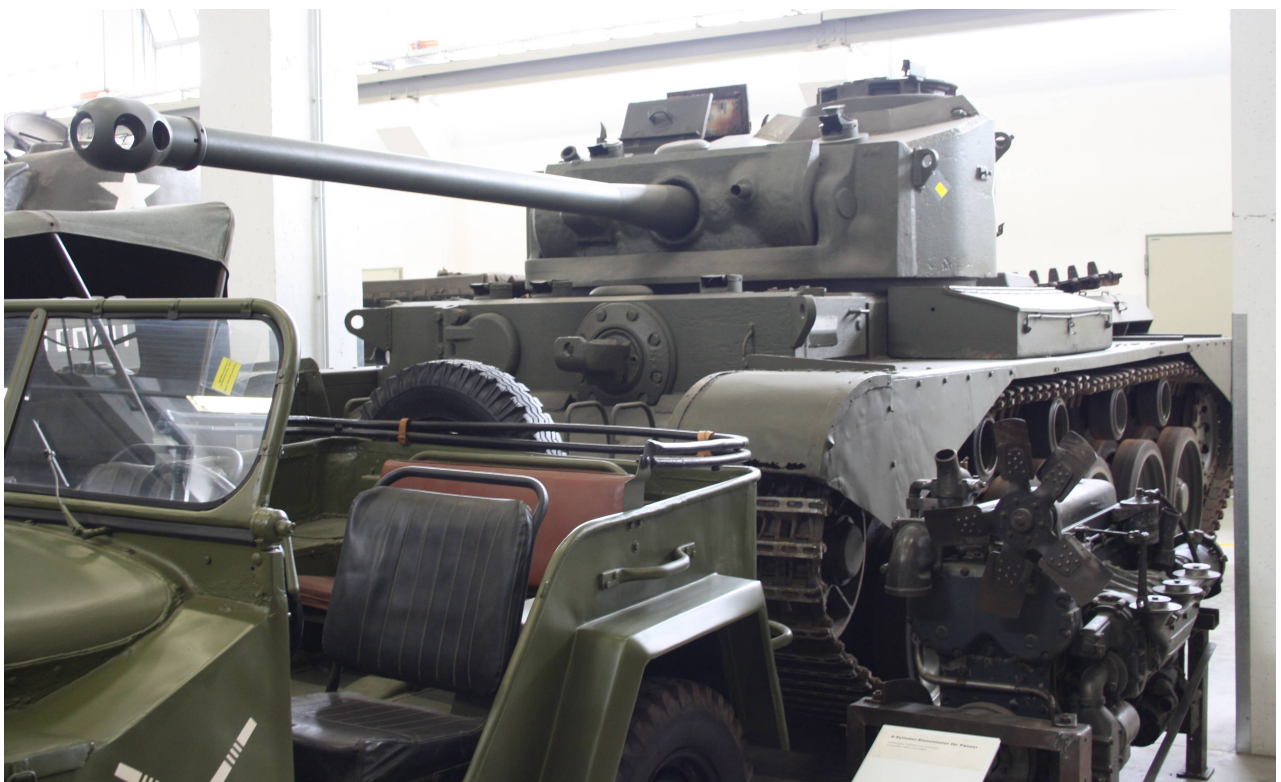
Walter Schwabe, October 2014