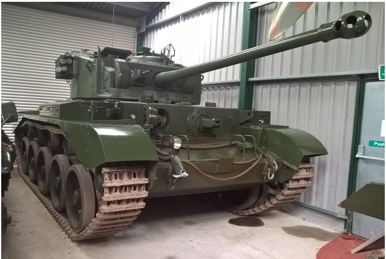
Comet "Cambrai" – Imperial War Museum, Duxford (UK)