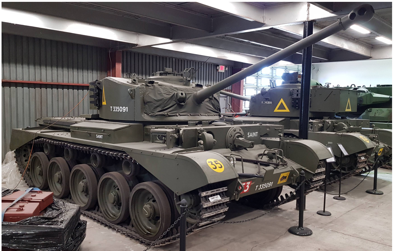
Pierre-Olivier Buan, September 2022

Previously owned by Ian Galliers, then part of the Isle of Wight museum. Ian Galliers purchased this vehicle from the Geneva military museum when it closed down. It is fitted with a Meteor Mk 4 (Centurion) engine ( http://www.armouruk.net/ )