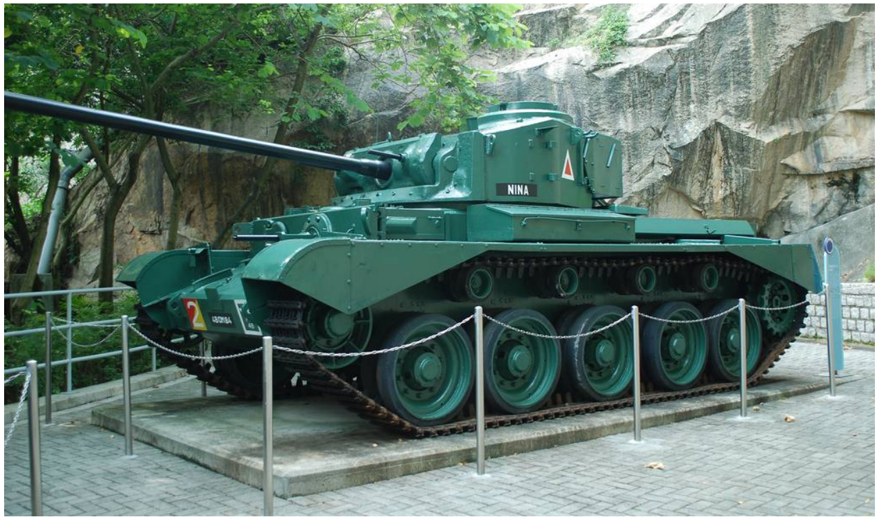
"TMA_0", August 2009 - http://www.flickr.com/photos/39568612@N08/3802697178/in/set-72157621984487484/