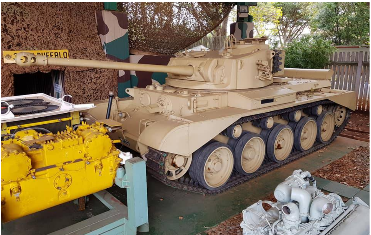
Pierre-Olivier Buan, March 2020

This tank was offered in an auction in September 2007, in Finland. It is currently being restored (AFV News forum)