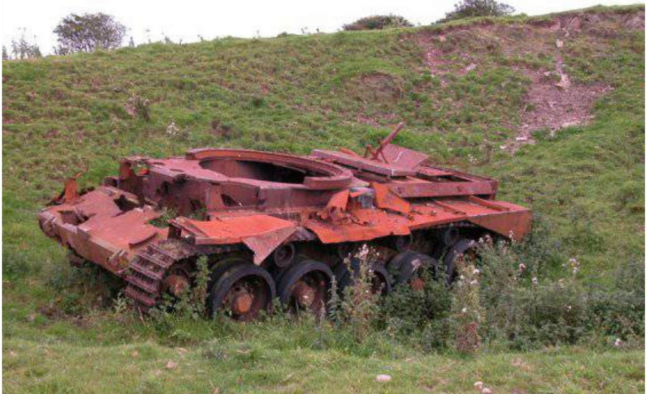
Comet hull wreck (208) – Kirkcudbright training area (UK)

http://canmore.rcahms.gov.uk/en/details/963560/