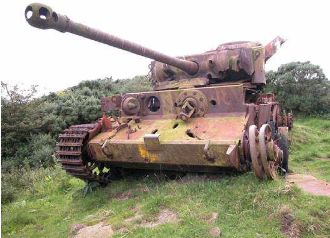
Comet wreck n° 5 – Salisbury Plain firing range (UK)

http://canmore.rcahms.gov.uk/en/site/240905/digital_images/kirkcudbright+training+area/