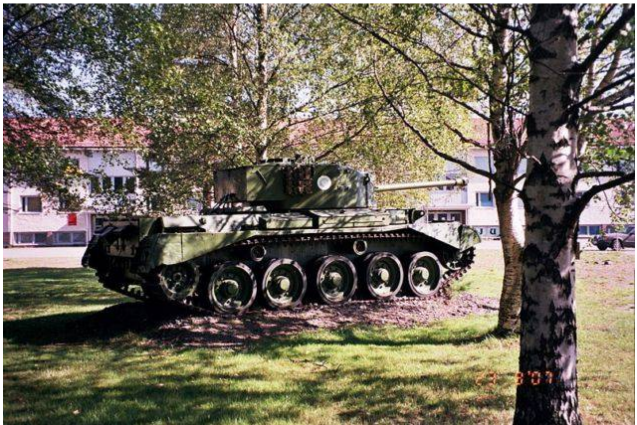
Comet (Ps. 252-??) – Savon Prikaati garrison, Mikkeli (Finland)

"Methem", August 2007 - http://commons.wikimedia.org/wiki/Image:Comet_tank_in_Oulu_2007_c.jpg