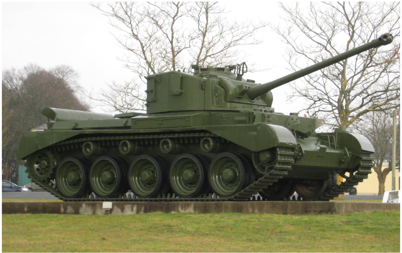
"ACTIVEARMOUR", November 2010

Comet – Irish Defences Forces Training Centre, Curragh Camp, The Curragh (Ireland)