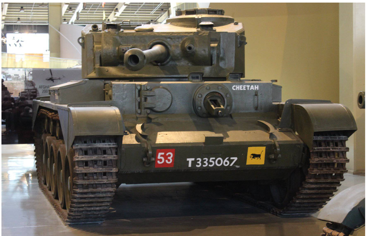
Comet – Natal Mounted Rifles HQ, Durban (Republic of South Africa)

https://www.facebook.com/photo.php?fbid=10215419683709077&set=pb.1346855703.-2207520000.1525531581.&type=3&theater