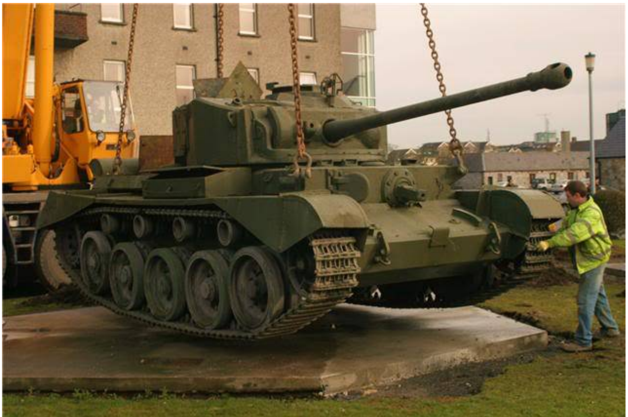
Comet – Irish Defences Forces Training Centre, Curragh Camp (Ireland) – running c. The tank is stored inside