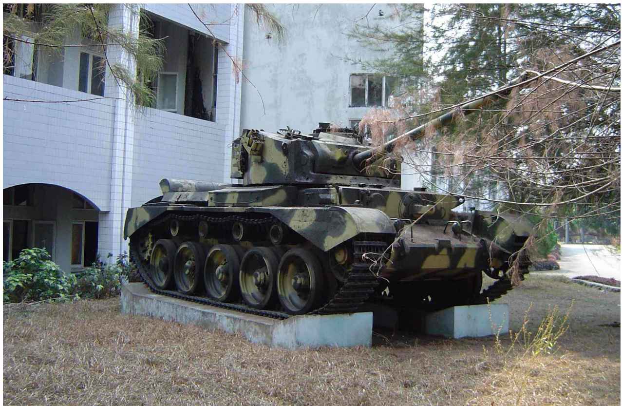
Comet – Kubinka Tank Museum (Russia)

http://www.museum-tank.ru/llwar/tables2A/comet0.html