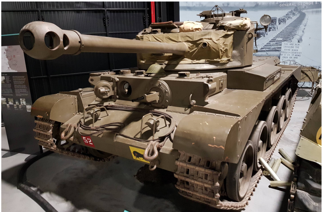
Pierre-Olivier Buan, October 2019