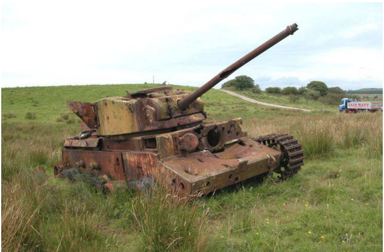
Comet wreck (192) – Kirkcudbright training area (UK)

http://canmore.rcahms.gov.uk/en/details/963570/