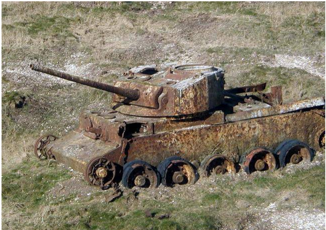
Comet wreck n° 3 – Salisbury Plain firing range (UK)