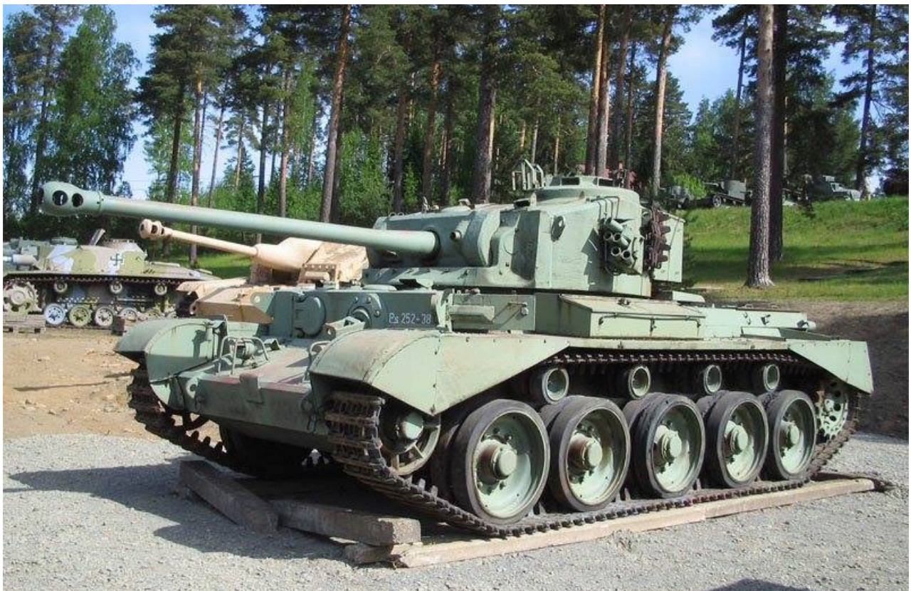
Comet (Ps. 252-23) – Finnish Armour Museum, Parola (Finland)

https://commons.wikimedia.org/wiki/File:Comet_MK_I_Model_B_Parola_tank_museum.jpg