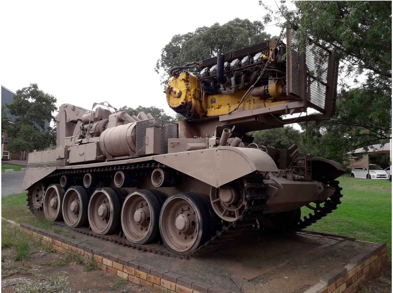
Pierre-Olivier Buan, March 2020