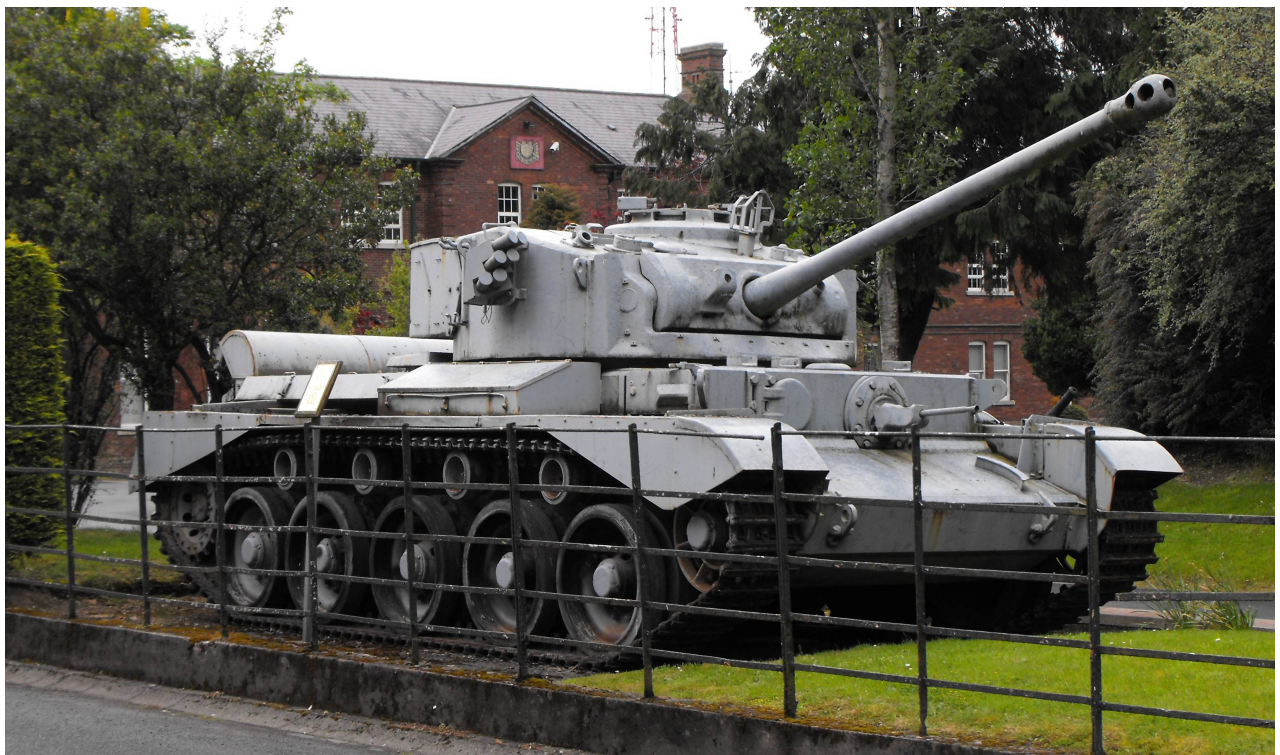
Raphael Riccio, February 2008

Comet – Irish Defences Forces Training Centre, Curragh Camp, The Curragh (Ireland)