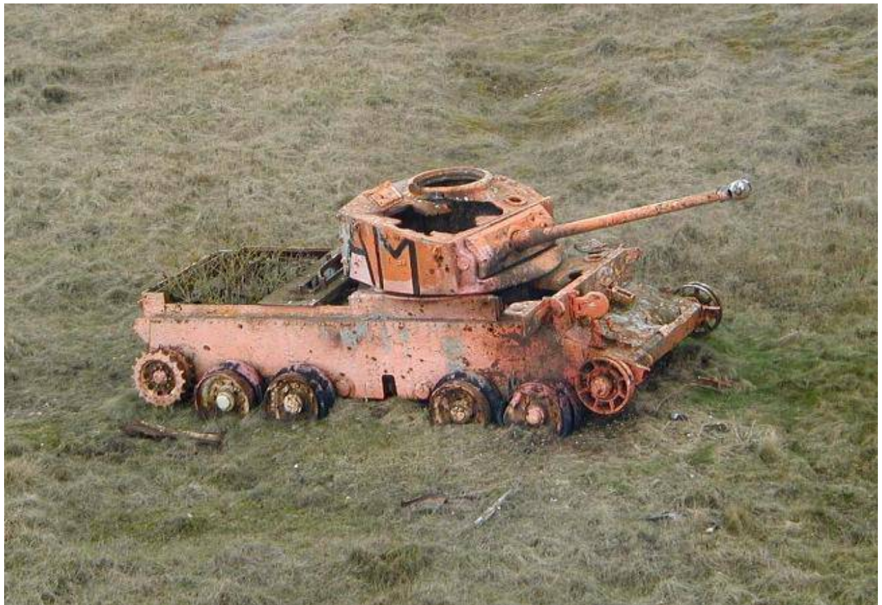
Comet wreck n° 1 – Salisbury Plain firing range (UK)