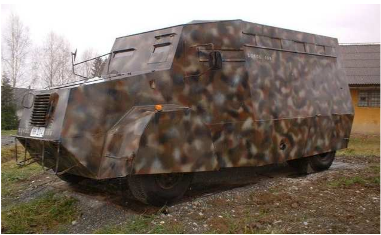
"durocipe" - http://www.index.hr/forum/default.aspx?idf=49&idt=182209&p=3&q=t

"BIB Mk II" "SV Fran" (St. Fran) Improvised AFV – Military Museum, Zagreb (Croatia) The vehicle was completed in November 1991 based on Tam110 truck chassis. Designation of the project was "BiB Mk II" (where the BiB implied Brodomaterijal and BIMONT). The vehicle is called the St. Fran. Although it was made for the 111th Brigade, in early December was submitted to the 133 Brigade.