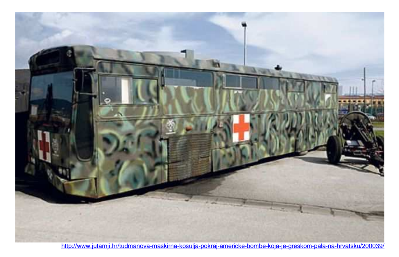
Unknown Armoured Bus/Ambulance - Military Museum, Zagreb (Croatia)