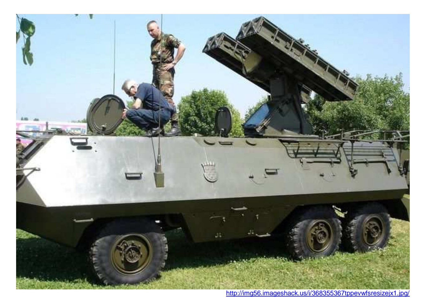
First Strijela-10 CRO A1 Končar (HV 360 OS) – Army barracks, Zagreb (Croatia) It was build by Končar factory using TAM 6x6 truck chassis to create a platform capable to carry several Strela-10 anti-aircraft missiles and captured from JNA stocks Strela launching platform. Only two such vehicles where created and used before the end on war.