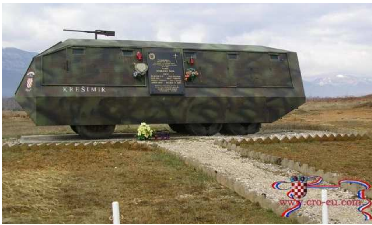
"Marica" - http://www.cro-eu.com/forum/index.php?topic=2223.0

It is one of Industrogradnja "Royalty" Series build by Remontind and Metalind plants of Industrogradnja. Four vehicles of this series: "Domagoj", "Krešmir", "Tomislav" and "Hrvoje" where produced using two TAM-260 and two Tatra 815 trucks chassis. They where used from September 1991 to end of war. Only one of them "Krešmir" was destroyed near Lički Ribnik on 22 September 1992.