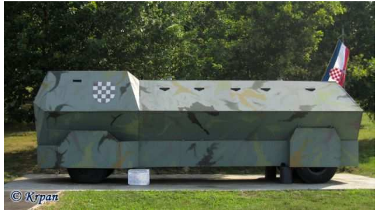
"Krpan " - http://www.autobusi.org/forum/index.php?topic=2264.75