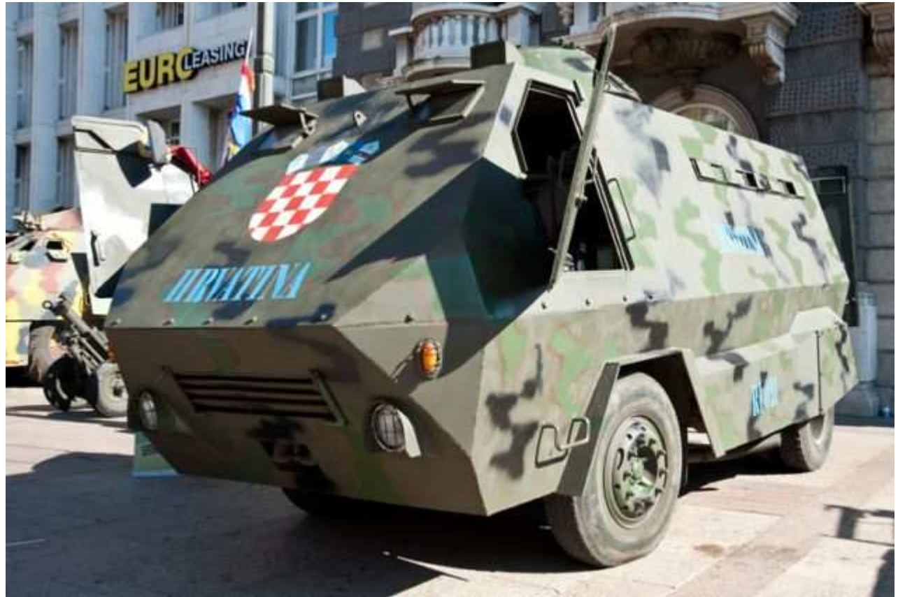
"Roberta F", October 2011 - http://commons.wikimedia.org/wiki/File:Oklopno_vozilo_rucne_izrade_Hrvatina_2011_7035.jpg

"Hrvatina" Improvised AFV – Military Museum, Zagreb (Croatia) It was made by 3 Maj shipyard in Rijeka. It was based on TAM-190 T15B 4x2, the works on started on September and it was finished in late October 1991.