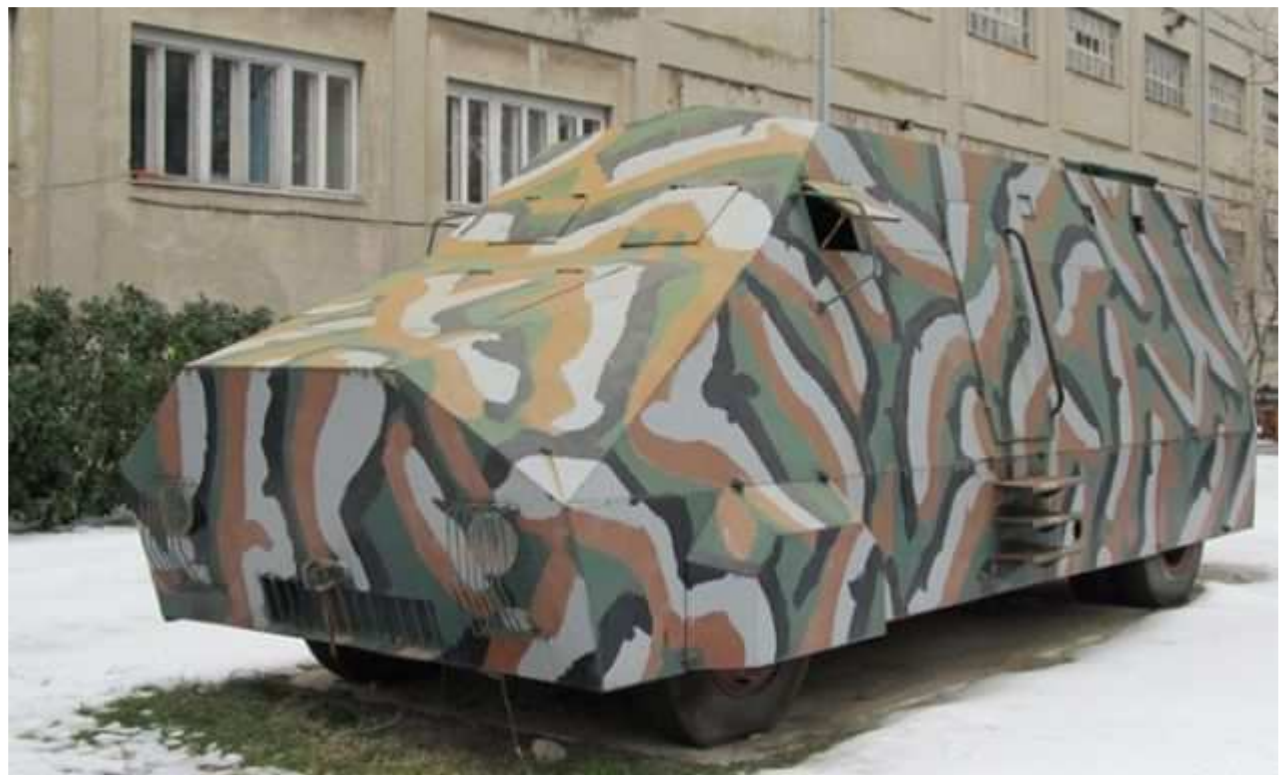
"Canesten" - http://www.forum.hr/showthread.php?t=614116&page=24

"Autodizalica Armoured Truck" Improvised AFV – Brodosplit Shipyard, Split (Croatia) In August 1991 the Autodizalica plant of the Brodosplit Shipyard made for Slipt special police an armoured vehicle using TAM-75 T5 truck.