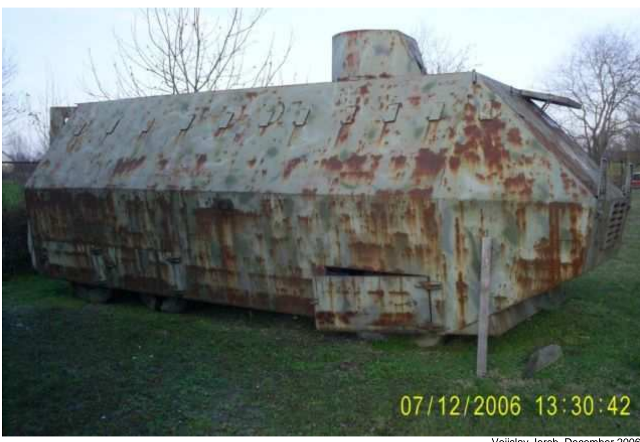
"Rapid - Slatina" Improvised AFV – near Slatina (Croatia) It was built on a FAP-10 Furgon chassis by the Rapid company in 1991. It was used by the 64th Independent ZNG Battalion and by the 136<sup>th</sup> Brigade until 1992.