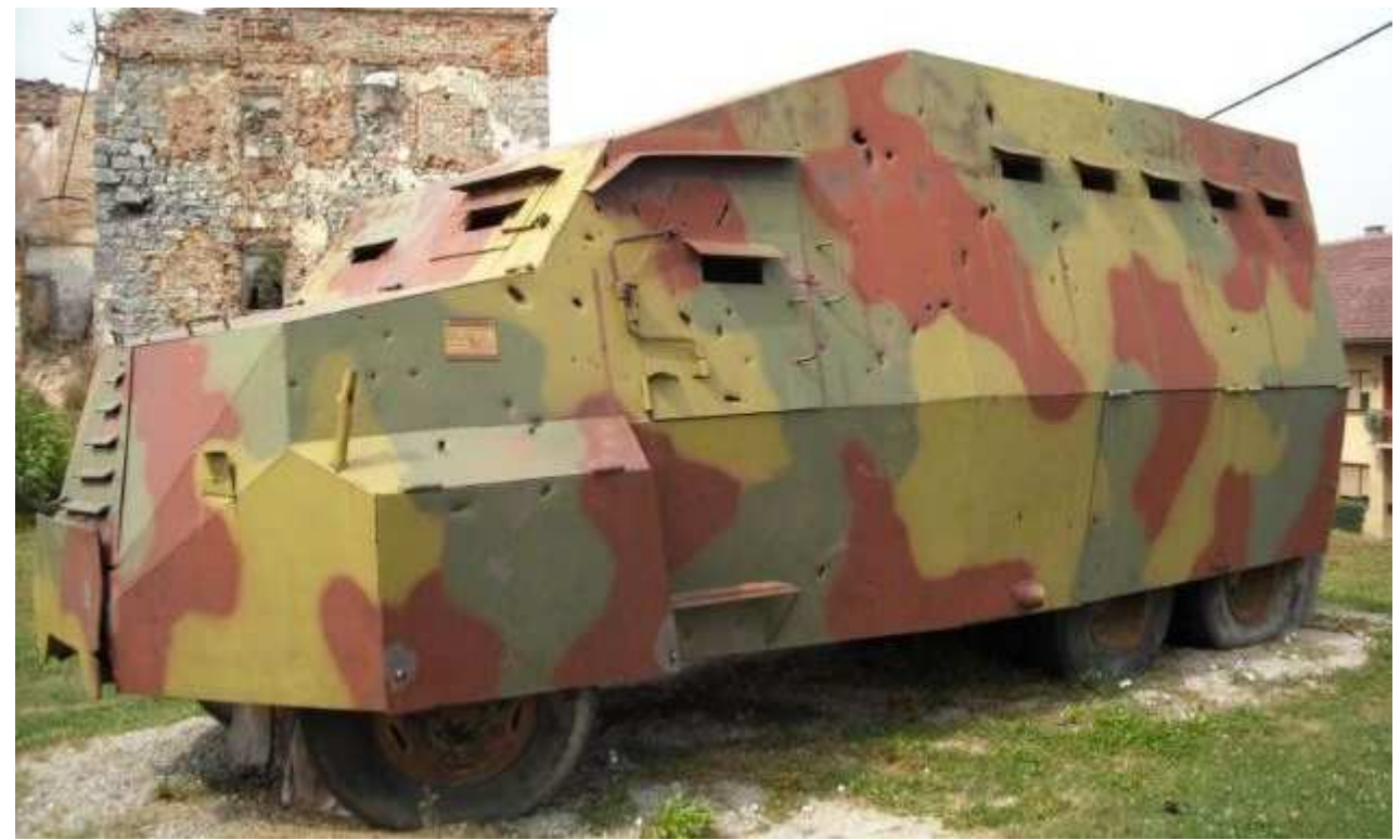
Rafał Białęcki, September 2008