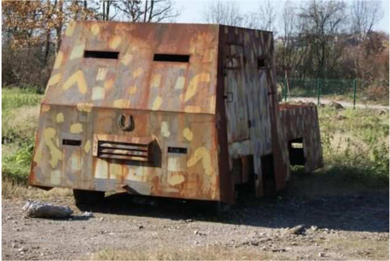
"domagoj" - http://www.maketarstvo.net/forum/viewtopic.php?t=2056