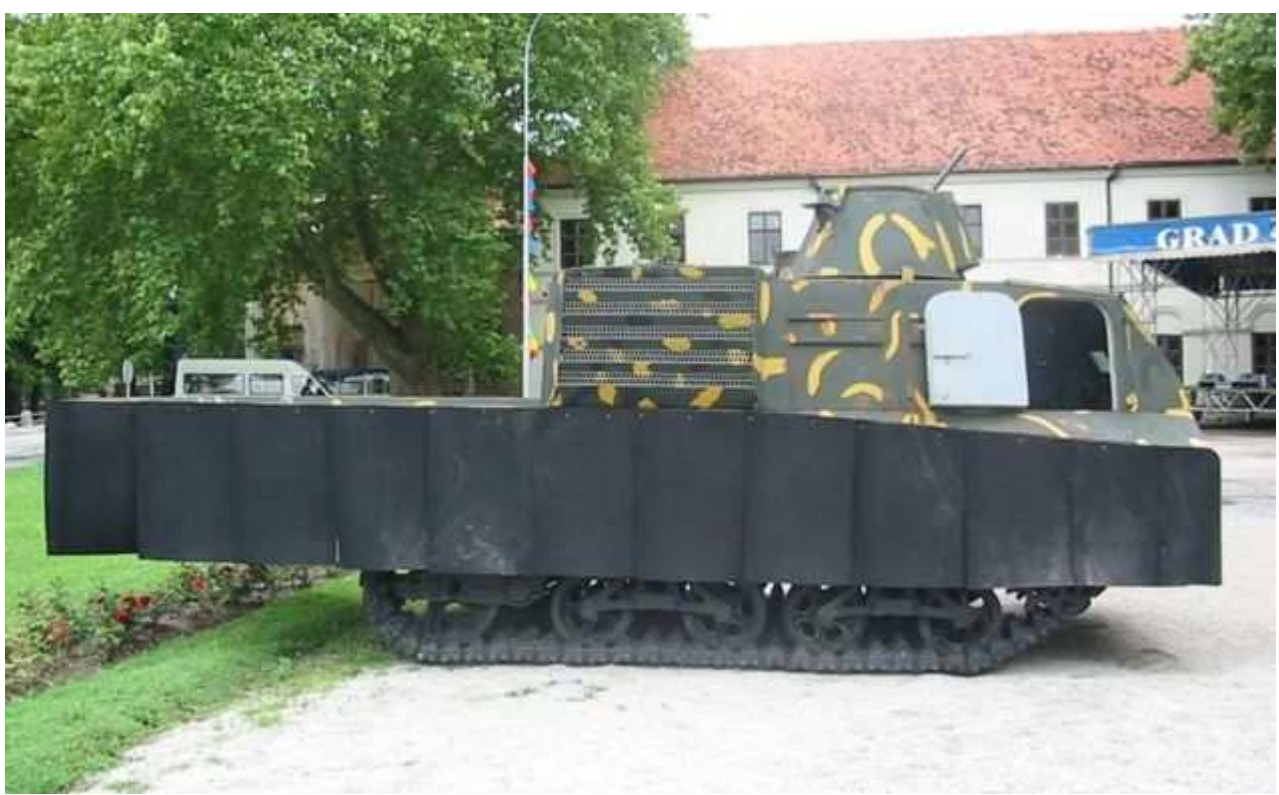
"MINI-2" Improvised AFV – Muzeja Domovinskog Rata u Barutani, Sisak (Croatia) It was build by Željezari Sisak (Sisak Iron Works) it's one of five produced vehicles which were based on TAM-80 trucks. It belonged to 57th Independed Battalion.

"domagoj" - http://www.maketarstvo.net/forum/viewtopic.php?t=17564&sid=feacf0347e9135c839c1b2a3d54b0a49