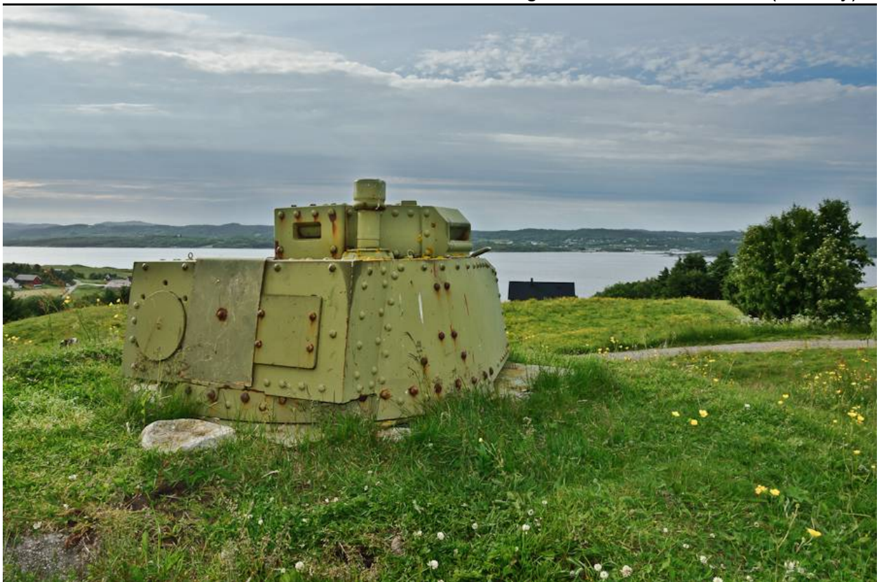
Two LT vz. 35 turrets – Batterie vara / Møvik fort, Augland, near Kristiansand (Norway)

http://www.flickr.com/photos/40870293@N04/4808086645/in/set-72157624554530686/