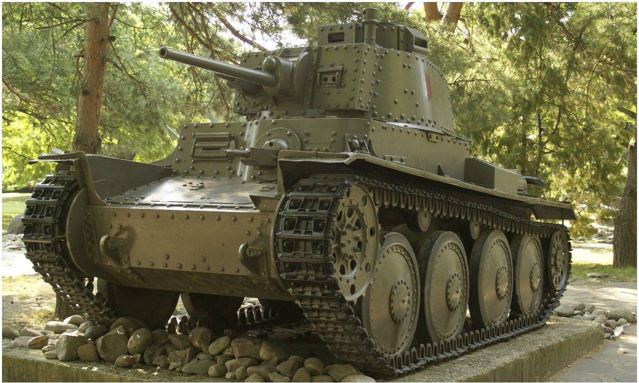
Rafał Białecki, September 2008