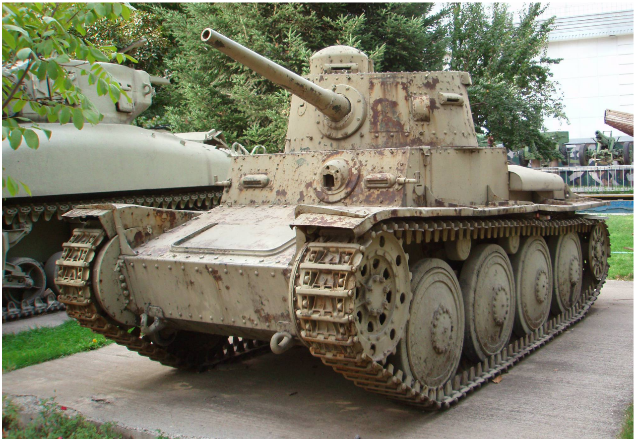
Anatoly Terentiev, October 2008 - http://en.wikipedia.org/wiki/Image:%D0%A2%D0%B0%D0%BD%D0%BA.jpg

Previously displayed in Zvolen (Slovakia). This vehicle (incl. hull/chassis) is integrated in an armored train. This armored train served in Slovakia during the National Uprising in 1944 (David Šolc)