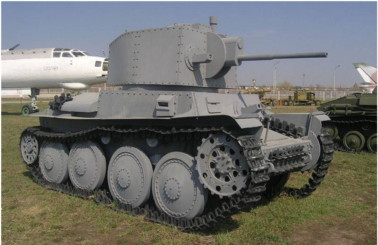
Sergueï Sorokin, 2008 - http://commons.wikimedia.org/wiki/Image:Panzer_38%28t%29%2C_museum_in_Togliatti%2C_Russia-2.JPG