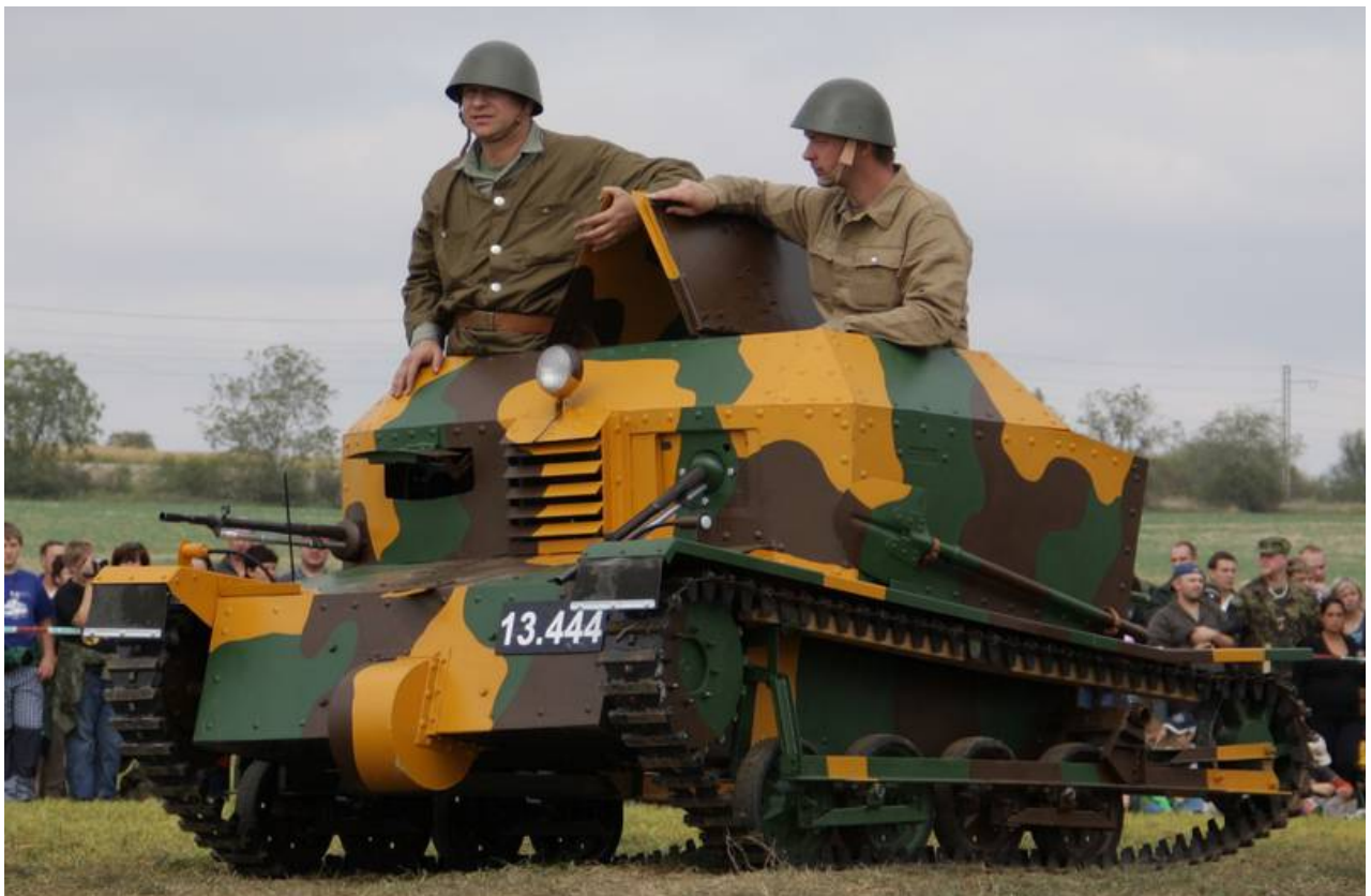
OA vz. 30 armoured car (reproduction) – Private collection (Slovak Republic)

http://www.tancik-vz33.estranky.cz/fotoalbum/utajena-pevnost-mj-s-4-chvalovice/2012-09-29_4990.html