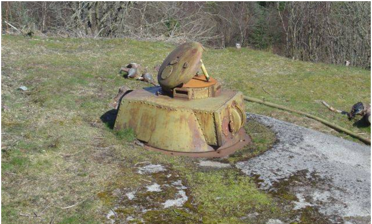
LT vz. 35 turret – Bergen area (Norway)

http://forum.mjf.no/uploads/523/Tankst%C3%A5rn.JPG