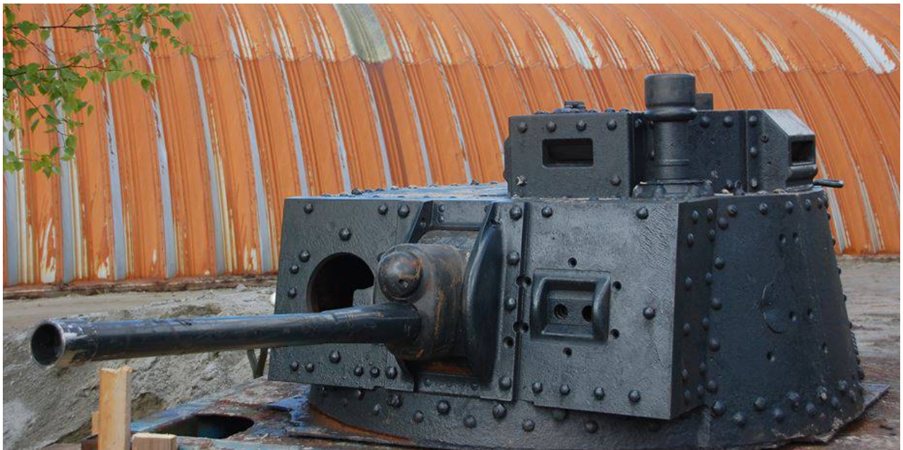
PzKpfw 38(t) turret – Rogaland Krigshistoriske Museum (Norway)

https://www.facebook.com/photo.php?fbid=10204269180278515&set=p.10204269180278515&type=1&theater&__mref=message