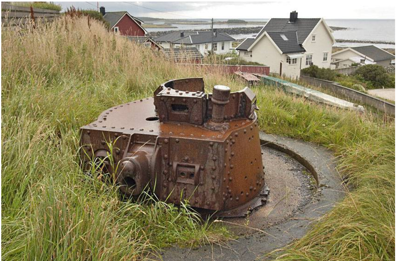
PzKpfw. 38(t) turret – Festung Lista, Wn Nordhassel, Farsund (Norway)

Ondrej Filip, August 2012 - http://zapisnik.fortif.net/opevneni-na-poloostrove-lista/