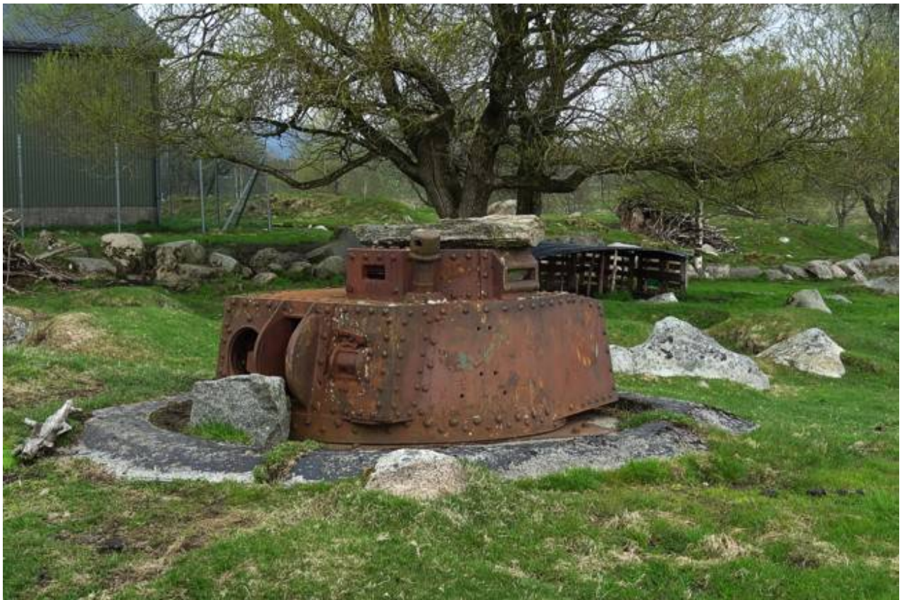
PzKpfw. 38(t) turret – Wn Sola Land III, near Stavanger (Norway)

http://bunkersite.com/locations/norway/rogaland/tk-sola-land5.php