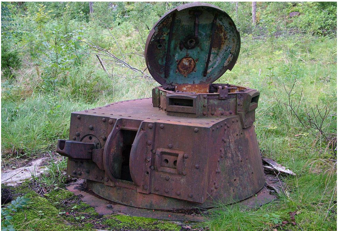
LT vz. 35 turrets – Kjevik airport, Kristiansand (Norway)

Erik Ettrup - http://www.panzerworld.net/panzerturretsnorway