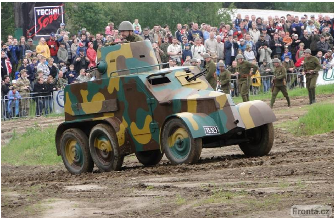
PzKpfw 38(t) turret – Unknown location (Norway?)

http://www.fronta.cz/fotogalerie/obrnny-den-lesany-2010