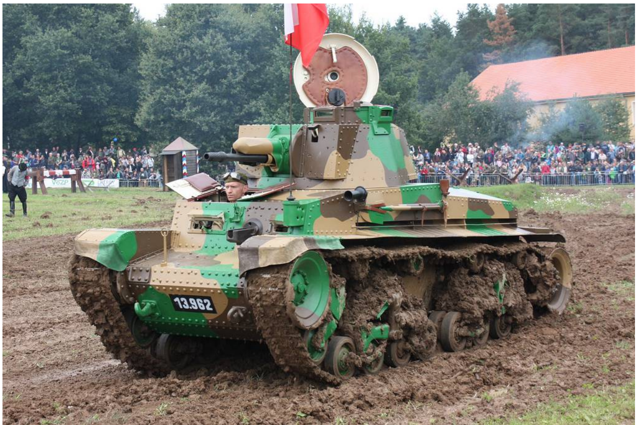
"adamicz", September 2013 - http://www.militaryphotos.net/forums/showthread.php?230009-Tank-Day-2013-in-Lesany-museum