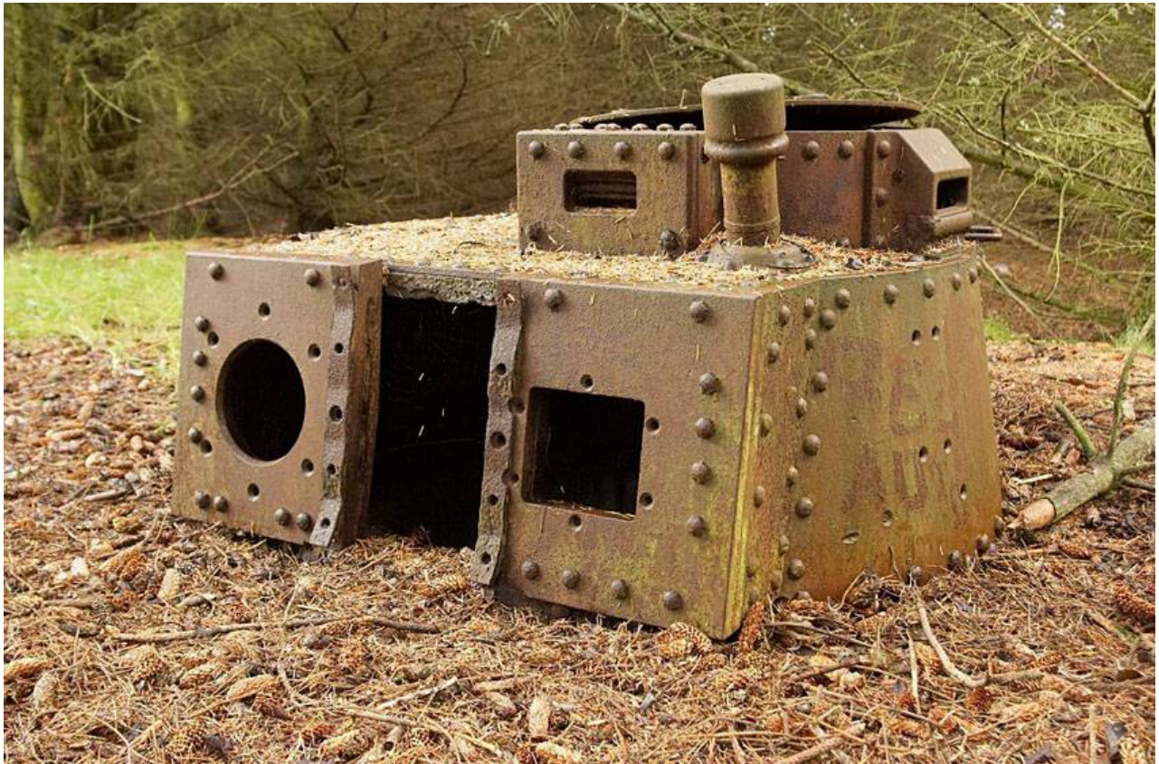
PzKpfw. 38(t) turret – Borhaug, near Vestbygd (Norway)

Ondrej Filip, August 2012 - http://zapisnik.fortif.net/opevneni-na-poloostrove-lista/