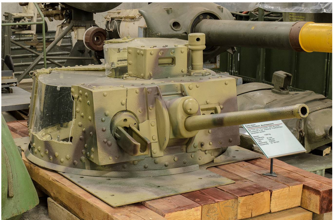
PzKpfw. 38(t) turret – Kevin Wheatcroft Collection (UK) Previously located on a Tobruk in Stavanger area (Norway)

"270862", July 2015 - https://www.flickr.com/photos/131561895@N06/20427495075/in/album-72157656907522941/