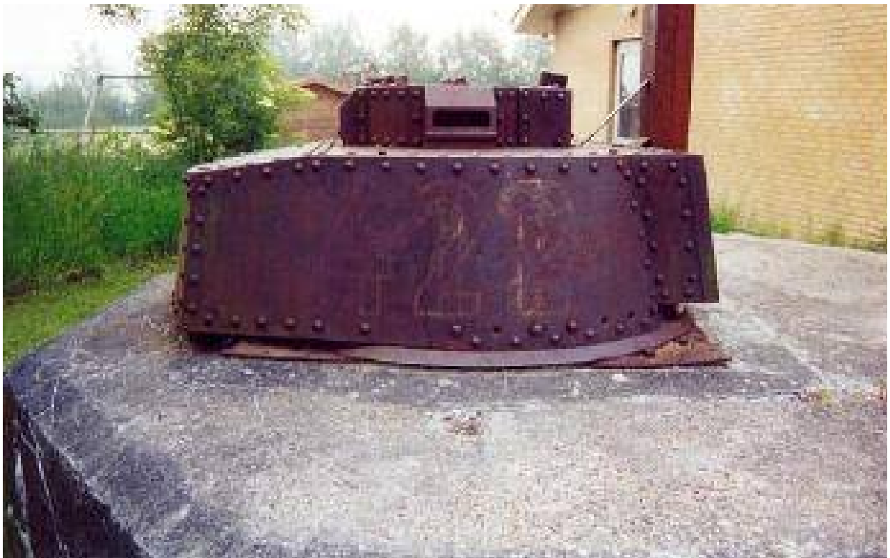
PzKpfw 38(t) turret – Private collection (Norway) Currently for sale

https://www.facebook.com/groups/sdkfz222/permalink/834918476640710/?__mref=message