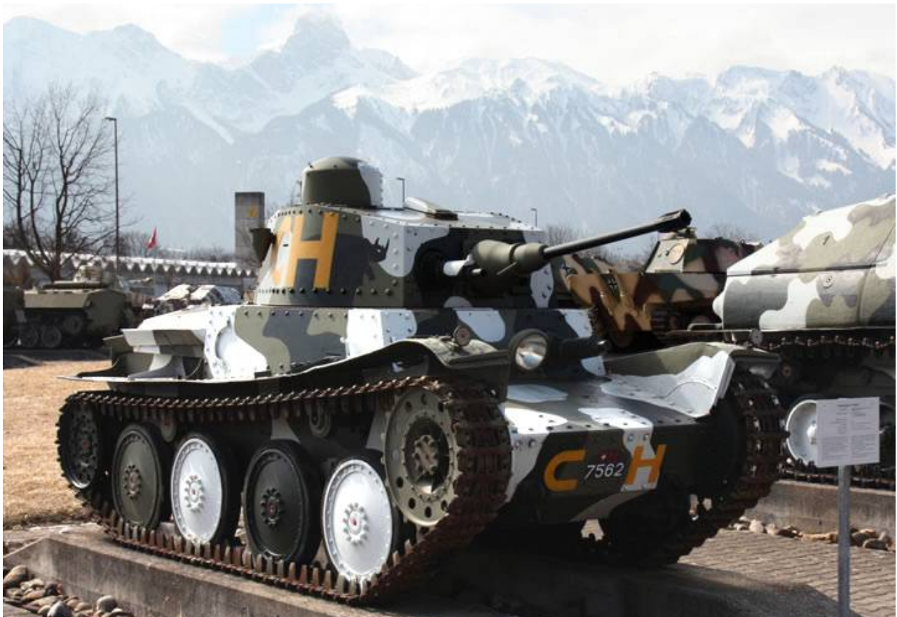
Massimo Foti, March 2010 - http://www.com-central.net/index.php?name=Forums&file=viewtopic&t=12552

LTH : export version to Switzerland of the LT vz. 38 (Lahky Tank LT 38/Panzerkampfwagen 38 (t)) (Wikipedia)