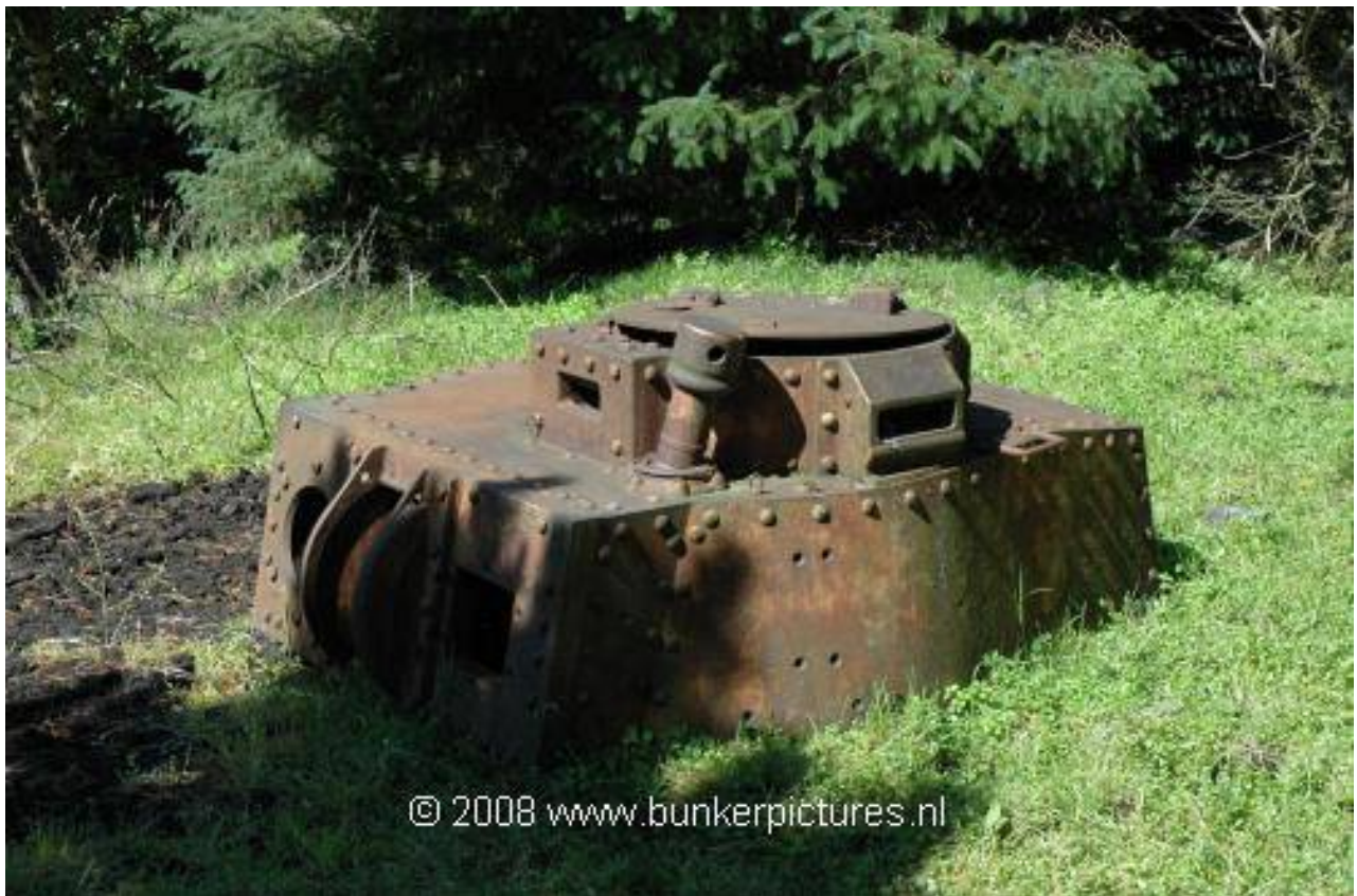
First PzKpfw. 38(t) turret – Inland defence line, Gossa Island, Møre og Romsdal (Norway)

http://www.bunkerpictures.nl/pictures/norway/more%20og%20romsdal/gossen/landfront/aanvang.html