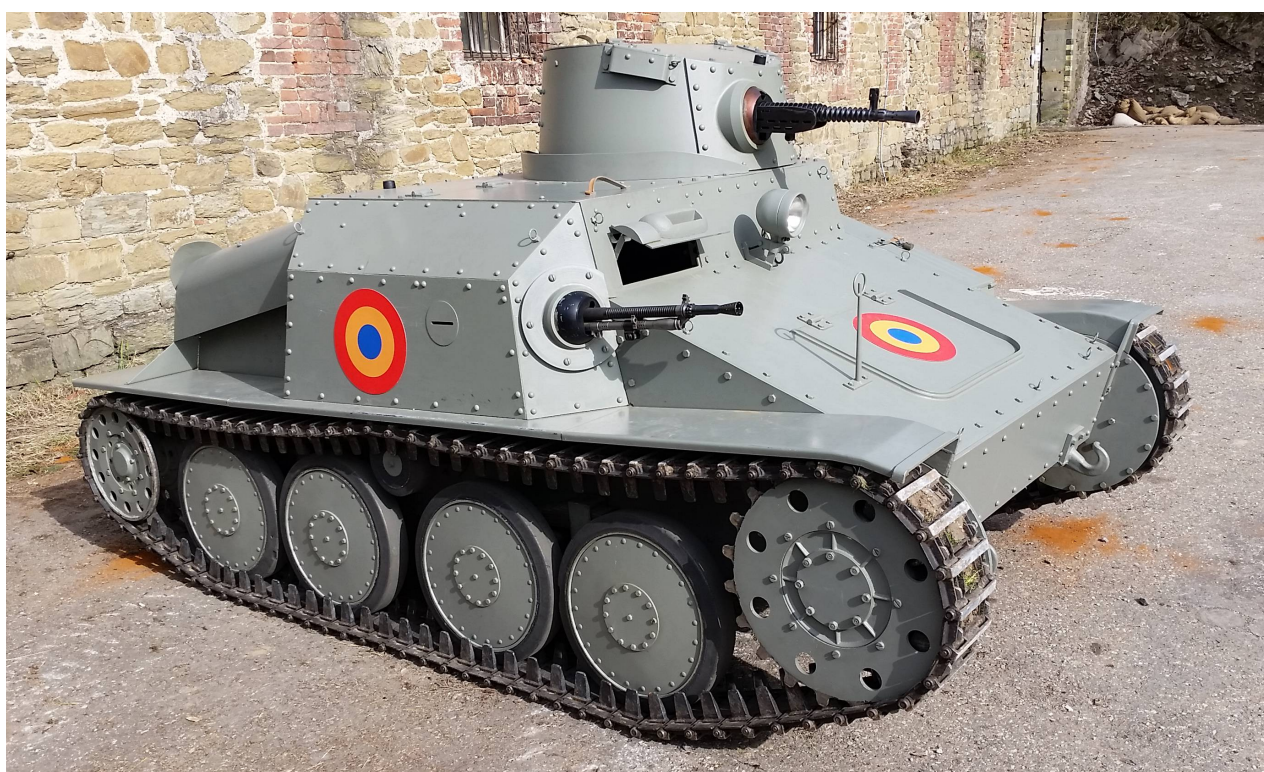
Tančík vz.33 (reproduction) – Private collection (Czech Republic)