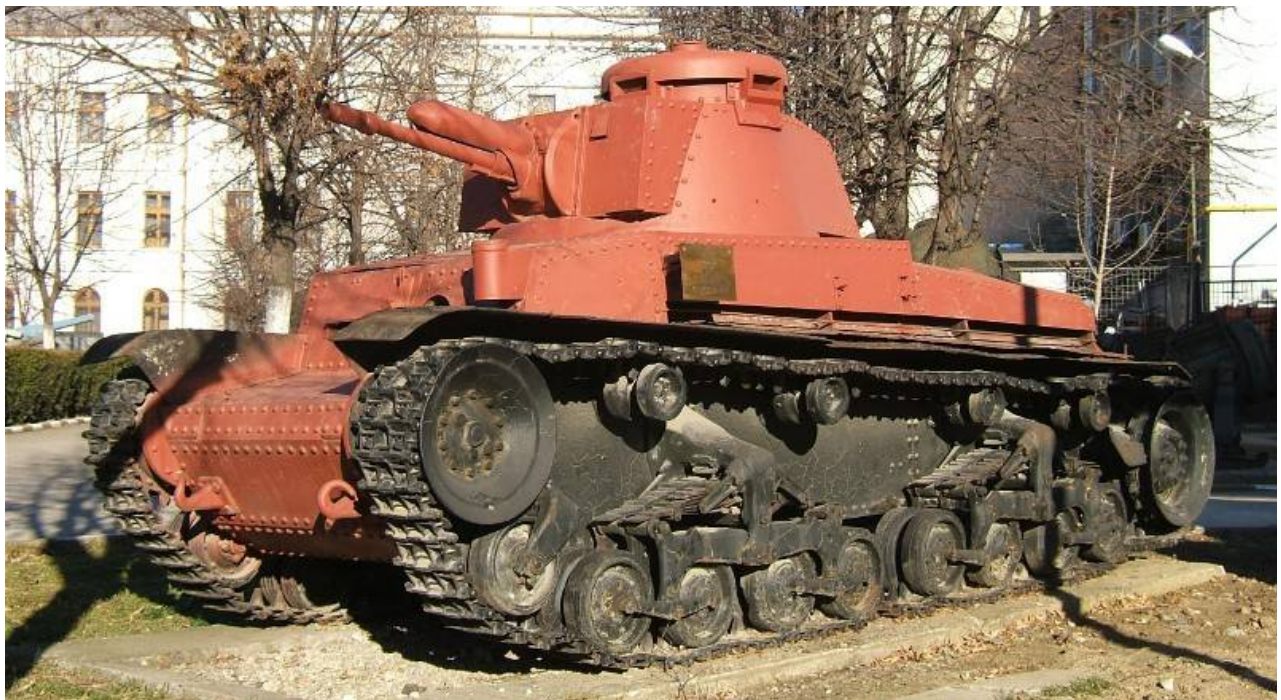
Doug Kibbey, January 2007 - http://www.com-central.net/index.php?name=Forums&file=viewtopic&t=5132&start=45

This tank was previously displayed at the Aberdeen Ord. Museum (USA), until mid-2008. It was restored at Lesany in 2010. Some new information was revealed thanks to "palic": the Serial Number is 10112, the tank was produced by CKD Prague. The original Czechoslovak military registration number was 13.962. The tank was delivered to the CZ Army in 1937 and served with the 2 nd Regiment of Assault Vehicles in Vyškov. After the German occupation this vehicle (minus its turret) continued its operational service in the WH as a Mörsezugmittel 35(t). After some unknown damages, this vehicle was sent to Skoda Pilsen to be repaired and remained there until the liberation of Czechoslovakia (it was not recovered from the Hillersleben Proving Ground, contrary to what the Aberdeen museum said). This vehicle was then equipped with a turret and repaired on request of the US HQ, and then shipped to the USA for tests of the pneumatic and steering system