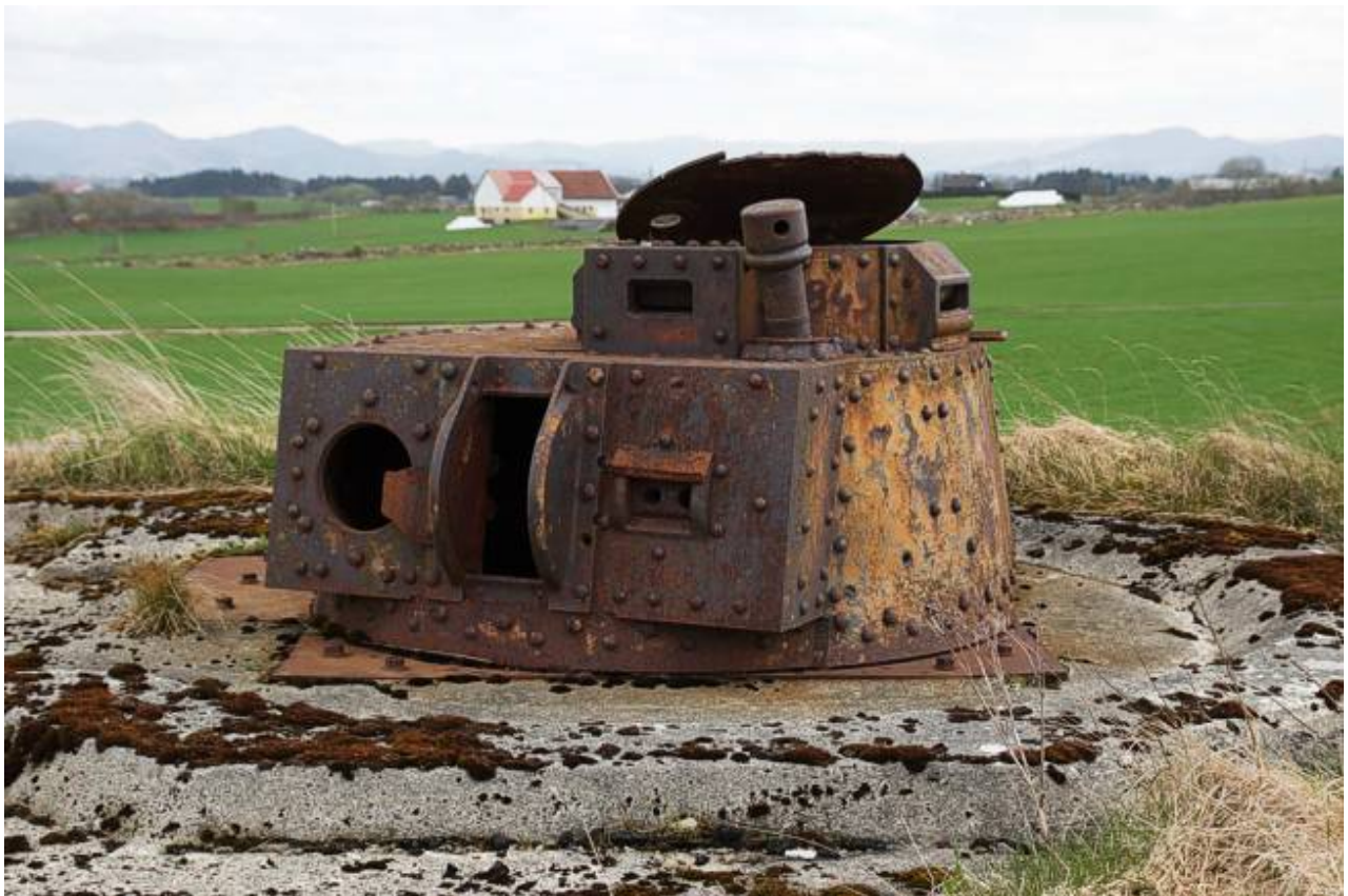
PzKpfw. 38(t) turret – Stp Zitadelle, near Stavanger (Norway)

http://bunkersite.com/locations/norway/rogaland/vftk-heigre.php