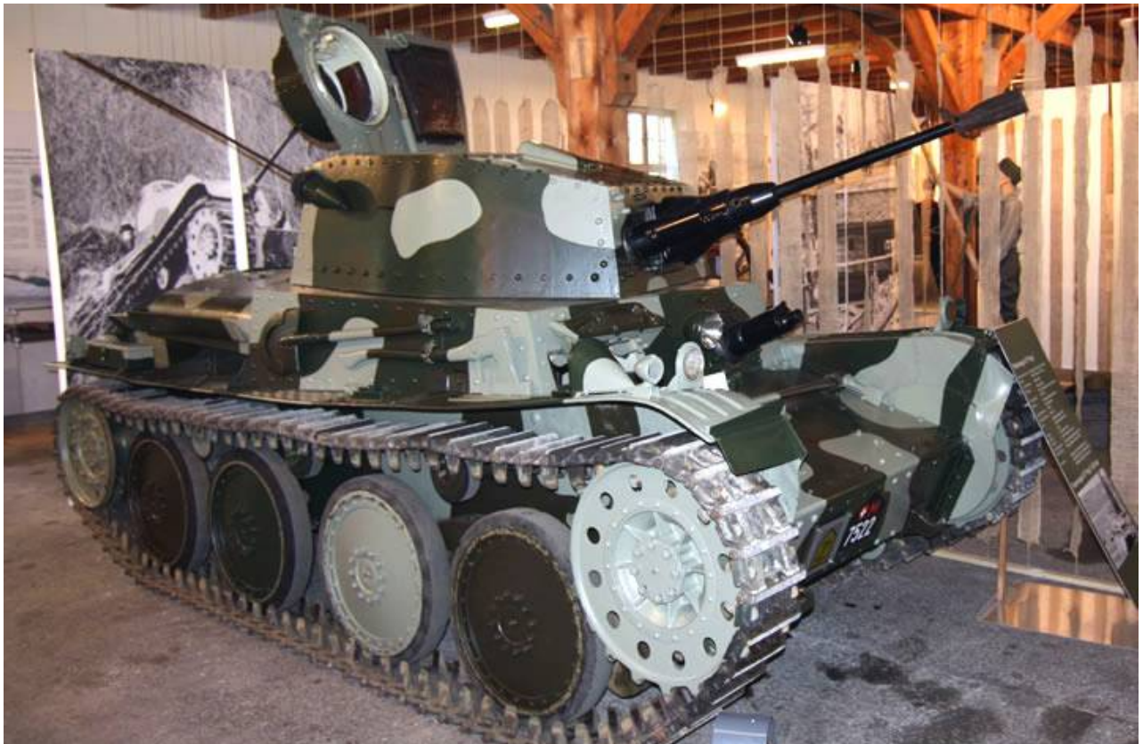
Massimo Foti, September 2009