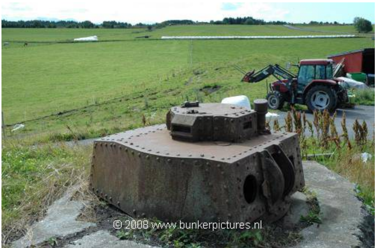
3rd PzKpfw. 38(t) turret – Inland defence line, Gossa Island, Møre og Romsdal (Norway)

http://www.bunkerpictures.nl/pictures/norway/more%20og%20romsdal/gossen/landfront/aanvang.html