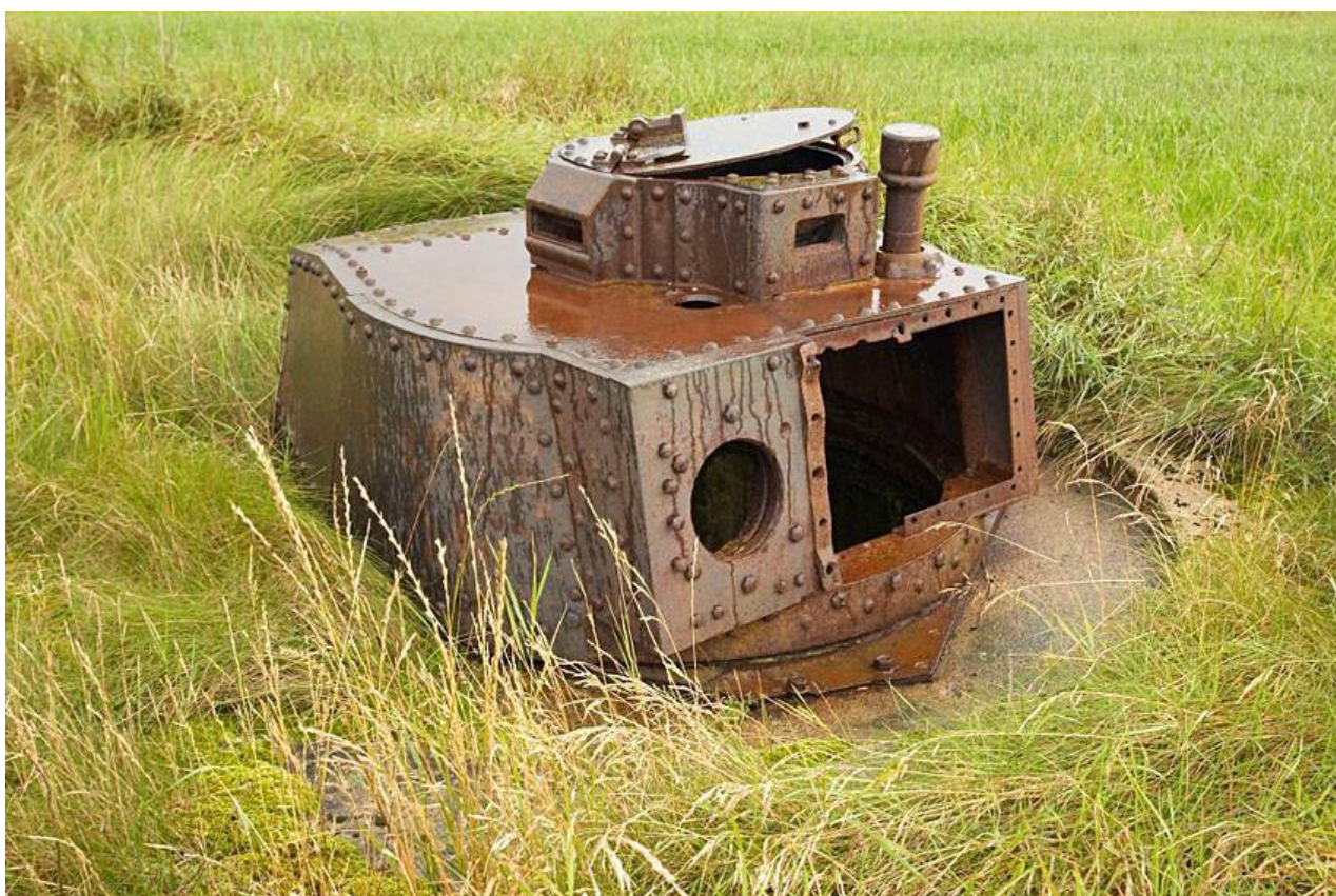
PzKpfw. 38(t) turret – Festung Lista, Wn Østhassel, Farsund (Norway)