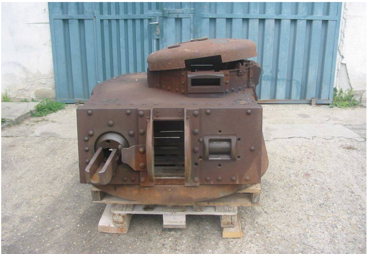
Two LT vz. 35 turrets – Unknown location