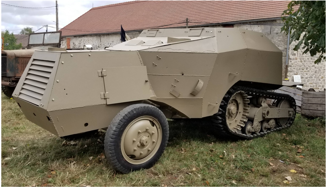
Pierre-Olivier Buan, September 2020