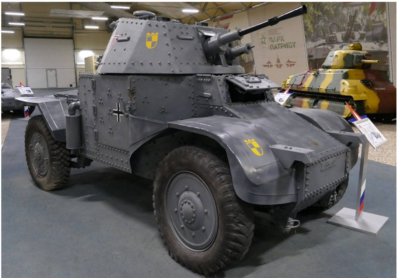
Yuri Pasholok, December 2019

This vehicle was assembled from parts that come from several wrecks. The front and rear axles come from Djibouti, the hull and some armor plates come from a fire range in Meucon, some other hull plates come from Coetquidan, the turret come from the Château de Guise, the rims are from an EBR and were cut to size