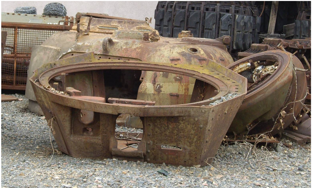
"181010", July 2011

This vehicle was previously part of the Auburn museum and was sold in December 2012. The chassis is original (and from a non-armoured vehicle) but the hull was entirely reconstructed