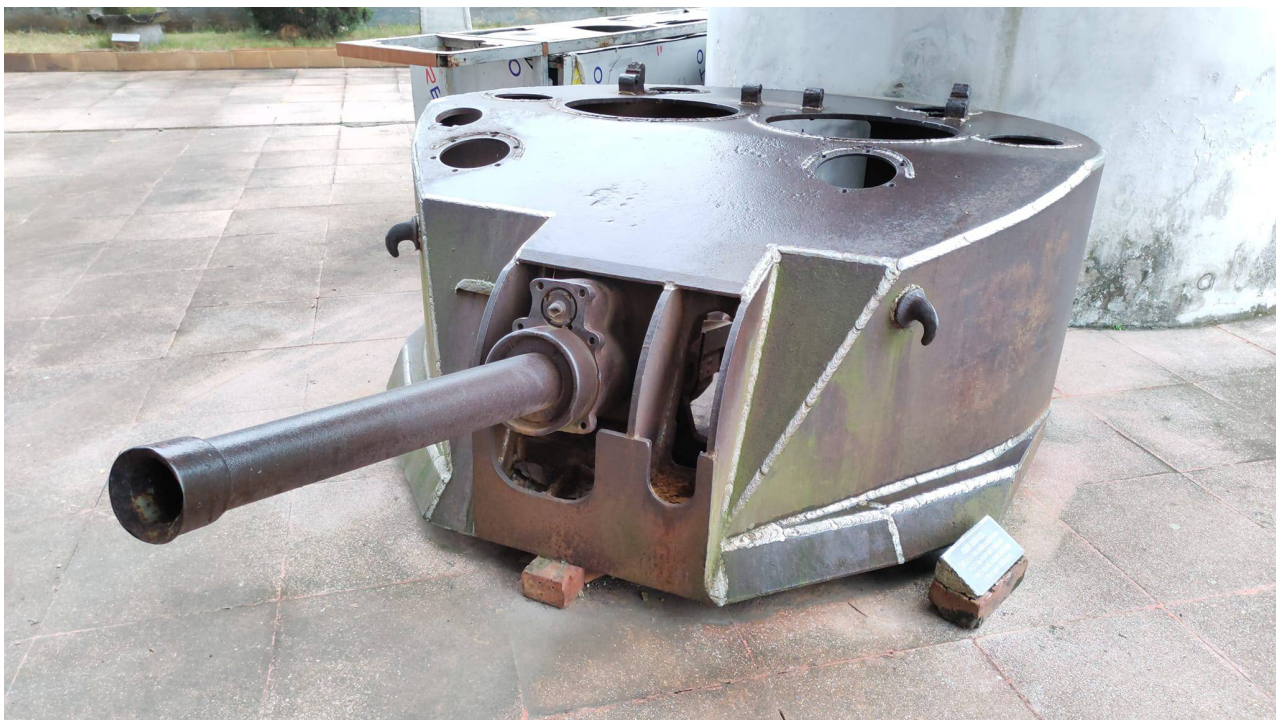
Two Panhard AMD 178B Fives Lille N°1 turrets – Musée des Blindés, Saumur (France)

https://www.facebook.com/groups/307283852755257/permalink/2080968588720099/