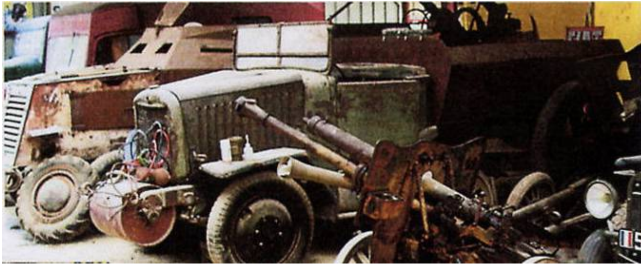
Véhicules Militaires Magazine, Mai 2005