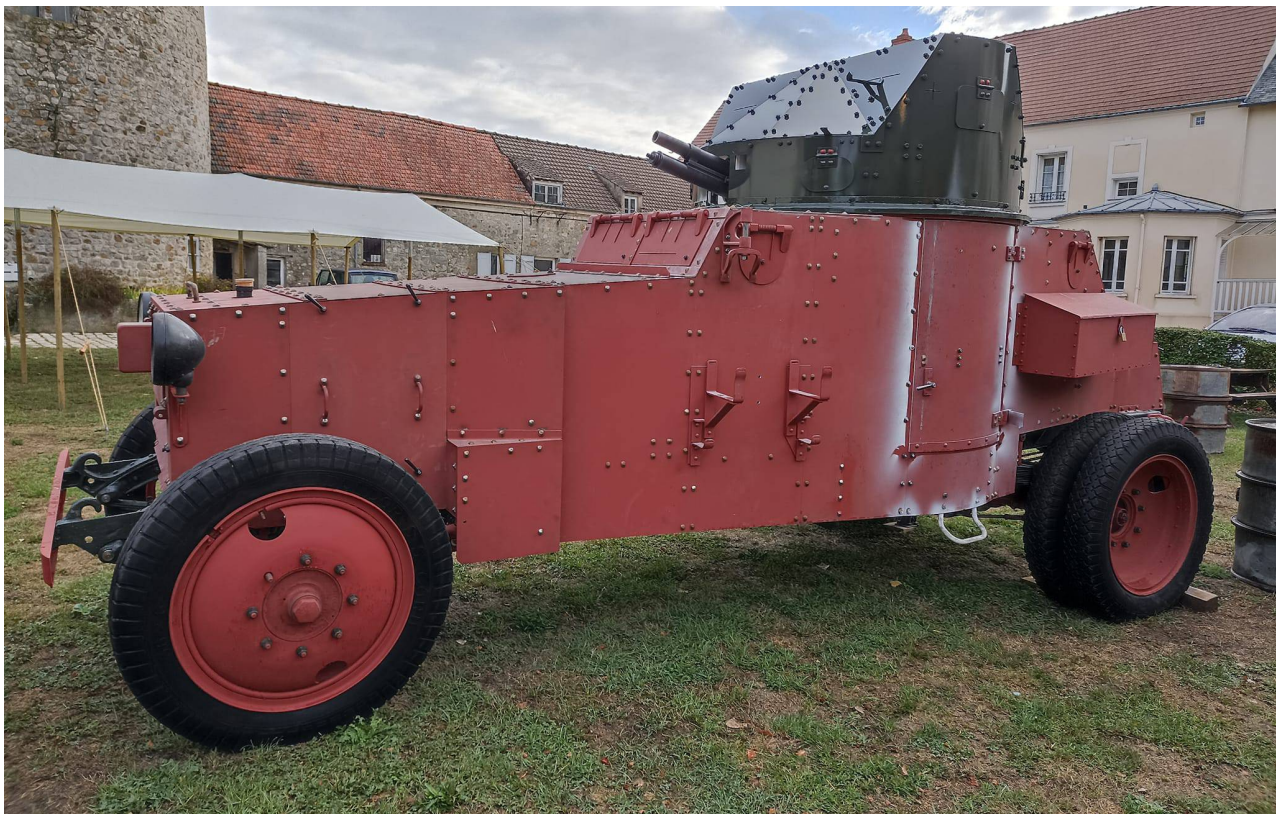
Citroen-Kegresse P-28 Armoured Half-Track – Montevideo (Uruguay)

https://www.facebook.com/groups/461618217292981/permalink/5380694208718666/