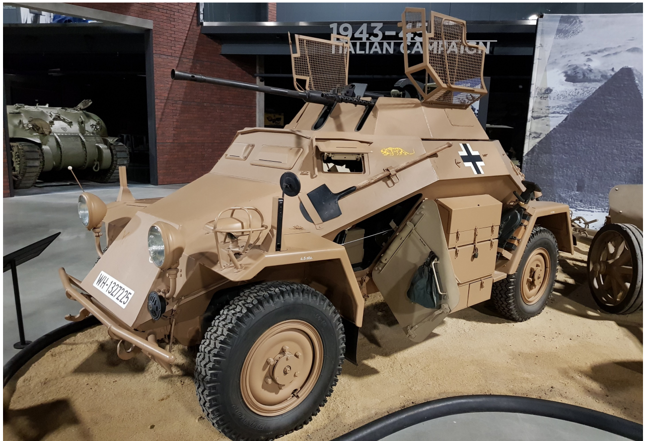
Pierre-Olivier Buan, September 2019