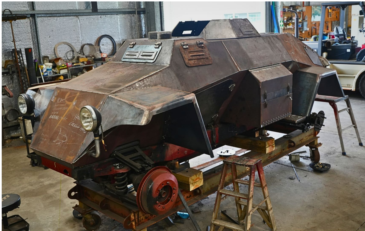
Daimler DZVR 21 – Deutsches Panzermuseum Munster (Germany)

https://www.facebook.com/photo/?fbid=982476307243178&set=pcb.982476333909842