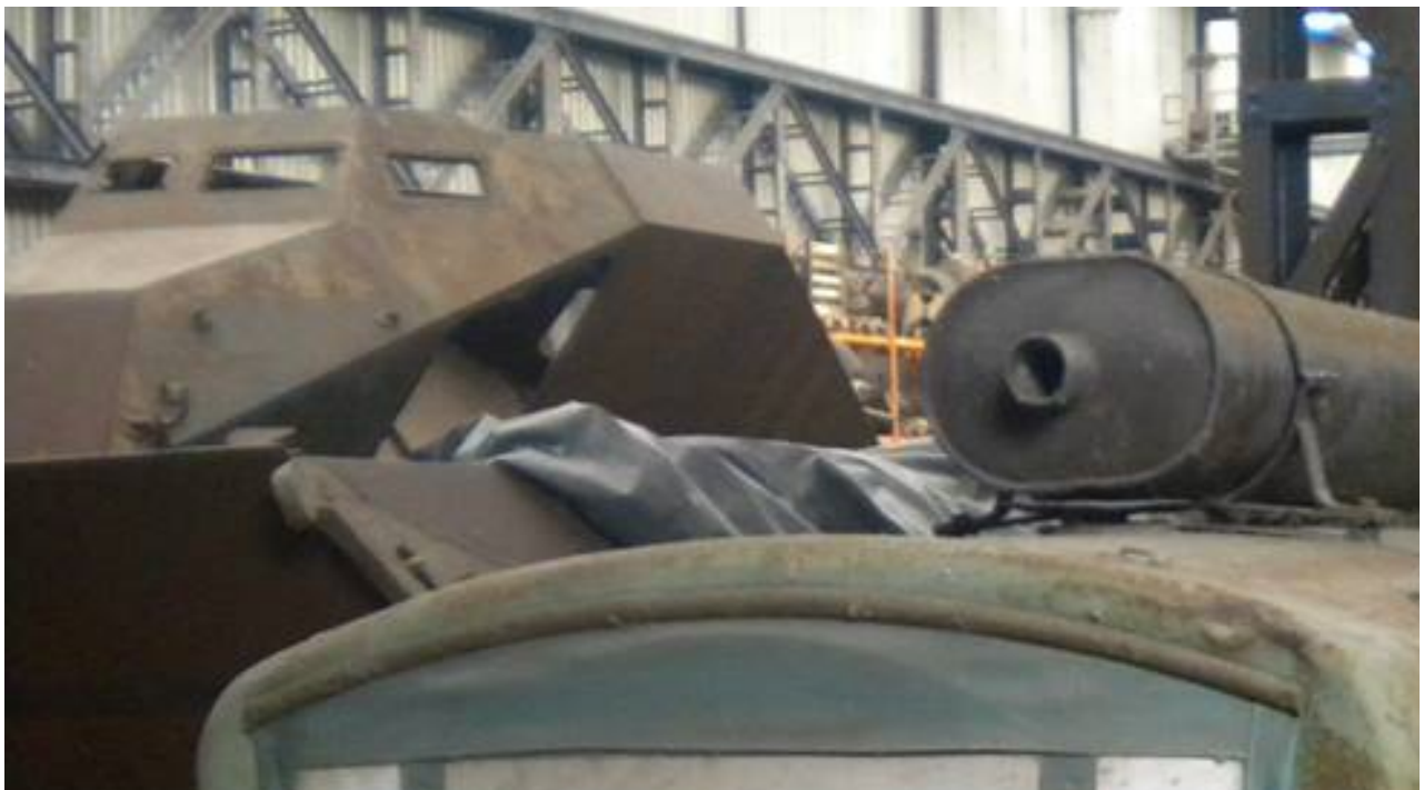
SdKfz. 261 restoration project – The Weald Foundation (UK) Chassis number 8110827

https://www.facebook.com/media/set/?set=a.829484870414009.1073741858.801749283187568&type=1