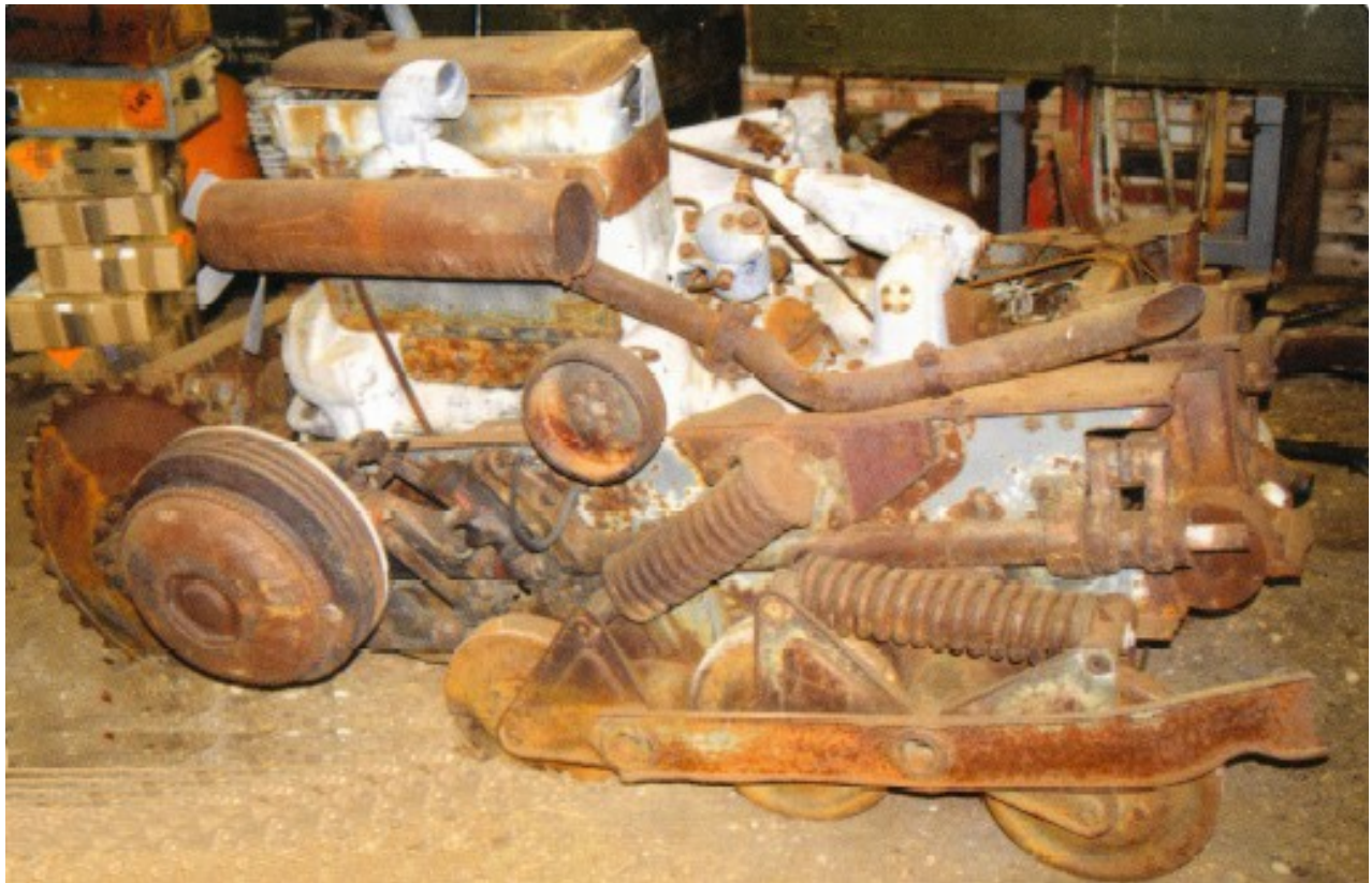
Nuts and Bolts magazine