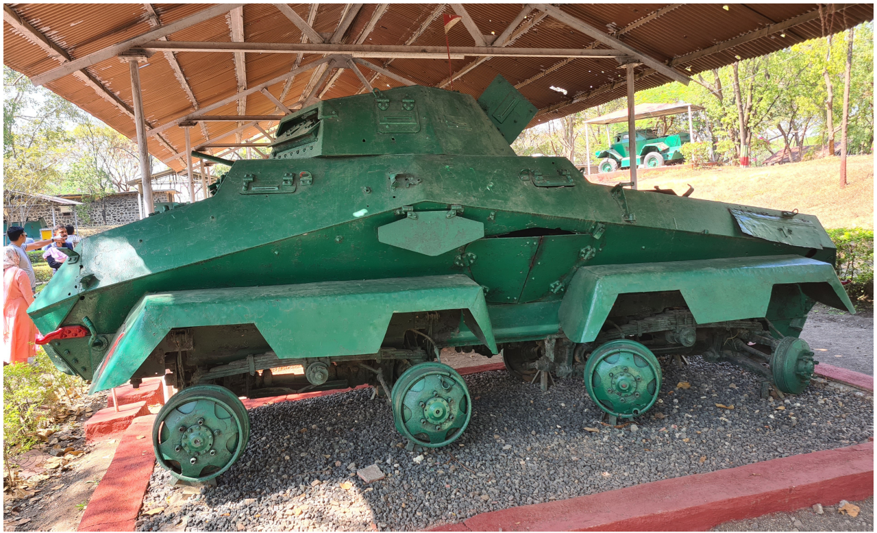
Pierre-Olivier Buan, January 2025