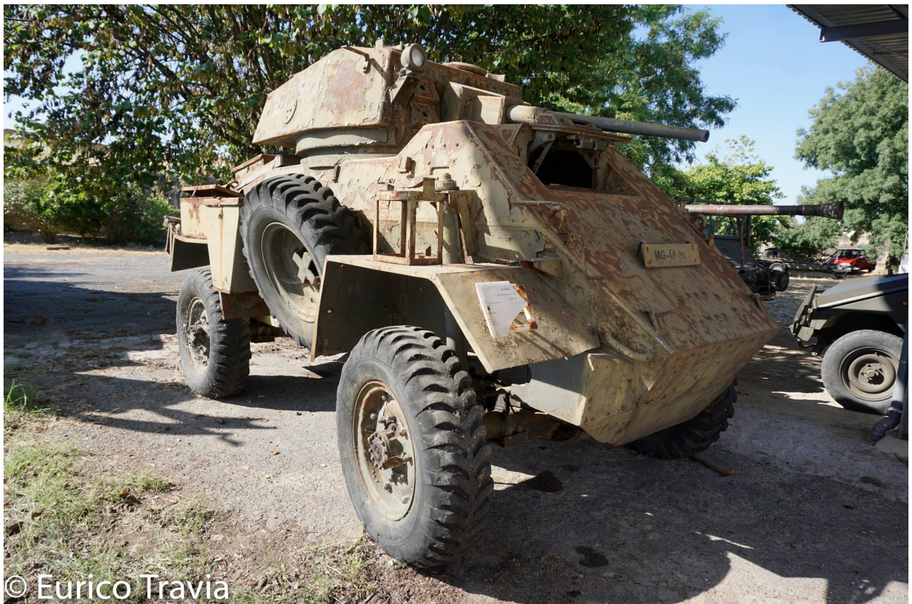
Humber Armoured Car Mk IV – Forte do Bom Sucesso, Lisbon (Portugal)