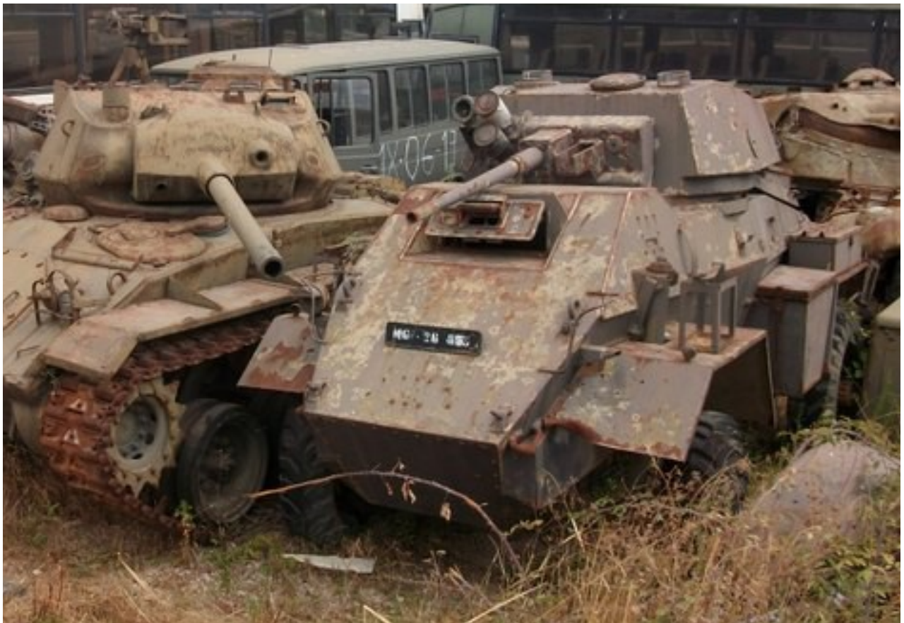
Humber Armoured Car – Portuguese Army Cavalry School Museum, Santarém (Portugal)

http://forum.motorclassico.pt/showthread.php?t=12700