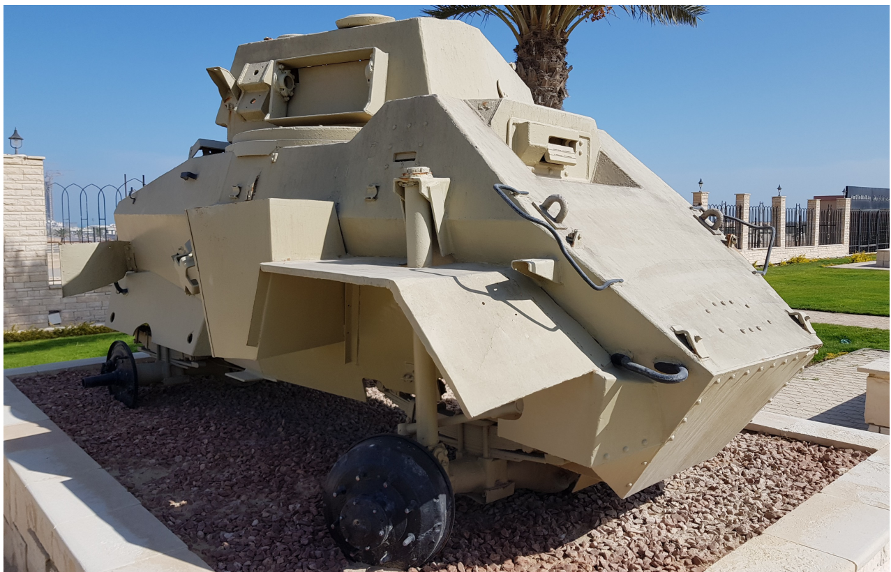
Humber Armoured Car – Royal Jordanian Tank Museum (Jordan)