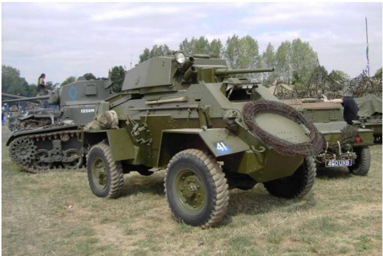
Humber Armoured Car – Bovington Tank Museum (UK)