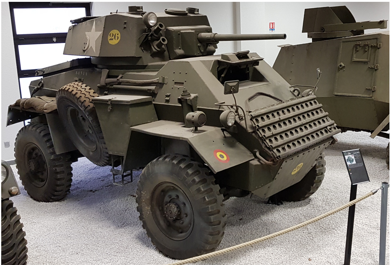
Pierre-Olivier Buan, December 2018