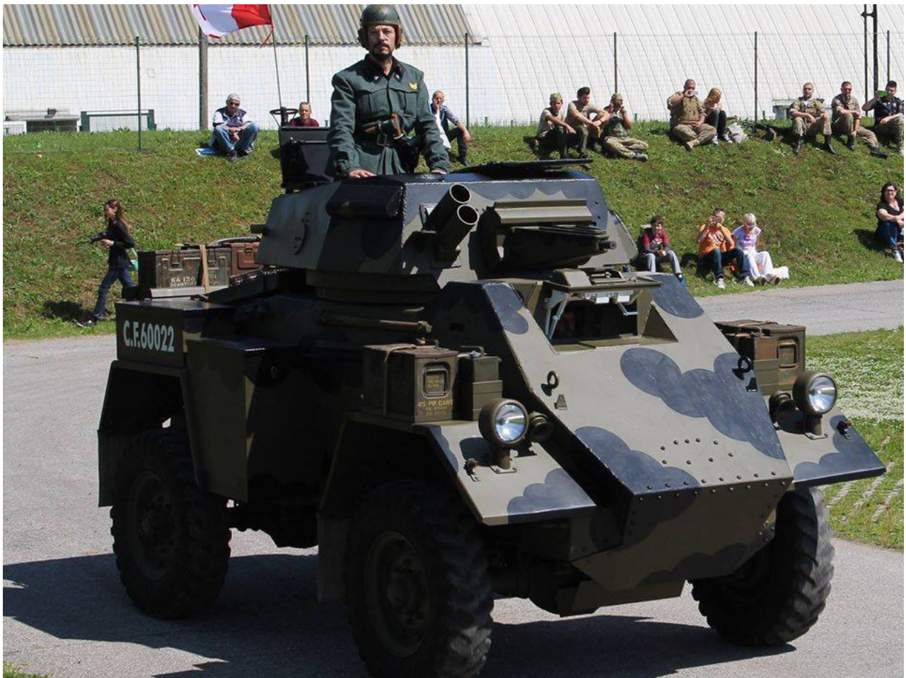
Fox Armoured Car – Caserma "Babini", Bellinzago Novarese (Italy)

"gigitank", June 2009 - http://www.modellismopiu.net/m+gallerie/main.php?g2_itemId=260079