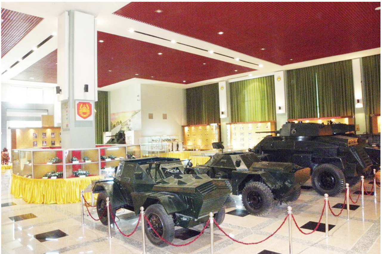
Humber Armoured Car – School of Armour and Mechanized Warfare, Nowshera (Pakistan)