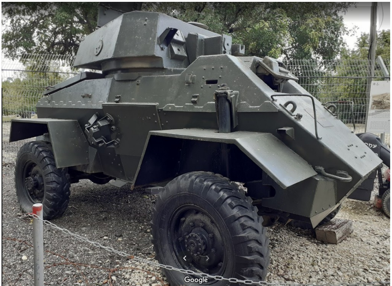
Humber Armoured Car – Yad Mordechai Battlefield reconstruction site, Negba (Israel)

https://www.google.com/maps/contrib/109233012899266205692/photos/