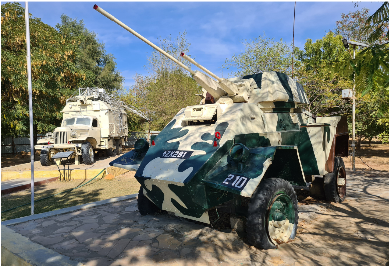
Pierre-Olivier Buan, January 2025

Two Fox Armoured Cars – Jaisalmer War Museum, Jaisalmer (India)