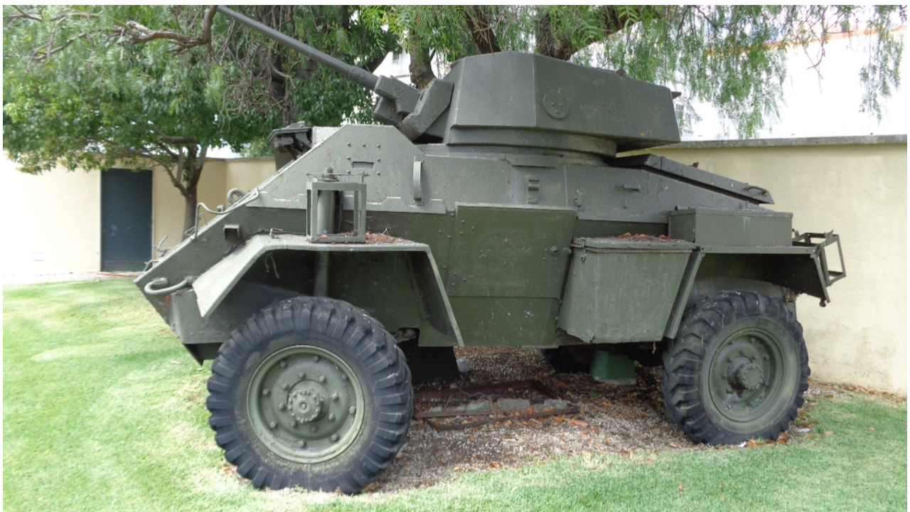
Humber Armoured Car – Colégio Militar, Lisbon (Portugal)