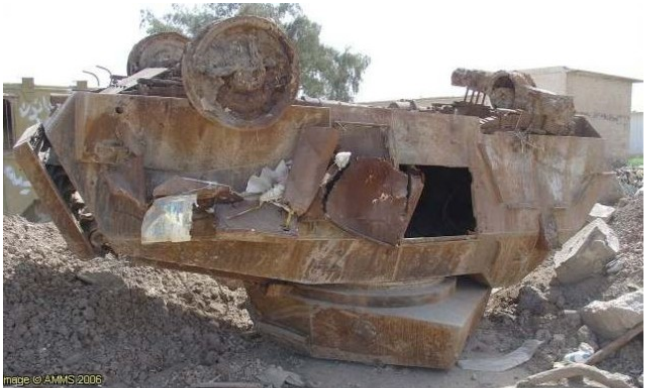
Humber Armoured Car "Erika" – Unknown location

http://www.ammssydney.com/content/CntRefFeat_PH_LostFound.html