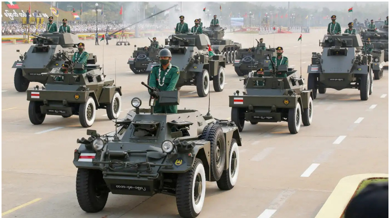
Two Humber Armoured Cars – Defence services museum Naypyidaw (Burma / Myanmar)

https://www.facebook.com/groups/859603390775800/