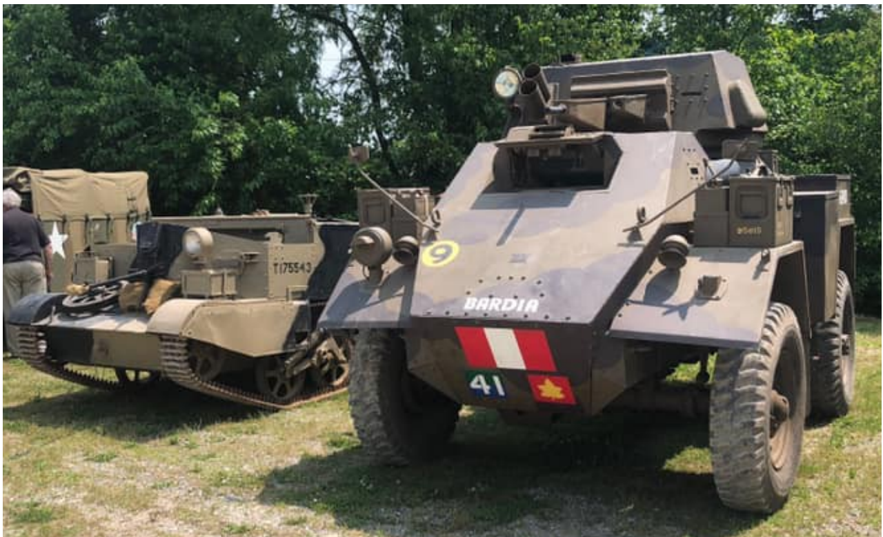
Fox Armoured Car – The National Cadet Corps, 1 (Andhra) Armoured Squadron NCC Directorate, Secunderabad (India)

https://www.facebook.com/MilitaryClassicVehicles/photos/pcb.1334942536653149/1334942493319820/?type=3&theater