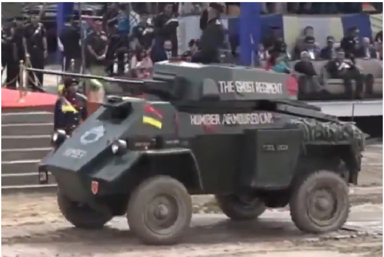
Humber Armoured Car – Armoured Corps Museum, Ahmednagar, Maharashtra (India)

https://www.facebook.com/mashtabekb/videos/