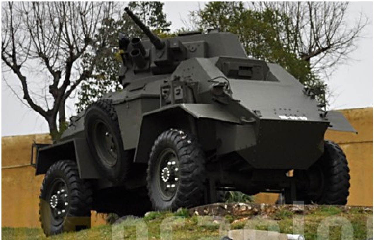
Humber Armoured Car – Military Museum, Porto (Portugal)

Miguel Silva Machado - http://www.operacional.pt/novas-capacidades-nos-lanceiros/