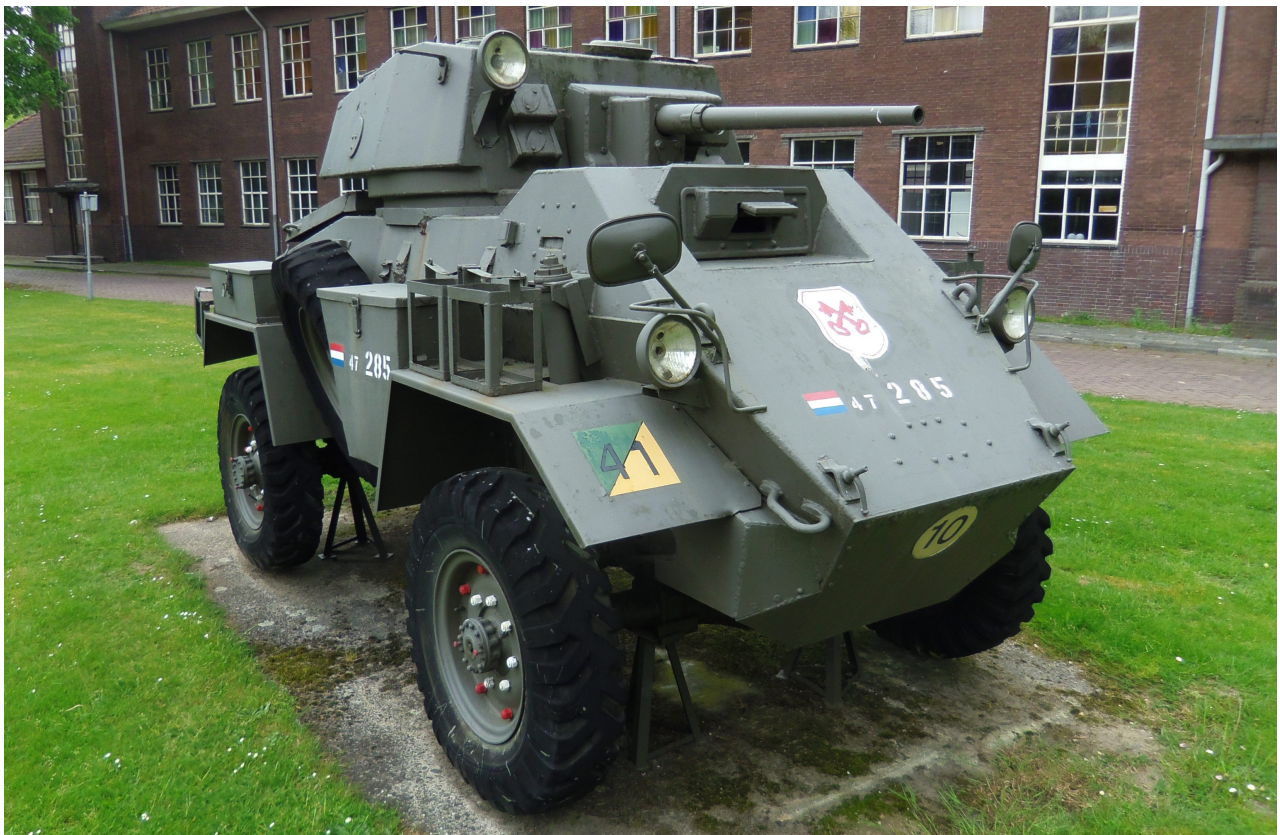
Humber Armoured Car – 43rd Reconnaissance Regiment Living History Group (UK)