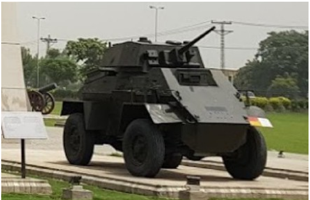
Humber Armoured Car – Maharaja Ranjit Singh War Museum, Ludhiana (India)

http://static.panoramio.com/photos/large/73448265.jpg