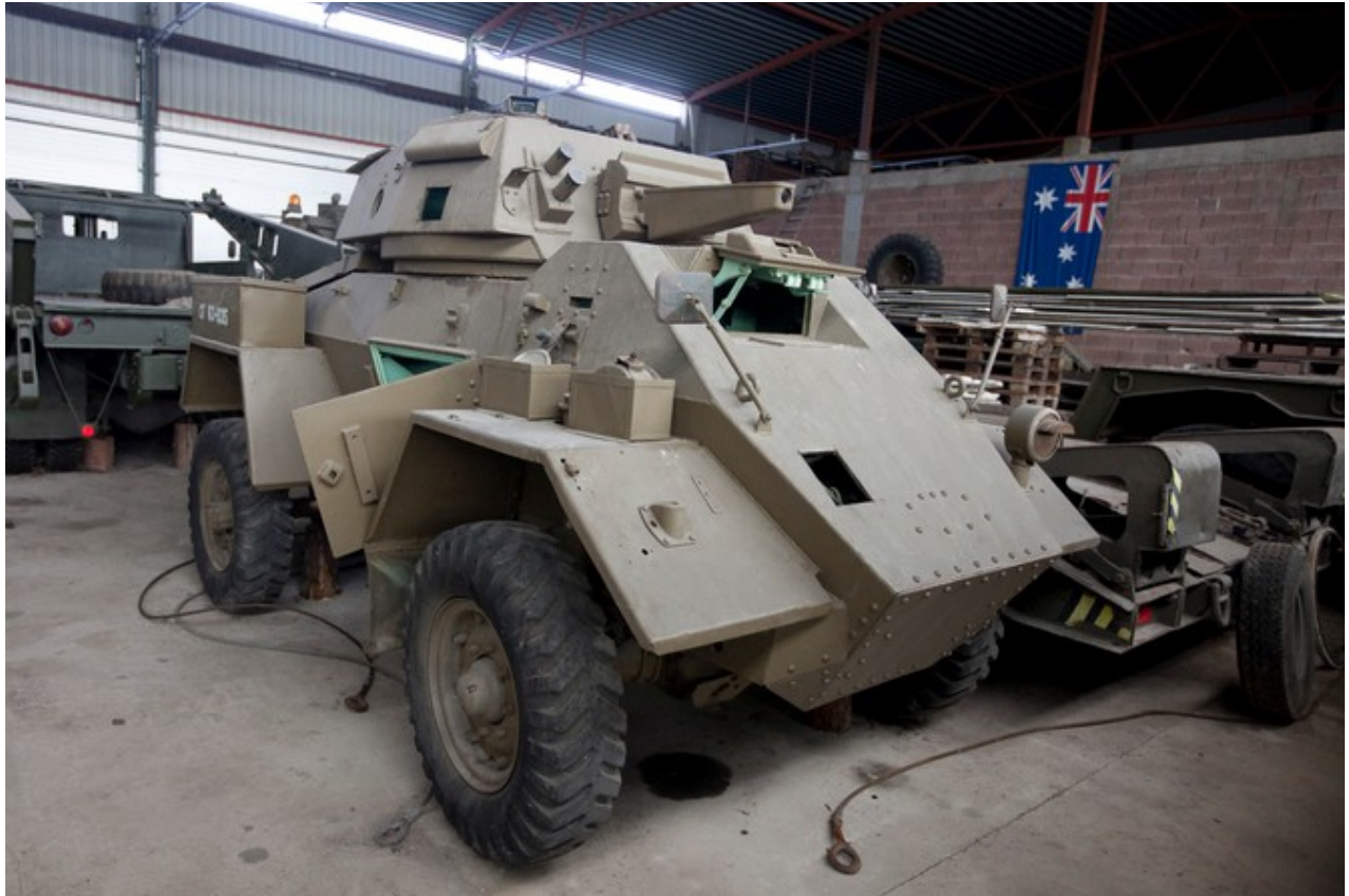
Fox Armoured Car – Heeresgeschichtliches Museum, Wien (Austria) On loan from the Robert Gill Collection

http://www.militarymuseum.at/collection/#/unitedkingdom/