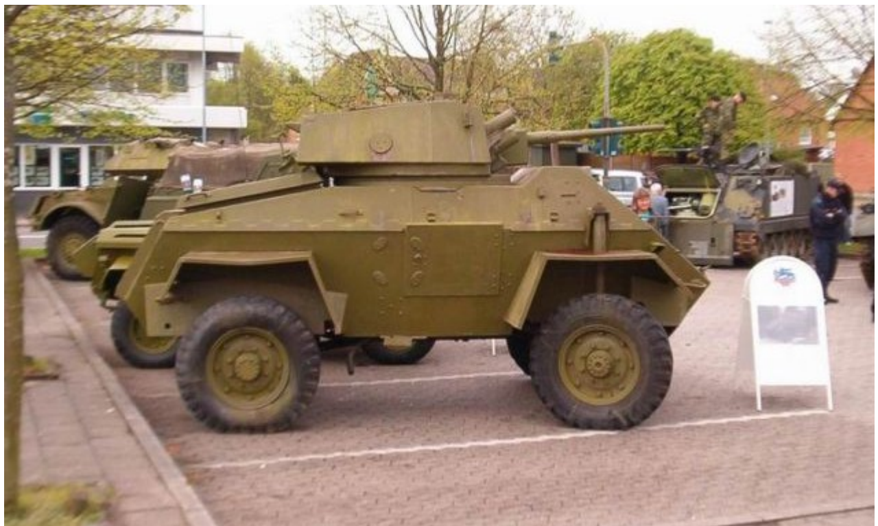
Humber Armoured Car – Tøjhusmuseet, Copenhagen (Denmark)