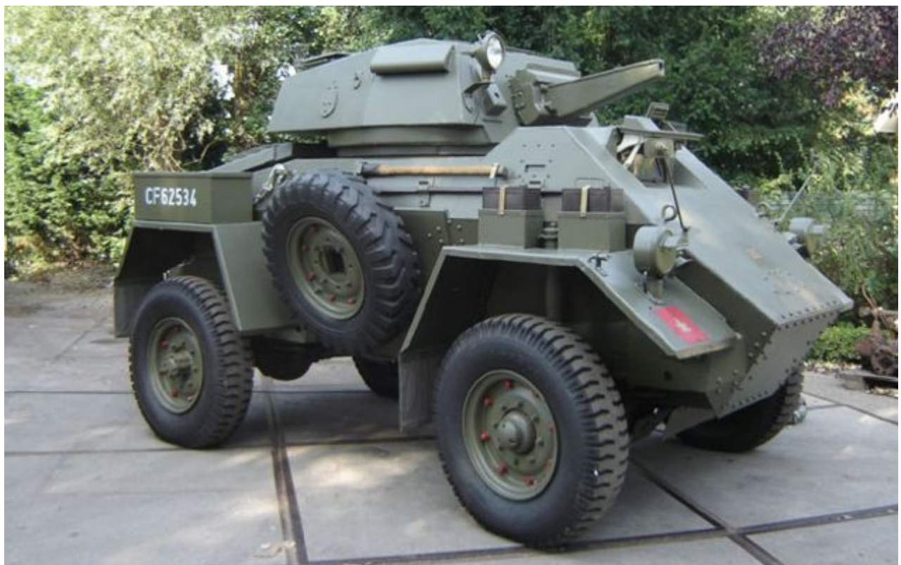
Fox Armoured Car – Rod and Rex Cadman Collection (UK)

http://212.79.246.244/5800/home.nsf/specials_restoration?openagent&id=c