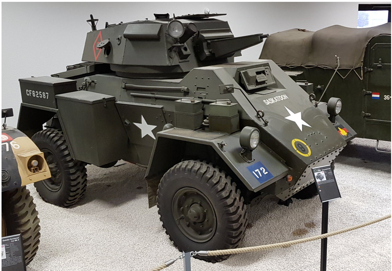
Pierre-Olivier Buan, December 2018

CF 62283. This Fox was used at Camp Borden as a training vehicle (Paul Visser). It was recovered with 2 other Fox Armoured Cars from a wrecking yard in Ontario, Canada, where they sat for nearly 40 years (Bruce Parker)