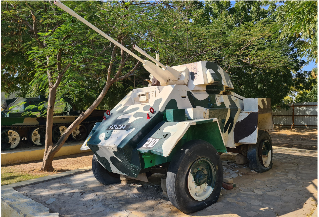
Pierre-Olivier Buan, January 2025