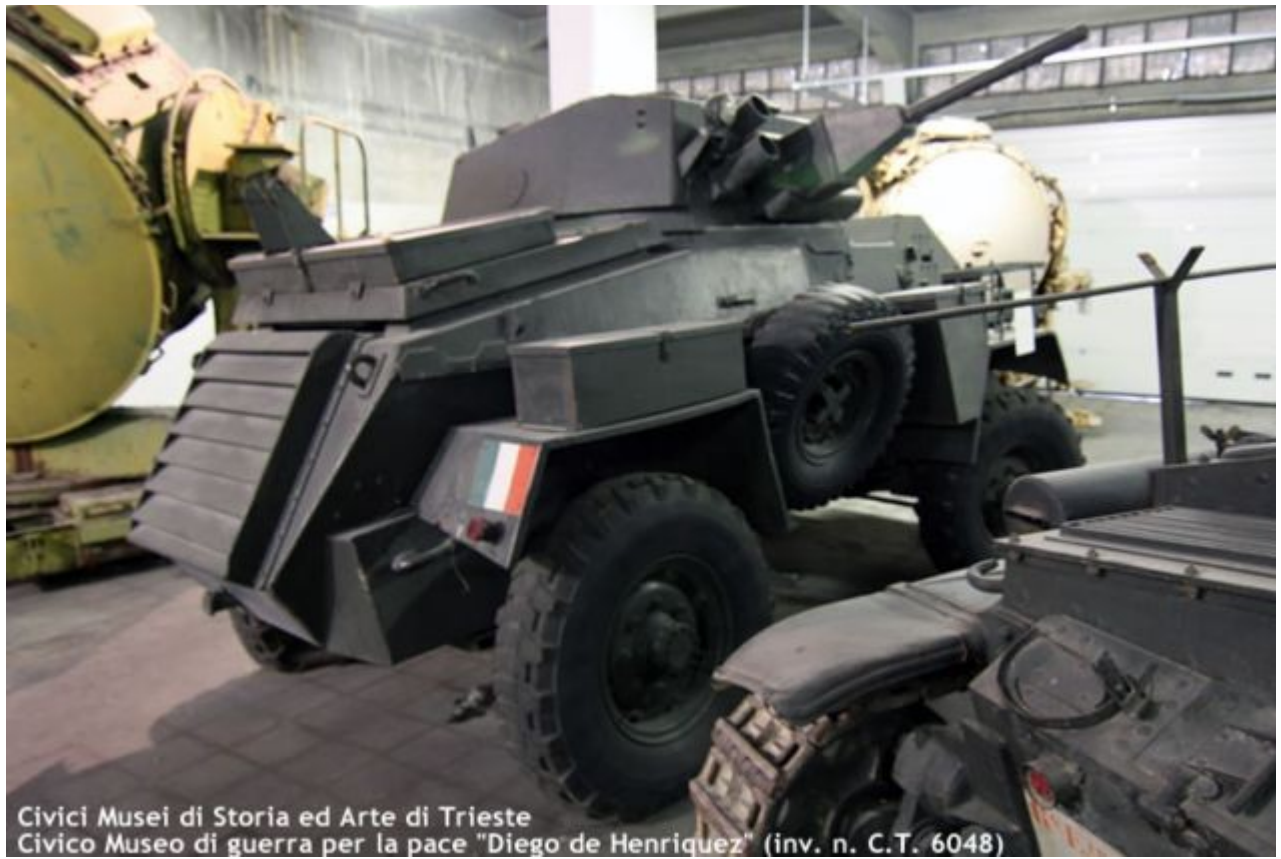
Humber Armoured Car – Museo di guerra per la pace Diego de Henriquez, Trieste (Italy)