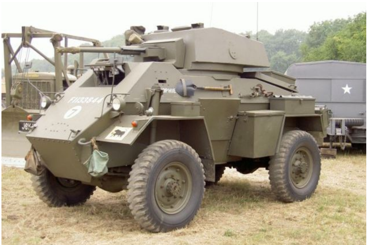
Humber Armoured Car – Private collection (UK)

Dennis Trowbridge, July 2005 - http://www.warwheels.net/Humber4TROWBRIDGE.html