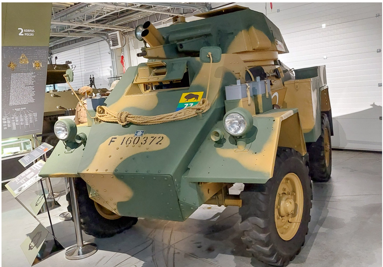
Fox Armoured Car – Museu Militar de Elvas (Portugal) Formerly displayed at the Portuguese Army Cavalry School Museum, Santarém (Portugal)

https://www.facebook.com/photo?fbid=3688303274726452&set=pcb.1405410626705725