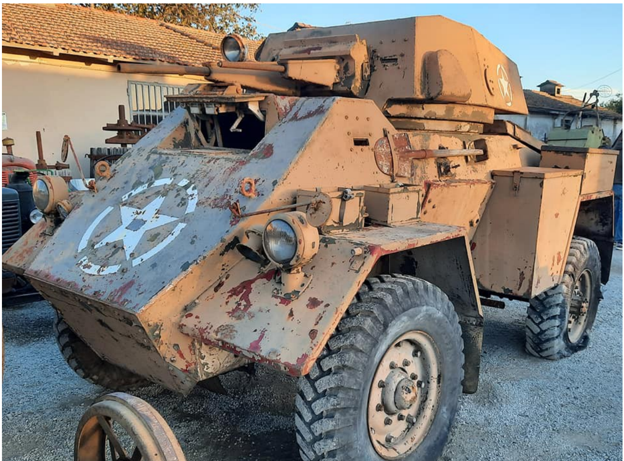
Fox Armoured Car – Museo delle Forze Armate 1914-1945, Montecchio-Maggiore (Italy)

https://www.google.com/maps/place/Museo+delle+Forze+Armate+1914-1945/