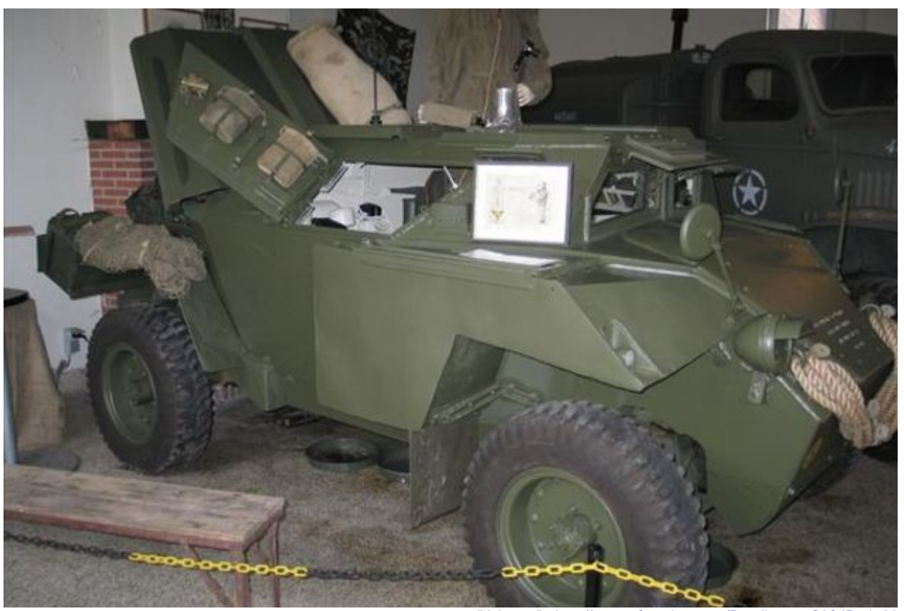
"tichenor" - http://www.afvregister.org/Details.aspx?AfvID=4726