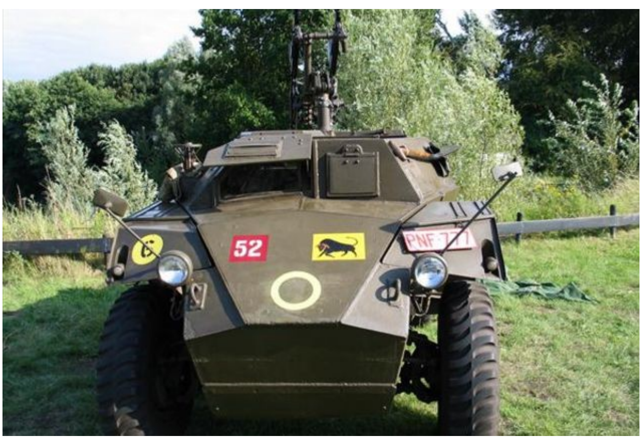
"tichenor" - http://www.afvregister.org/pres.aspx