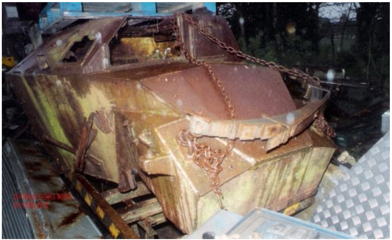
George Moore - http://www.warwheels.net/humberscoutGMOORE.html