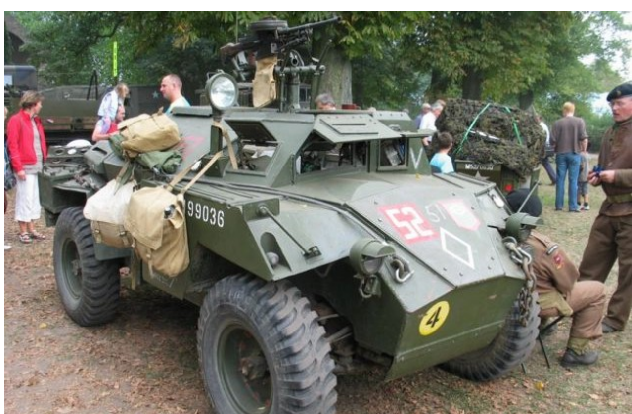
"vyvyanbasterd", September 2009 - http://picasaweb.google.com/vyvyanbasterd/LiberationOfNijmegenRemembrance#