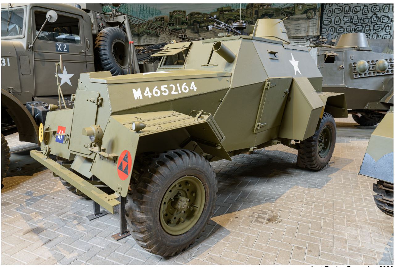
Axel Recke, December 2020