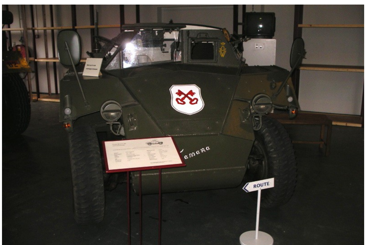
"Olaf", December 2007