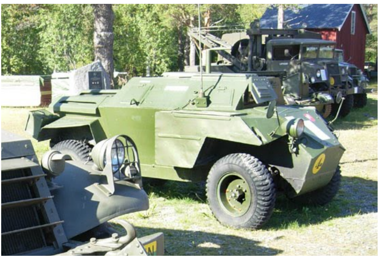
Lars Gyllenhaal, September 2010 - http://larsgyllenhaal.blogspot.com/2010_09_01_archive.html