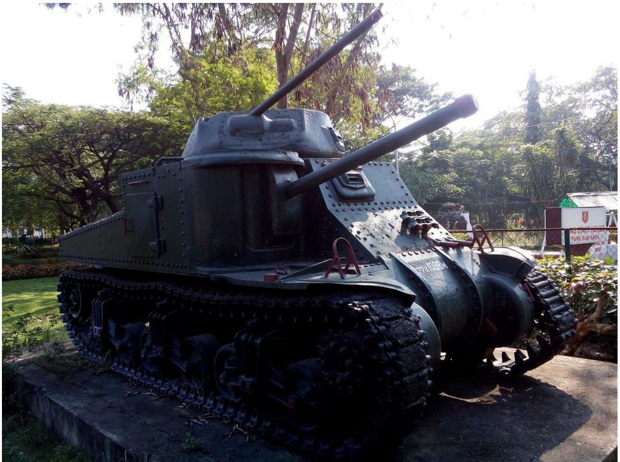
"272hiteshs", December 2013 - https://www.tripadvisor.in/