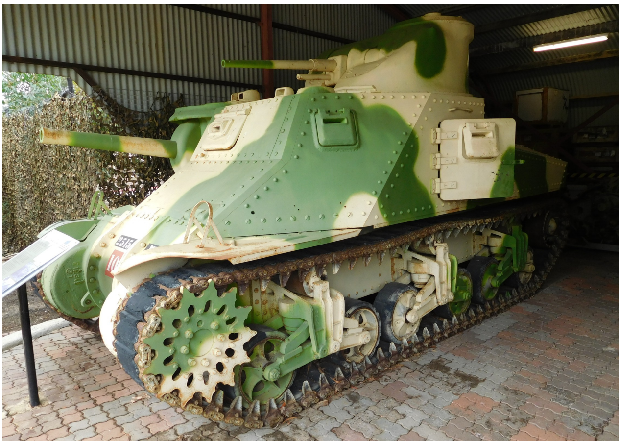
M3 Lee – Armoured Corps Museum, Ahmednagar, Maharashtra (India)