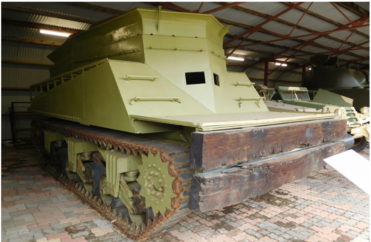
"Bukvoed", January 2007 - http://en.wikipedia.org/wiki/Image:Puckapunyal-M3-BARV-2.jpg