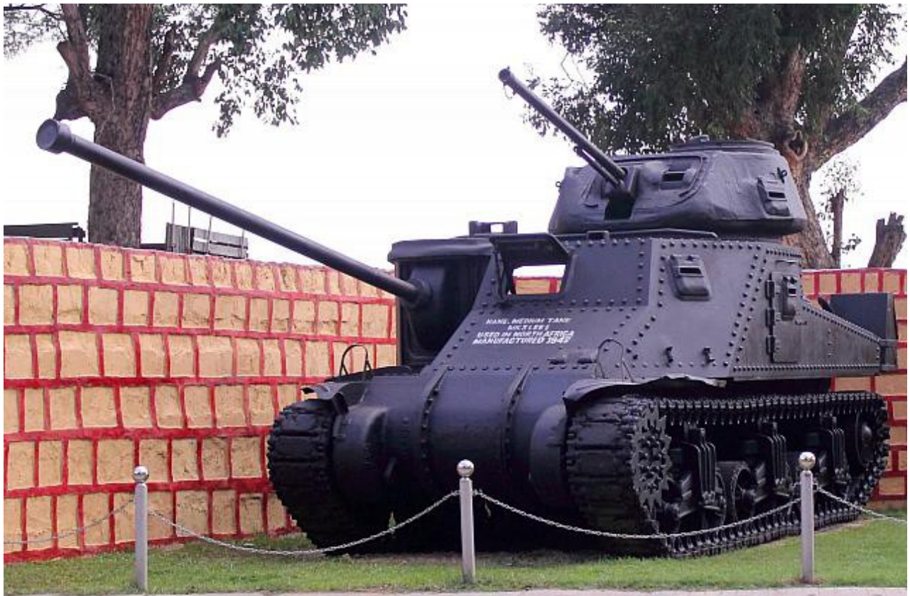
Bala Vignesh - http://www.warbirds.in/galleries/wr/Karnataka/Bangalore/Ulsoor