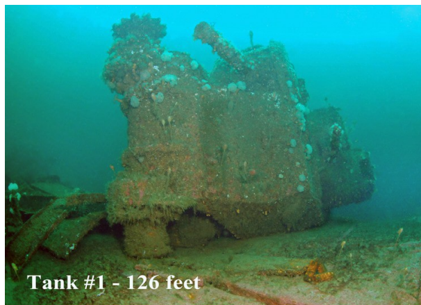
Tank #1 - 126 feet