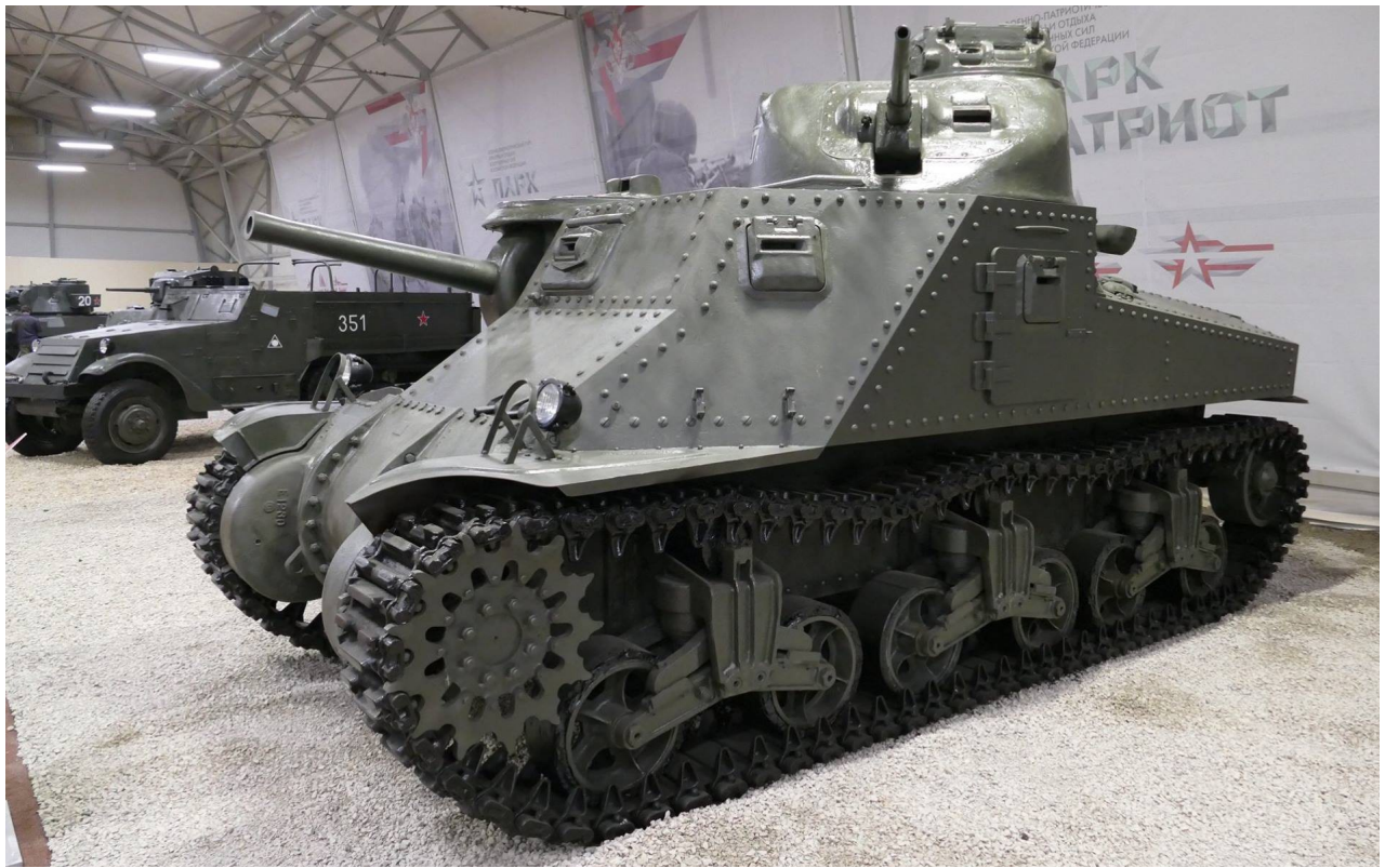
Yuri Pasholok, September 2016 - https://www.facebook.com/