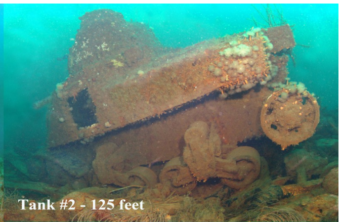
Tank #2 - 125 feet