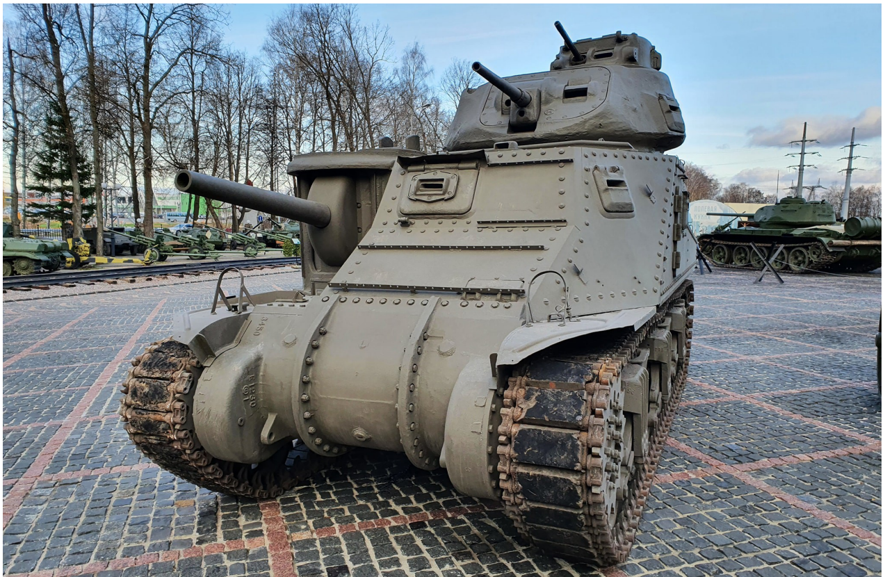
Yuri Pasholok, November 2020