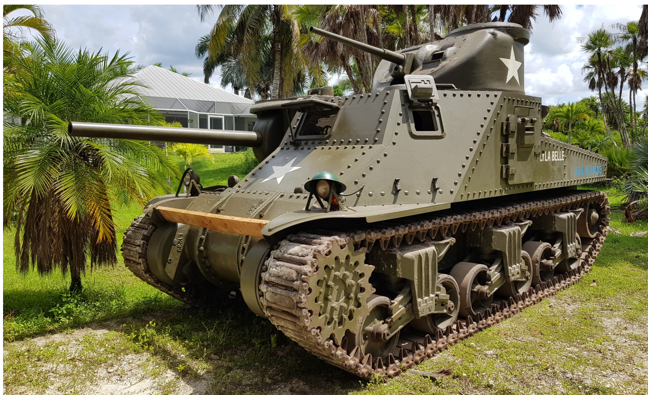
Pierre-Olivier Buan, September 2019