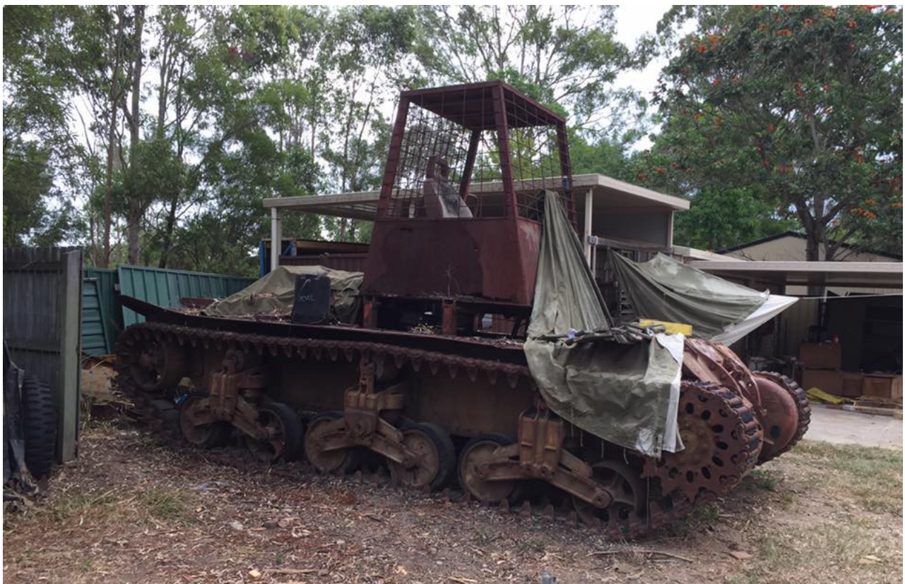
M3 Grant hull – Private collection, Western Australia (Australia) – running condition WD No T-24676; built by Pullman Standard in July, 1942. It is being restored

https://www.facebook.com/photo.php?fbid=1390304131041267&set=pcb.740854052750780&type=3&theater