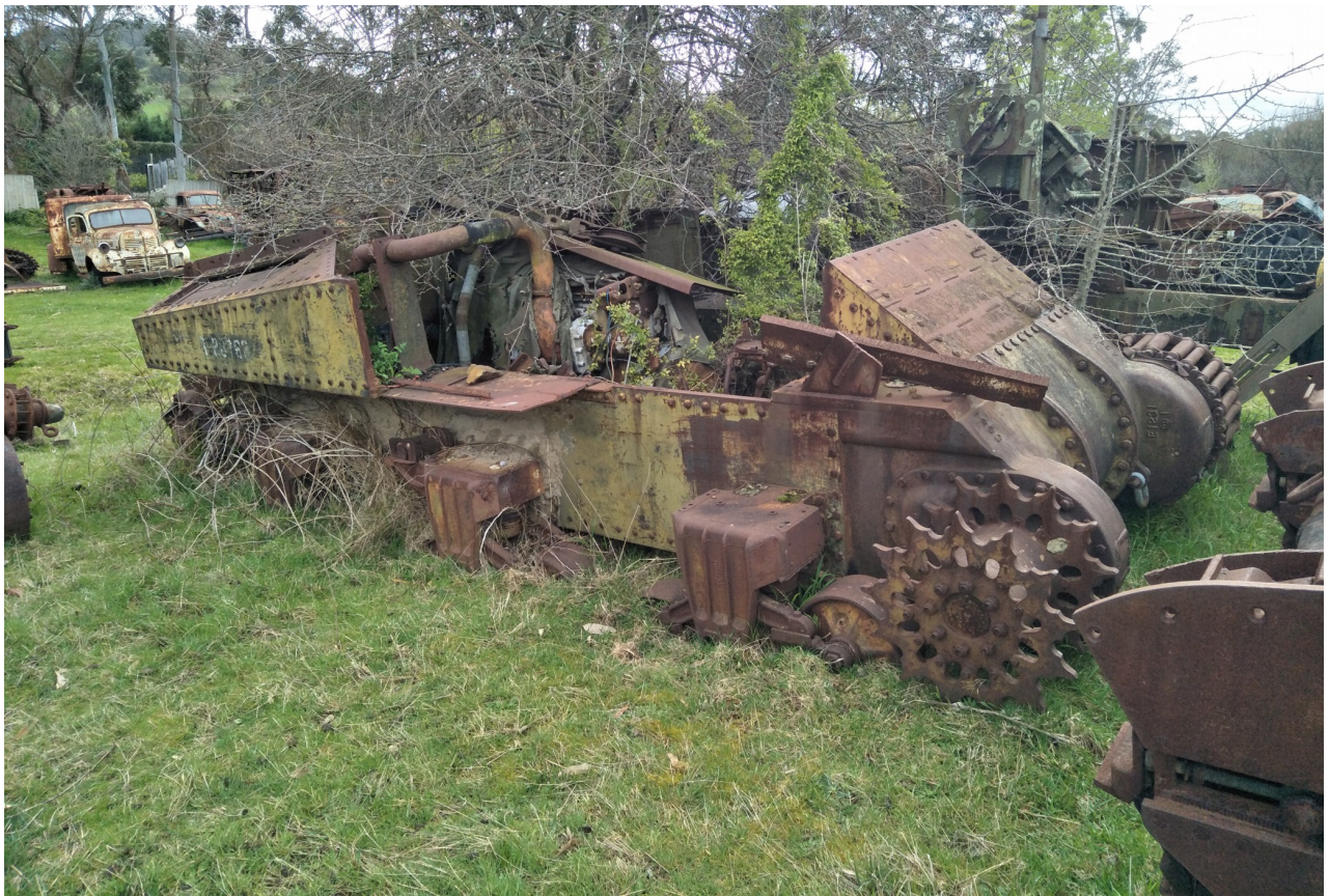
"Luke", September 2018