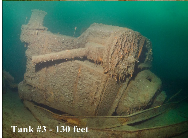
Tank #3 - 130 feet