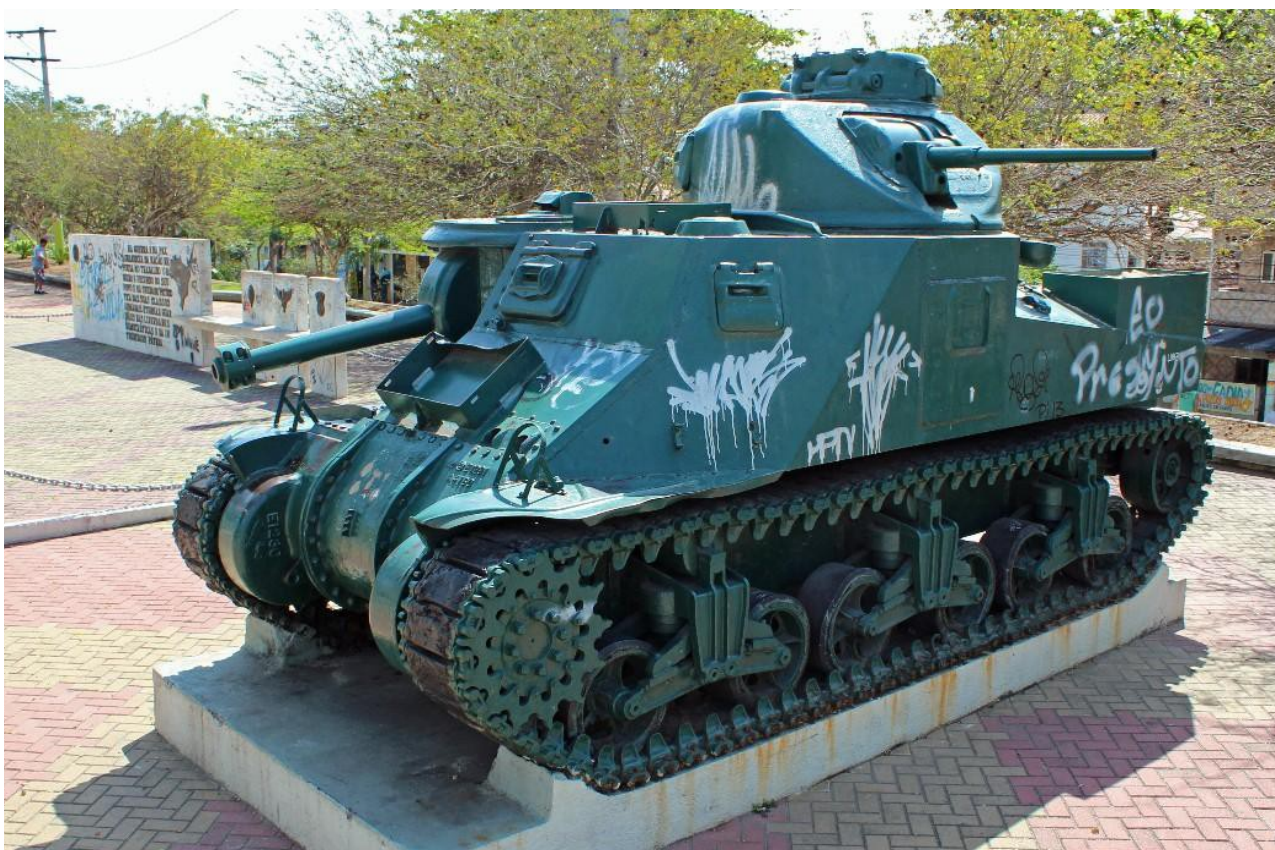
M3A3 Lee – 13º Regimento de Cavalaria Mecanizado, Pirassununga (Brazil) Serial Number 1280, built by Baldwin in August, 1942 (Colonel Rocha)

Trevor Larkum, September 2011 - http://preservedtanks.com/Profile.aspx?UniqueID=1788