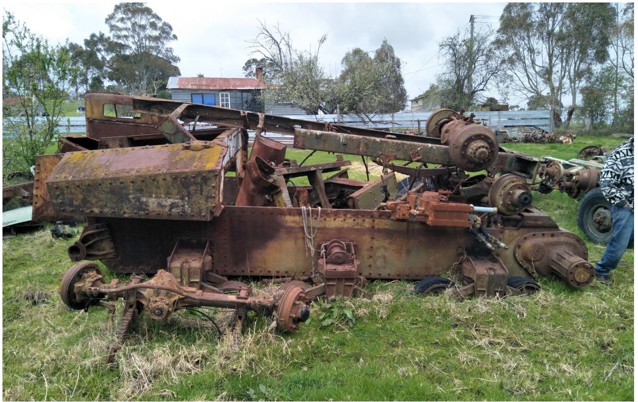
"Luke", September 2018