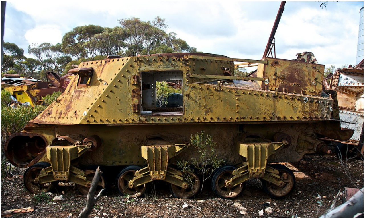
Fourth M3A5 Grant hull – Murrayville, VIC (Australia)

Dirk Spennemann, July 2009 - http://www.flickr.com/photos/heritagefutures/3782416295/in/set-72157621801985831/