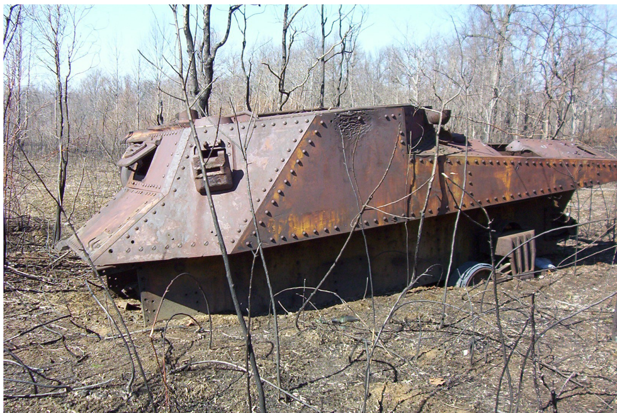
M3 Lee hull – Private collection, somewhere in Western Victoria (Australia) Serial Number 3426, built by Chrysler in April, 1942

http://www.oldcmp.net/Cav_Grants.html#Anchor-47857