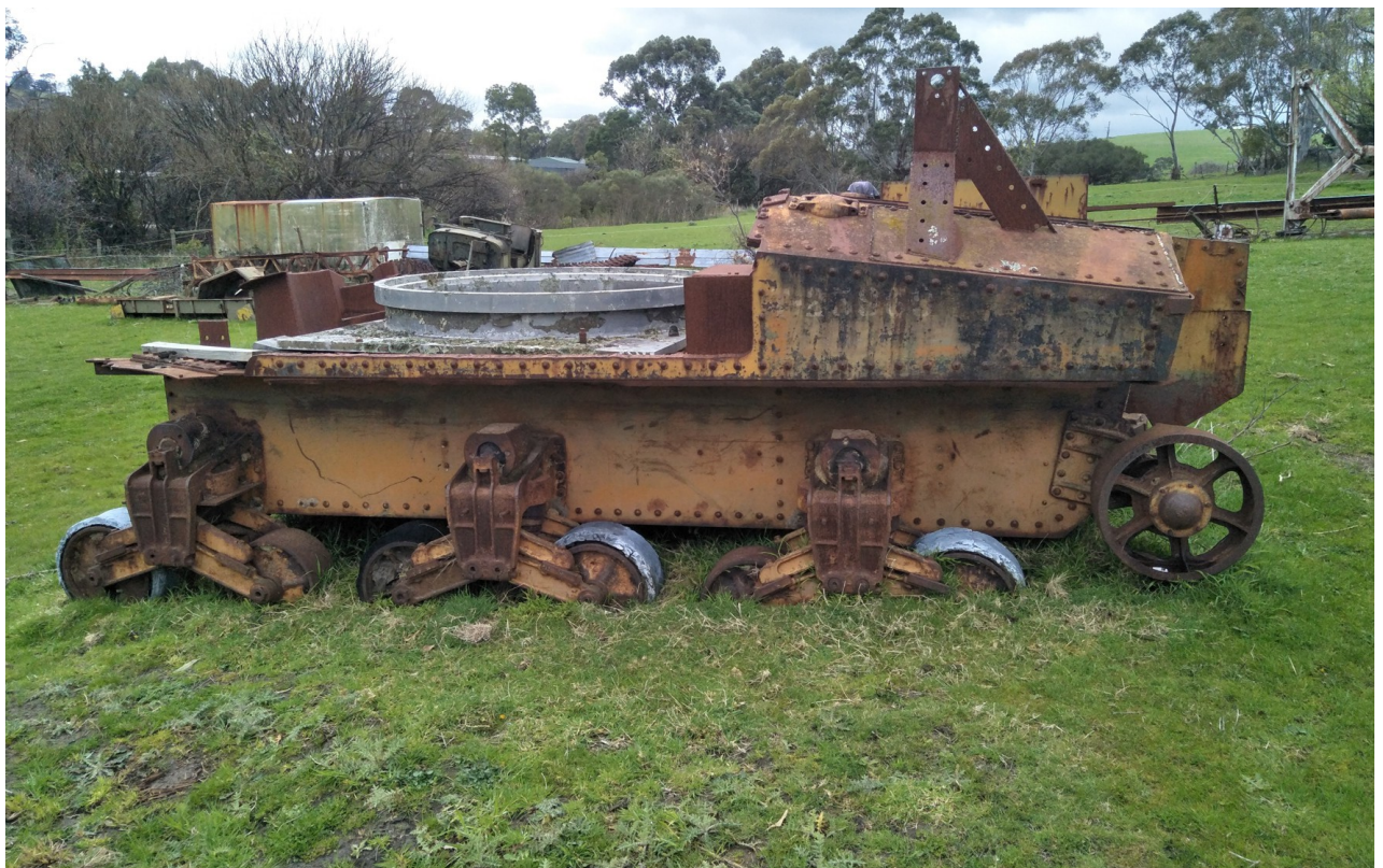
"Luke", September 2018