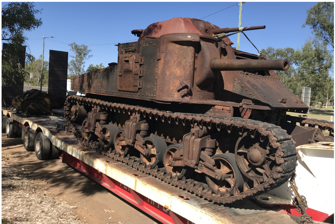
M3 Grant hull – Somewhere in Western Australia Modified to be used as an agricultural tractor

https://www.facebook.com/profile.php?id=100057211136572