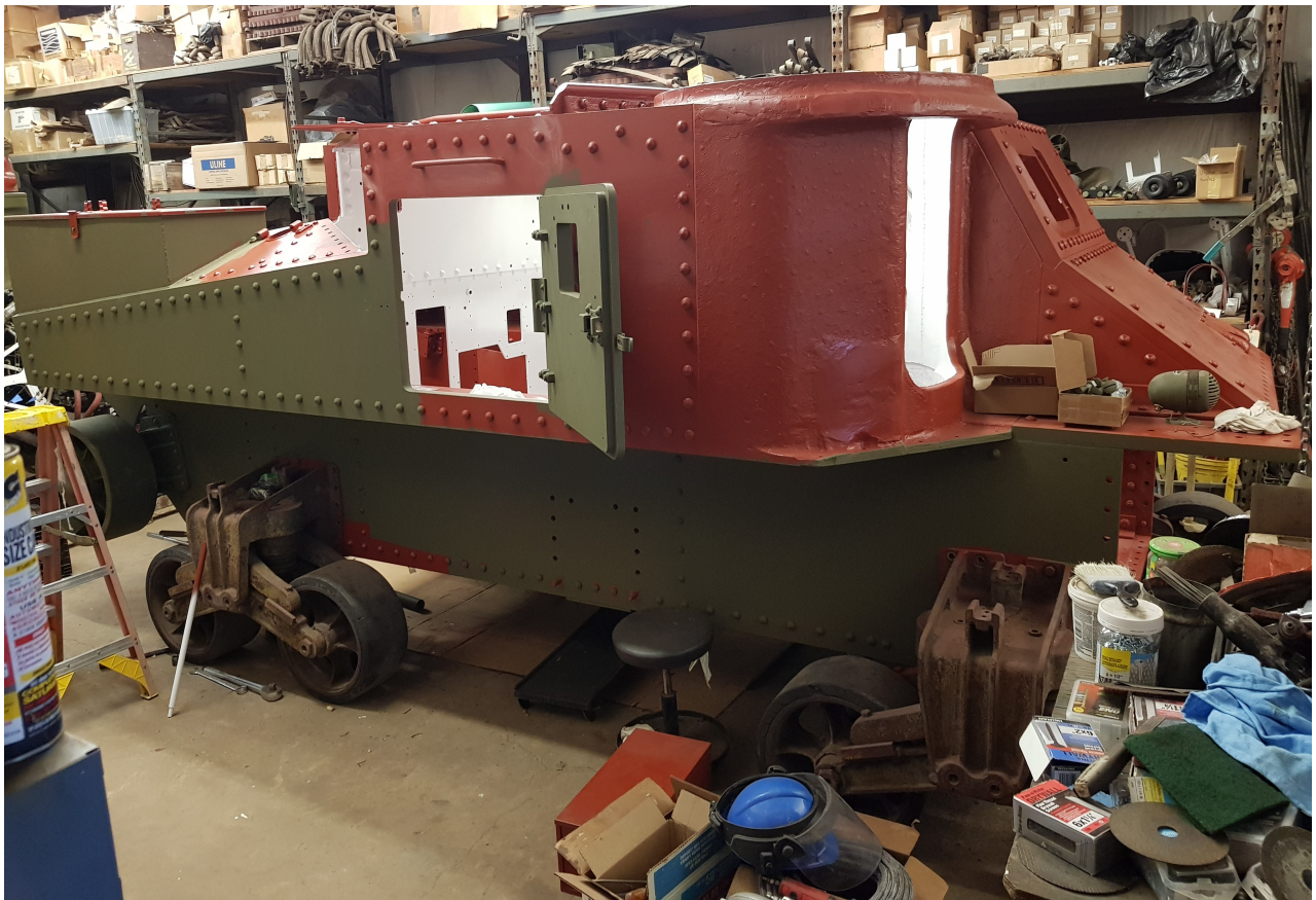
Pierre-Olivier Buan, September 2023