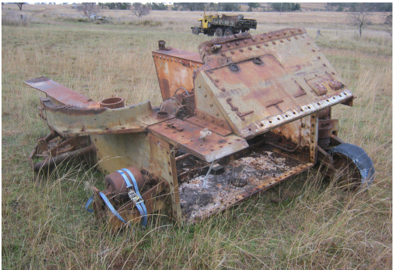
M3 Lee/Grant hull – Private collection, NSW (Australia)

https://www.facebook.com/writerightmedia/photos/pcb.1863224257237179/1863223883903883/?type=3