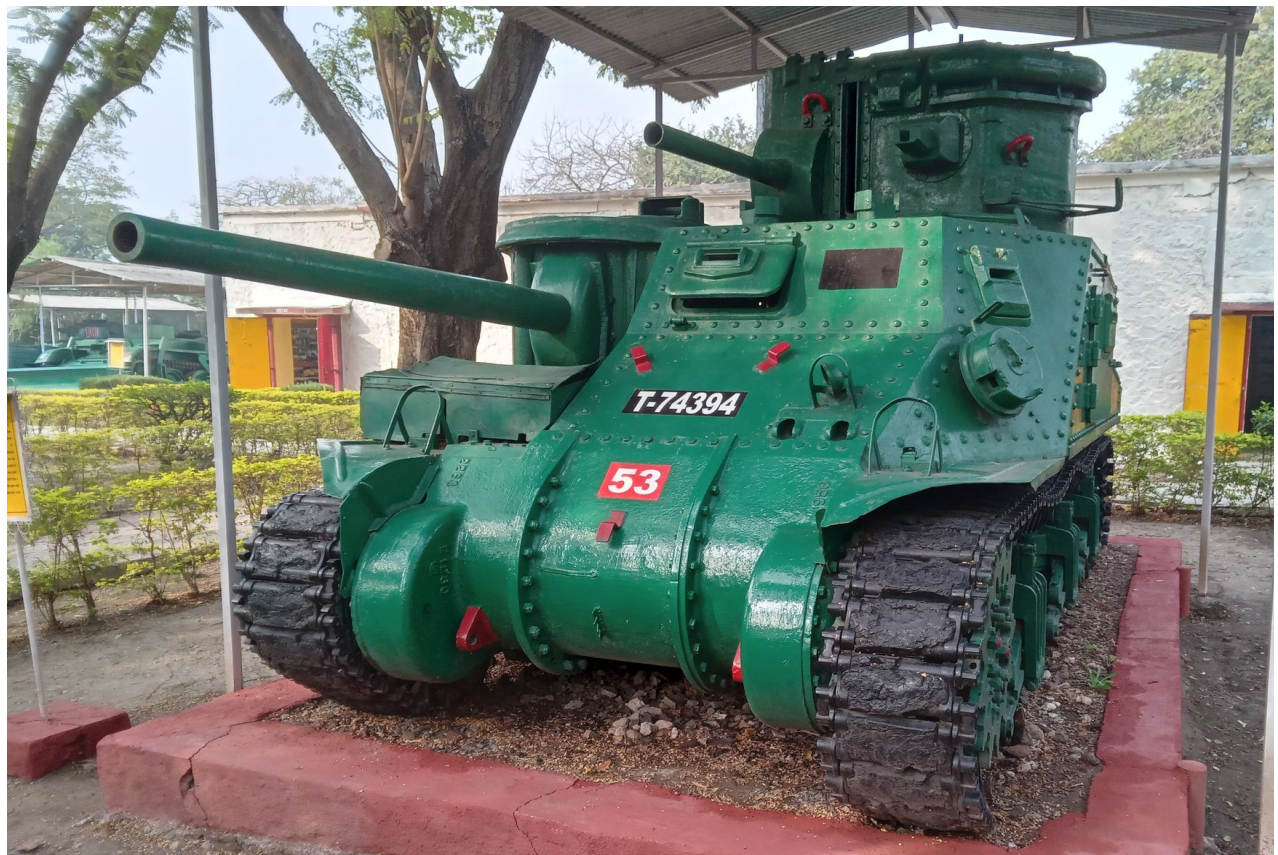
M3A5 Lee – Escola de Material Bélico (EsMB), Vila Militar, Rio de Janeiro (Brazil)

CVMARJ, October 2010 - https://picasaweb.google.com/CVMARJ/DIADOQUADRODEMATERIALBELICO#5533824939743404674