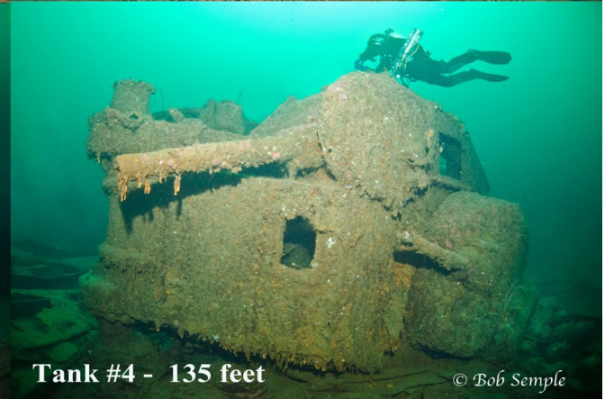
Tank #4 - 135 feet