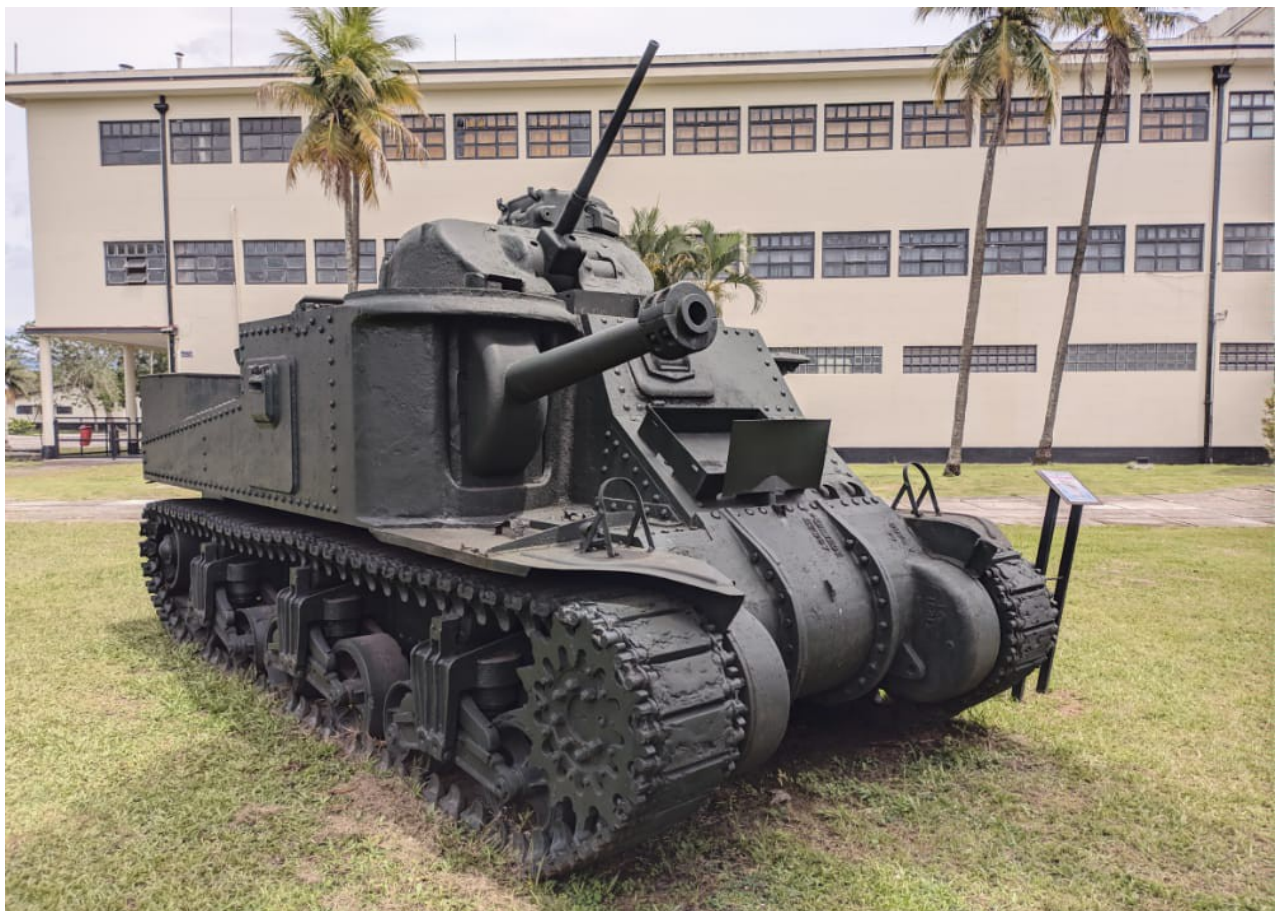
M3A5 Lee – Canhão Square, Juiz De Fora (Brazil)

https://tribunademinas.com.br/noticias/cidade/18-10-2017/carro-de-combate-da-praca-do-canhao-e-revitalizado.html