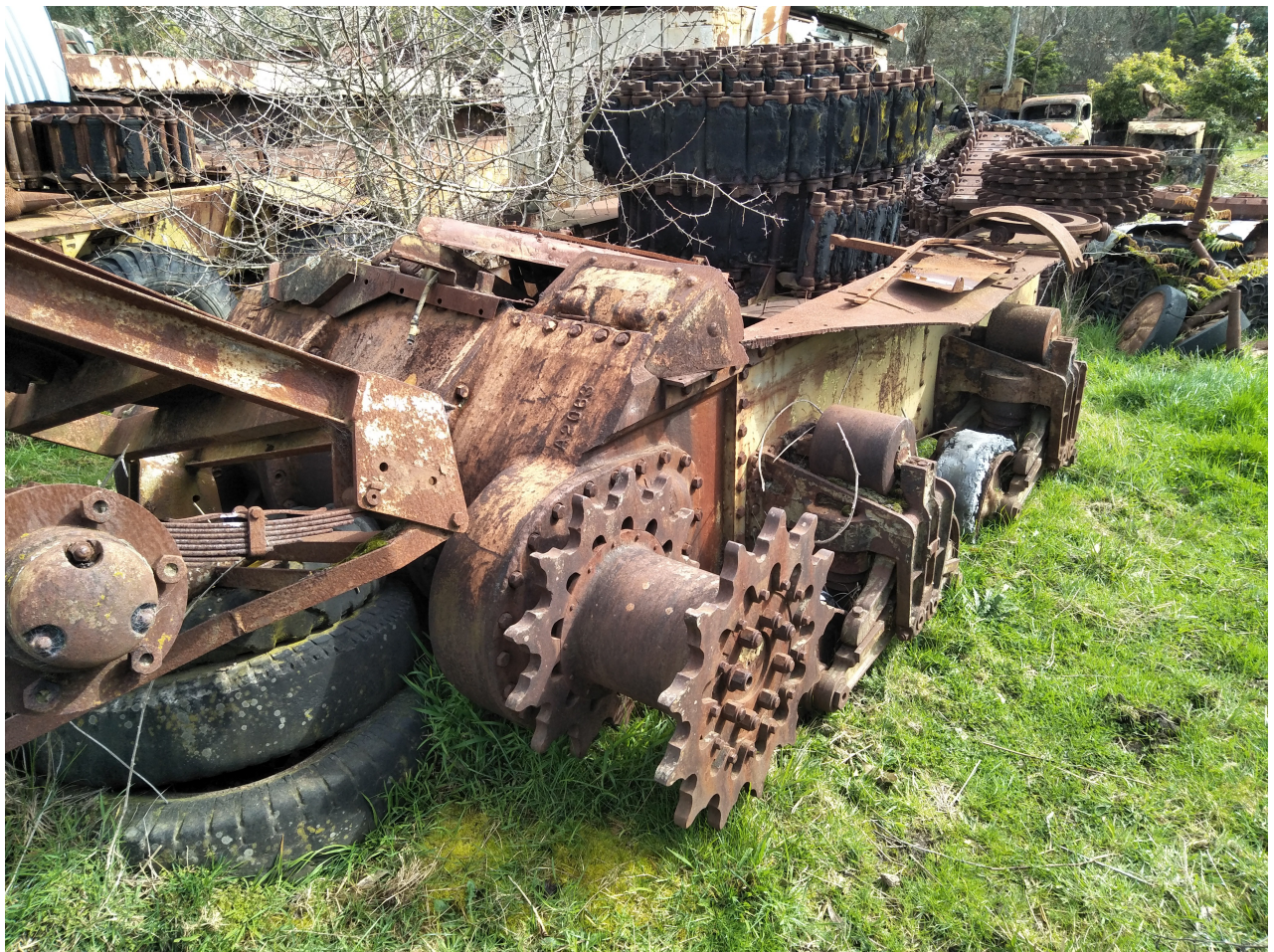
"Luke", September 2018