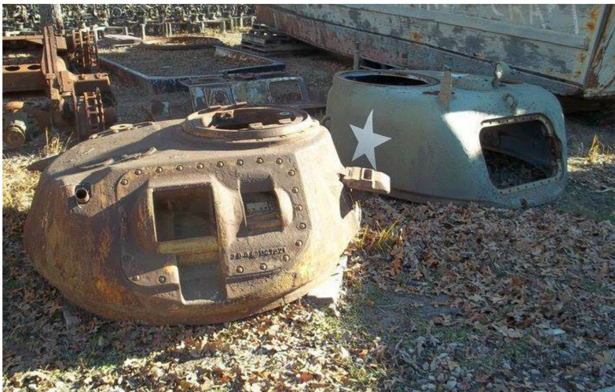
M3 Grant turret – Private collection, Western Australia (Australia)

http://www.com-central.net/index.php?name=Forums&file=viewtopic&t=5337&postdays=0&postorder=asc&start=585