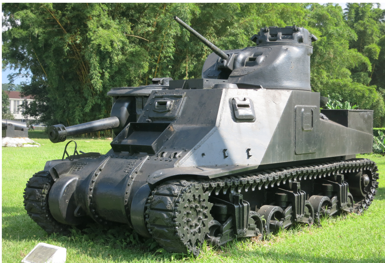
M3A3 Lee – Museu Militar Conde de Linhares, Rio de Janeiro (Brazil)

Trevor Larkum, September 2011 - http://preservedtanks.com/Profile.aspx?UniqueID=1733