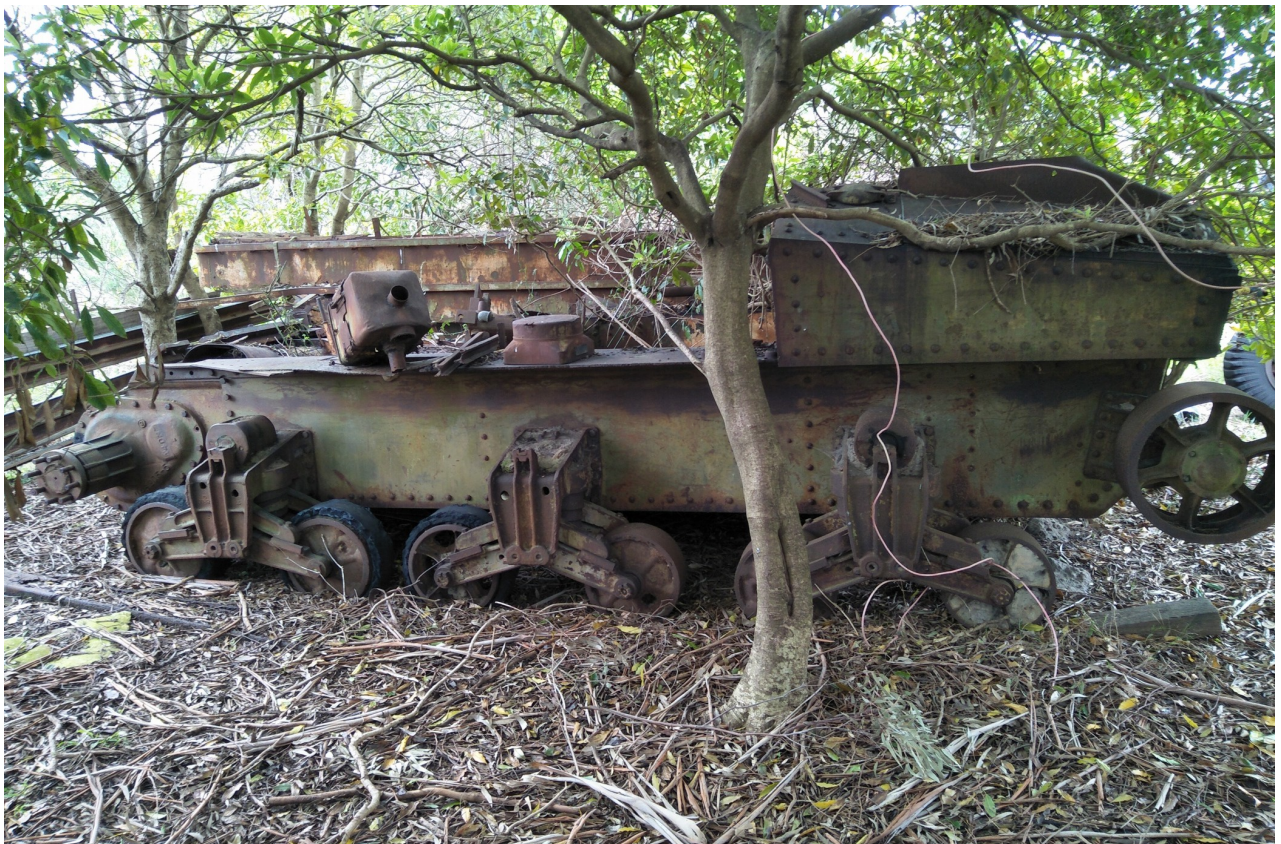
"Luke", September 2018