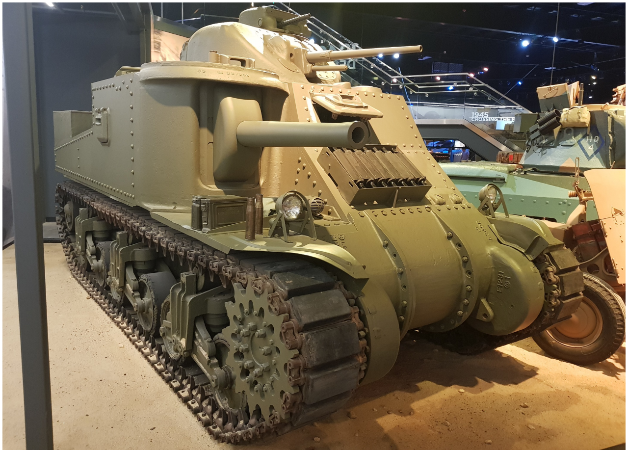
Pierre-Olivier Buan, September 2019