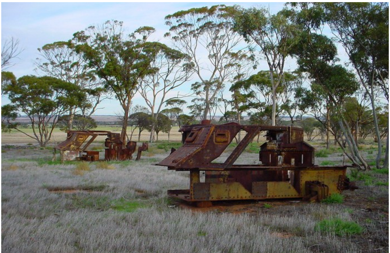
"Rod Diery", June 2006 - http://www.mapleleafup.org/forums/showthread.php?t=6407