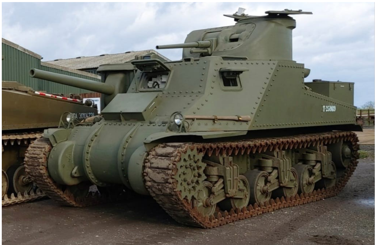
Armourgeddon, May 2021 - https://www.facebook.com/1911284422489817/posts/2942260399392209/