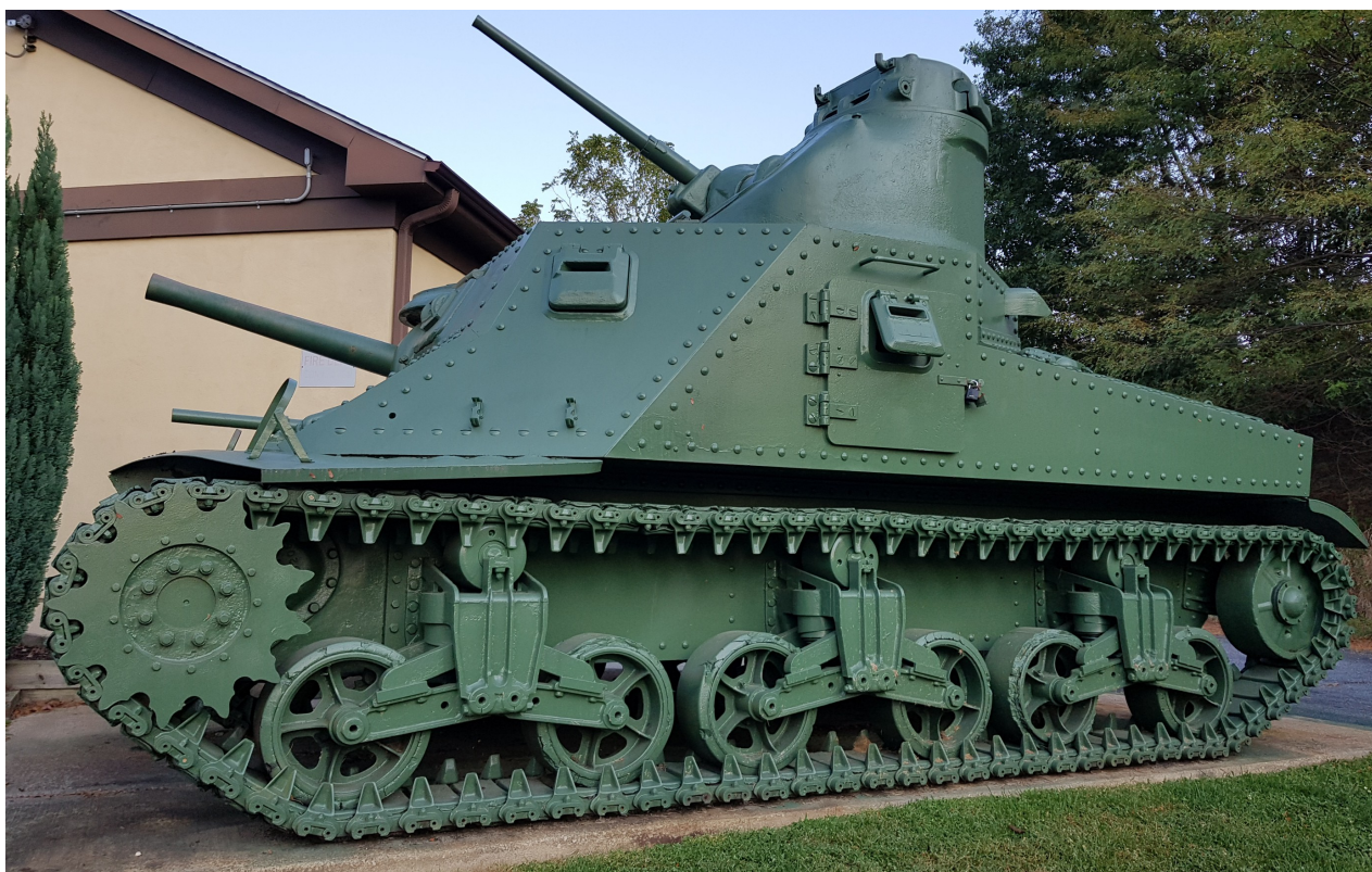
Pierre-Olivier Buan, September 2019