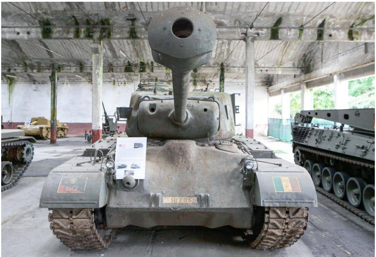
La Stampa, 2018 - https://www.lastampa.it/