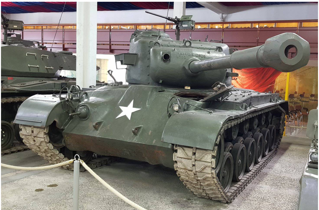
Pierre-Olivier Buan, March 2019

This M26 Pershing was previously displayed in the Army Museum in Brussels, but it is currently being cosmetically restored. Once the restoration is finished, it will go back to Brussels