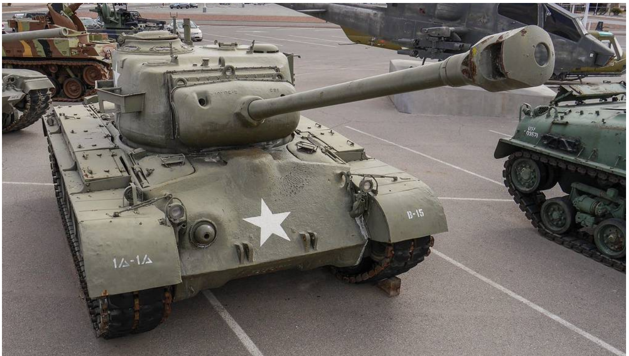
M26 Pershing – 1st Cavalry Division Parade Field, Fort Hood, TX (USA) Serial Number 1983 (USA AFVs register)