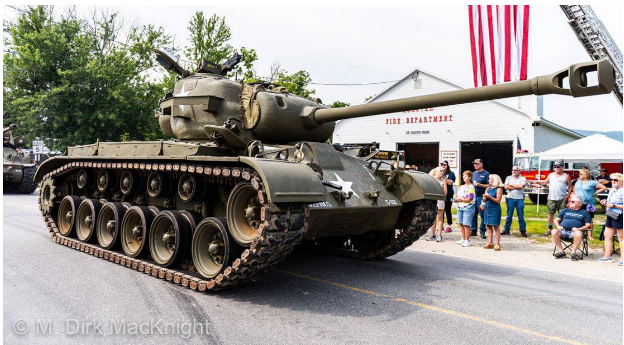
M26 Pershing – Museum of military equipment "Battle Glory of the Urals", Verkhnyaya Pyshma, Sverdlovsk Oblast (Russia)

Vitaly Kushmin, April 2020 - https://www.facebook.com/media/set/?set=a.2609824352477954&type=3