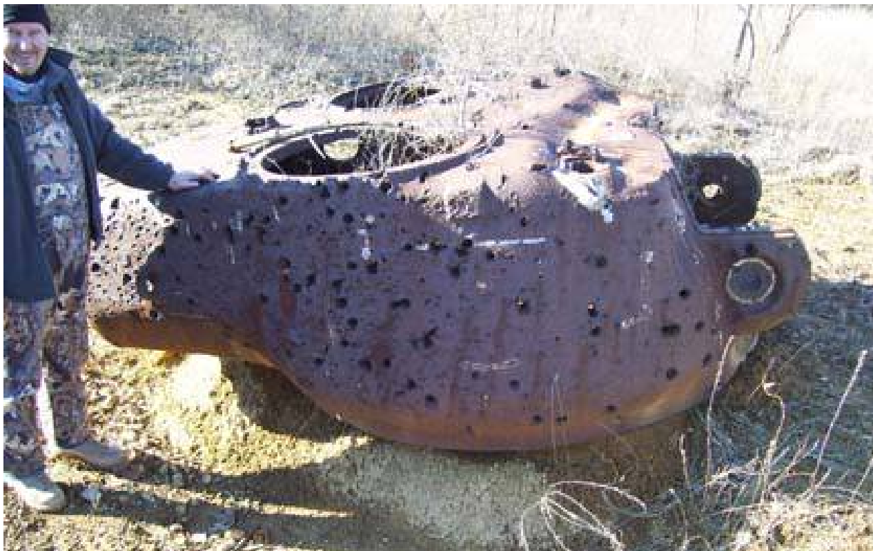
Garry Redmon, February 2013 - http://armorfortheages.com/GGPM/Volunteers/RangeSearch/RangeSearchProjectPage03.htm