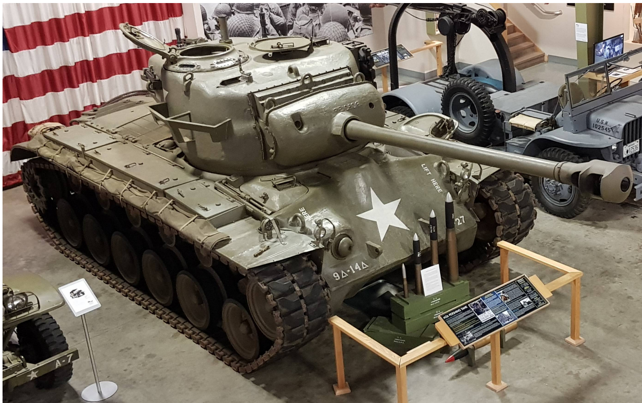
Pierre-Olivier Buan, September 2019