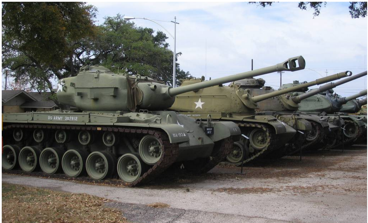
M26 Pershing – House of Tanks Museum, Wichita, KS (USA)