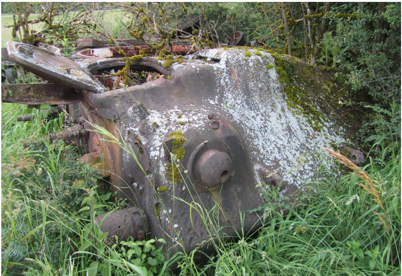
M26 Pershing wreck – Panzerfarm, Kęszycki Brothers Collection (Poland)

http://panzer-farm.pl/en/museum/collection/