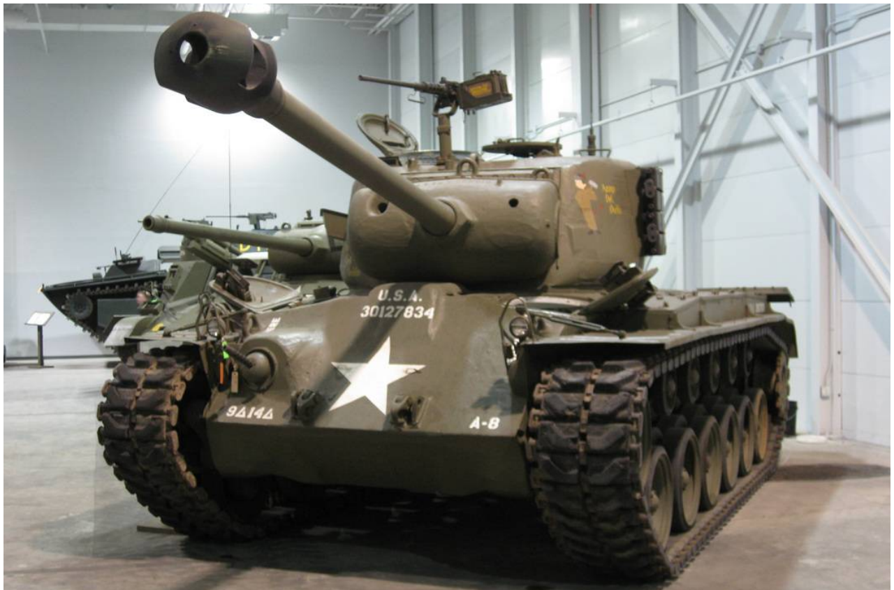
M26 Pershing – 3-7 Cavalry Headquarters, Fort Stewart, GA (USA) Serial Number 974 (USA AFVs register)

http://www.instmiltech.com/hall-of-armor.html