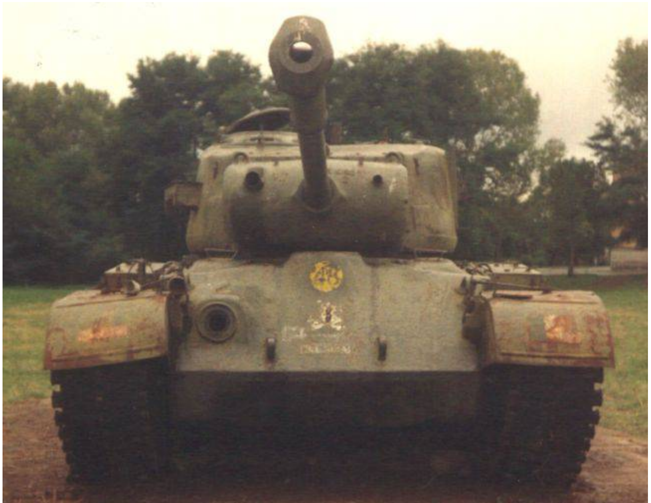
Filippo Cappellano, 1995 - http://digilander.libero.it/pmg/contributi/censimento/m26_cesano.htm