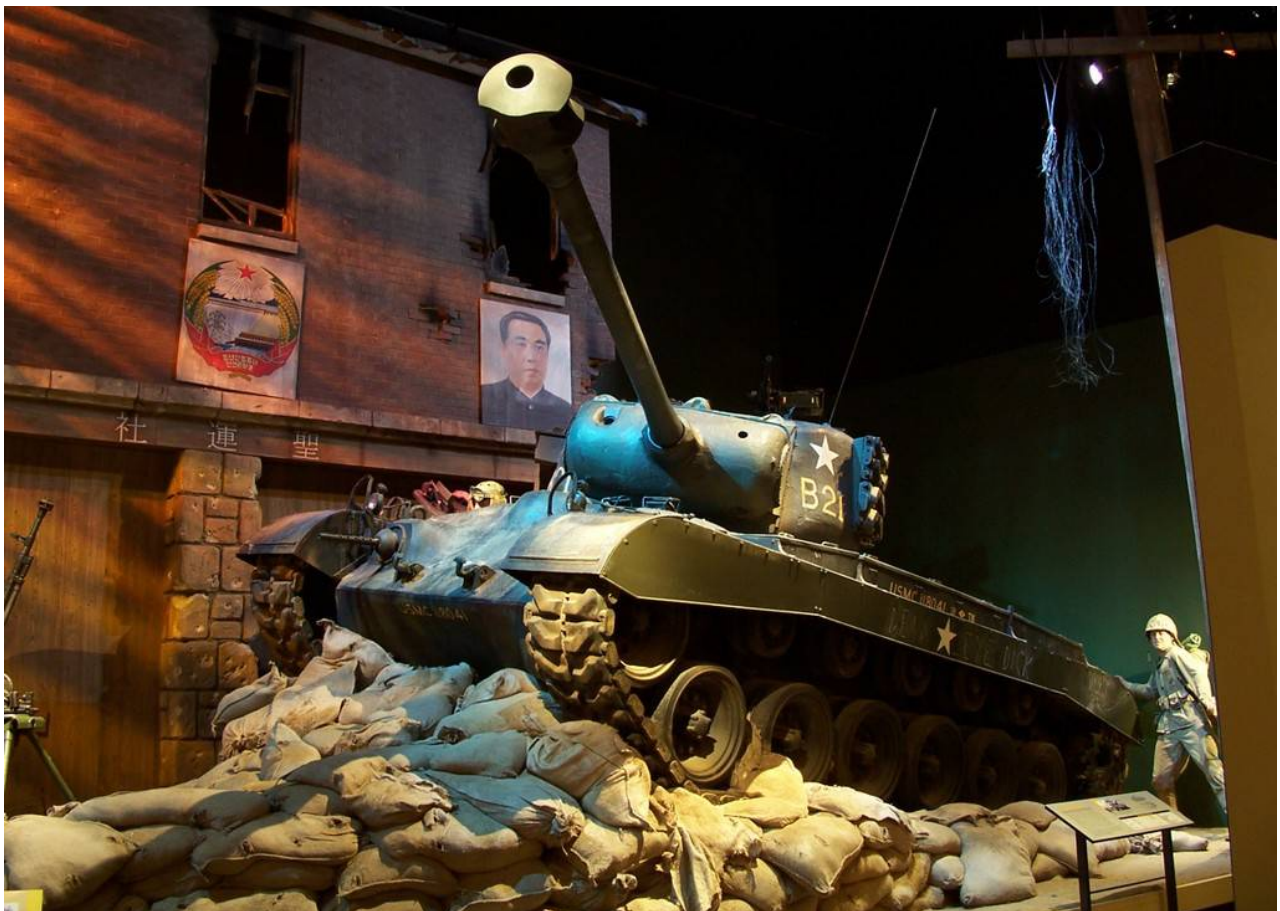
M26 Pershing – Military Technology Museum of New Jersey, Wall Township, NJ (USA) Formerly owned by the National Guard Militia Museum of New Jersey, Sea Girt, NJ (USA)

https://www.reddit.com/r/TankPorn/comments/nez5o0/i_love_my_job_m26_pershing/