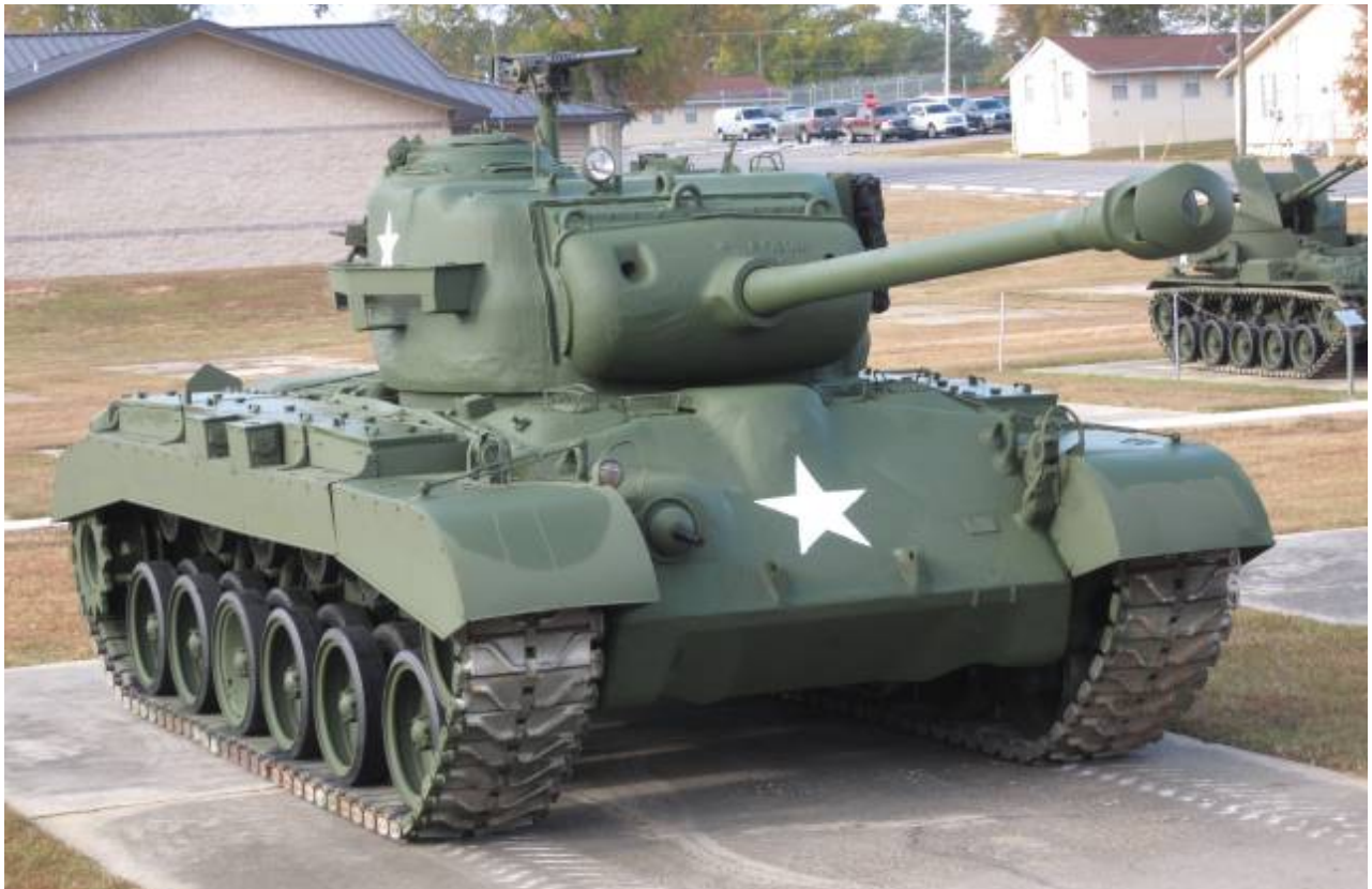
Mississippi Armed Forces Museum, November 2012