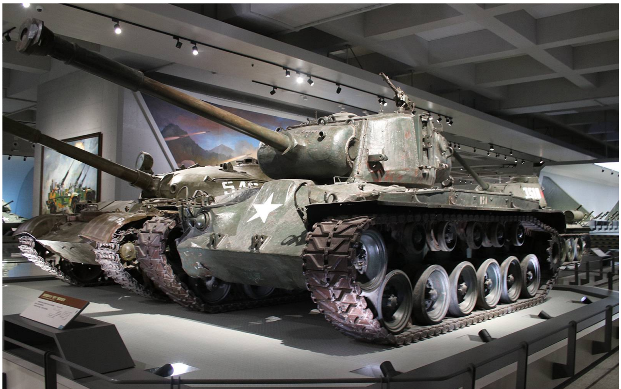
"NTG842", September 2019 - https://www.flickr.com/photos/52287882@N05/albums/7215771111401636/page2/