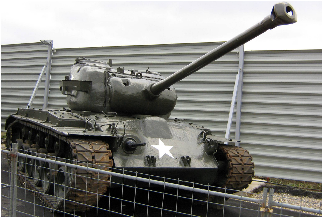
February 2007 - http://news.webshots.com/album/557416413xGpCqt?start=72