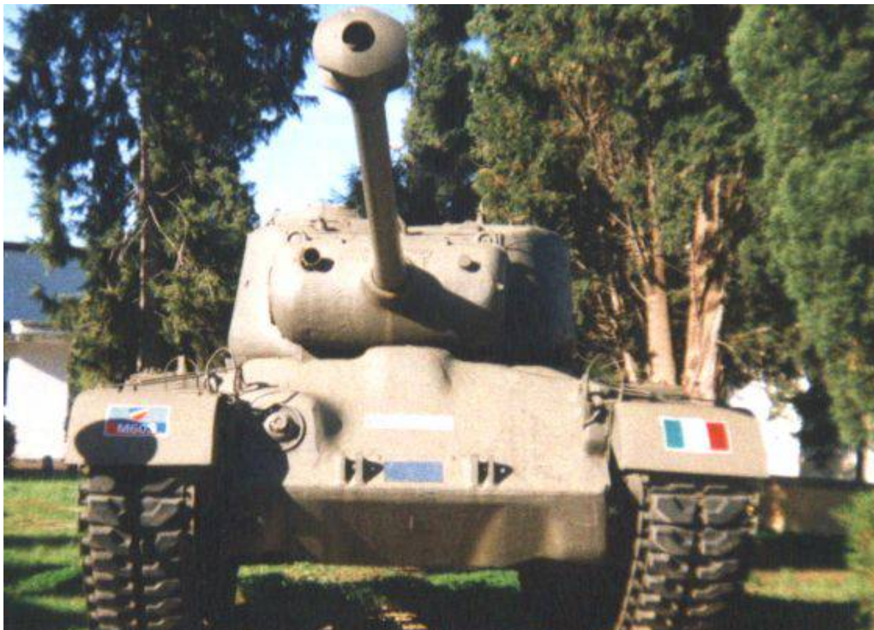
M26 Pershing – Caserma "Tagliamento", Arzene (Italy)

Philippo Cappellano - http://digilander.libero.it/pmg/contributi/censimento/m26_lecce.htm