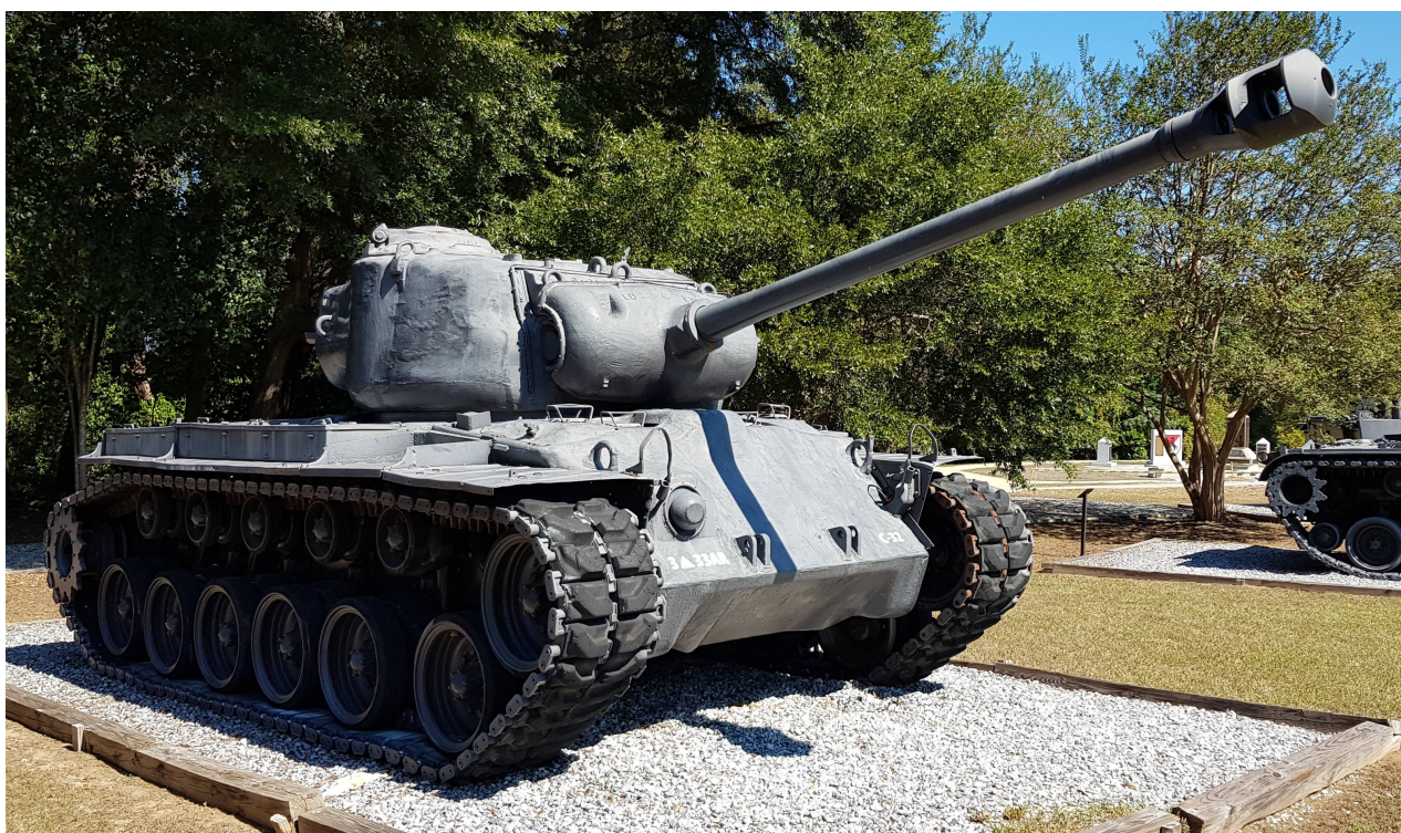
M26 Pershing – NCO Academy, Fort Jackson, SC (USA) Serial Number 1517 (USA AFVs register)

Pierre-Olivier Buan, September 2018 - https://www.flickr.com/photos/13963542@N08/sets/72157672573769297