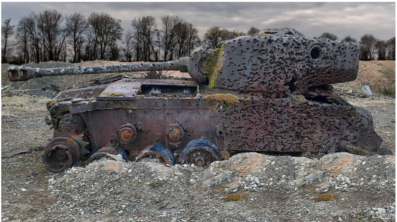
M26 Pershing wreck – Garnisongeschiede Jüterbog, Sankt Barbara (Germany)

https://www.facebook.com/103397456456403/posts/4796055747190527