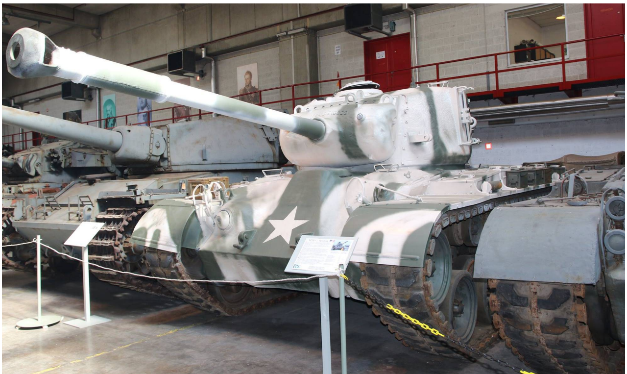
Gunfire Museum Brasschaat, October 2017

M26A1 Pershing – Grafenwöhr Training Area, Grafenwöhr (Germany) Serial Number 394. Located at Camp Normandy, Grafenwoehr. Registration No. 30127140. It was reported to have been in Baumholder before coming there (Michael Lembo)