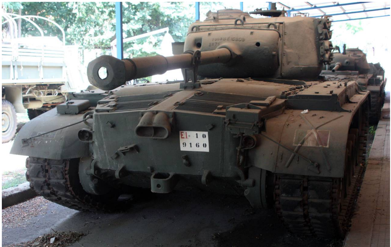
Massimo Foti, July 2009

Serial Number 711, built by Fisher in May, 1945. USA 30127457. This tank has been transferred from the Replacement Training Center to the Armored School at Ft Knox in Sept, 1945. It has then been listed in the Army Ground Forces Bd 2 (test tank) inventory at Yuma PG in July 1947. It has then been given or sold to France, still having remains of French markings on it nowadays. It ended up on a fire range in Germany at an unknown date