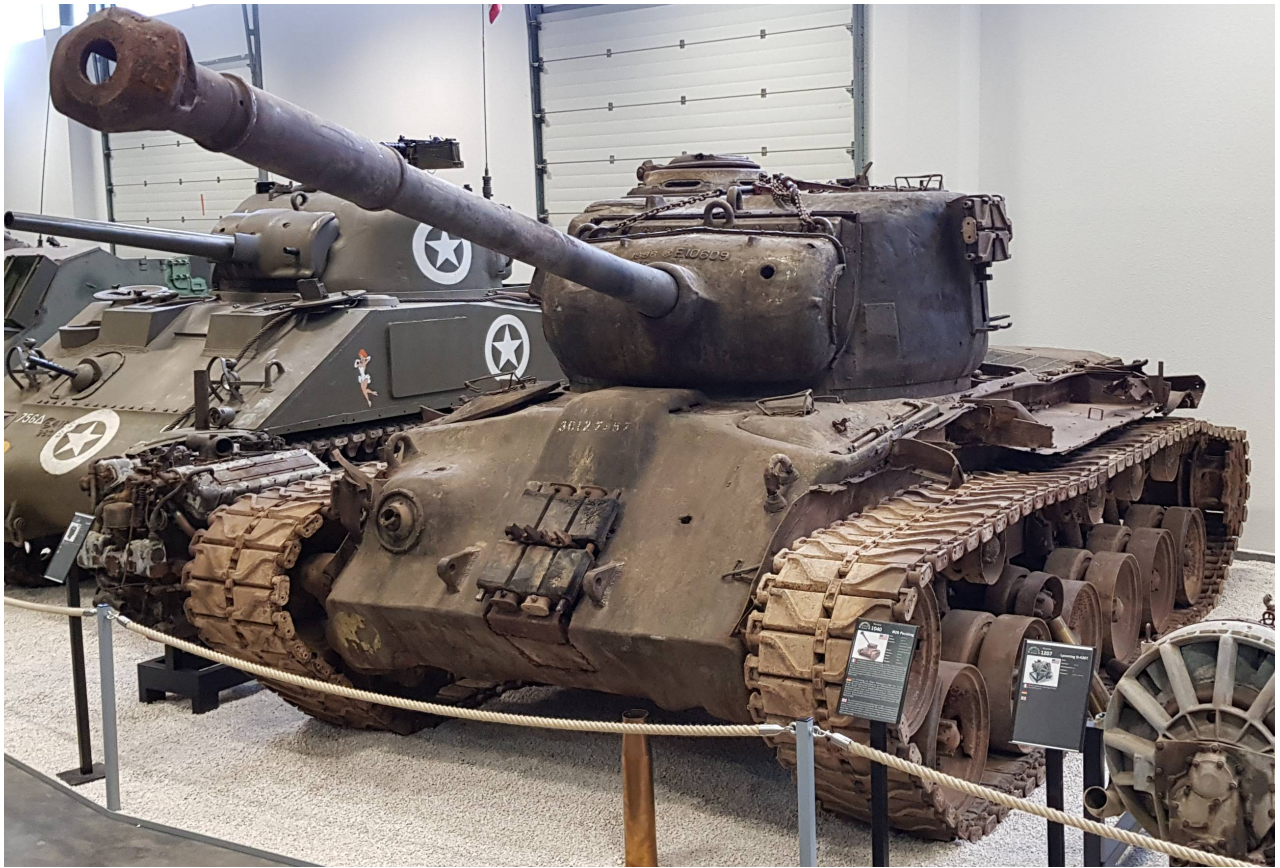
Pierre-Olivier Buan, December 2018