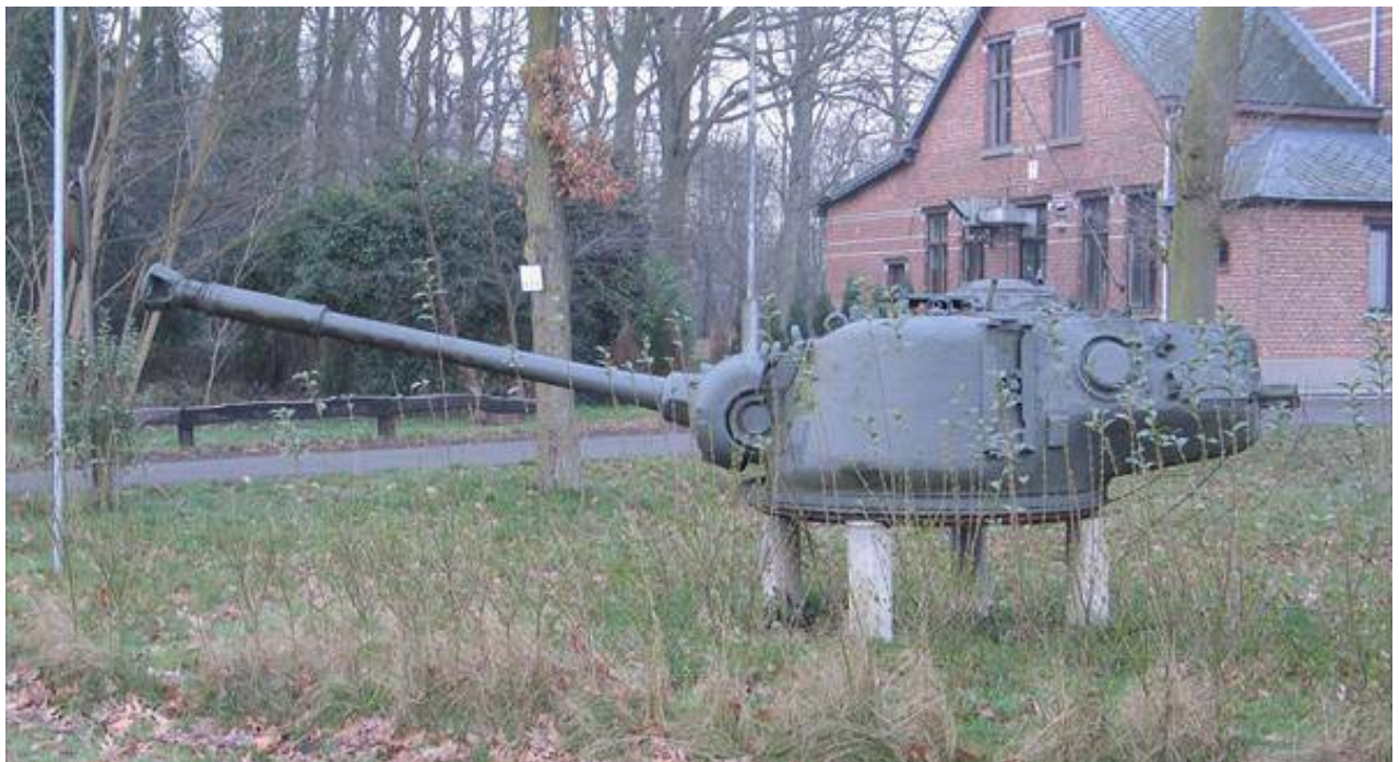
M26A1 Pershing turret – Cavalry House, Leopoldsburg (Belgium)