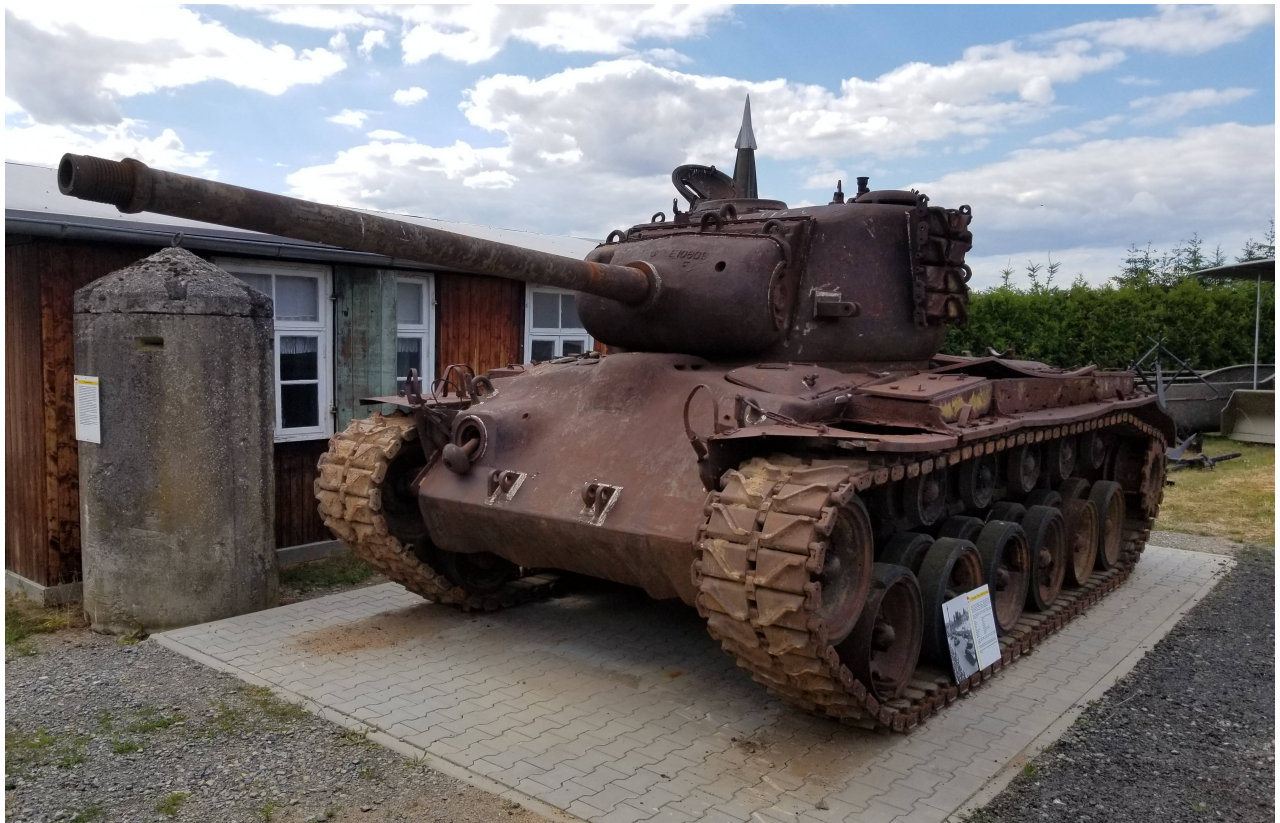
Pierre-Olivier Buan, July 2020