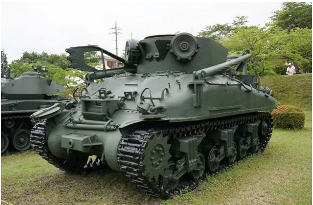
M32B1 TRV – Longgang road, Jhongli City, Taoyuan (Taiwan)

http://blair-military.blogspot.com/2011/08/m32b1.html