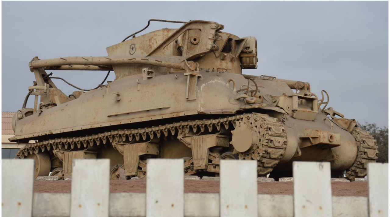
Sylvain Protois, July 2019