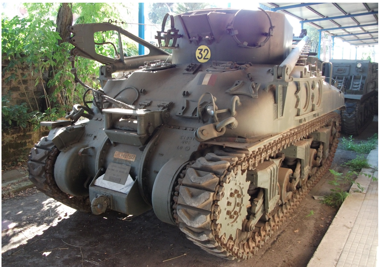
Pierre-Olivier Buan, September 2012