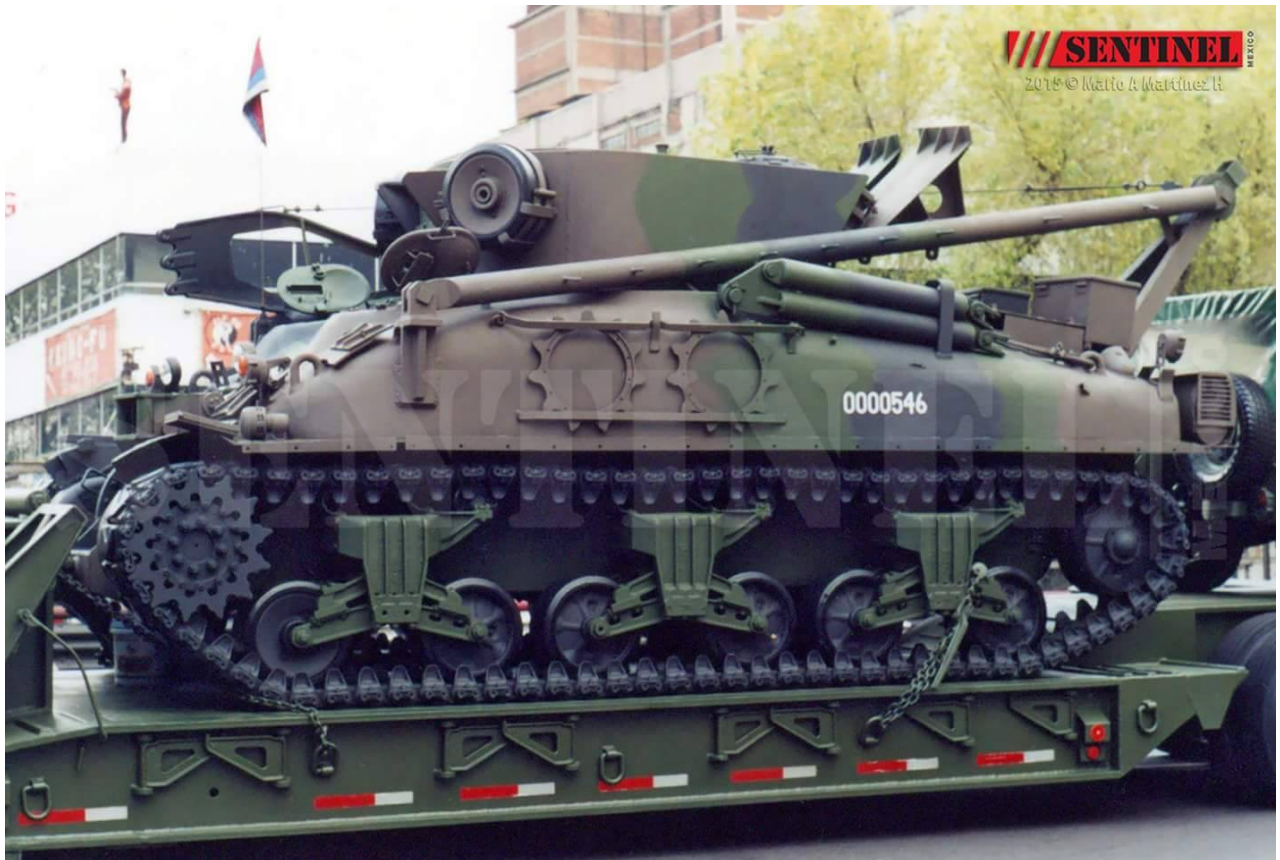
"Sentinel México", November 2015 - https://www.facebook.com/SentinelMexico1/

M32B3 TRV – Smith and Edwards Co., Pleasant View, near Ogden, UT (USA) Serial Number 600, USA Number 40155174, converted by Pressed Steel Car in September, 1944. Converted from Serial Number 2925, an M4A3 built by Ford in November, 1942