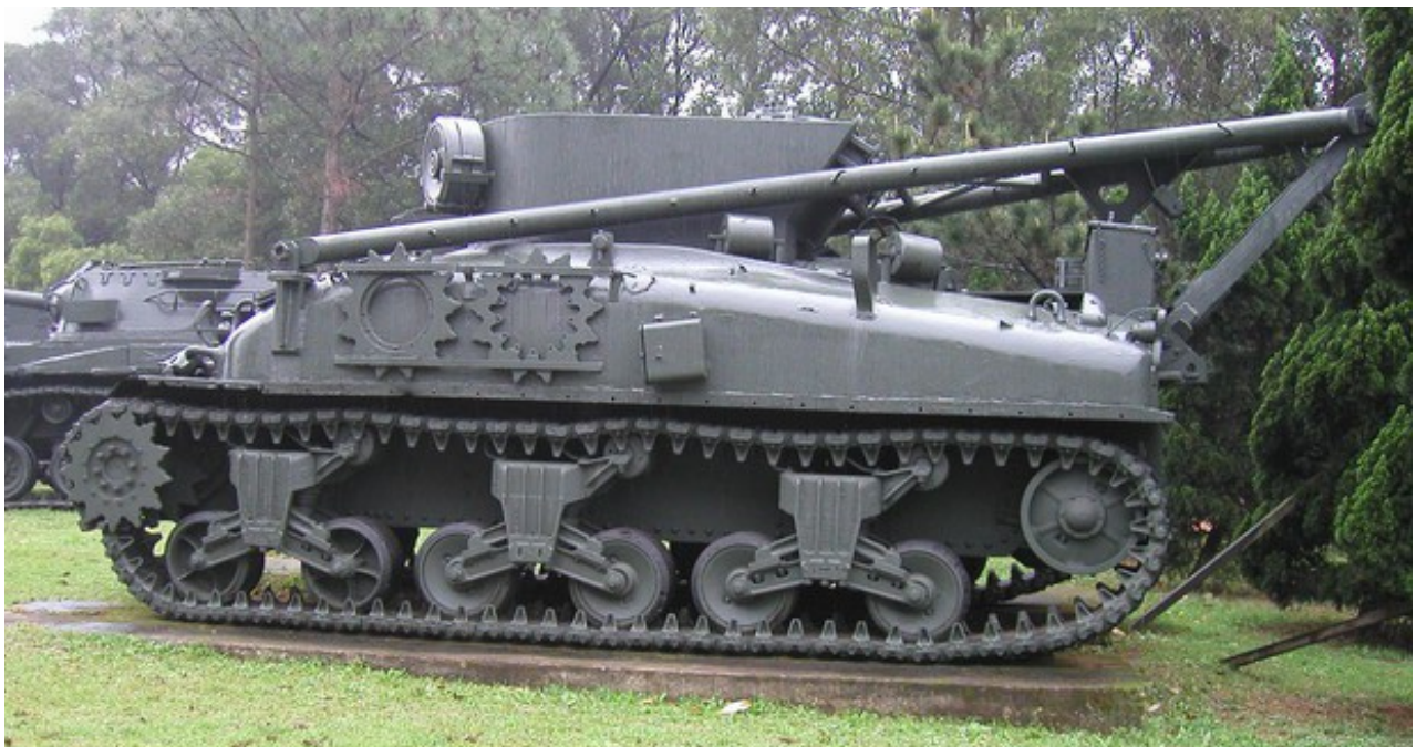
June 2010 - http://blog.xuite.net/maomi/Food01/34559980