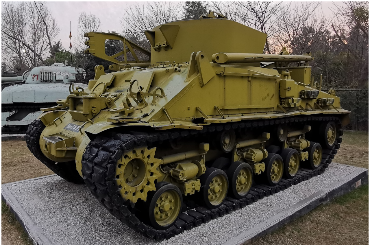
M32A1B3 TRV – Pakistan Army Museum, Lahore (Pakistan)