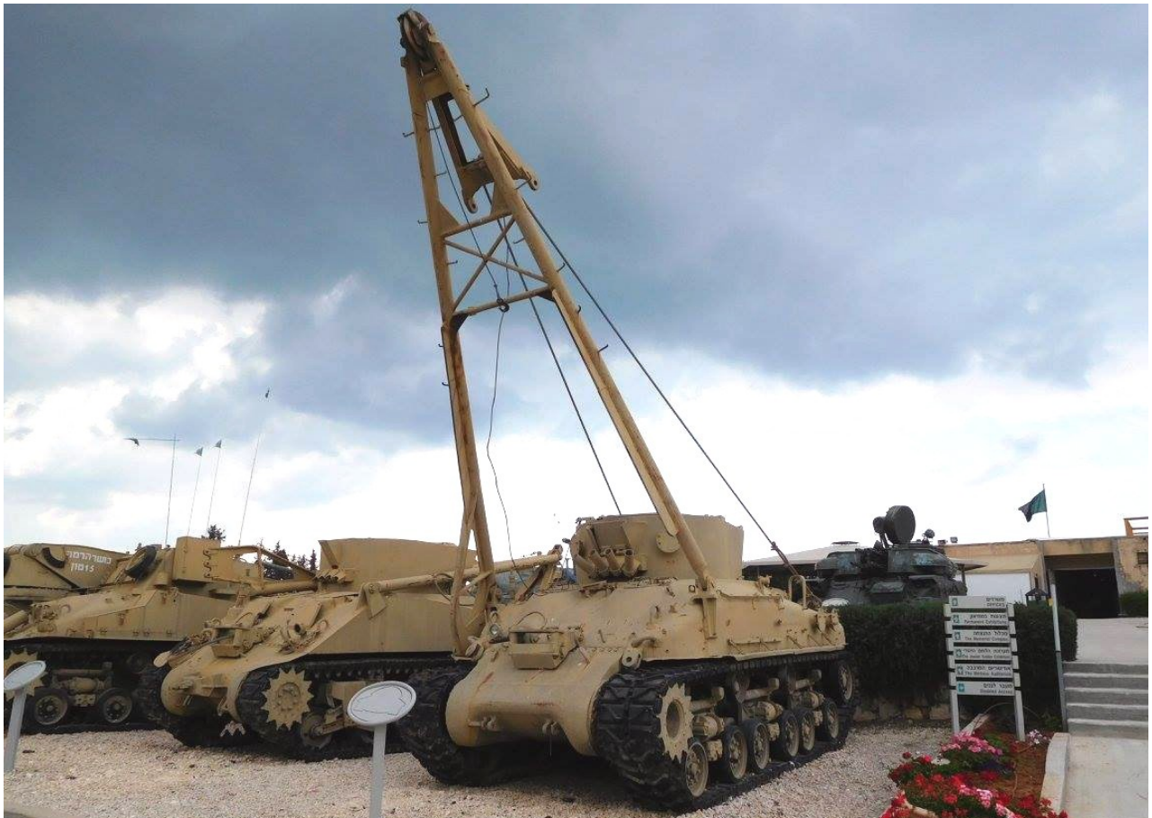
Jim Goetz, March 2017 - https://www.facebook.com/

Converted from Serial Number 12203, an M4A3 built by Ford in May, 1943. Now equipped with a radial engine, M4 engine deck and rear engine doors (Israeli conversion). This tank has got the automatic tow hook modification in 1945