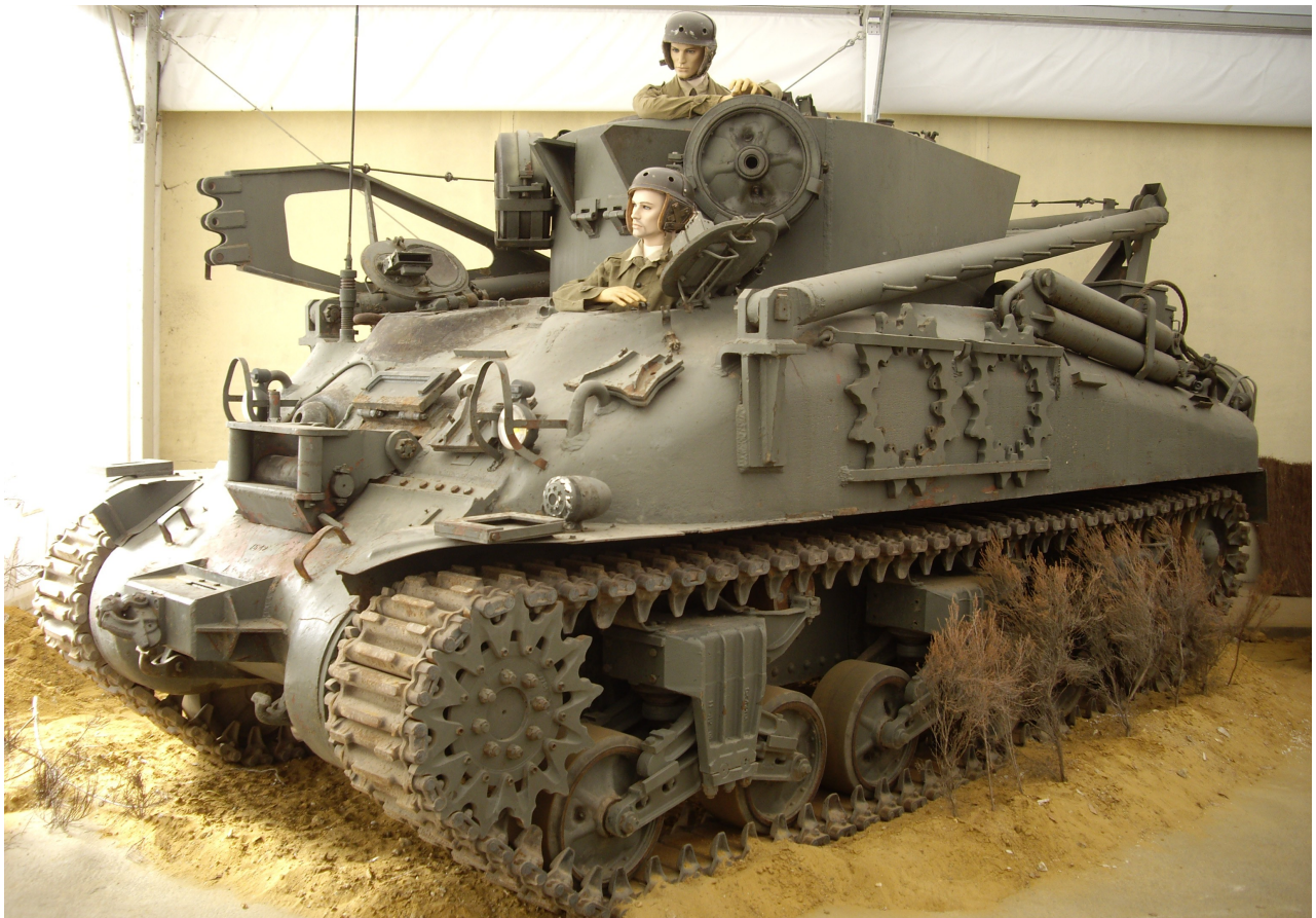
Pierre-Olivier Buan, June 2011