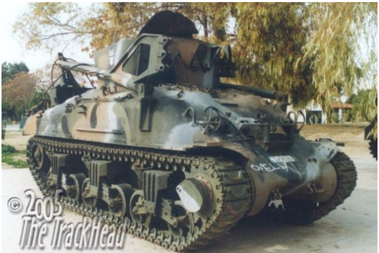
M32B1 TRV – Unknown military area (Greece)