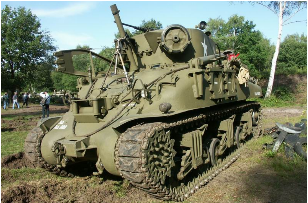
M32 TRV – Depot of the Royal Museum of the Armed Forces and Military History Landen (Belgium) Converted from a PSC M4

http://www.armyrecognition.com/europe/Belgique/exhibition/Tanks_in_Town_2005/Tanks_in_Town_2005_pictures_gallery.htm