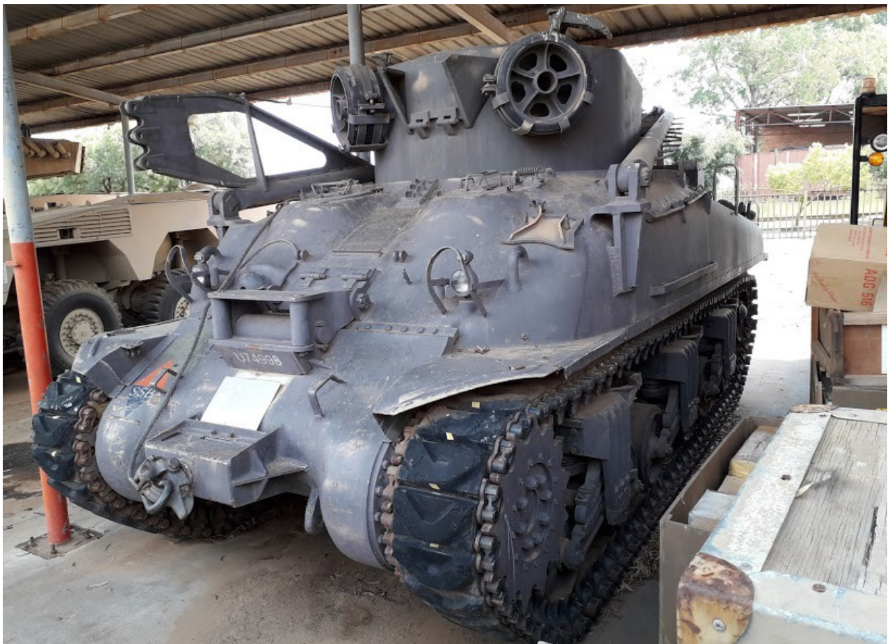
M32A1B3 TRV – Batey ha-Osef Museum, Tel Aviv (Israel) Converted from a Ford M4A3. This tank has got the automatic tow hook modification in 1945