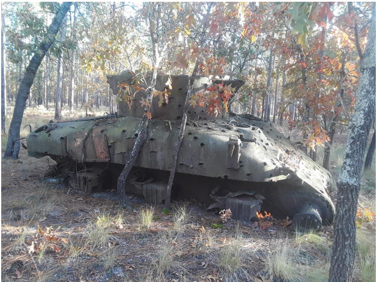
M32B1 TRV wreck – Fire range, Fort Riley, KS (USA)

https://www.facebook.com/photo.php?fbid=10102993098623223&set=pcb.800994599964222&type=3&theater