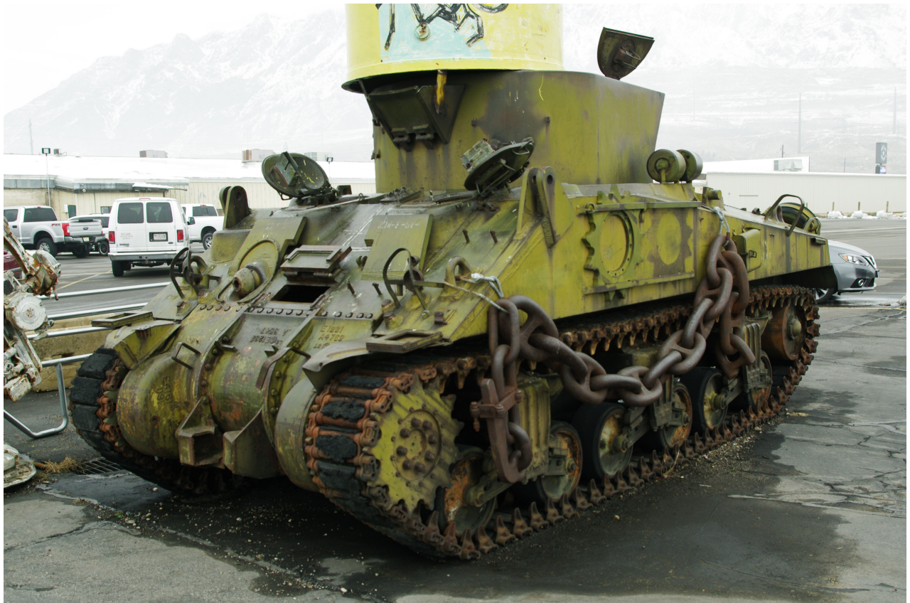
Giuseppe Franzoni, December 2019

M32B3 TRV – Smith and Edwards Co., Pleasant View, near Ogden, UT (USA) Serial Number 600, USA Number 40155174, converted by Pressed Steel Car in September, 1944. Converted from Serial Number 2925, an M4A3 built by Ford in November, 1942