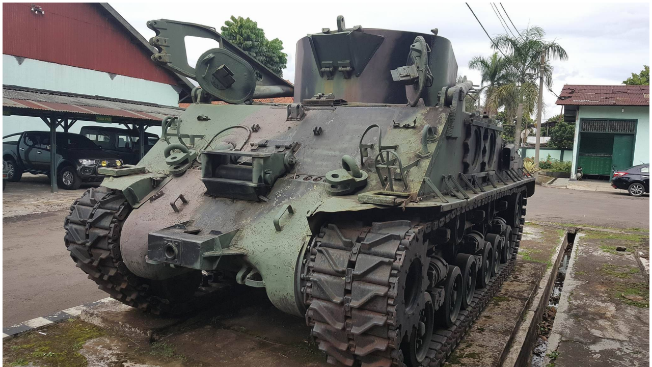
Budi Nurtjahjo Djarot