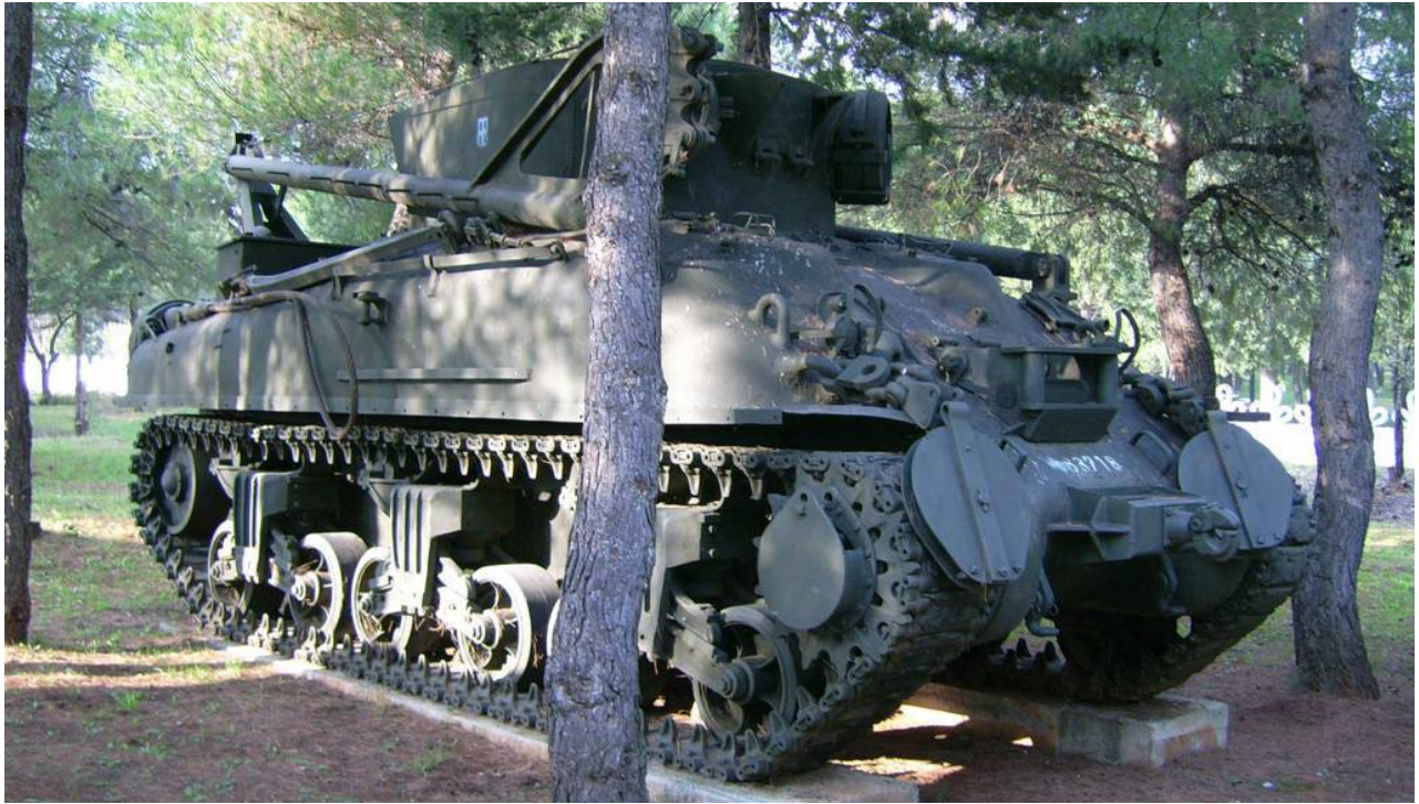
Κωνσταντίνου Παντισίδη, November 2006 - http://www.redstar.gr/Foto_red/Exibition/MuseumGR_Aulon.html

First M32B1 TRV – Hellenic Army Armor Museum, inside the Armor Training Center, Avlona, near Athens (Greece)