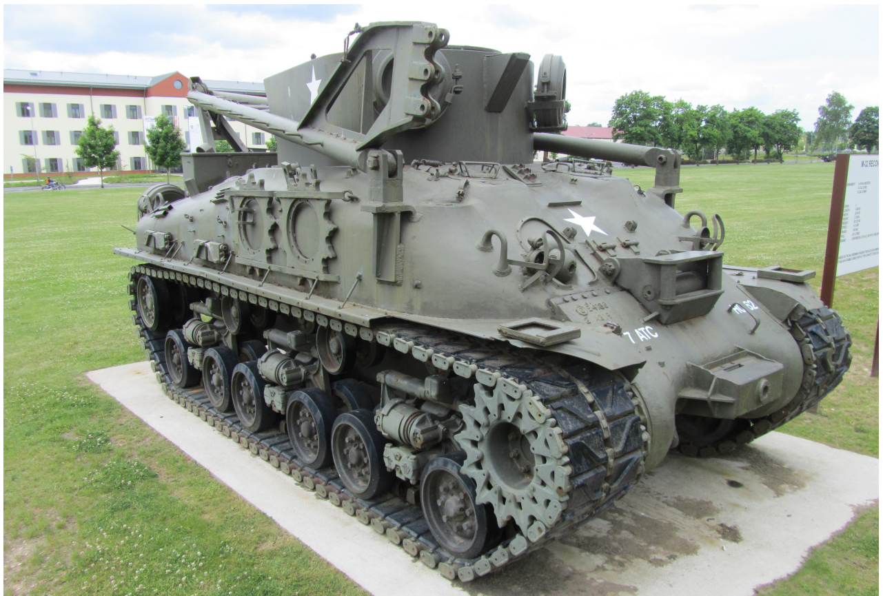
M32A1B1 TRV – Auto + Technik museum, Sinsheim (Germany) Converted from a Pressed Steel Car M4A1

Pierre-Olivier Buan, September 2014 - https://www.flickr.com/photos/13963542@N08/sets/72157647957518545