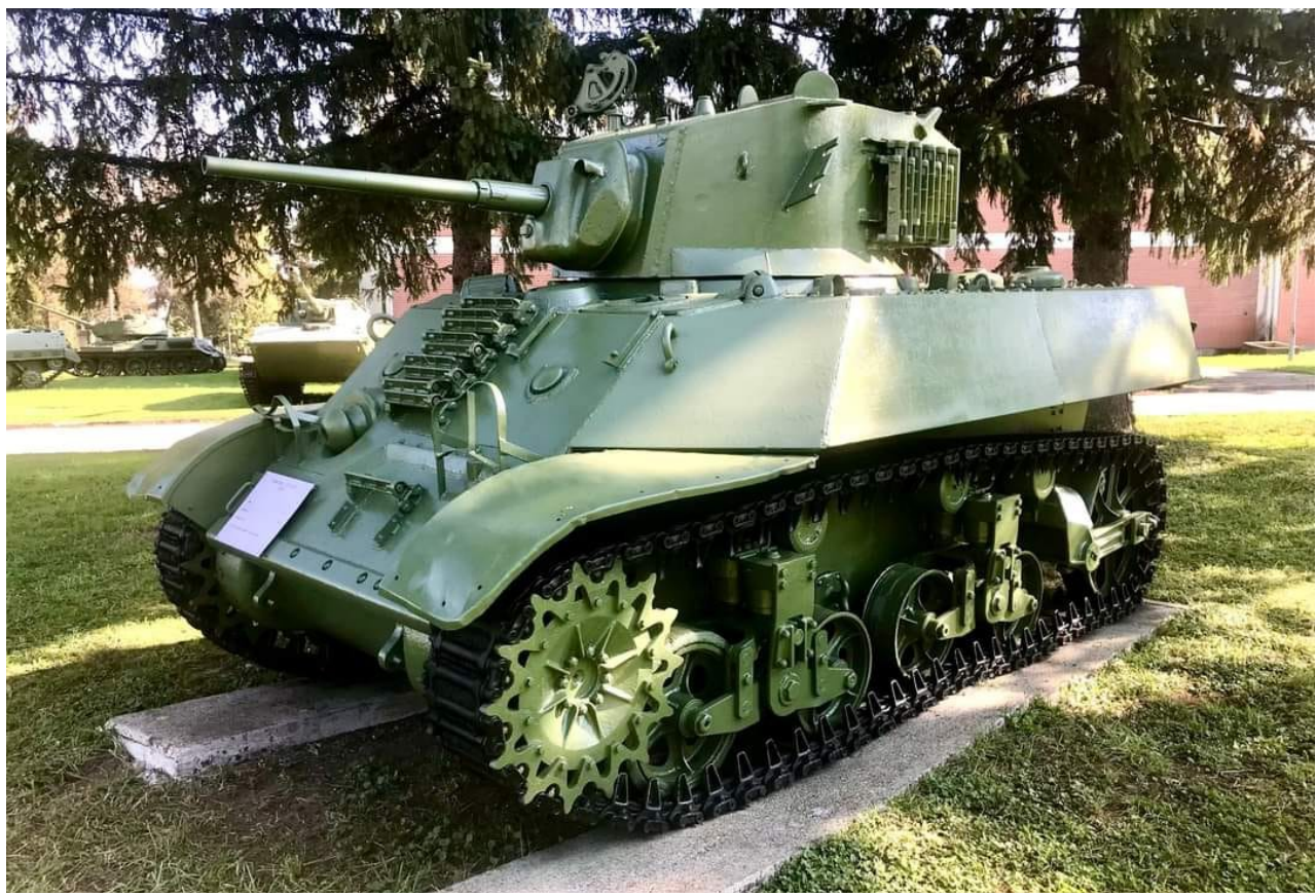
M3A3 Stuart – Hrib svobode (Liberty Hill), Ilirska Bistrica (Slovenia) Serial Number 12847