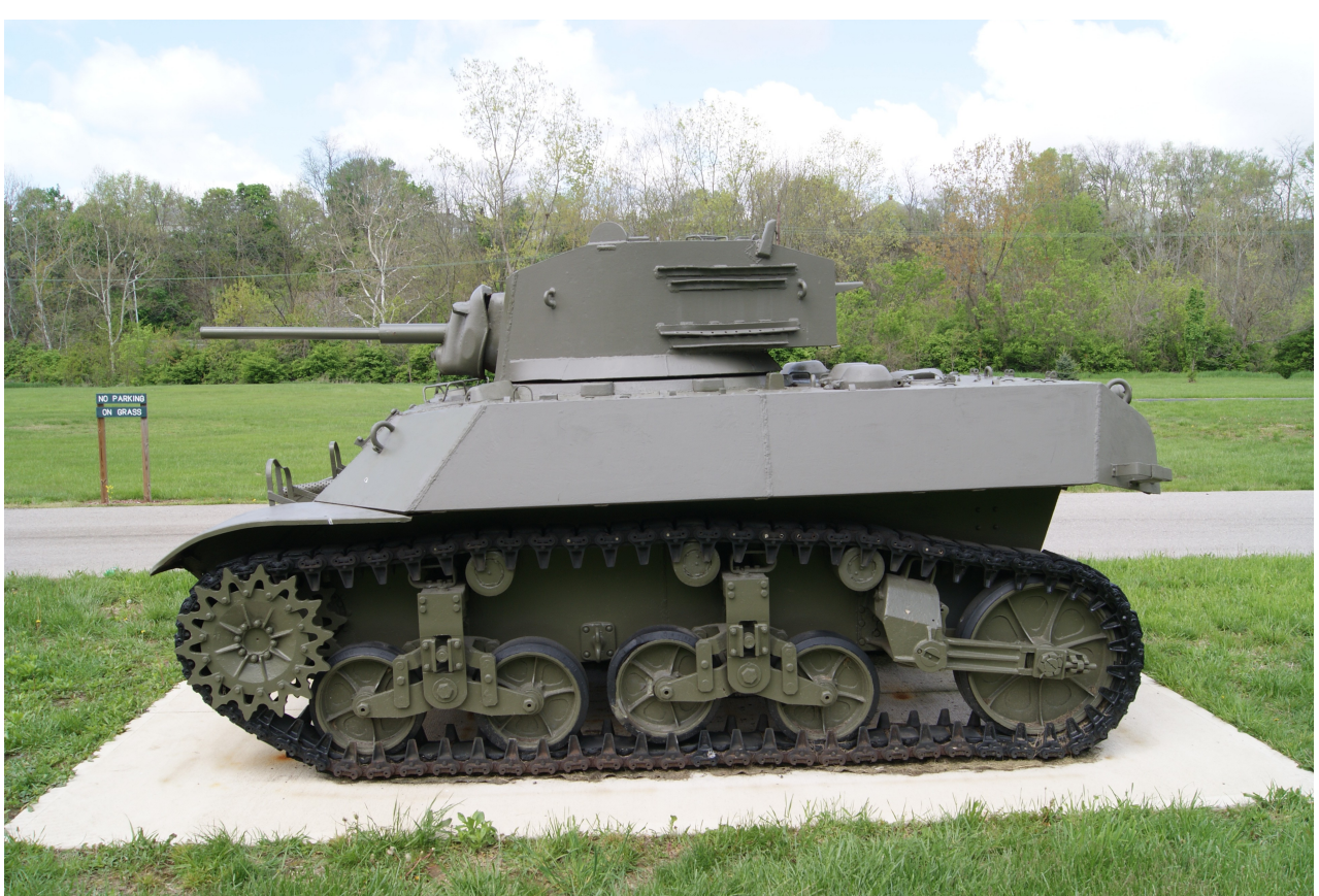
M3A3 Stuart – Minerva Veterans Memorial Park, Minerva, OH (USA) Serial Number 13277 (USA AFVs register)