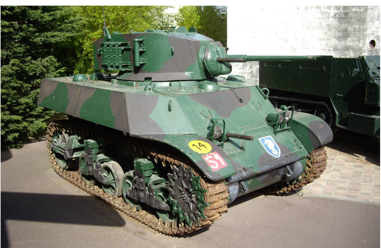
M3A3 Stuart – On Ioan to the CVMA in Nantes (France) Serial Number 13774, on Ioan from the Musée des Blindés in Saumur