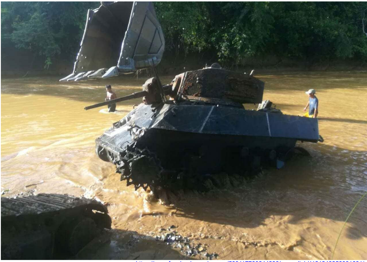
M3A3 Stuart – Pakistan Army Museum, Lahore (Pakistan)

https://www.facebook.com/groups/599117760244236/permalink/1121243258031681/