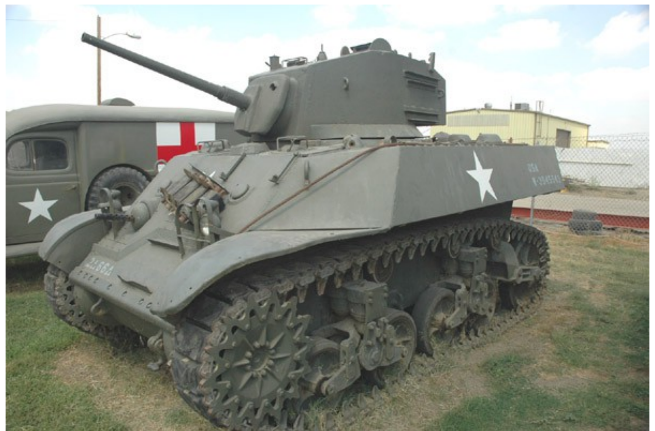
Chris Hughes, September 2005 - http://www.toadmanstankpictures.com/m3a3_stuart.htm