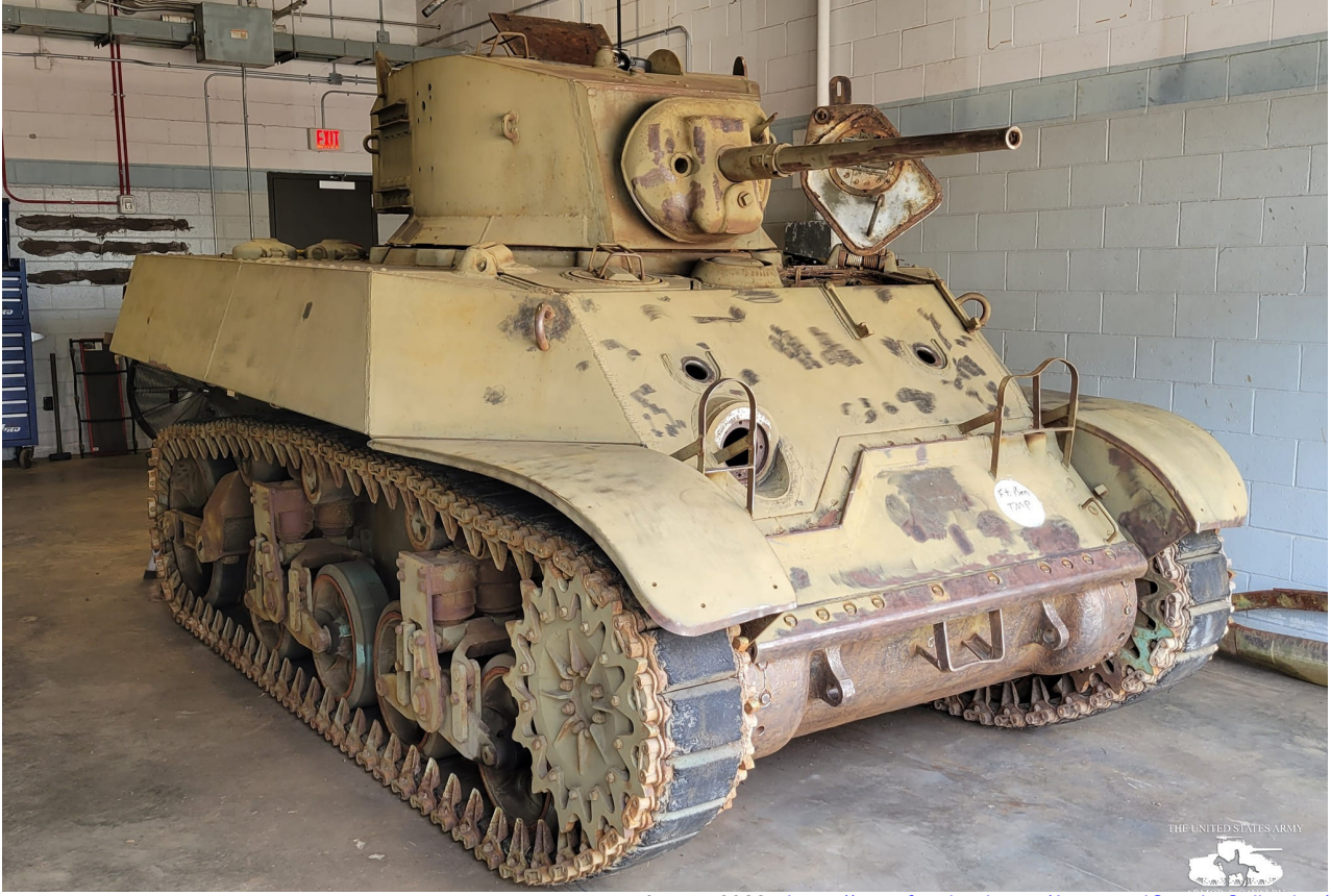
August 2022 - https://www.facebook.com/ArmorandCavalryCollection/