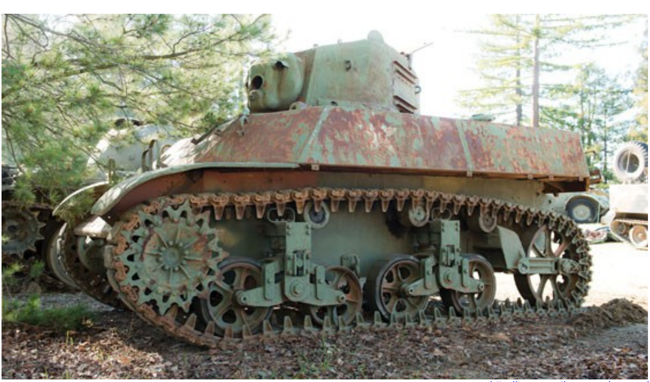
M3A3 Stuart - American Legion Post, Houston, MN (USA)