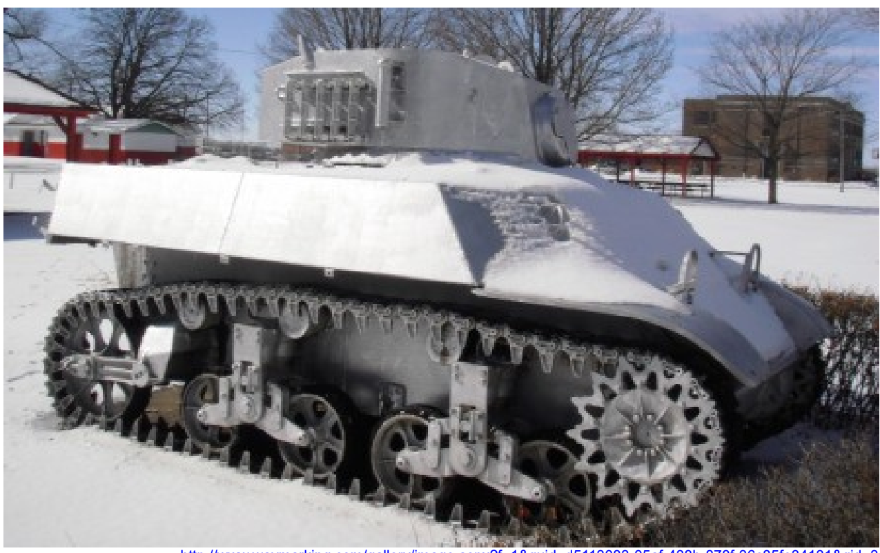
M3A3 Stuart – Cemetery (north of town), Hoopeston, IL (USA) Serial Number 12237 (Kurt Laughlin)

http://www.waymarking.com/gallery/image.aspx?f=1&guid=d5113083-05af-438b-878f-36c85fe34131&gid=3