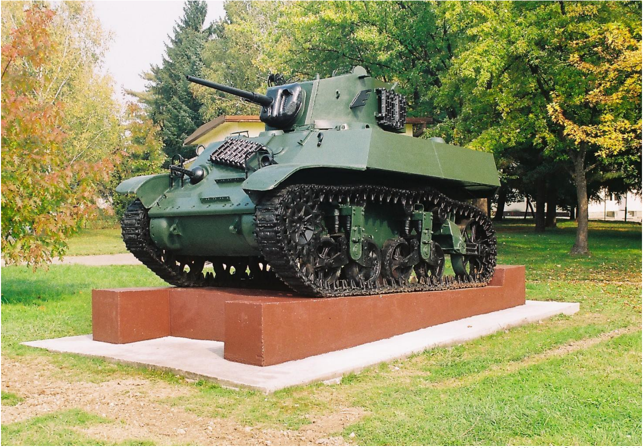
Nebojsa Mirkovic, September 2018

M3A3 Stuart – 252 Armored Brigade, Jarčujak, near Kraljevo (Serbia) This tank was displayed in the city of Kraljevo from the sixties until 2007, when it was transferred to a local military barracks and is now displayed there (Nebojsa Mirkovic)