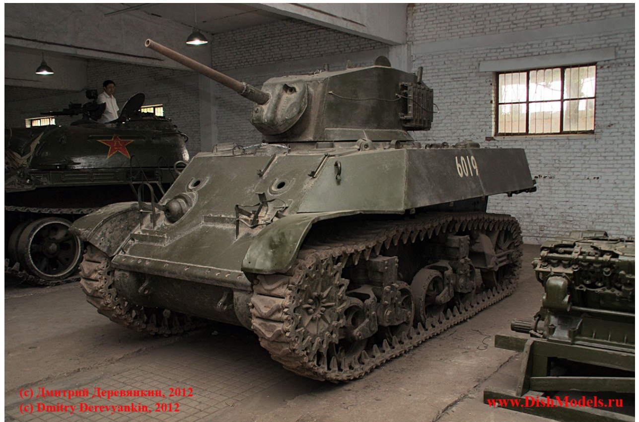
Dmitry Derevyankin, 2012 - http://dishmodels.ru/wshow.htm?p=2200