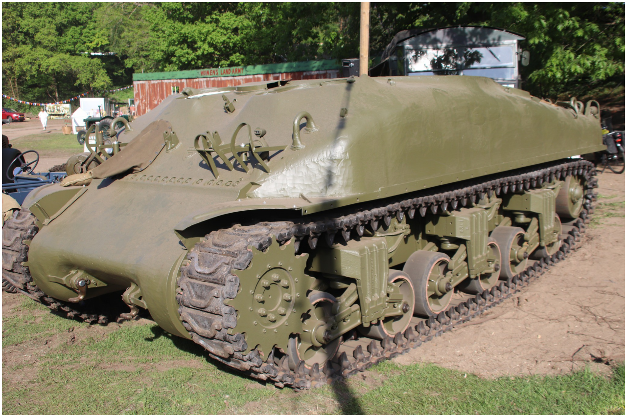
Walter Schwabe, May 2025

Sequence number 4953, probably built in August, 1944