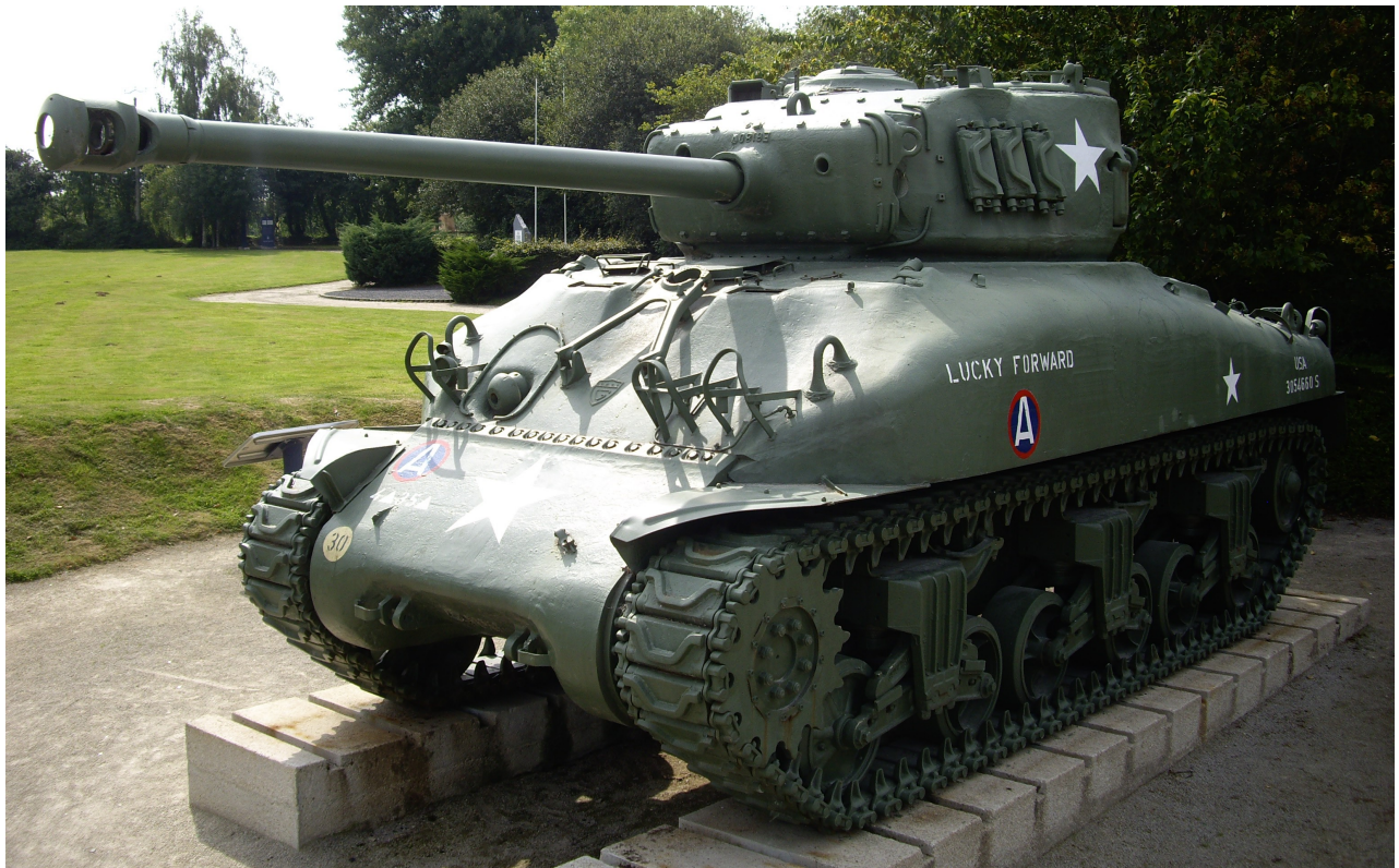
Pierre-Olivier Buan, September 2010 - http://the.shadock.free.fr/Tanks_in_France/sherman_nehou/index.html