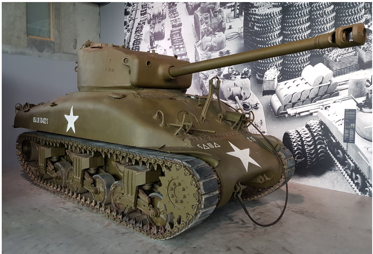
M4A1(76) Sherman "Montereau II" – Saumur Tank Museum (France) – running condition Ex-MDAP

http://dday-overlord.forumactif.com/ftopic1311.concours-de-dioramas-de-SAUMUR.htm