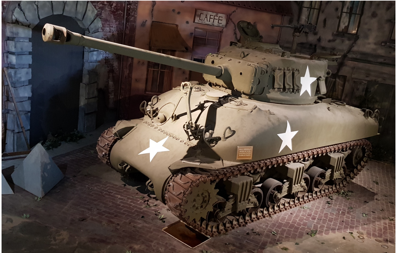
Pierre-Olivier Buan, September 2023