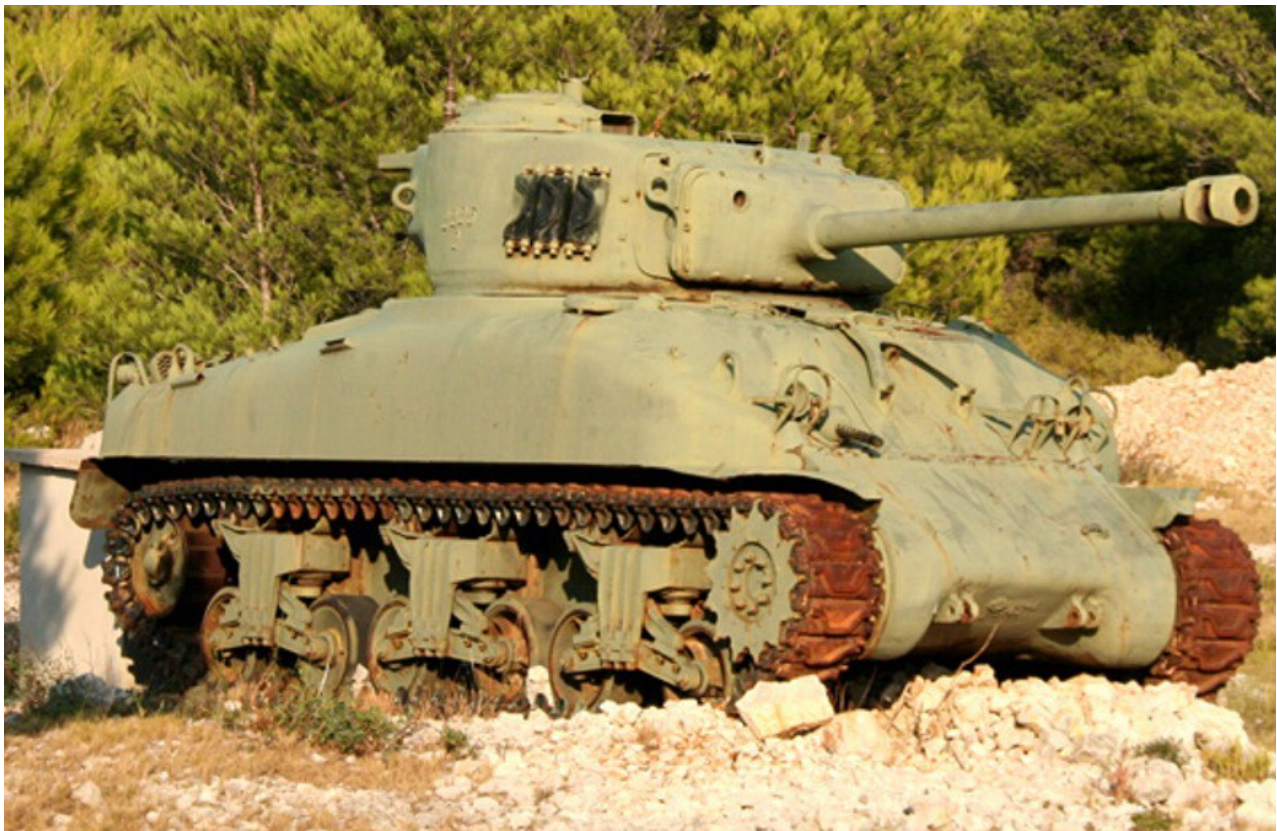
M4A1(76) Sherman – Camp de Canjuers, near Draguignan (France) Ex-MDAP

http://the.shadock.free.fr/Tanks_in_France/camp_carpiagne/index.html