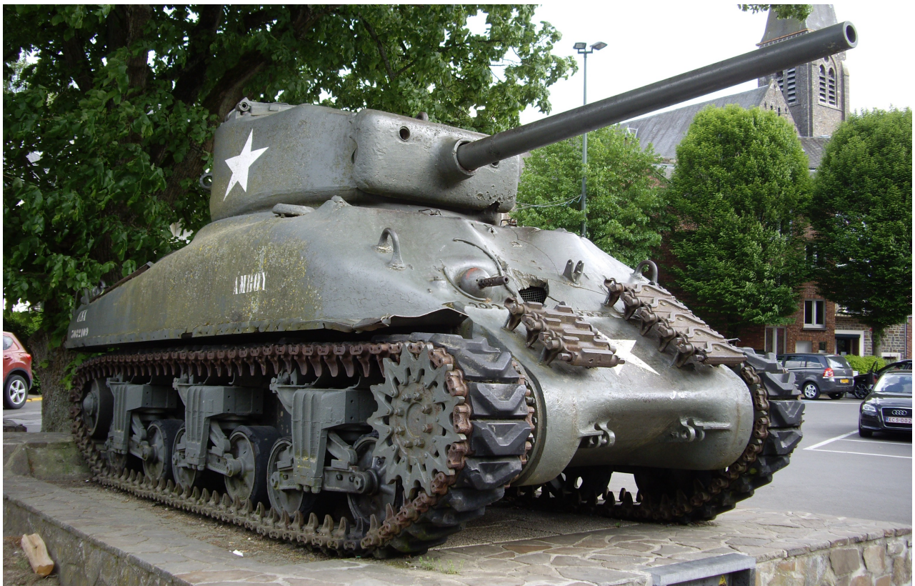
Pierre-Olivier Buan, April 2011 - http://the.shadock.free.fr/Tanks_in_France/sherman_laroche/index.html

Formerly part of the Chièvres US Air Force base, Chièvres (Belgium)