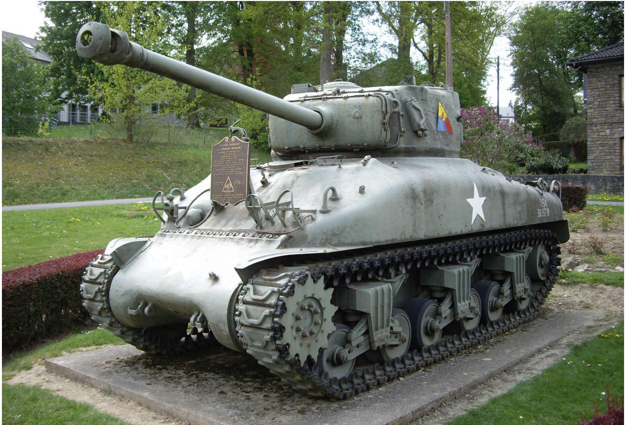
Pierre-Olivier Buan, April 2011 - http://the.shadock.free.fr/Tanks_in_France/sherman_vielsalm/index.html