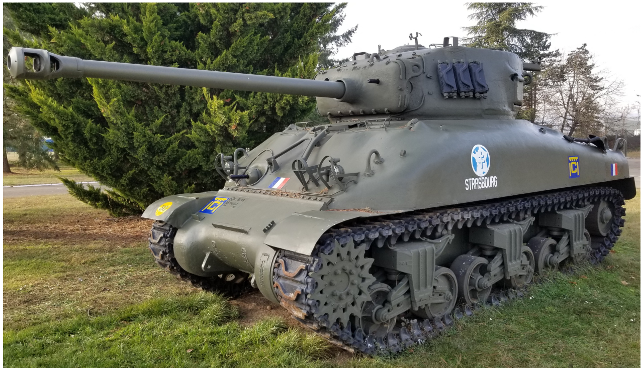
Pierre-Olivier Buan, December 2021