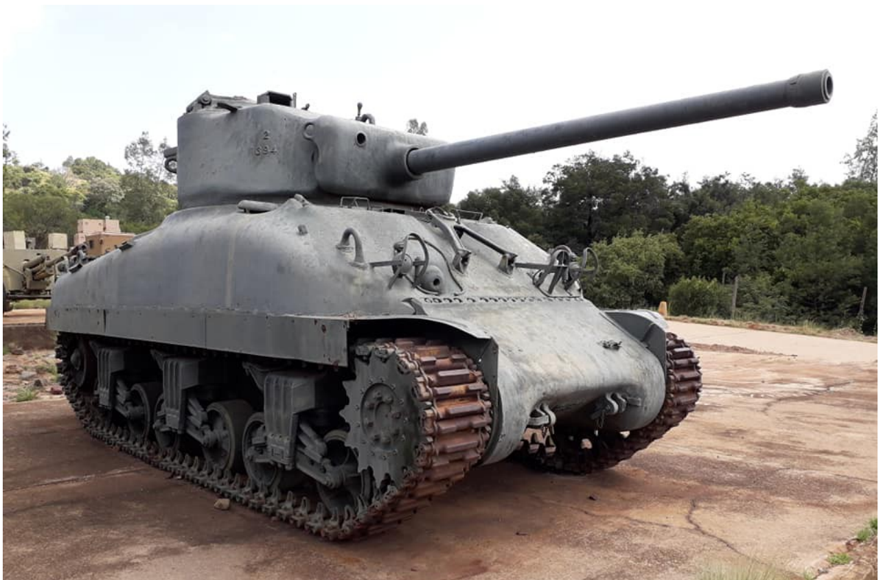
Pierre-Olivier Buan, March 2020