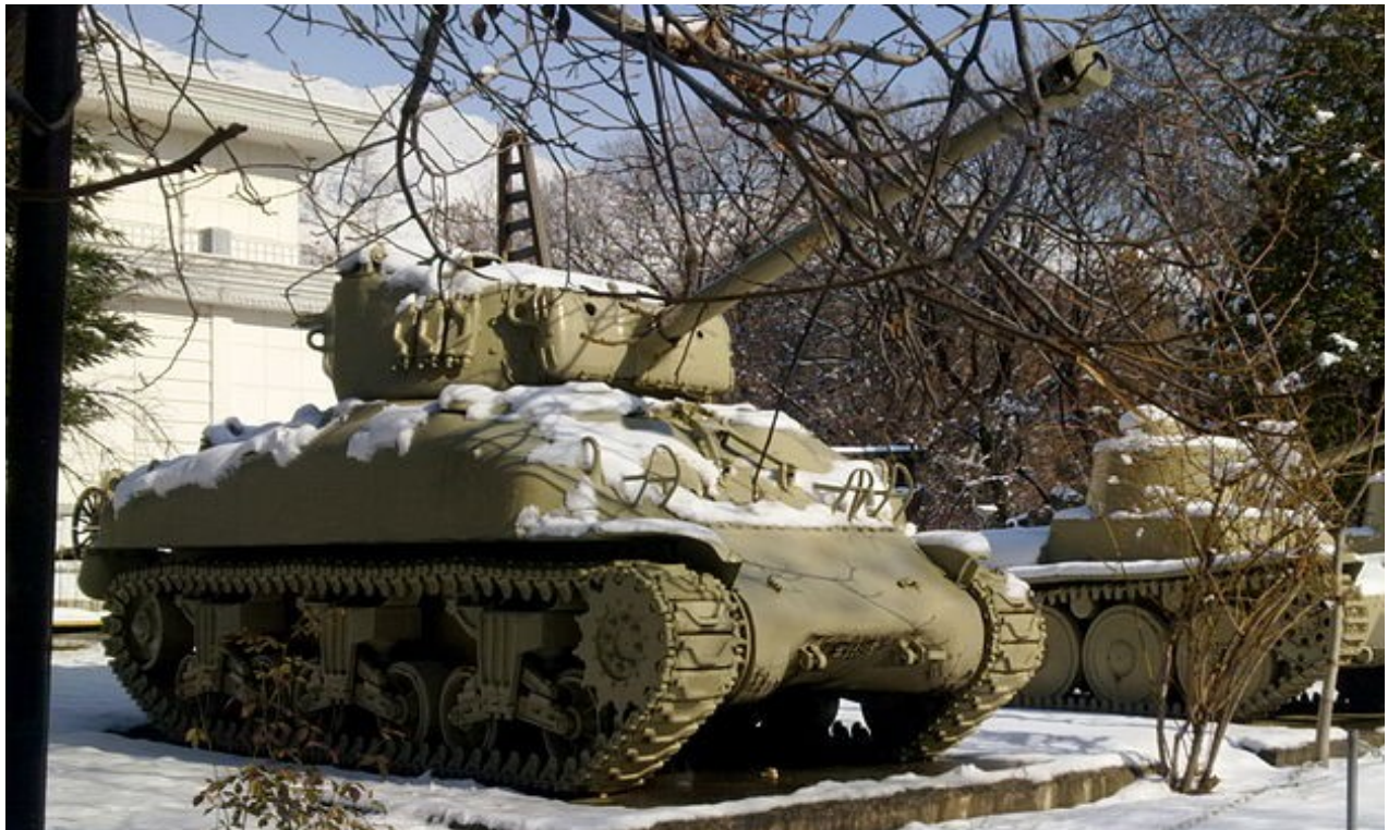
Morgan Karim, December 2011 - https://commons.wikimedia.org/wiki/File:Military_Museum_in_Sa'dabad_Palace.jpg