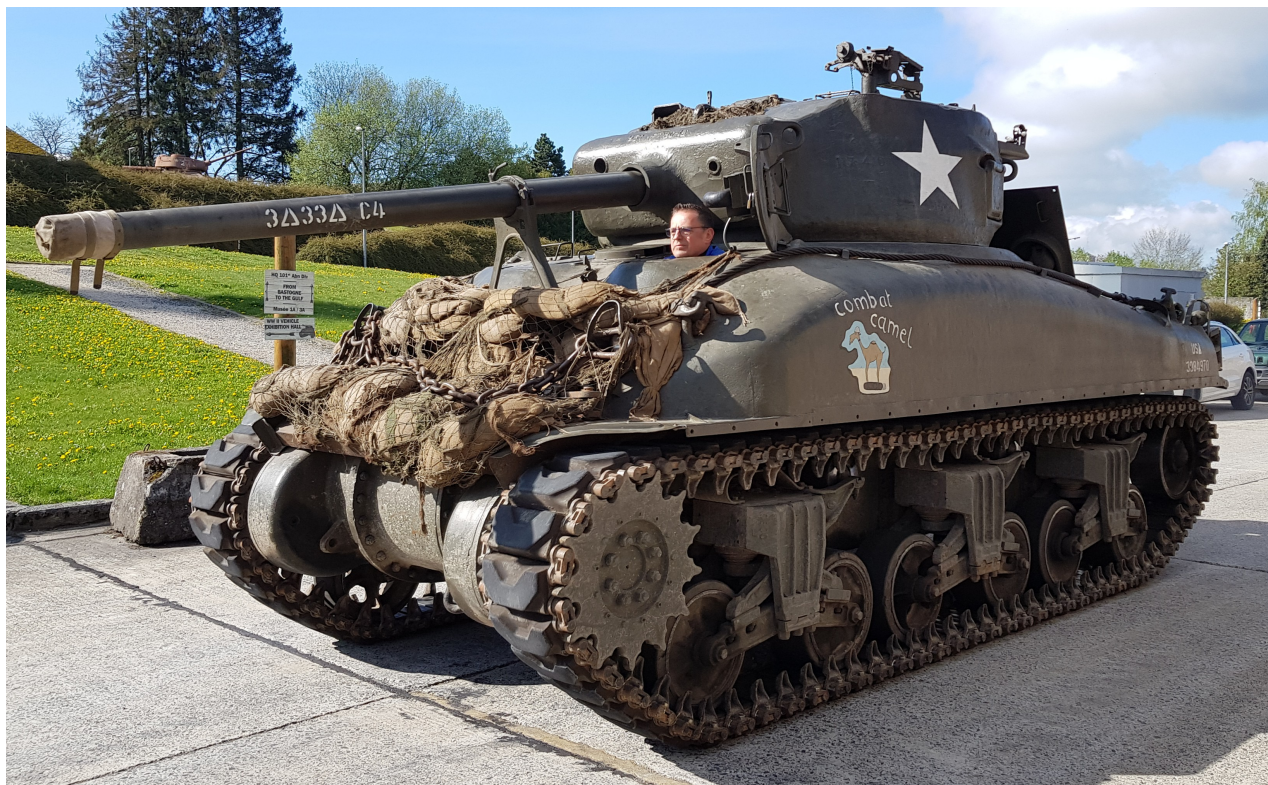
Pierre-Olivier Buan, April 2019