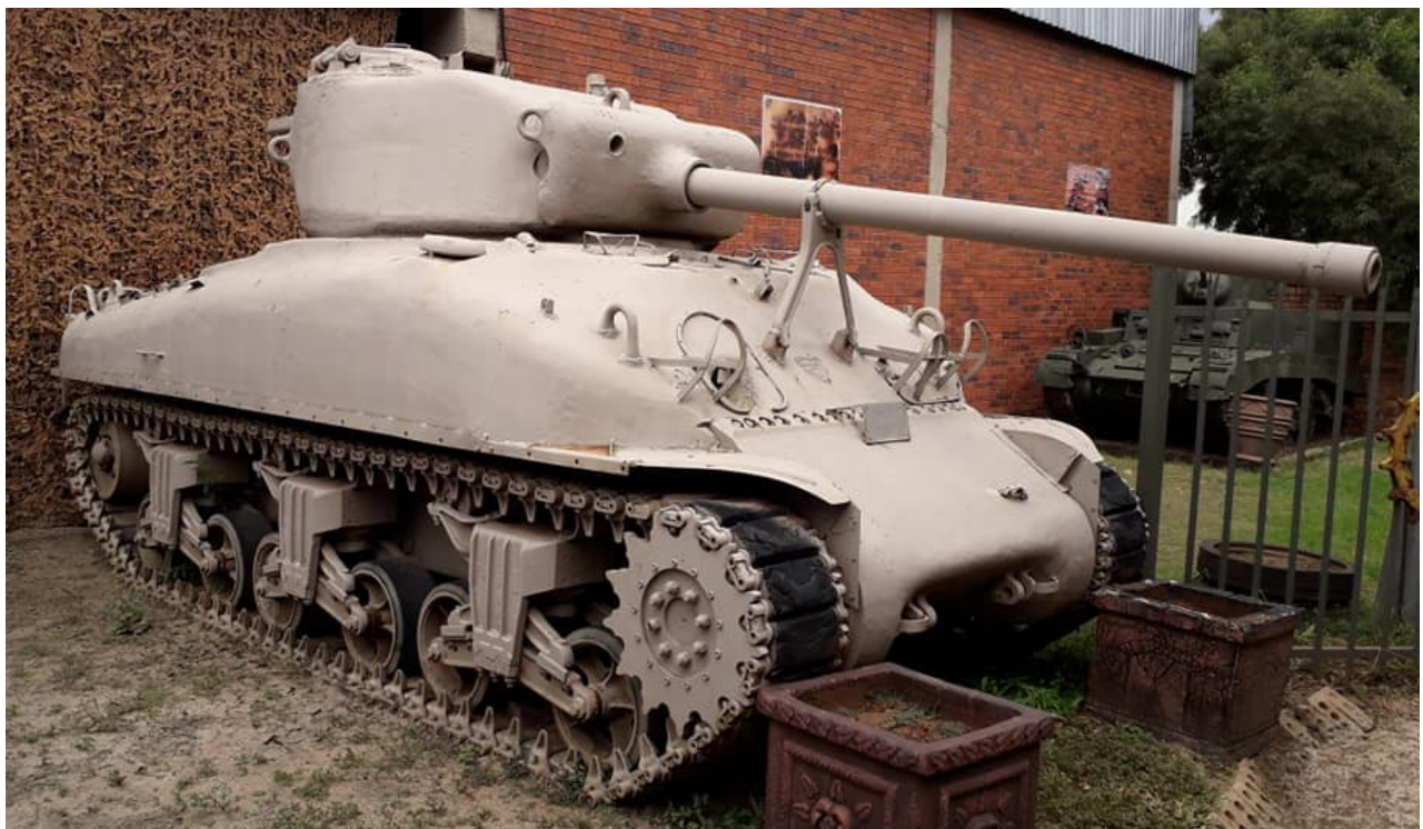
Pierre-Olivier Buan, March 2020