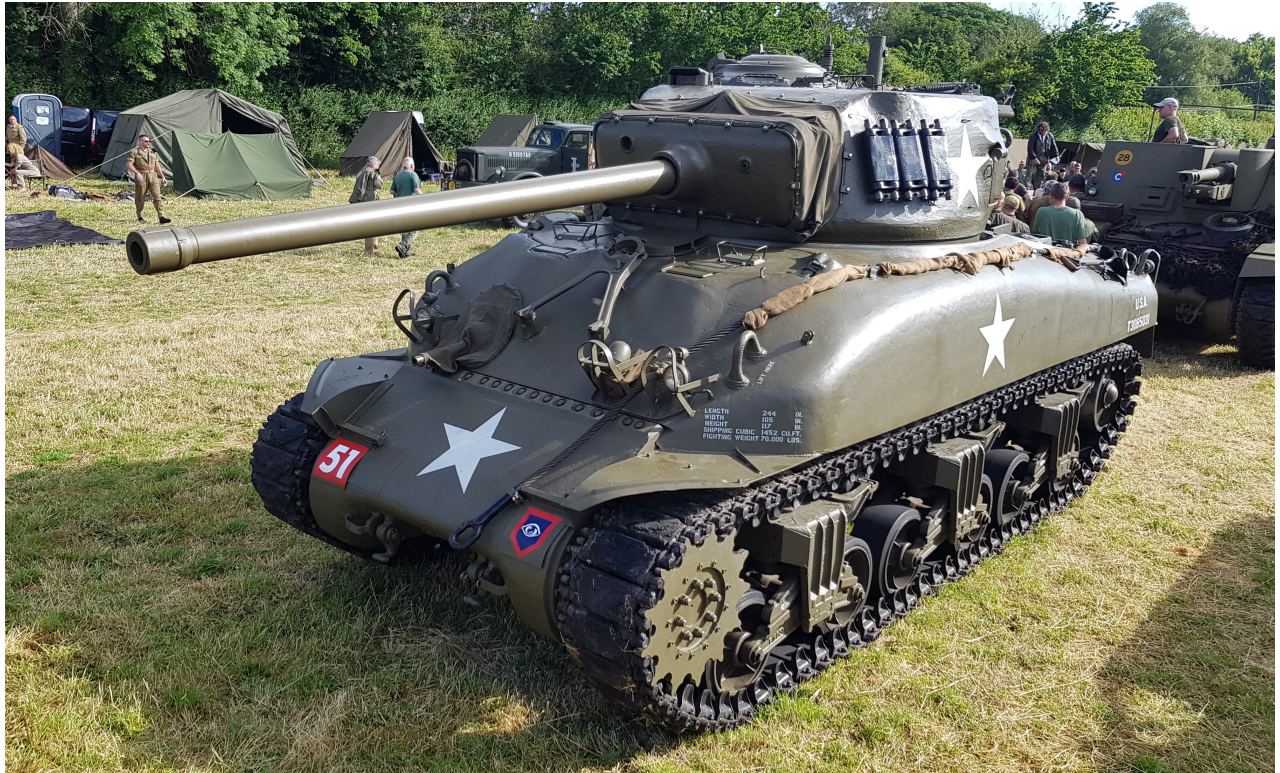
Pierre-Olivier Buan, June 2024