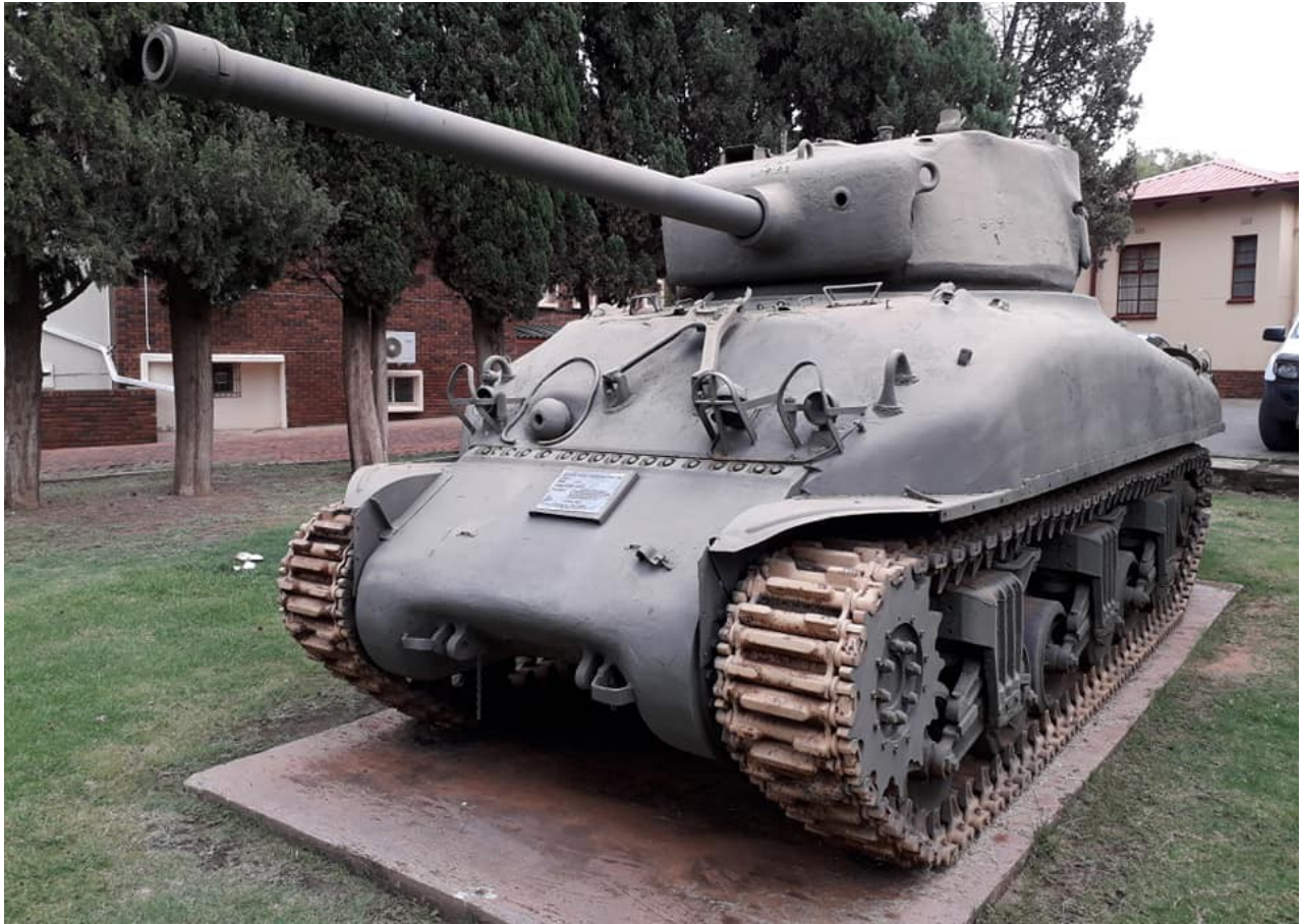
Pierre-Olivier Buan, March 2020