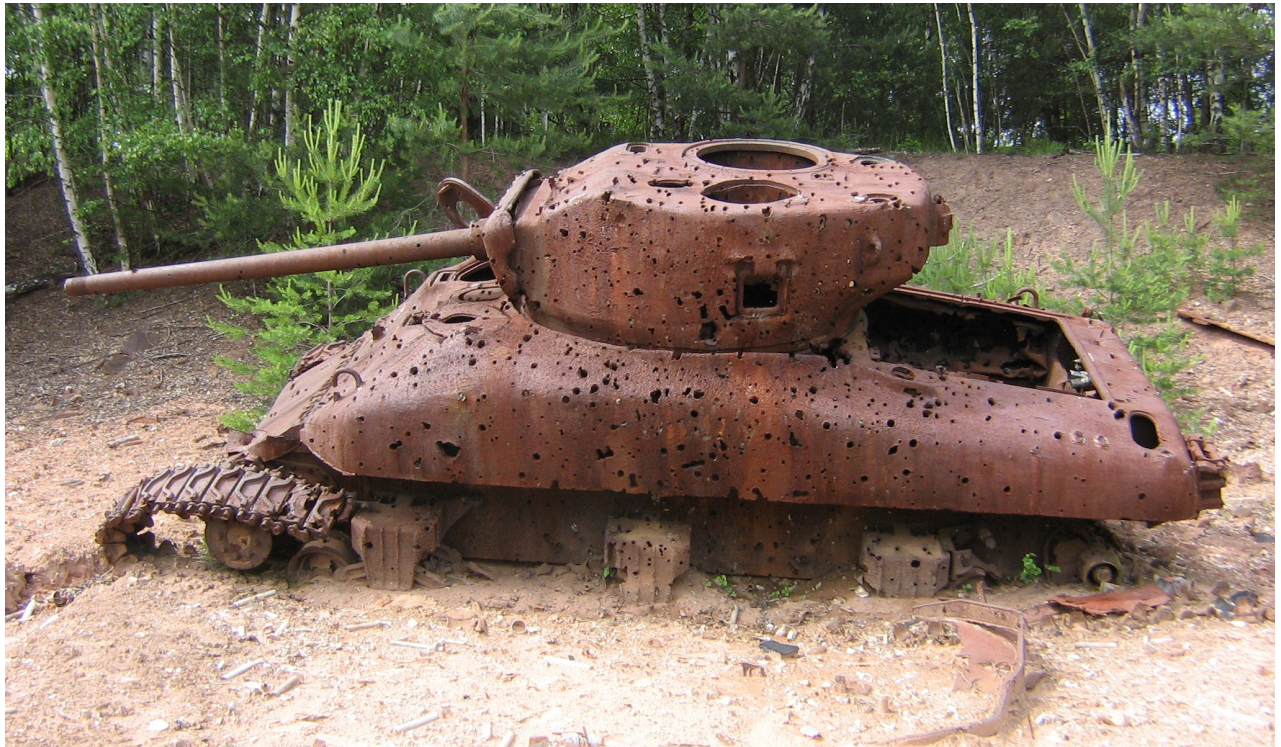
M4A1(76) Sherman wreck – Fire range, eastern France Serial Number 38133, sequence number 4069, built in February, 1944