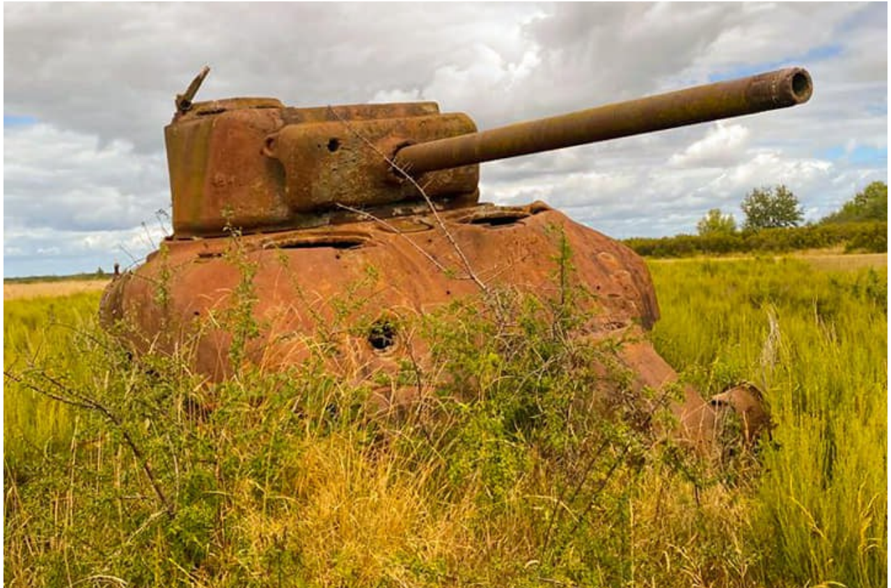
"Monument Men Urbex", 2021