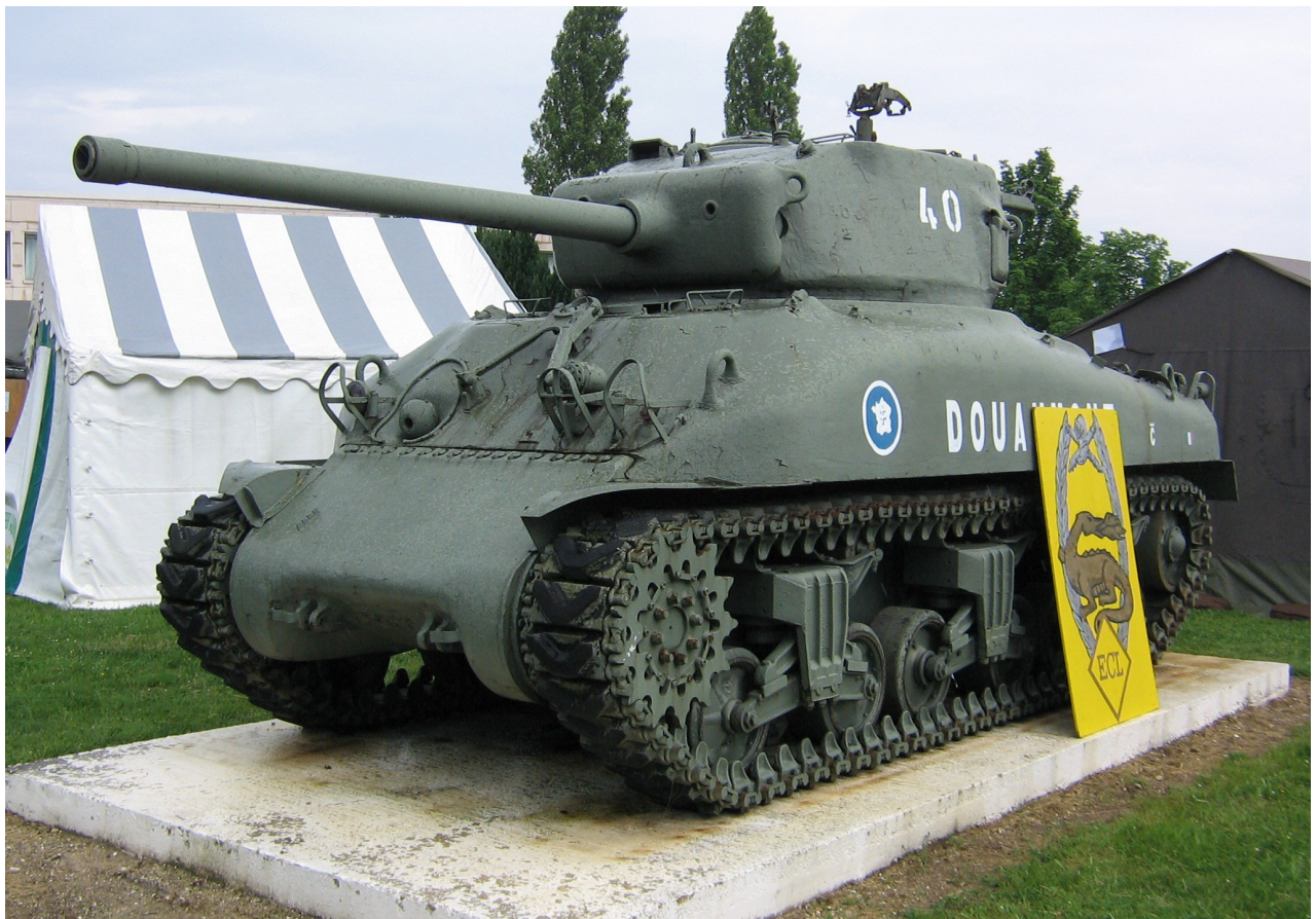
M4A1(75) Sherman – Unknown MV association, southern France (France) – running c. Formerly located at Balmoral Green association, Versailles (France) . Serial Number 52225, sequence number 5303, built in September, 1944. This is an M4A1(76) hull with a 75mm turret

Pierre-Olivier Buan, May 2008 - http://the.shadock.free.fr/Tanks_in_France/mourmelon2/index.html