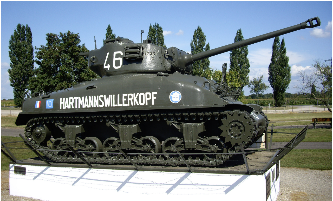
Pierre-Olivier Buan, August 2009 - http://the.shadock.free.fr/Tanks_in_France/marckolsheim/index.html