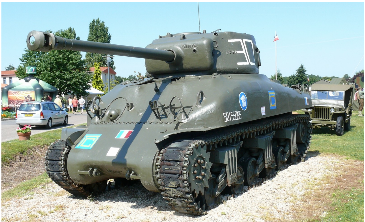
M4A1(76) Sherman – Jeeppest, Saint Mihiel (France) Ex-MDAP