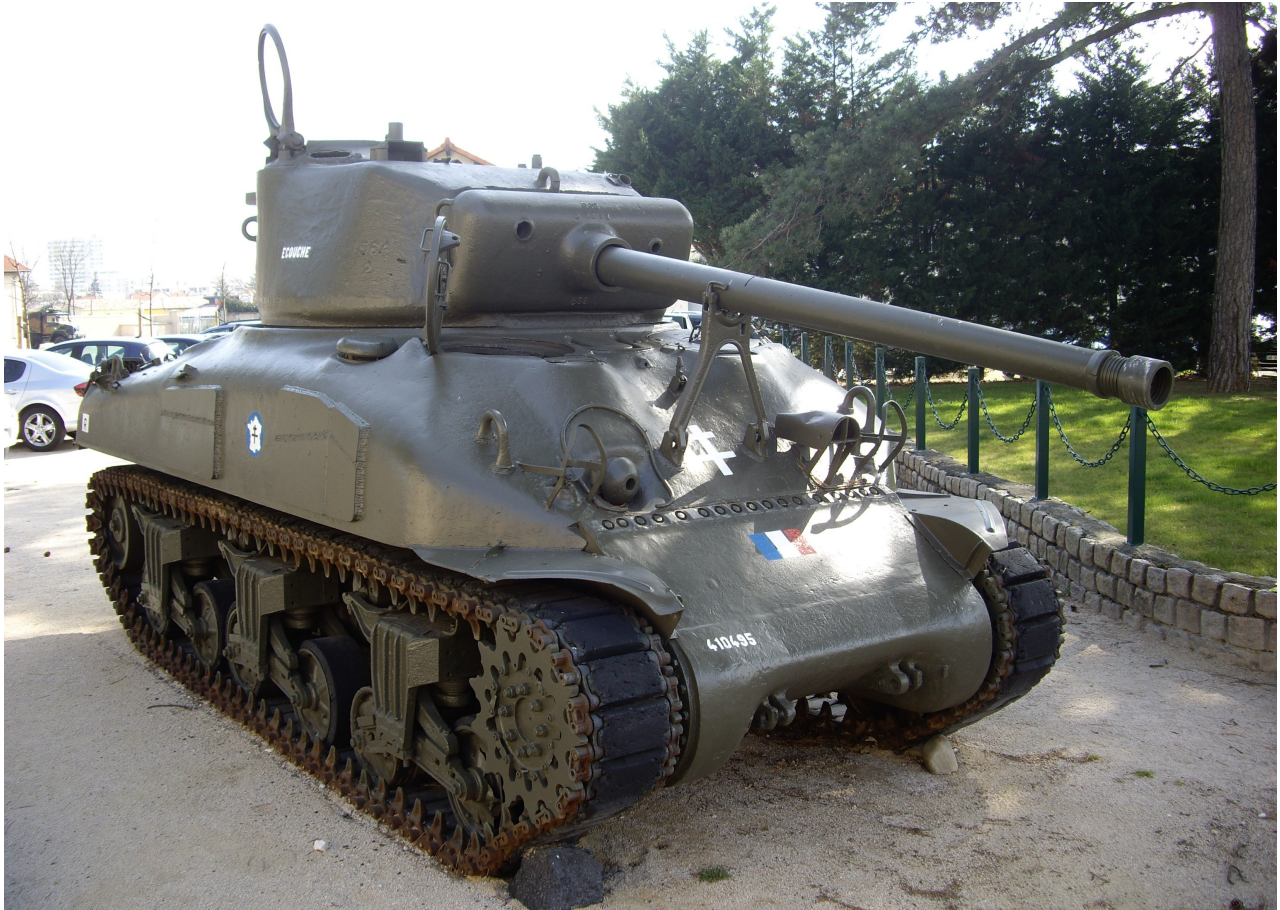
Pierre-Olivier Buan, March 2012 - http://the.shadock.free.fr/Tanks_in_France/sherman_valence/index.html