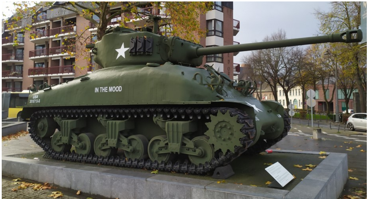
Clément Dupuis, November 2020