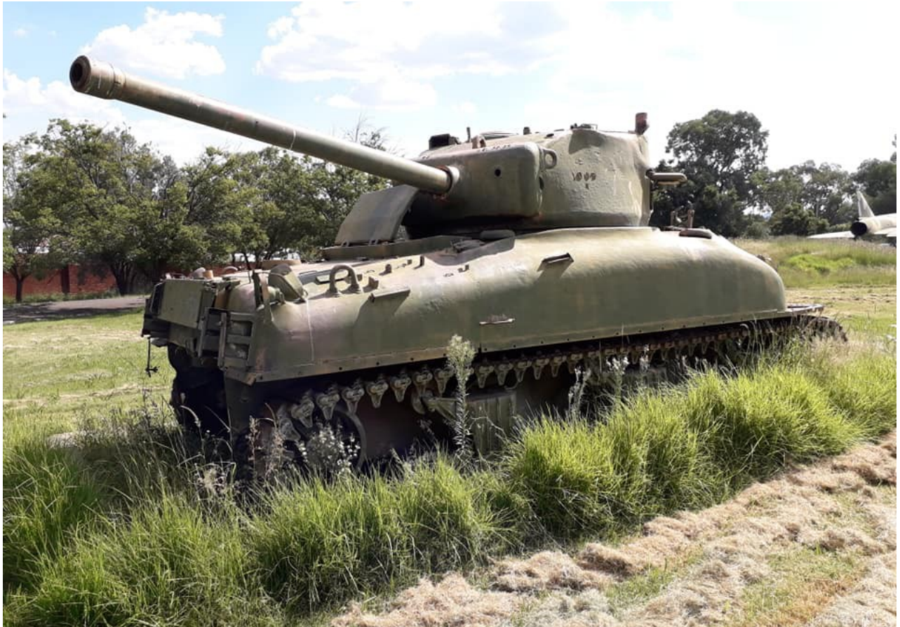
Pierre-Olivier Buan, March 2020