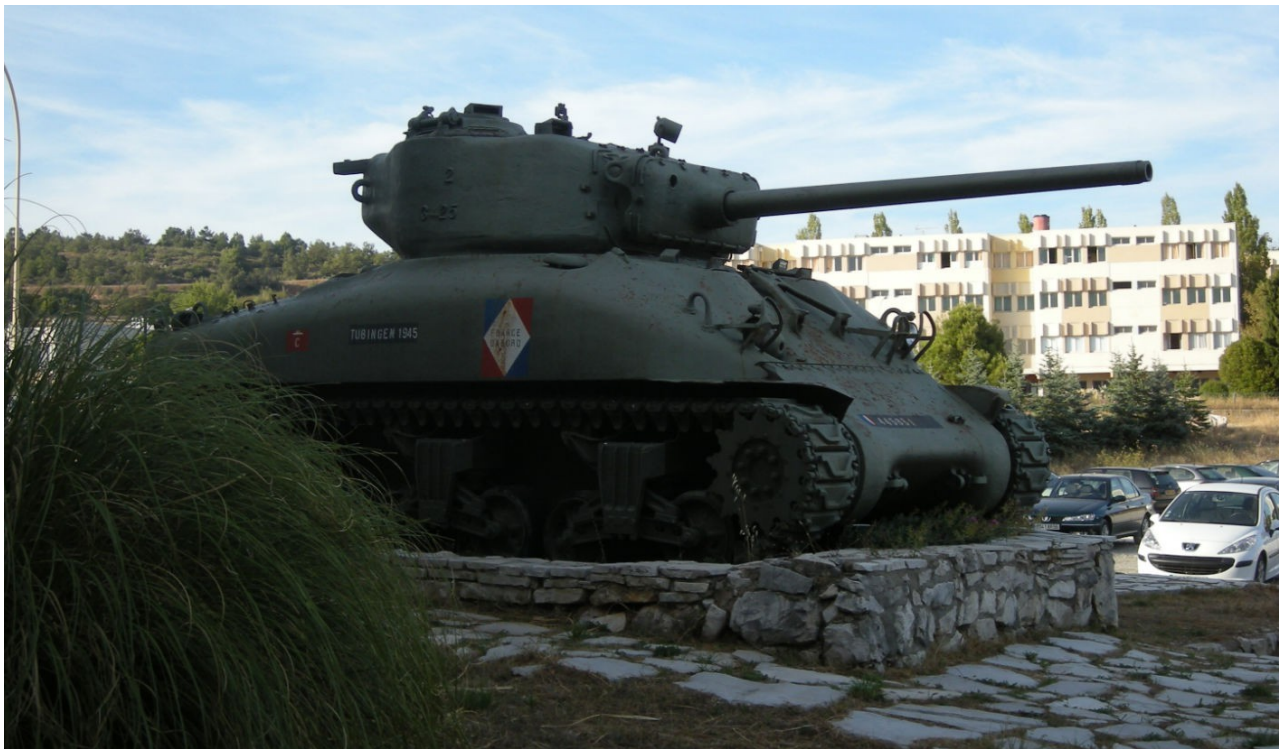
Mehdi Madani - http://the.shadock.free.fr/Tanks_in_France/camp_canjuers/index.html

Serial Number 52192, sequence number 5268, built in September, 1944. This tank has been seen in service with the French army in the 1950s. The reason why some appliqué plates are welded to the hull is unknown, as this modification is normally unnecessary on this model