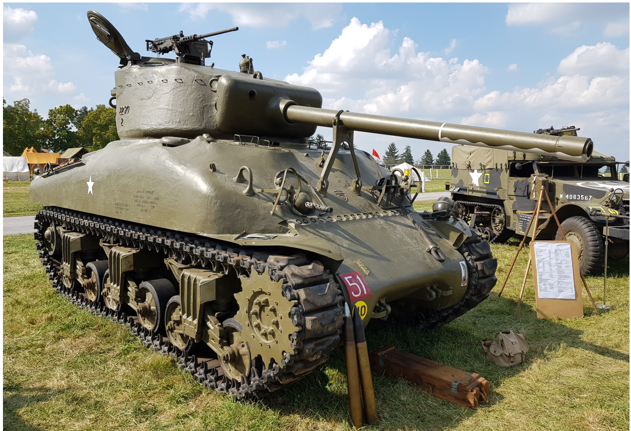
M4A1(76) Sherman – Chengkungling History Museum, Chengkungling (Taiwan)

https://commons.wikimedia.org/wiki/File:M4_Sherman_Tank_Display_in_Chengkungling_20121006a.JPG