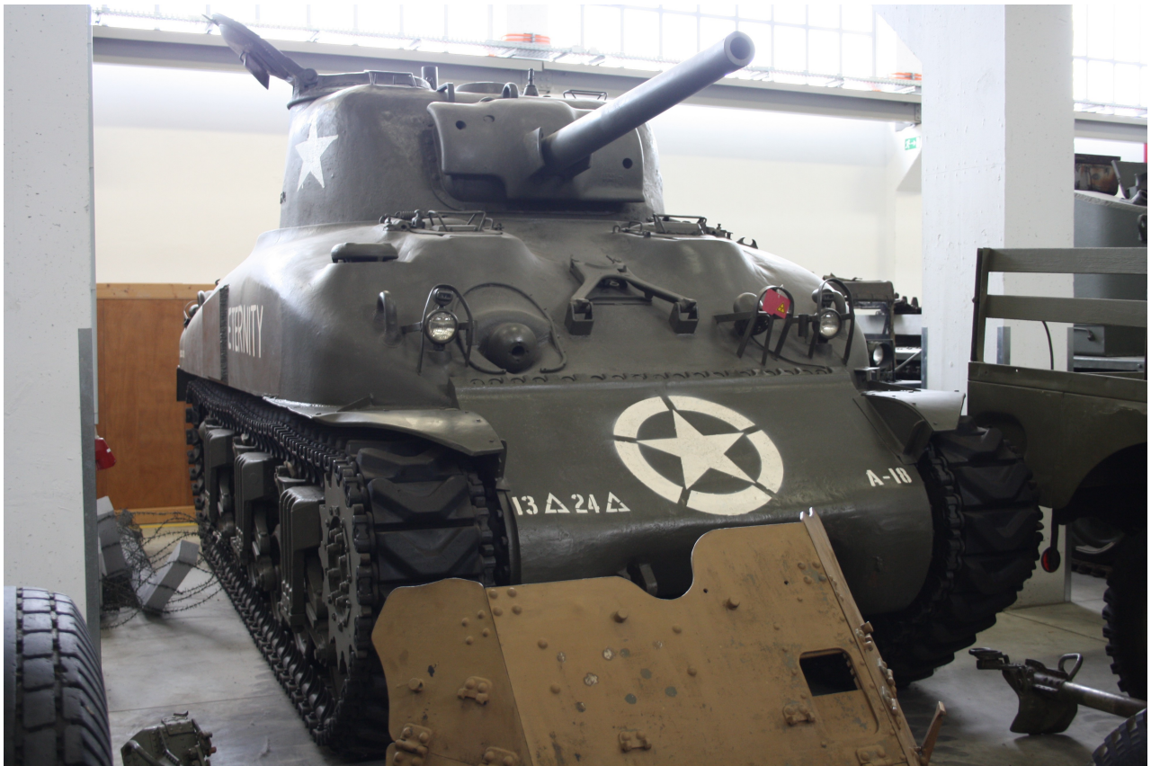
Walter Schwabe, October 2014