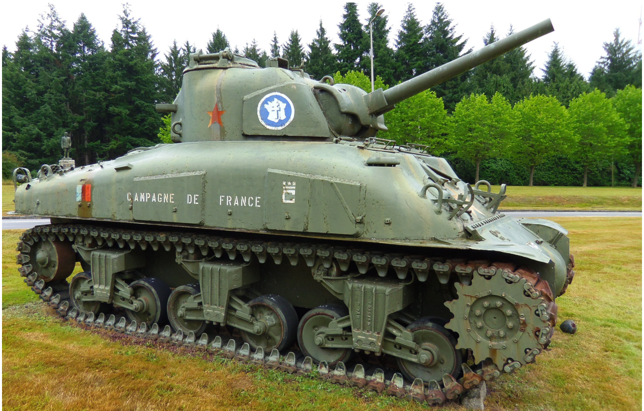
Pierre-Olivier Buan, June 2017 - http://the.shadock.free.fr/Tanks_in_France/sherman_camp_coetquidan/index.html