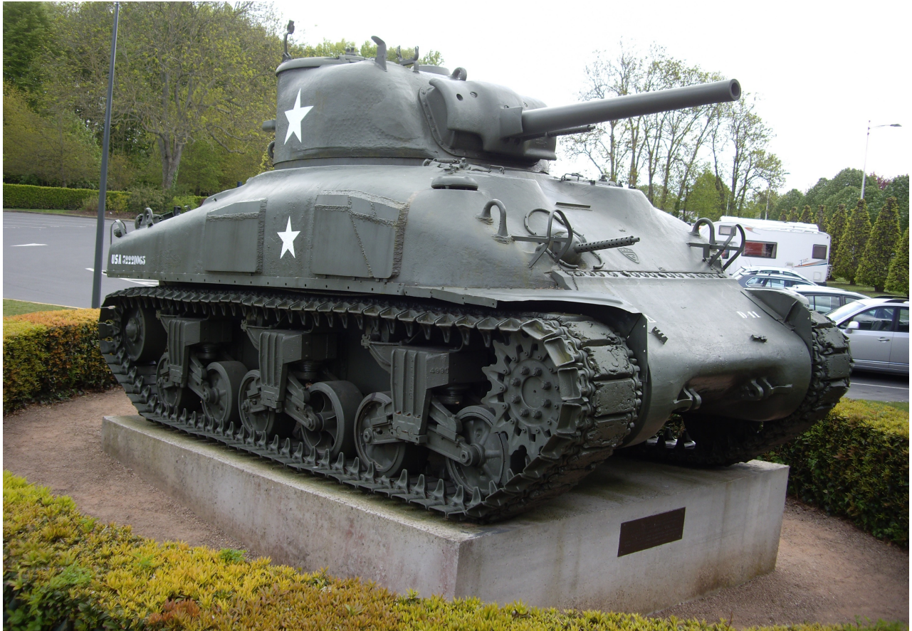
Pierre-Olivier Buan, May 2010 - http://the.shadock.free.fr/Tanks_in_France/sherman_bayeux/index.html