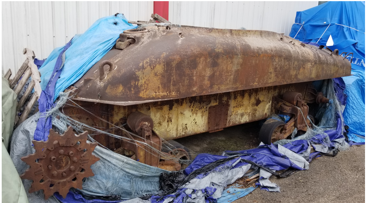
M4A1E9 Sherman – Escola de Sargentos de Logística, Deodoro (Brazil)

https://i1194.photobucket.com/albums/aa371/pmeb/M4A1E9/Imagem_095.jpg.html