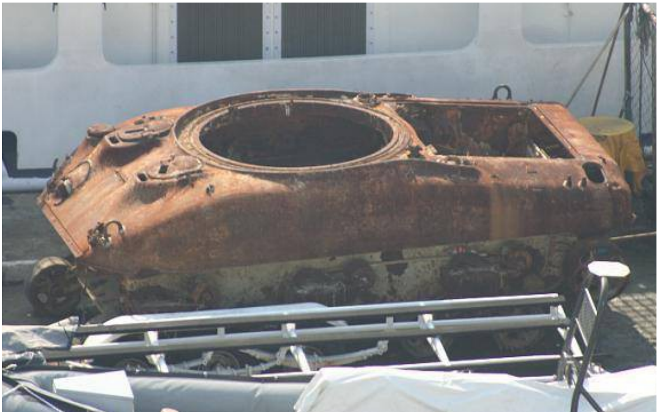
M4A1(75) Sherman hull – – La Courtine Military Camp, near Aubusson (France)

http://preservedtanks.com/Profile.aspx?UniqueID=1730