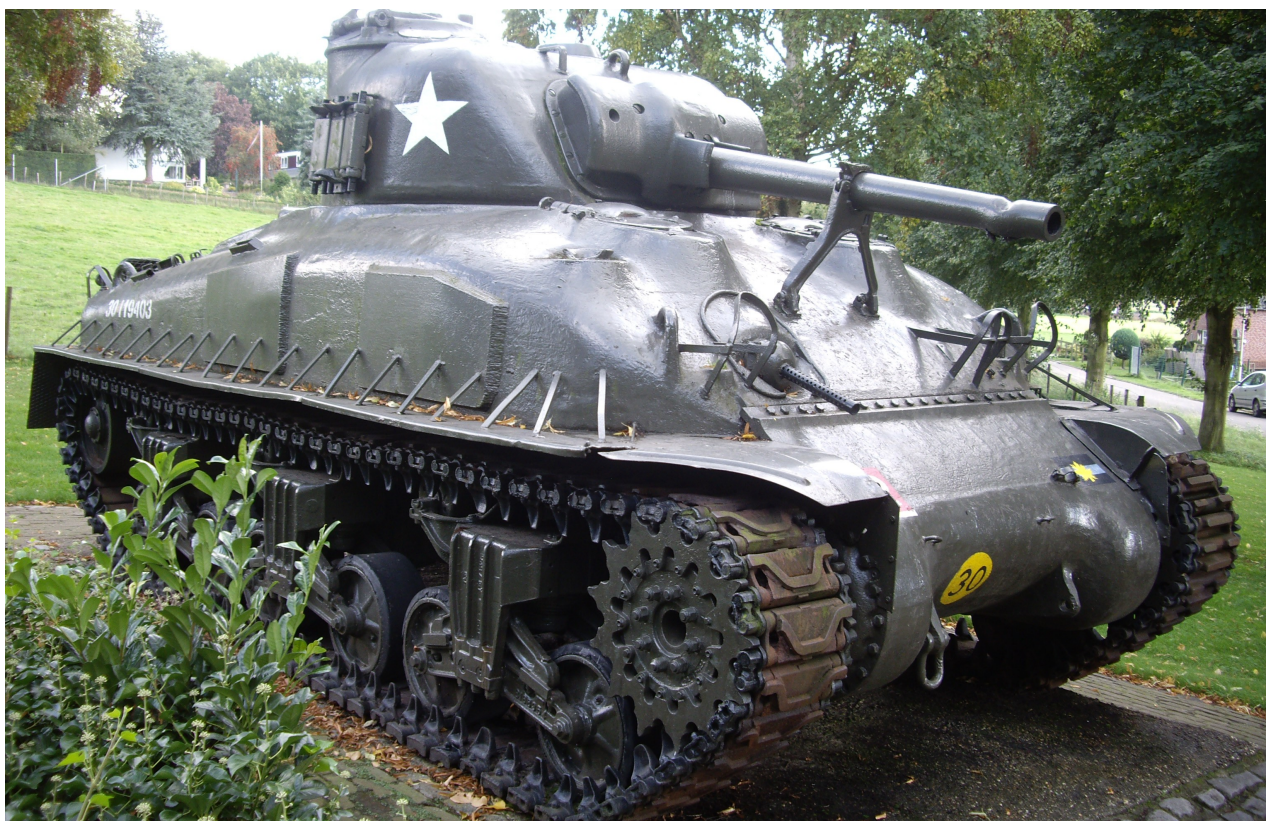
Pierre-Olivier Buan, August 2011 - http://the.shaddock.free.fr/sherman_minutia/walkarounds/sherman_woensdrecht/

Serial Number 3714, built by Pacific Car and Foundry in July, 1943. This tank was used by the army of the Netherlands after WW2. It had the E9 suspension during post-war service, but it was removed during the tank's restoration by "Comité Shermantank Overloon" in 2011