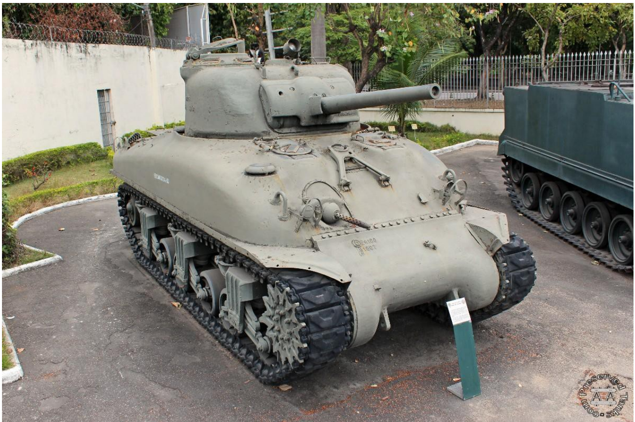
M4A1E9 Sherman – Antique Car Museum Hall, Quilicura (Chile)

Trevor Larkum, September 2011 - http://preservedtanks.com/Profile.aspx?UniqueID=1595