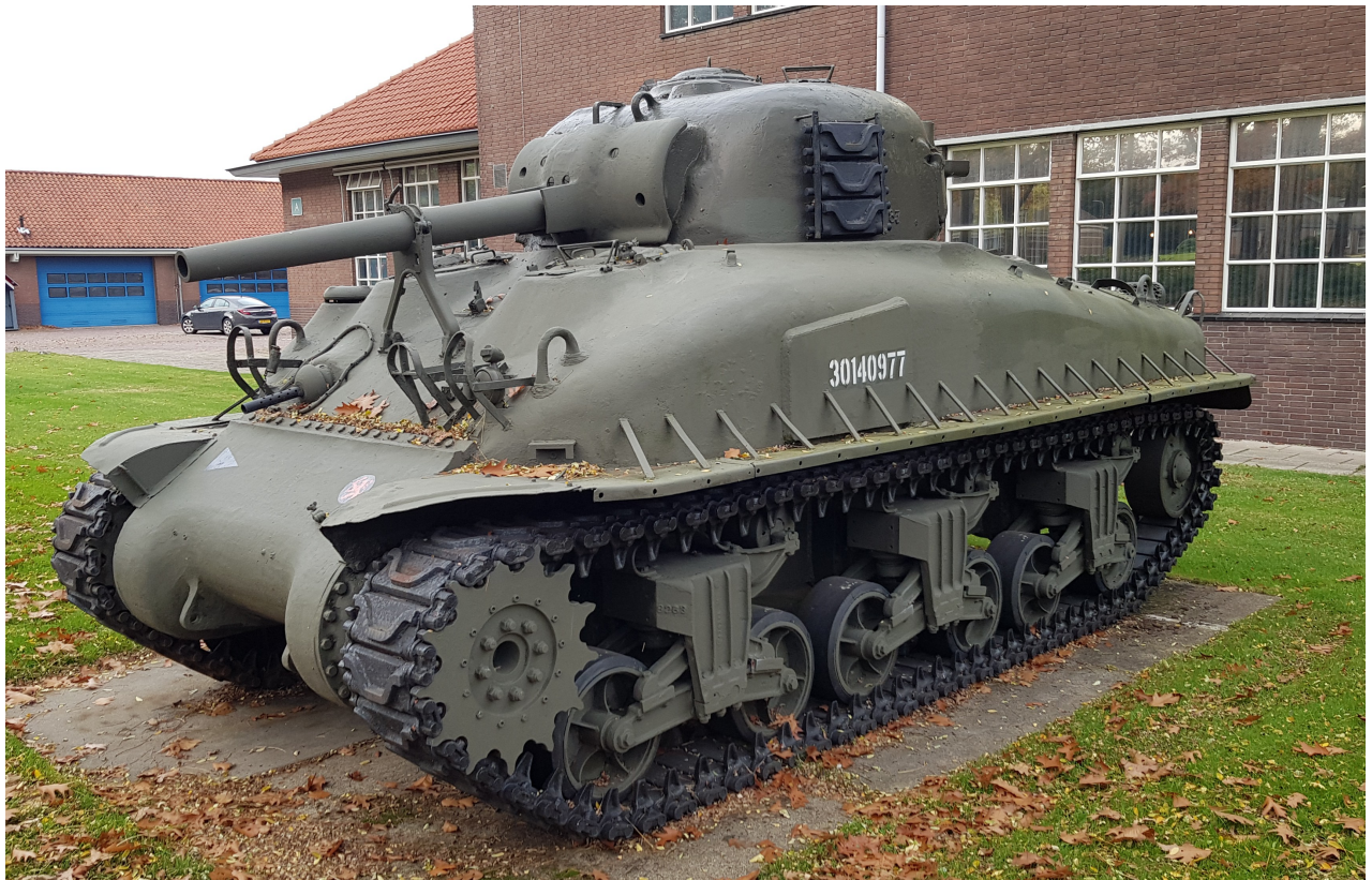
Pierre-Olivier Buan, October 2022