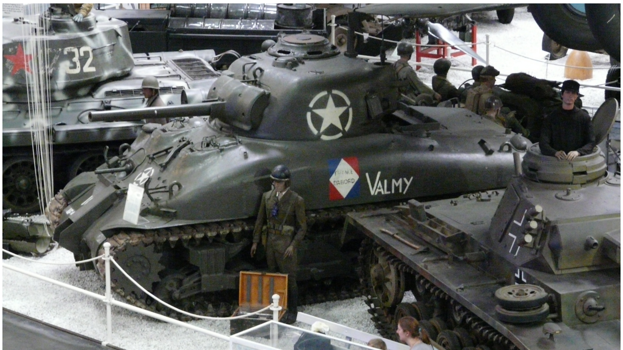
Pierre-Olivier Buan, August 2013

Serial Number 37260, manufactured by Pressed Steel Car in October, 1943