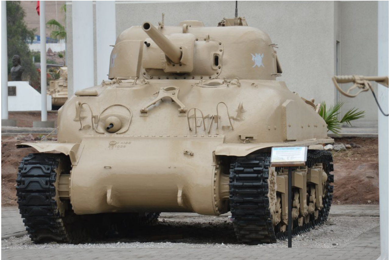
Sylvain Protois, July 2019