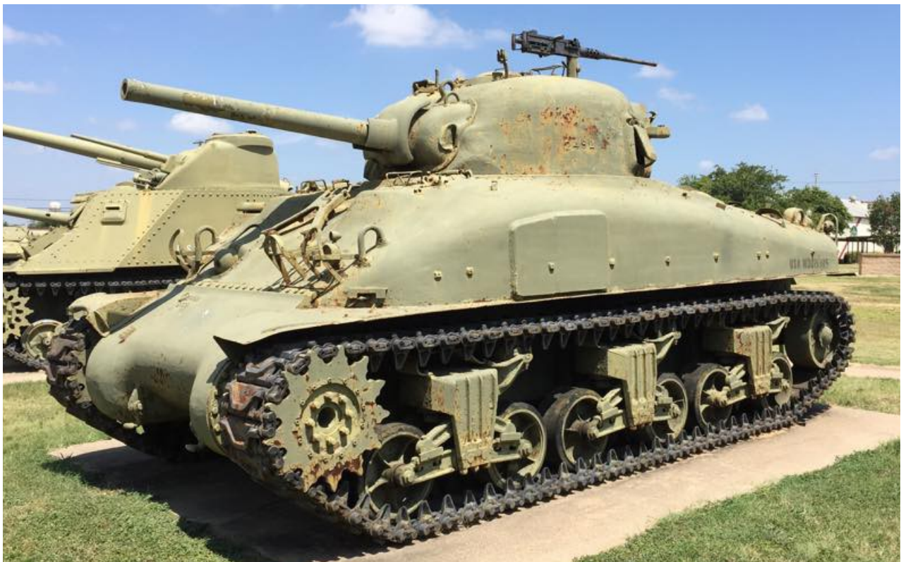
M4A1E9 Sherman – U.S. Army Armor & Cavalry Collection, Fort Benning, GA (USA) Formerly displayed at the Old WWII Barracks Area, US Army Chemical Corps Museum, Ft Leonard Wood, MO (USA). Built by Pacific Car and Foundry

Chris Hughes, July 2015 - https://www.facebook.com/