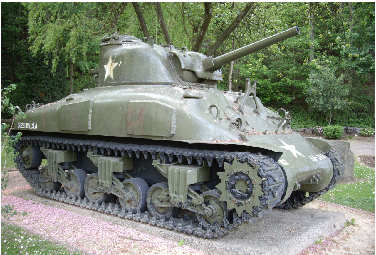
M4A1E9 Sherman – Private collection (Netherlands)

Pierre-Olivier Buan, May 2011 - http://the.shadock.free.fr/Tanks_in_France/sherman_ettelbruck/index.html