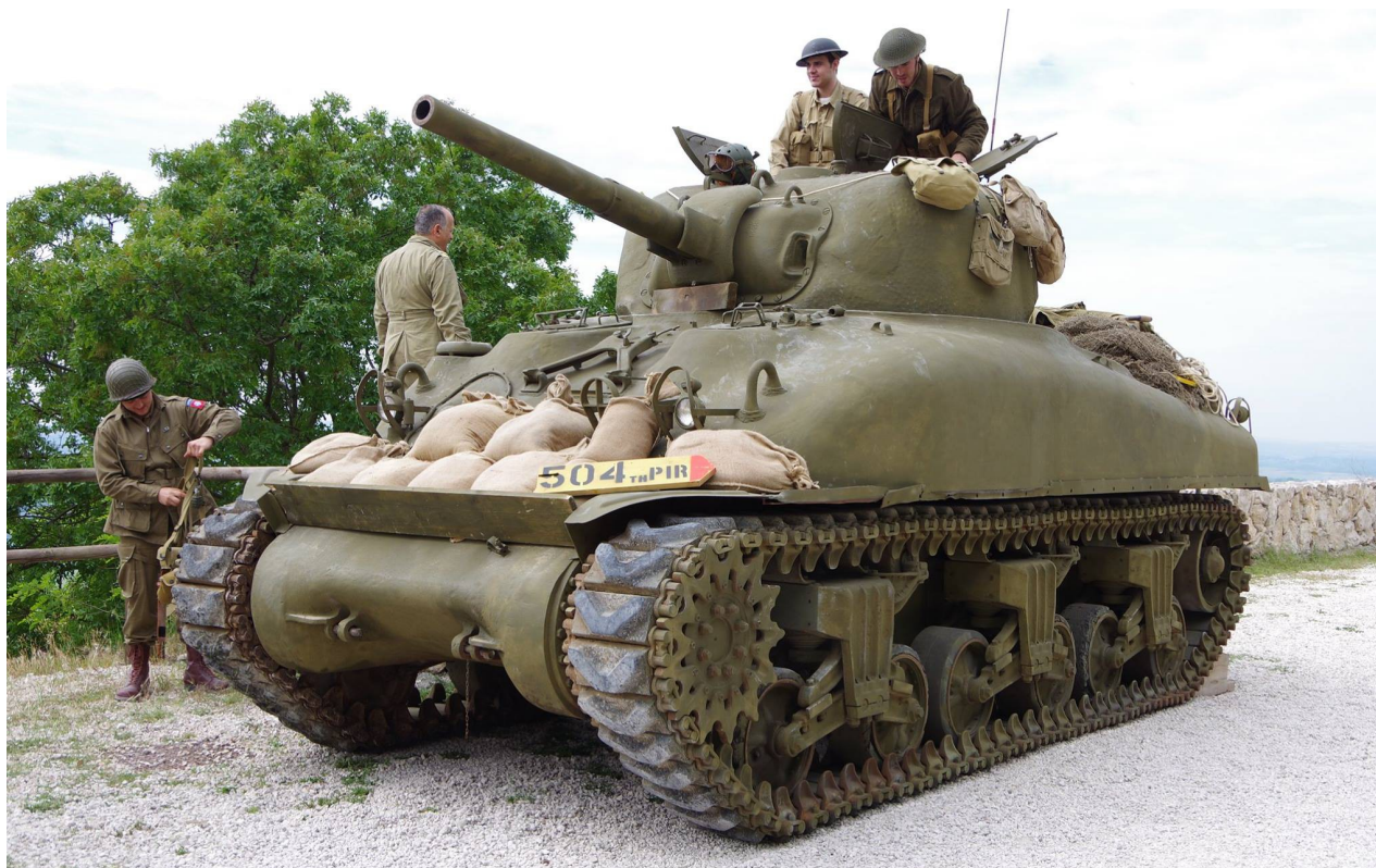
M4A1(75) Sherman – Museum of Landing and Salerno Capital, Salerno Formerly stored at the Caserme "Nacci" e "Zappalà", Lecce (Italy)

https://it.igotoworld.com/en/poi_object/316561_museum-landing-salerno-capital.htm