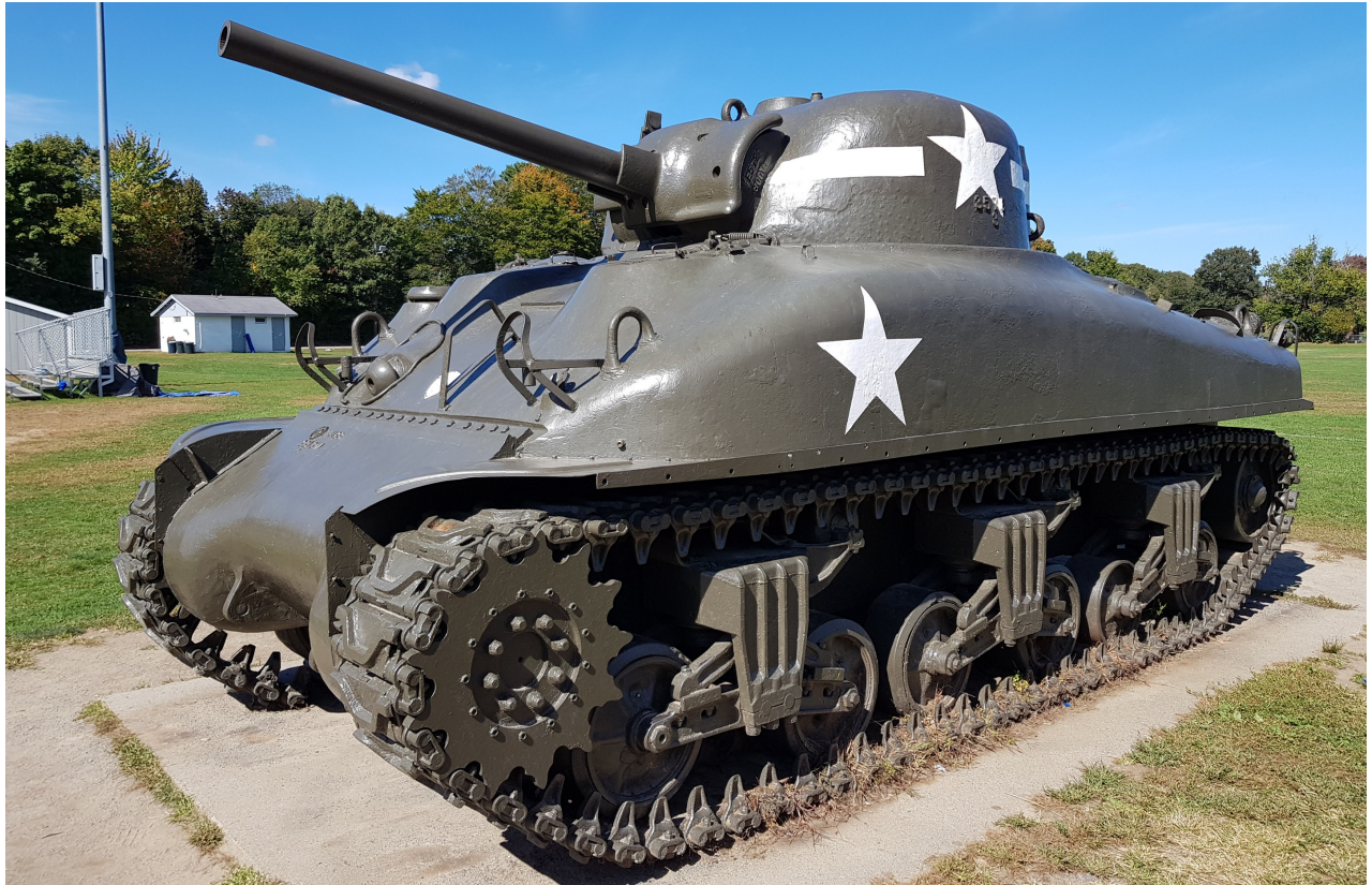
Pierre-Olivier Buan, September 2019