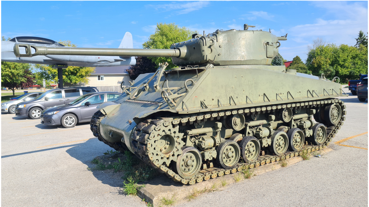
Pierre-Olivier Buan, September 2024