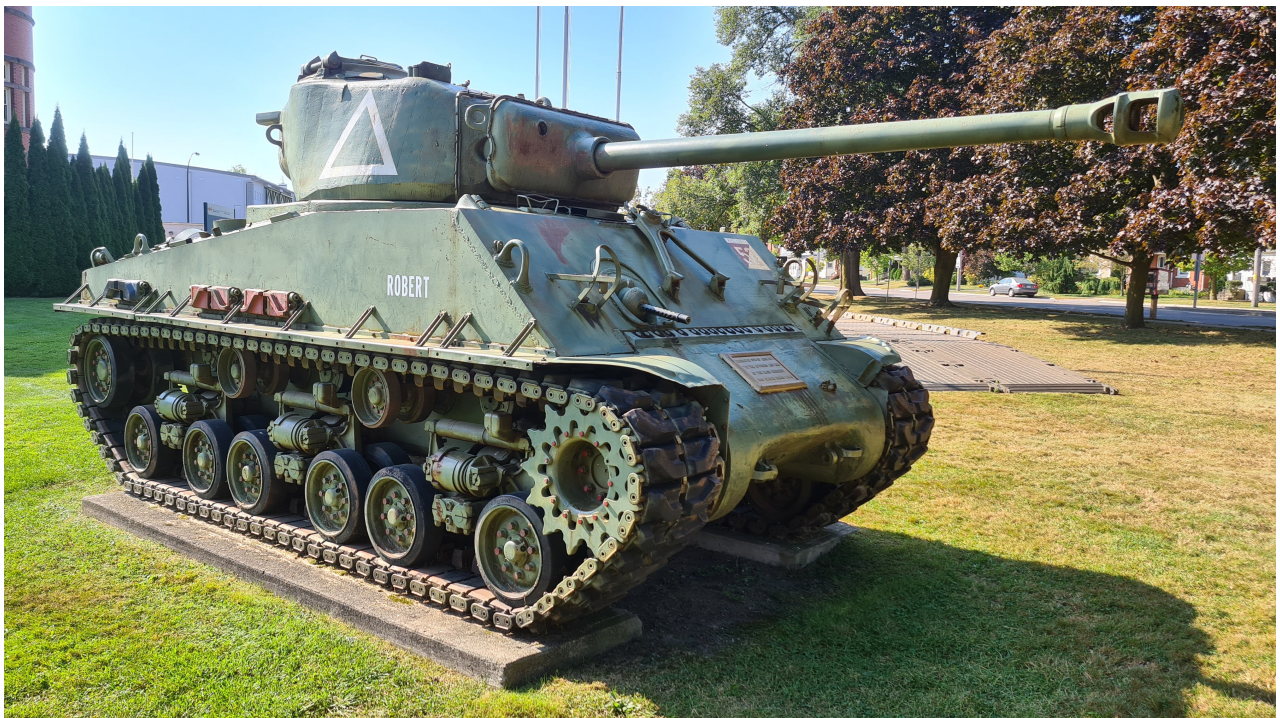
Pierre-Olivier Buan, September 2024