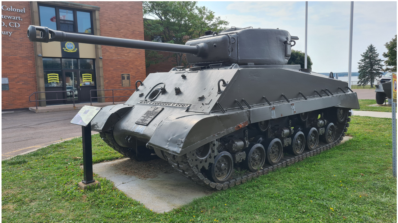
Pierre-Olivier Buan, September 2024