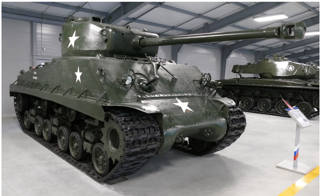
M4A2(76) HVSS – Bovington Tank Museum (UK) – running condition Serial Number 65016, built by Fisher in March, 1945. Used in the film "Fury"

Yuri Pasholok, October 2021 - https://www.facebook.com/100006243103648/posts/2976136859271055/