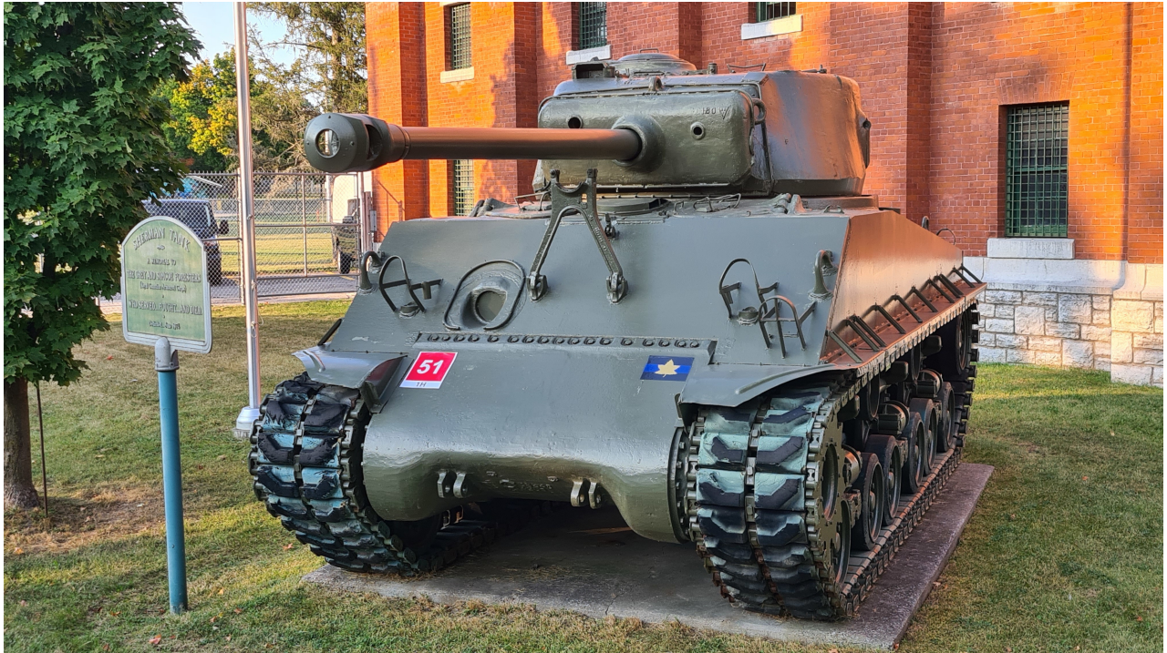
Pierre-Olivier Buan, September 2024