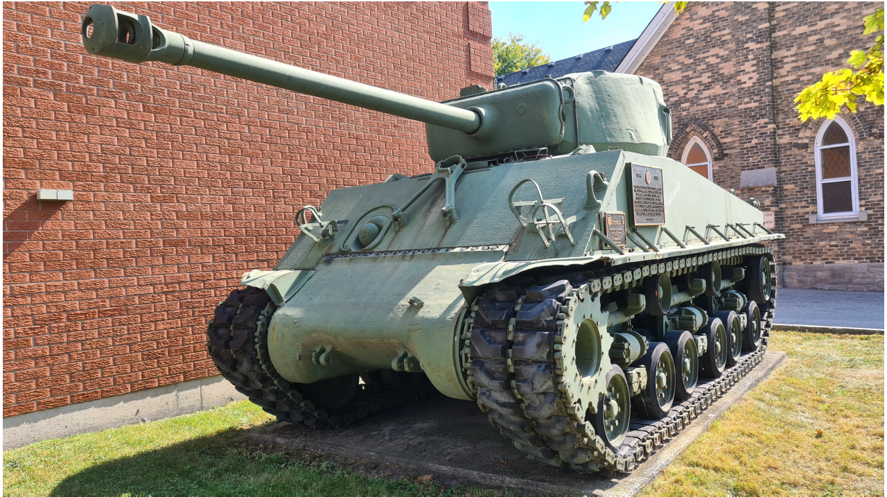
Pierre-Olivier Buan, September 2024