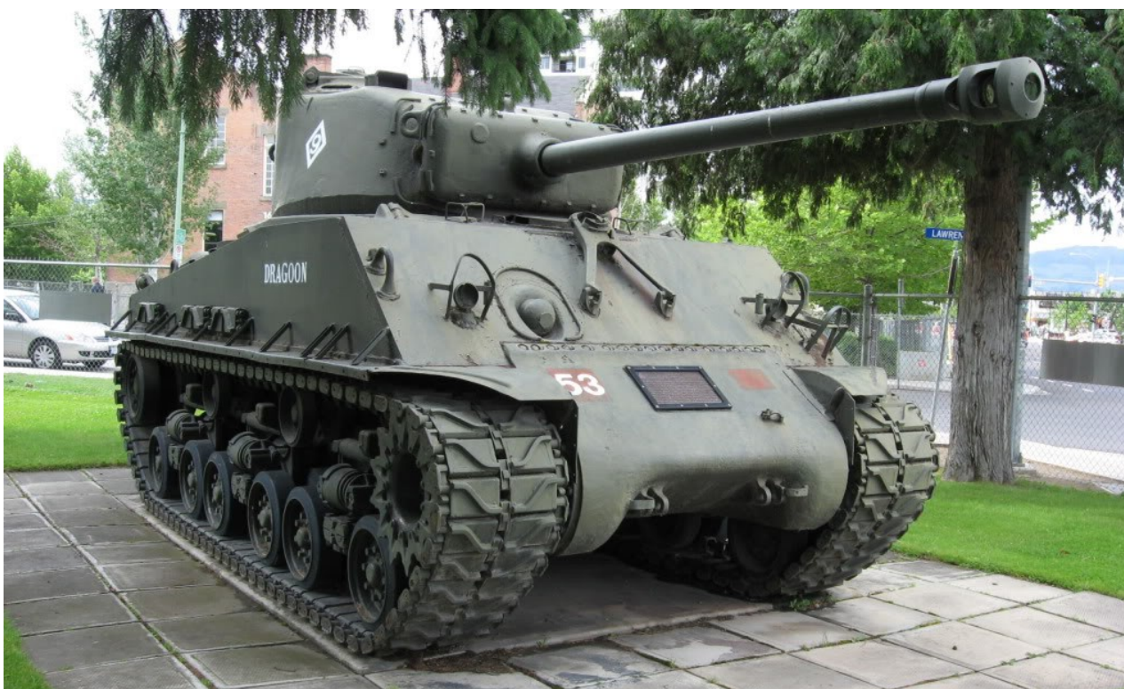
Alf Adams, 2007 - http://s698.photobucket.com/