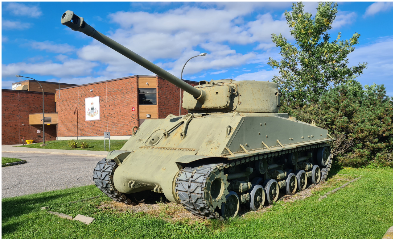
Pierre-Olivier Buan, September 2024

Serial Number 65040, built by Fisher in March, 1945