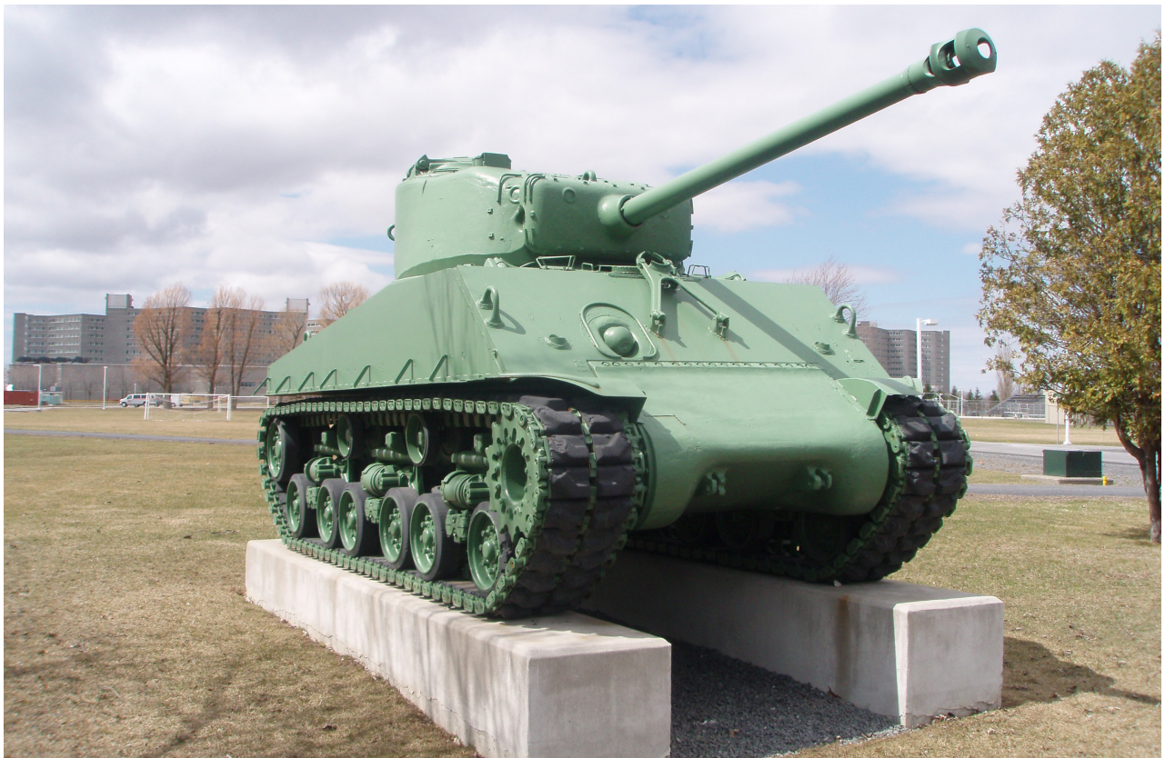
M4A2(76) HVSS – CMR, Saint Jean, Quebec (Canada) Serial Number 65050, built by Fisher in March, 1945