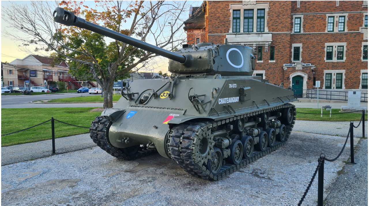
Pierre-Olivier Buan, September 2024