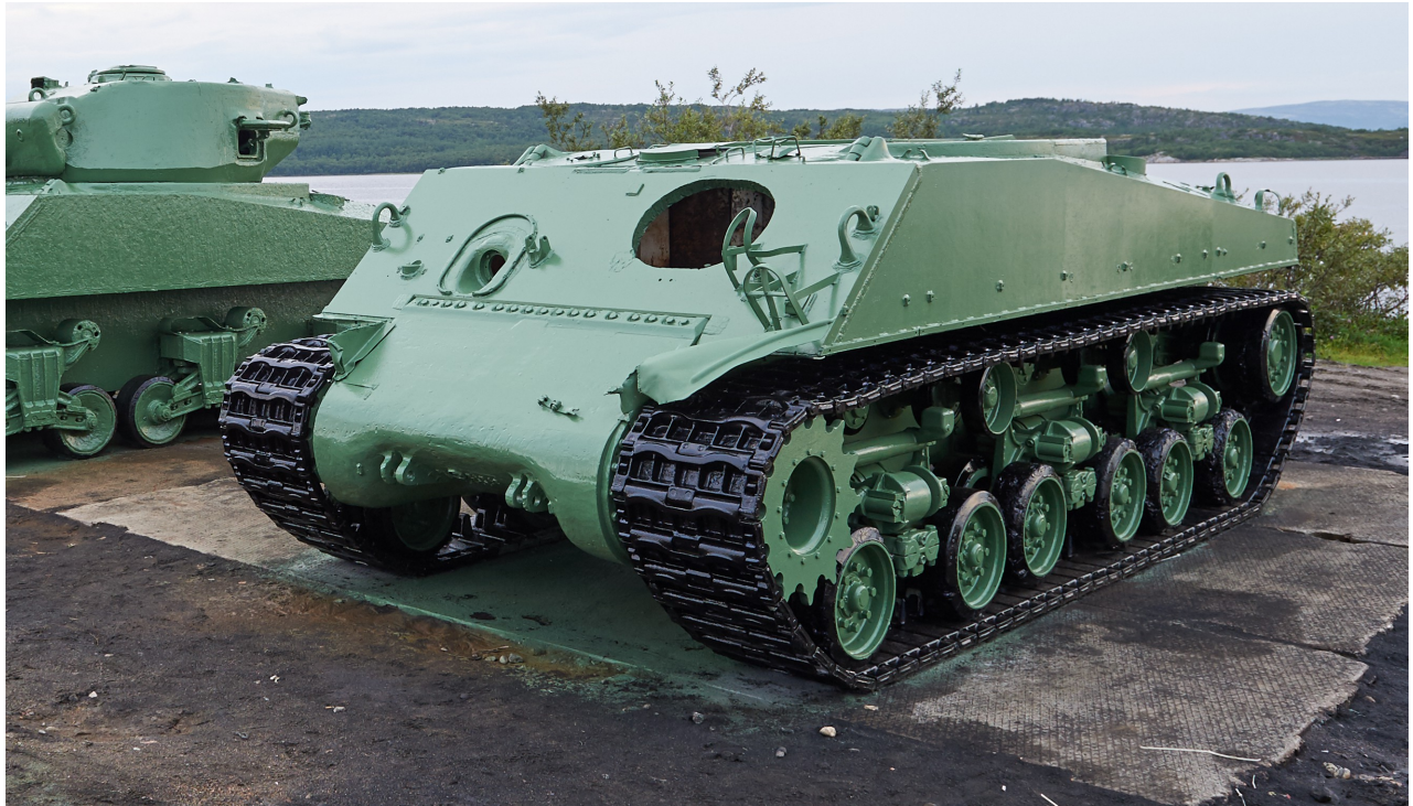
Dmitry Ukryukov, 2015

Serial Number 64669, built by Fisher in February, 1945 ("Dmitry")