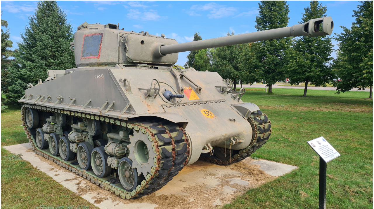
Pierre-Olivier Buan, September 2024