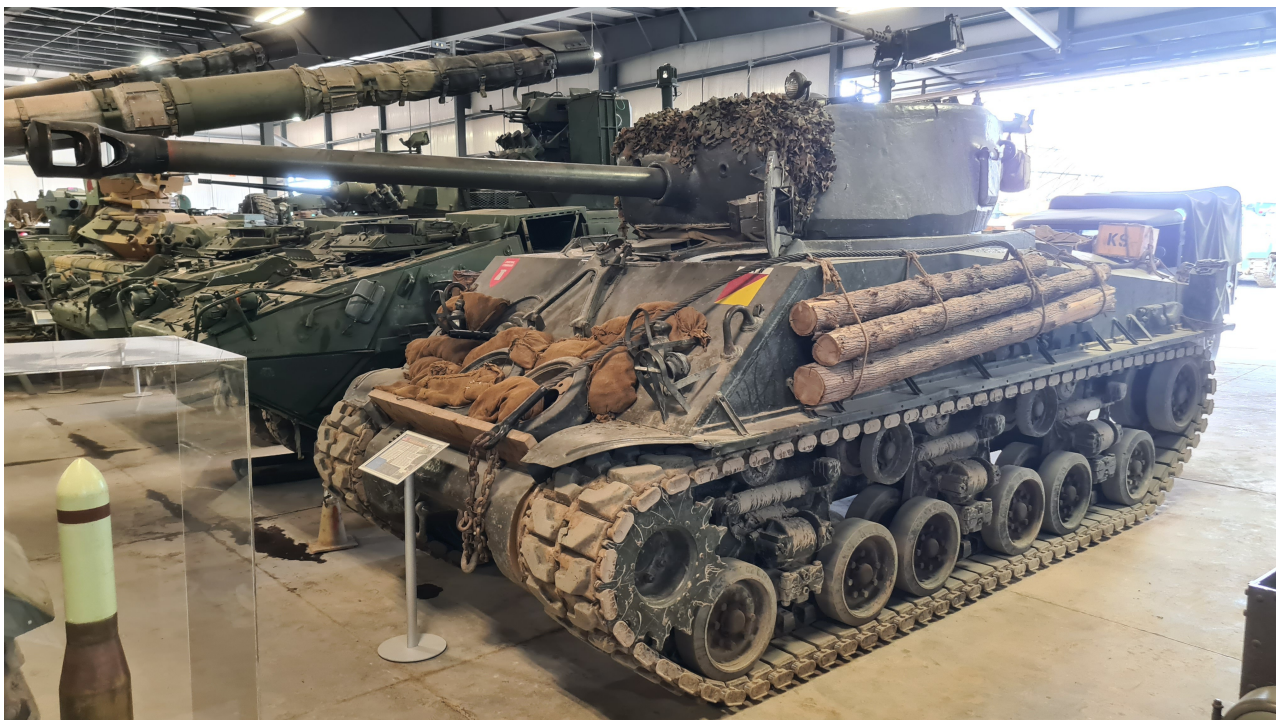
Pierre-Olivier Buan, September 2024