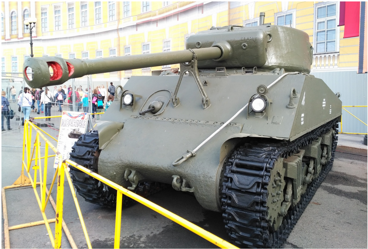
Vitaly Kuzmin, May 2018 - https://www.facebook.com/