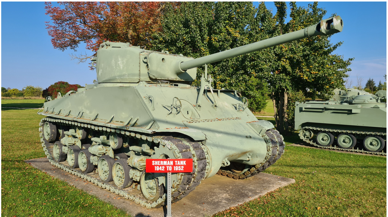
Pierre-Olivier Buan, September 2024

Serial Number 69199, built by Fisher in April, 1945 (Canada AFVs register)