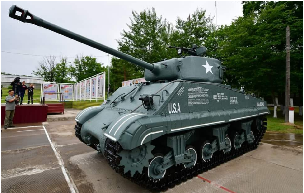
M4A2(76) VVSS – Museum of Arms and Air Force, Ryazan, Ryazan Oblast (Russia) Serial Number 64415, built by Fisher in December, 1944. This tank was recovered from the USS Thomas Donaldson ship in July, 2017

https://www.facebook.com/Shermanica/photos/a.1920606371546230.1073741828.1819443004995901/2108970819376450/