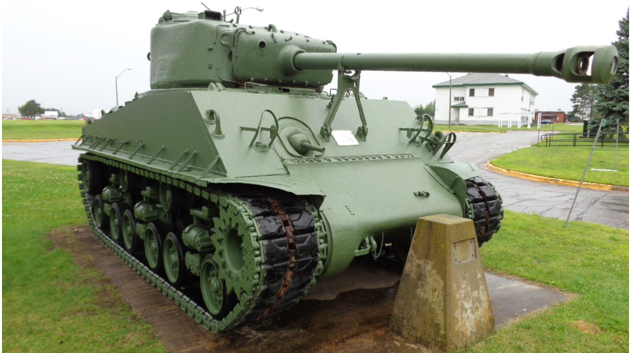
Jim Goetz, April 2013

Serial Number 65241, built by Fisher in April, 1945. This tank is a different one from SN 69241 , listed below. Previously displayed on Paquette road