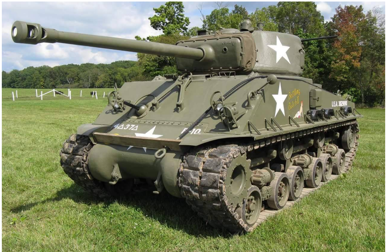
M4A2(76) HVSS – Military Historical Museum, Lenino-Snegiri (Russia) Serial Number 64643, built by Fisher in February, 1945

http://www.flickr.com/photos/72649331@N00/sets/72157629648508123/with/6861674780/