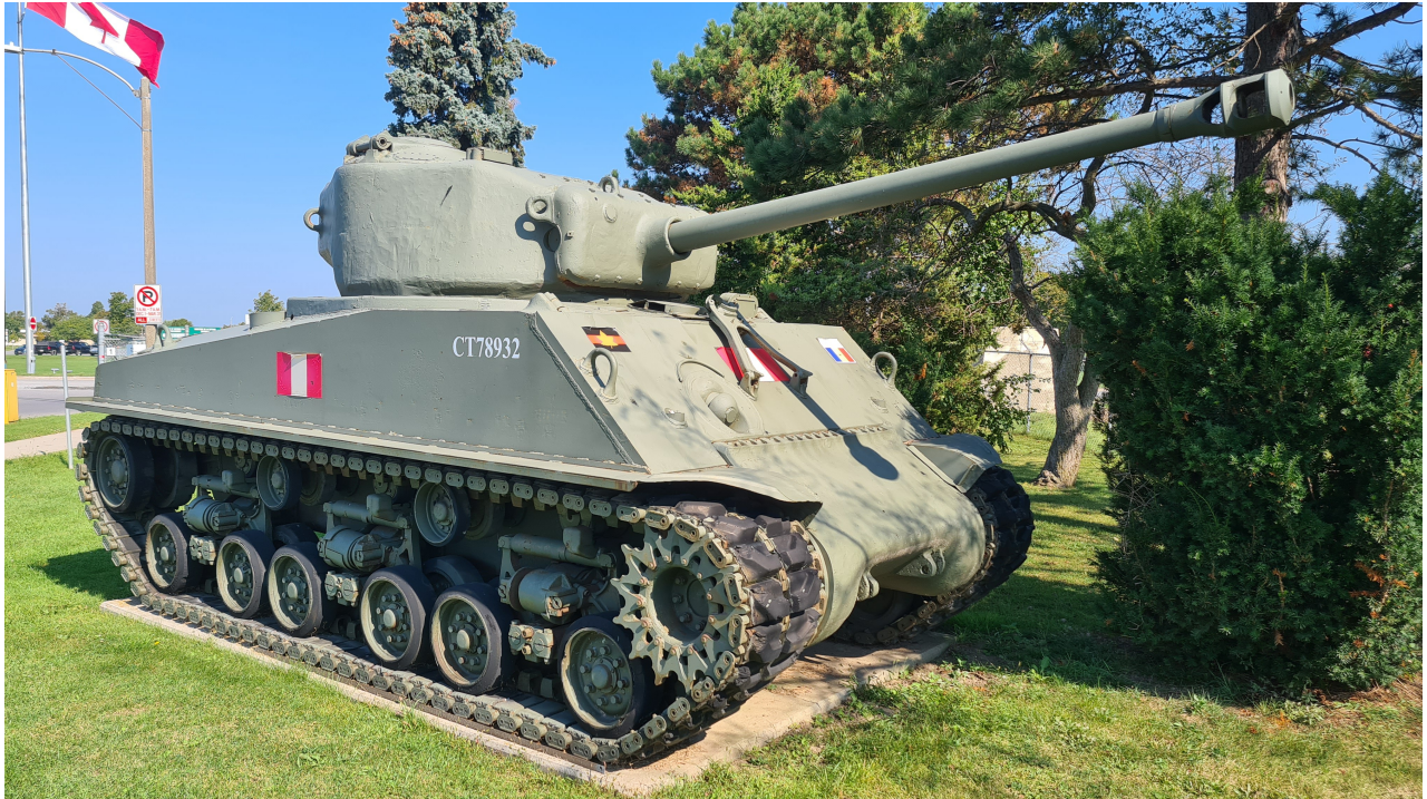
Pierre-Olivier Buan, September 2024