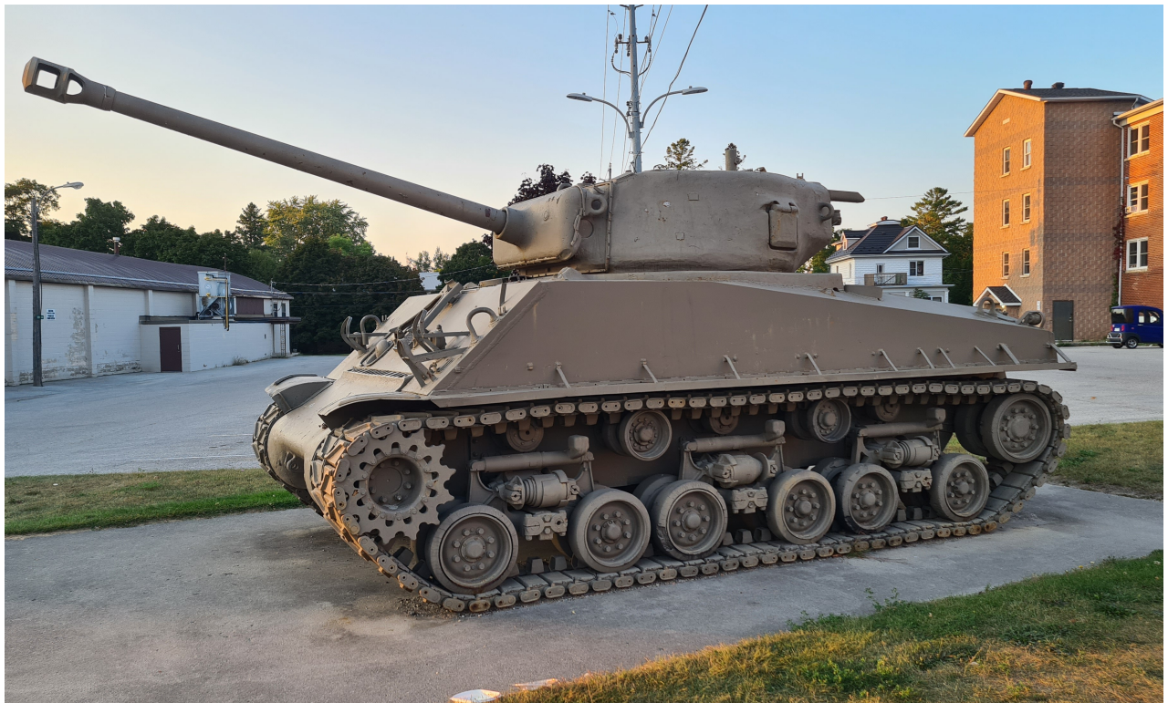
Pierre-Olivier Buan, September 2024