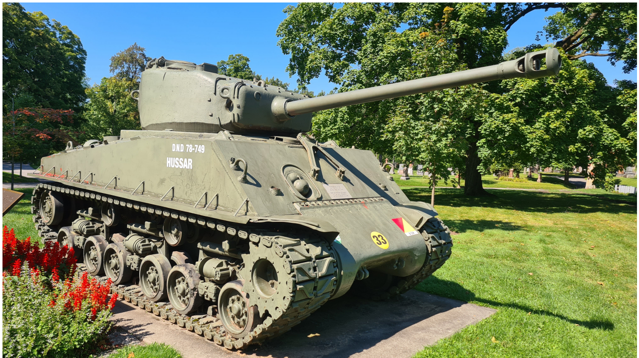
Pierre-Olivier Buan, September 2024