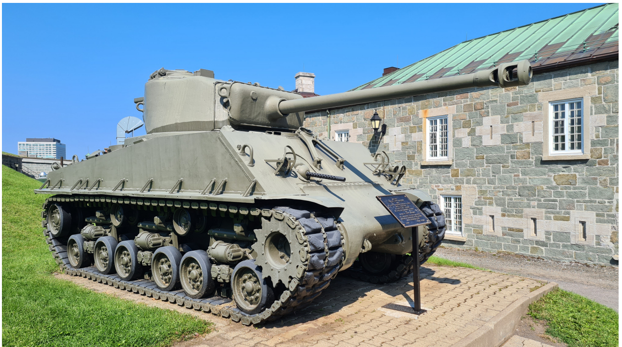
Pierre-Olivier Buan, September 2024