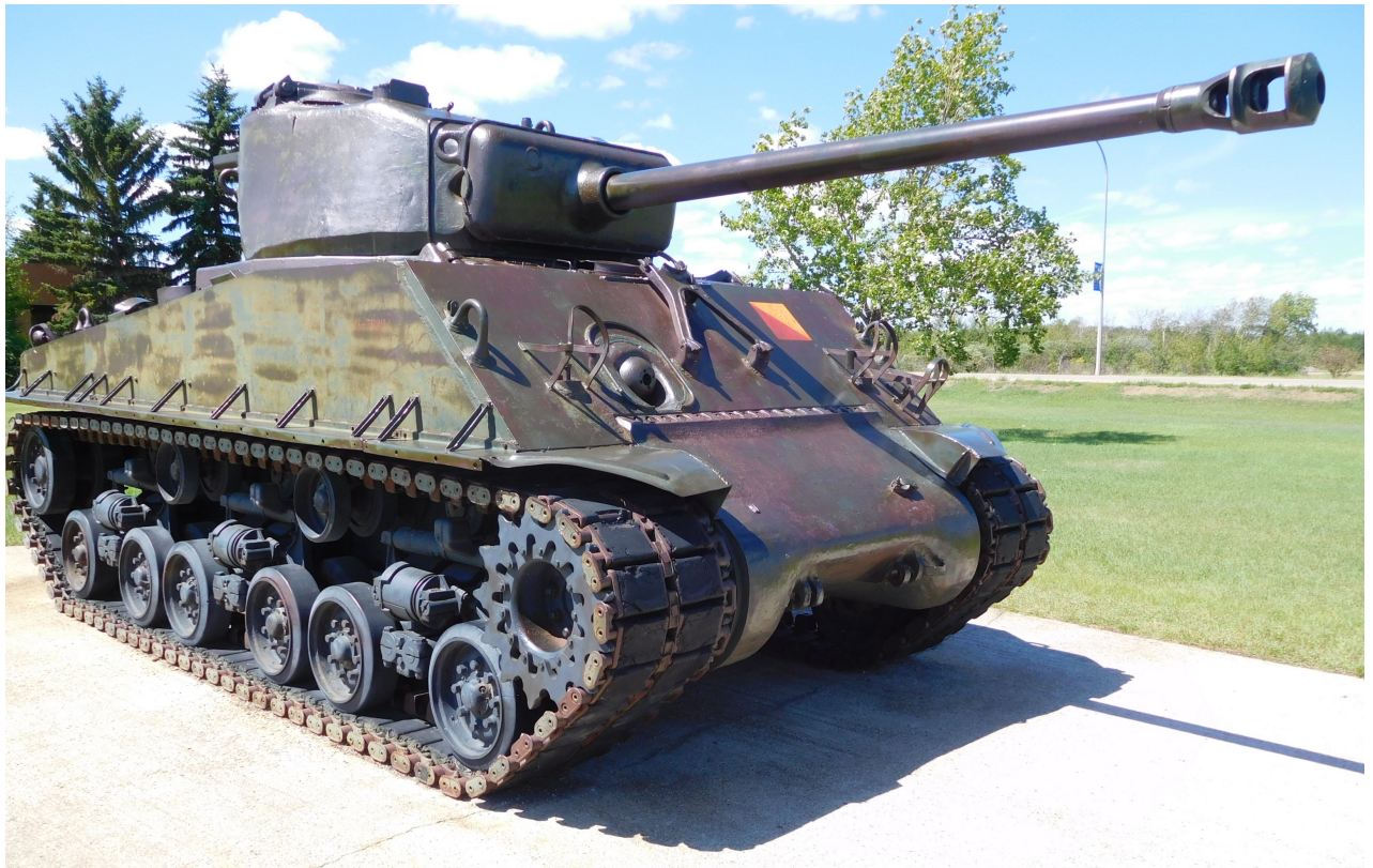
M4A2(76) HVSS "Catherine" – CFB Wainwright, Alberta (Canada) Serial Number 64965, built by Fisher in March, 1945