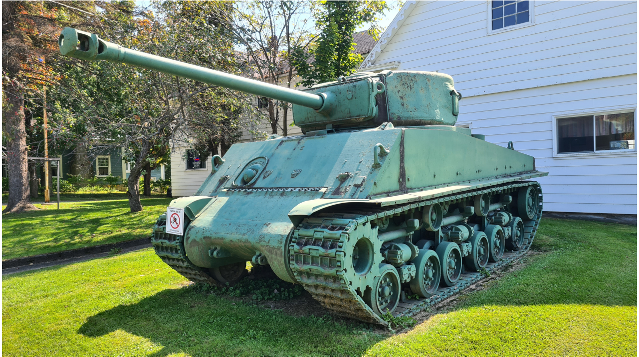
Pierre-Olivier Buan, September 2024