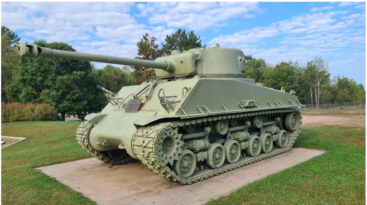
Pierre-Olivier Buan, September 2024