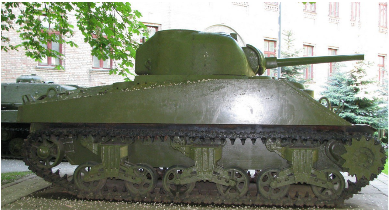
Viktor Bogatov - http://www.dishmodels.ru/wshow.htm?mode=P&vmode=T&p=2195&id=94873&tp=w

Very early M4A2 with Direct Vision and 11 bolts on the rear hull plate, built by Pullman Standard in early/mid 1942. We suspect that the hull was possibly one of the 90 M4A2s received by the Brits as part of the Emergency Shipment in Egypt, just before the Nov. 1942 El-Alamein Battle. The tank has been extensively upgraded/remanufactured at some point after 1942. It has received appliqué armor, a later "no pistol port" turret and a Chrysler-built 3-piece differential housing. It may have been built with M3 bogies, or if M4 bogies, much earlier than the ones on there now with the 1943 casting dates. It also has typical Middle-East Theater modifications, like the turret sun shield fitting and wire racks on the rear engine deck. The gun travel lock was "locally" fabricated, and a nice job at that. There is yet no evidence that standard gun travel lock kits were made available for field modification. This tank most probably came from British Middle-East stocks and served with the Egyptian army in the 1950s and put in the museum after service withdrawal (Joe DeMarco and Leife Hulbert)