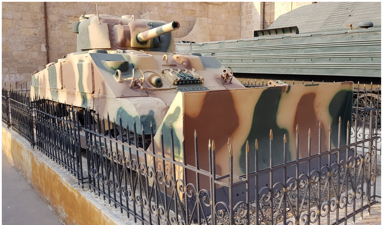
Pierre-Olivier Buan, November 2019

Most probably built by Pullman Standard, seems to come from a fire range. Has been cosmetically restored with a 76mm T23 turret