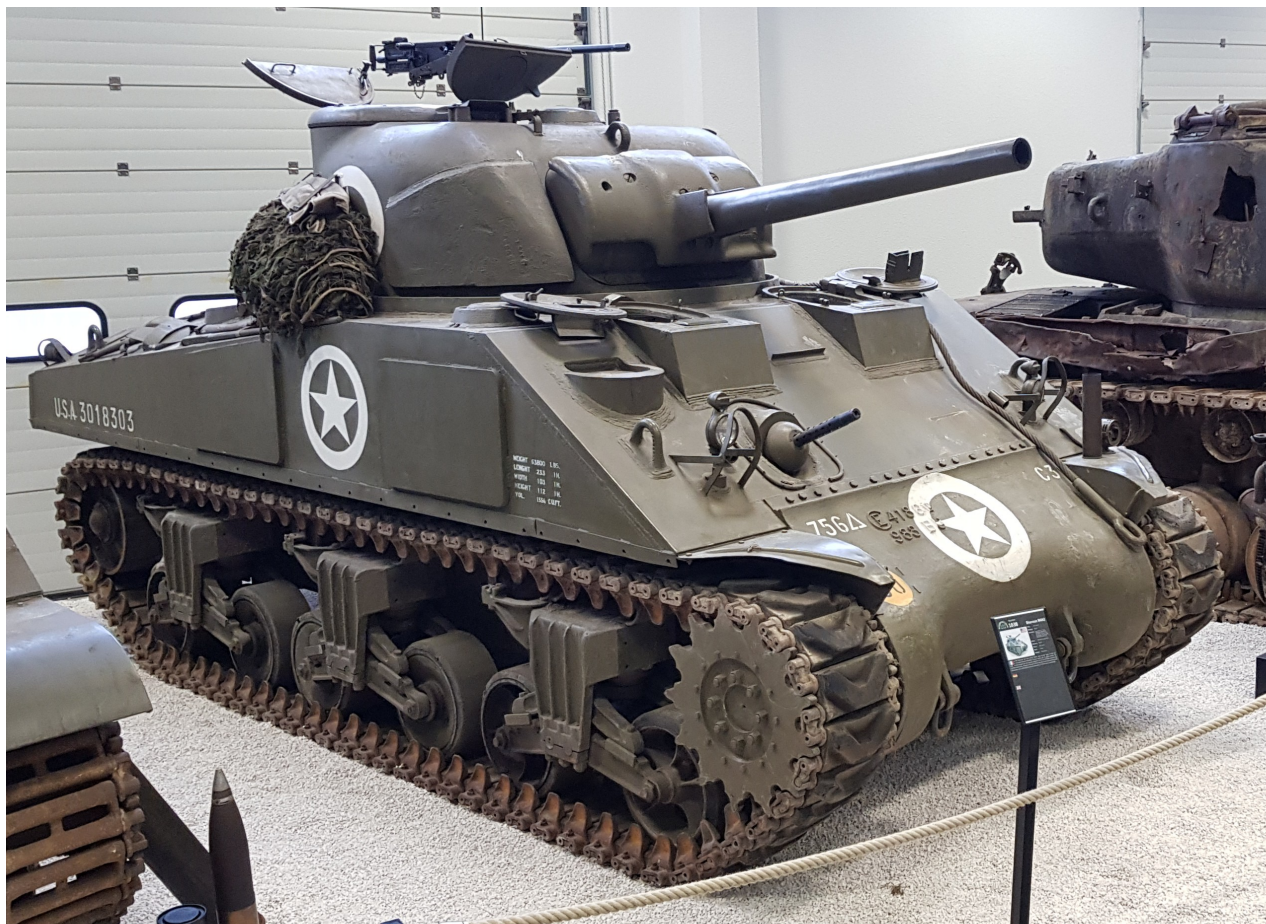
Pierre-Olivier Buan, December 2018