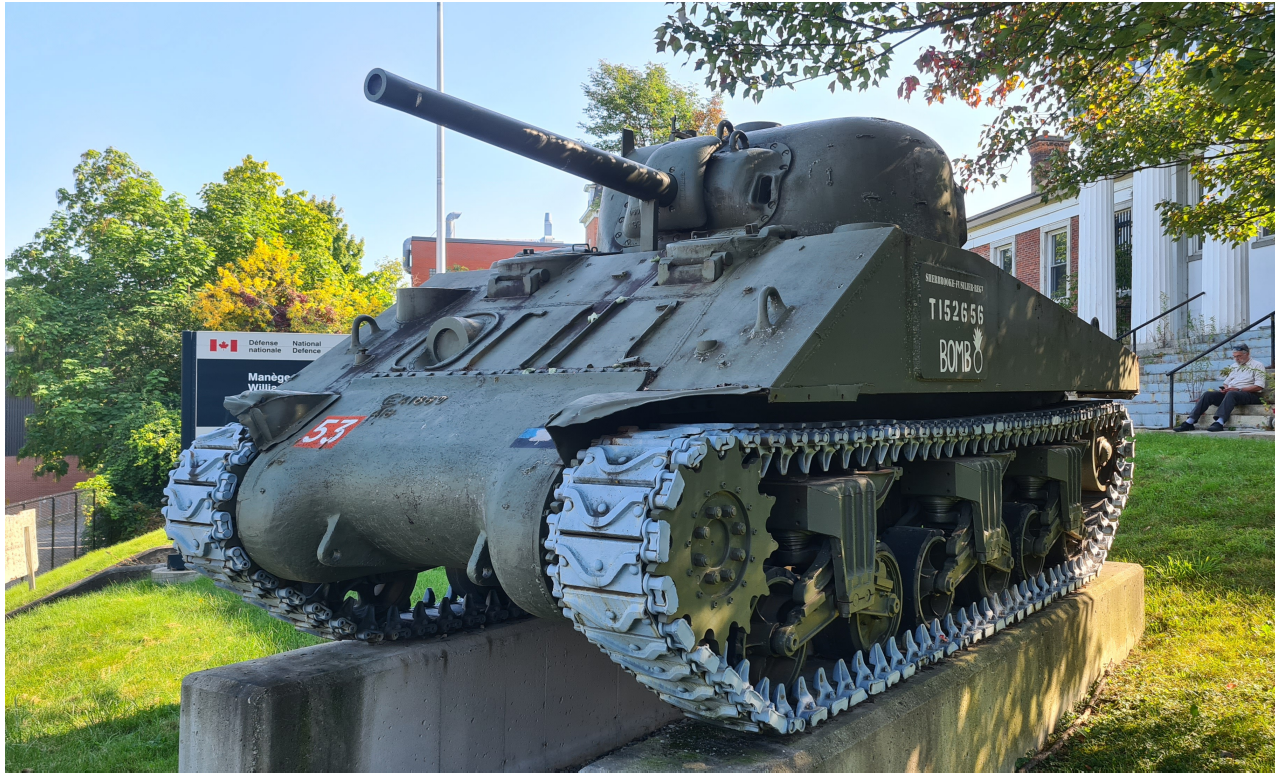
Pierre-Olivier Buan, September 2024