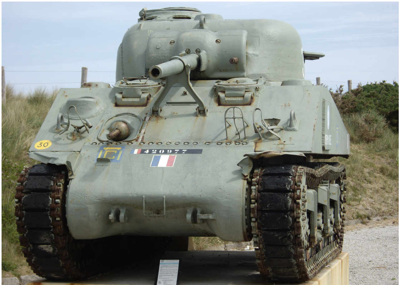
Pierre-Olivier Buan, June 2010 - http://the.shadock.free.fr/Tanks_in_France/sherman_varreville/index.html