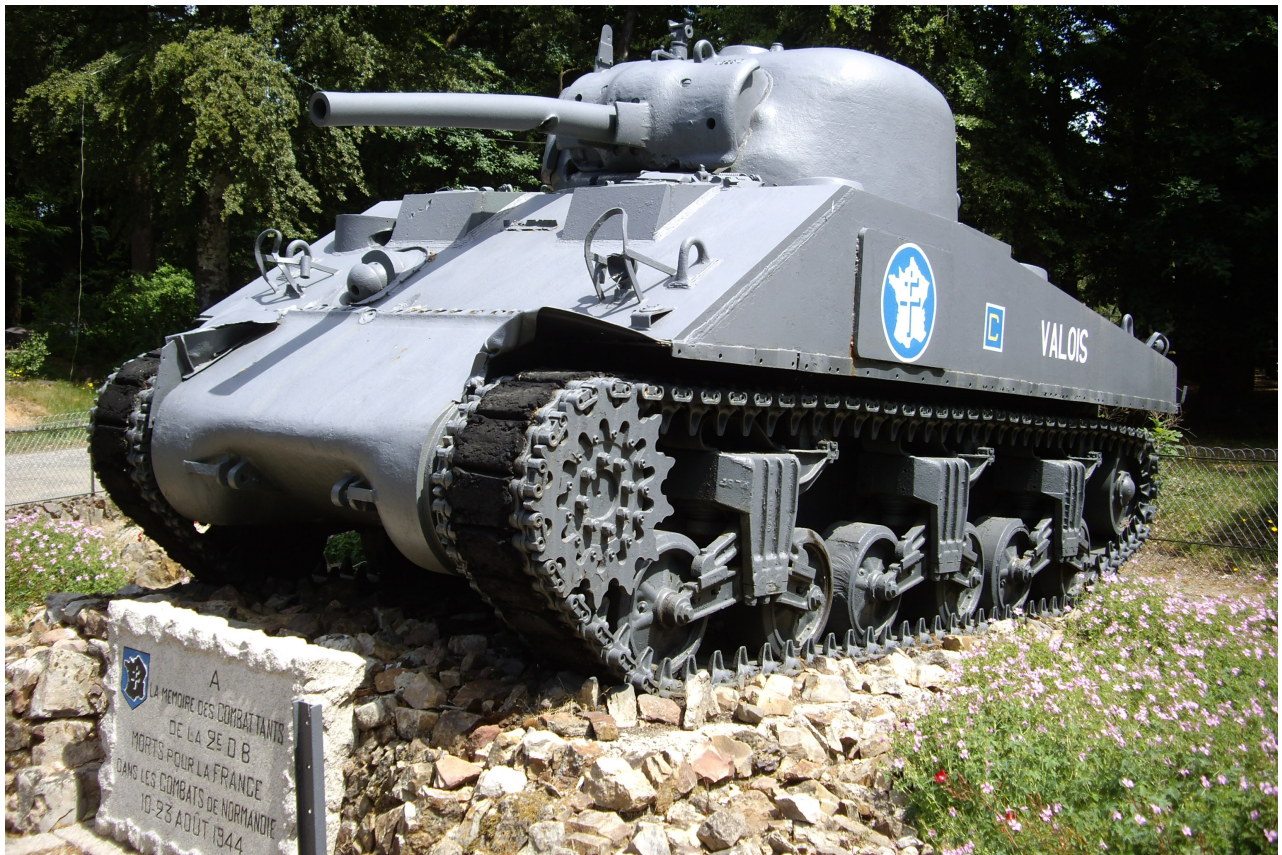
Pierre-Olivier Buan, June 2011 - http://the.shadock.free.fr/Tanks_in_France/sherman_medavy/index.html