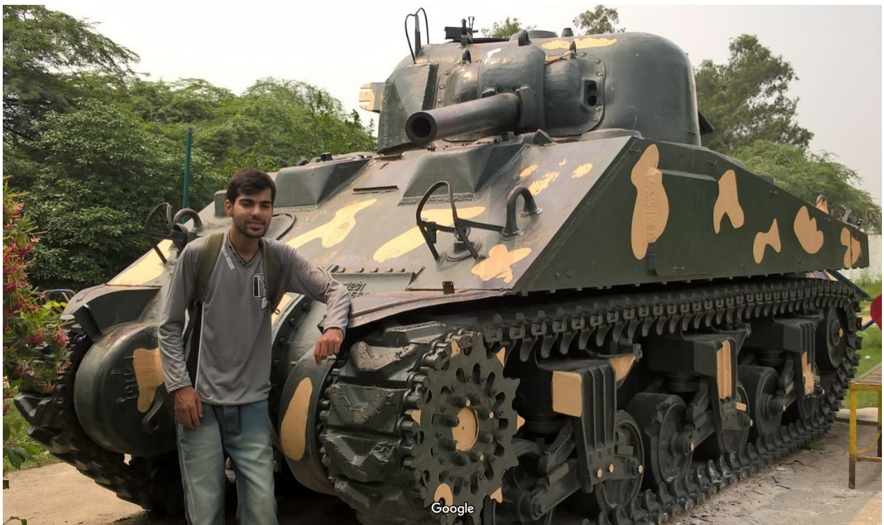
M4A2(75) Sherman – Battle of Longewala War Memorial, Longewala (India) Built by Fisher