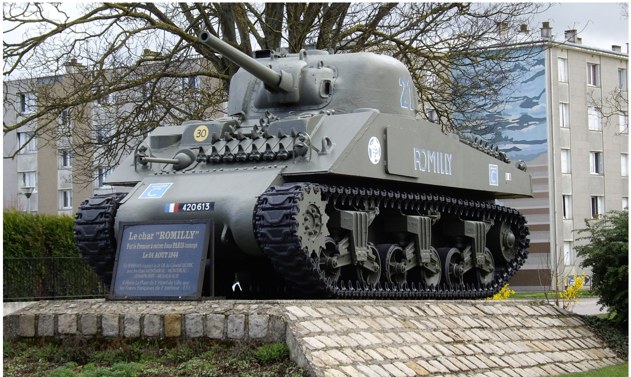
Pierre-Olivier Buan, March 2010 - http://the.shadock.free.fr/Tanks_in_France/sherman_romilly/index.html