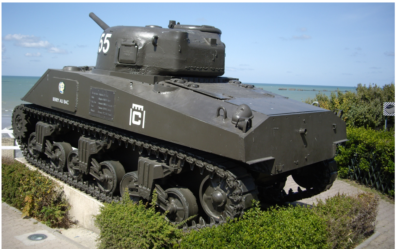
Pierre-Olivier Buan, May 2010 - http://the.shadock.free.fr/Tanks_in_France/sherman_arromanches/index.html

Early M4A2 with Direct Vision and 11 bolts on the rear hull plate. Most probably built by Federal Machine and Welder