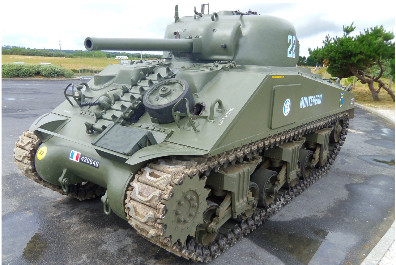
Pierre-Olivier Buan, August 2014 - http://the.shadock.free.fr/Tanks_in_France/m4a2_monterneau_balmoralgreen/index.html

Serial Number 26830, built by Fisher in July, 1943. Original tank from the 501st Tank Regiment, 2nd French Armored Division, knocked out here on 15 August 1944 (France AFVs register)