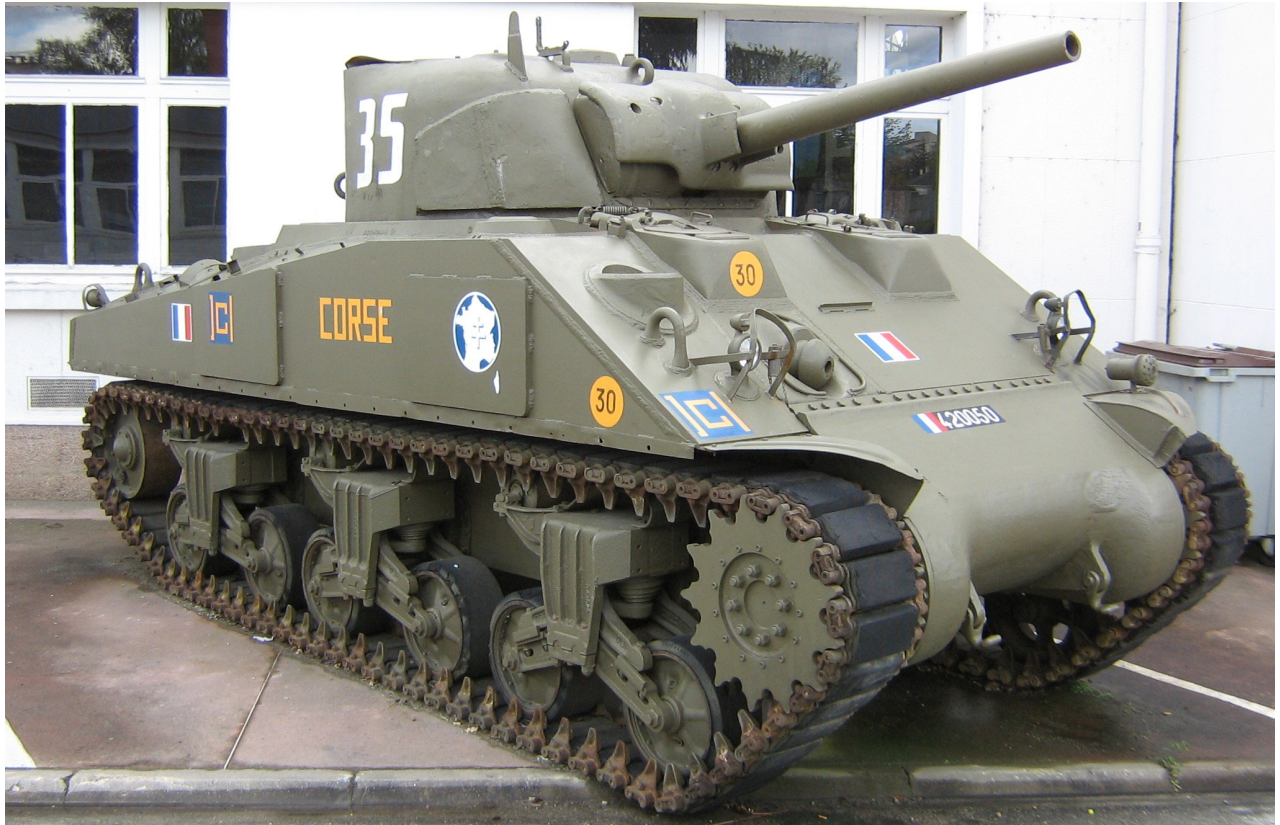
Pierre-Olivier Buan, April 2008 - http://the.shadock.free.fr/Tanks_in_France/saumur_outside/index.html