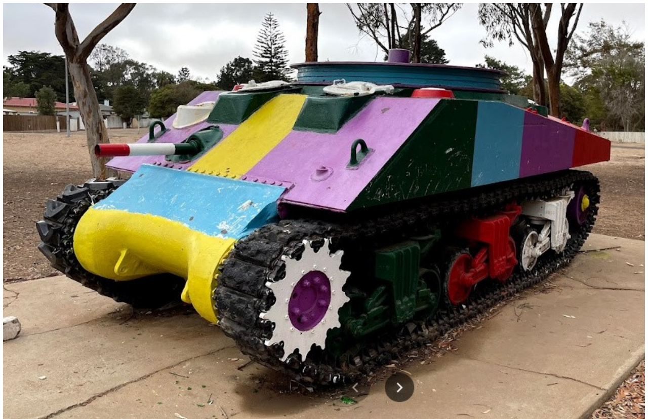
M4A2(75) Sherman hull – Unknown military fire range, Southern France

http://materielmilitaire.skyrock.com/3176670897-Epave-de-char-A4M4.html