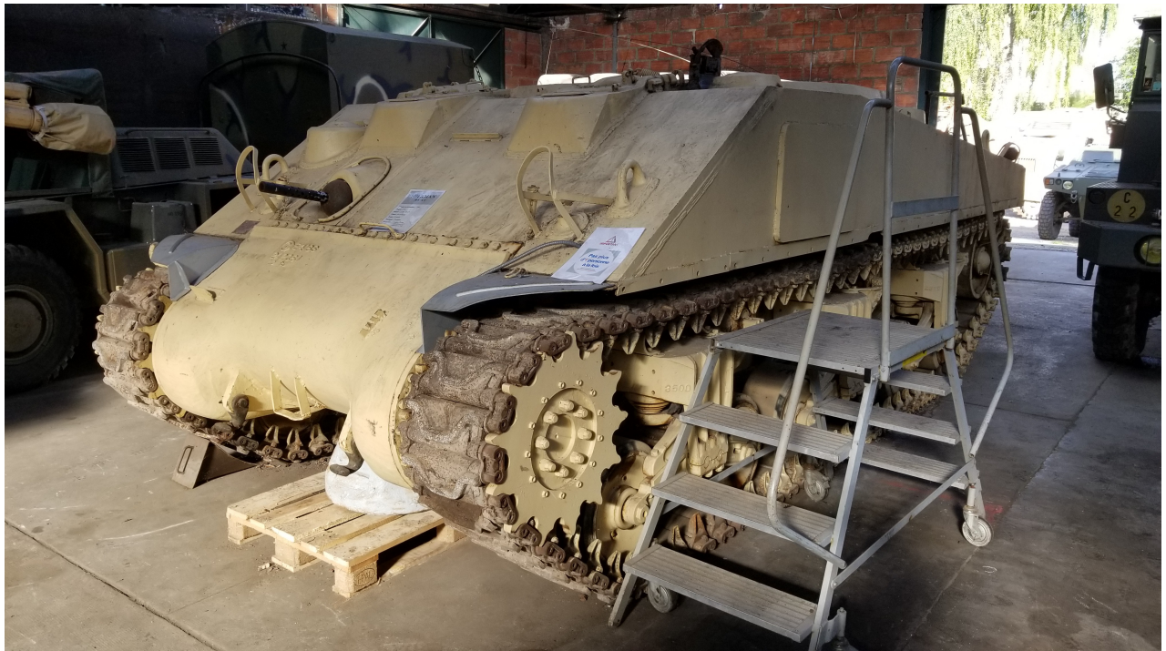
Pierre-Olivier Buan, September 2021

Serial Number 9008, built by Fisher in February, 1943. This tank is not the original "Romilly", but is probably a WW2 veteran from the 2nd French Armored Division. The tack-welded side appliqué plates are often seen on period photos and a number of surviving French WW2 Shermans