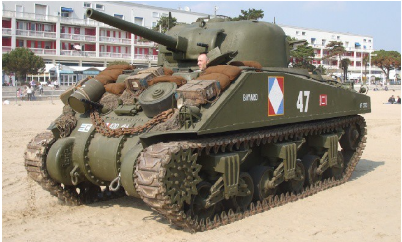
"LT WAYNE" - http://mcollec.forumactif.org/t31719-recherche-photos-du-m4a2-sherman-du-mvvg-midi-pyrenees