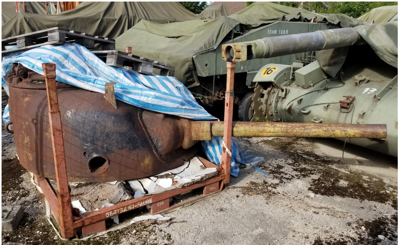
Pierre-Olivier Buan, September 2021