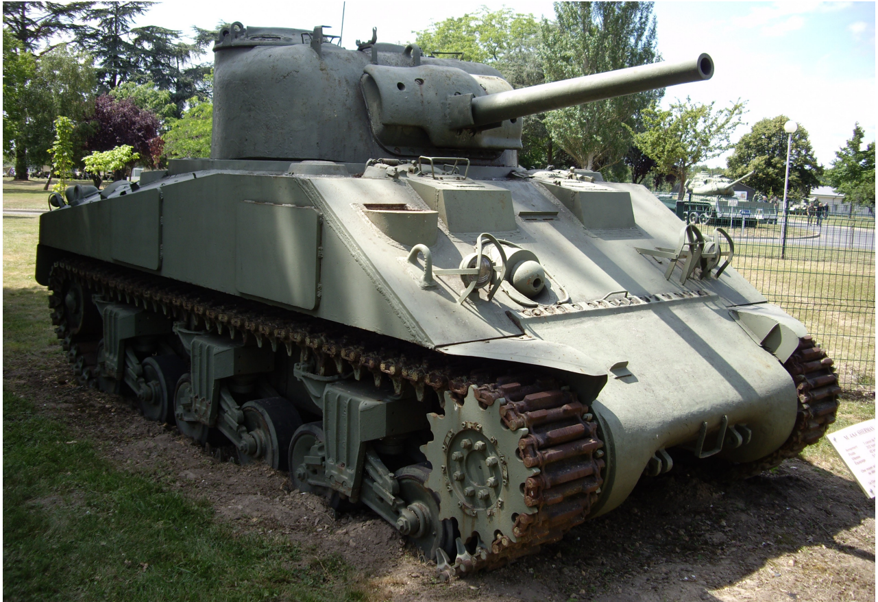
Pierre-Olivier Buan, June 2009 - http://the.shadock.free.fr/Tanks_in_France/2rd_fontevraud/index.html