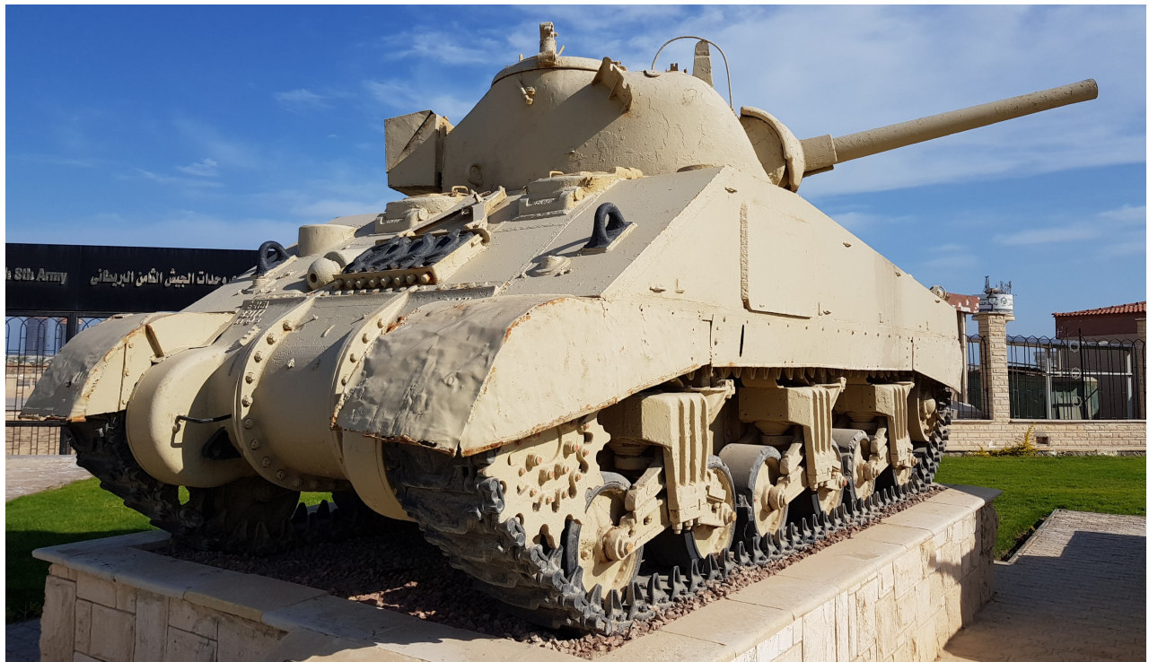
Pierre-Olivier Buan, November 2019