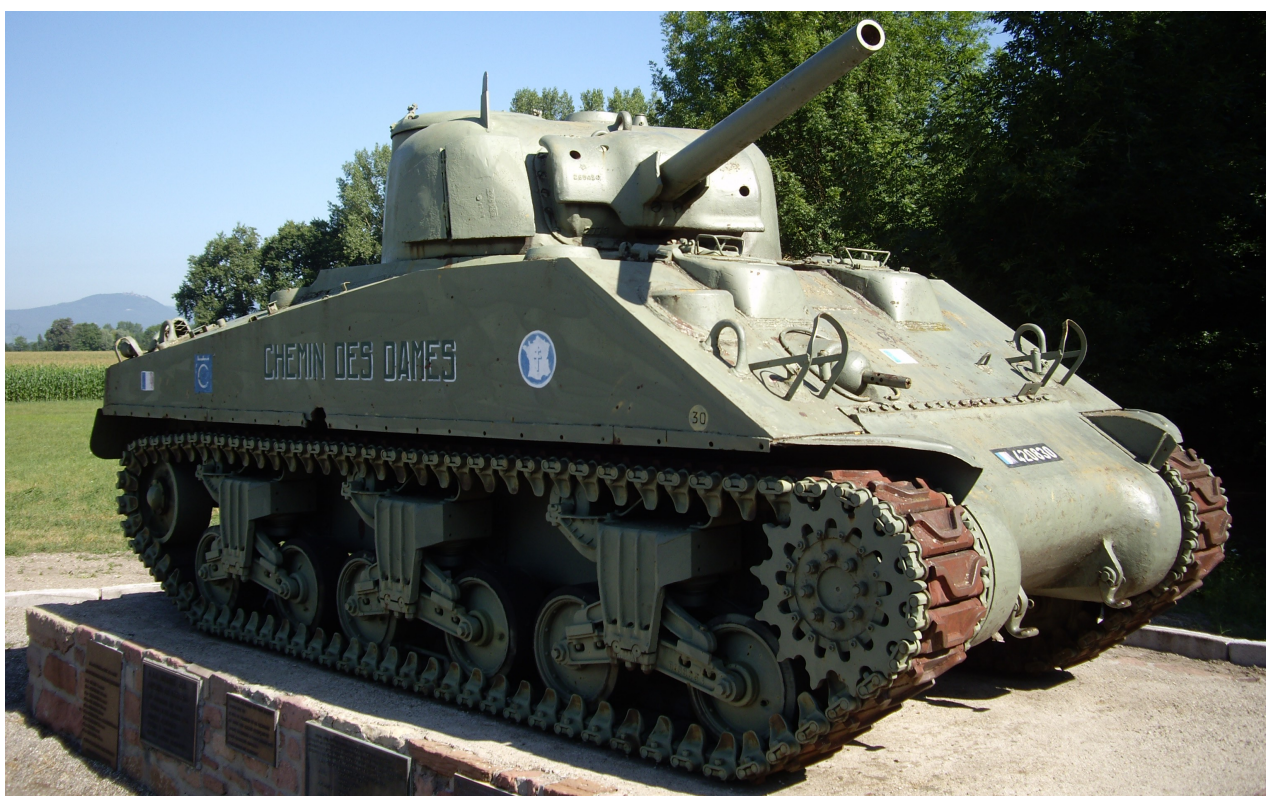
Pierre-Olivier Buan, July 2010 - http://the.shadock.free.fr/Tanks_in_France/sherman_grussenheim/index.html

Serial Number 8831, built by Fisher in January, 1943. This tank is most probably a WW2 veteran from the 2nd French Armored Division. The tack-welded side appliqué plates are often seen on period photos and a number of surviving French WW2 Shermans