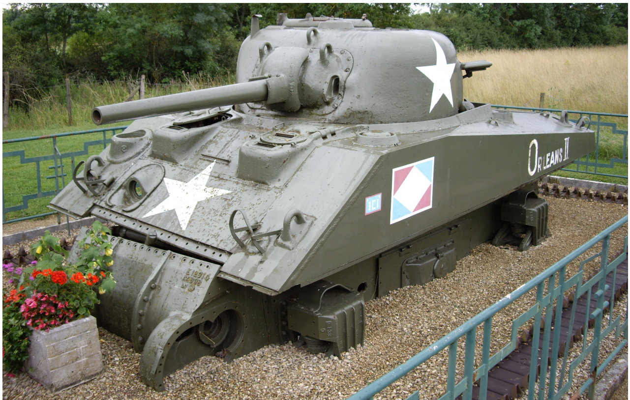
Pierre-Olivier Buan, July 2008 - http://the.shadock.free.fr/Tanks_in_France/sherman_beaune/index.html

Serial Number 18154, built by Chrysler in January, 1943. Original tank of the 2nd Cuirassiers Regiment, French 1st Armored Division. Hit in Beaune on September 6, 1944, transferred in Dijon to serve as a monument after 1945