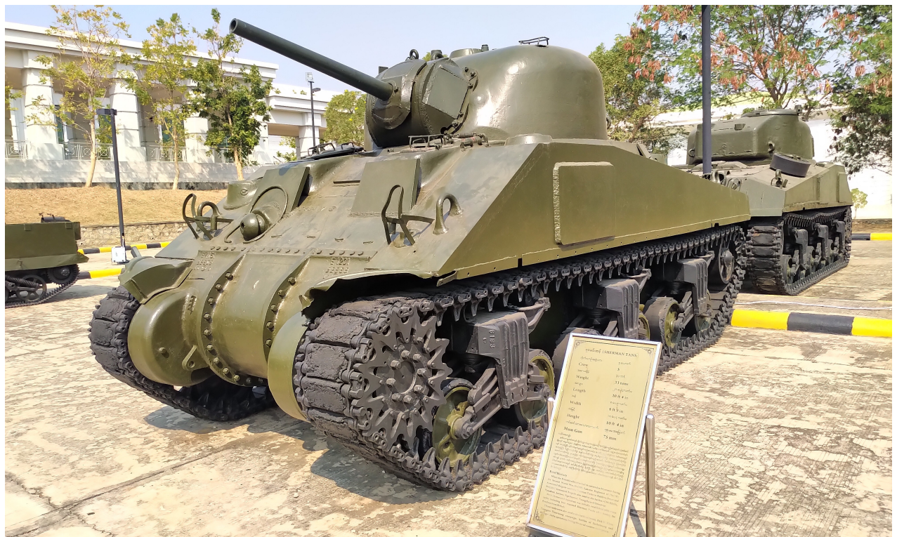
M4A4(75) Sherman – Kharian Cantonment, Kharian (Pakistan)

https://twitter.com/tms313/status/1228945870252412928