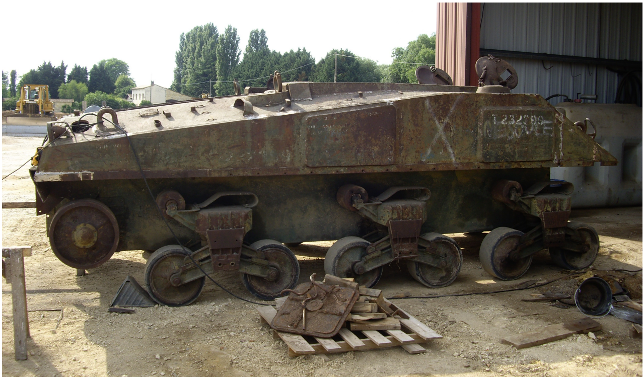
M4A4 wreck – Unknown location, probably in Italy

https://www.reddit.com/r/TankPorn/comments/1ejrsb7/i_found_a_sherman_tank/?sort=top