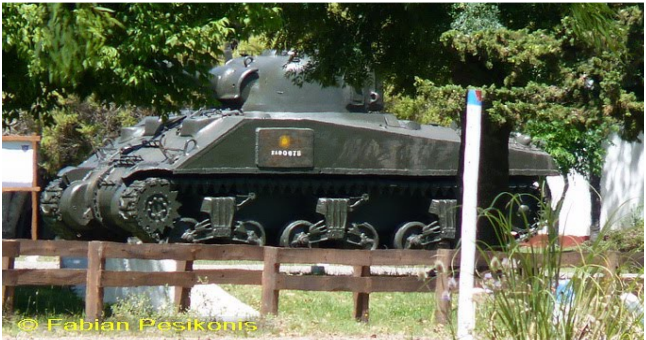
M4A4(75) Sherman – Campo de Mayo, Buenos Aires Buenos Aires Province (Argentina) Serial Number 22410, built by Chrysler in August, 1943