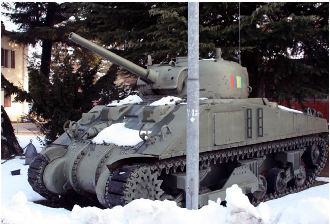
M4A4(75) Sherman Dozer – Museo della Motoriz. Militare della Cecchignola, Rome (Italy)

Massimo Foti, February 2010 - http://www.com-central.net/index.php?name=Forums&file=viewtopic&t=12384