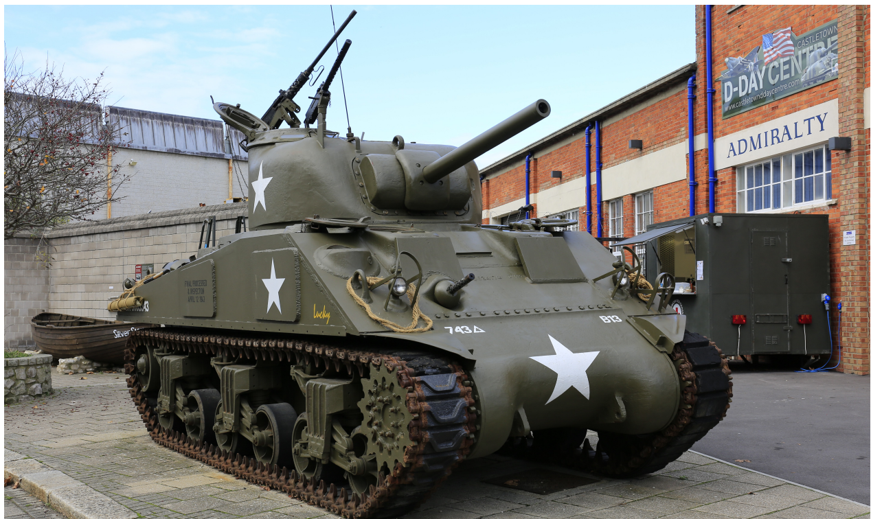
Michael Perry, November 2017

Serial Number 20804 (front differential housing tow lugs). This is a M4A4 hull and differential unit, with a high bustle turret (that probably comes from an M4A3(75)W), and an M4/M4A1 engine deck reproduction