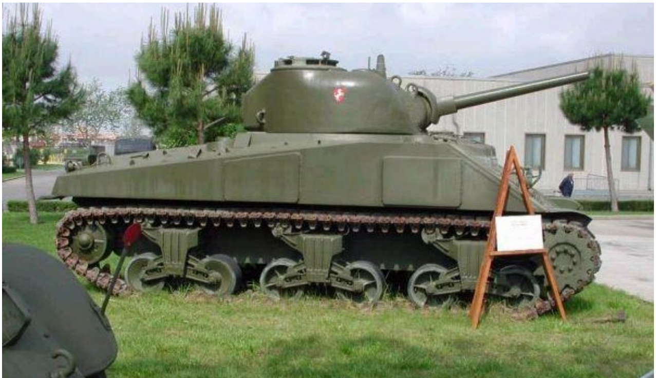
Giulio Gobbi, 2002 - http://digilander.libero.it/