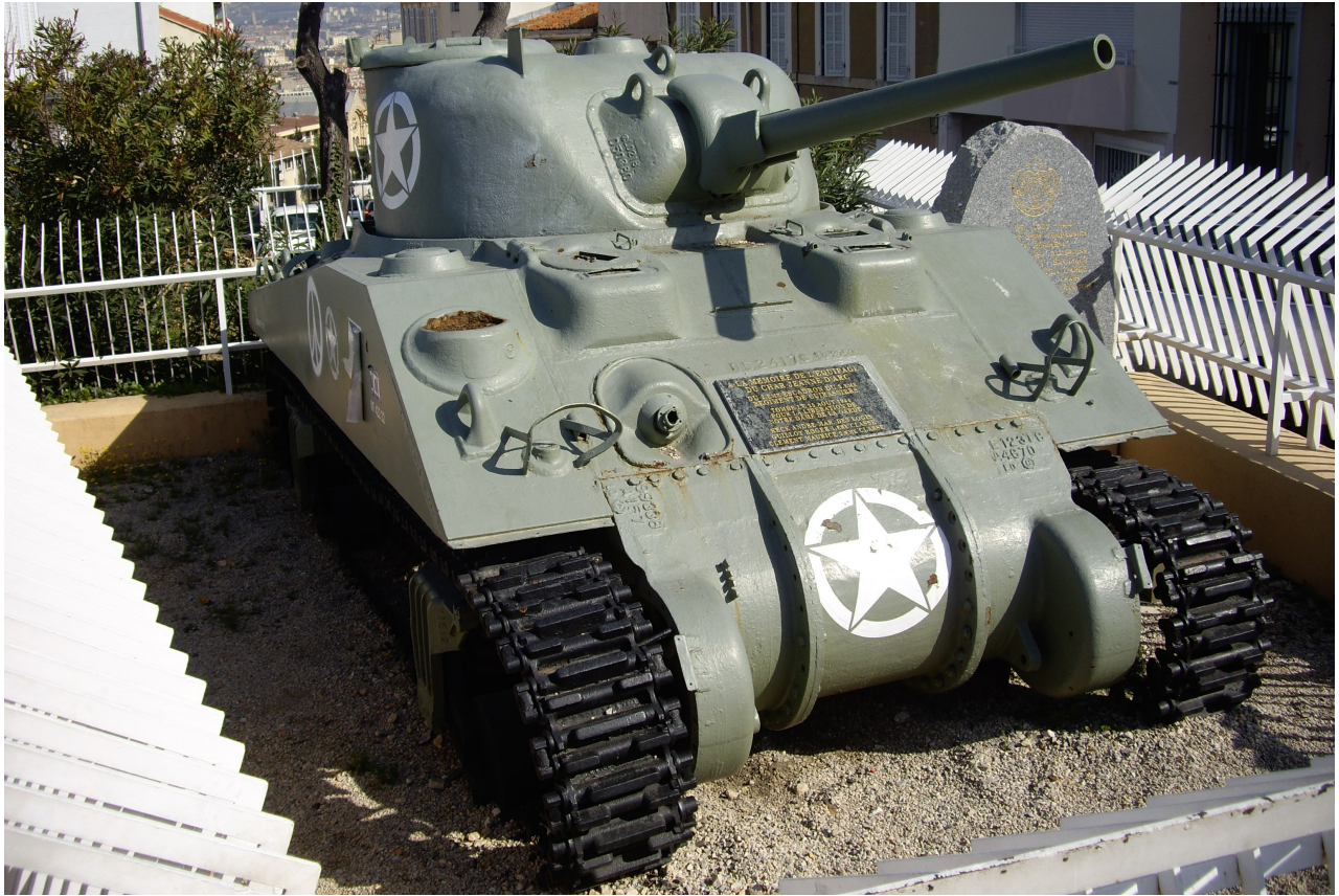
Pierre-Olivier Buan, March 2012 - http://the.shadock.free.fr/Tanks_in_France/sherman_marseille/index.html