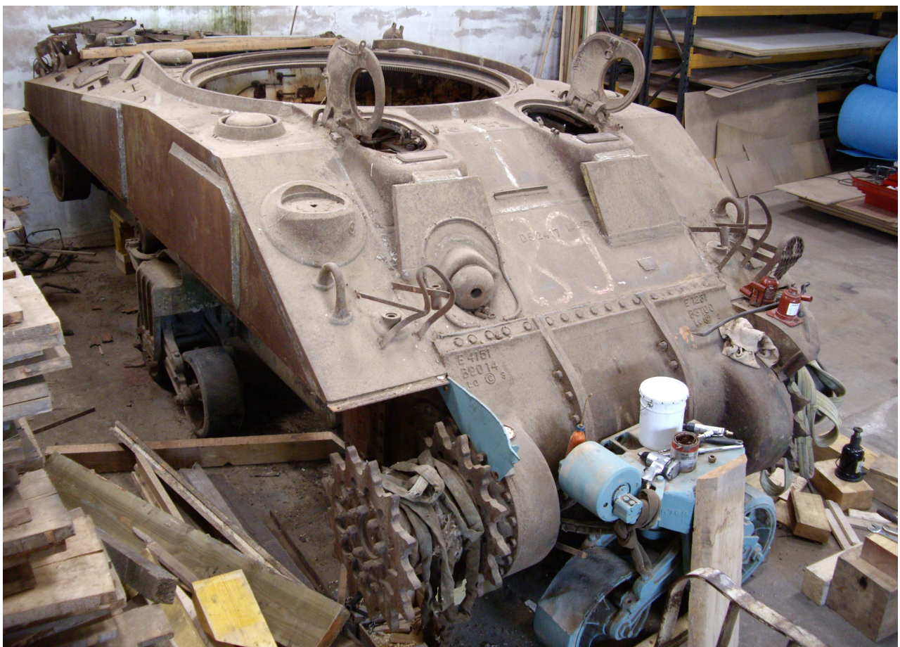
Pierre-Olivier Buan, September 2008