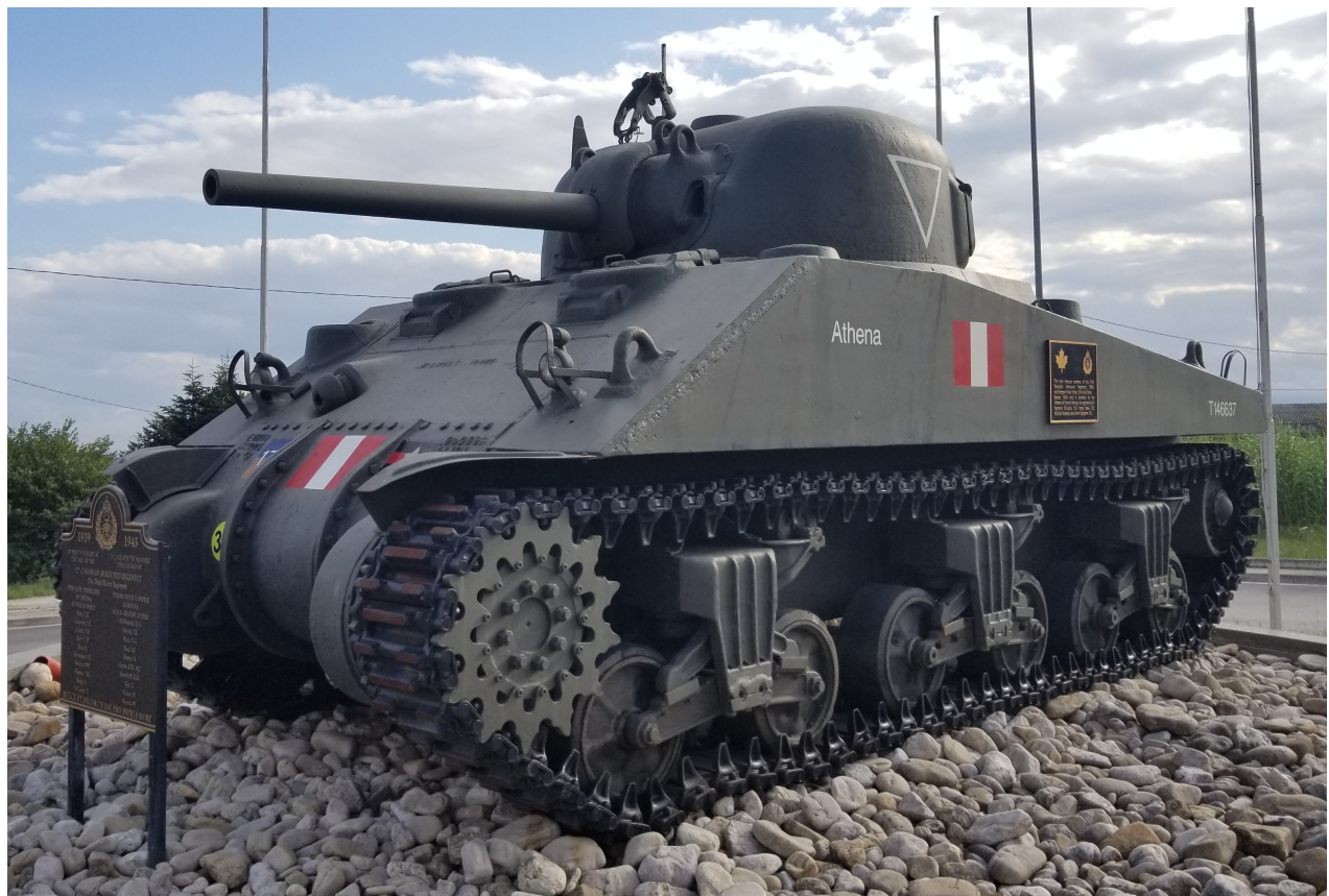
M4A4(75) Sherman – Caserma "Babini", Bellinzago Novarese (Italy)