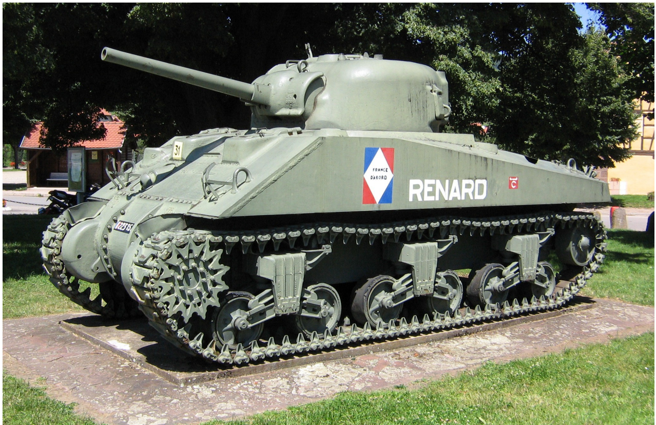
Pierre-Olivier Buan, July 2007 - http://the.shadock.free.fr/Tanks_in_France/sherman_kientzheim/index.html