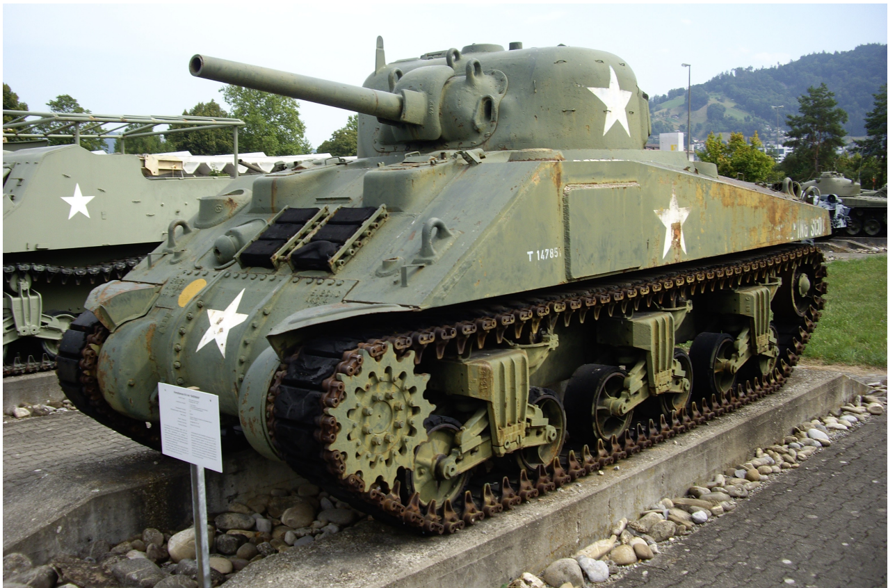
M4A4 Transformé – Private collection, near Toulon (France)