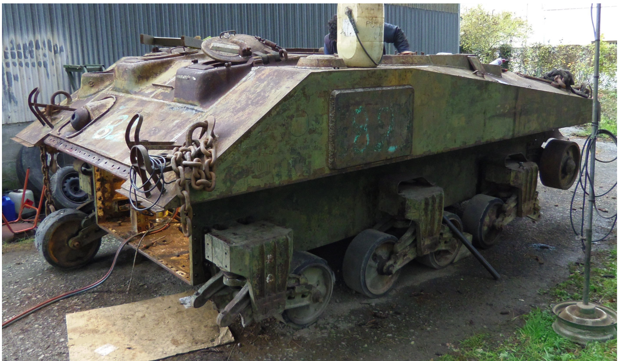
Pierre-Olivier Buan, November 2014

Serial Number 16600, built by Chrysler in November, 1942