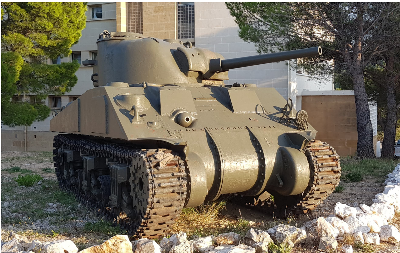
Romain Lapie, September 2018

Serial Number 21752, built by Chrysler in July, 1943