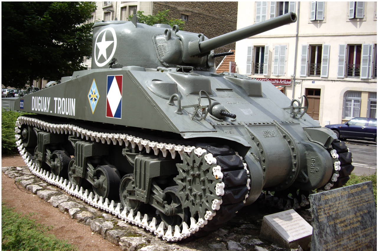
Pierre-Olivier Buan, July 2008 - http://the.shadock.free.fr/Tanks_in_France/sherman_dijon/index.html