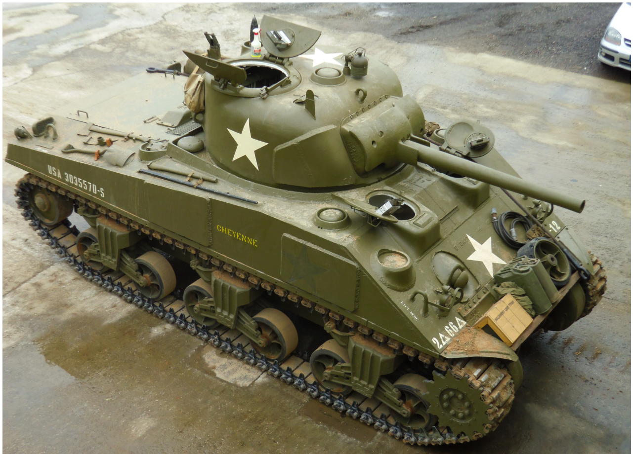
Pierre-Olivier Buan, July 2015