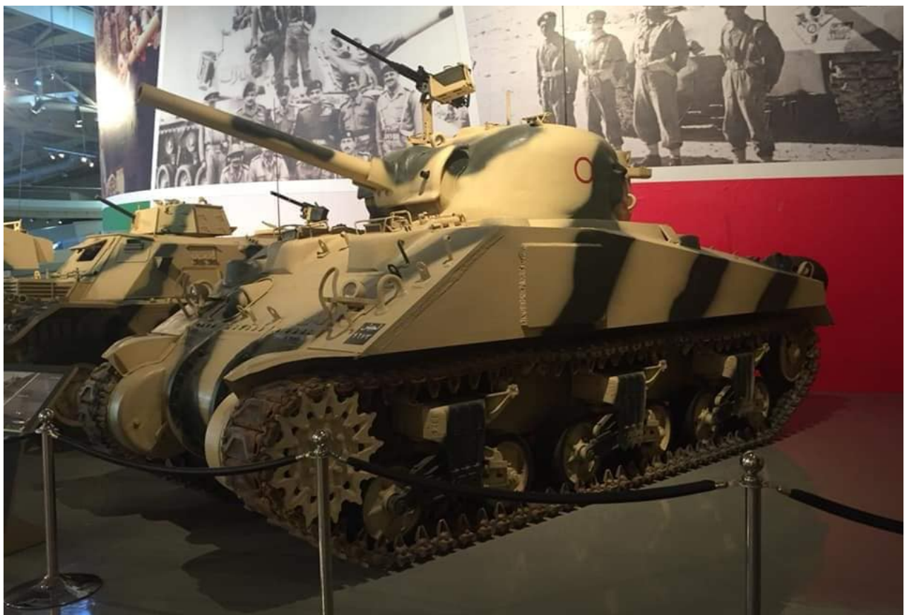
M4A4(75) Sherman – Royal Jordanian Tank Museum (Jordan)