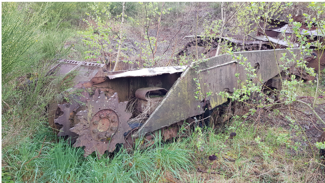
Pierre-Olivier Buan, April 2019