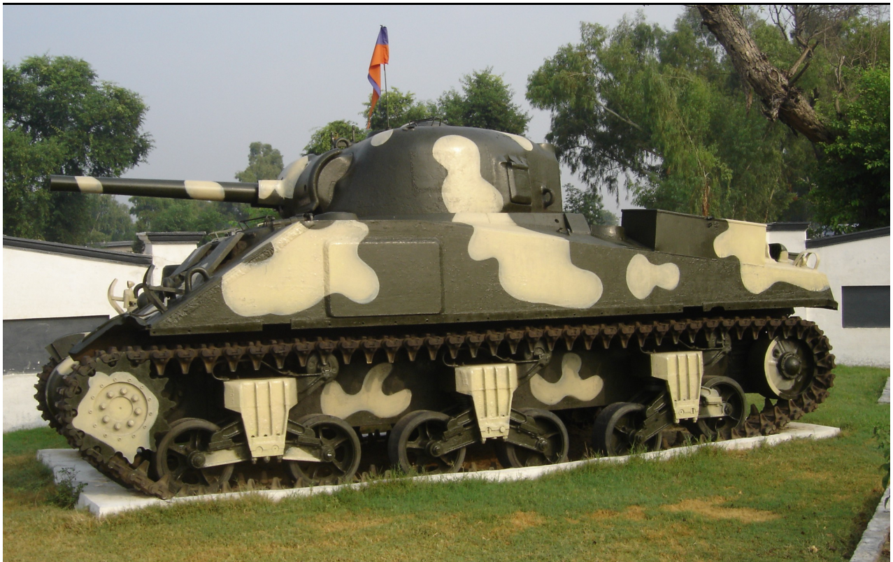
M4A4 (75) – Cariappa Dwar, Prayagraj (India)

https://yappe.in/uttar-pradesh/prayagraj/pani-tanki-crossing/790557