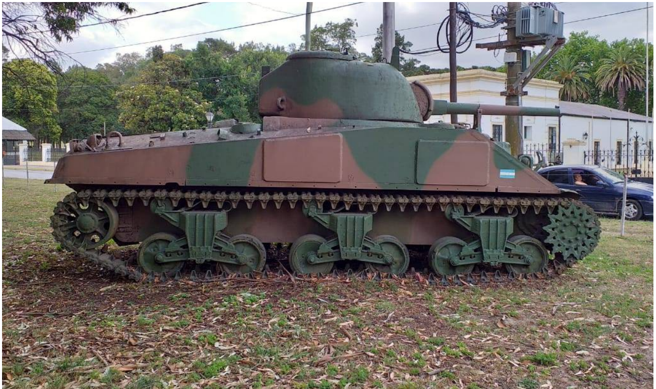
Another M4A4(75) Sherman – Base of Regimiento de Caballería de Tanques. 8, Magdalena, Buenos Aires Province (Argentina)

Fabian Pesikonis, 2013 - https://blindados23.blogspot.com/2011/01/sherman-regimiento-de-caballeria-de.html