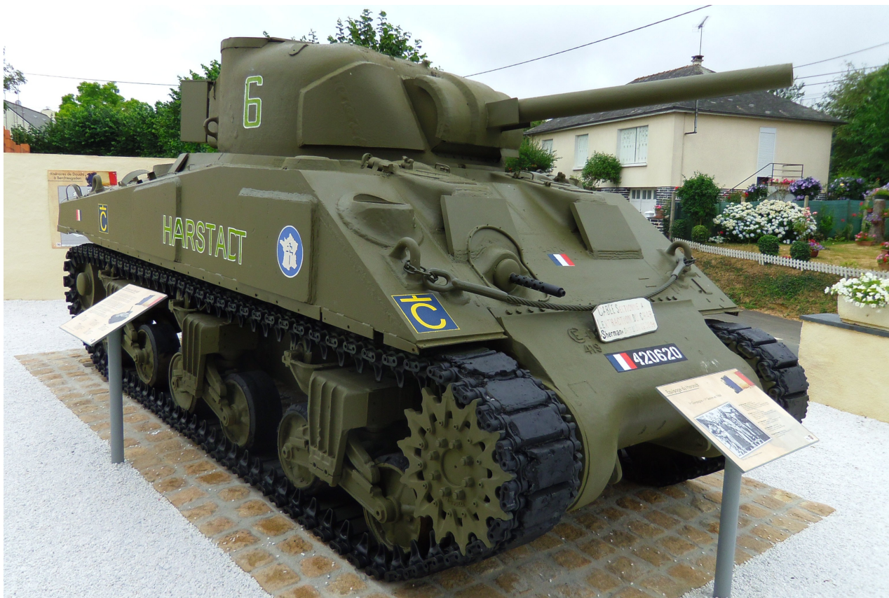
Pierre-Olivier Buan, July 2015 - http://the.shadock.free.fr/Tanks_in_France/sherman_grugelhopital/index.html