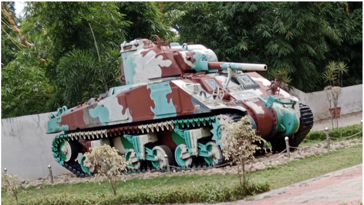
M4A4 (75) – College of Military Engineering, Pune (India)

https://commons.wikimedia.org/wiki/File:Sherman_tank_at_CME_Pune_02.jpg