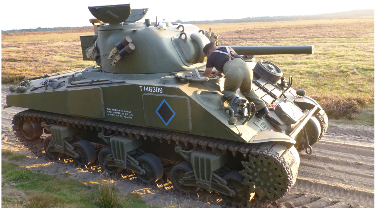
Walter Schwabe, September 2014

M4A4 w/ experimental HVSS gear – Fort Lee U.S. Army Ordnance Museum, VA (USA) Serial Number 19617, built by Chrysler in April, 1943 (USA AFVs register). Previously displayed in Aberdeen Proving Ground, MD