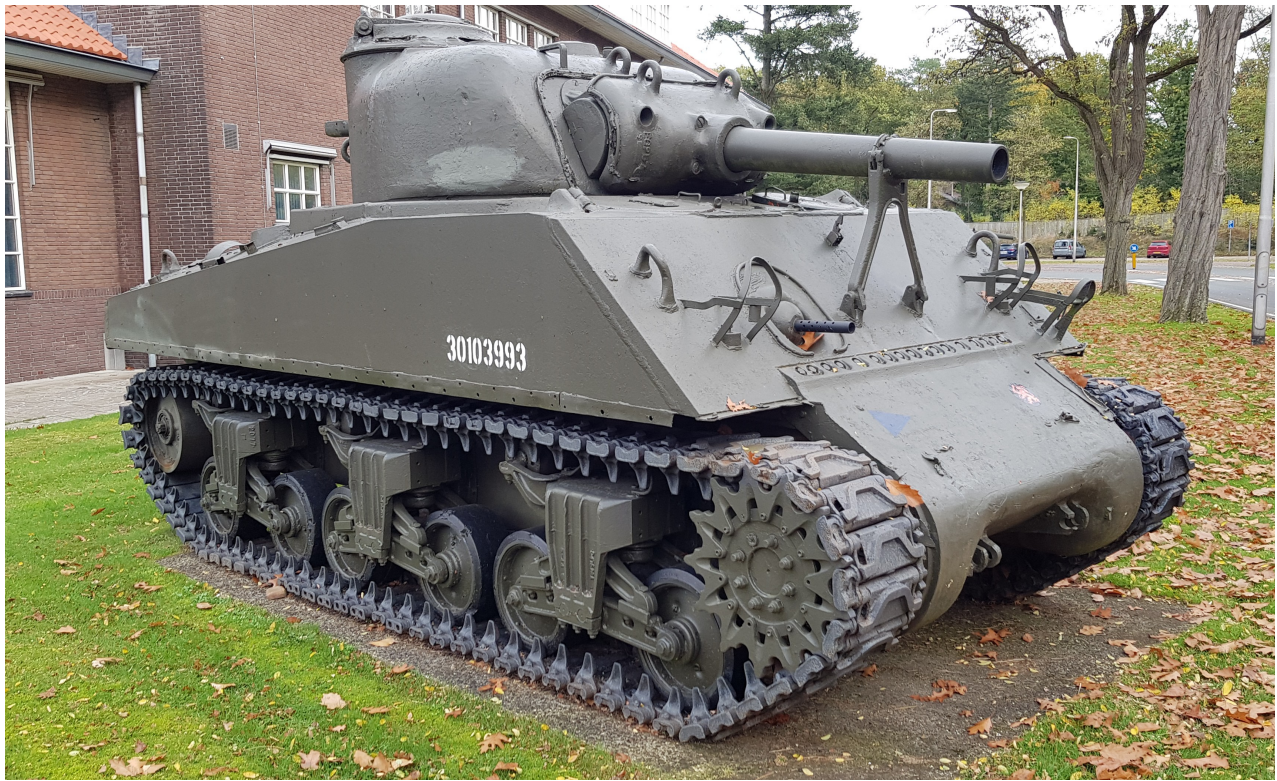
Pierre-Olivier Buan, October 2022