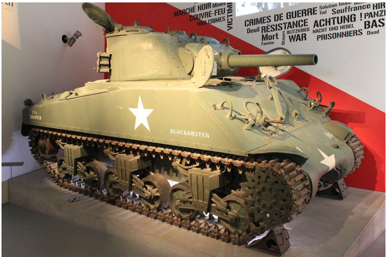
Didier Bouvy, May 2014

Serial Number 57304, built in June, 1944