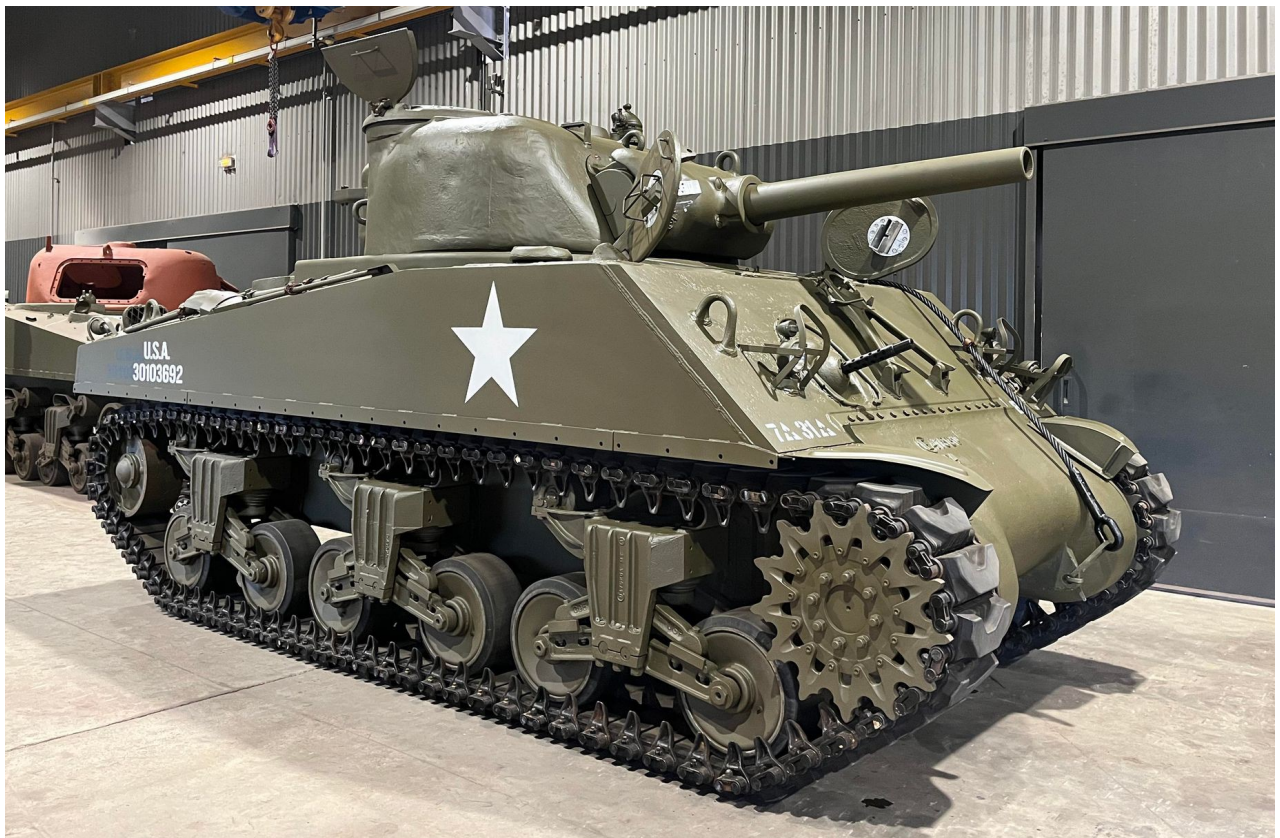
Matthieu Dumias, May 2024

This tank is located in the storage building and is a different vehicle from the previous one