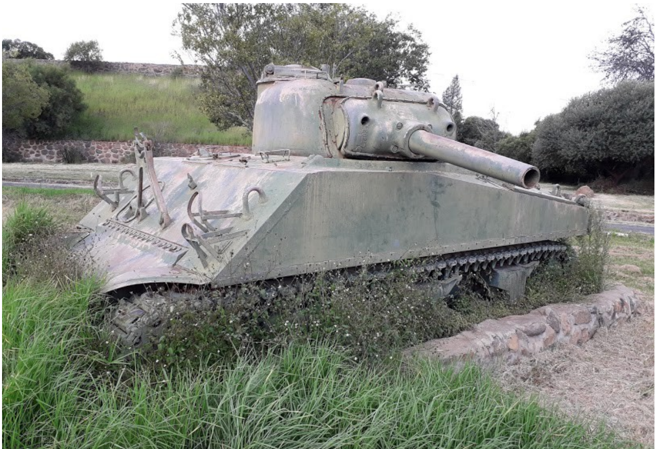
Pierre-Olivier Buan, March 2020