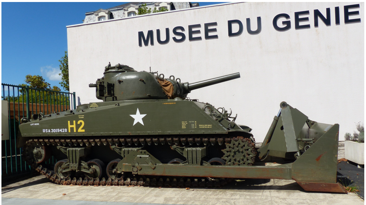
M4(105) Sherman – Xavier Degrenne Collection (France) – running condition Serial Number 56934, built in March, 1944

https://www.facebook.com/pg/MilitaryClassicVehicles/photos/?tab=album&album_id=822486621232079