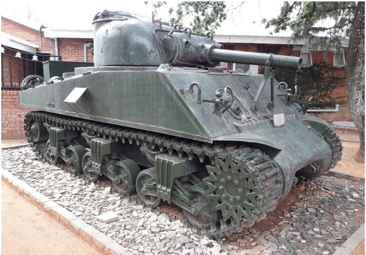
Pierre-Olivier Buan, March 2020

Serial Number 57476, built in July, 1944