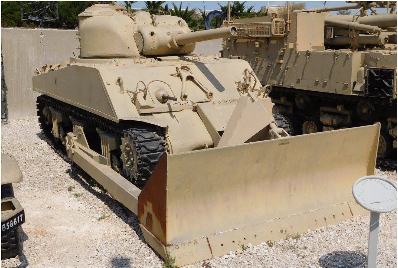
M4(105) Sherman – Private collection (France) – running c. Serial Number 57442, built in July, 1944

Jim Goetz, March 2017 - https://www.facebook.com/