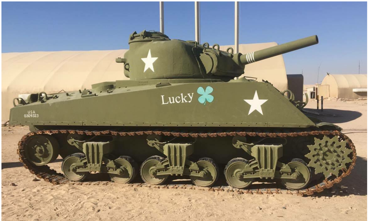
Vince Behan, December 2017