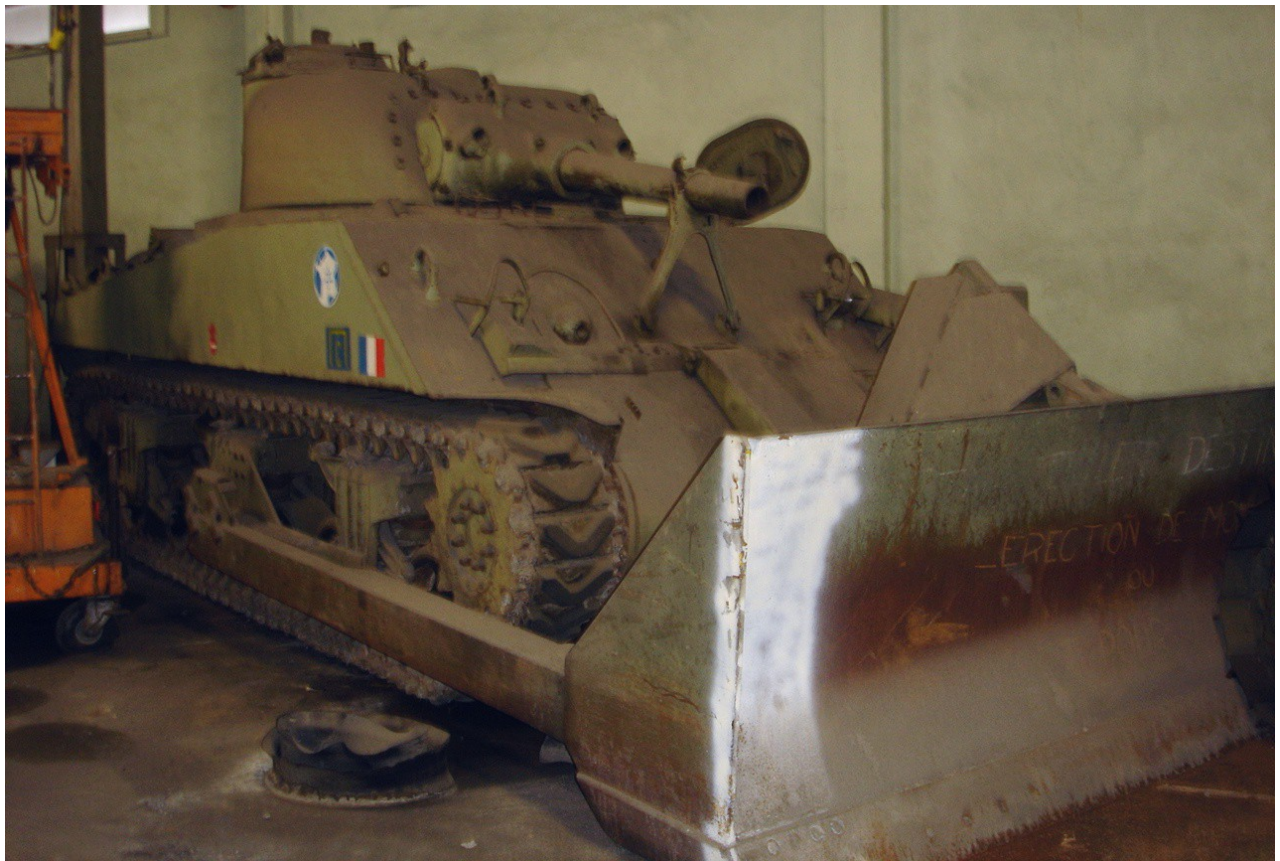
"cayproteau", June 2006 - http://picasaweb.google.com/vilajou/CharAngloAméricains#