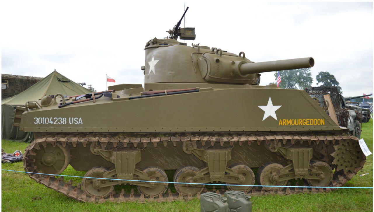
Ian Wilcox, September 2015 - https://www.facebook.com/

Serial Number 58208, built by Chrysler in August, 1944. British T-270894, ex-Commonwealth lend-lease tank, bought from UK in 1947