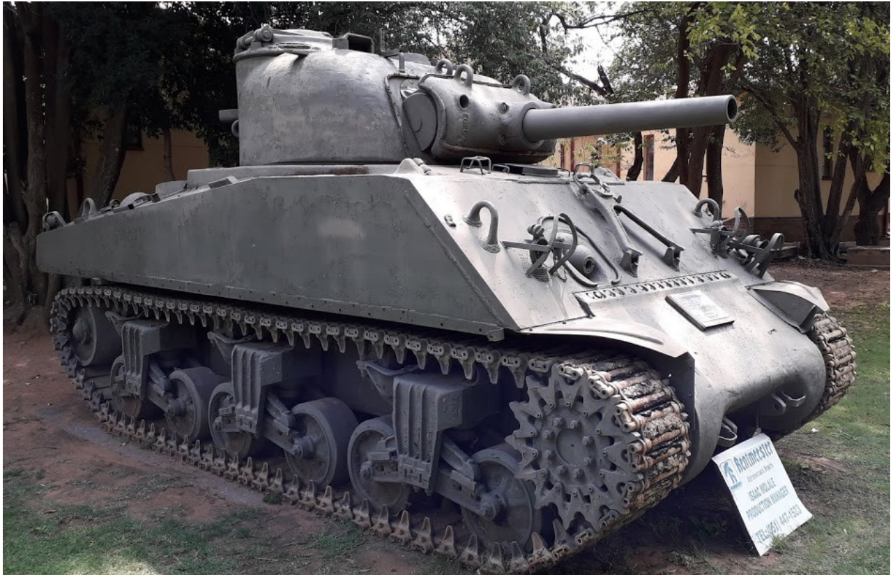
Pierre-Olivier Buan, March 2020