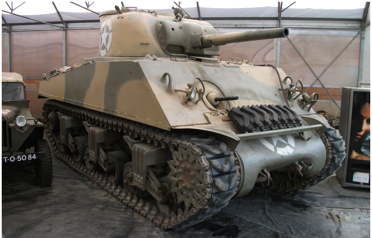
Pierre-Olivier Buan, August 2012

Serial Number 57146, built in May, 1944. The 105mm gun and turret have been replaced with a 75mm gun and low bustle turret