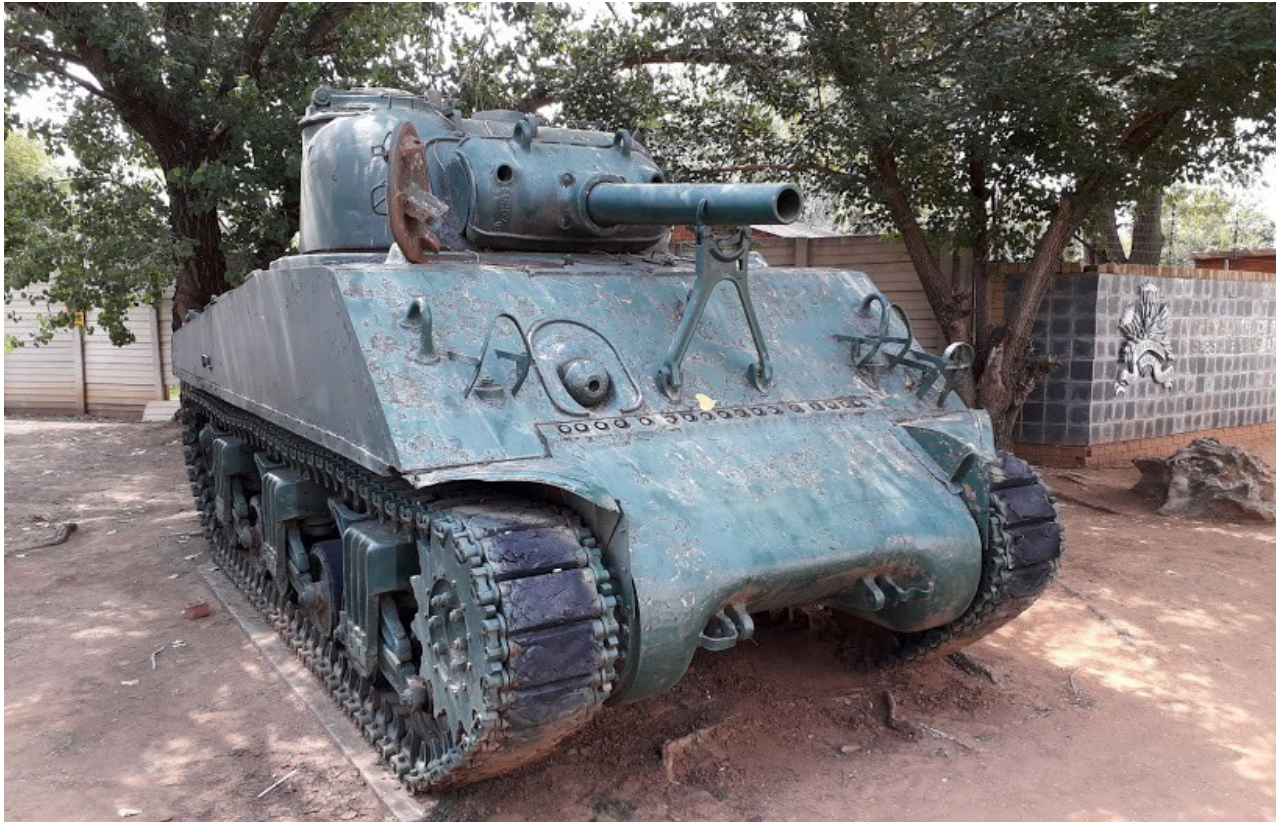
Pierre-Olivier Buan, March 2020