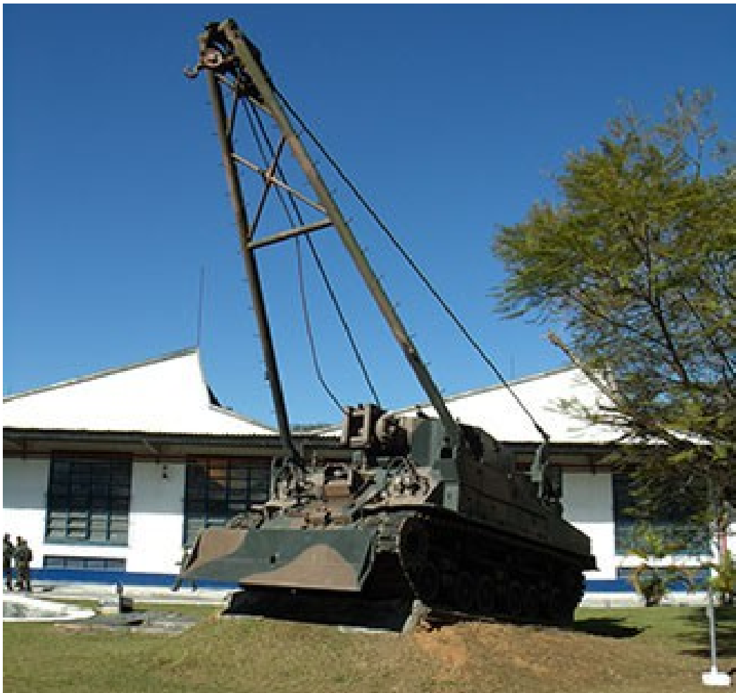
M74 – Unknown location (Greece)

http://photobucket.com/gallery/user/pmeb/media/cGF0aDpNNzQvNjEyODgxNDk4MF9mZGZkYzdINWRkX28uanBn/?ref=1