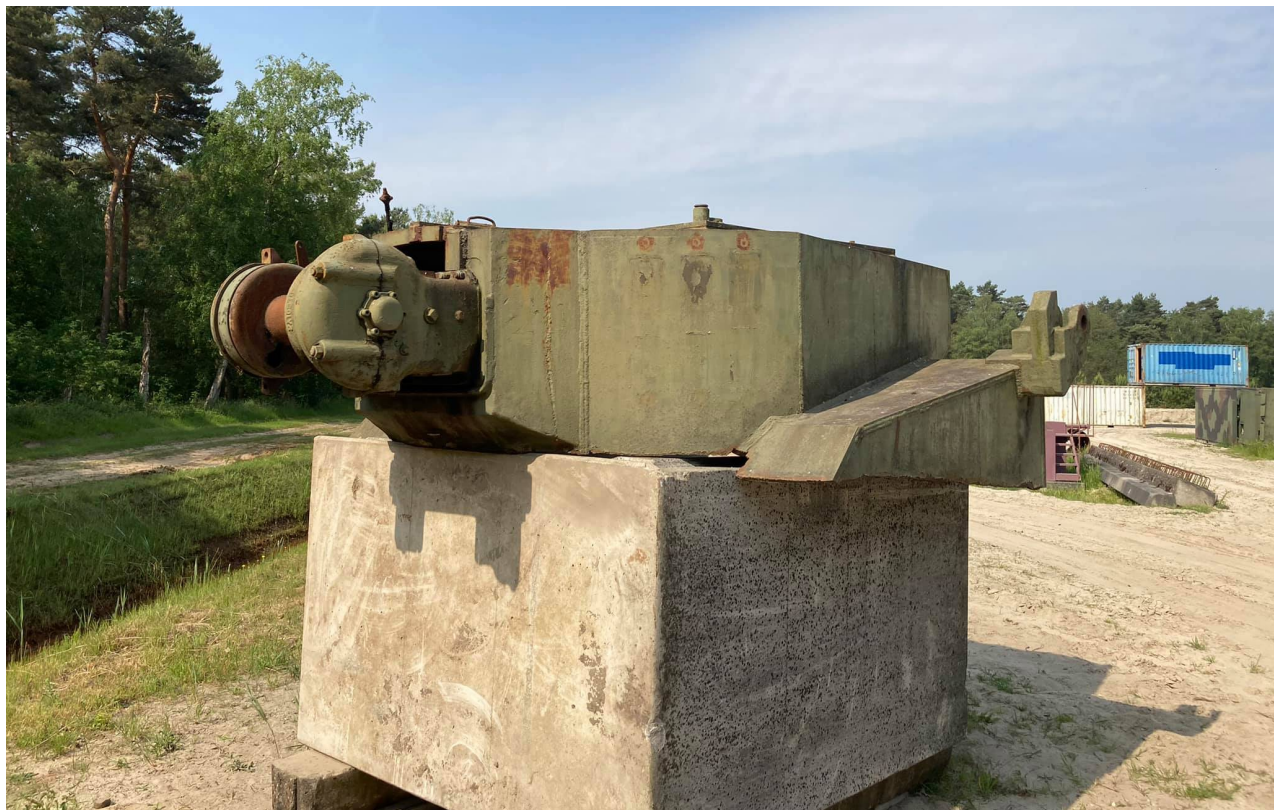
M74 TRV wreck – BAIV, Nederweert (Netherlands) Hull serial number 74468, originally built by Chrysler as an M4A3(105) in May, 1945

https://www.facebook.com/groups/1702825809944254/permalink/3239666492926837/