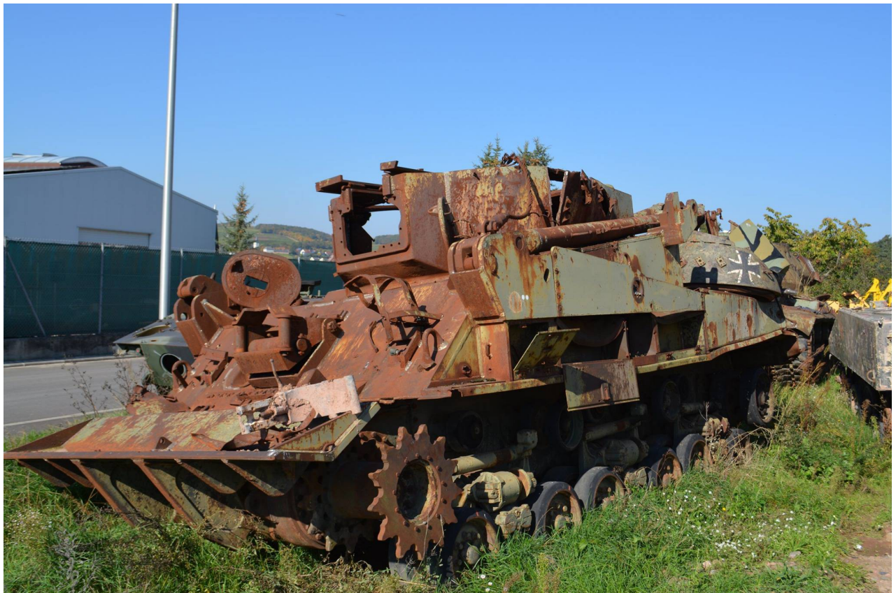
M74 – “Theodor-Körner-Kaserne“, Lüneburg (Germany)

https://www.facebook.com/kuinemilitaryphotography/photos/a.1759802127580589/2413840002176795/?type=3&theater