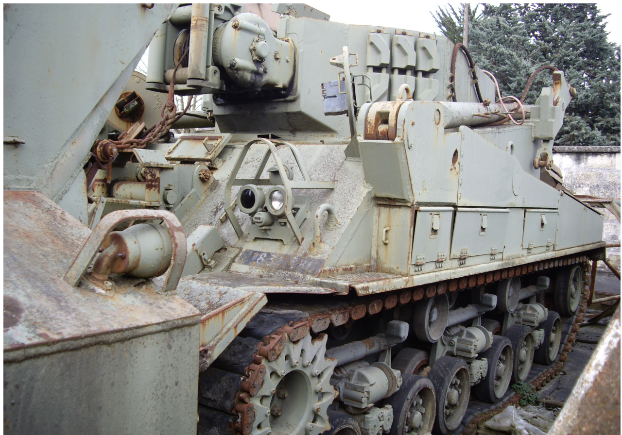
M74 – Museum Bevrijdende Vleugels, Best (Belgium)

http://ic2.pbbase.com/o6/57/50857/1/85775817.cmnTiYCd.DSCF3040.JPG