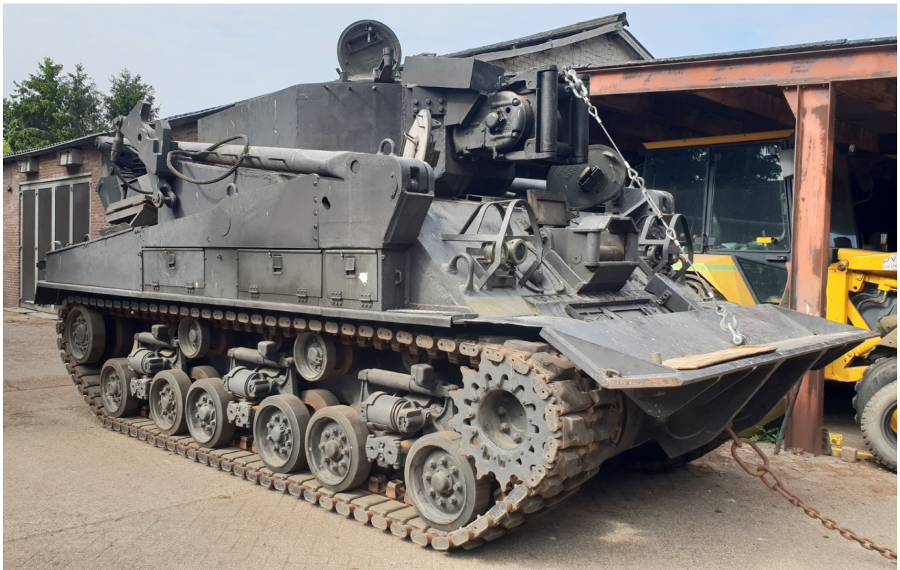
M74 – Private collection, Maassluis (Netherlands)

http://www.shermantank.nl/Maassluis%20M74.htm