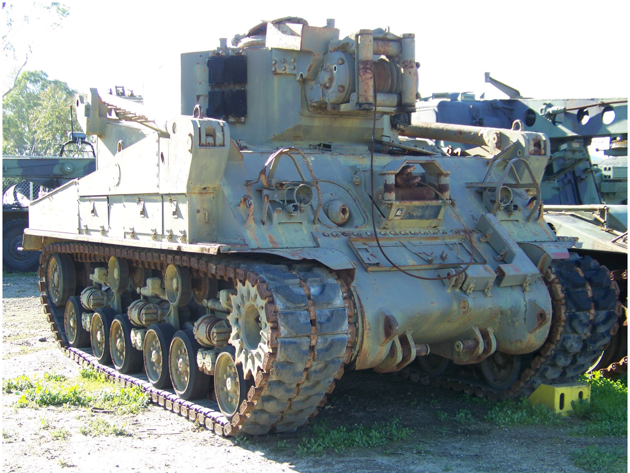
Neil Baumgardner, January 2011 - http://smg.photobucket.com/albums/v218/baumgar/Camp%20Pendleton/#!cpZZ2QQtpZ20

M74 – Mechanized Museum of the US Marine Corps, Camp Pendleton, CA (USA)