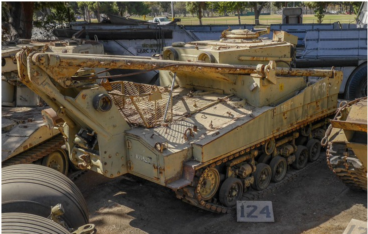
Lorén Hannah, October 2013 - http://www.vgbimages.com/AFV-Photos/American-Society-of-Military-His/i-jTZb6vg

M74 – American Society of Military History "Tankland" , South El Monte, CA (USA)