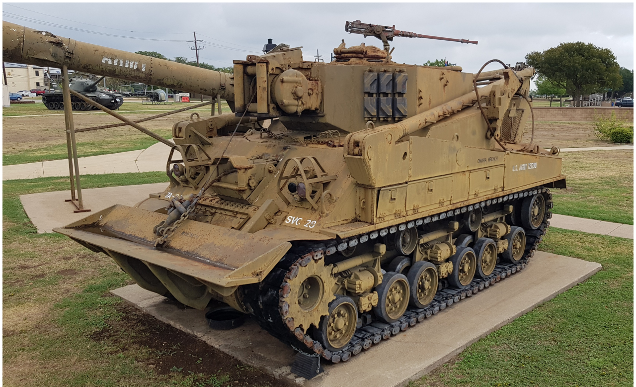
Pierre-Olivier Buan, September 2023

Serial Number 143, converted from SN 65635, an M4A3 105mm HVSS built by Chrysler in February, 1945