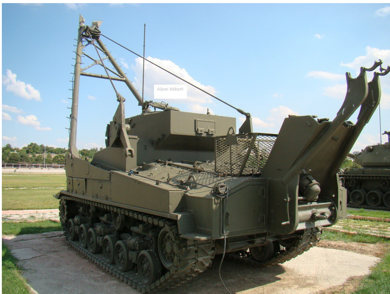
M74 – Hellenic Army Armor Museum, inside the Armor Training Center, Avlona, near Athens (Greece)