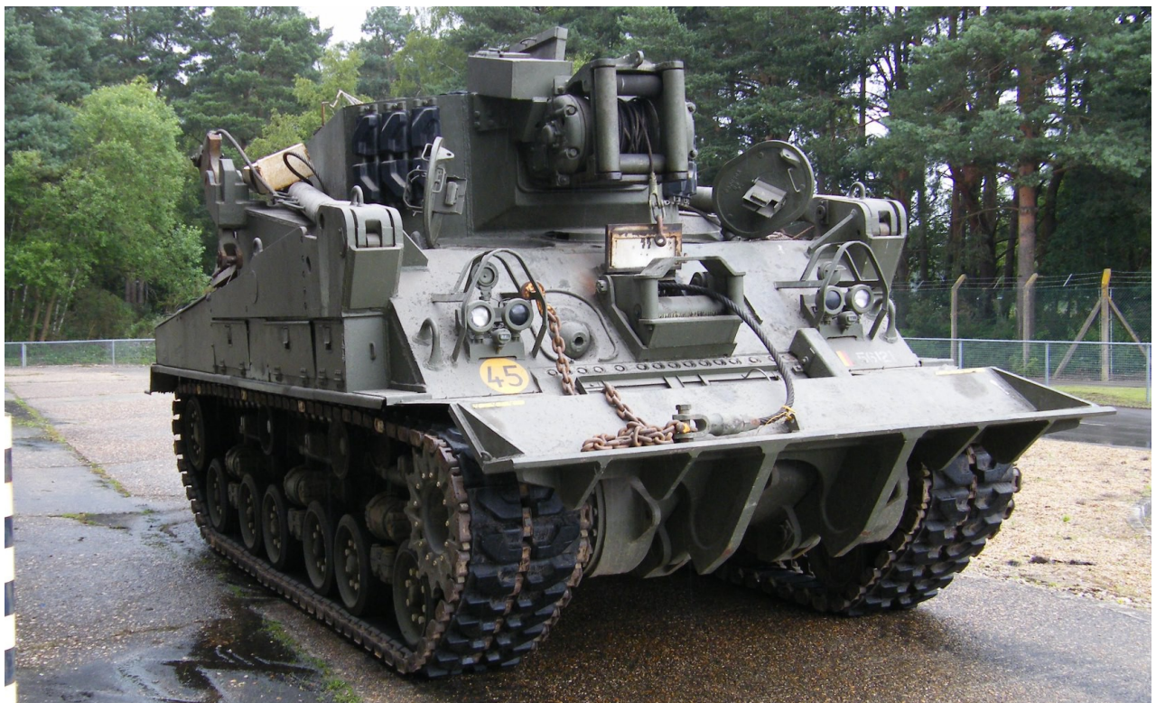
REME Museum, December 2012 - https://www.facebook.com/

Serial Number 133. Hull serial number 74655, originally built by Chrysler as an M4A3(105) in May, 1945