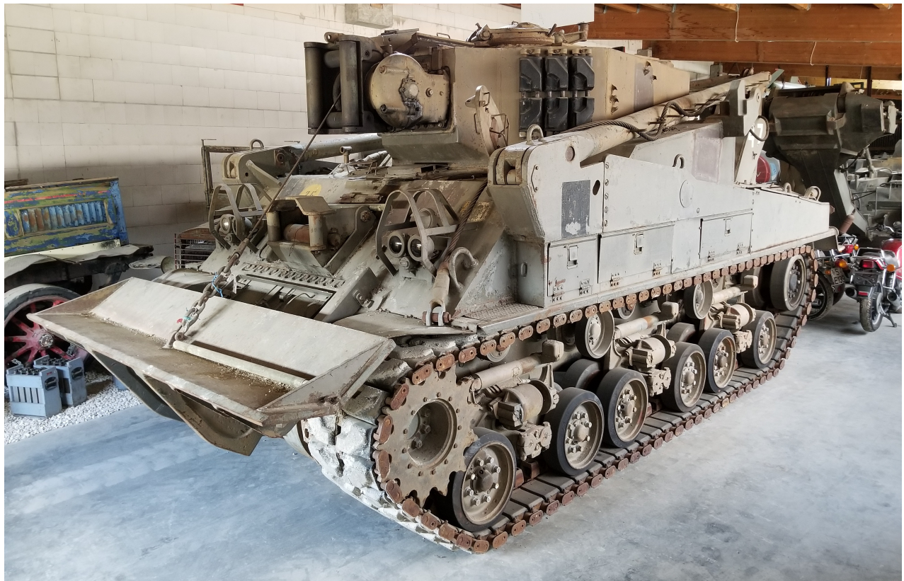
Pierre-Olivier Buan, July 2020