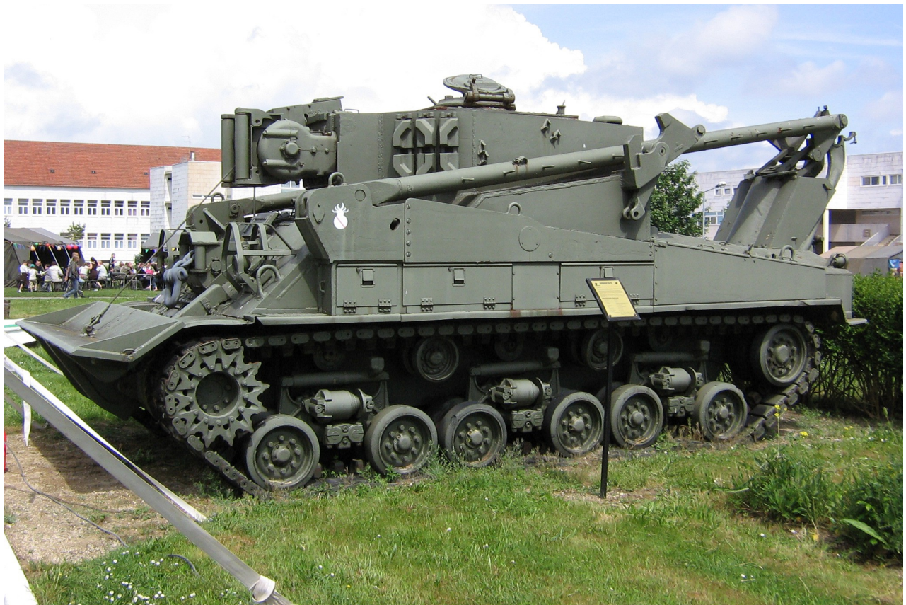
Pierre-Olivier Buan, May 2008 - http://the.shadock.free.fr/Tanks_in_France/mourmelon3/index.html