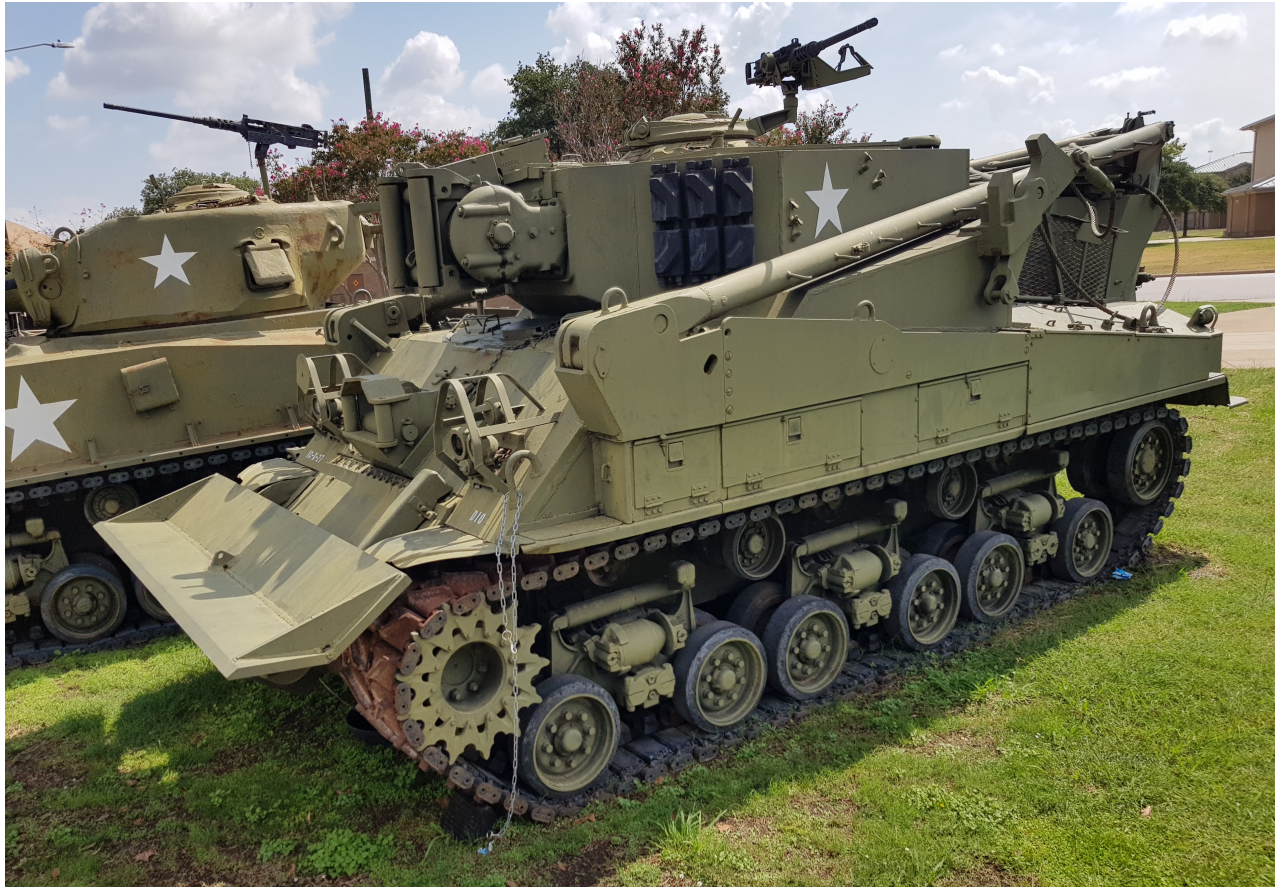
Pierre-Olivier Buan, September 2023