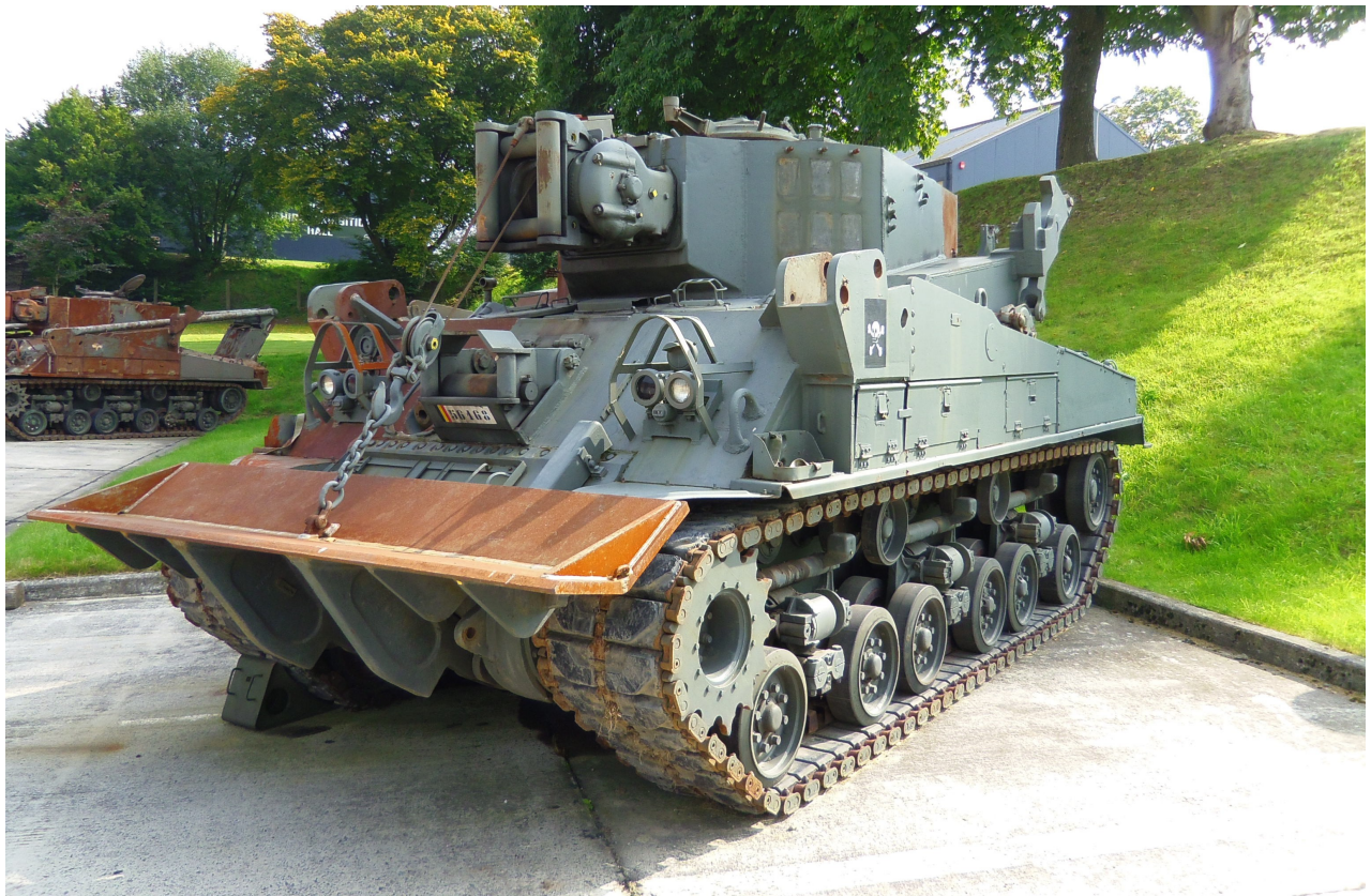
Pierre-Olivier Buan, September 2014