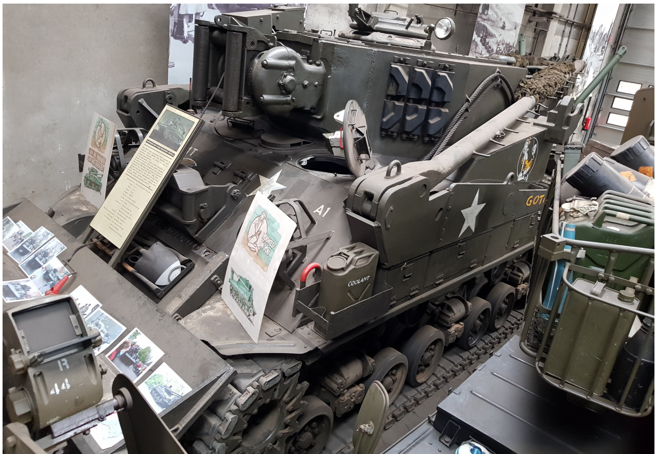
M74 TRV – BAIV trading, Maarheeze (Netherlands) Comes from Greece

https://www.facebook.com/baivbv/photos/pcb.3917761905019920/3917744585021652