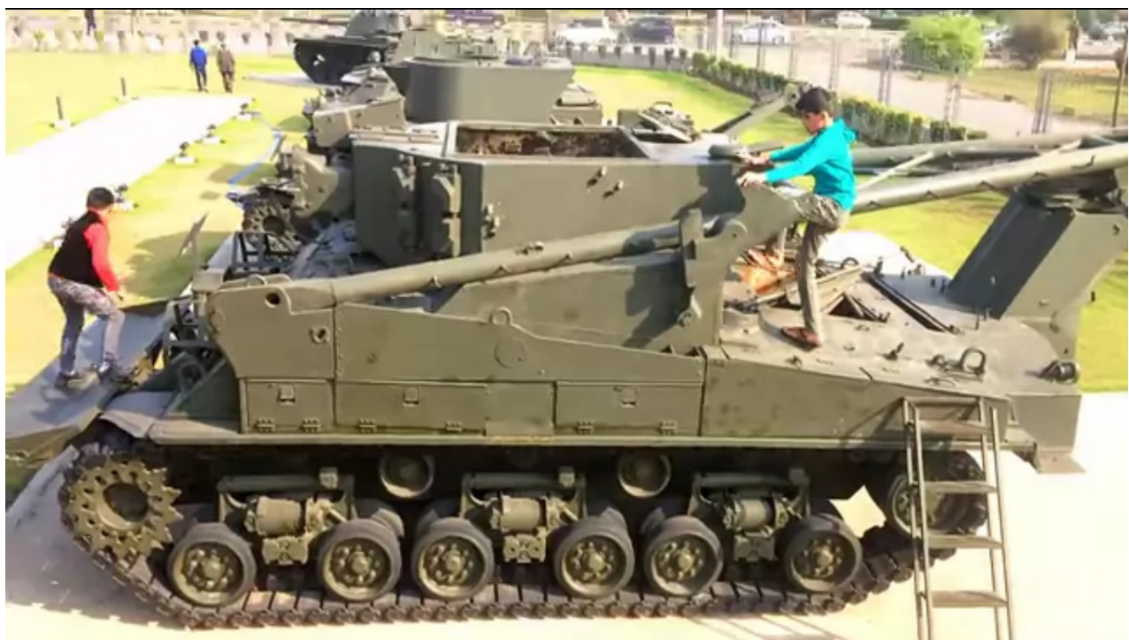
M74 – Holy Defense Museum, Tehran (Iran)

https://www.youtube.com/watch?v=IZGMCzbnbPE