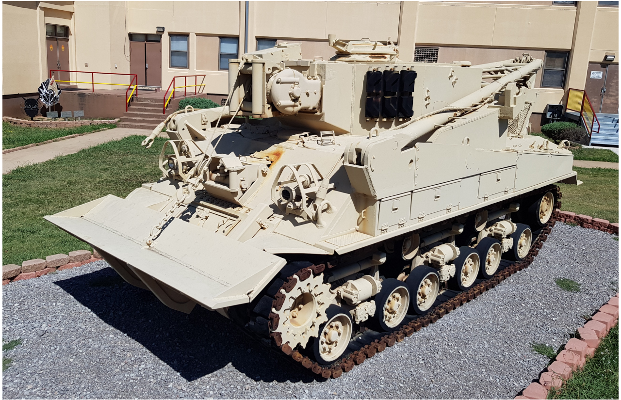
Pierre-Olivier Buan, September 2023