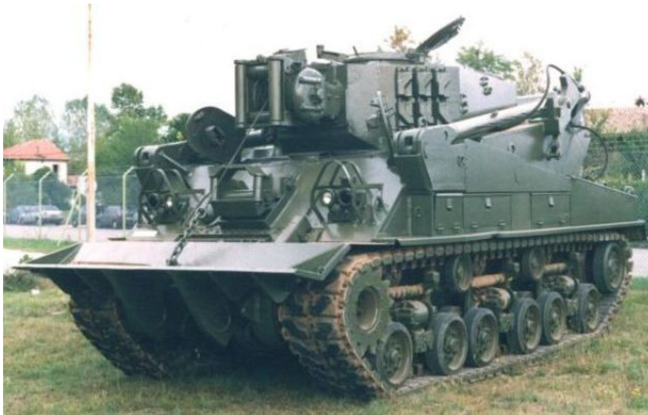
Pierantonio Farina - http://www.ferreamole.it/contributi/censimento/m74_ariete.htm

M74 – Caserma "De Carli" di Cordenons (Italy)