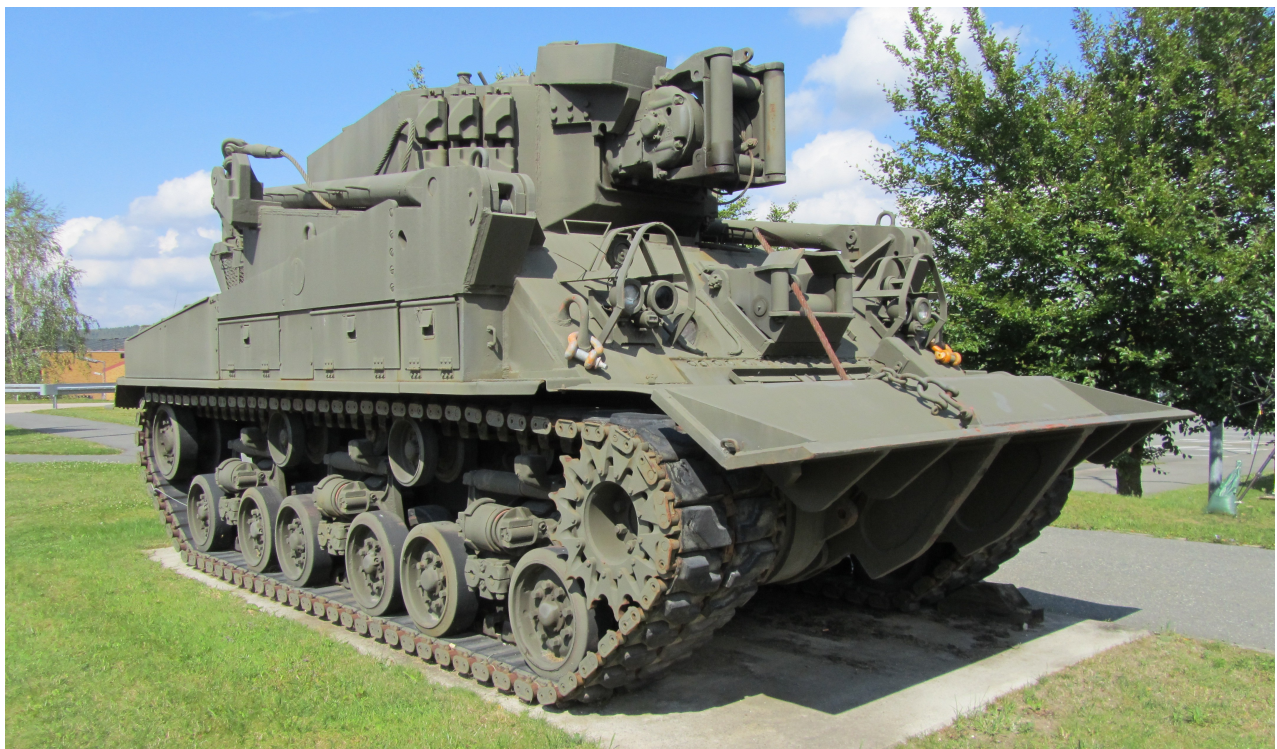
M74 – Military Historical Museum of the Bundeswehr, Dresden (Germany)

http://ja.wikipedia.org/wiki/%E3%83%95%E3%82%A1%E3%82%A4%E3%83%AB:Bundeswehrmuseum_Dresden_64.jpg