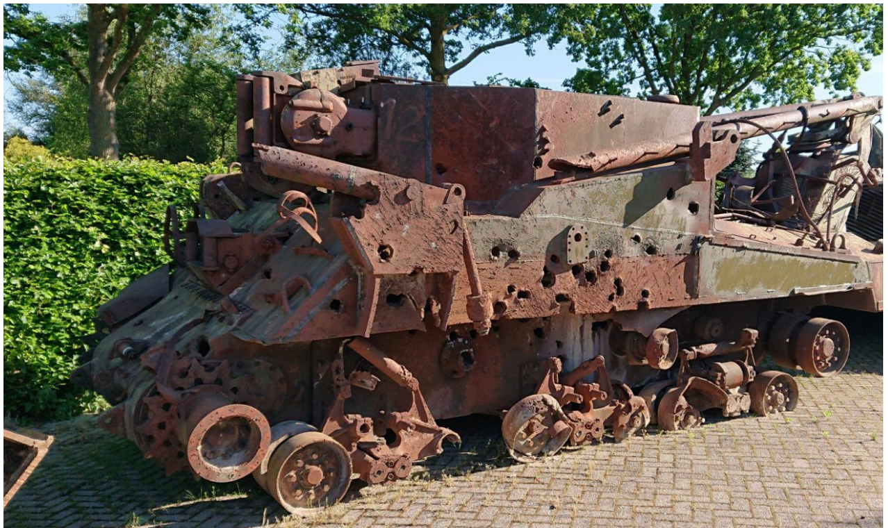
M74 – Regimiento de Caballeria Mecanizado Nº 4, Avenue Don Pedro de Mendoza, Montevideo (Uruguay)

https://www.baiv.nl/7314-m74-tank-recovery-vehicle/