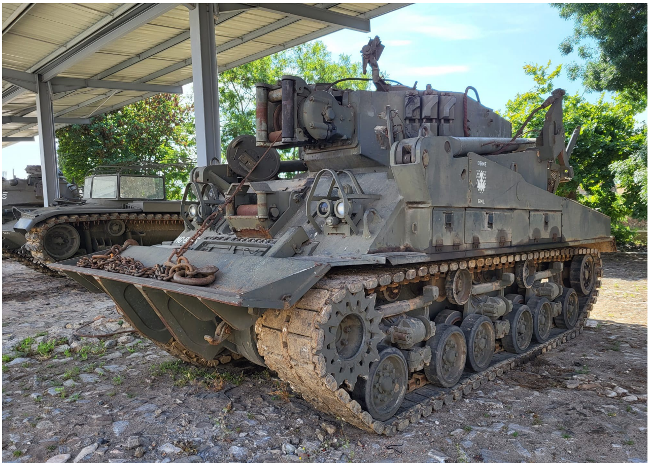
Craig Moore, June 2023