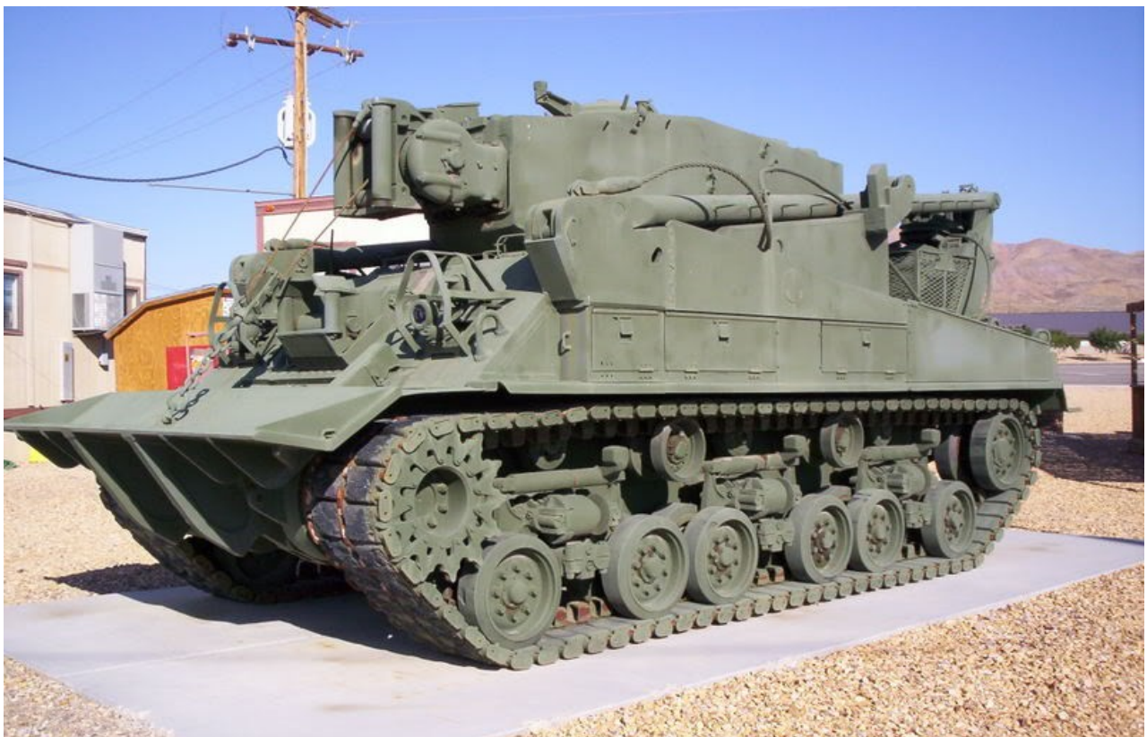
"SFC_Jeff_Button" - http://www.com-central.net/index.php?name=Forums&file=viewtopic&p=41002

M74 – Mechanized Museum of the US Marine Corps, Camp Pendleton, CA (USA)