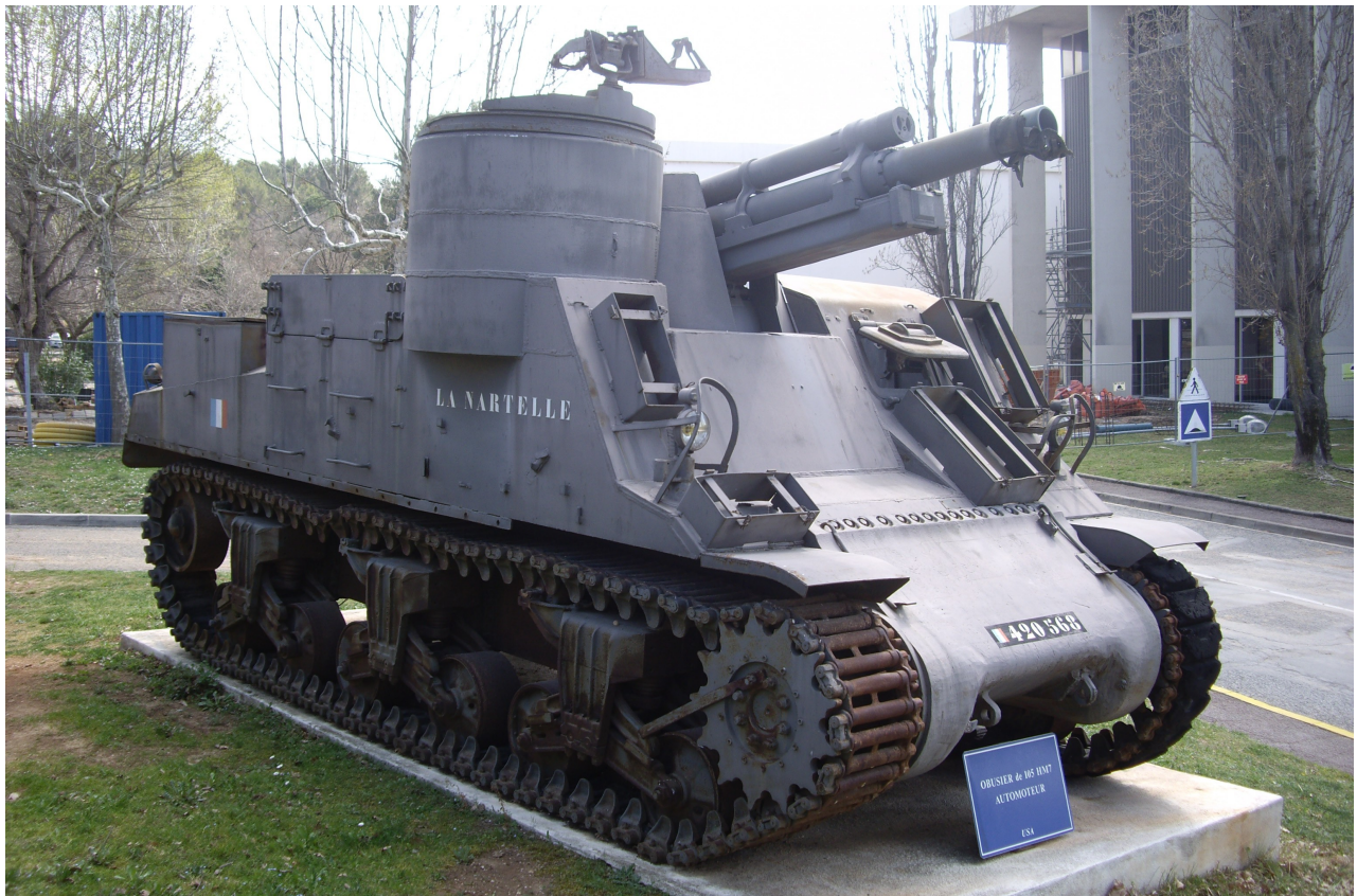
Pierre-Olivier Buan, March 2012 - http://the.shadock.free.fr/Tanks_in_France/m7b2_draguignan/index.html