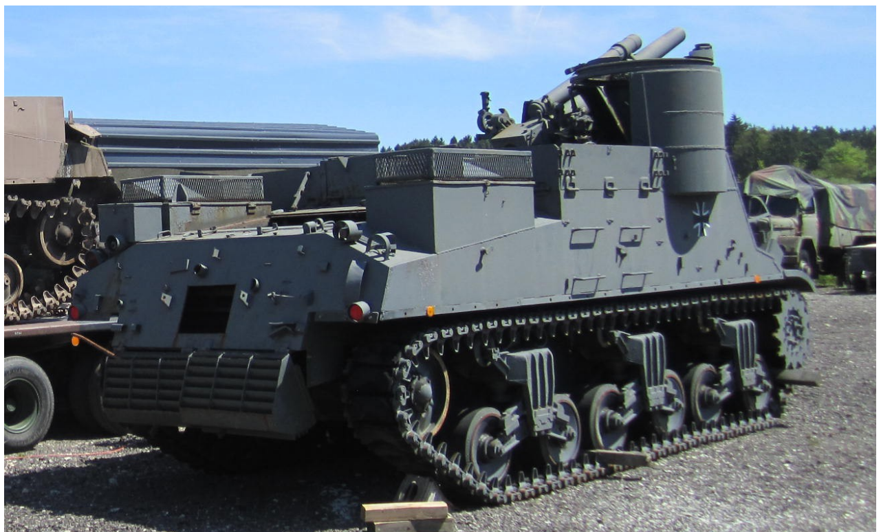
Wagner Armeefahrzeuge, August 2018