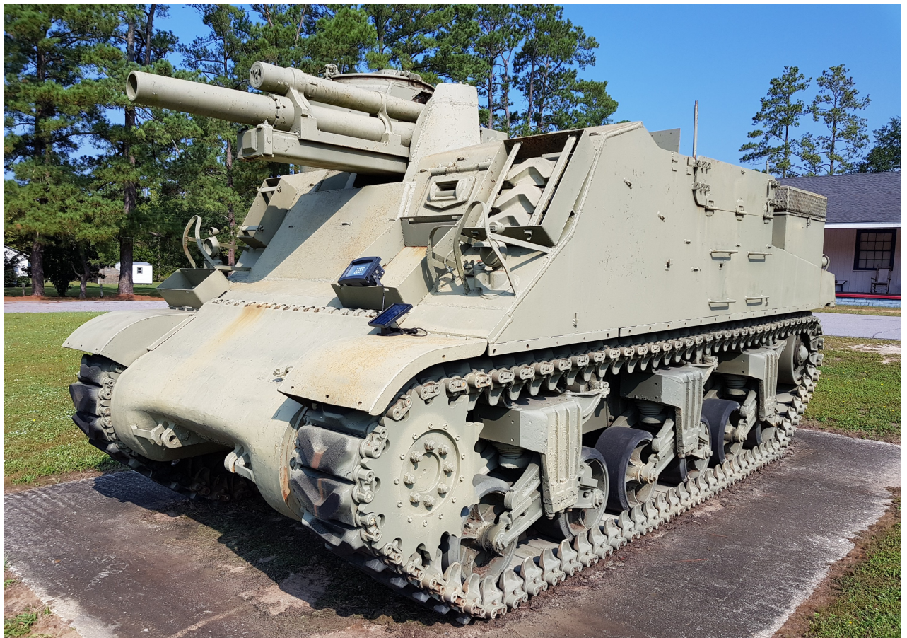
M7B2 Priest – Sanford, NC (USA)

Doug Kibbey - http://www.com-central.net/index.php?name=Forums&file=viewtopic&t=13422