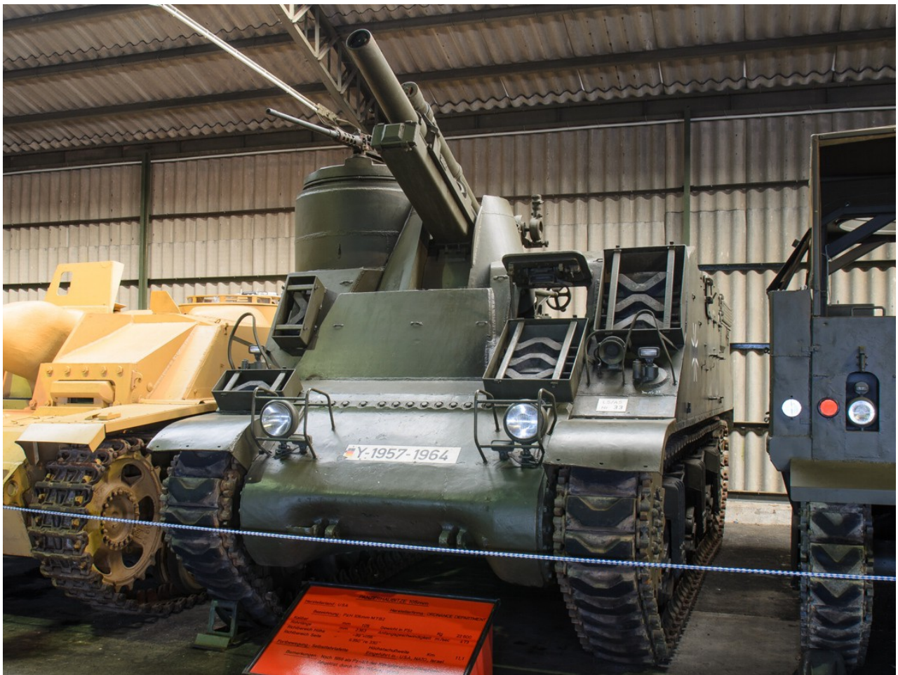
Axel Recke, 2012