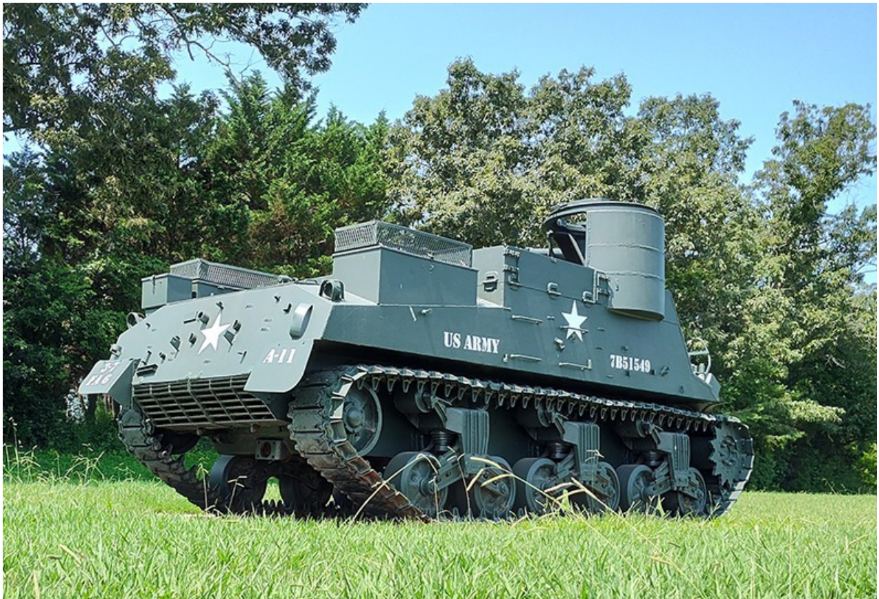
M7B2 Priest – Tennessee ARNG Armory, Tullahoma, TN (USA)

https://www.facebook.com/americanlegionpost13TN/