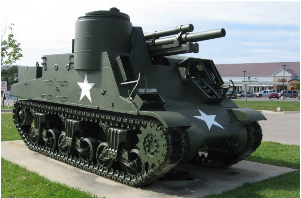
"Alf-Adams" - http://media.photobucket.com/image/m7b2%20priest/Alf-Adams/Michigan%20AFVs/IMG_3224.jpg?o=4