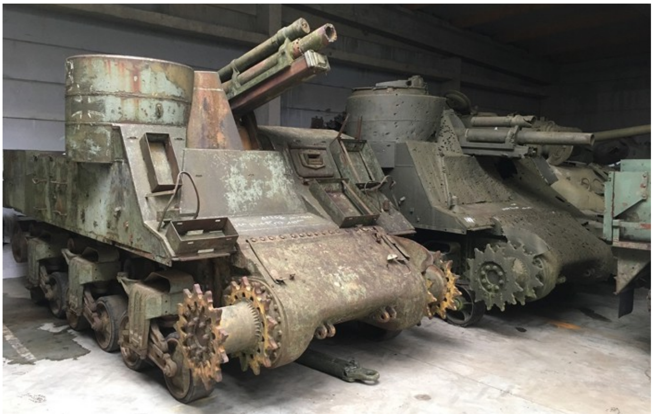
M7B2 Priest wreck – Private collection (Netherlands)

https://www.milweb.net/classifieds/view_large.php?ad=95956