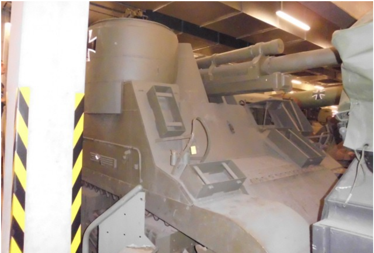
M7B2 Priest – Auto + Technik Museum, Sinsheim (Germany)

Pierre-Olivier Buan, February 2007 - http://news.webshots.com/photo/2303508100100192038IMAZZ