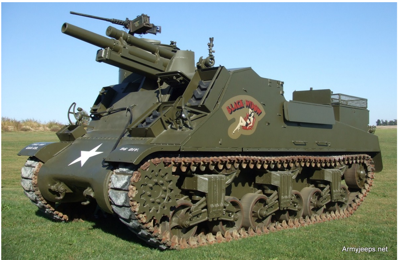
M7B2 Priest – North gate to Warren Air Force Base, Cheyenne, WY (USA)

Paul Hannah, March 2017 - http://www.vgbimages.com/