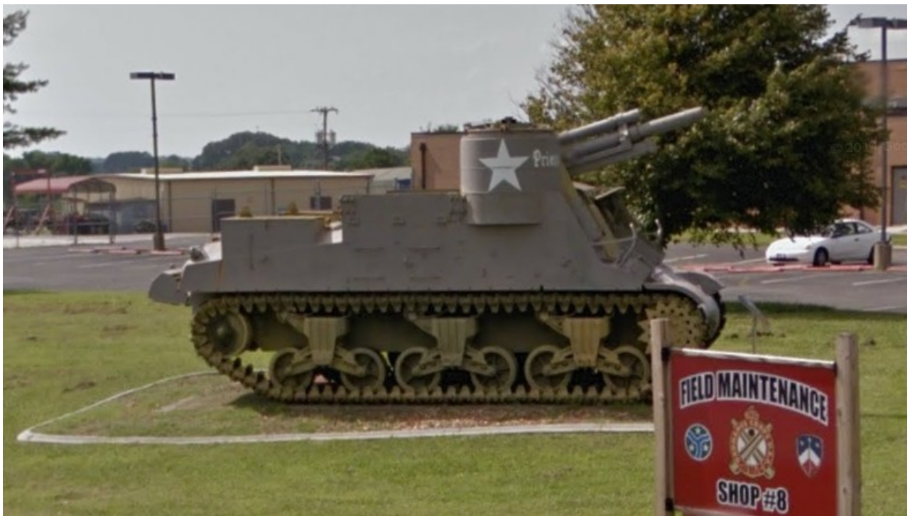
M7B2 Priest – Knoxville, TN (USA)