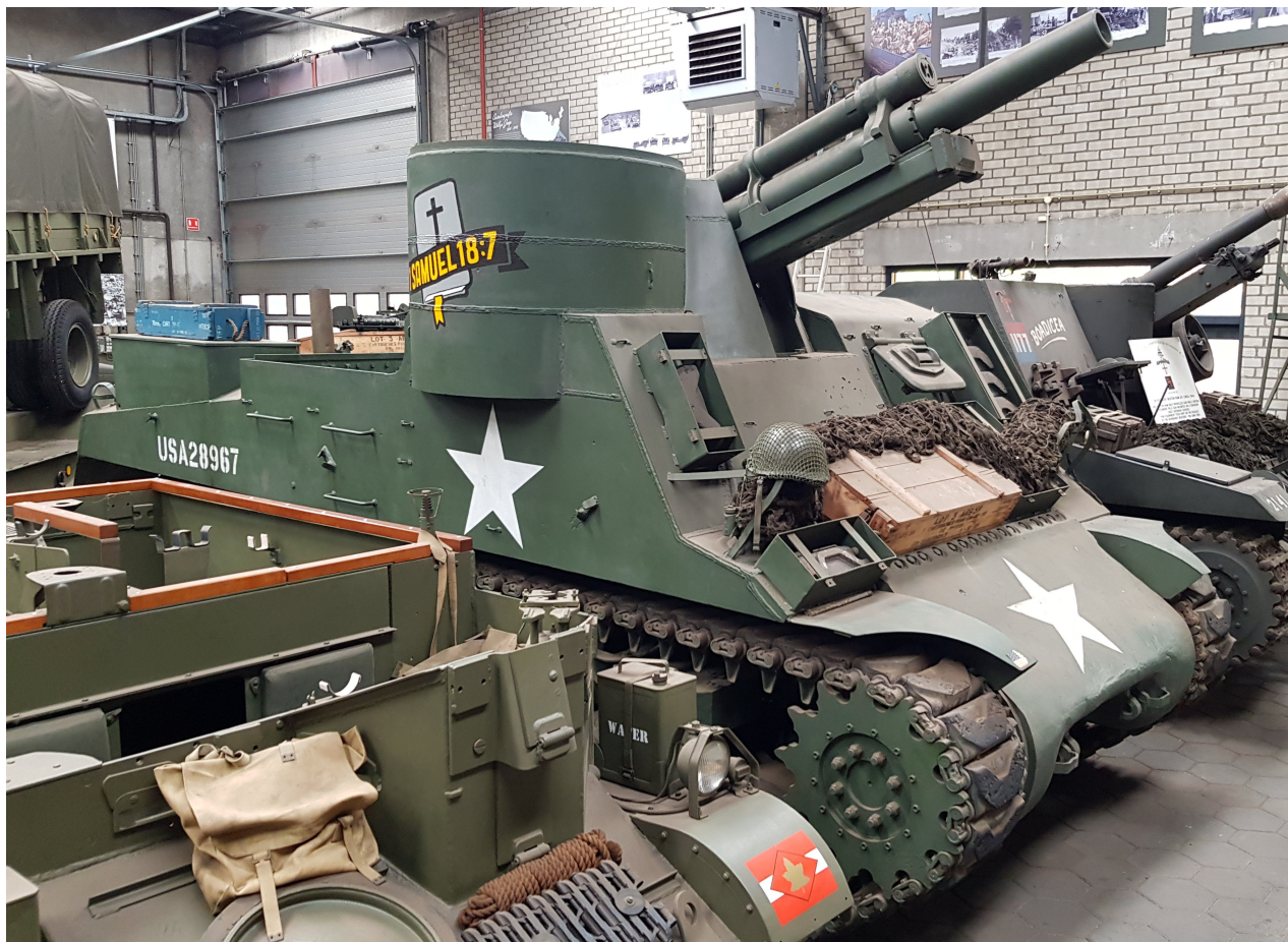
Pierre-Olivier Buan, October 2022