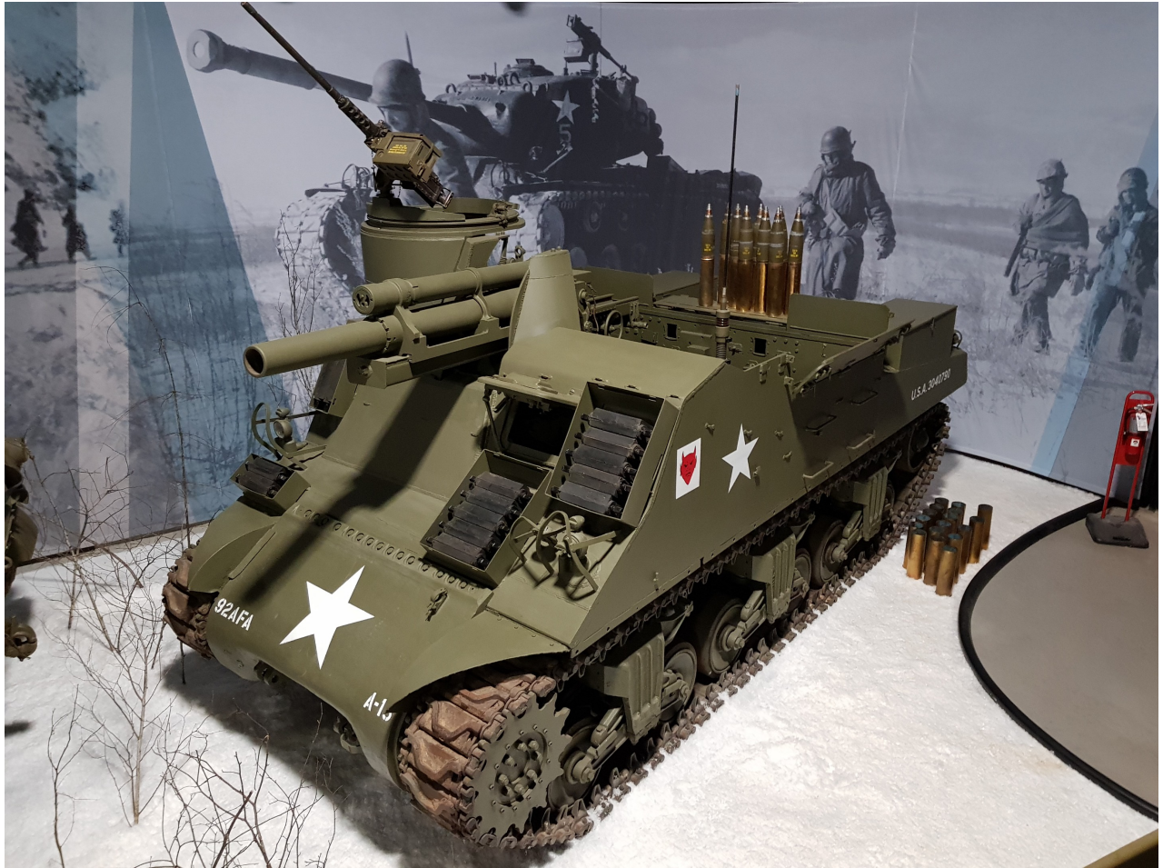
Pierre-Olivier Buan, September 2019