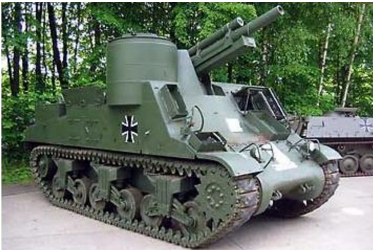
M7B2 Priest – Barbara Kaserne, Delmenhorst (Germany)

http://www.hartziel.de/index.htm?/sockel/11_bawue/seite2.htm