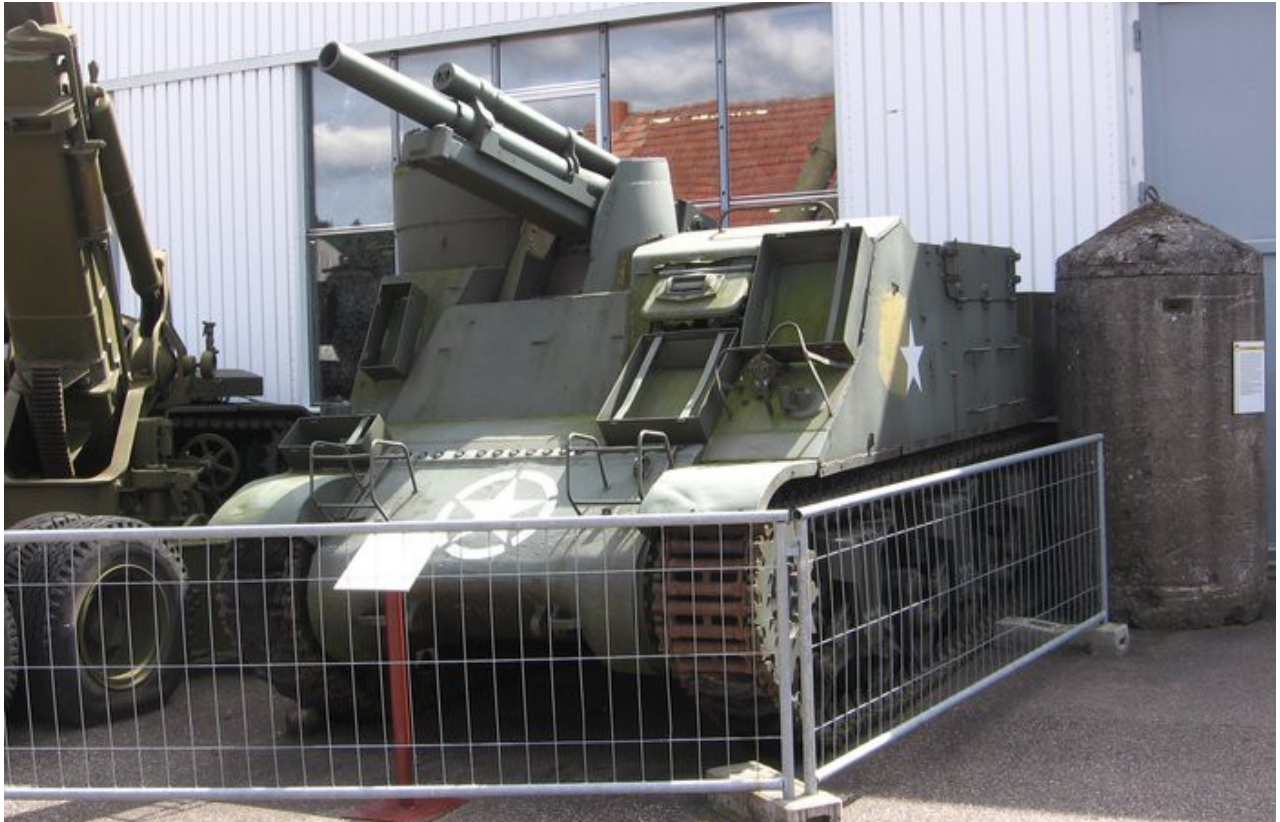
"312karl", August 2009 - http://312karl.rajce.idnes.cz/Stammheim_-_Museum_fur_Zeitgeschichte/