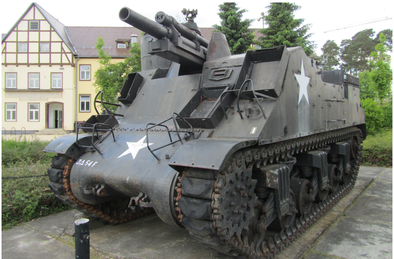
M7B2 Priest – Wehrtechnische Dienststelle Meppen (Germany)

https://www.facebook.com/photo.php?fbid=1134196379925951&set=pcb.1710359472520353&type=3&theater