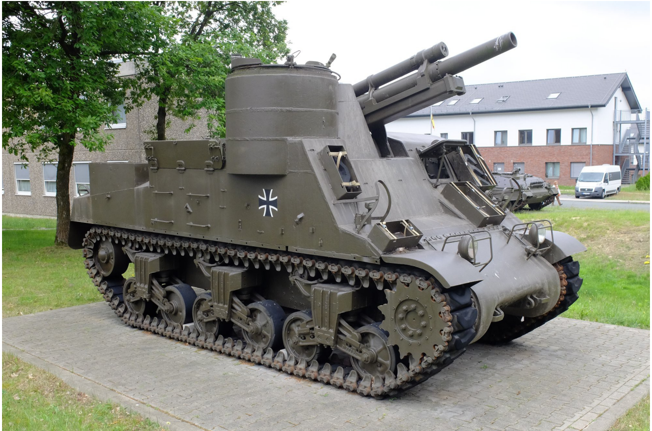
Kuine's military photography, June 2019 - https://www.facebook.com/pg/kuinemilitaryphotography/