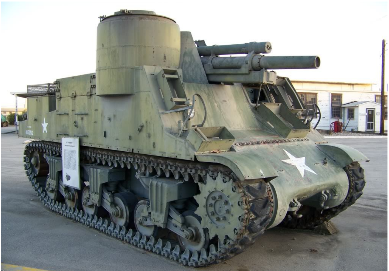
Neil Baumgardner, February 2008 - http://www.com-central.net/index.php?name=Forums&file=viewtopic&t=10815

M7B2 Priest – American Society of Military History "Tankland" South El Monte, CA (USA)