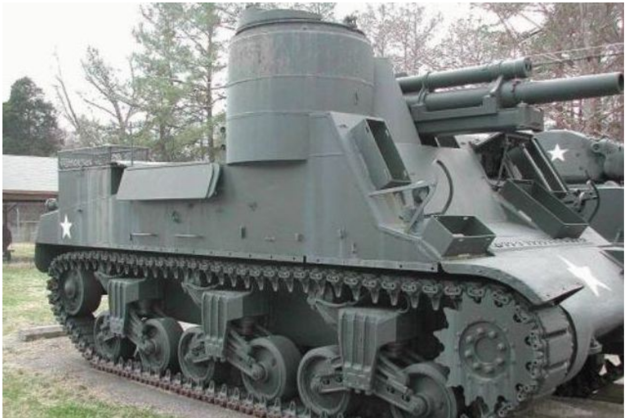
M7B2 Priest – West Virginia National Guard, Point Pleasant, WV (USA)

http://public.fotki.com/pcmodeler/reference_gallery/armor_reference_photos-1/105mm_howitzzer_moto/