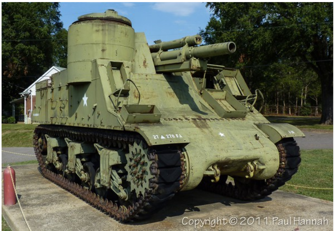
M7B2 Priest – Union City, TN (USA)