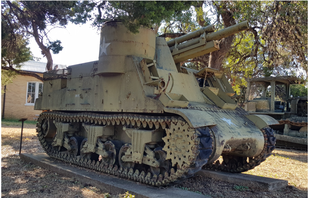
Pierre-Olivier Buan, September 2023