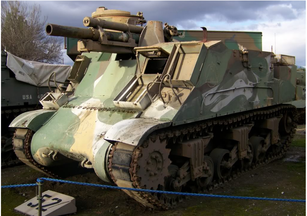
Neil Baumgardner, January 2008 - http://www.com-central.net/index.php?name=Forums&file=viewtopic&t=8705&highlight=tankland

M7B2 Priest – American Society of Military History "Tankland" South El Monte, CA (USA)