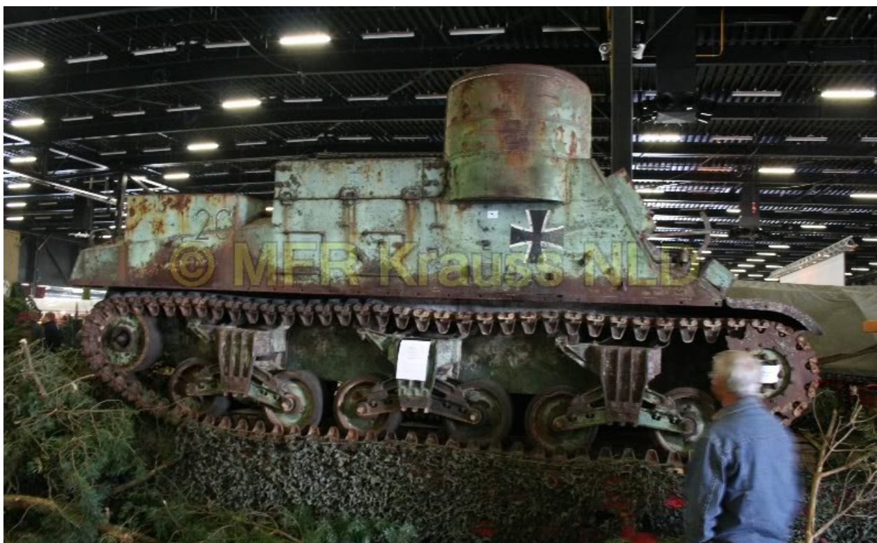
Michel Krauss - http://i1015.photobucket.com/albums/af278/panzerpanther5/NL-AFV-register/M7B2Priest_04.jpg

Serial Number 4334, built by Pressed Steel Car in November, 1944