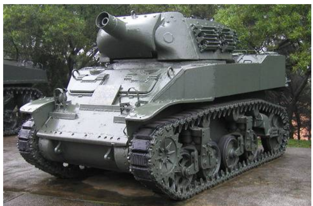
June 2010 - http://blog.xuite.net/maomi/Food01/34559980

M8 HMC – Tu Vu (Viet Nam) The tank belonged to 3rd Squadron of 1er Régiment de Chasseurs à Cheval and was recovered in 1996 from river near Vu Tu. This vehicle and other Stuart tanks were destroyed in December 1951 during the attack of 308th Regiment of Viet Minh on military post in Tu Vu (<u>http://bantroi.blogspot.com</u>)