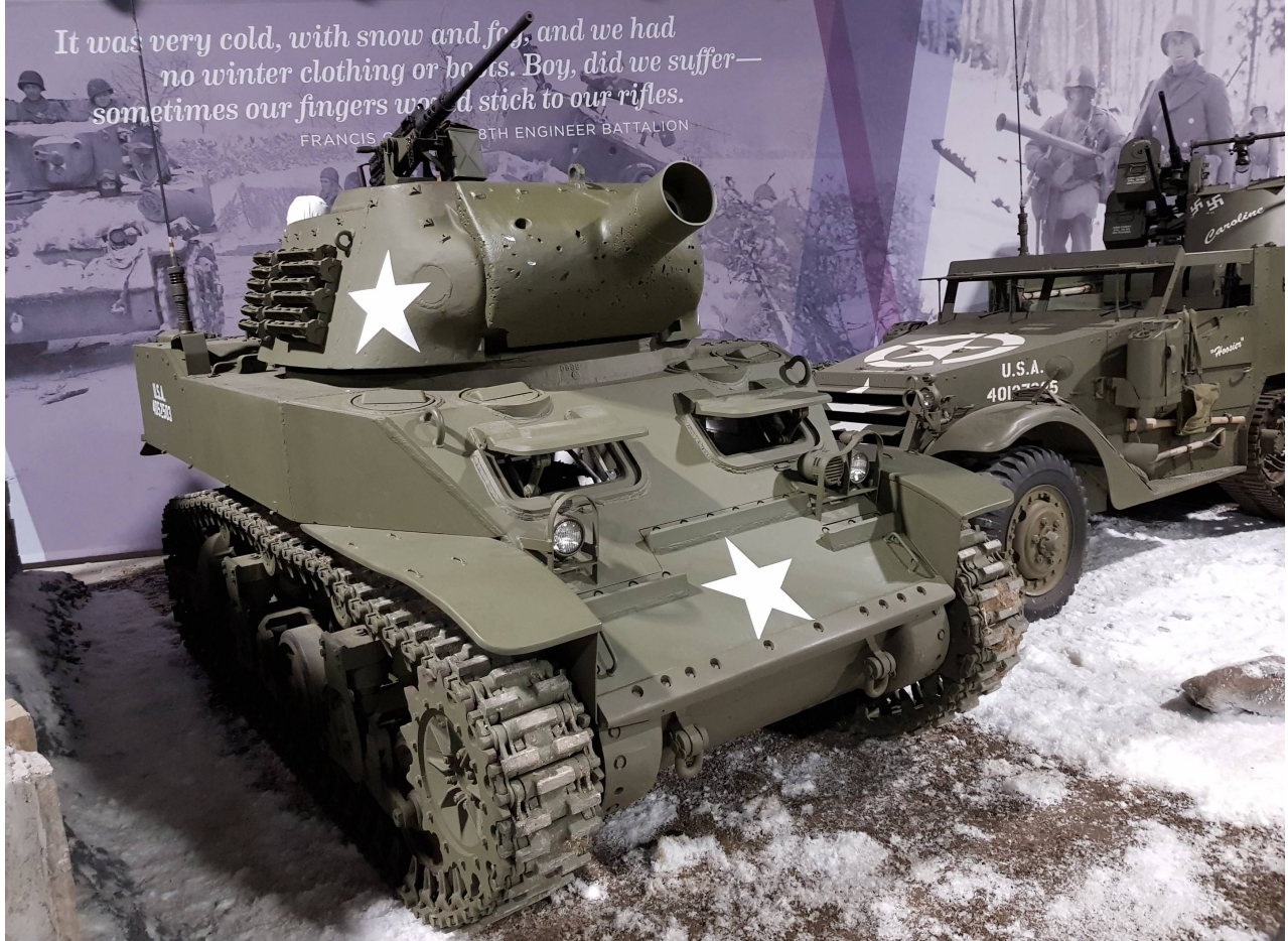
Pierre-Olivier Buan, September 2019