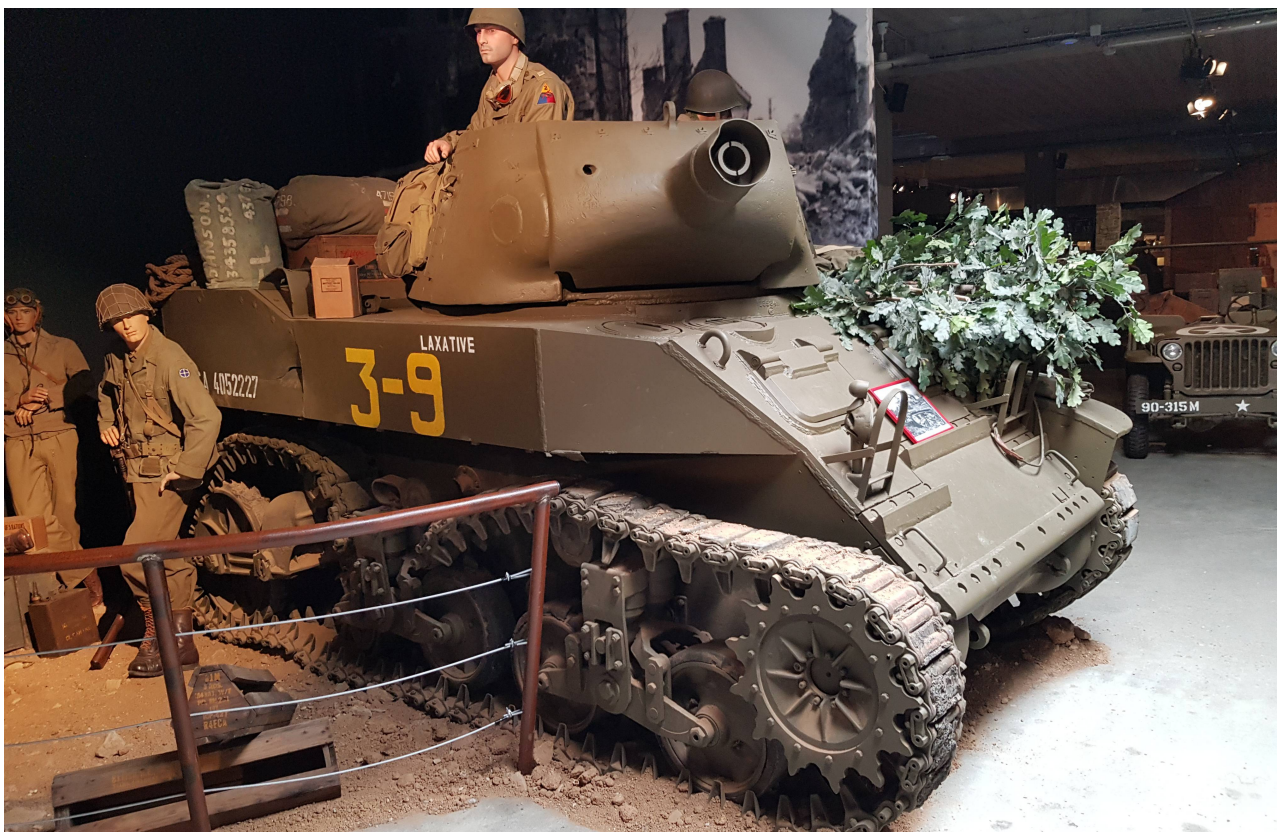
M8 Howitzer Motor Carriage – Musée des Blindés, Saumur (France) Serial Number A-1436 (France AFVs register)