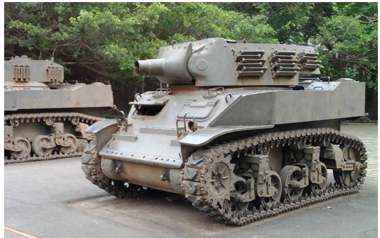
"Kc Chang", July 2016 - https://www.facebook.com/