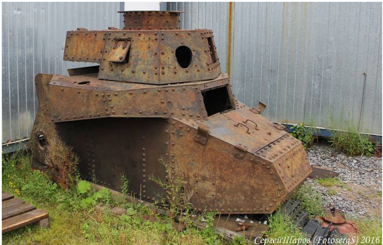
"FotosergS", August 2016 - https://fotki.yandex.ru/next/users/fotosergs/album/168893/view/647830

It is one of many T-18 used as strong holds on Molotov Line on Russian-German border of 1939-1941. It was part of Przemyśl Fortified Region and was discovered in the 1990s and recovered from Leżachów village near Sieniawa, where it was used as strong hold near San river (Rafał Białęcki)