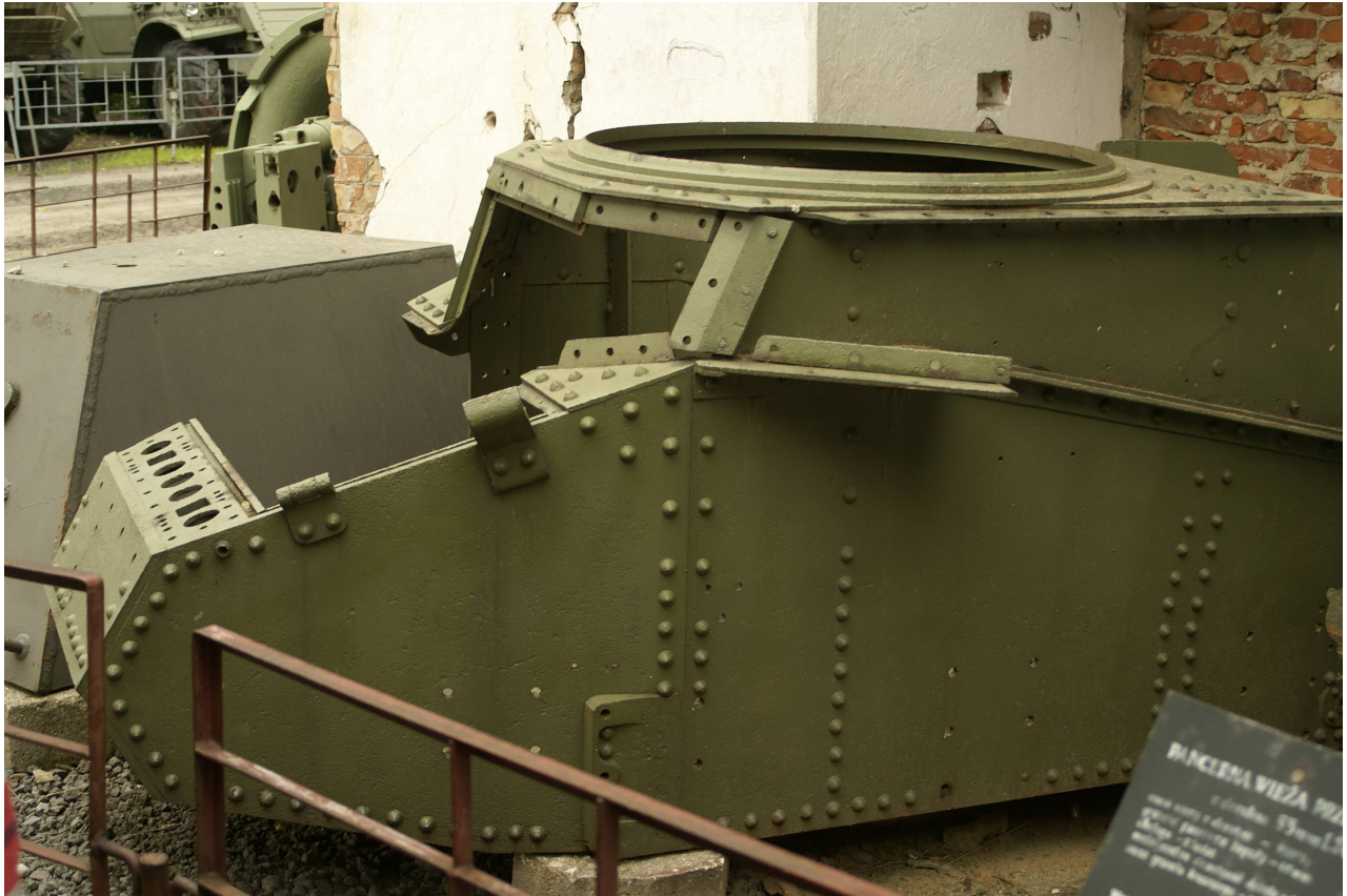
Rafał Białęcki, September 2008