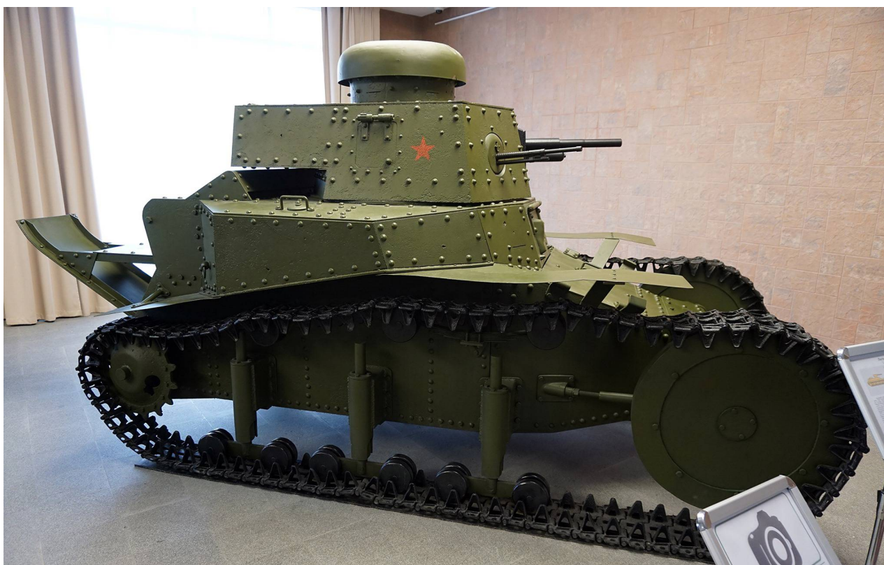
Vitaly Kuzmin, March 2020