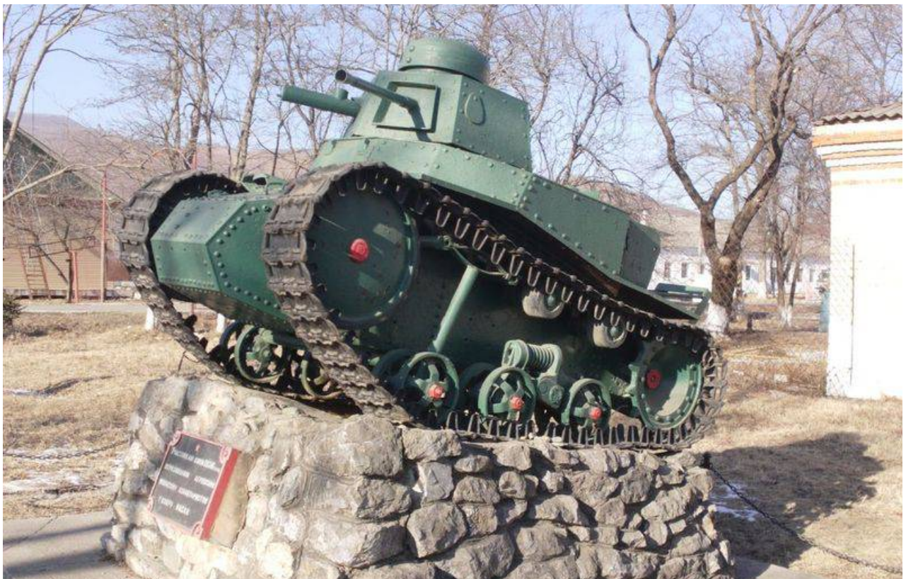
MS-1 (T-18) m1930 – Slavjanka, Primorski Krai (Russia)