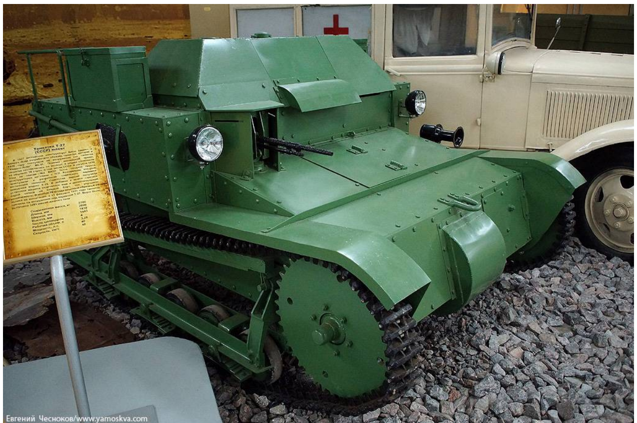
T-27 – Kubinka Tank Museum (Russia)