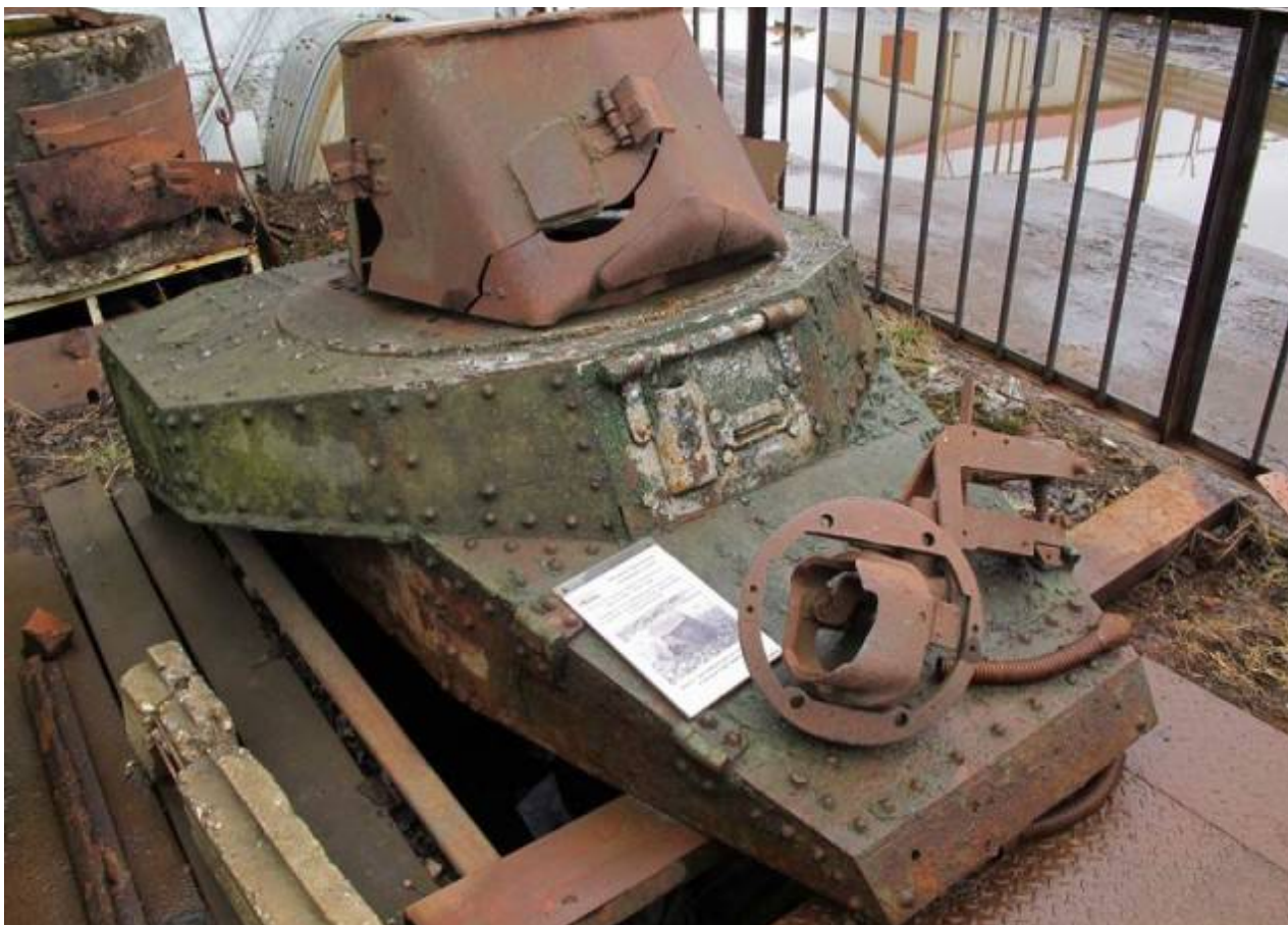
"FotosergS", October 2010 - http://fotki.yandex.ru/users/fotosergs/view/304454?page=48