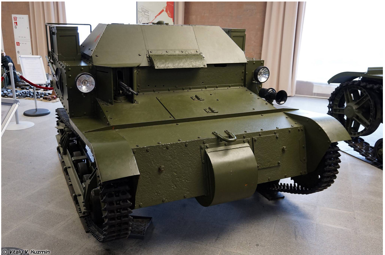
T-27 – Alakurtti, Murmansk Oblast (Russia)

Ivan Vdovin - http://pomnite-nas.ru/mshow.php?GalleryID=1&photoPage=2&s_OID=3638