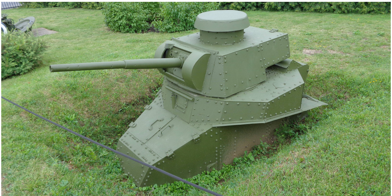
MS-1 (T-18) m1927 – Museum of the Pacific Fleet History Vladivostok, Primorski Krai (Russia)