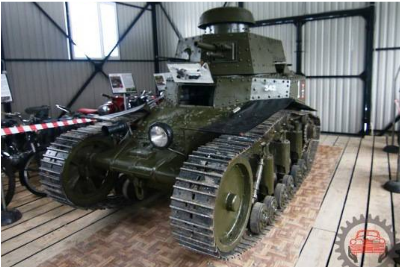
MS-1 (T-18) – Military History Museum, Khabarovsk, Khabarovsk Krai (Russia)

http://cdn.fishki.net/upload/post/201505/10/1527923/dsc_0051.jpg