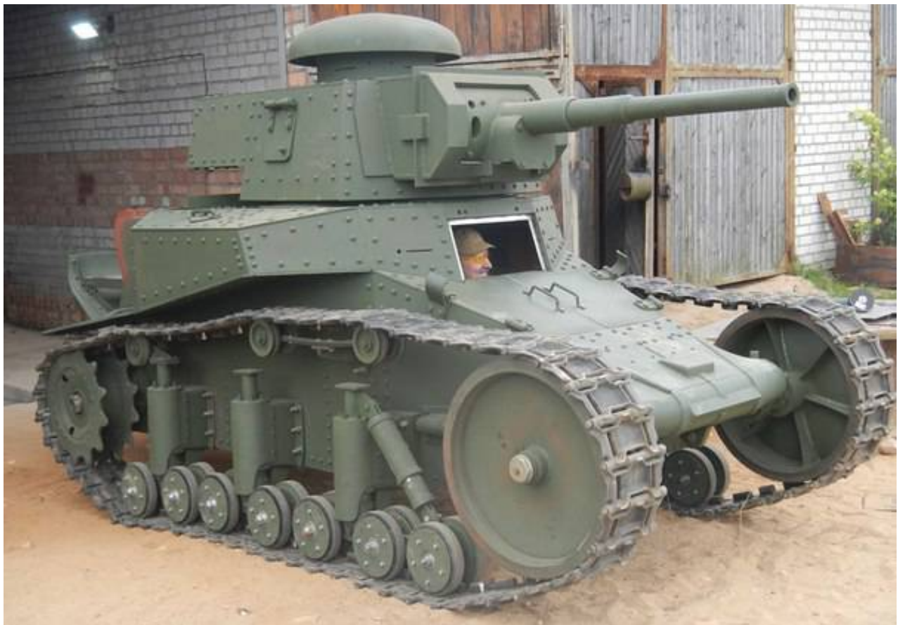
MS-1/T-18 reproduction – Park Patriot, Kamensk-Shakhtinsky, Rostov Oblast (Russia)

https://vk.com/album-112161094_228667471