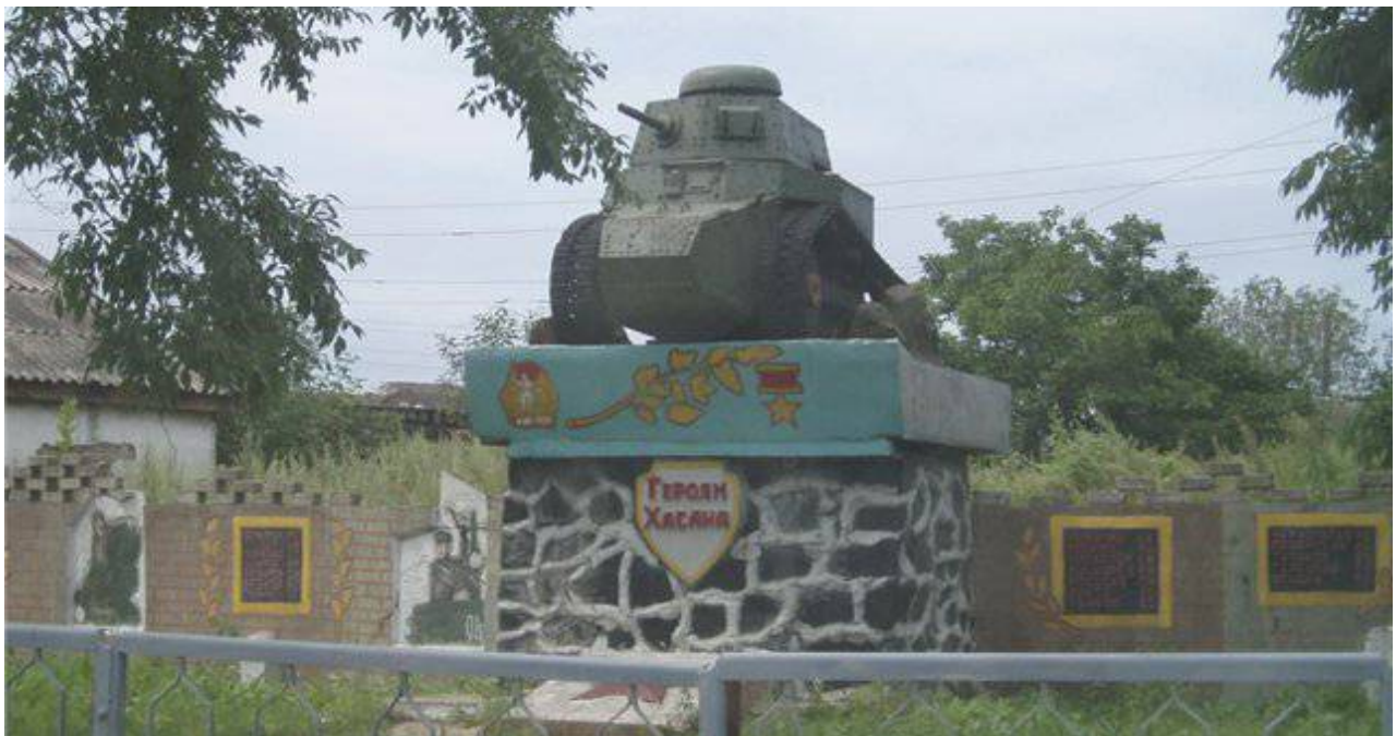
MS-1 (T-18) m1930 – Posiet, Primorski Krai (Russia)

http://foto.radikal.ru/f.aspx?k07012a4d60f57868jpg