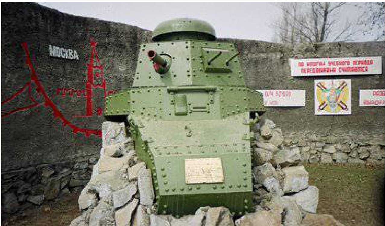
MS-1 (T-18) m1930 – HQ of the 5 th Army, Ussuriysk, Primorsky Krai (Russia) – running c. This vehicle has been photographed during a military parade in 2005, but it is now on static display

http://foto.radikal.ru/f.aspx?c0610c157cad5dc18jpg