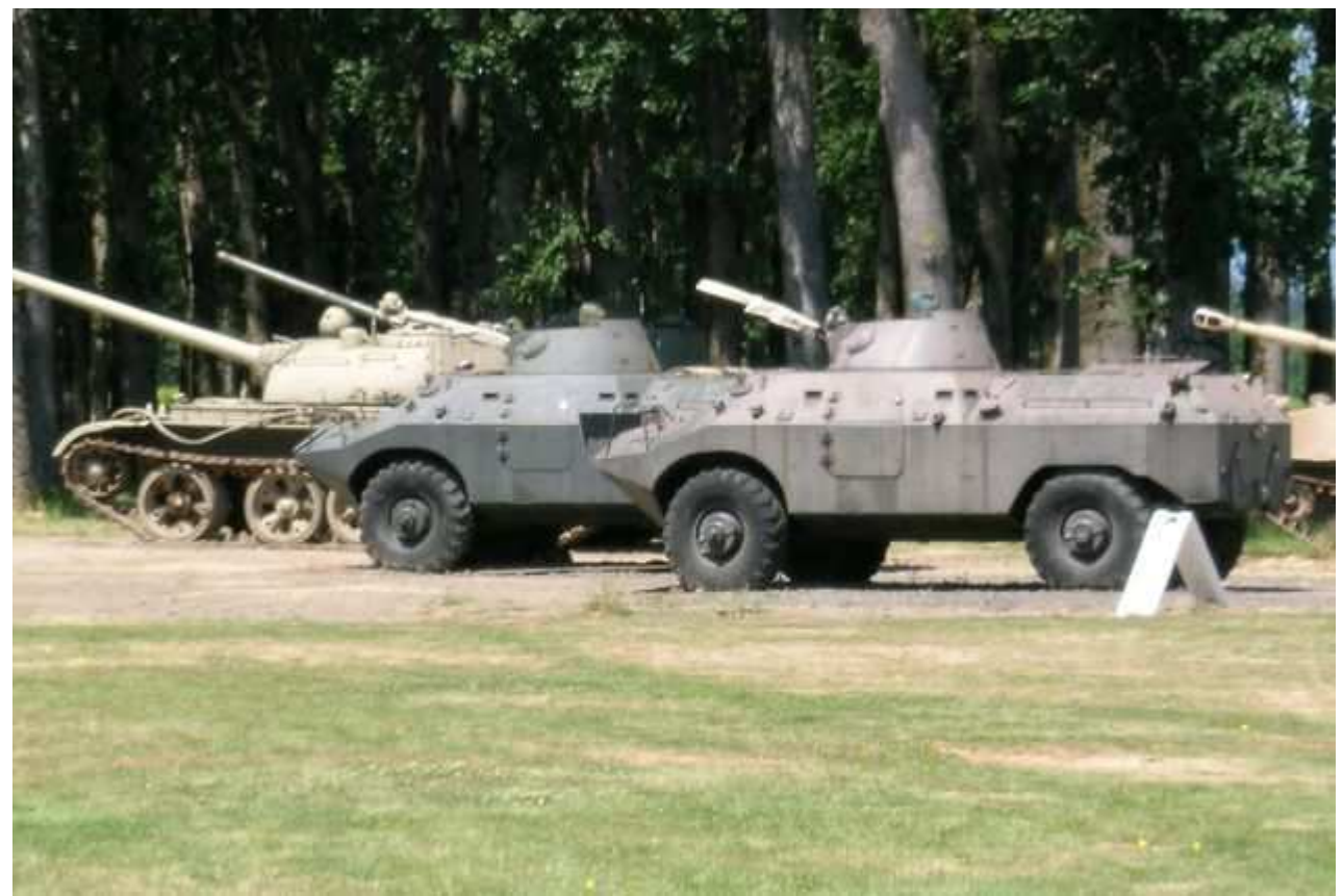
PSzH – Unknown location (Hungary)

"Frog Taco", July 2006 - http://www.flickr.com/photos/frogtaco/199129793/in/set-72157594213159476/