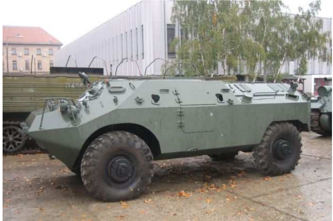
"charlie21", November 2006 - http://kep.tar.hu/charlie21/50386805/26623040#2