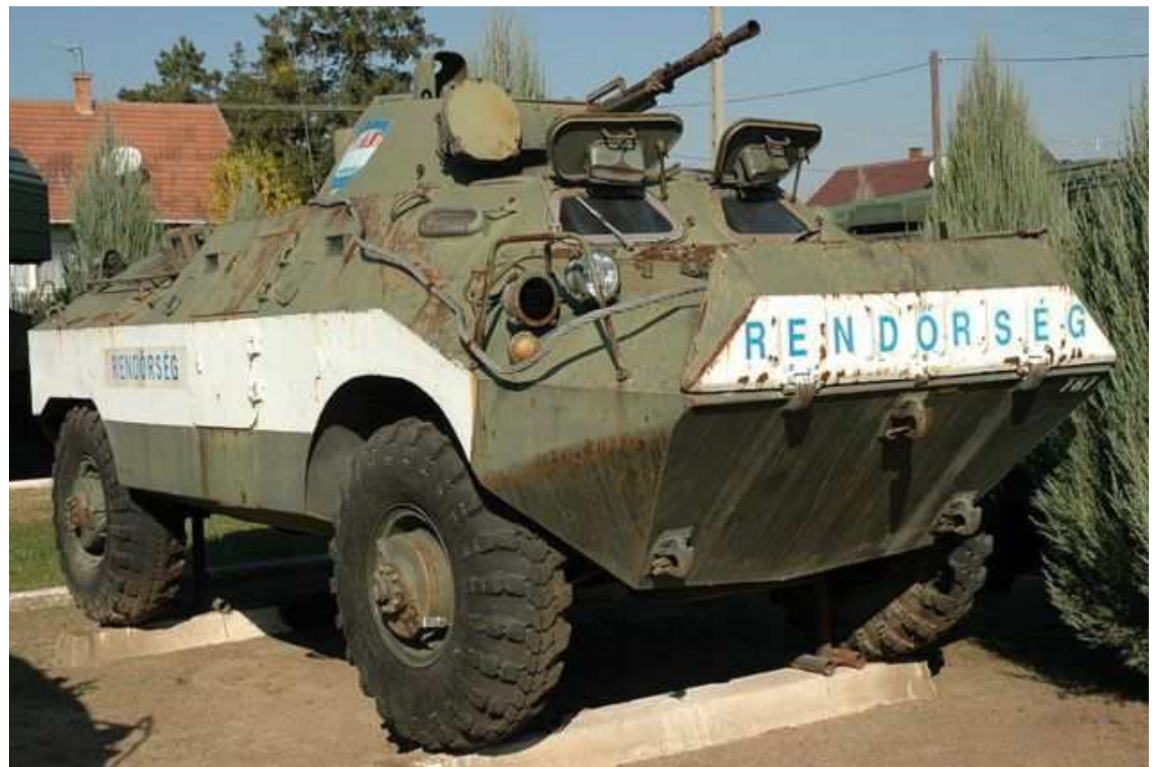
"VargaA", October 2005 - http://commons.wikimedia.org/wiki/File:PSZH_D944_Police_Hun_2.jpg