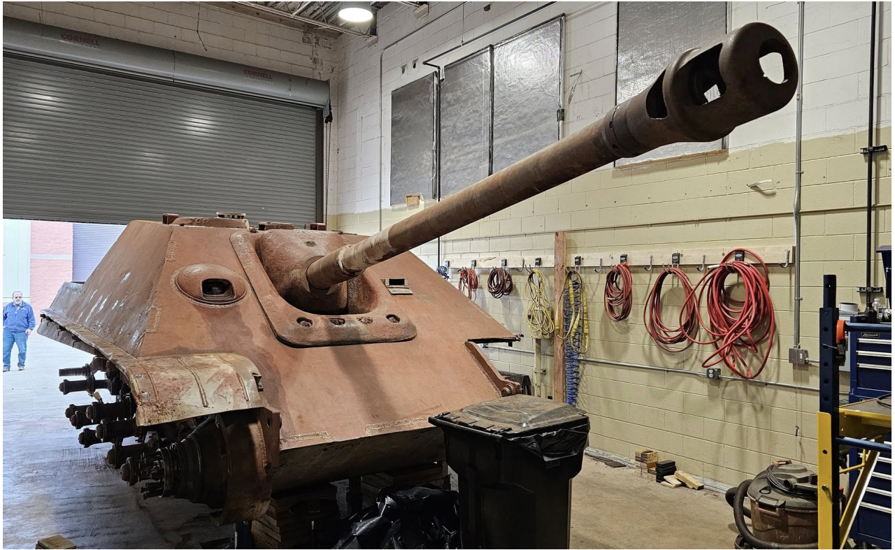
Rob Cogan, December 2024