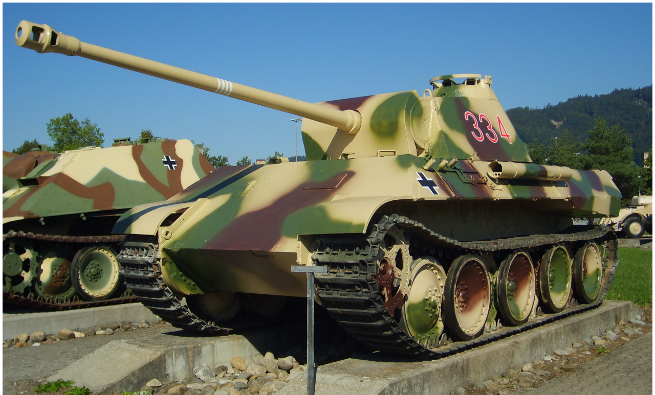
Stephen Drew, August 2006 - http://www.tanxheaven.com/sd/ThunTankMuseum2006/ThunTankMuseum06.htm

It was restored in 2004–2005 for static display by Kevin Wheatcroft in exchange for the engine and gearbox (Wikipedia). This tank was donated by the Polish Troops as a memorial for their liberation of the city in 1944, according to a plate on the tank