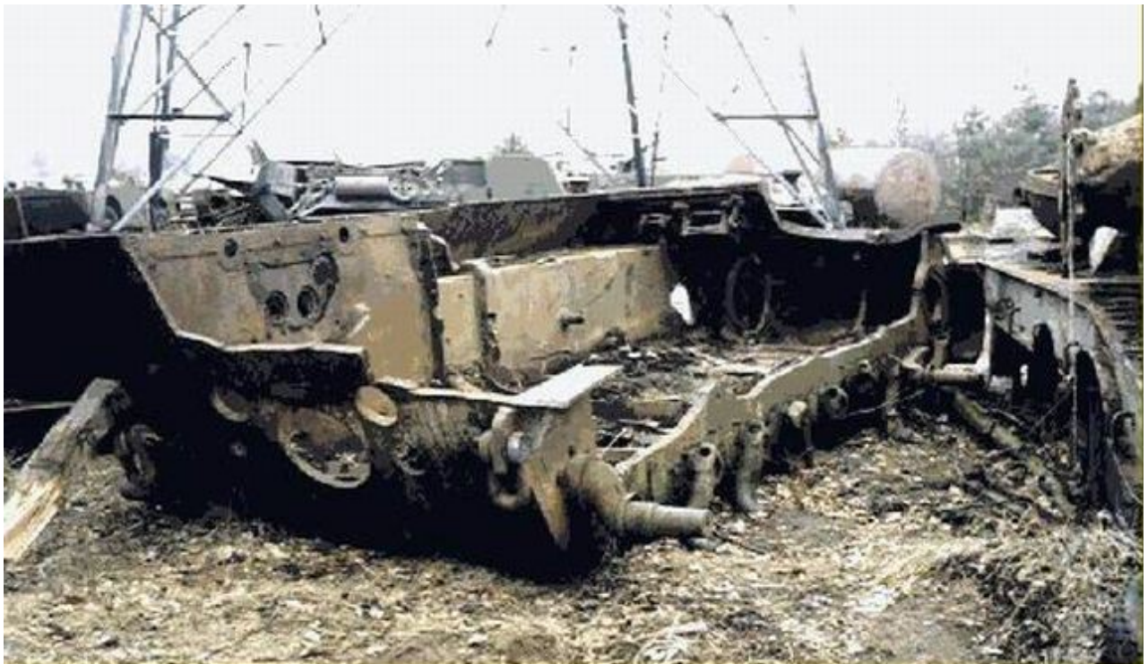
Panther turret part – Museum im. Orła Białego, Skarżysko-Kamienna (Poland)

June 2004 - http://www.orzelbialy.dmkhosting.com/galeria/thumbnails.php?album=30