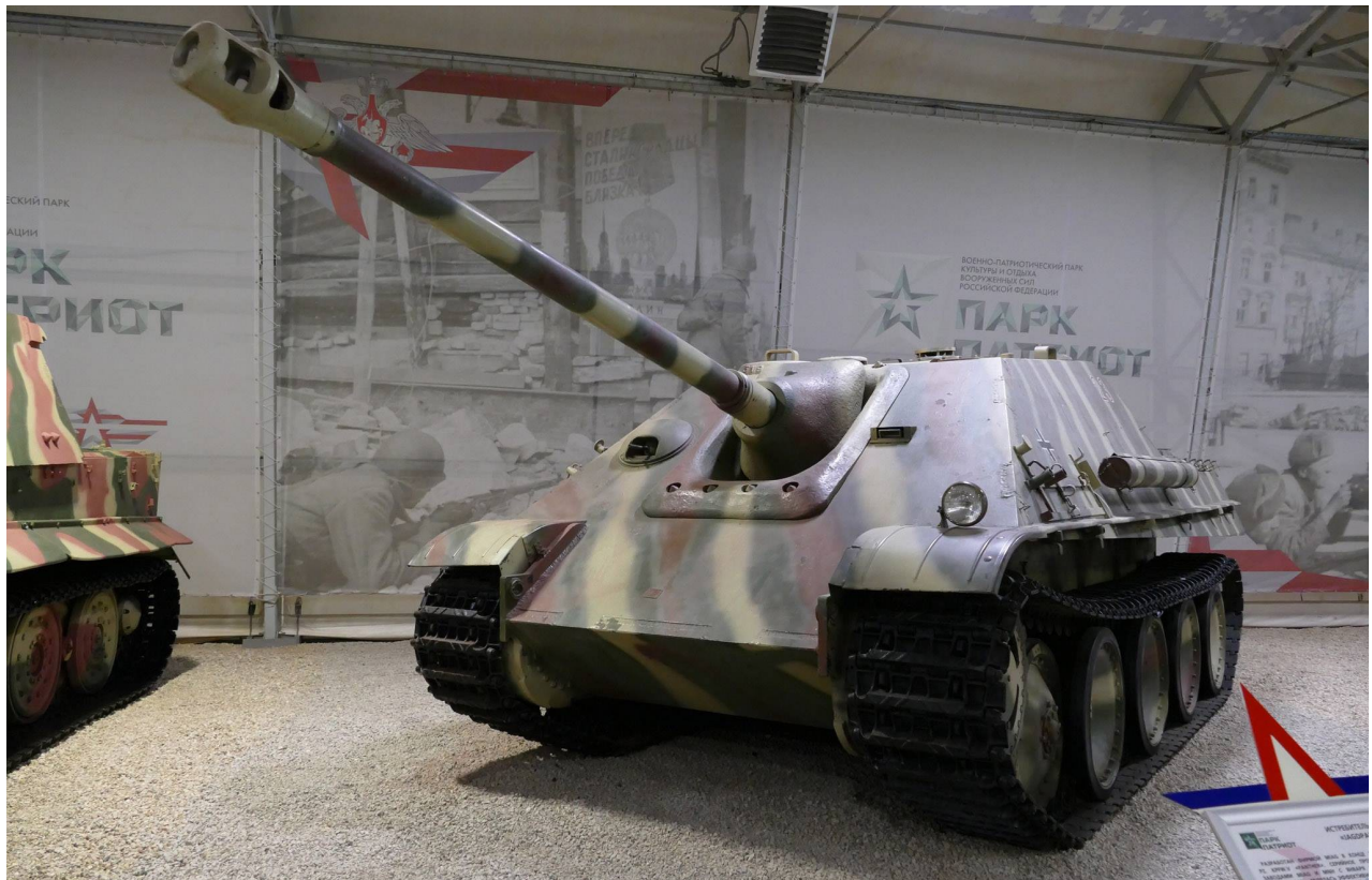
Yuri Pasholok, April 2019