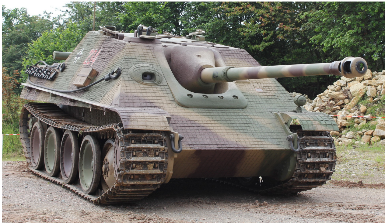
Hein Freund, June 2012 - http://freundhein11.fr.funpic.de/pics/120630/