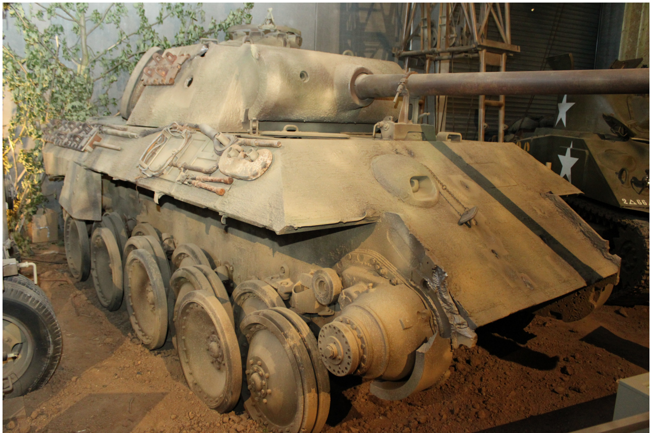
Sander Degeling, June 2013