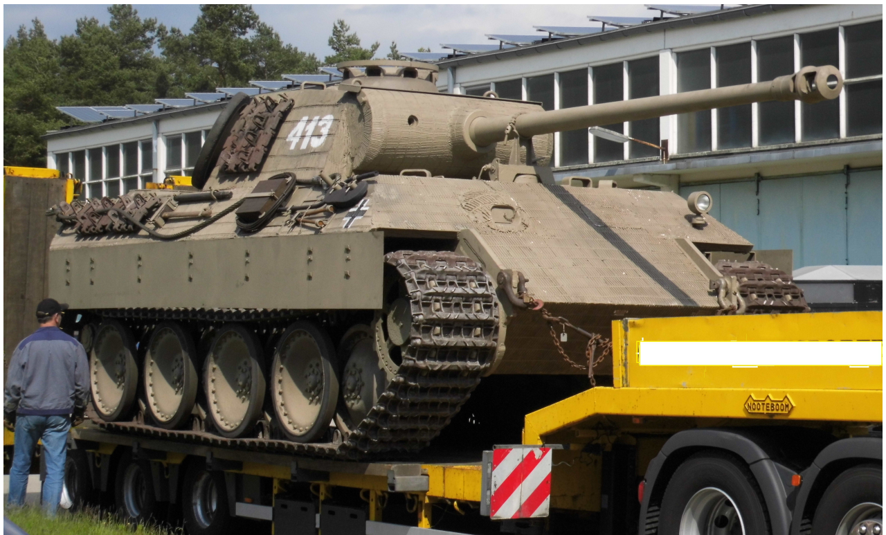
"Stefan", May 2015

More details about the recovery here : http://www.detektorweb.cz/index.4me?s=show&i=8171&mm=1&vd=1