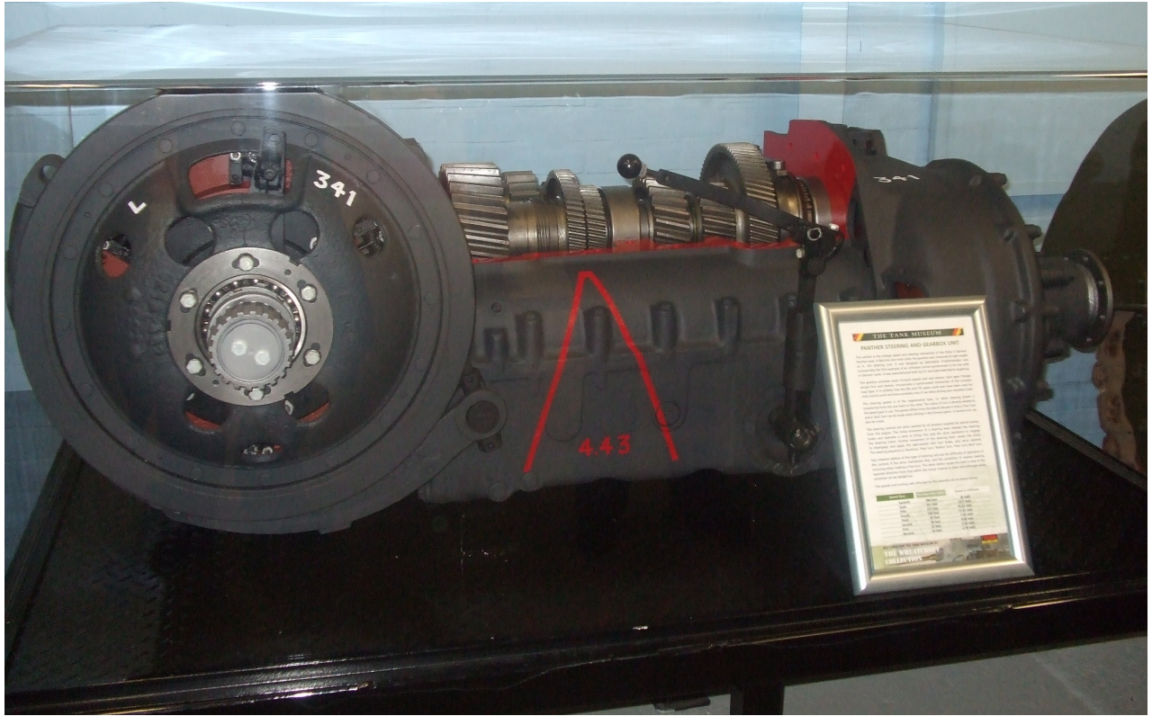
Rob Rhoades, June 2008