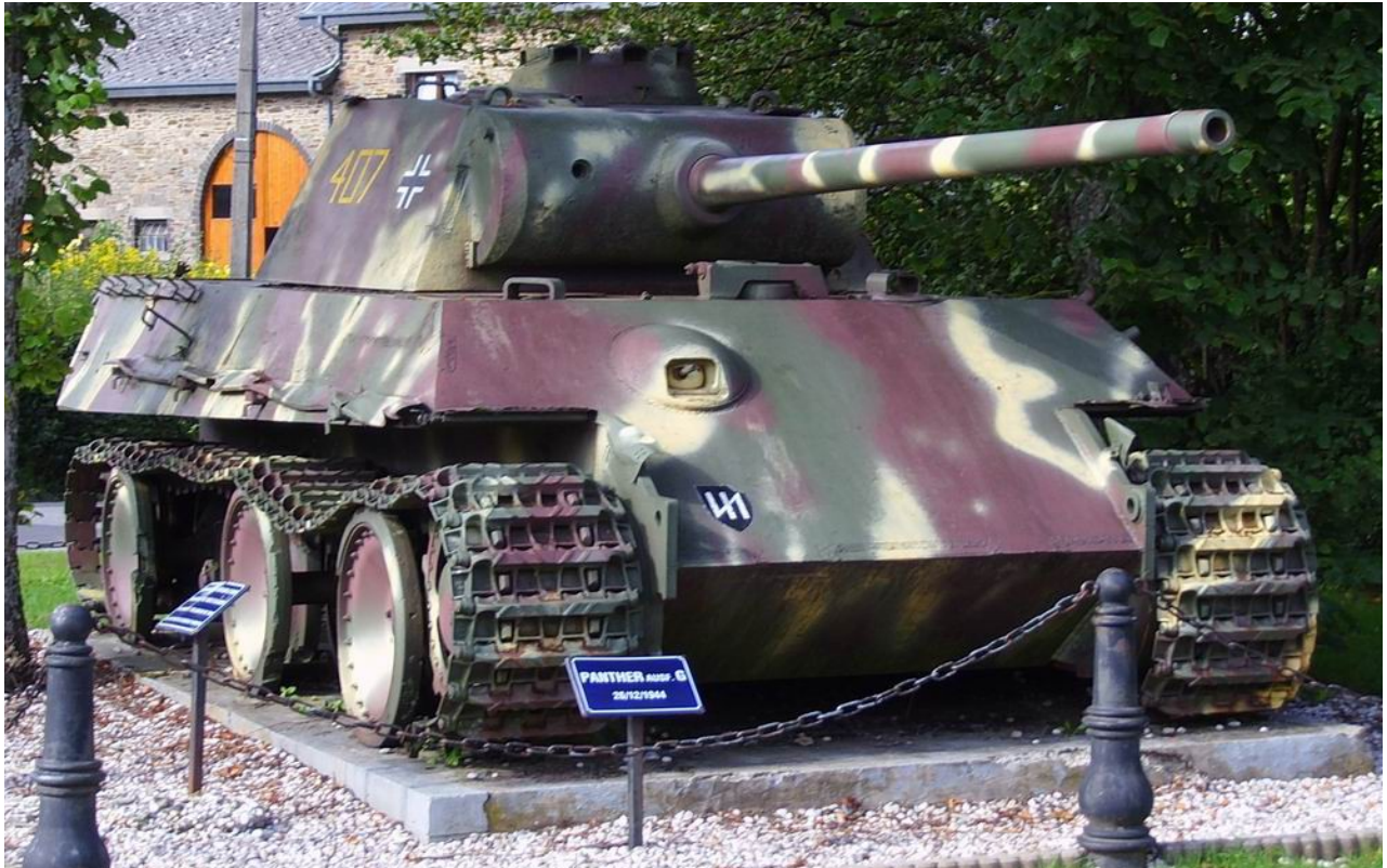
"Sander D", September 2005