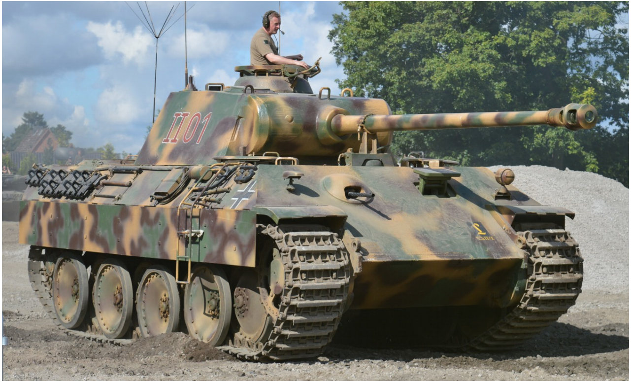
Bernd Borchert, September 2017