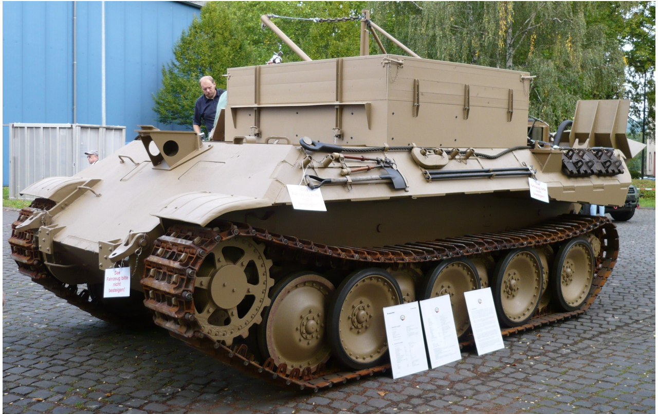
Jens Hill, September 2007 - http://www.primeportal.net/recovery/jens_hill/bergepanther/