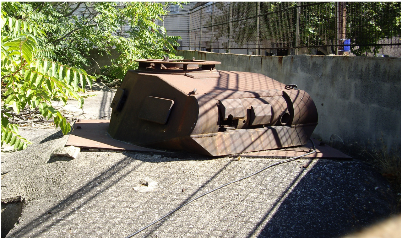
Pierre-Olivier Buan, July 2008 - http://the.shadock.free.fr/Tanks_in_France/pzII_marseille/index.html