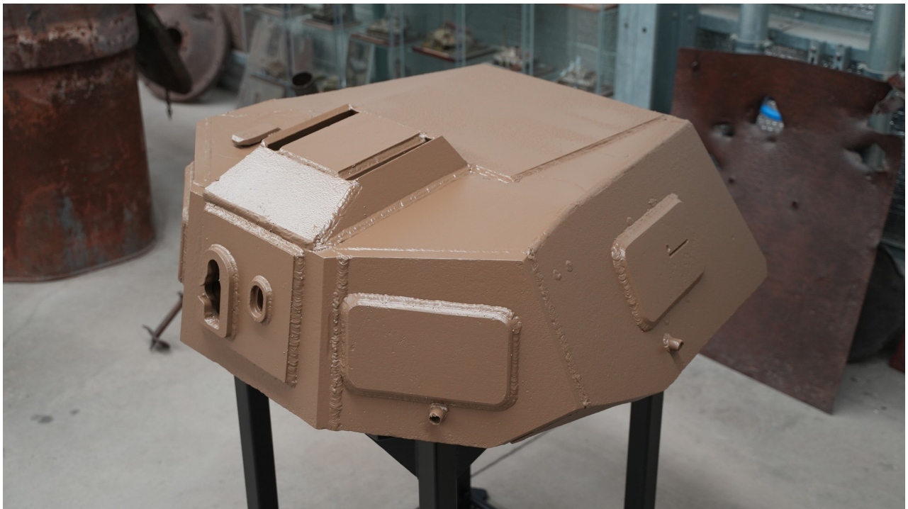
PzKpfw. II Flamingo turret – Rogaland Krigshistoriske Museum (Norway)

https://www.facebook.com/100064424540437/posts/1026488016175340/?rdid=l7Rd96rlu4Zcz72D