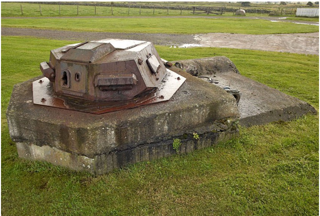
PzKpfw. II Flamingo turret – Festung Lista, near Stave, Farsund (Norway)

Ondrej Filip, August 2012 - http://zapisnik.fortif.net/opecvneni-na-poloostrove-lista/