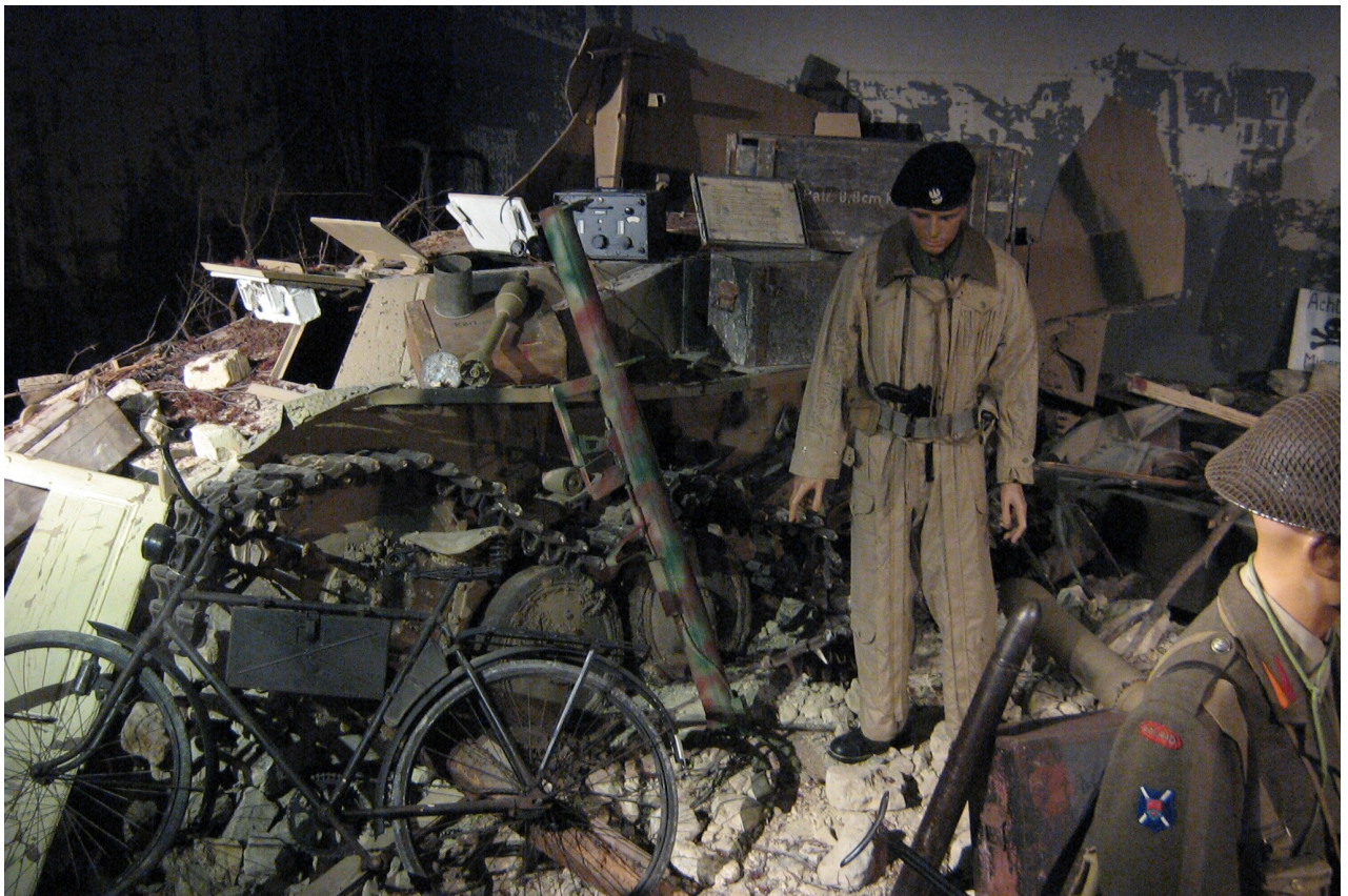
Wespe – Australian Armour and Artillery Museum, Cairns, QLD (Australia) Reportedly comes from the Becker collection