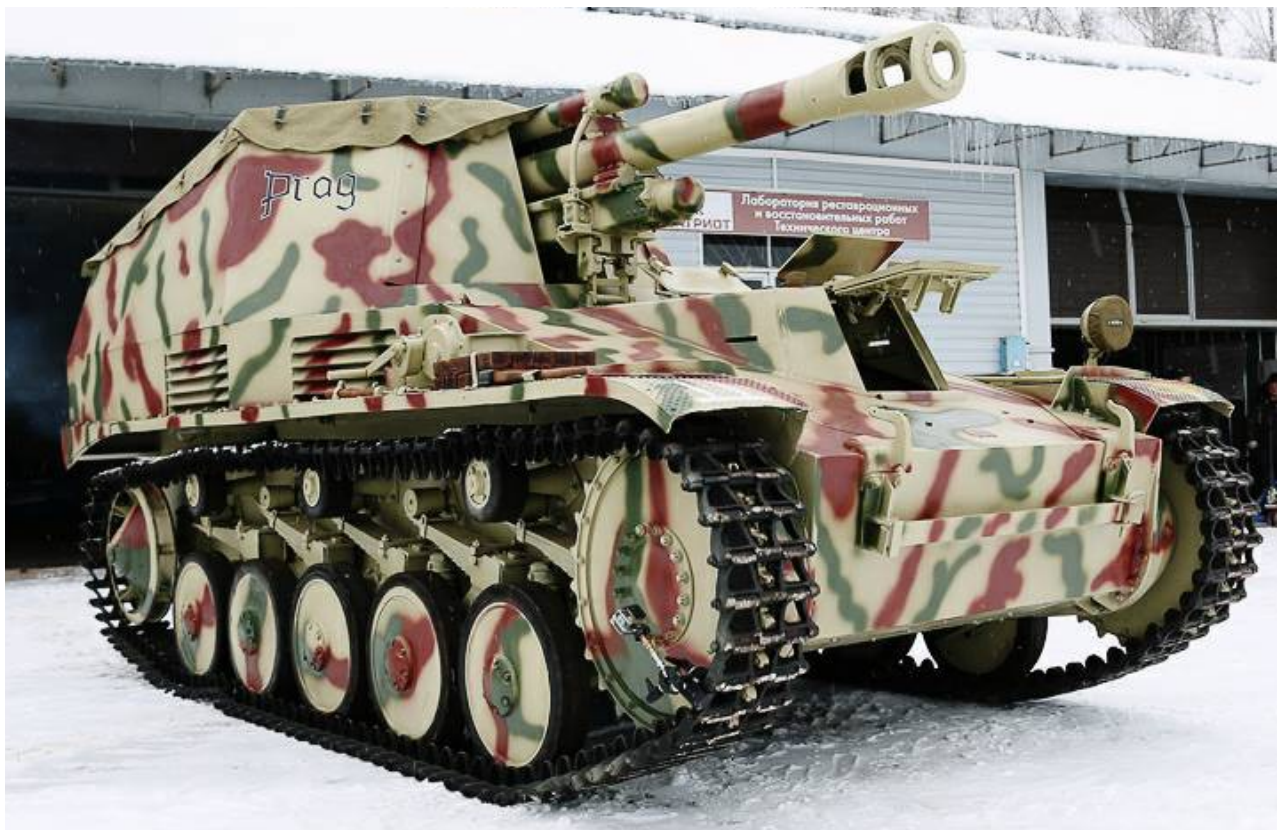
Patriot Park, December 2018