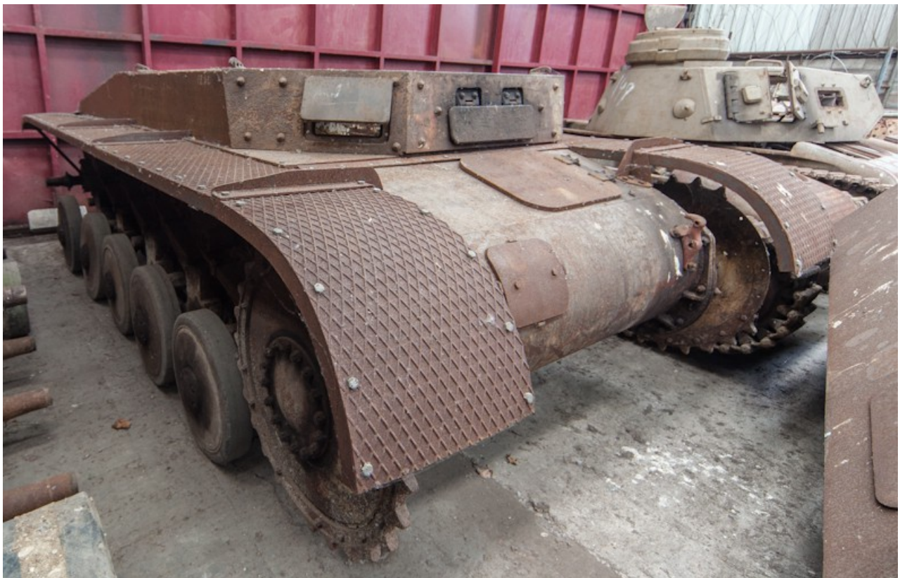
PzKpfw. II turret – Rantznau (Germany)

http://www.flickr.com/photos/foantje/8196812474/in/set-72157632037551397