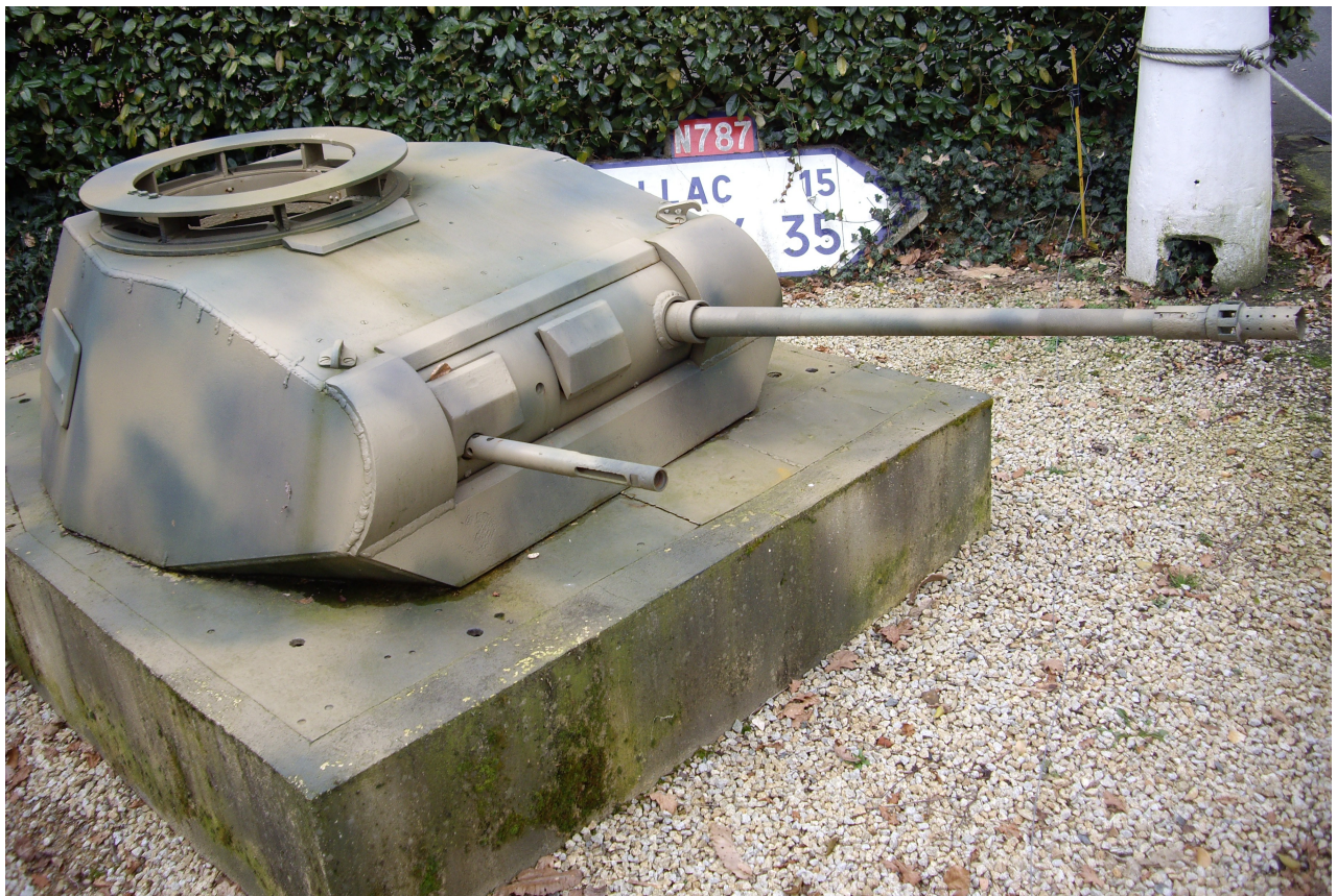
PzKpfw. II turret – Musée de l'armée, Invalides, Paris (France)

Pierre-Olivier Buan, March 2009 - http://the.shaddock.free.fr/Tanks_in_France/remember_lehon/index.html