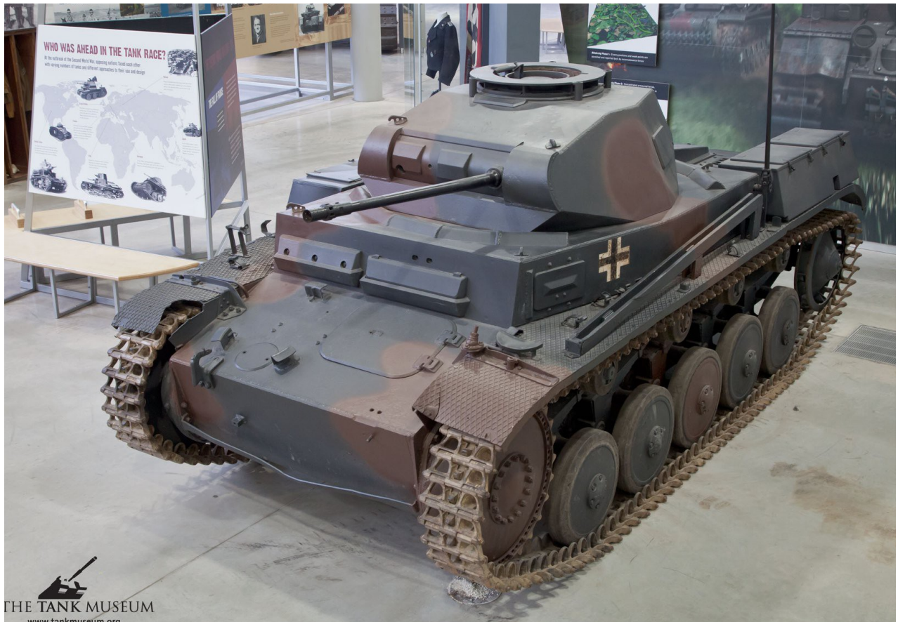
THE TANK MUSEUM www.tankmuseum.com

The Tank Museum, December 2020 - https://www.facebook.com/tankmuseum/photos/a.352150330841/10159003626840842/