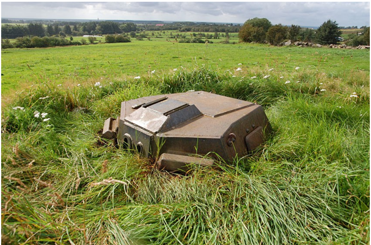
PzKpfw. II Flamingo turret – Festung Lista, near Hauge, Farsund (Norway)