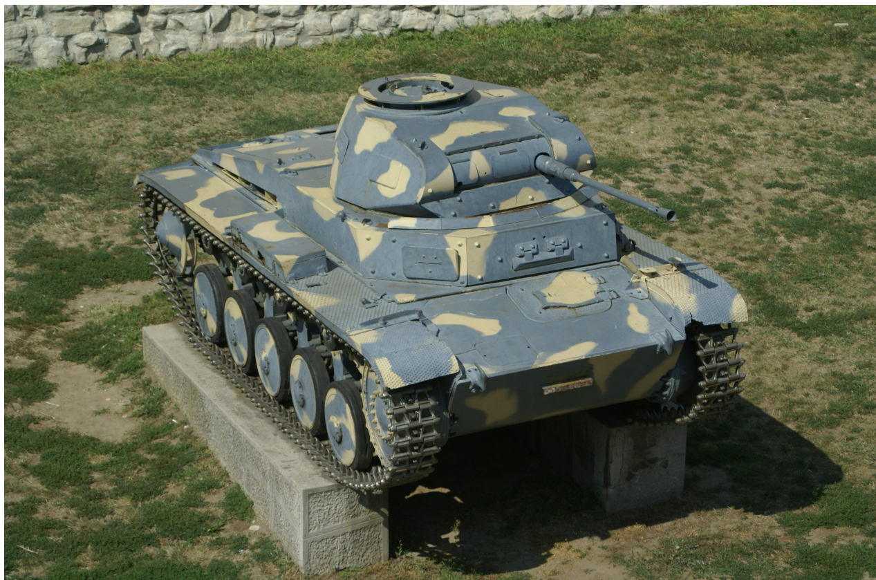
Rafał Białęcki, September 2008