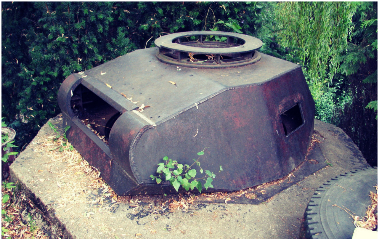
Marder II (sdkfz 132) gun shield and gun mount – Fort Gerhard, Świnoujście (Poland)

https://www.facebook.com/MalopolskaGrupaPoszukiwawczoHistoryczna/posts/2171496099659967