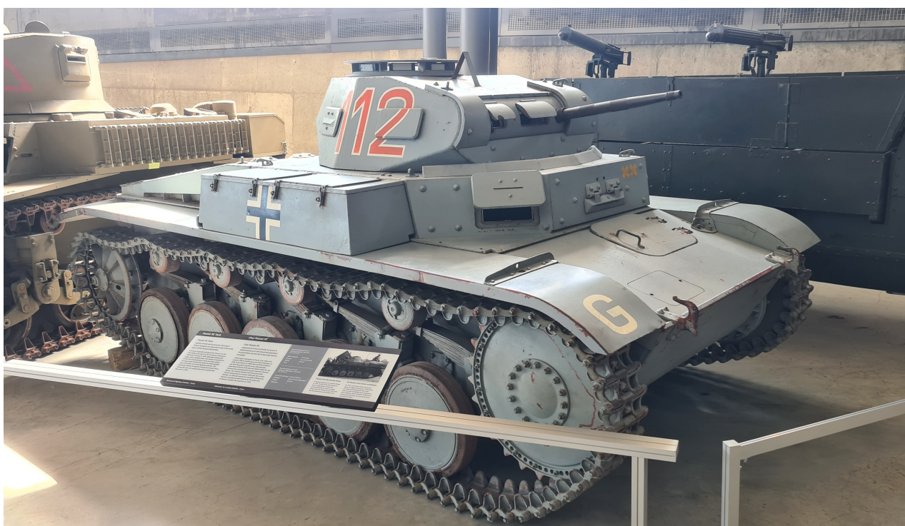
Pierre-Olivier Buan, September 2024