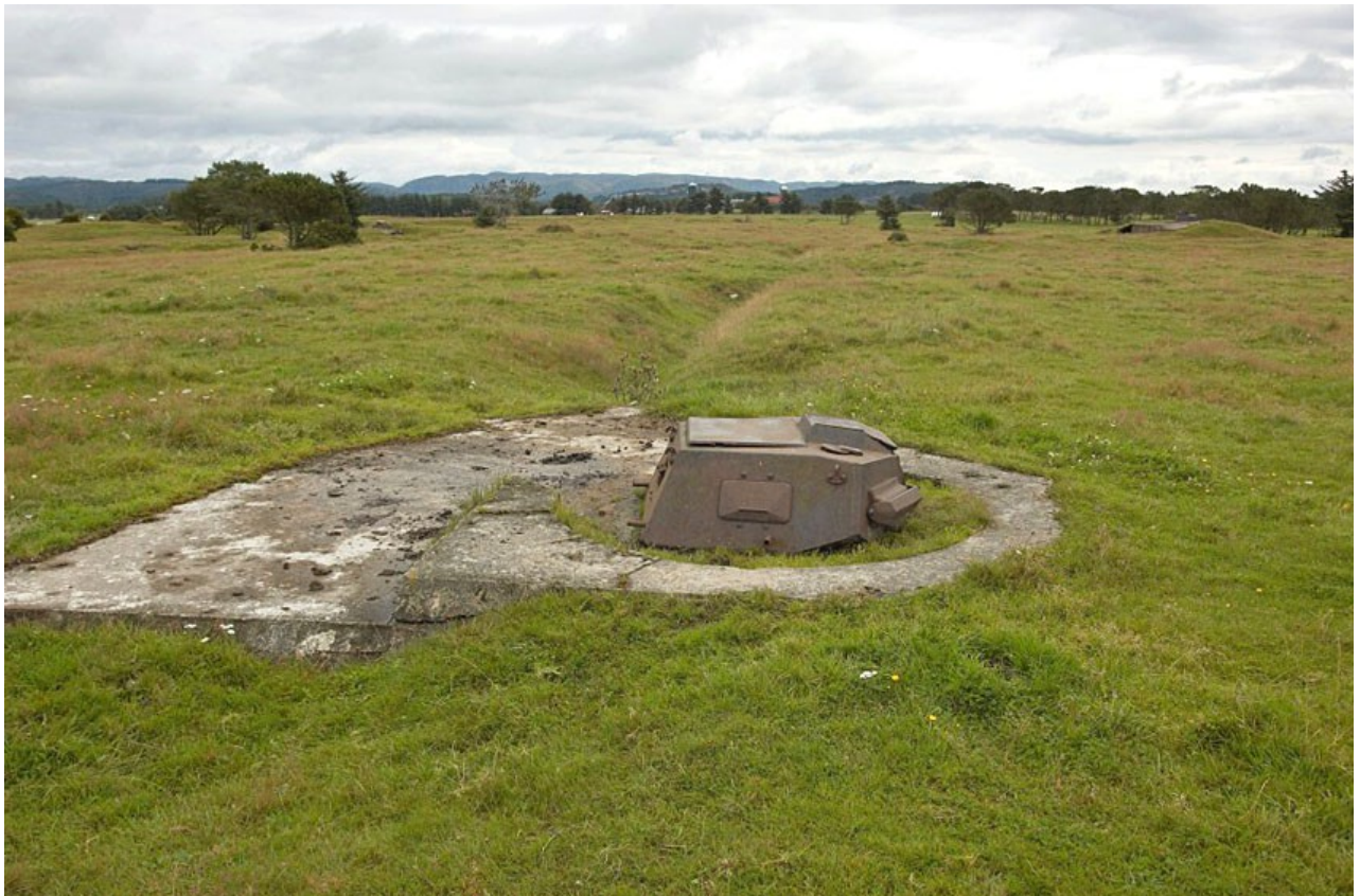
PzKpfw. II Flamingo turret – Festung Lista, Kviljo, Farsund (Norway)

Ondrej Filip, August 2012 - http://zapisnik.fortif.net/opecvneni-na-poloostrove-lista/