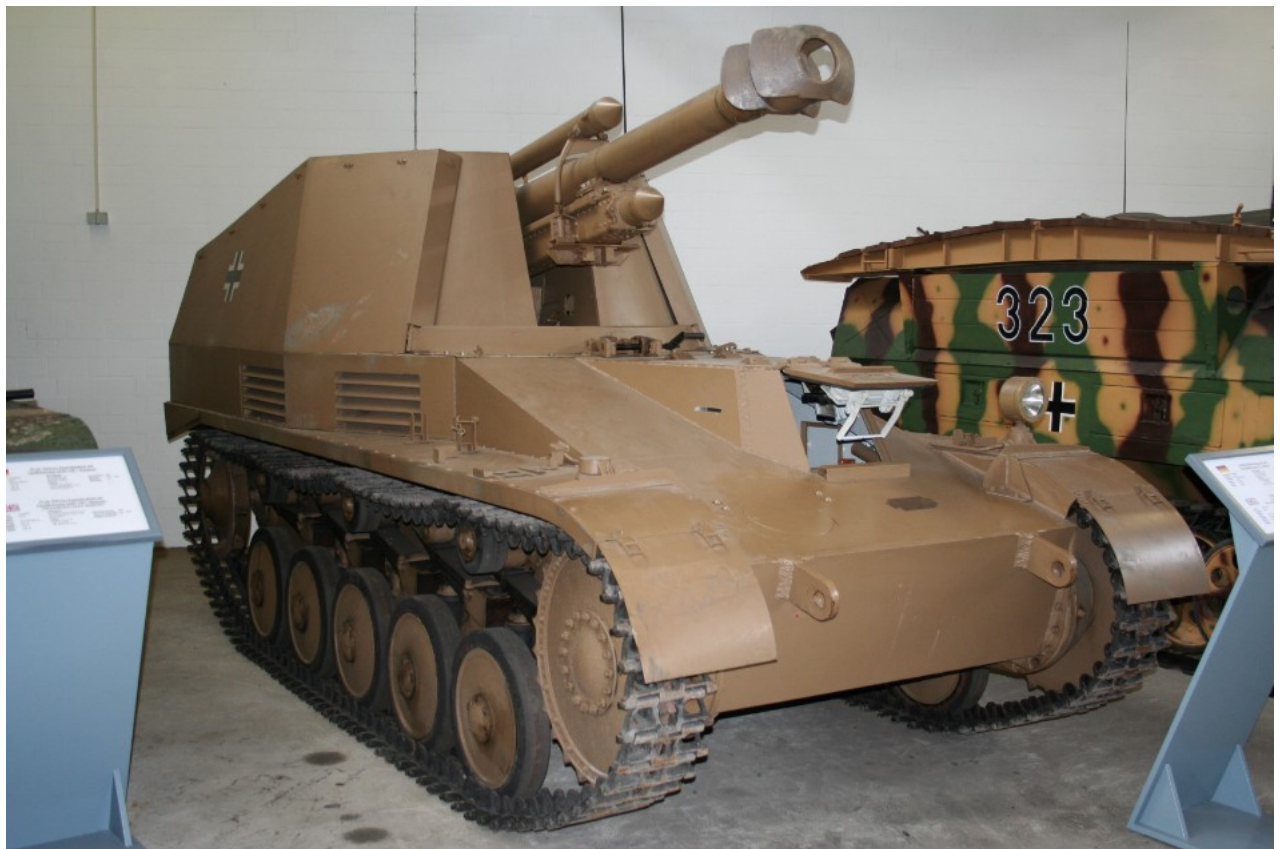
Klaus Blick - http://www.rc-panzerketten-forum.com/wbb2/thread.php?threadid=7620

PzKpfw. II Ausf. L "Luchs" – Musée des Blindés, Saumur (France) – running condition