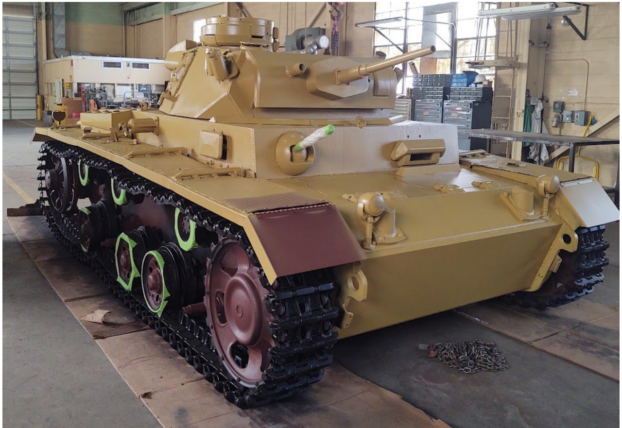
Fort Bliss Museum, January 2024 - https://www.facebook.com/1ADFTBMuseum