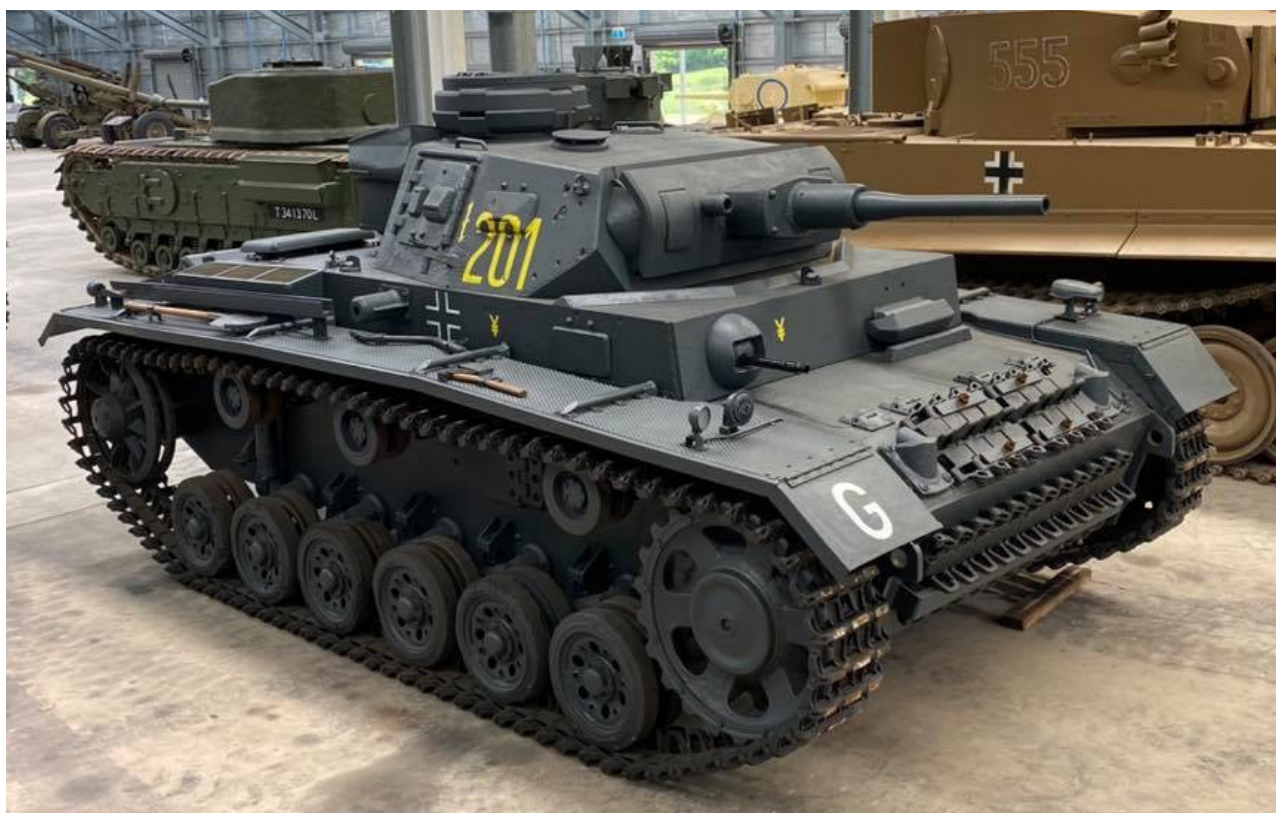
PzKpfw. III Ausf. J – State Military Technical Museum, Ivanovskoe Moscow Oblast (Russia)