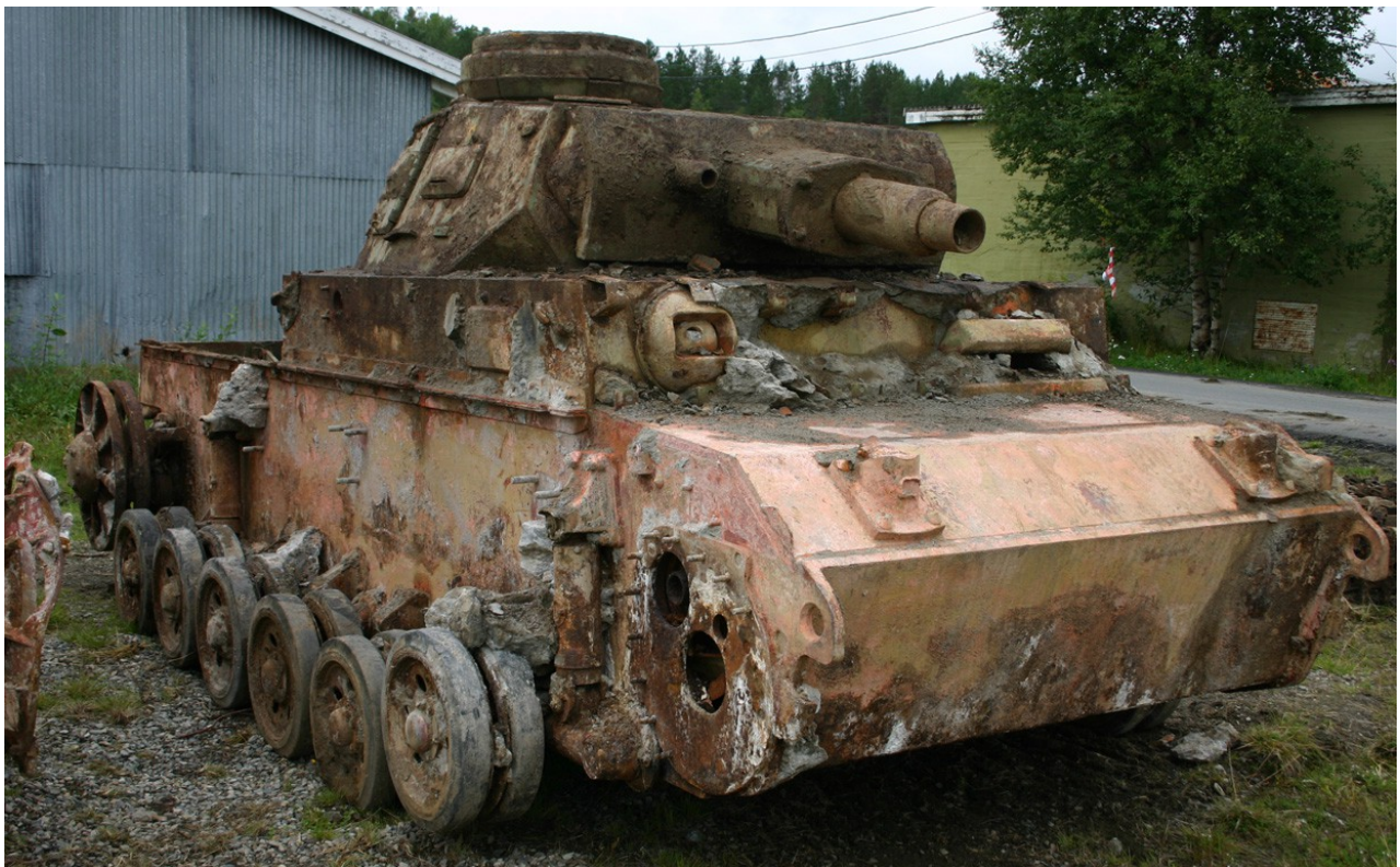
Arild Thrane Sandnes, August 2007 - http://www.tpmk.no/Forbilder/Panzer%20Setermoen.htm