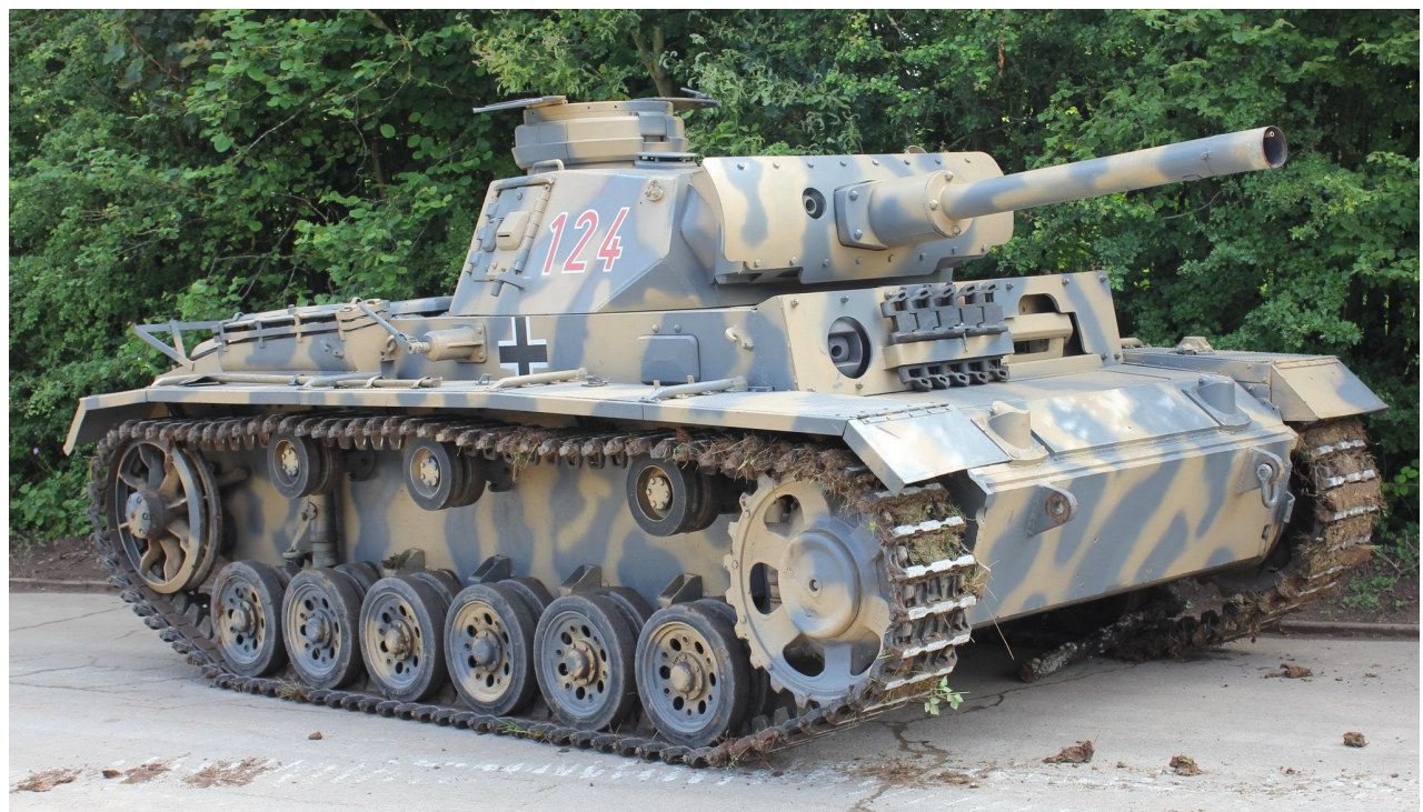
Hein Freud, June 2012 - http://freundhein11.fr.funpic.de/pics/120630/

PzKpfw. III Ausf. M – Deutsches Panzermuseum Munster (Germany) – running condition This tank was recovered from Tunisia in 1986 (Achtung Panzer ! website)