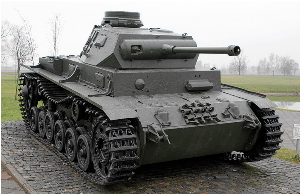
"zzuka", November 2006 - http://forum.globus.tut.by/viewtopic.php?t=1093&postdays=0&postorder=asc&start=0

This vehicle is currently stored and is not publicly visible