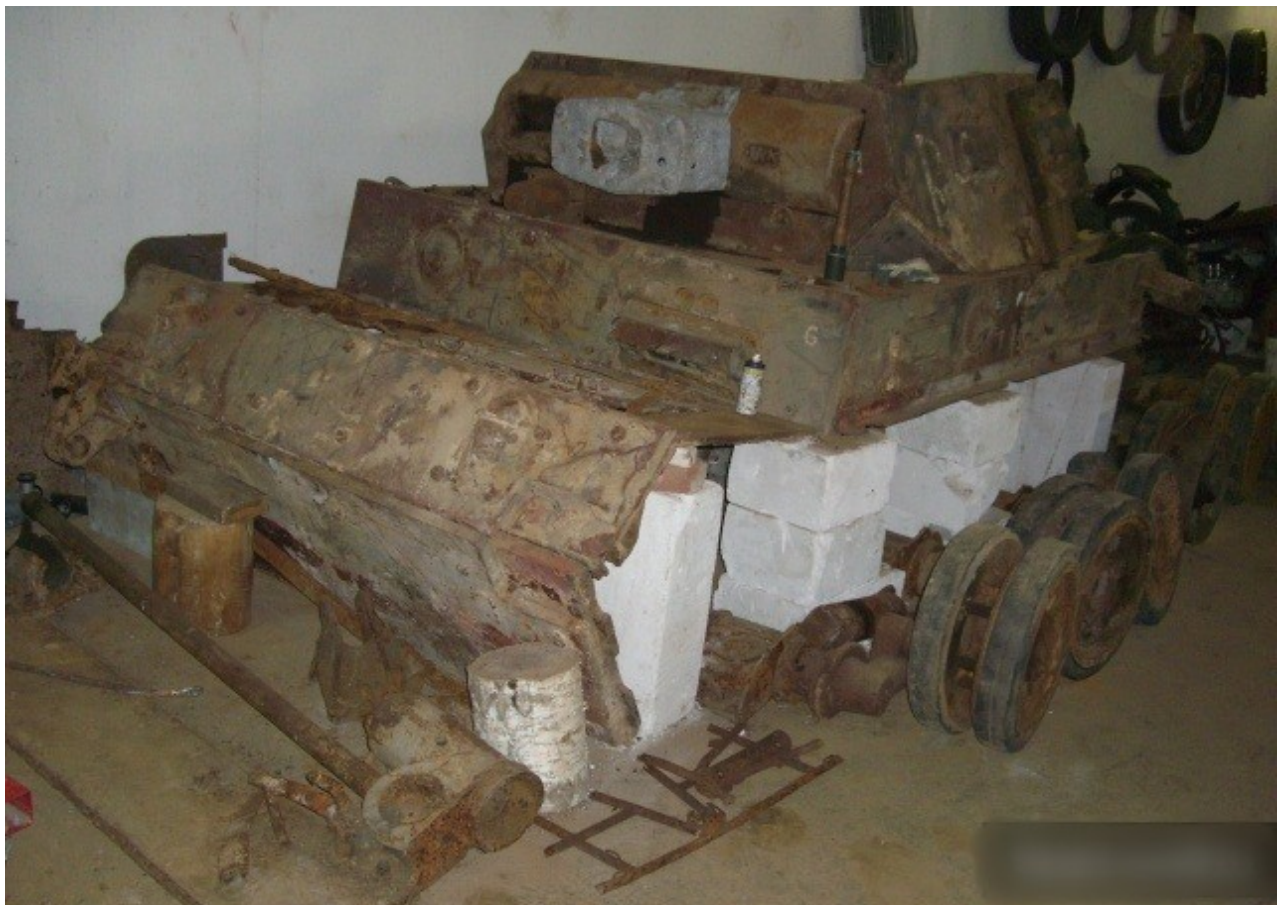
PzKpfw. III partial turret – Moscow Defence State Museum, Moscow (Russia)

https://www.facebook.com/kurlandkessel1945/photos/a.784394268243792/3353981611285032/