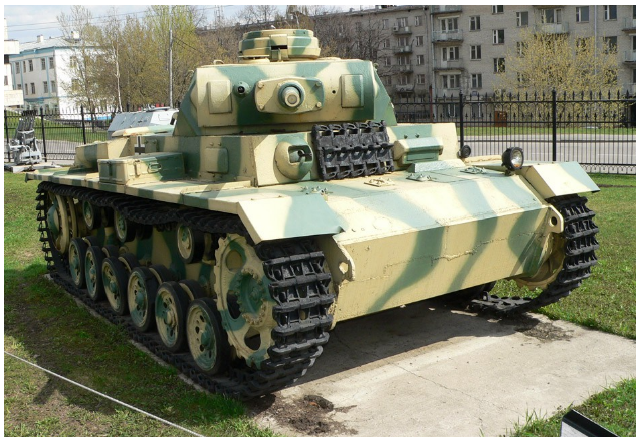
Yuri Pasholok, April 2007 - http://www.com-central.net/index.php?name=Forums&file=viewtopic&t=6736