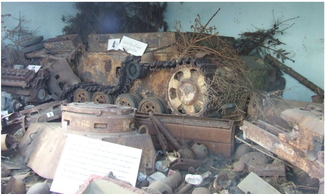
Andreas Edler, October 2007 - http://picasaweb.google.com/a.edler/AutoUndMotorradMuseumBadOeynhausen#

This tank has been used on a fire range near Ivanovo (north east of Moscow), and recovered in 2002. It has been restored in April 2002 (Yuri Pasholok). More pictures here: http://dishmodels.com/wshow.htm?p=461