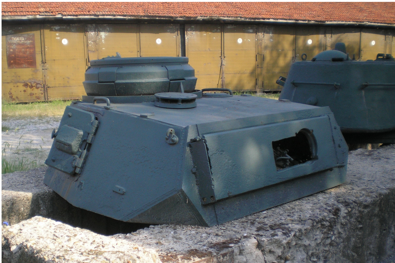
Dobromir Dimitrov, July 2013