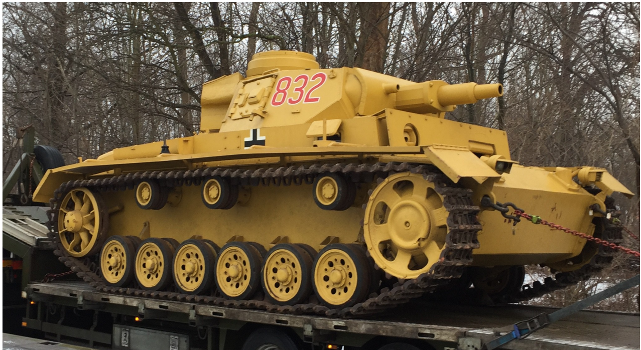
Niels Vegger, January 2016