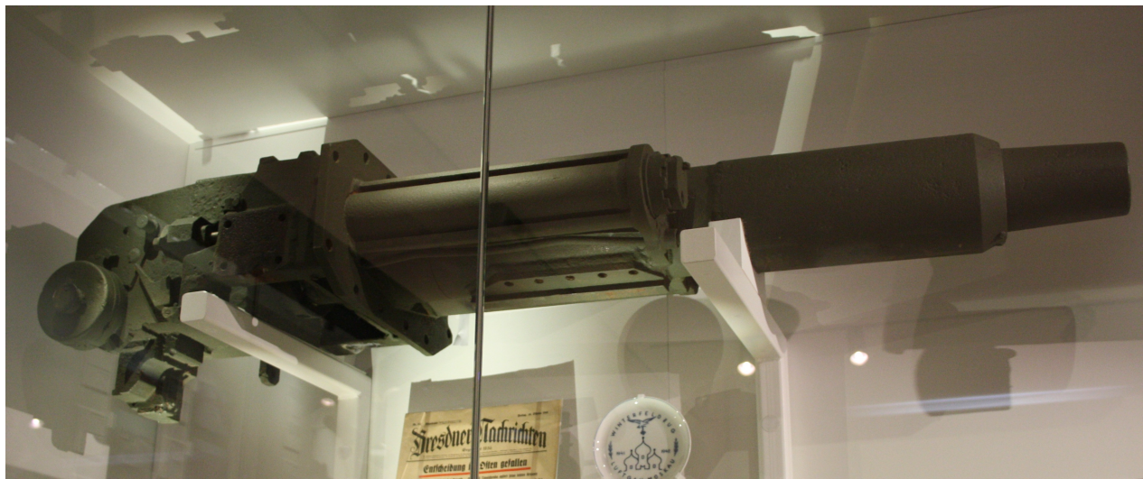
Walter Schwabe, October 2014