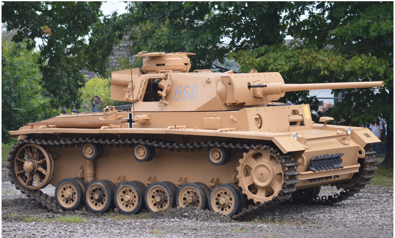
Bernd Borchert, September 2014

PzKpfw. III Ausf. M – Deutsches Panzermuseum Munster (Germany) – running condition This tank was recovered from Tunisia in 1986 (Achtung Panzer ! website)