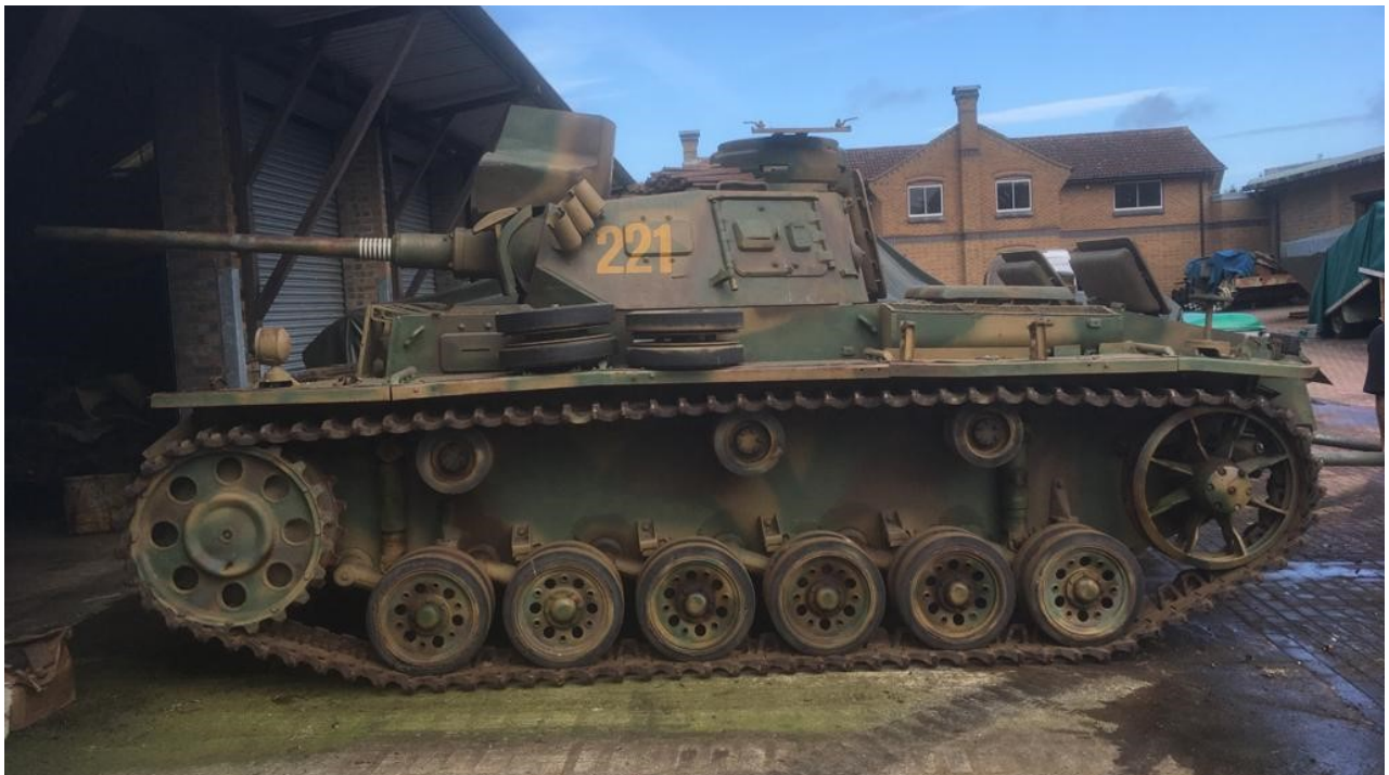
PzKpfw. III Ausf. L – U.S. Army Armor & Cavalry Collection, Fort Benning, GA (USA) This tank was recovered from Tunisia (USA AFVs register)

https://www.facebook.com/The-Wheatcroft-Collection-2348619585363508/photos/pcb.3702644629960990/3702644206627699/