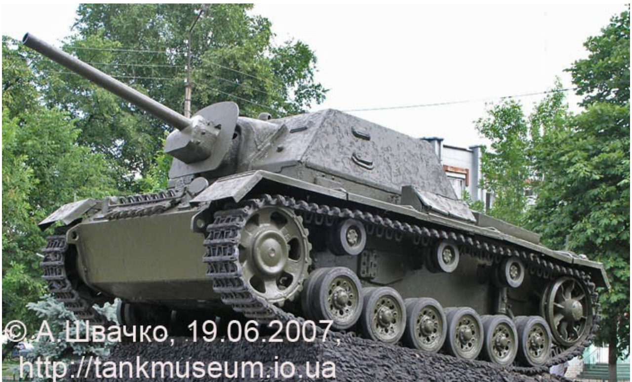
Pz.Bef.Wg. III – Vadim Zadorozhny museum, Arhangelskoe, Moscow Oblast (Russia)