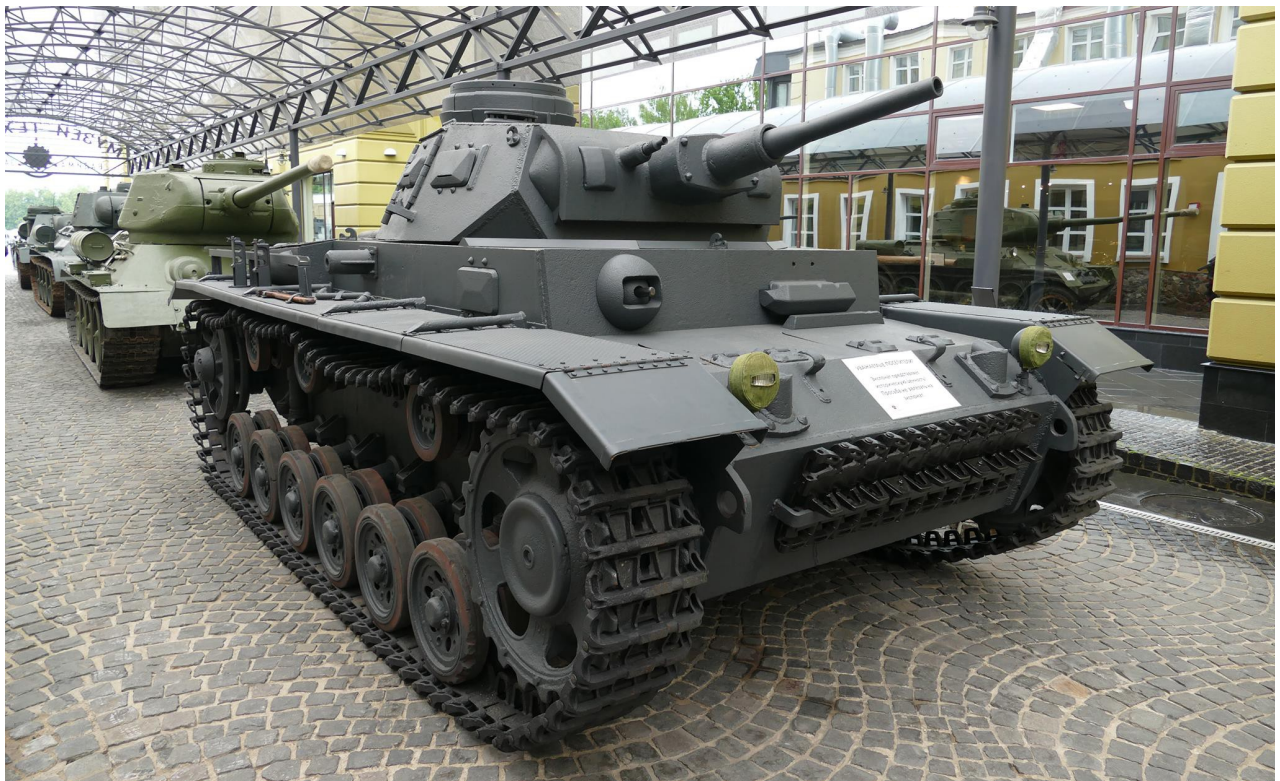
Yuri Pasholok, June 2017

Fahrgestell number 72527, produced by MAN in late December 1941 or January 1942 (Yuri Pasholok). On a photo made at Kubinka in 1946, "the White phantom" - the emblem of 11th Panzer-Division - is visible on this tank. Characteristic for this division is two-valued tactical number "24". The 11th division didn't fight at Stalingrad, but tried to make the way to the encircled troops (Alex Pankov). This tank is everywhere yellow from inside and outside, it was built surely for DAK, but used in Russia (Dmitry Bushmakow)