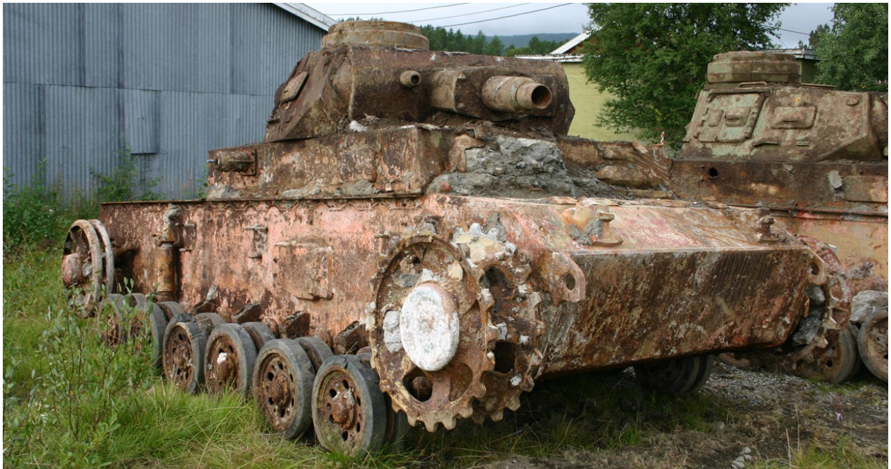
Arild Thrane Sandnes, August 2007 - http://www.tpmk.no/Forbilder/Panzer%20Setermoen.htm