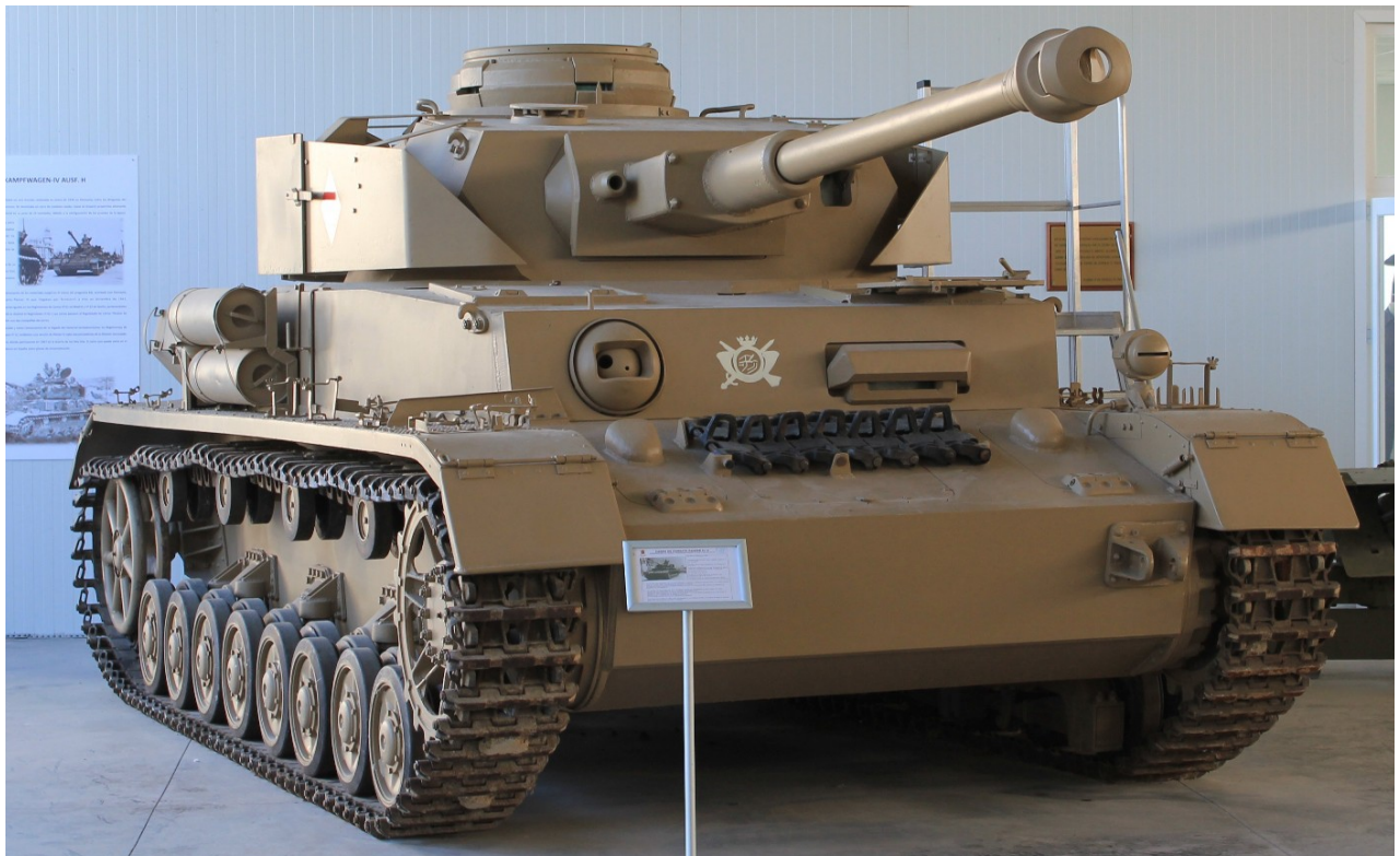
Didier Bouvy, October 2014