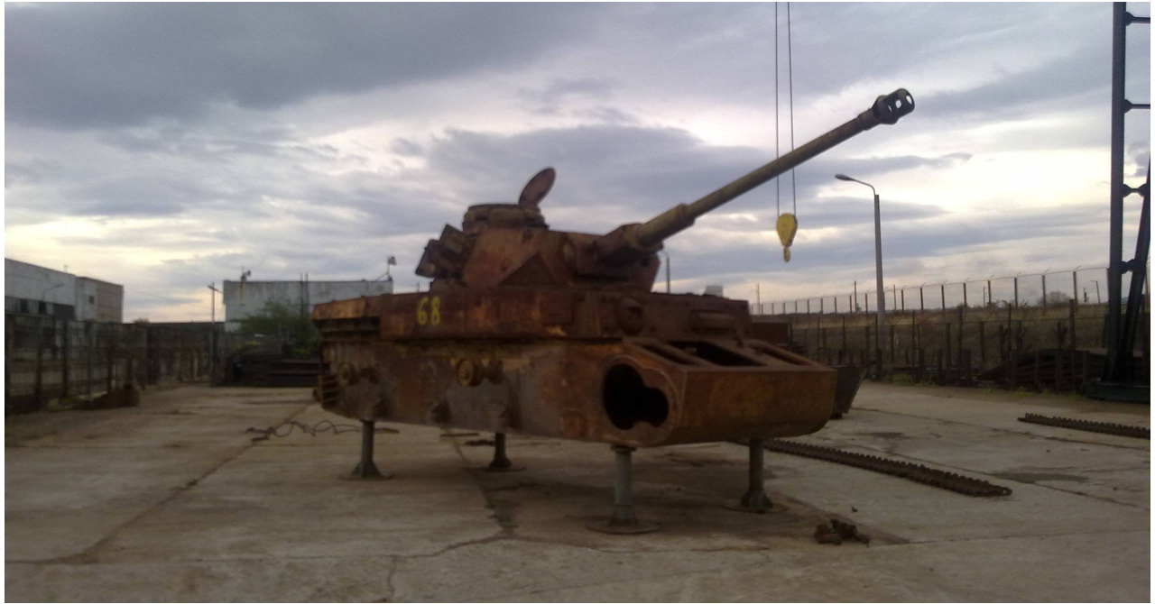
Dobromir Dimitrov, October 2011