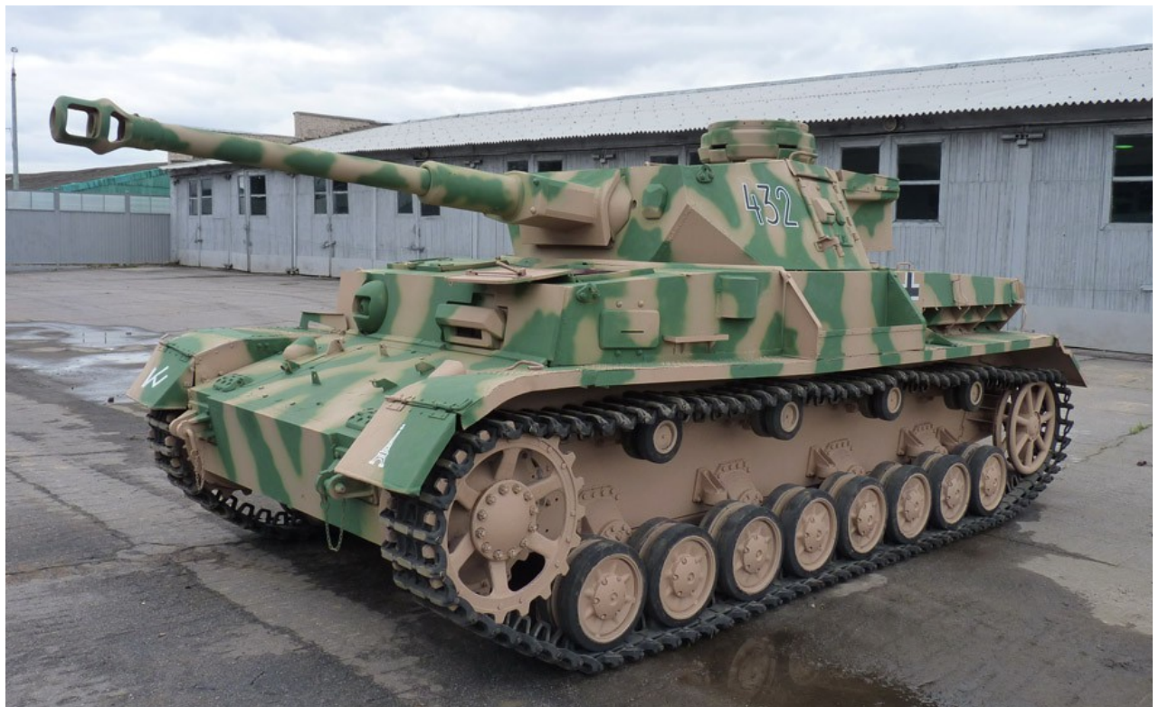
T-40/75 (PzKpfw. IV Ausf. H) – Unknown location (Ukraine/Russia)

Yuri Pasholok, April 2010 - http://www.com-central.net/index.php?name=Forums&file=viewtopic&t=12655