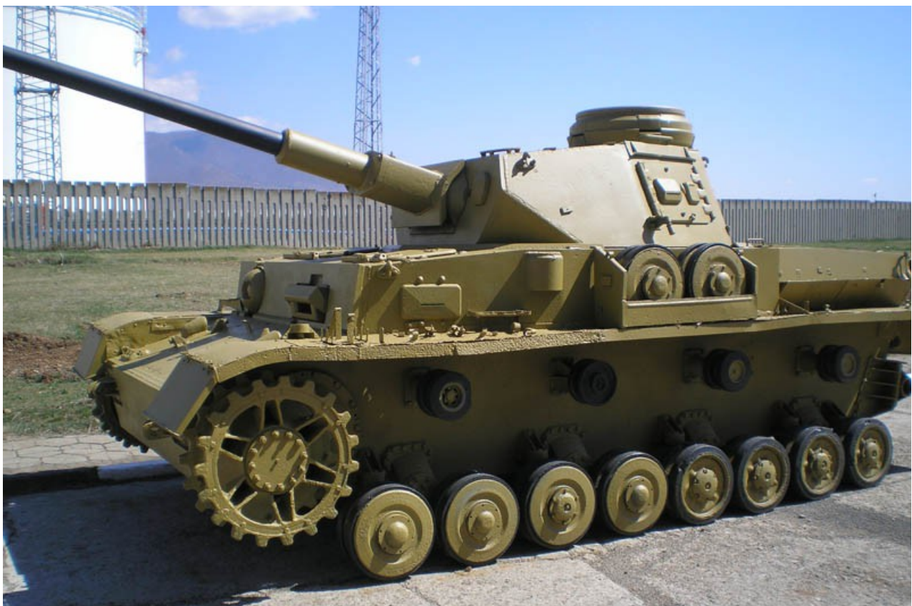
Dobromir Dimitrov, April 2012

The restoration project started with the arrival of a Panzer IV Ausf. F turret in Poklonnaya Gora, 10 years ago. The hull is made from new, but some parts of the superstructure are original (front glacis, front-left, back-right). The suspension is half original. Some little details are original. All original parts are recovered from the ground (AFV News forum)