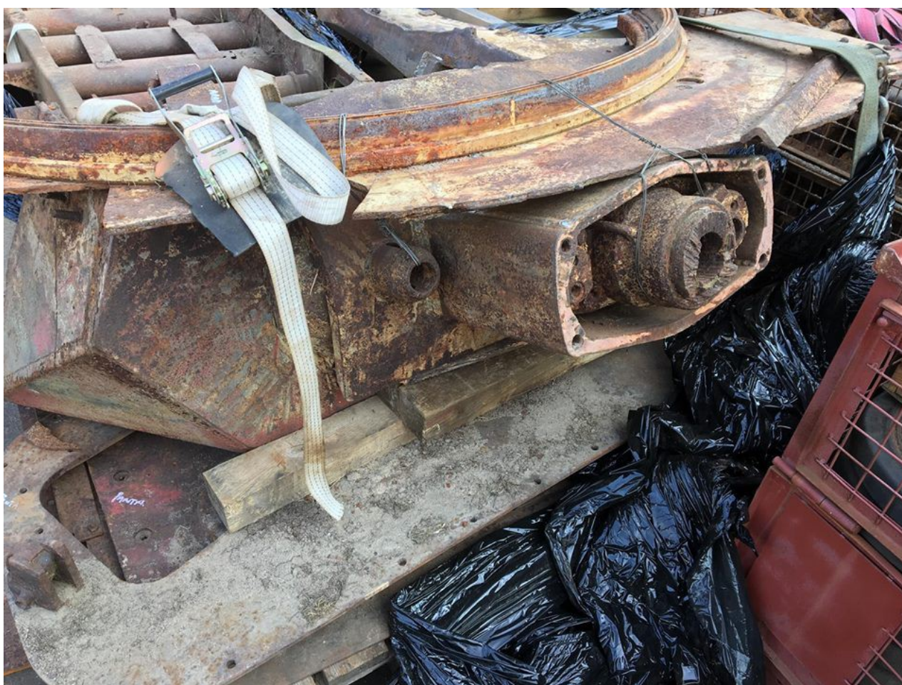
T-40/75 (PzKpfw. IV) wreck – On a military fire range (Syria)