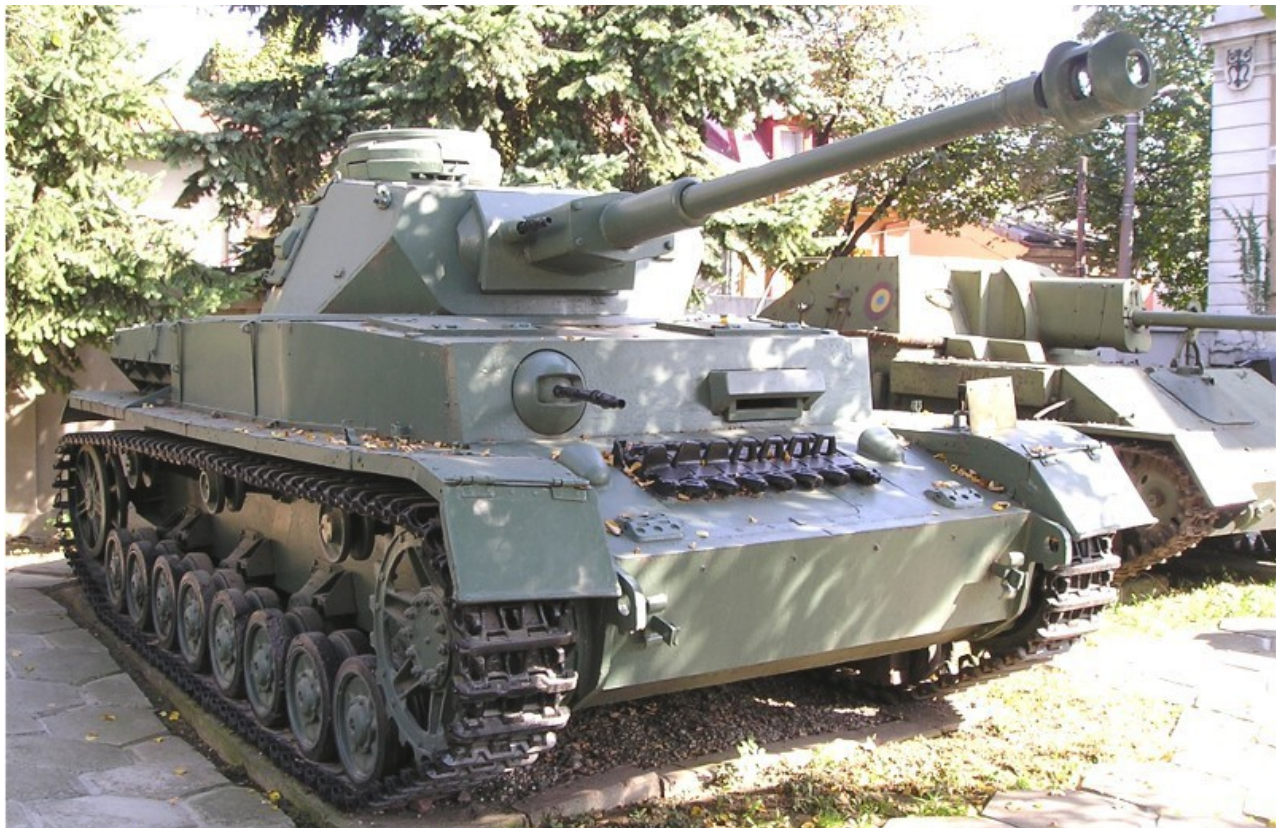
Doug Kibbey, October 2006 - http://www.com-central.net/index.php?name=Forums&file=viewtopic&t=5132