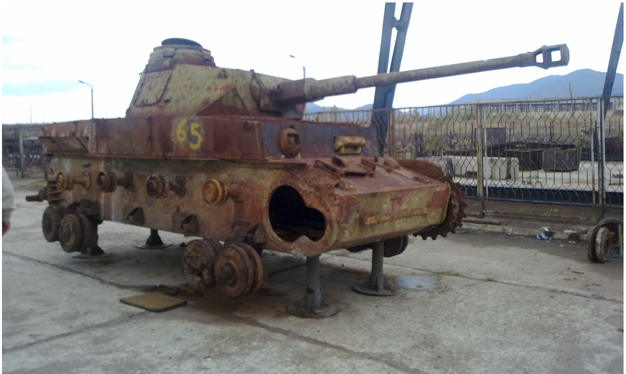
Dobromir Dimitrov, October 2011