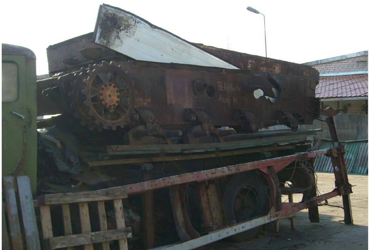
PzKpfw. IV Ausf. H or J gun – somewhere in Estonia