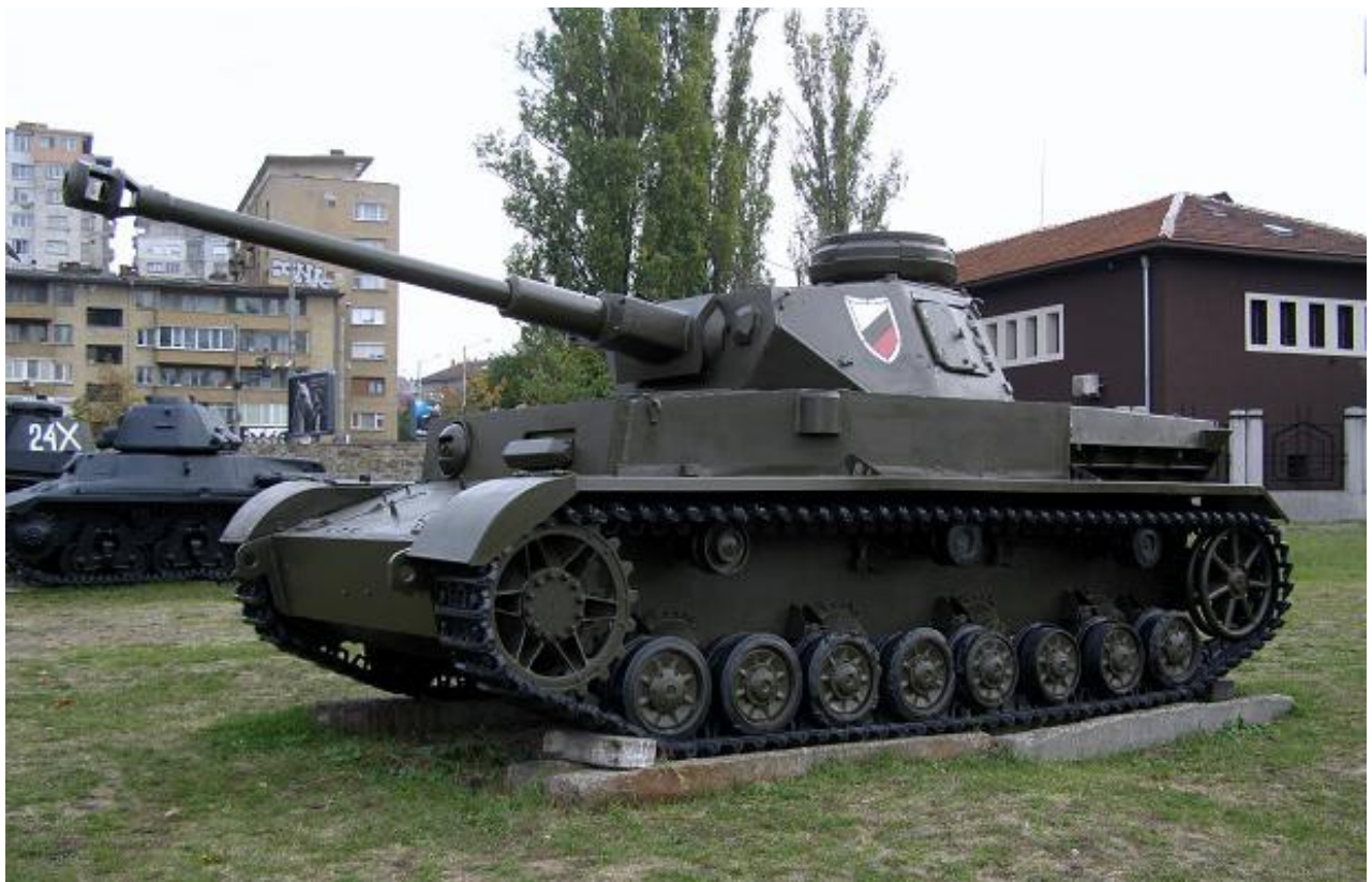
"=VNVV=Rosev", November 2011 - http://www.scalemodels-bg.com/phpbb/viewtopic.php?f=53&t=136&start=1200

"From what we could discern from a file coming from the museum, the vehicle came to grief in the Battle for Romania, probably in summer '44. It either took a hit that resulted in the loss of the original turret (I didn't see any obvious damage to the hull, inside or out) or the chassis may have come to be captured and used by the Russians for a period (possibly as a personnel or ammo carrier) as it was recovered with some Cyrillic overwriting on some of the operating controls (instruments are now absent). With the end of hostilities, it came to rest at the museum and a "donor turret" from unspecified sources came via the Romanian Military School to be installed on the chassis to complete the exhibit as it is seen today" (Doug Kibbey)