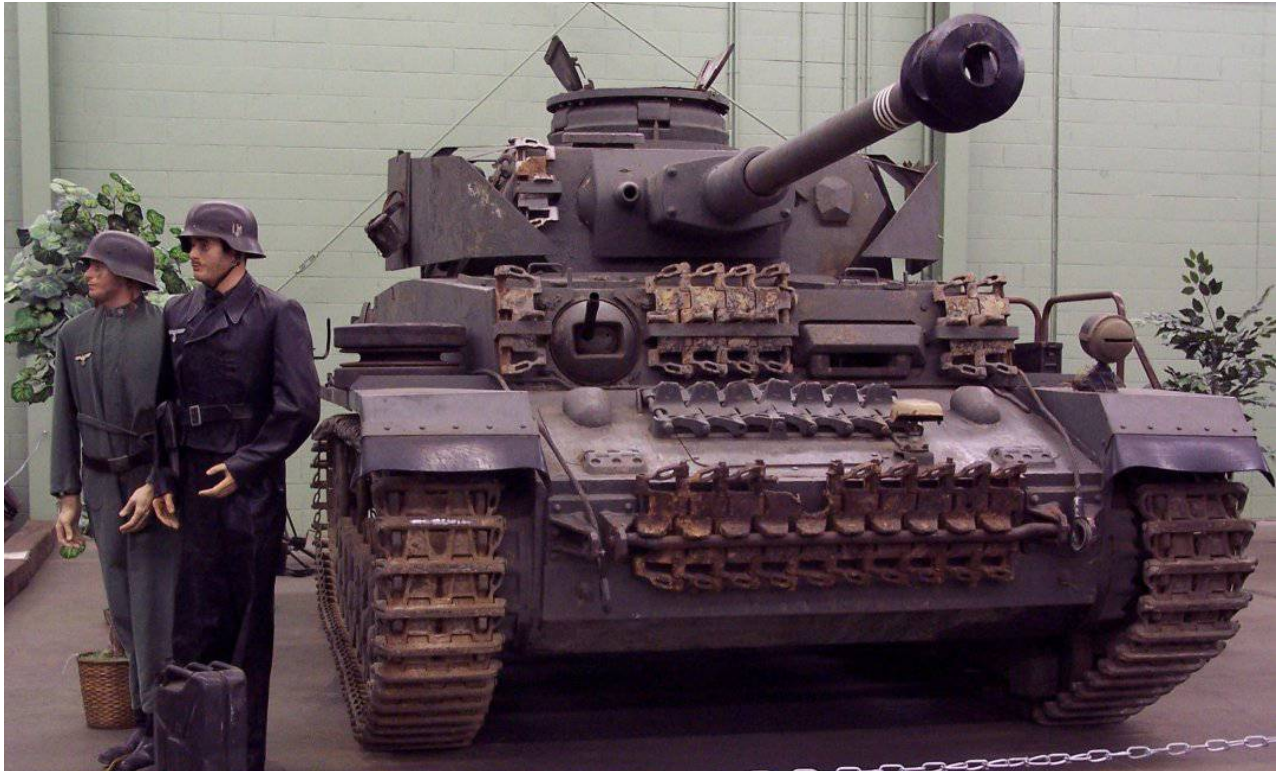
Art Tyng, Spring 2005 - http://rctankcombat.com/battle-reports/DanvilleSpring2005/