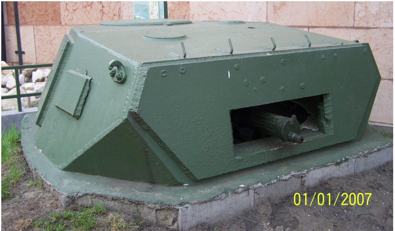
Ferenc Bálint, March 2010

These hulls are possibly part of the Kęszycki Brothers Collection in Poland. There are at least 2 different PzKpfw. IV hulls in this collection, see this link : http://wars98.fotosik.pl/zdjecia/2