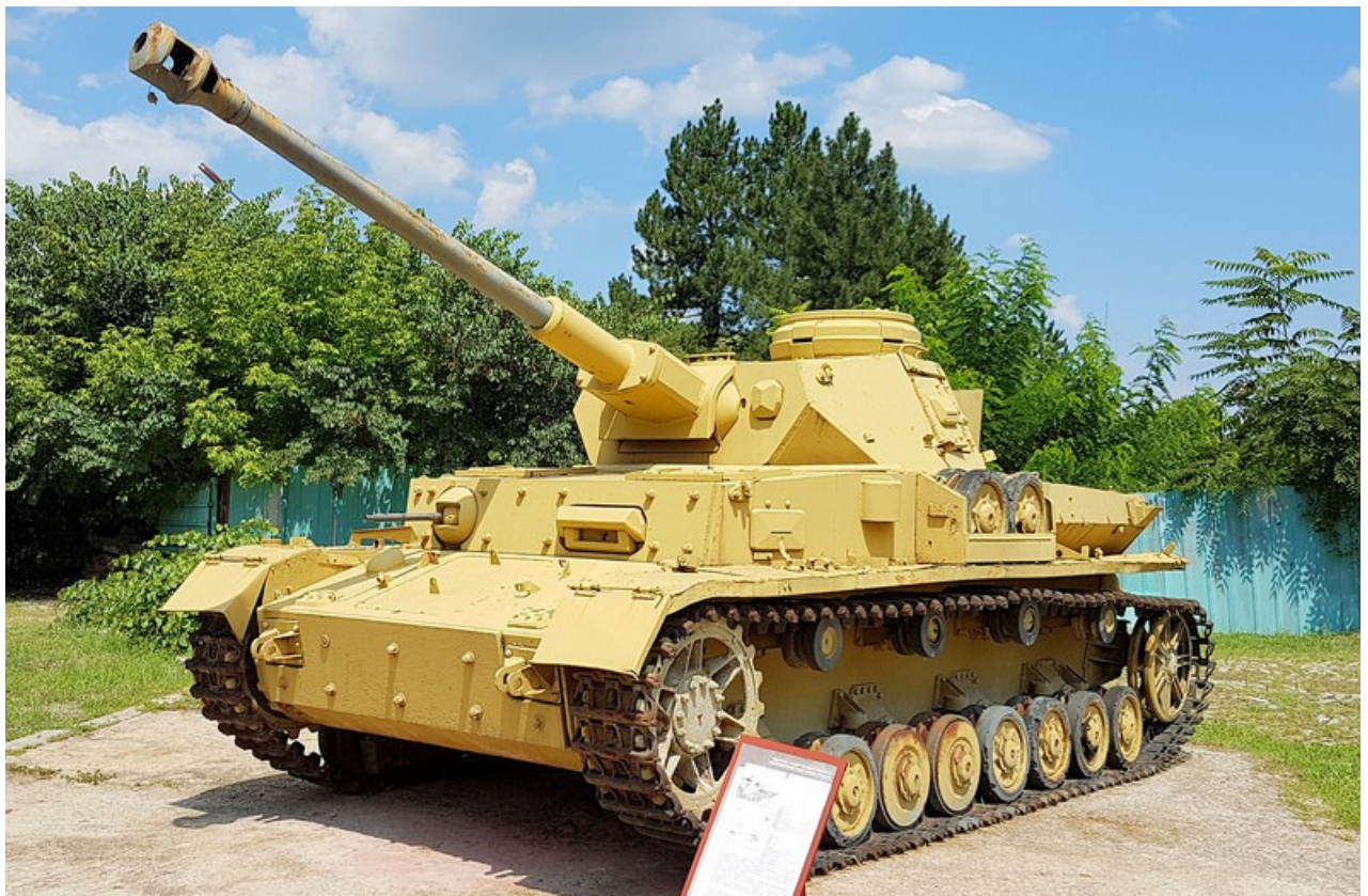
PzKpfw. IV Ausf. H – Kalemegdan Military Museum, Belgrade (Serbia)

https://hiveminer.com/Tags/%D0%B1%D0%BE%D0%B9%D0%BD%D0%B0%D1%82%D0%B0