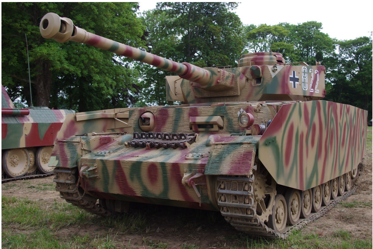
Max Stein, June 2019

This tank was for a while on display at the "Musée du 19 Août 1942", Pourville, Normandy, France (Trevor Larkum). Now the tank is more complete, missing parts were added : idlers, hatches, tracks , turretschürzen, tools , but it is still unpainted and doesn't run (Rudi Schoeters). This Panzer IV (ex Dieppe museum) is an Ausf H. It still has the small armoured exhaust cover were the second muffler was for the auxiliary engine for the turret drive. The spoked idlers ( more typical for Ausf J) were put on during restoration ("Bullitt")