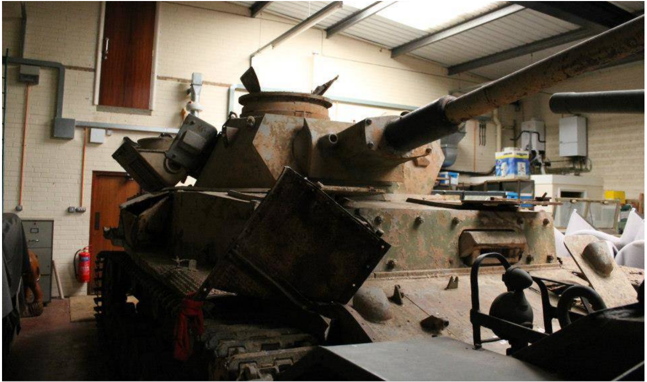
"The_Challenger", November 2012 - http://www.facebook.com/media/set/?set=a.453885897980390.93729.433891793313134&type=3