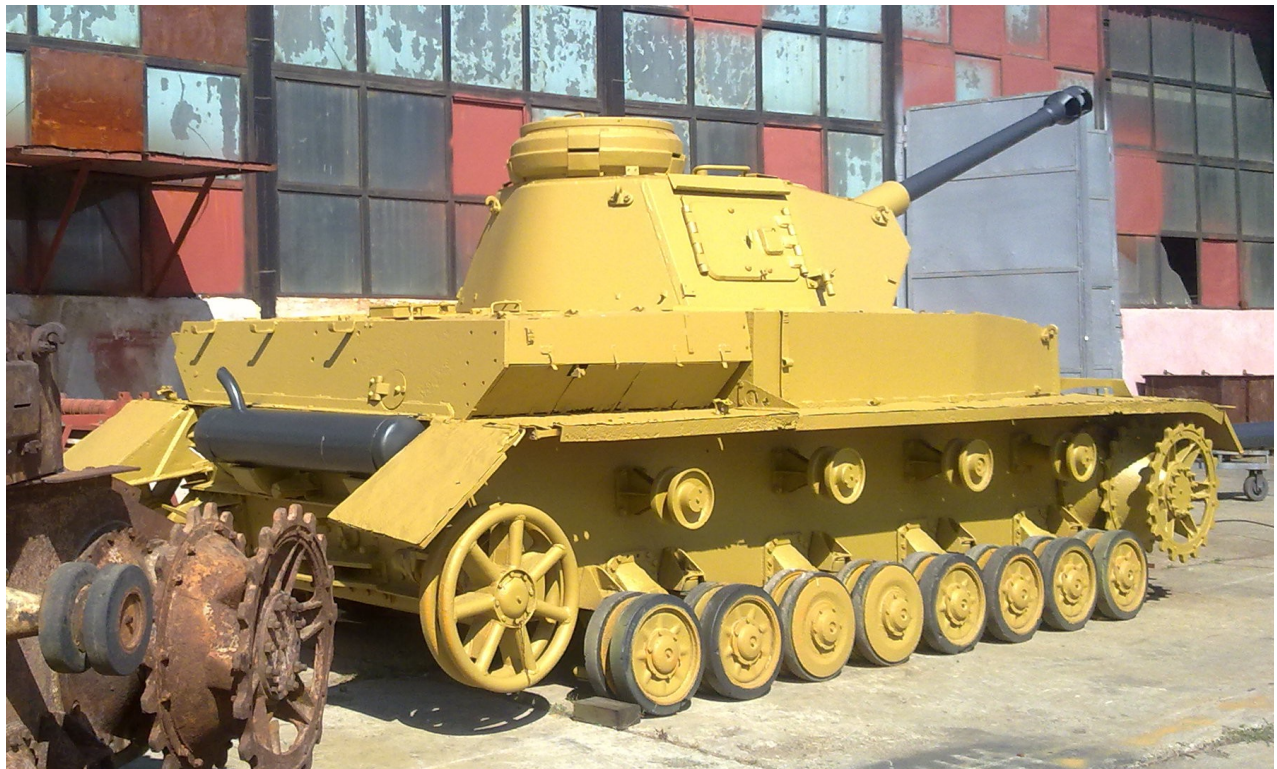
Dobromir Dimitrov, October 2011