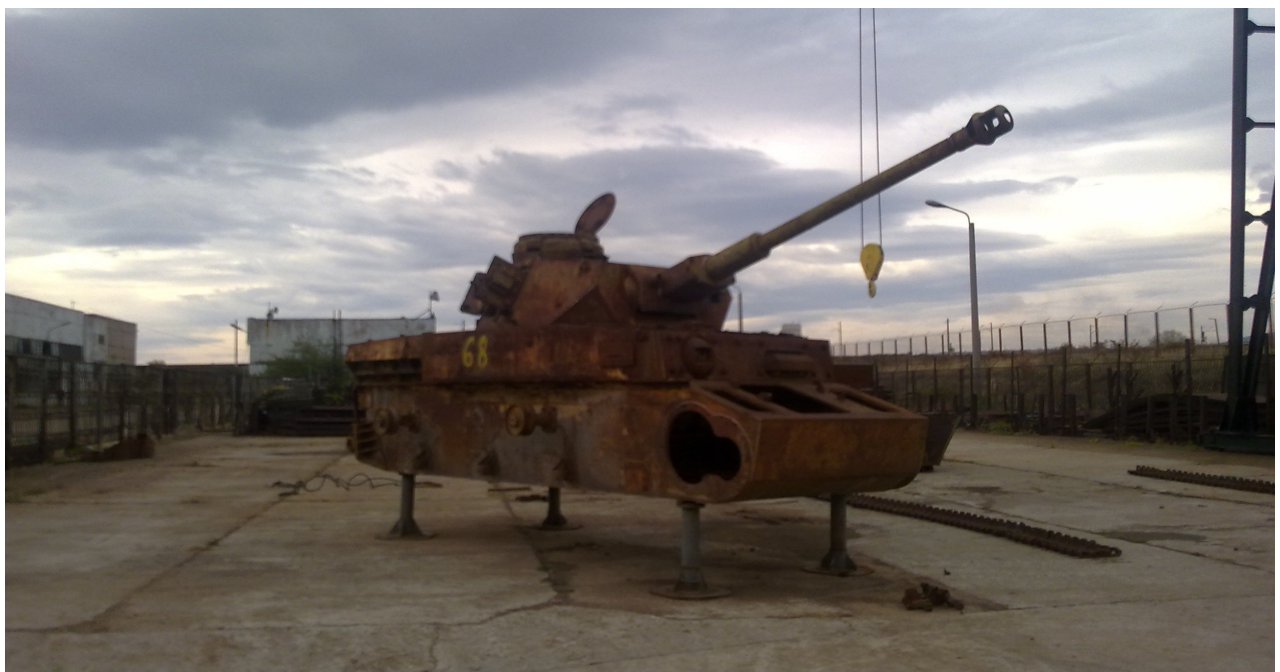
Dobromir Dimitrov, October 2011