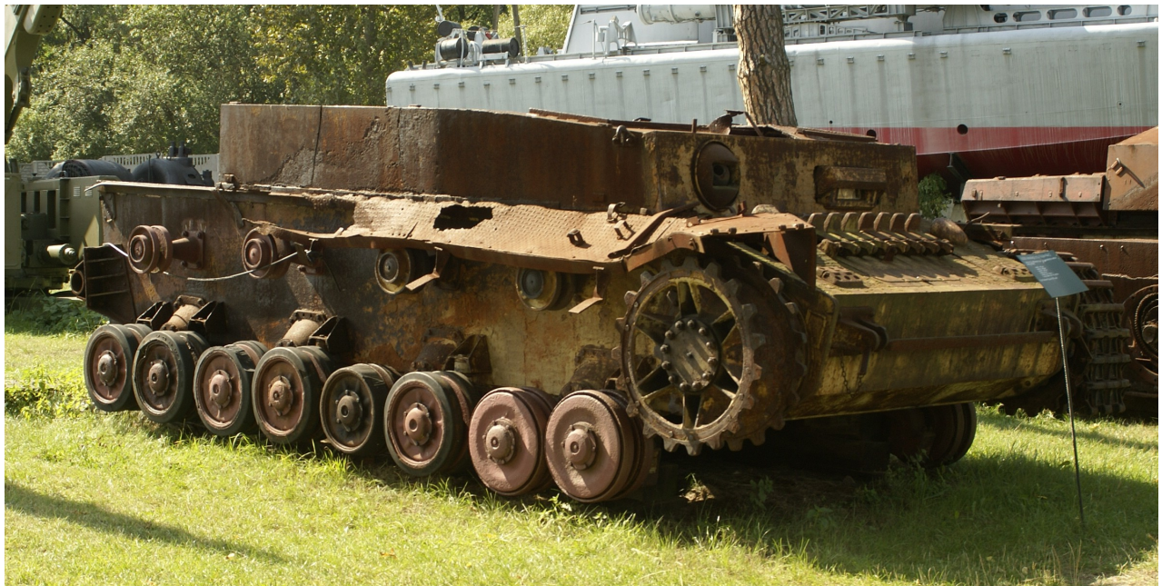
Rafał Białęcki, September 2008

PzKpfw. IV restoration project – Museum im. Orła Białego, Skarżysko-Kamienna (Poland) The museum announced in late February, 2021 that the Panzer IV would be completely restored, probably to running condition