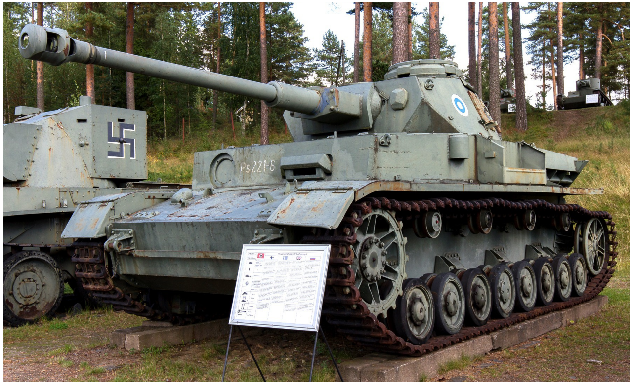
Axel Recke, September 2015