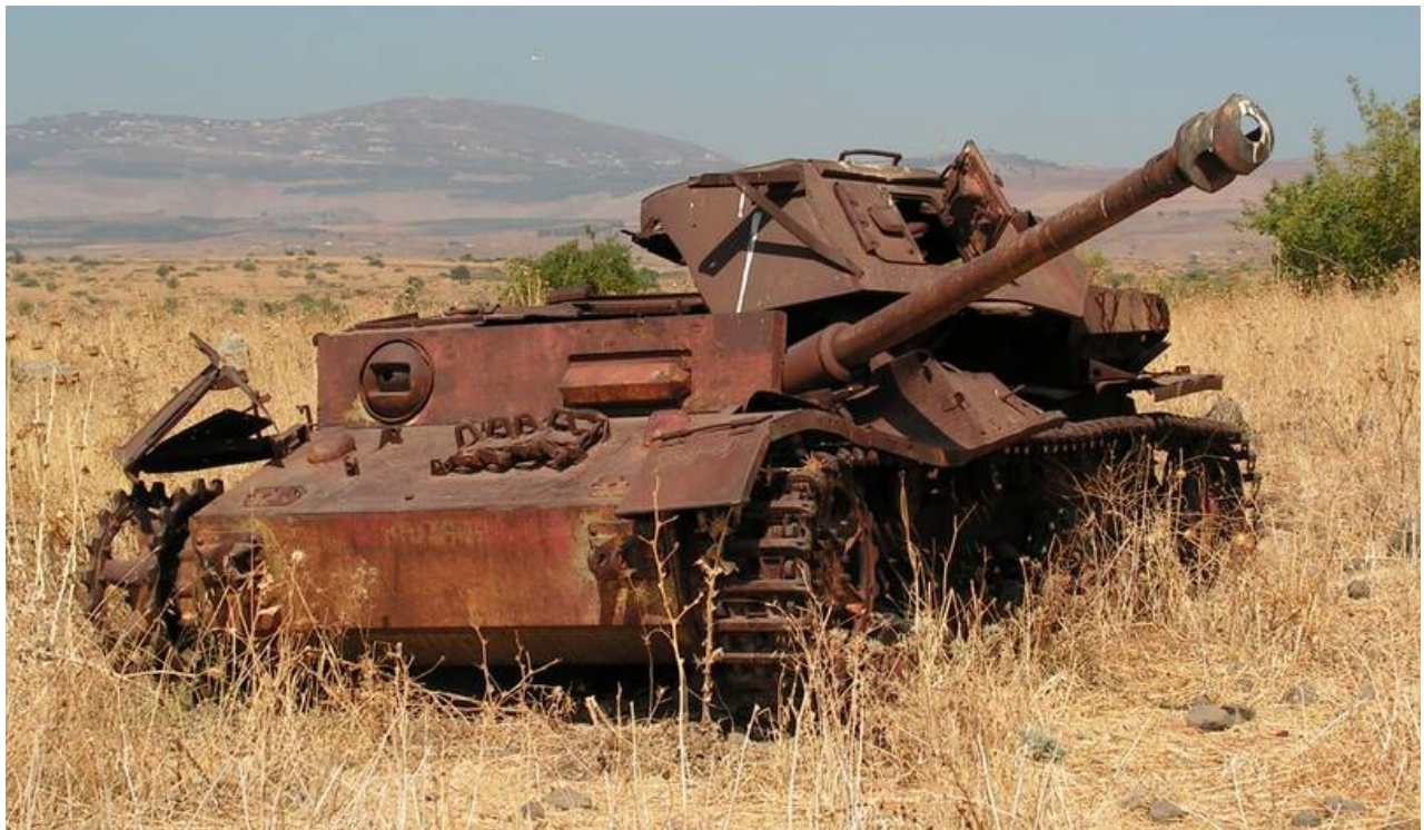
Dmitriy Tubin, 2011 - http://www.dishmodels.ru/wshow.htm?p=1953

http://www.com-central.net/index.php?name=Forums&file=viewtopic&t=8865