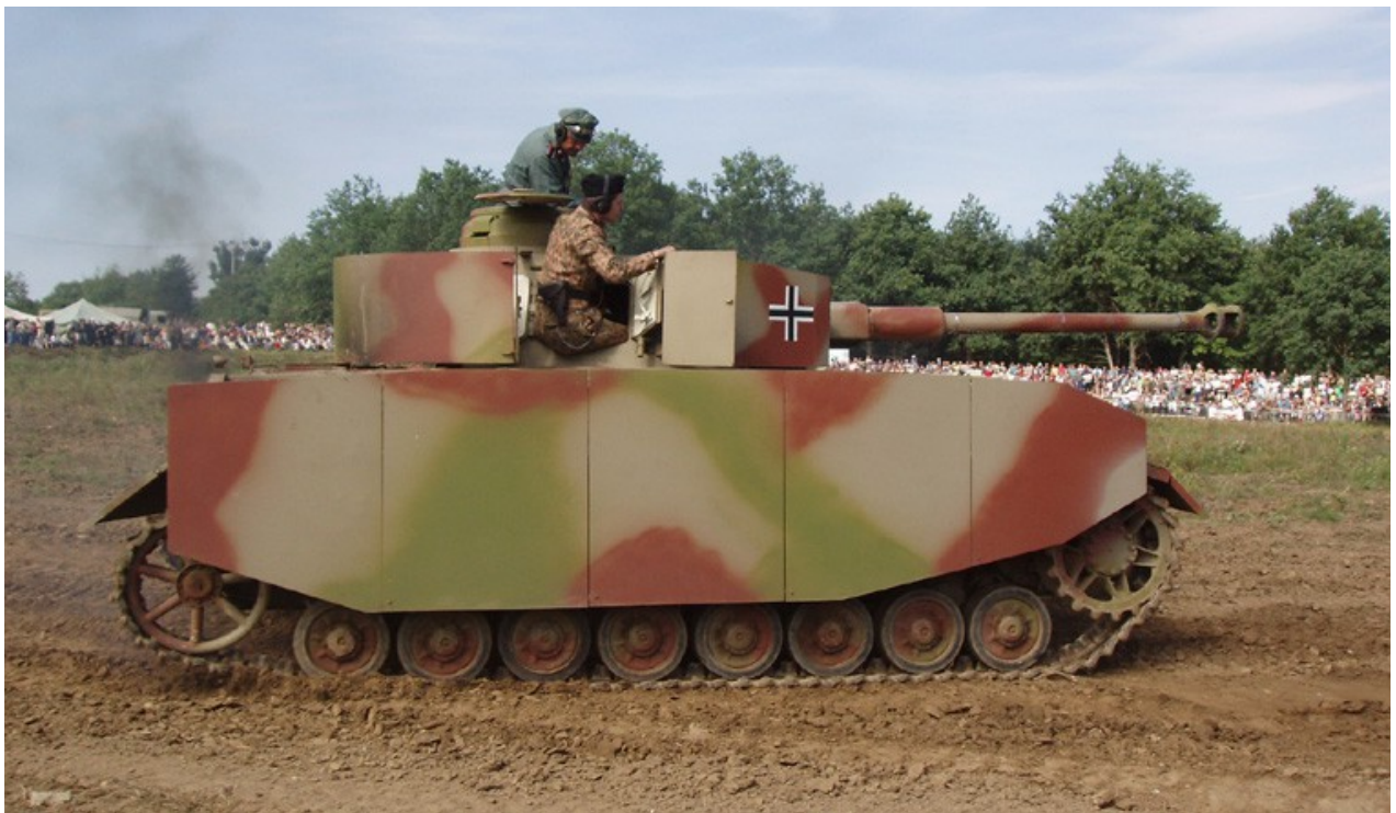
August 2005 - http://www.valka.cz/galerie/displayimage.php?album=250&pos=13

Formerly displayed at the Museum Oręża Polskiego, Kołobrzeg (Poland). The tank has been recovered in April 2011 from a field near the airport, near Stargard Kluczewo. The parts were transferred to the Armoured Weapons Museum, Land Forces Training Centre in Poznań. It has been rebuilt from the parts recovered. The tank was supposedly blown up by its crew or a shell in 1944 or 1945 (info. from the museum). Fahrgestell number 93173 (Maciej Boruń)