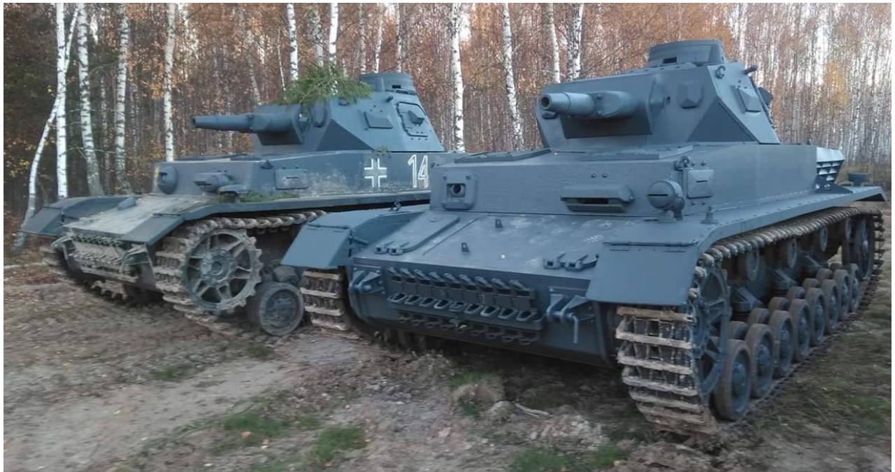
PzKpfw IV turret – Unknown location (Russia?)

https://www.facebook.com/photo.php?fbid=724461421254827&set=pcb.1121568947993406&type=3&theater&ifg=1