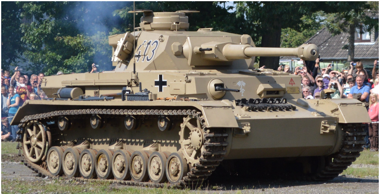
Bernd Borchert, September 2012

More photos of this tank can be seen here : http://www.wheatcroftcollection.com/PzKpfwIV.html