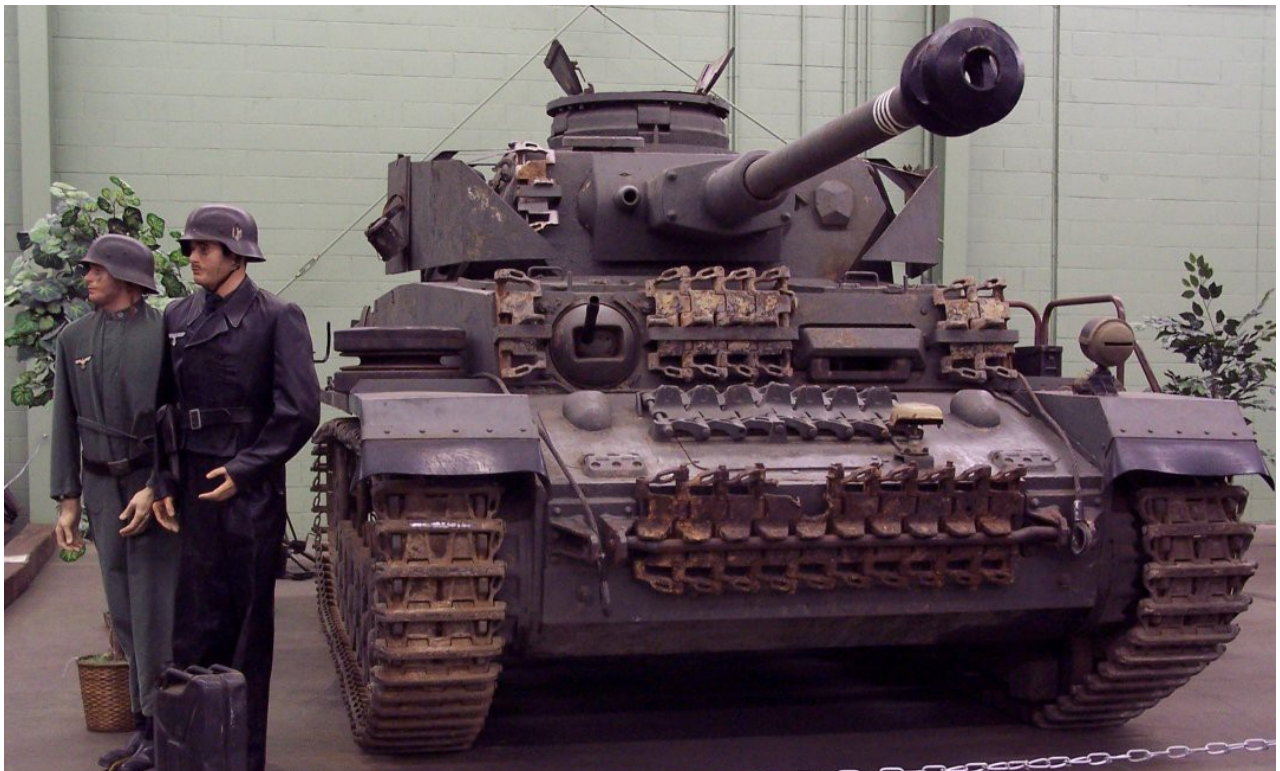
Art Tyng, Spring 2005 - http://rctankcombat.com/battle-reports/DanvilleSpring2005/

This tank is an Ausf. H/J chassis and turret with either an Ausf. A to E main gun, or a gun with a cut up barrel