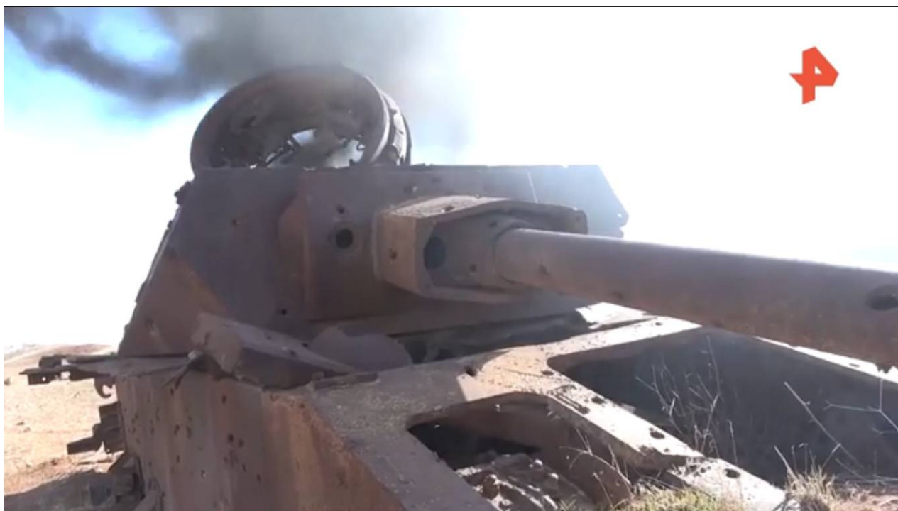
T-40/75 (PzKpfw. IV) wreck – Lake Kinneret area, Golan heights (Israel) Fahrgestell number 110099, reportedly manufactured by Nibelungenwerke

http://forum.valka.cz/viewtopic.php/title/-Pz-Kpfw-IV-v-sluzbach-cudzich-armad/p/136933