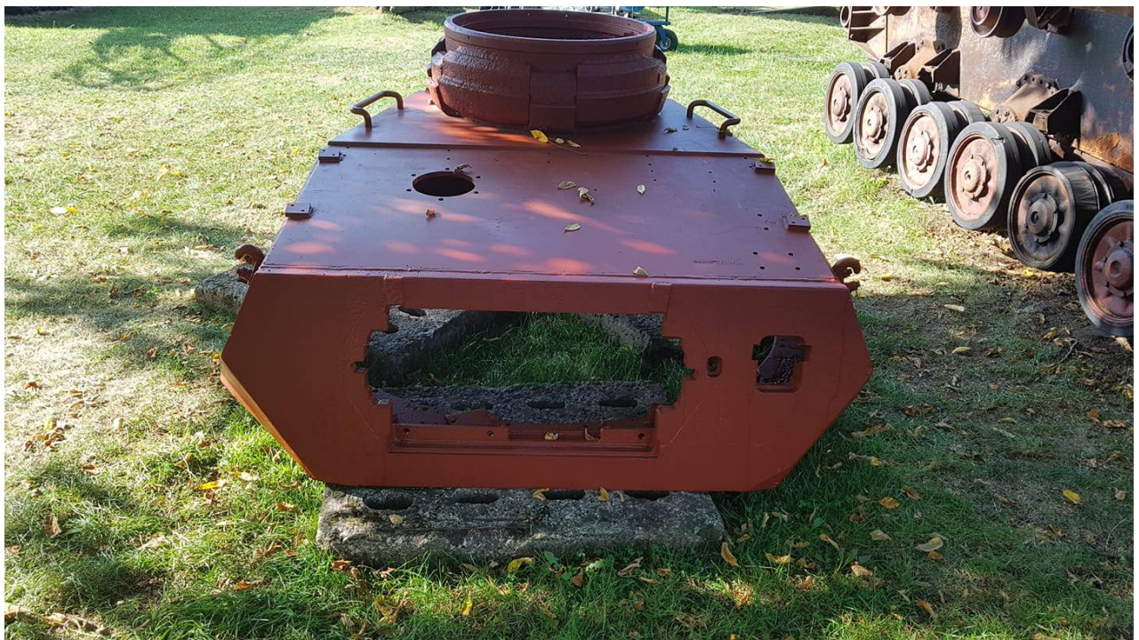
PzKpfw. IV Ausf. H front hull – Fort IX Czerniakowski, Warsaw (Poland)

"Militarne Podróże", November 2015 - https://www.facebook.com/