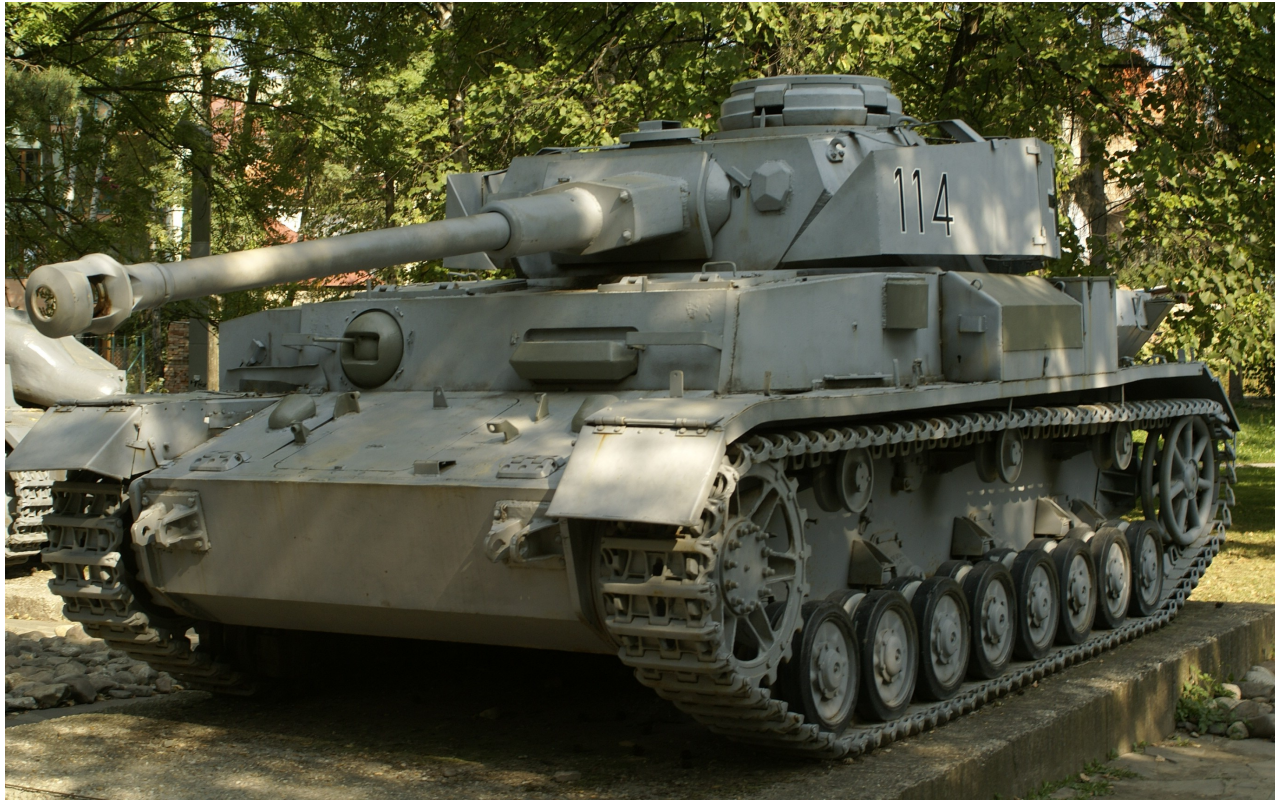
Rafał Białecki, September 2008

Modified and used by the Czechoslovak army after 1945 and redesigned T-40/75