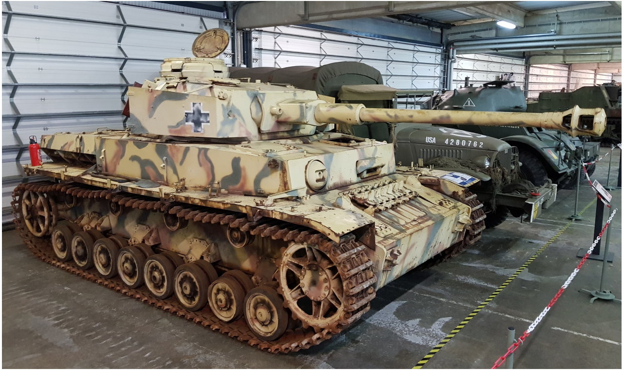
Pierre-Olivier Buan, April 2019