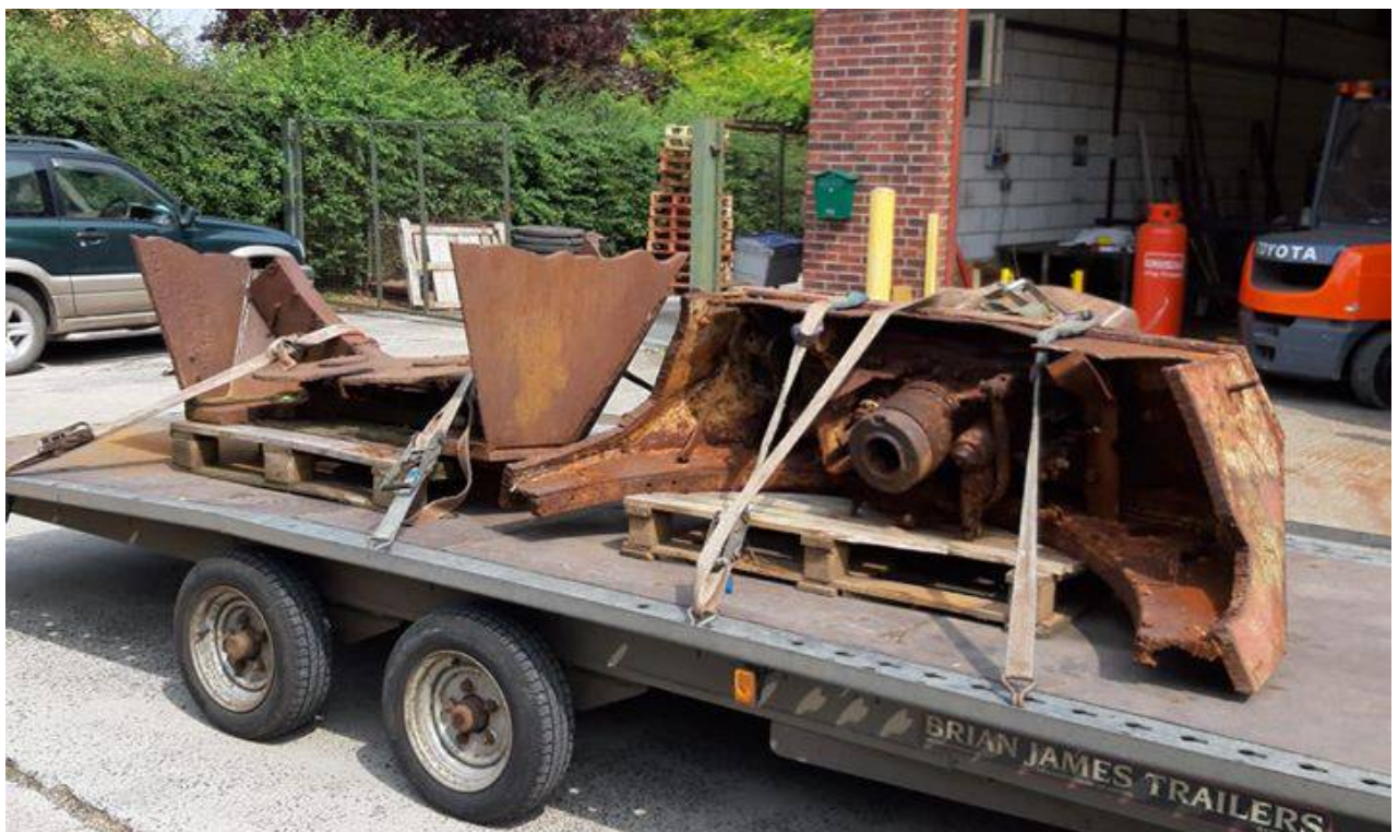
PzKpfw. IV turret – Kevin Wheatcroft Collection (UK)

https://www.facebook.com/The-Wheatcroft-Collection-2348619585363508/