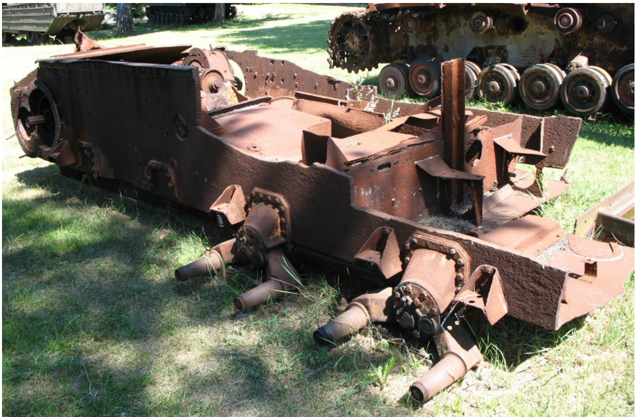
"Vlaad", July 2006

PzKpfw. IV restoration project – Museum im. Orła Białego, Skarżysko-Kamienna (Poland) The museum announced in late February, 2021 that the Panzer IV would be completely restored, probably to running condition