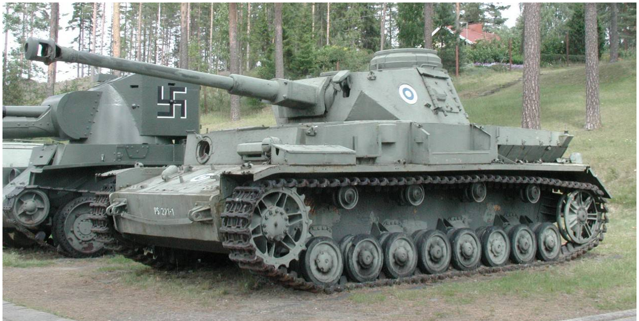
Esa Muikku, June 2002