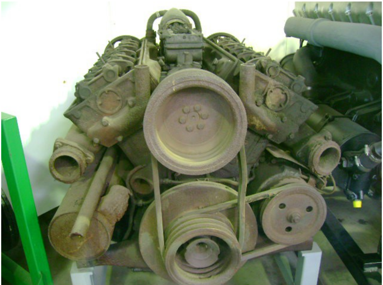
PzKpfw. IV Ausf. D turret – Deutsches Panzermuseum, Munster (Germany)