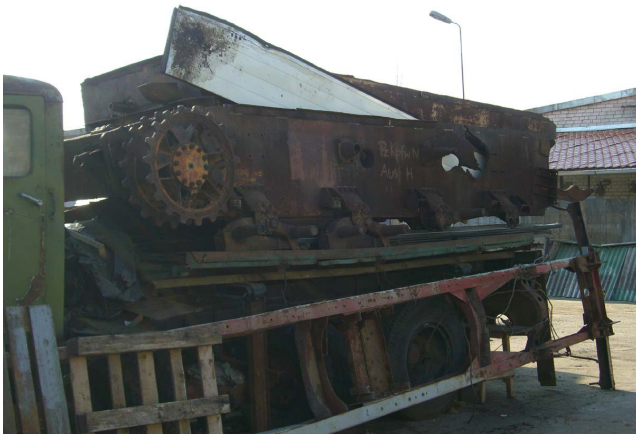
"BIGRED", March 2008 - http://opozit.ru/modules.php?name=Forums&file=viewtopic&t=29696