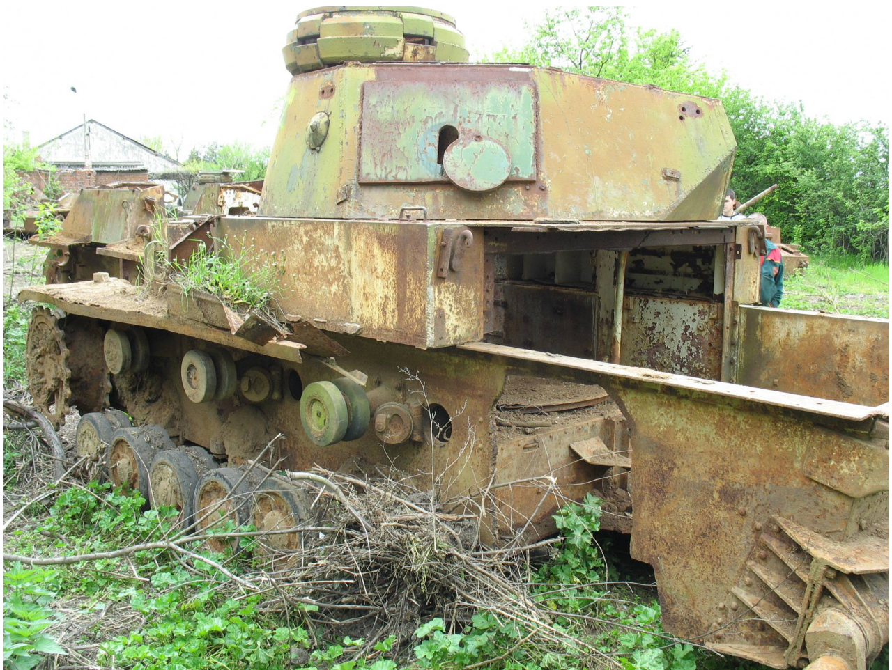
Dobromir Dimitrov, 2009