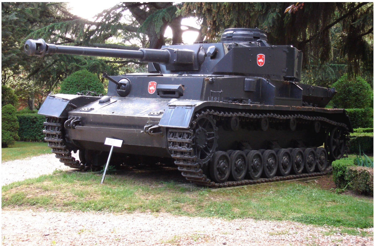
Lope Sanz, May 2010

The tank has been transferred from Falaise to the new museum in March 2013