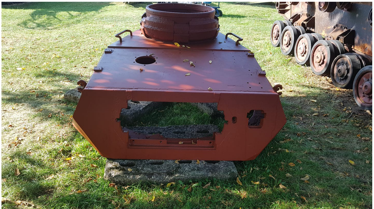
PzKpfw. IV Ausf. J restoration project – SdKfz Team Poland (Poland)

https://www.facebook.com/photo/?fbid=517687047683371&set=a.102245202560893