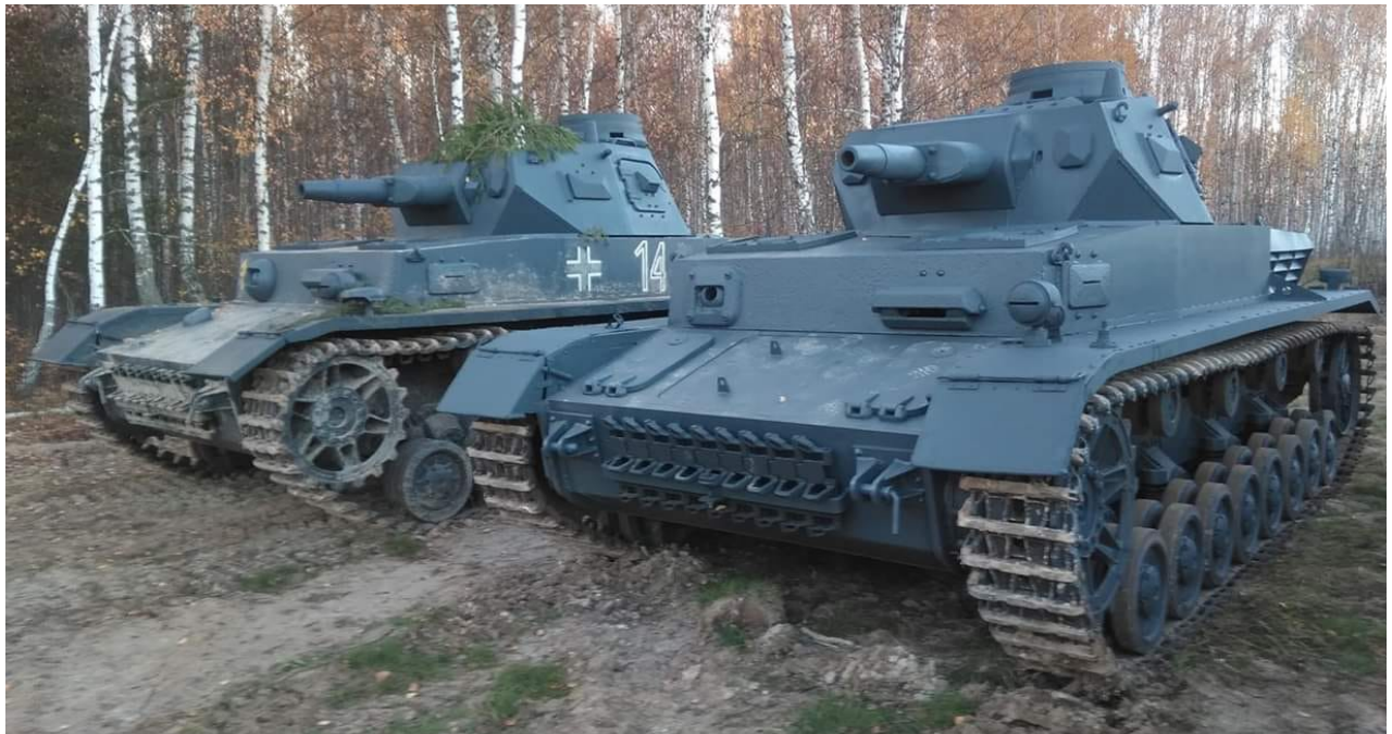
PzKpfw IV turret – Unknown location (Russia?)

https://www.facebook.com/photo.php?fbid=724461421254827&set=pcb.1121568947993406&type=3&theater&ifg=1