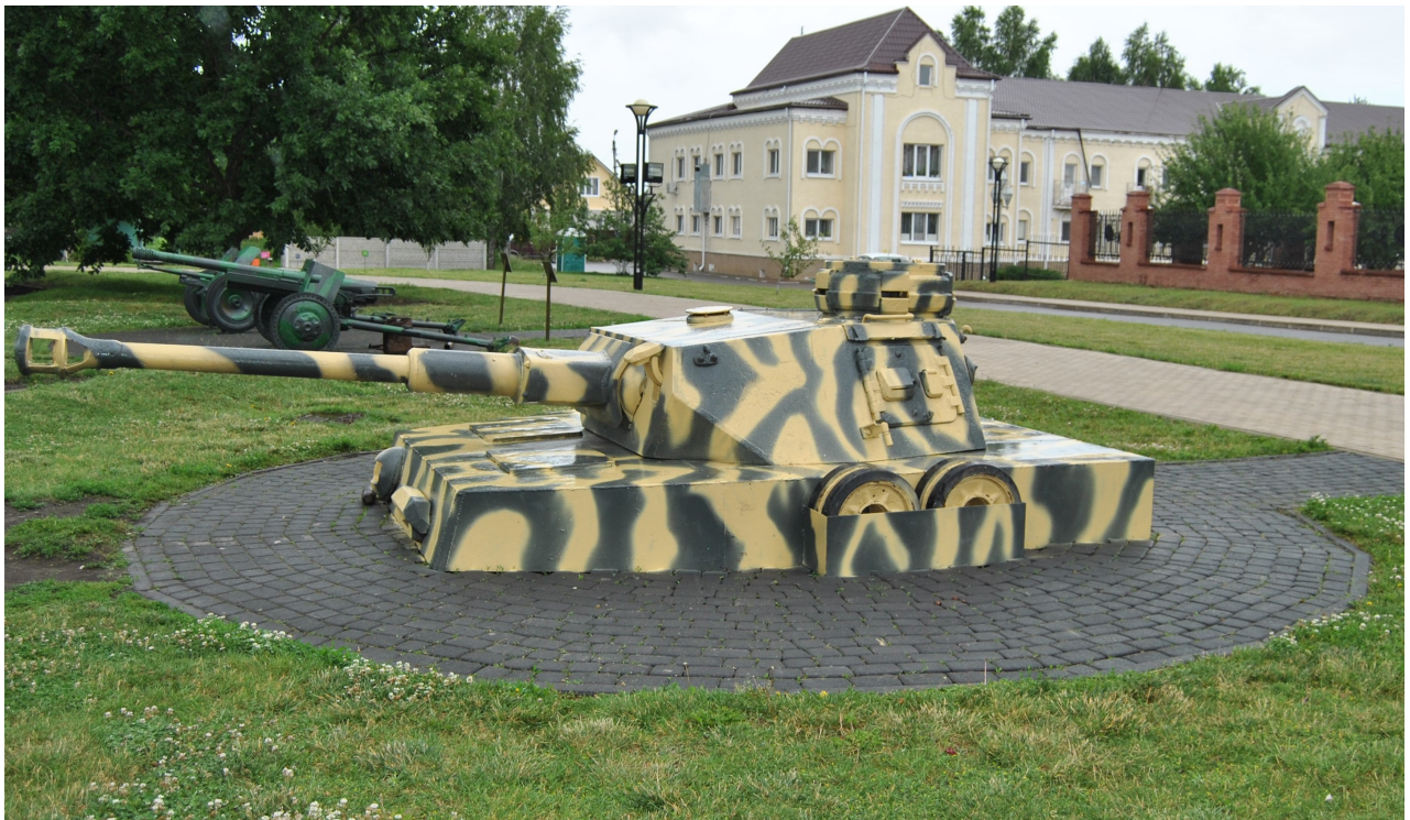
Karol Ondrusek, July 2017

Described as a "set of metal" belonging to a Panzer IV Ausf. D with hull number 80576 and tank number 433 (early war - Polish/French Campaign), it consists in a main gun, a pair of tracks, all the roadwheels, many pieces of armor, and original parts with numbers