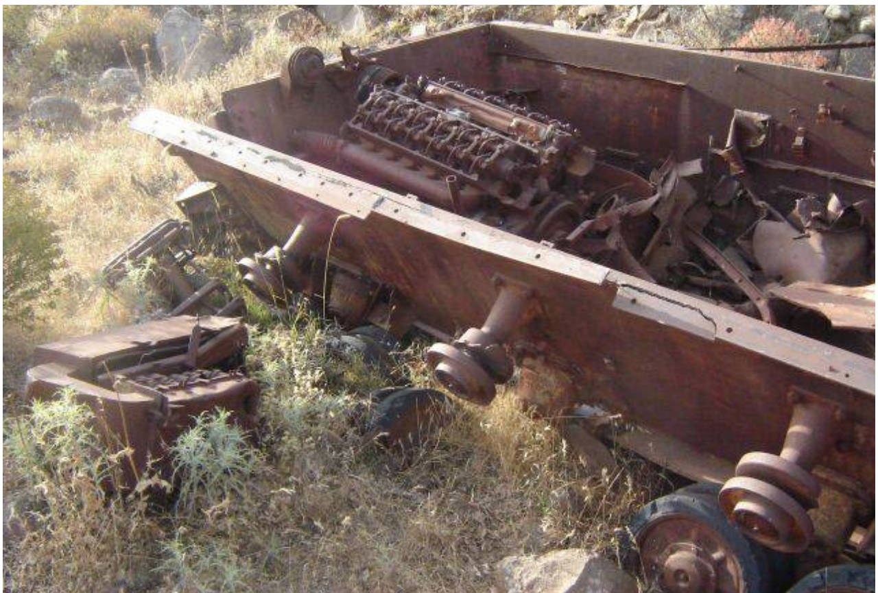
"borowiki", November 2008 - http://www.forfree.pl/eksploracja/viewtopic.php?t=725&postdays=0&postorder=asc&start=30