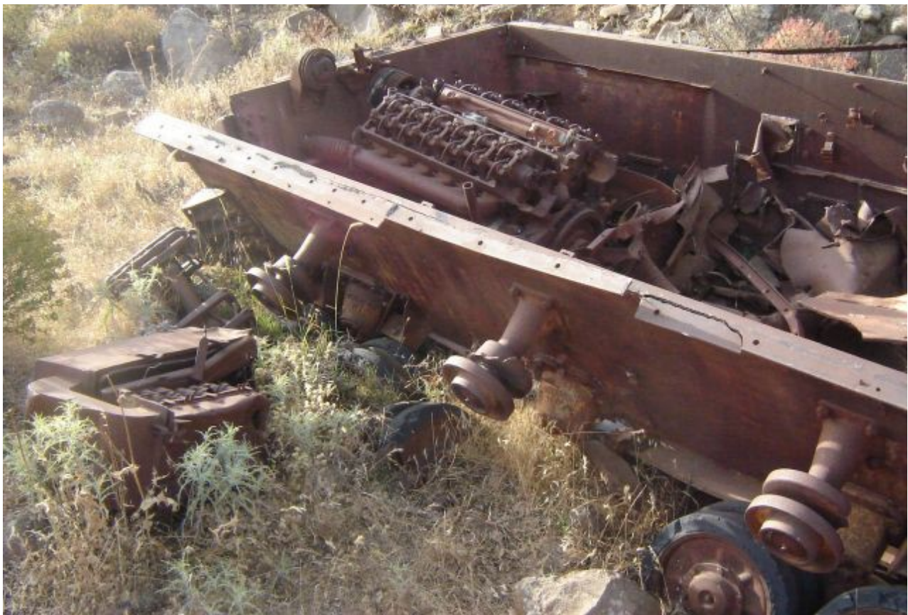
"borowiki", November 2008 - http://www.forfree.pl/eksploracja/viewtopic.php?t=725&postdays=0&postorder=asc&start=30