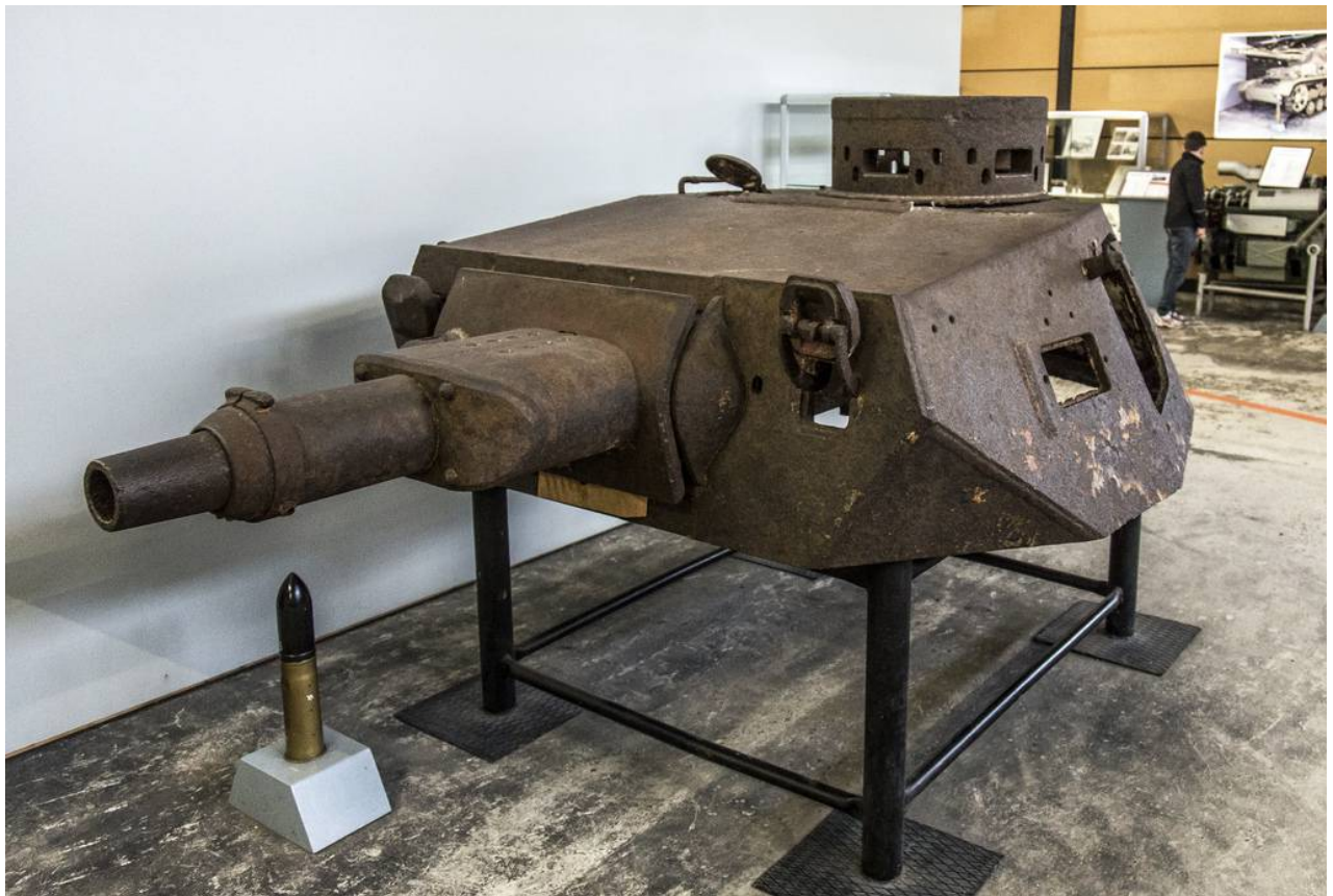
PzKpfw IV Ausf. J wreck (Ps. 221-11) – MM Park, La Wantzenau (France) Fahrgestell number 91792 (Will Phelps). This tank comes from the Finnish army target range, Säkylä (Finland)

Massimo Foti, October 2012 - http://www.flickr.com/photos/massimofoti/8733503407/