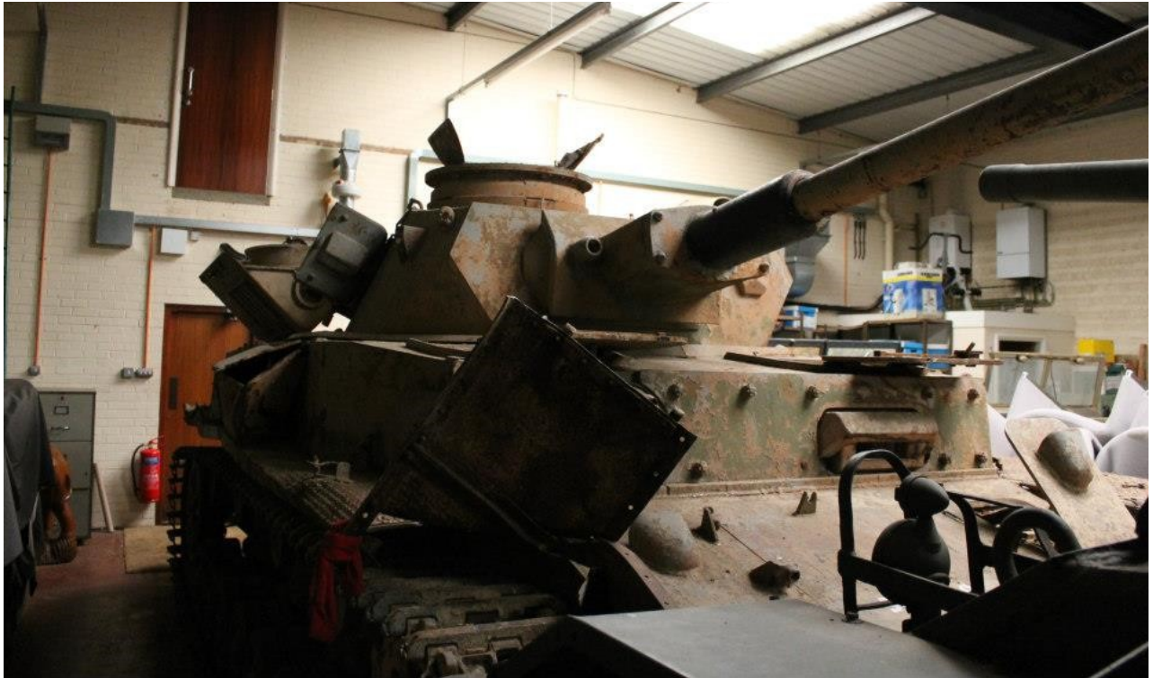
"The_Challenger", November 2012 - http://www.facebook.com/media/set/?set=a.453885897980390.93729.433891793313134&type=3