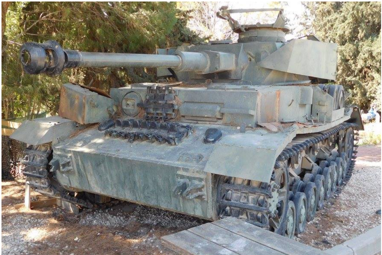
T-40/75 (PzKpfw. IV Ausf. H) – Khmeimim air base, near Lattaquié (Syria)