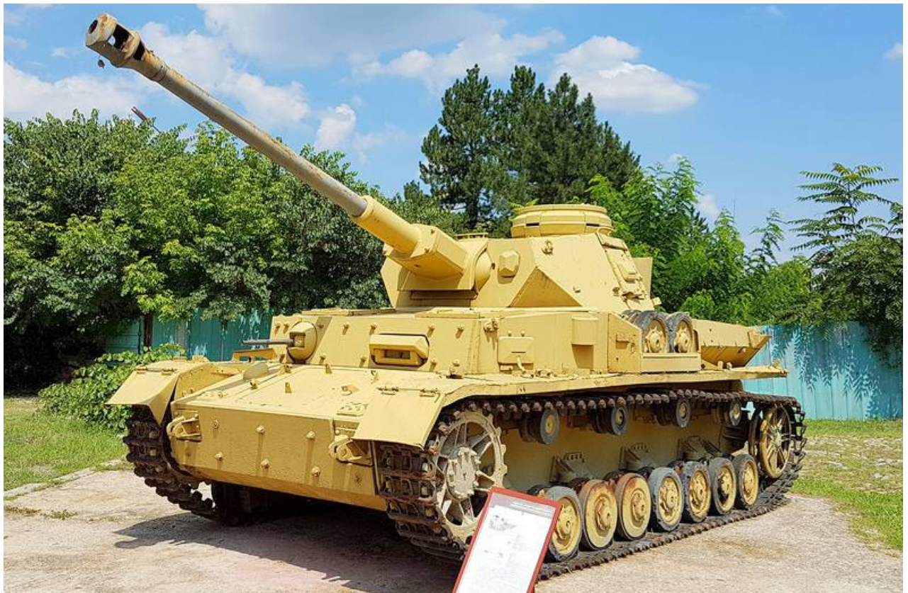
PzKpfw. IV Ausf. H – Kalemegdan Military Museum, Belgrade (Serbia)

https://hiveminer.com/Tags/%D0%B1%D0%BE%D0%B9%D0%BD%D0%B0%D1%82%D0%B0