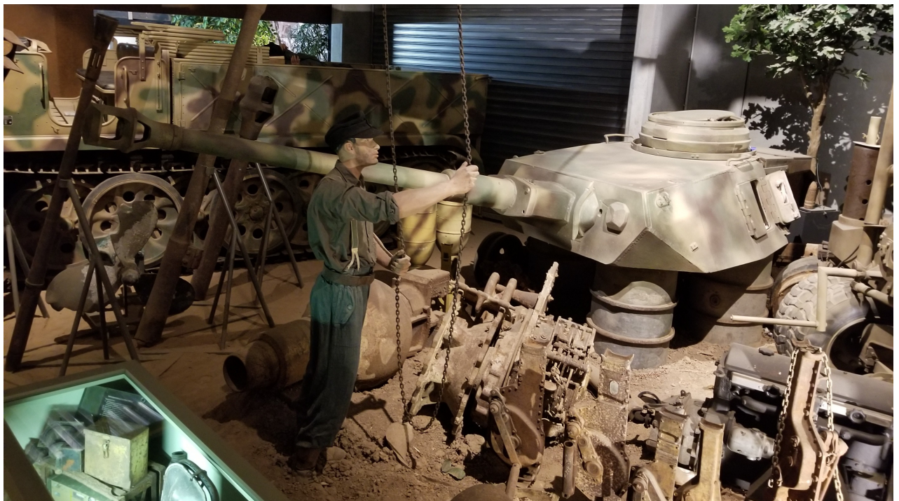
PzKpfw. IV hull and turret

https://www.facebook.com/media/set/?set=a.829484870414009.1073741858.801749283187568&type=1