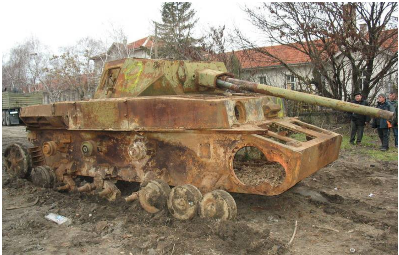
PzKpfw. IV wreck (n° 4) – Museum of Battle Glory, Yambol (Bulgaria)