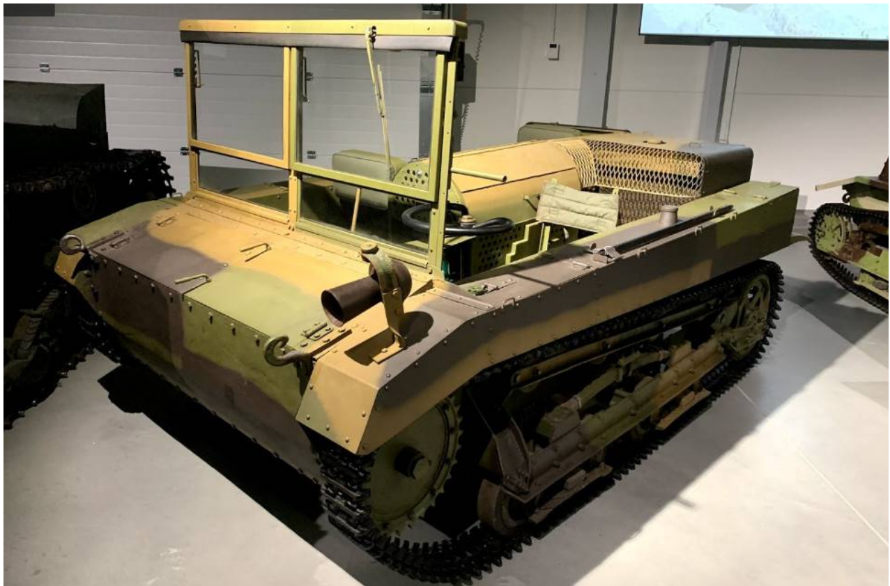
Dariusz Sienniak, November 2019 - https://www.google.com/maps/