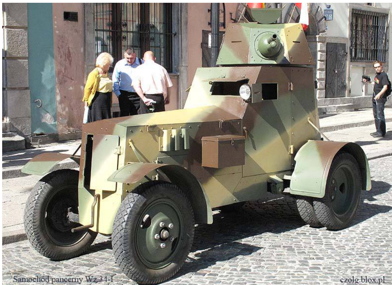
Samochód pancerny Wz.34-I