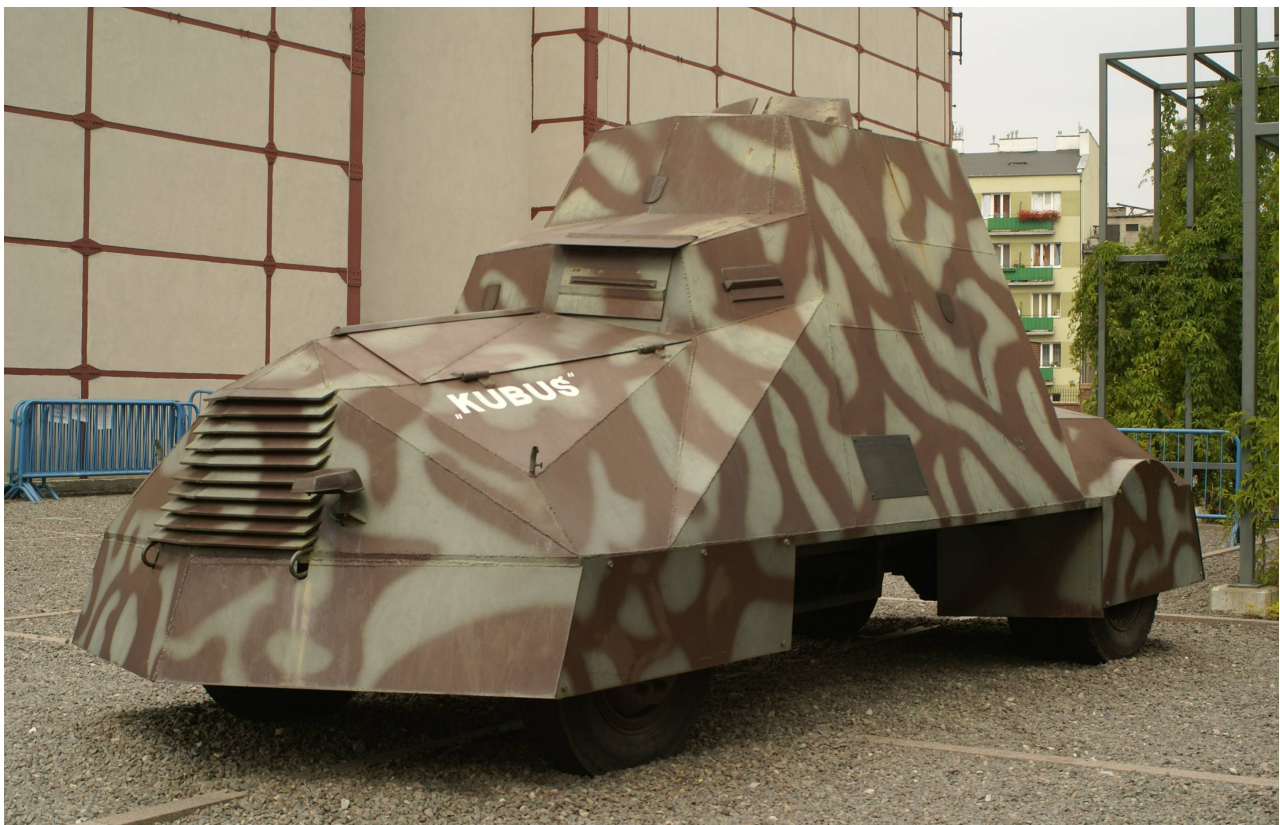
Armored Car wz.34 reproduction Arsenał - Muzeum Fortyfikacji i Broni, Zamość (Poland)

http://muzeum-zamojskie.pl/wp-content/uploads/2015/06/Muz-Arsena%C5%82-2.jpg