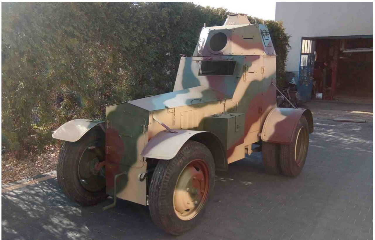
Armored Car wz.34 reproduction Andrzej Frankowski (private owner, Poland) – running condition

https://www.facebook.com/1527980030773955/photos/pcb.2142358999336052/2142317349340217/?type=3&theater