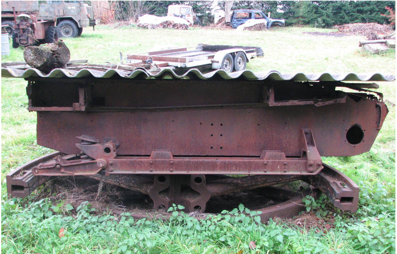
Jędrzej Korbal, November 2009