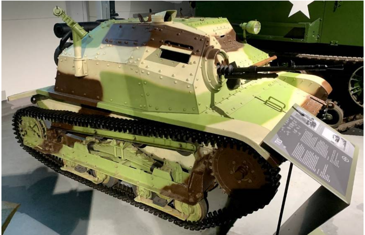
Dariusz Sinenniak, November 2019 - https://www.google.com/maps/