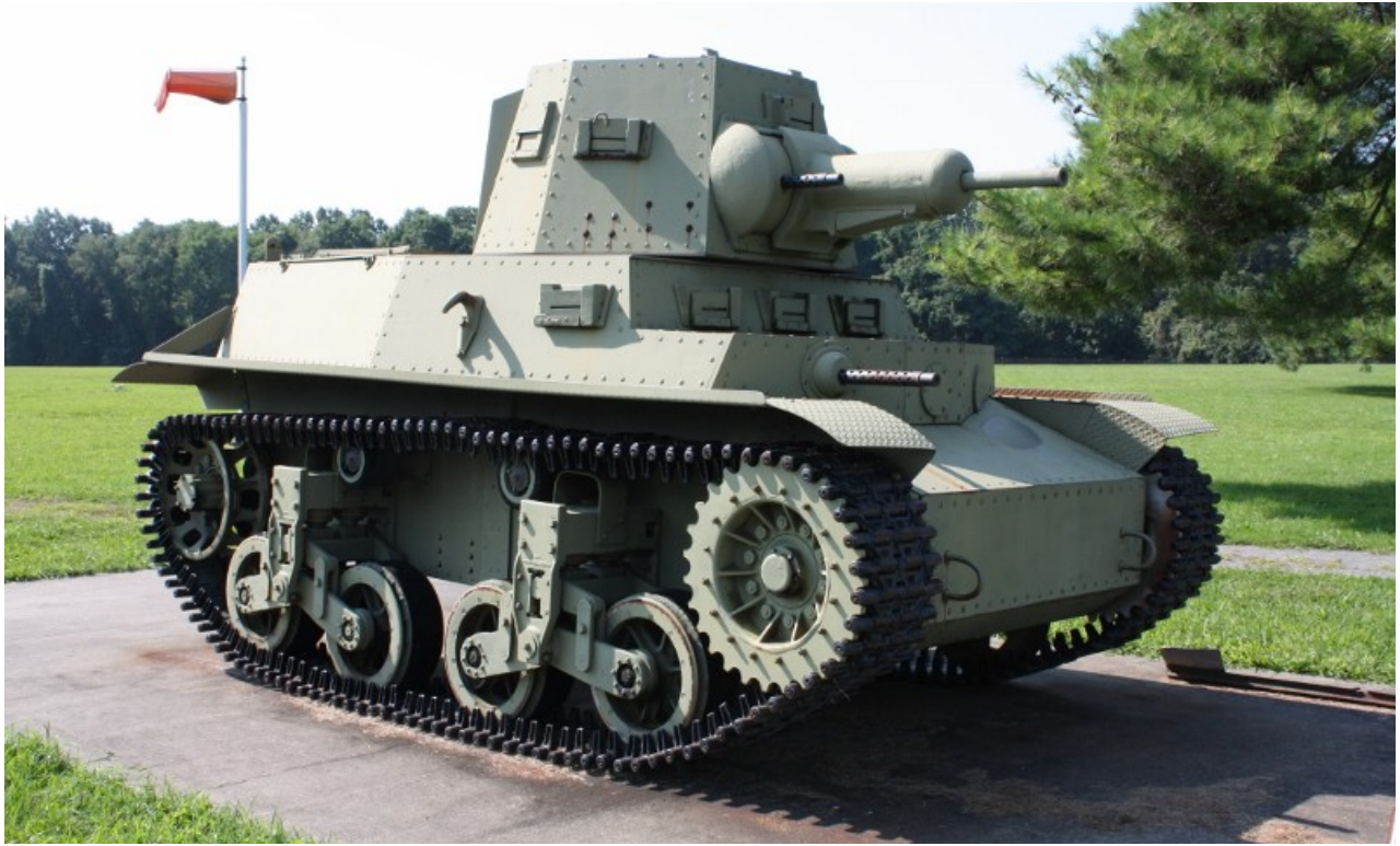
Rick Eshleman, August 2013 - http://www.com-central.net/index.php?name=Forums&file=viewtopic&t=16206

Marmon-Herrington CTMS-1TB1 – Militia Museum of NJ, Lawrenceville, NJ (USA) SN 791; Ex-Guatemalan Army (USA AFVs register)