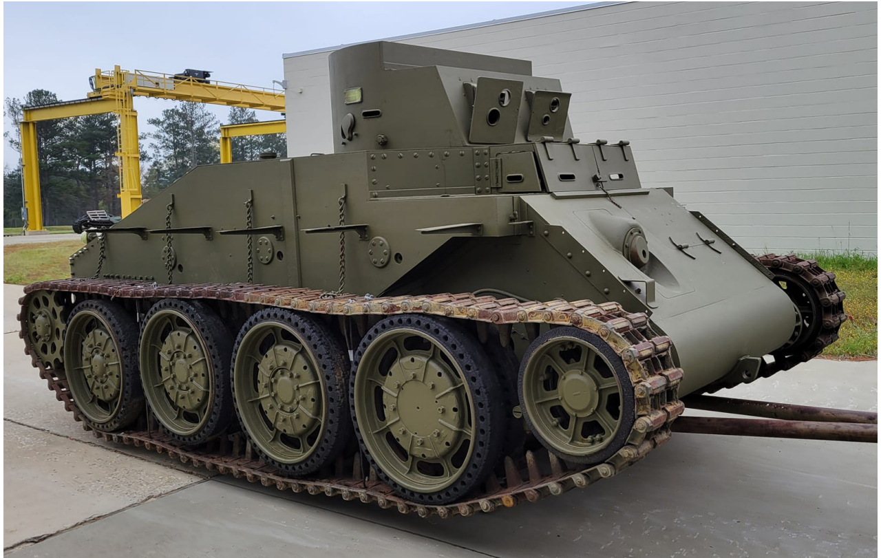
US Army Armor & Cavalry Collection, March 2023