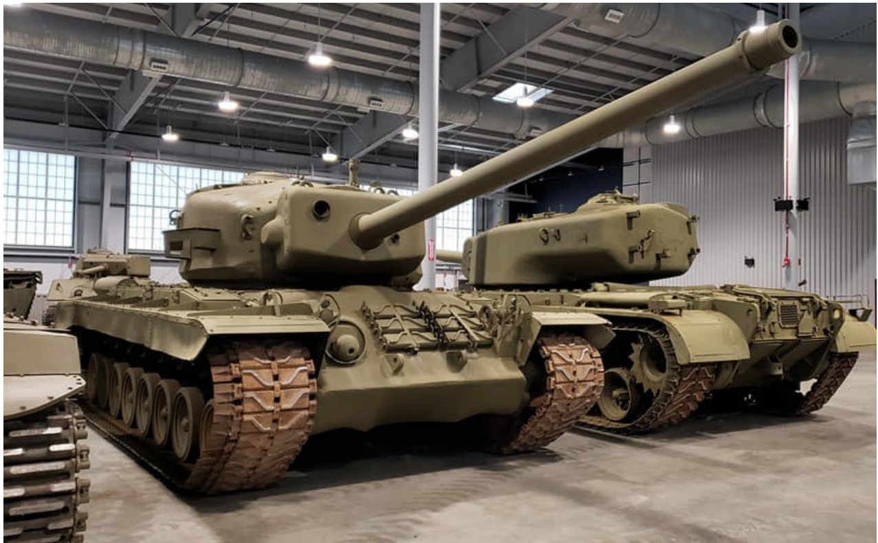
US Army Armor & Cavalry Collection, November 2020

This tank could be the Serial Number 1 (USA AFVs register). This tank is stored and is not publicly visible