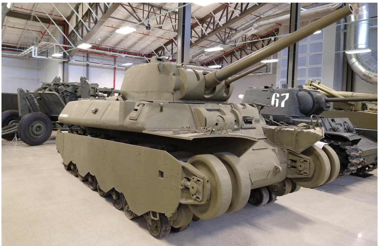
Marmon-Herrington CTLS-4TAC – Photographed near Portugal Cove-St. Philips, Newfoundland and Labrador (Canada)