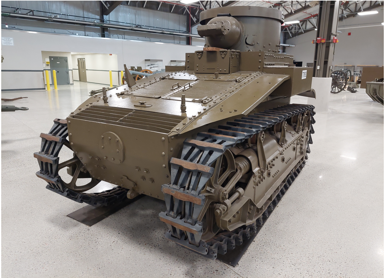
Romain Cansière, April 2025