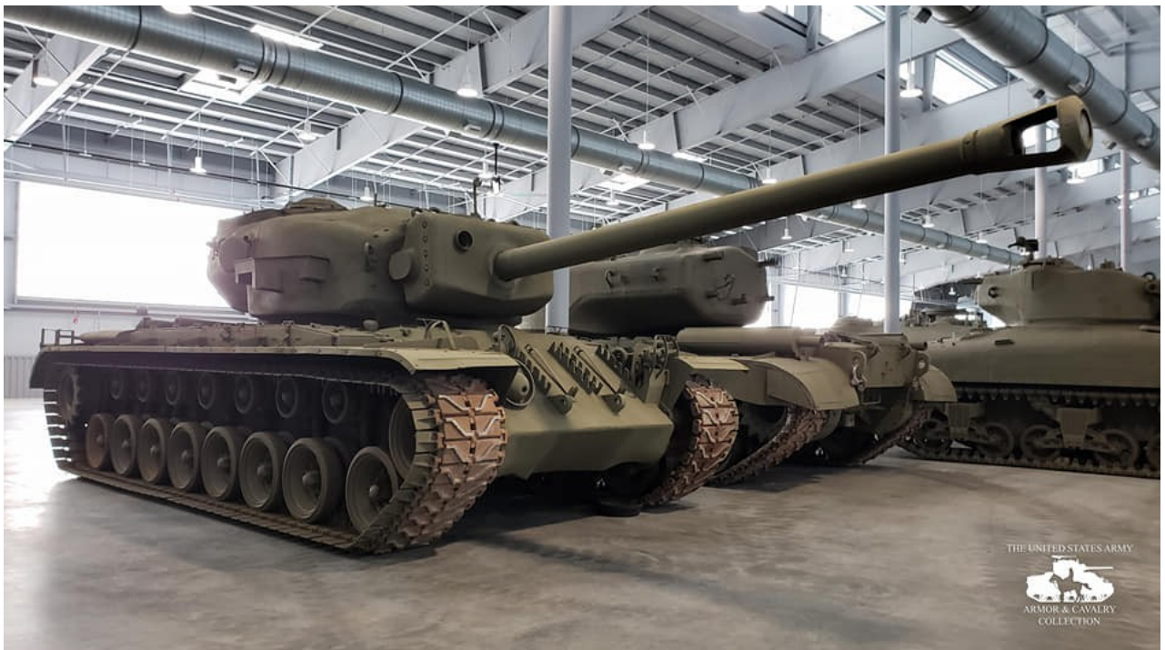
T30 Heavy Tank Detroit Arsenal, Tank-automotive and Armaments Command, Warren, MI (USA)

US Army Armor & Cavalry Collection, November 2020