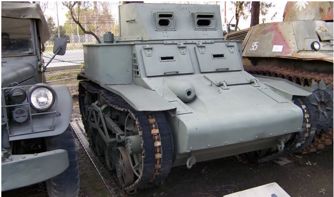
Neil Baumgardner, January 2008 - http://www.com-central.net/index.php?name=Forums&file=viewtopic&t=8701