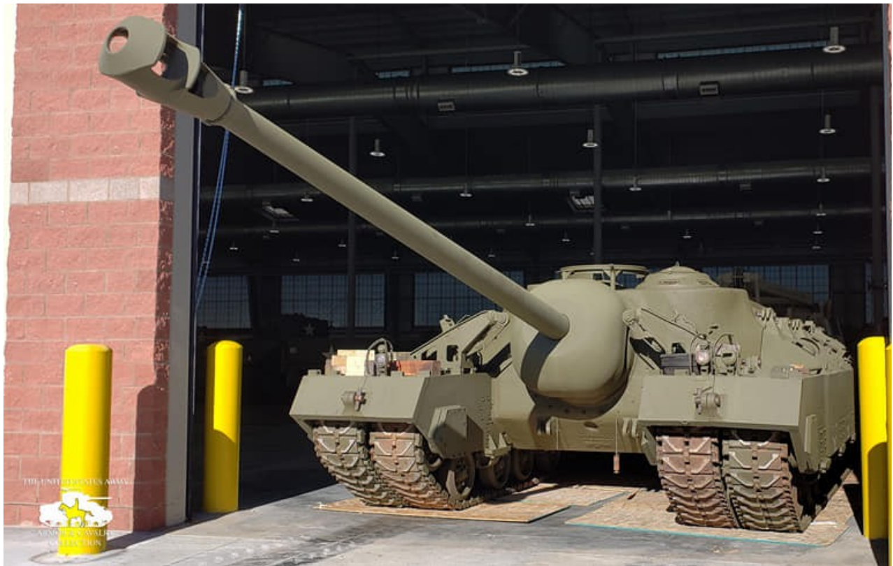
US Army Armor & Cavalry Collection, November 2020