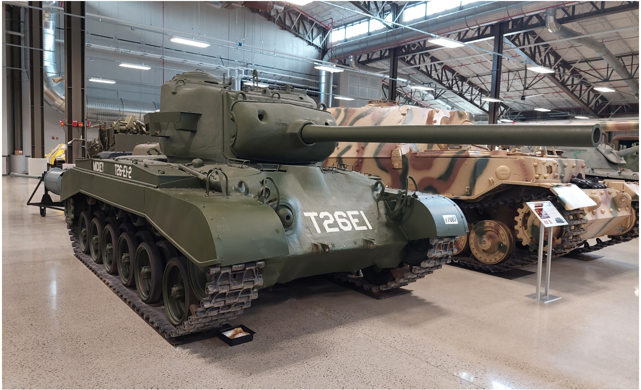
Romain Cansi re, April 2025