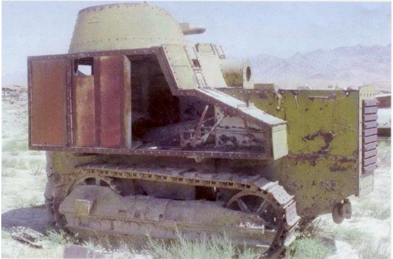
"Wojska pancerne" article