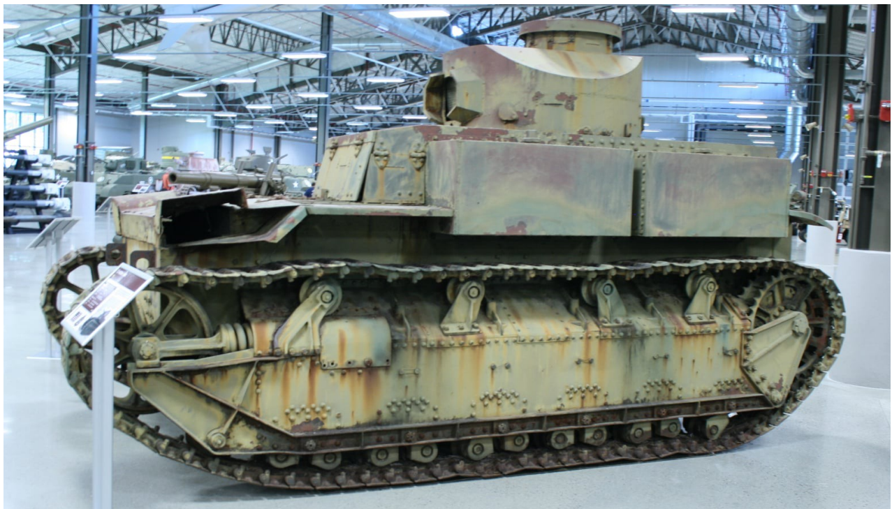
M1922 Medium A Tank – U.S. Army Armor & Cavalry Collection, Fort Benning, GA (USA) Previously part of Aberdeen Proving Ground museum

https://www.facebook.com/ArmorandCavalryCollection