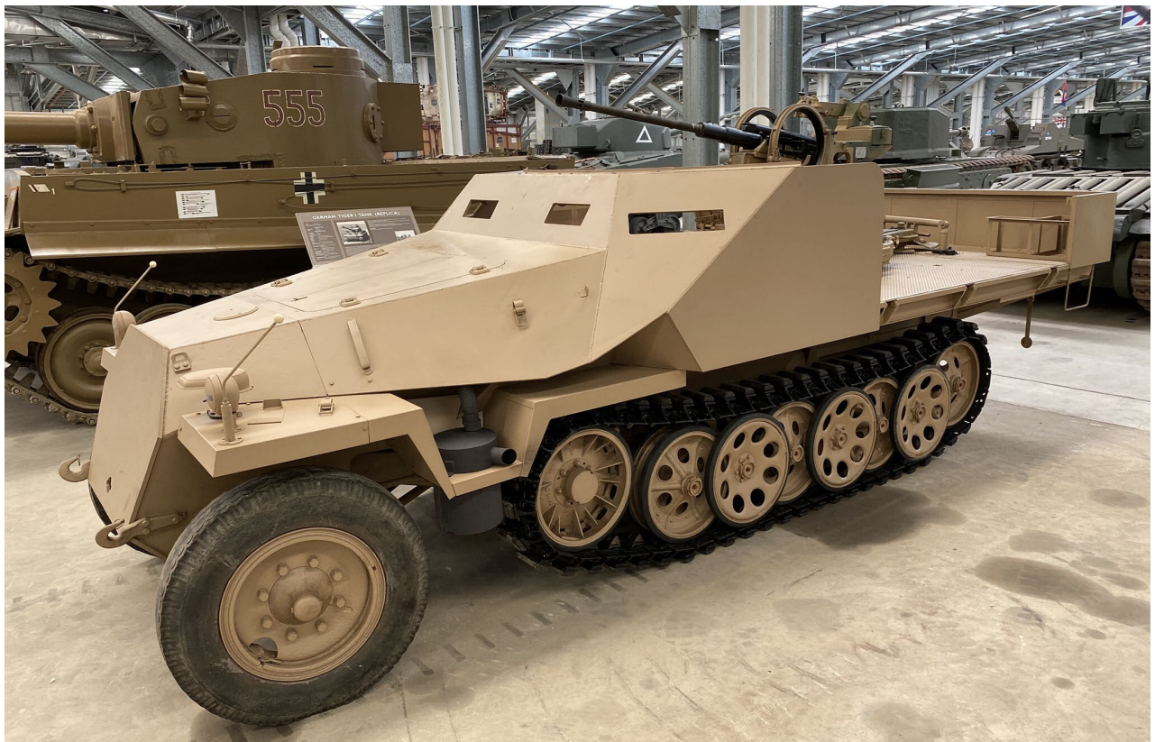
www.facebook.com , February 2020

Fahrgestellnummer 720338, built in 1942 by Skoda (Hilary Doyle) Vehicle was remade in the former Arlon museum to look like a 39 hanomag