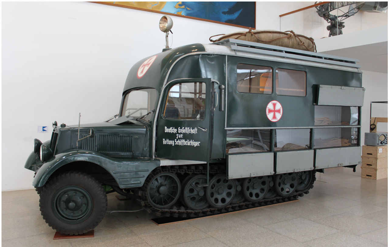
Sander Degeling, September 2013