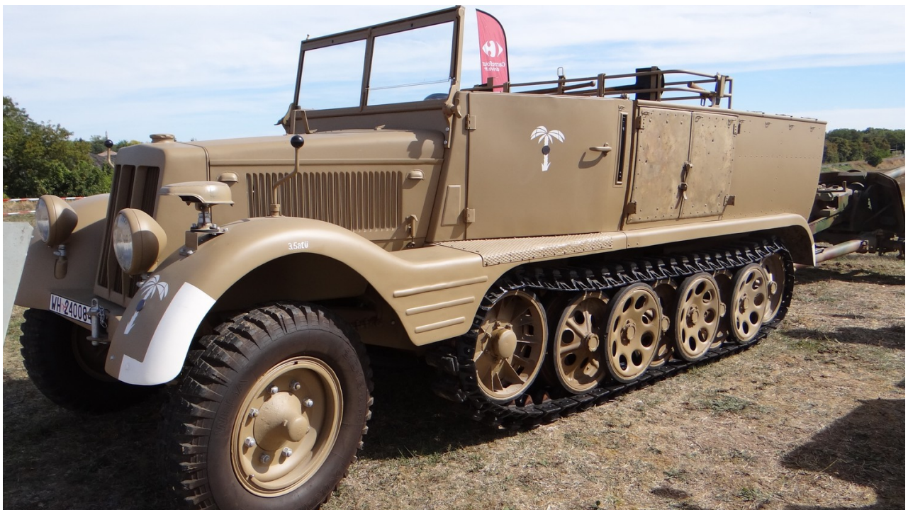
2023 – www.facebook.com