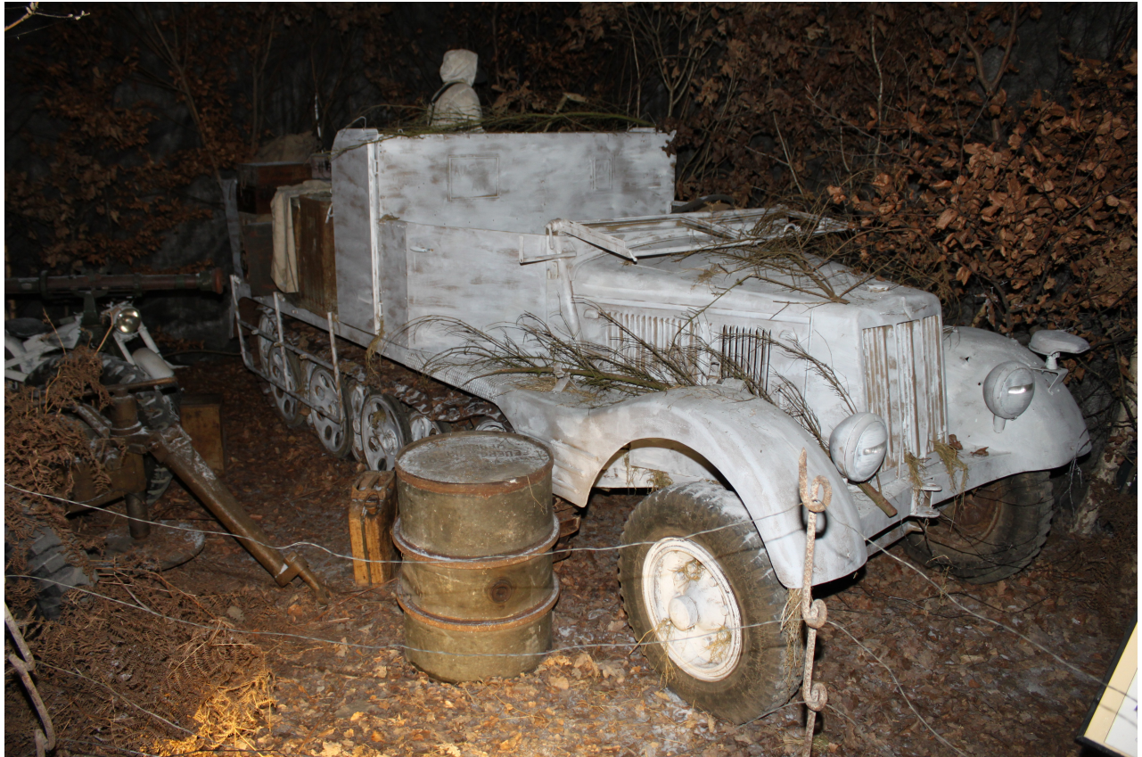
Sander Degeling, July 2013