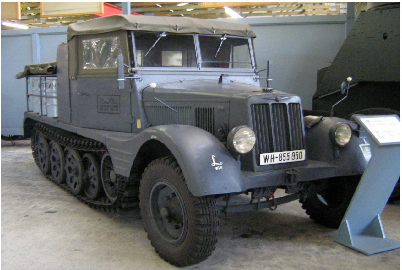
Walter Schwabe, July 2007