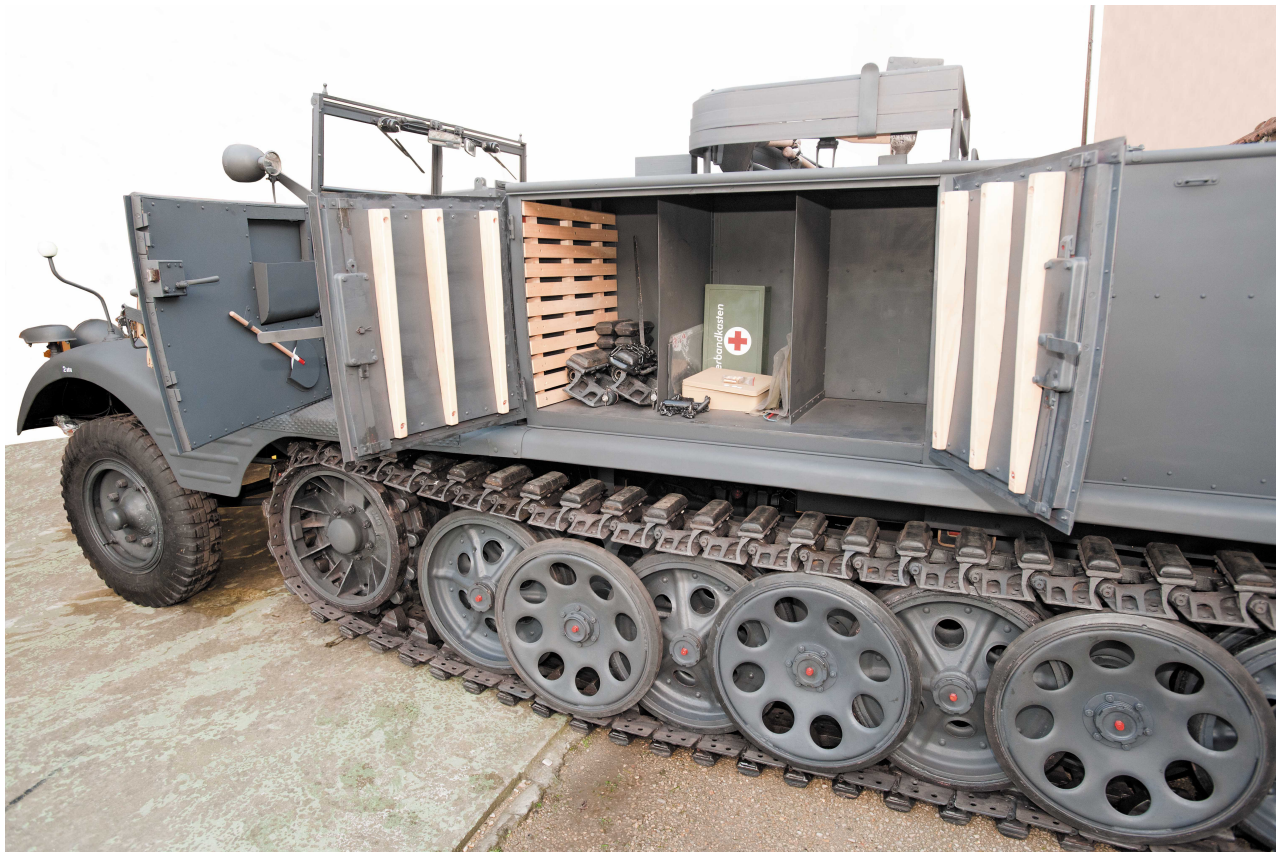
Hermann Historica Auction