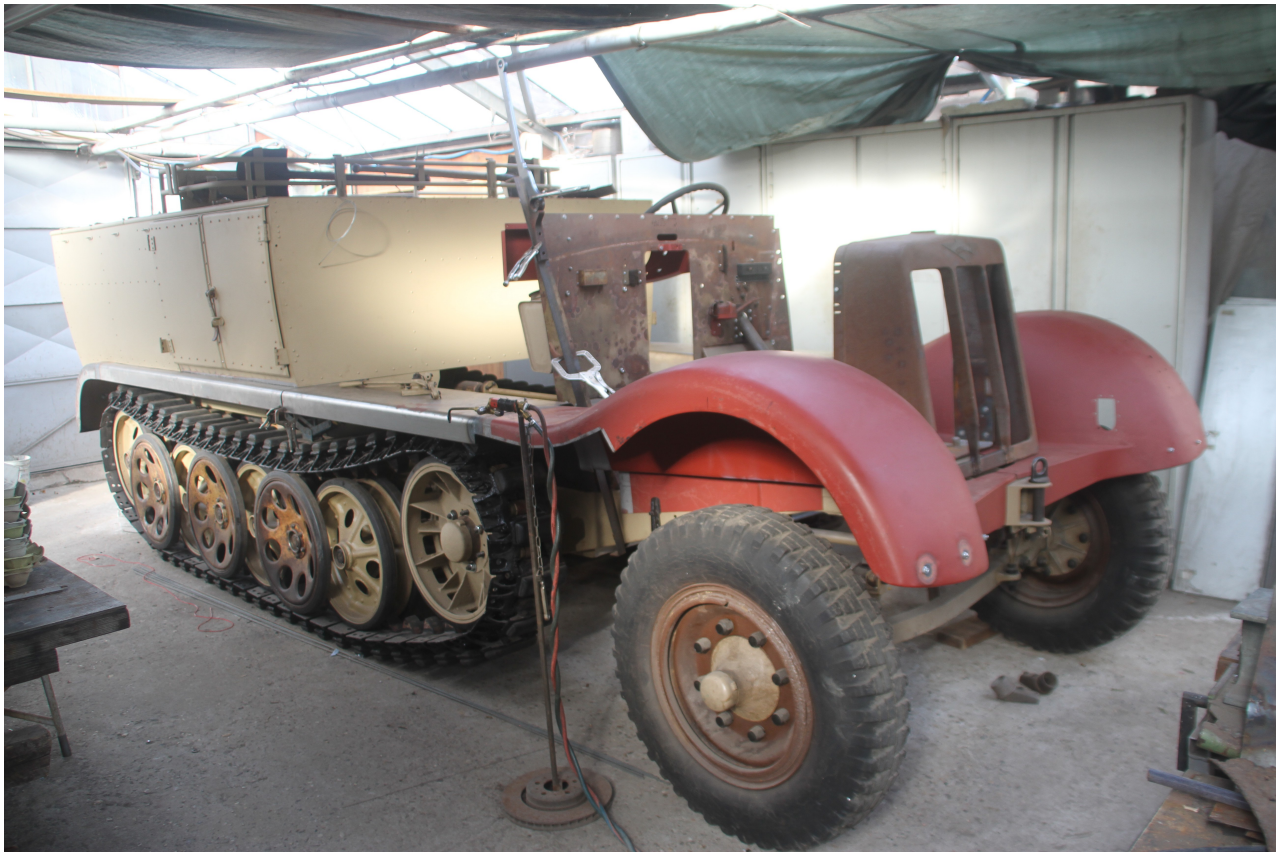
Walter Schwabe, November 2023