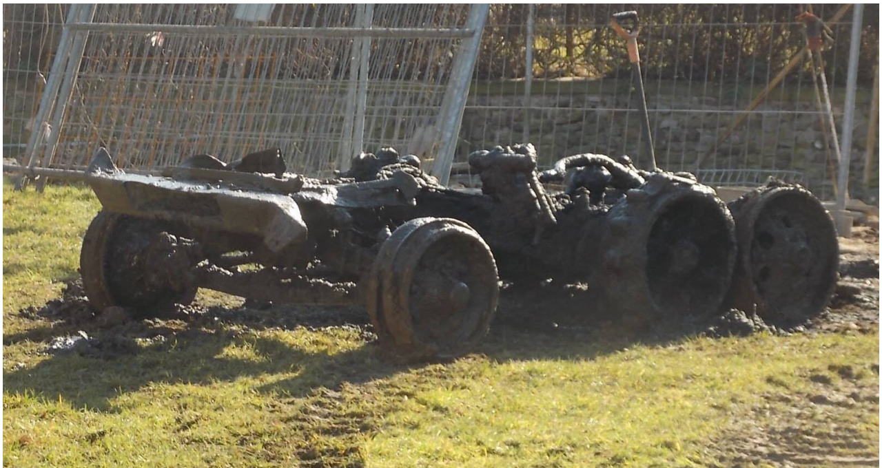
Udo Kupfer 2015