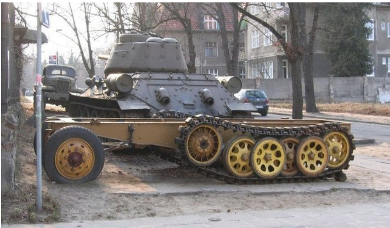
Michal Sambor, January 2009 - http://picasaweb.google.com/czolgi123/SdKfz_6_GdaSk#

Fahrgestellnummer 25259, built by Mercedes-Benz in 1936