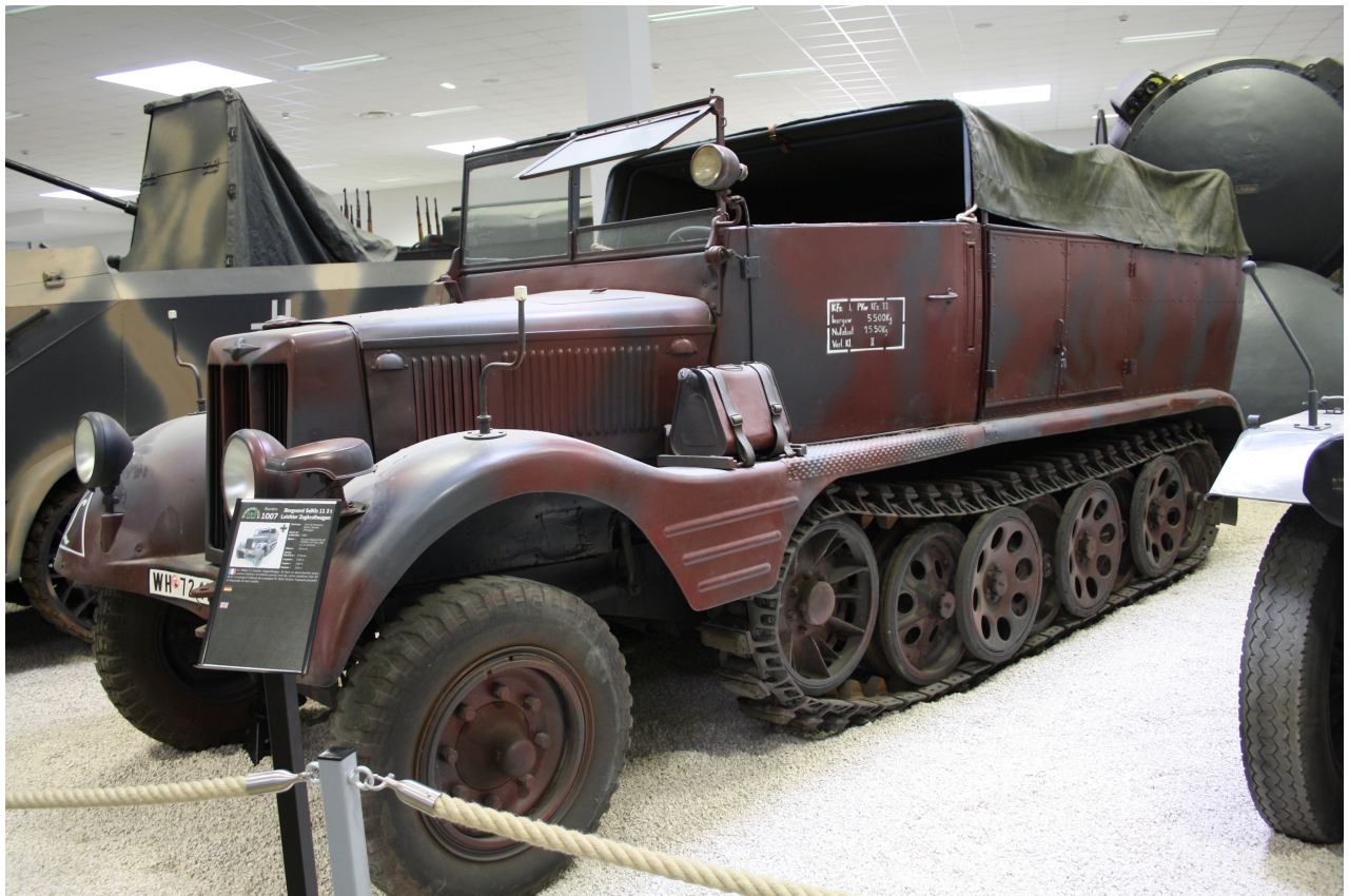
Walter Schwabe, June 2018