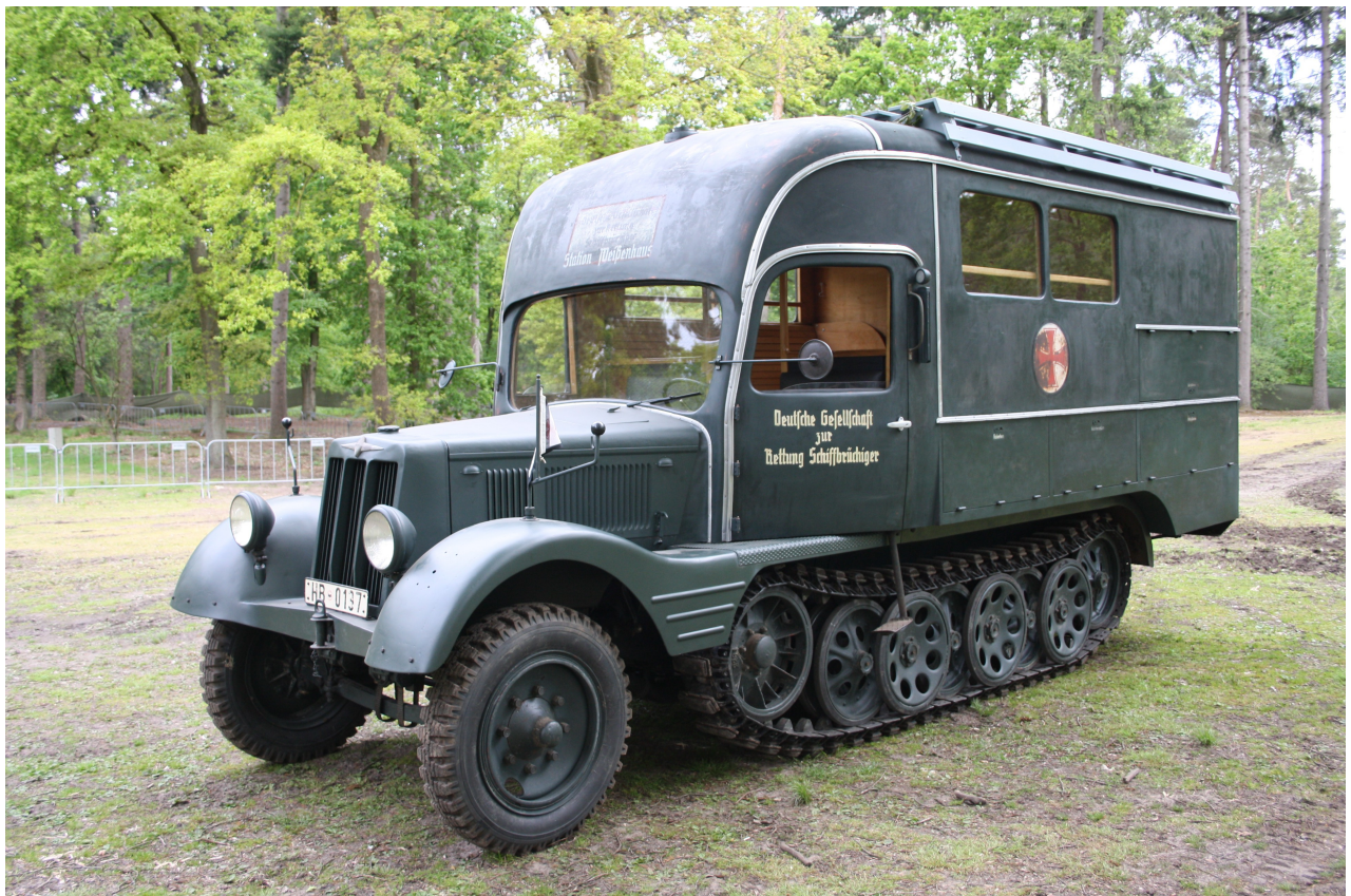
Walter Schwabe, May 2019

11 of these were planned but only 2 were finished