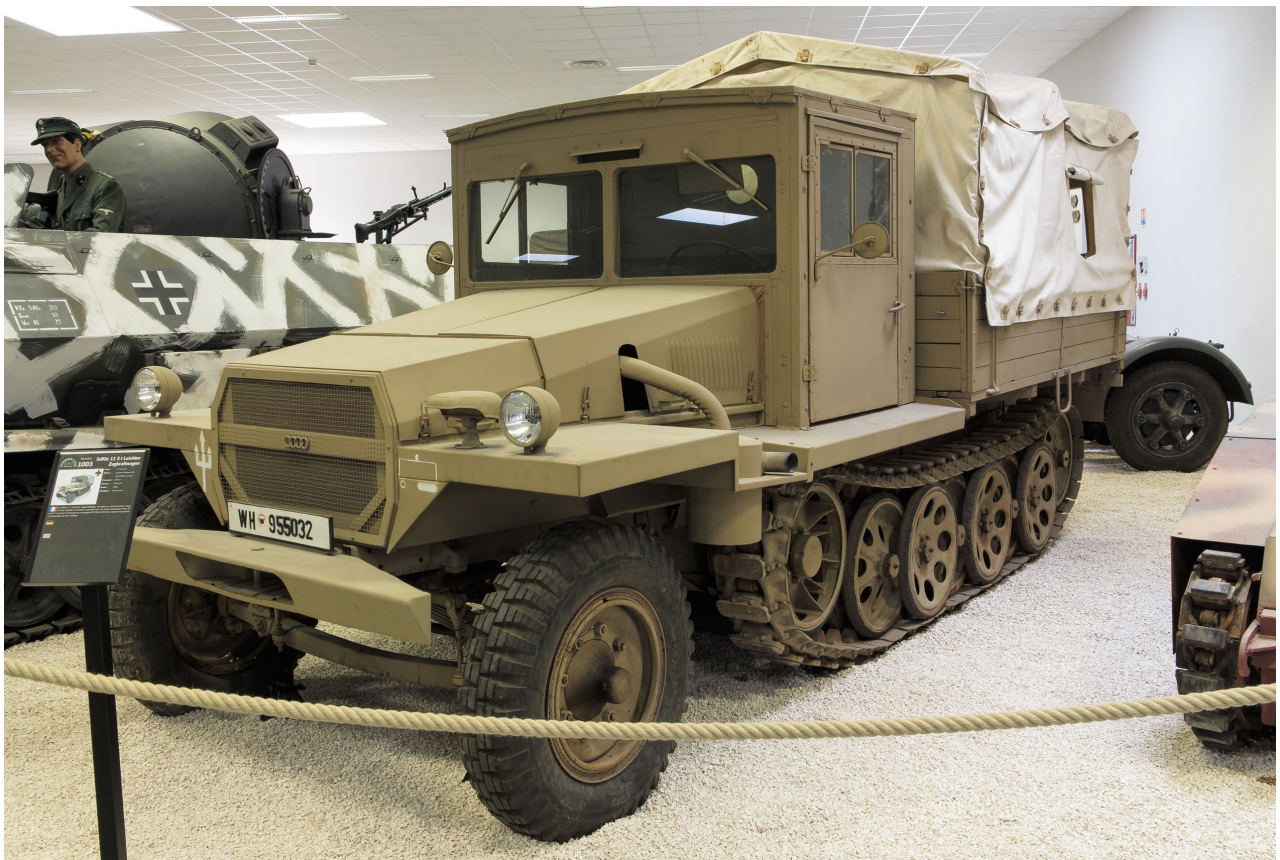
Axel Recke ,August 2017

Built in 1942 by Borgward. The vehicle belonged to the Auburn Victory Museum, and was sold in the December 2012 auction