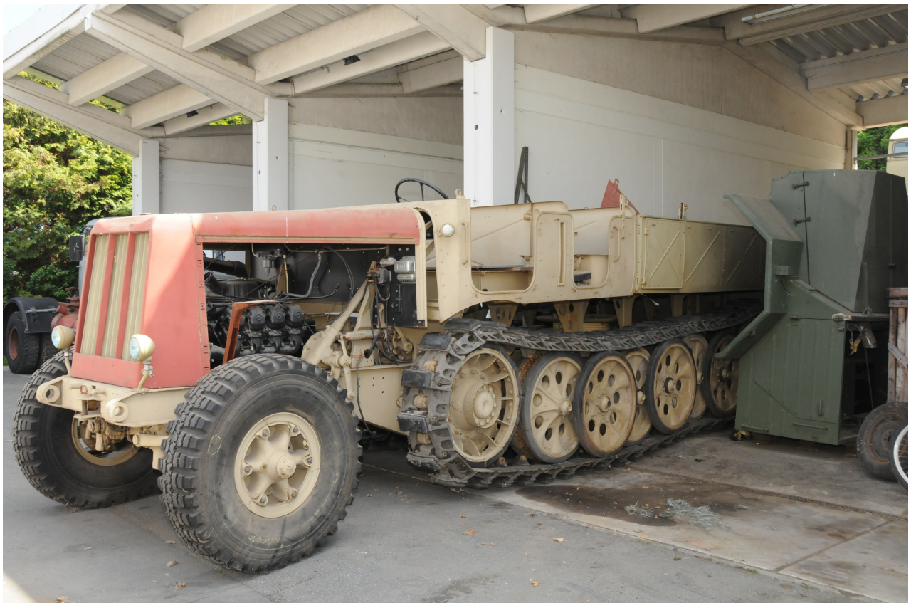
SdKfz.9 – Private collection (Germany) – running condition Fahrgestellnummer 46597, built by Famo Werke Breslau