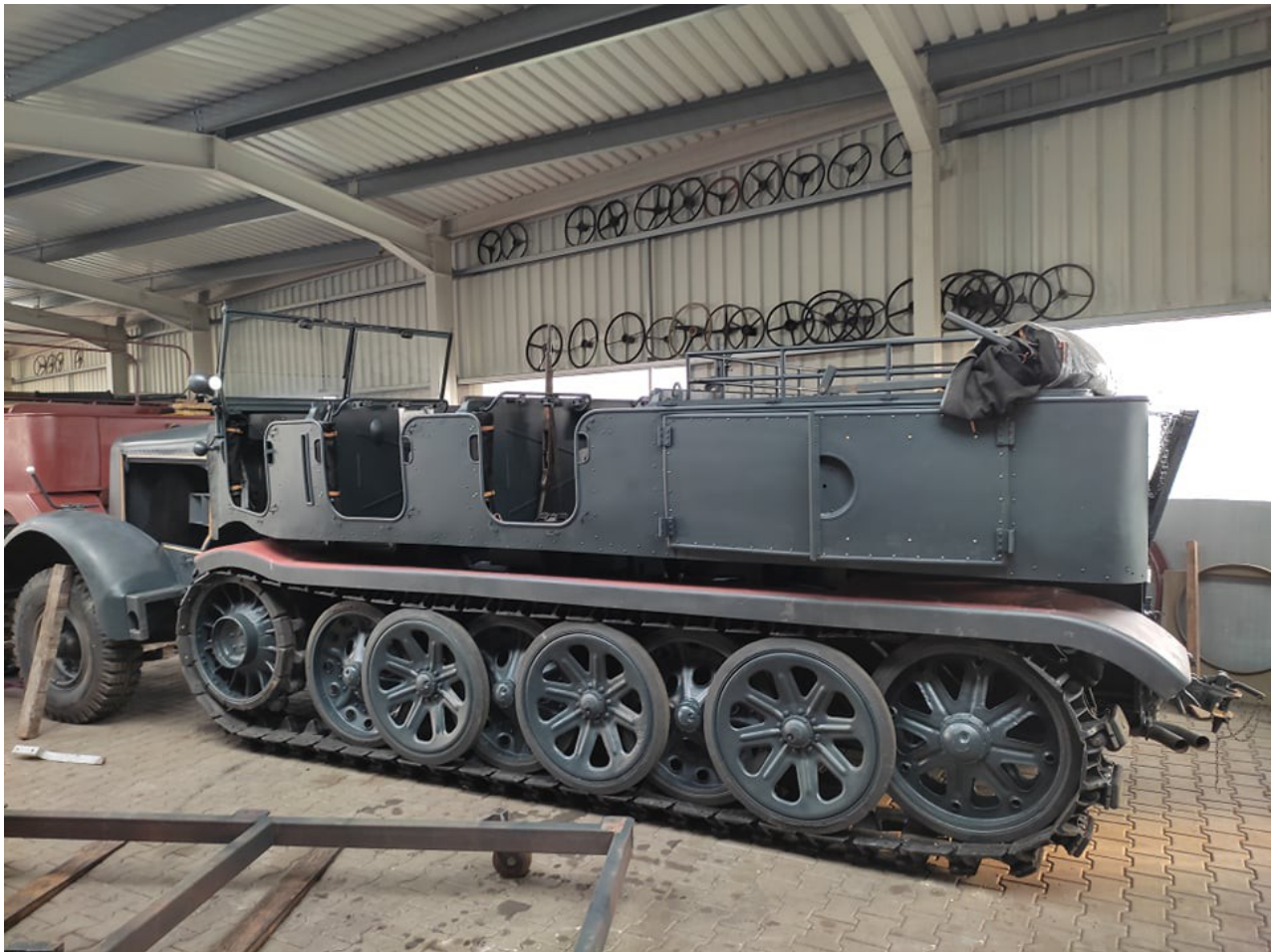
Honza Lehar, Sept.2021