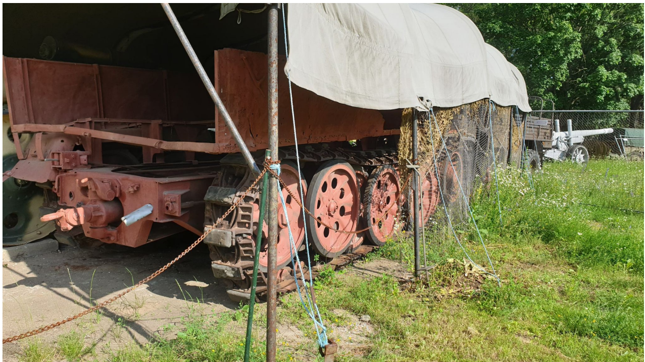
Jakub Brandys, July 2020

Fahrgestellnummer 40272, built by Vomag. The vehicle is currently under restoration