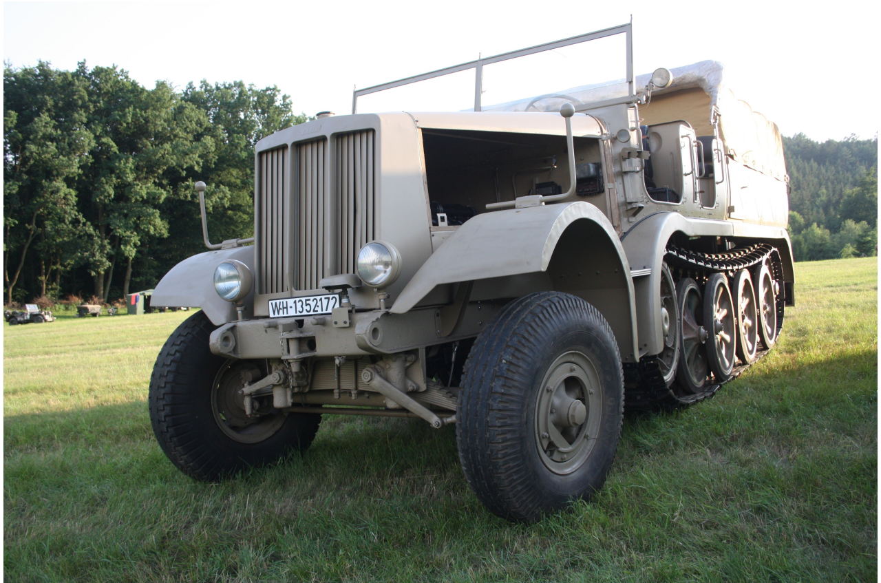
Walter Schwabe, July 2022