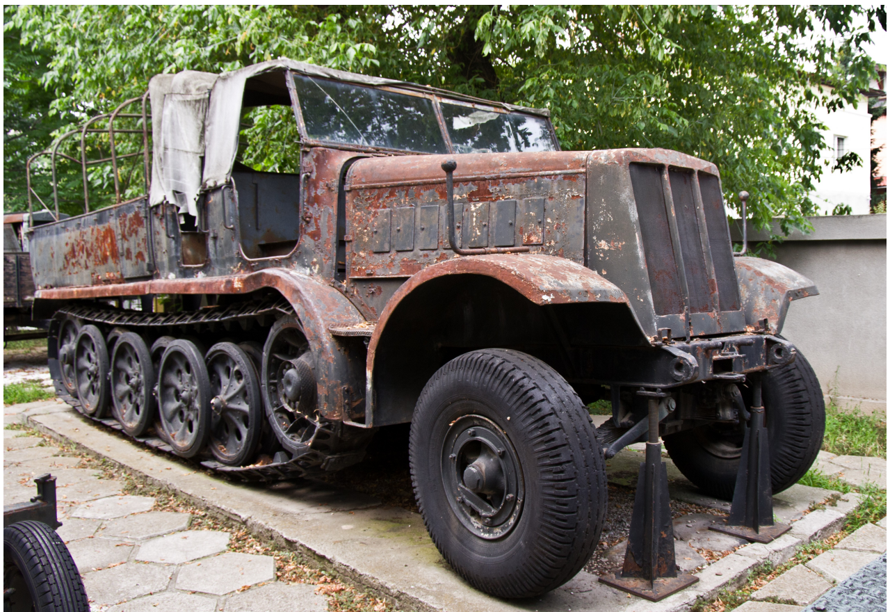
Massimo Foti, July 2010