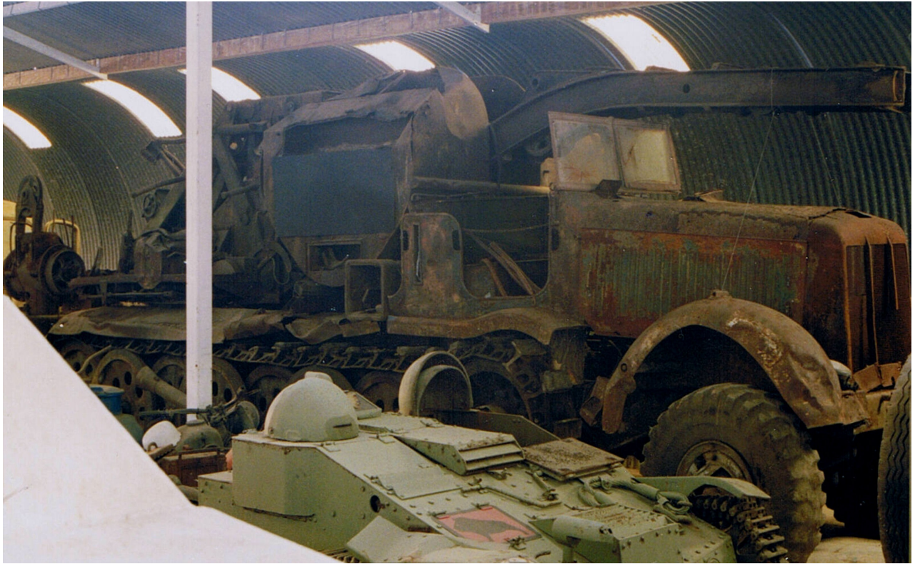
Nuts & Bolts Archive