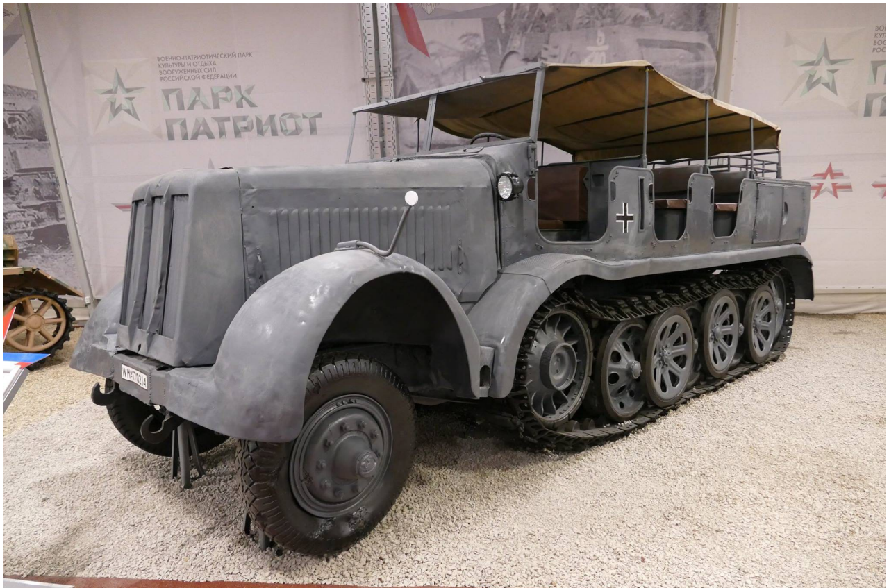
Yuri Pasholok, 2016 – www.facebook.com

The vehicle is not on display anymore ,but stored in a warehouse ,not accesable for public