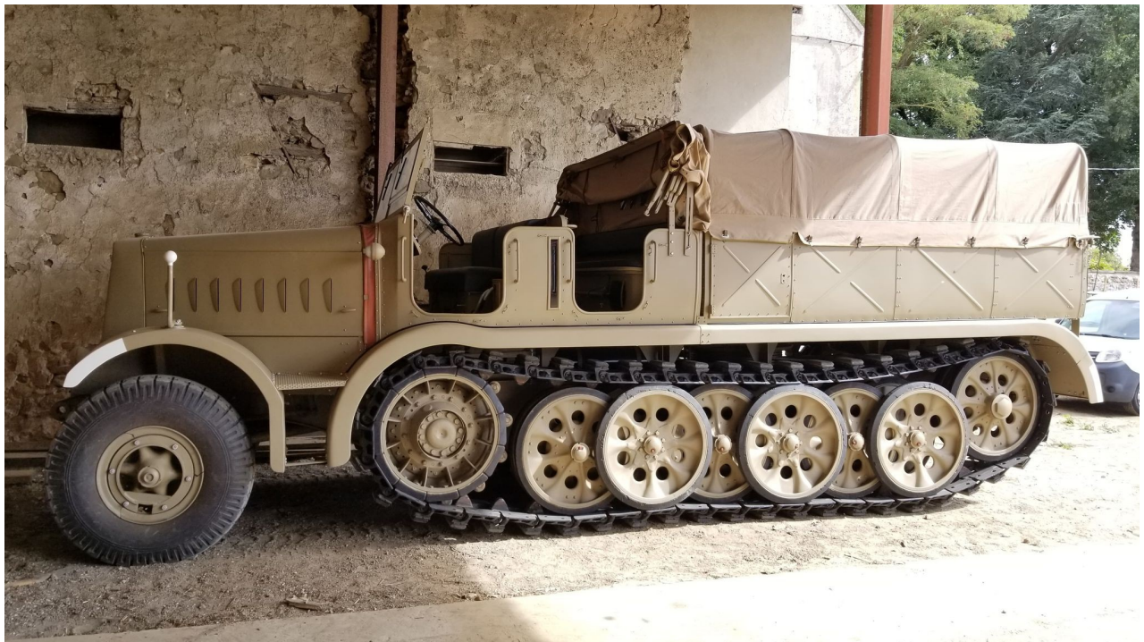
Pierre-Oliver Buan, September 2020