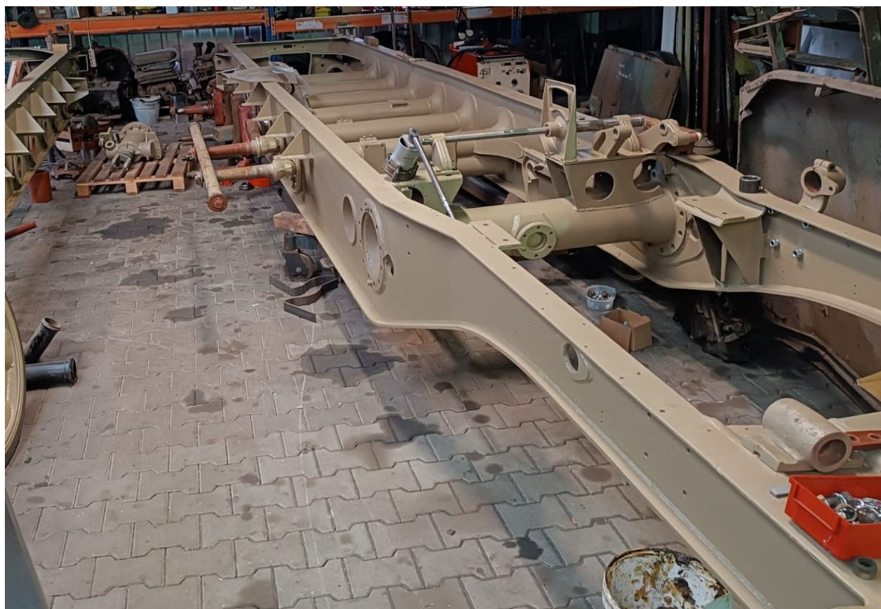
www.facebook.com , December 2023

Fahrgestellnummer 46645, built in 1944 by Famo Werke Breslau. The chassis of this vehicle is originally from a version 9/1, that makes the vehicle a little longer and wider than a standard version