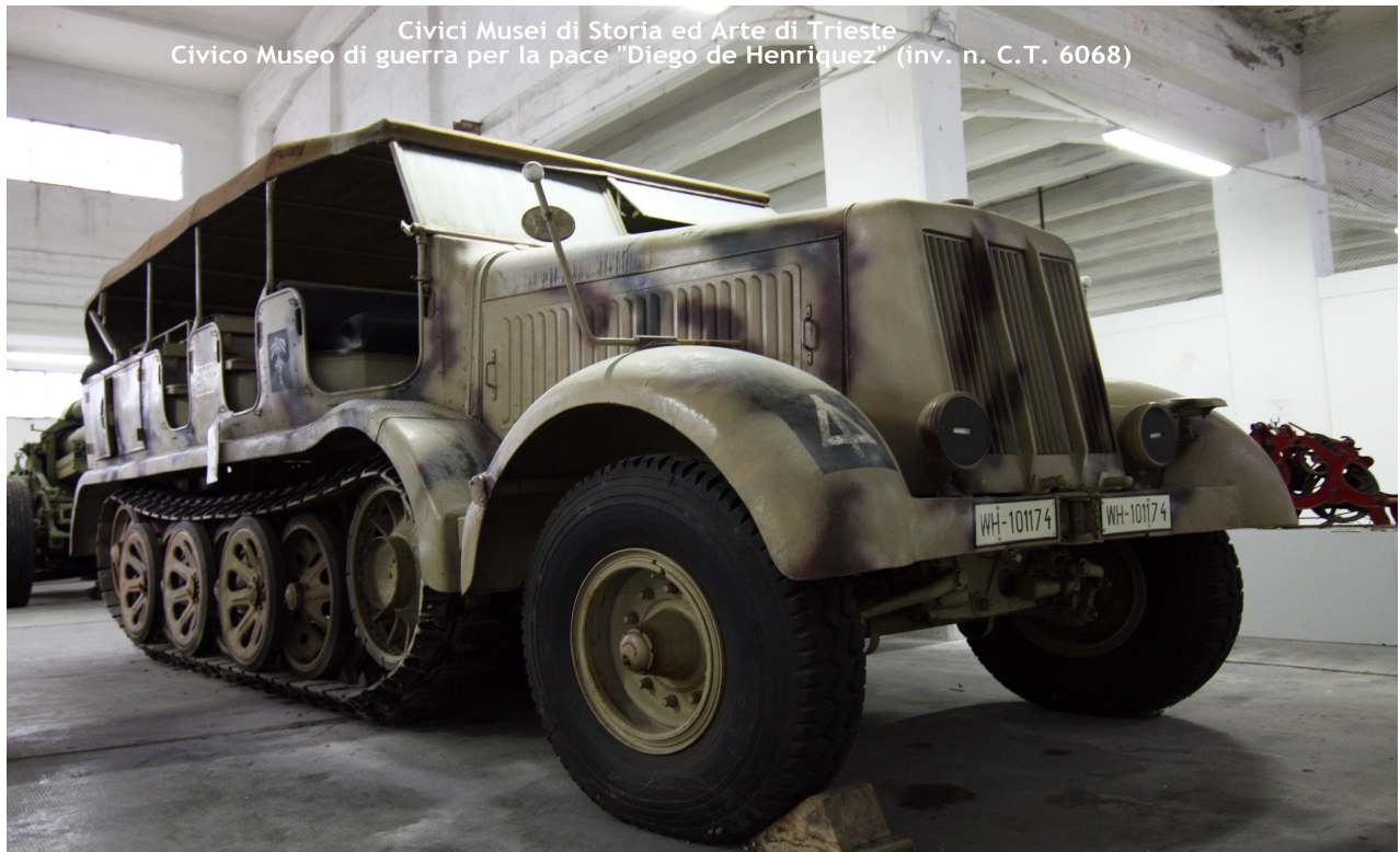
Massimo Foti, November 2009