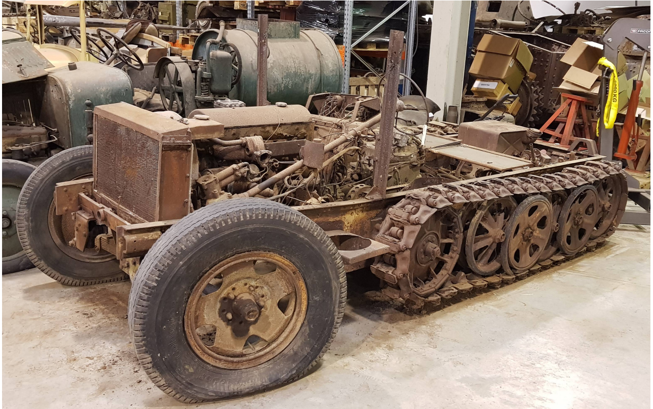
Pierre-Olivier Buan, December 2018