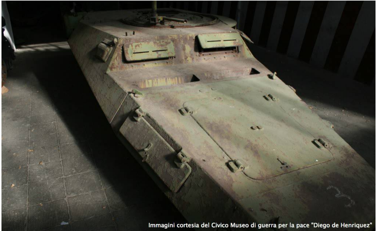
Immagini cortesia del Civico Museo di guerra per la pace "Diego de Henriquez" "Ambrescia", February 2008 - http://www.ambrescia.com/gite/2/trieste08/trieste.html