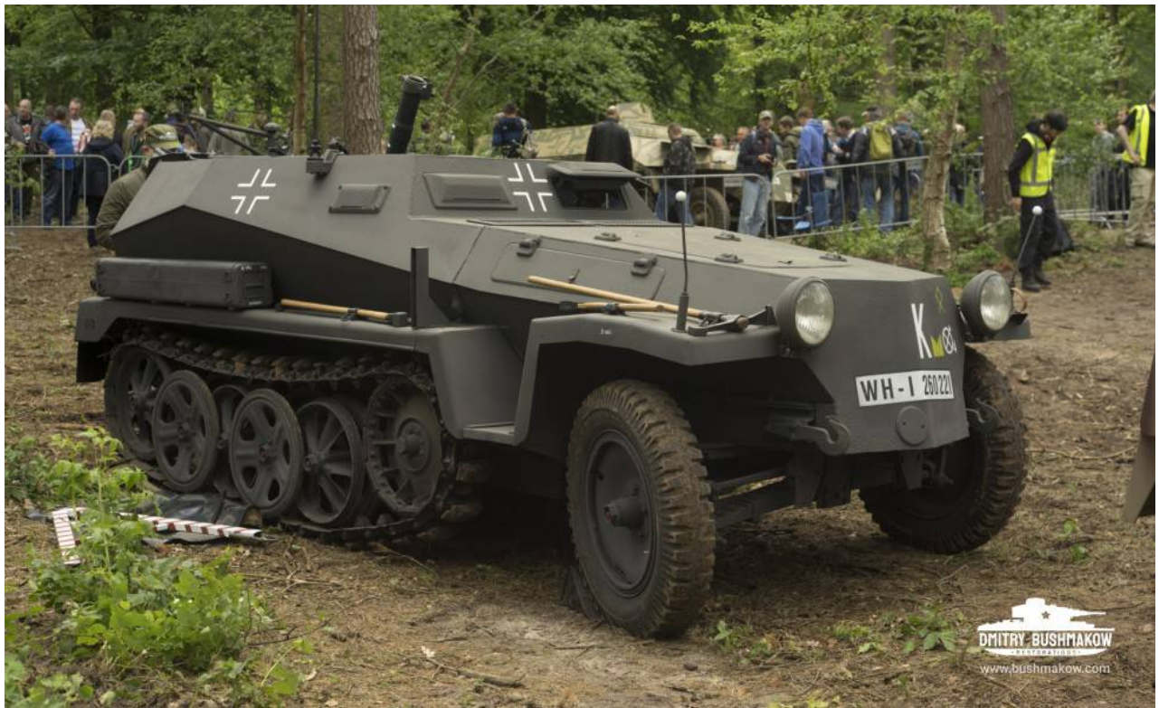
Dmitry Bushmakow - https://bushmakow.com/collection/sd-kfz-250-7-ausf-a-trupp-64-kradsch-btl-stalingrad/