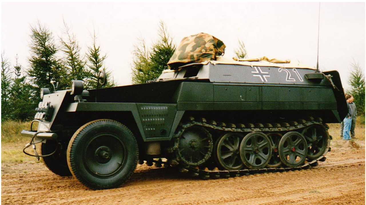
Rudi Ehninger, photo taken during the 80s

Ex-SS vehicle. More (but older) pictures can be seen here : http://digilander.libero.it/pmg/contributi/censimento/2-250_ts.htm