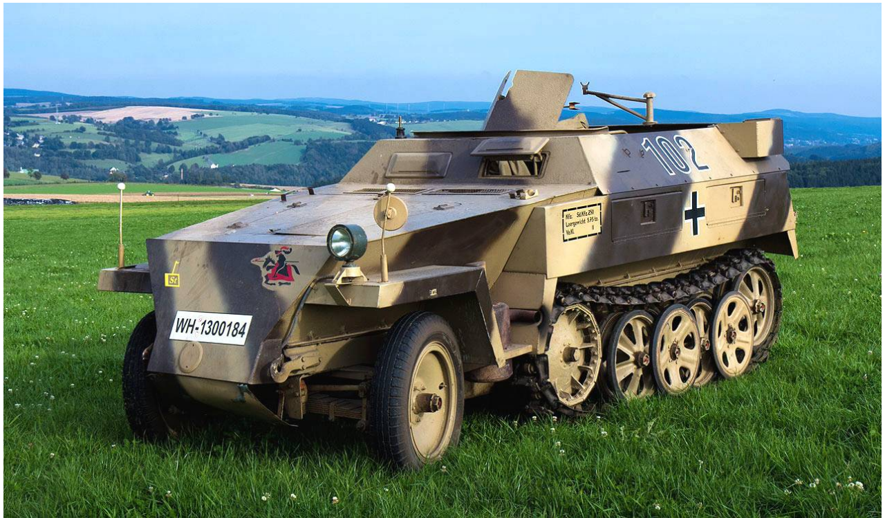
Dmitry Busmakow, October 2012