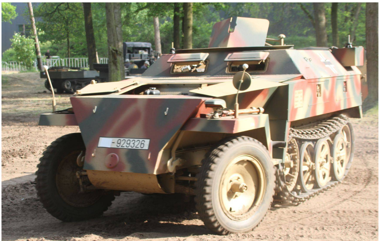
SdKfz. 250/3 Ausf. B – Australian Armour and Artillery Museum, Cairns, QLD (Australia) Restoration by Dmitry Bushmakow

https://www.flickr.com/photos/aussiefordadverts/30203019535