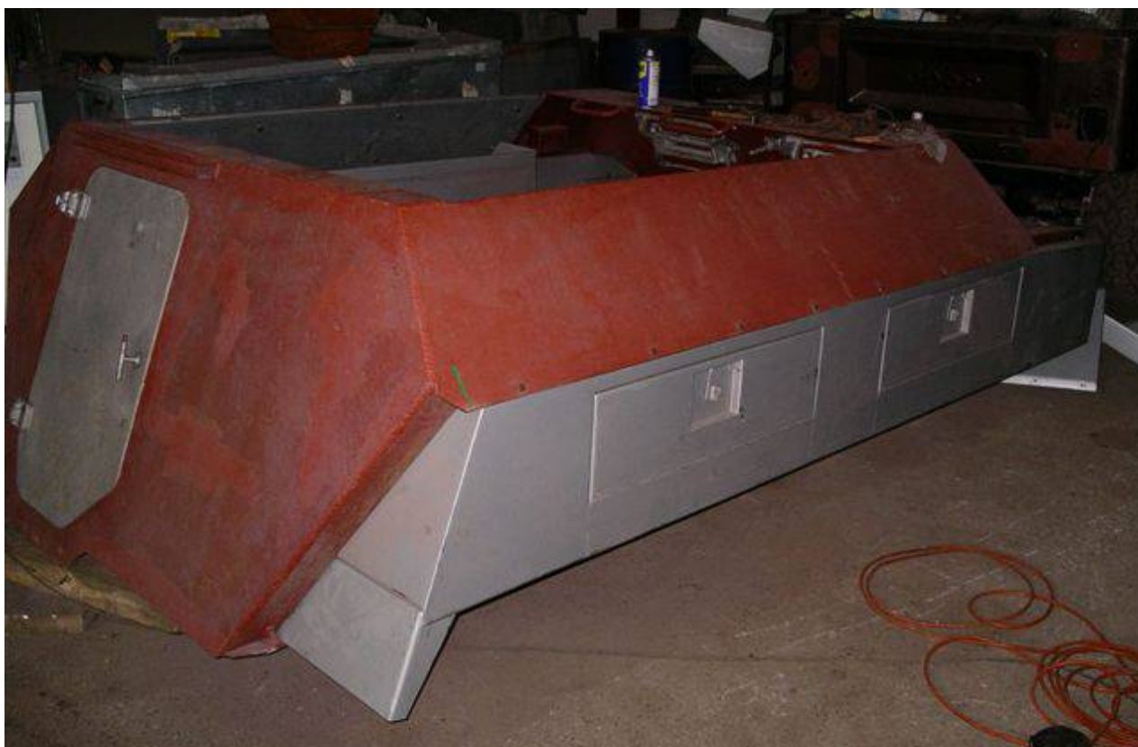
“szturm”, March 2009 - http://www.forfree.hc.pl/eksploracja/viewtopic.php?t=731&start=160&sid=4d89931dbc7edadc7cc3bccce4561ff9