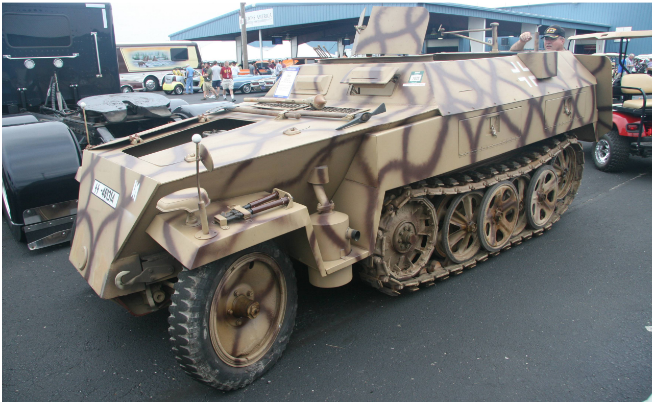
SdKfz. 250/? chassis – Private collection, Belgorod (Russia)