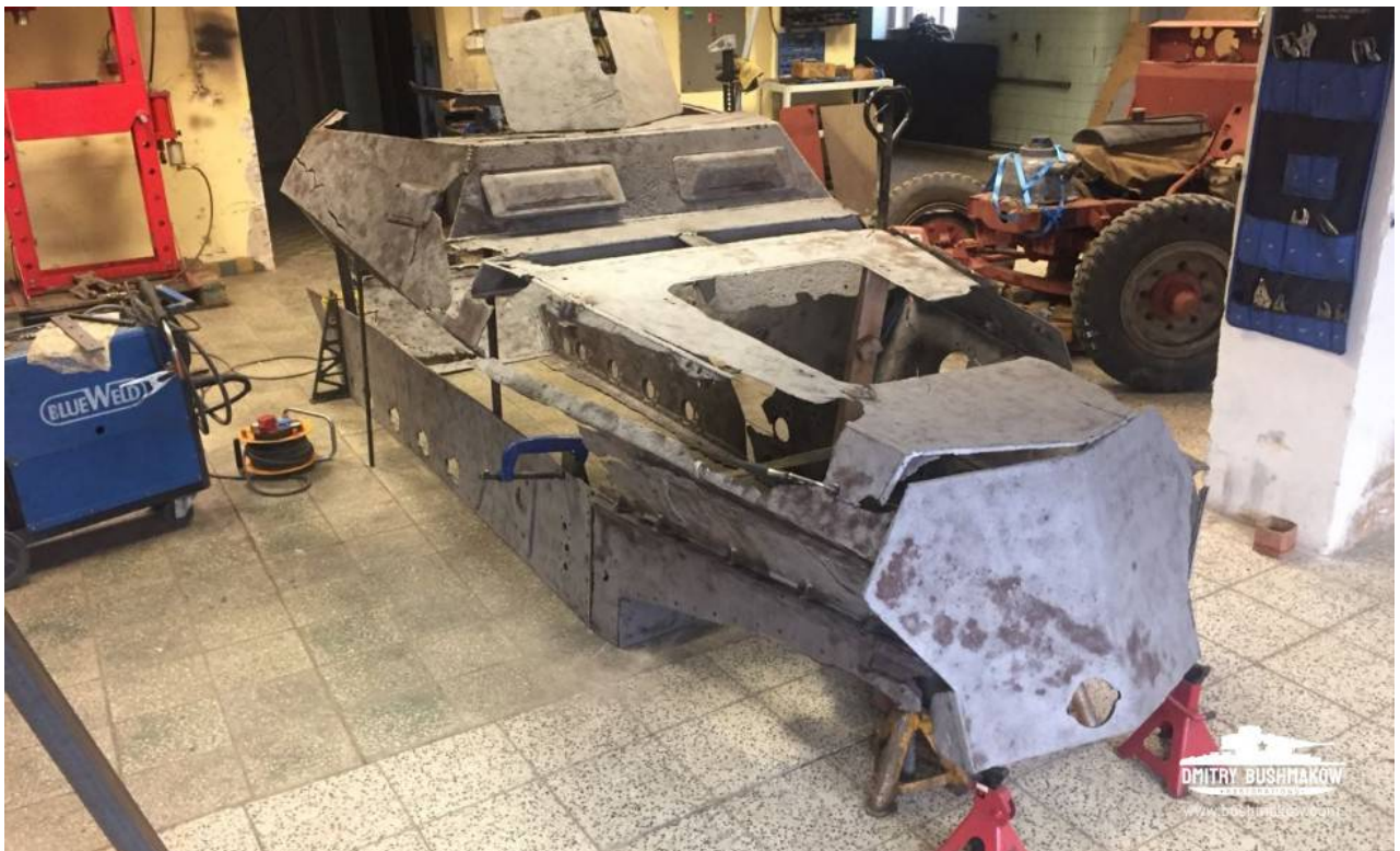
Dmitry Bushmakow - https://bushmakow.com/projects/current/sd-kfz-250-3-ausf-a-5-panzer-division-1945/