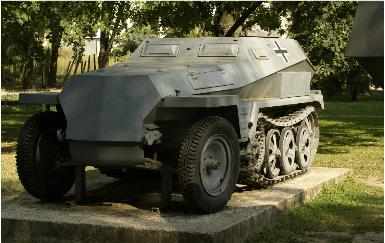
Rafał Białęcki, September 2008

The SdKfz 250s in Slovakia are all made of OT-810 frames with full repro bodies and everything, I've seen fotos from inside. No original parts are used (Dmitry Bushmakow)