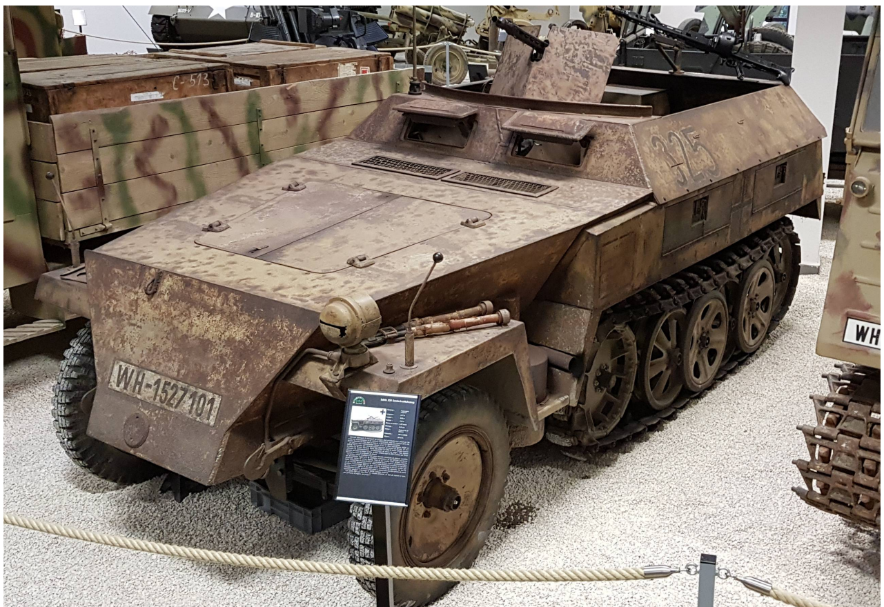
Pierre-Olivier Buan, December 2018