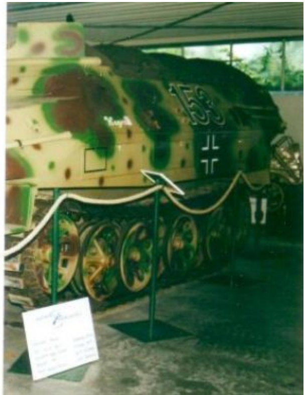
Dennes Aldrup, 2002 - http://www.panzer-modell.de/specials/ontour/autotechnica/autotechnica.htm