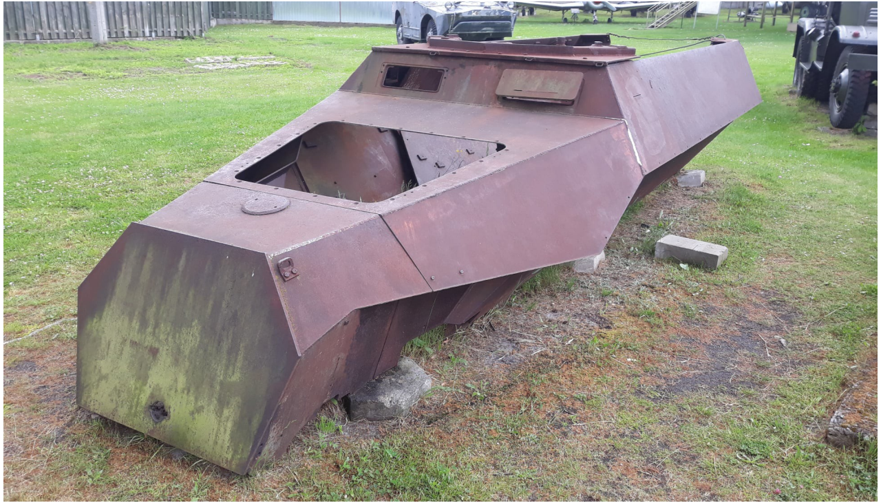
Rafał Białęcki, September 2008