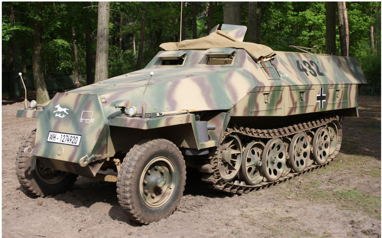
Walter Schwabe, May 2015