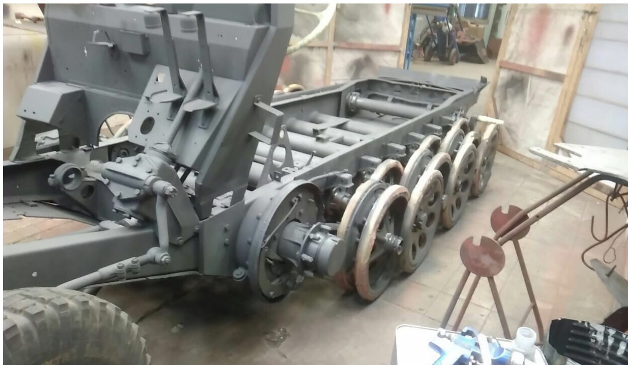
Dmitry Bushmakow, December 2017