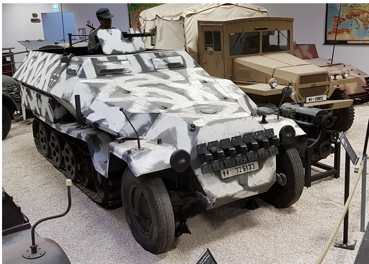
Pierre-Olivier Buan, December 2018