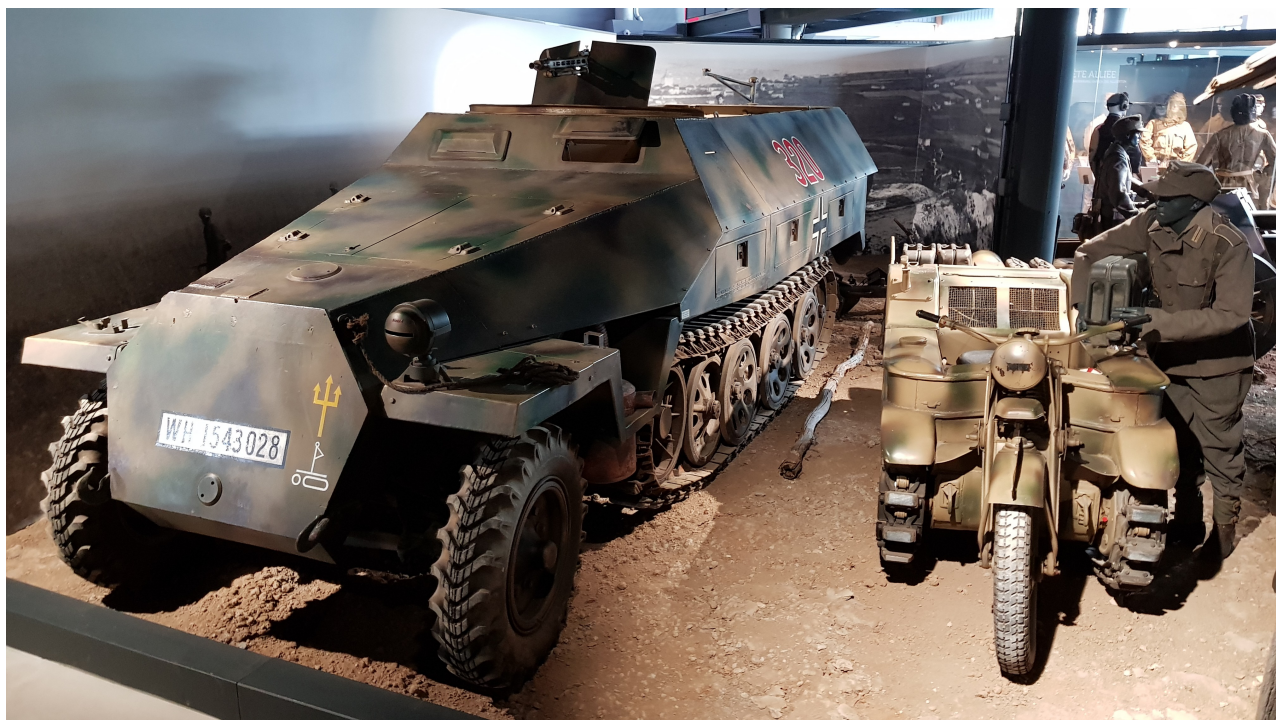
SdKfz. 251/1 Ausf. D – National Museum of Military History, Diekirch (Luxemburg)