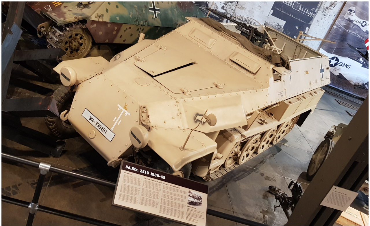
Pierre-Olivier Buan, September 2023