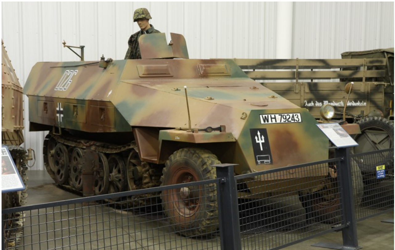
"vagabond", December 2009 - http://www.com-central.net/index.php?name=Forums&file=viewtopic&t=11943