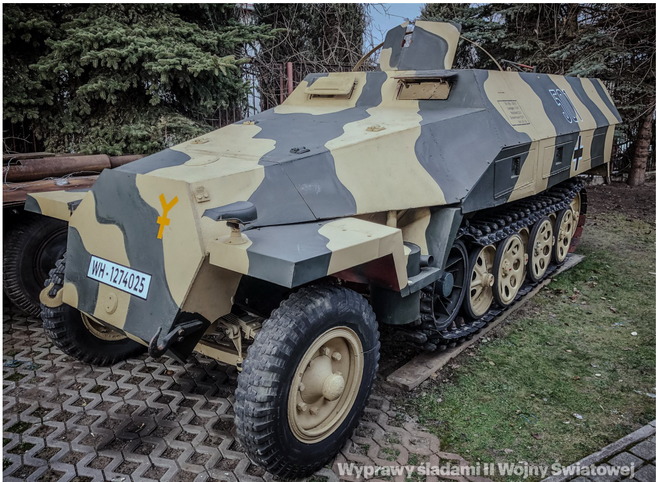
SdKfz. 251/1 Ausf. D – SdKfz Team Poland (Poland)

https://www.facebook.com/WyprawyŚladami2WojnyŚwiatowej/photos/pcb.1799307856871944/1799299060206157