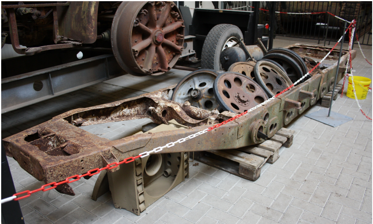
Walter Schwabe, May 2015

Chassis number 540300, built by Auto-Union in 1943. This chassis was previously at the Wings of Liberation museum in Best (Netherlands)