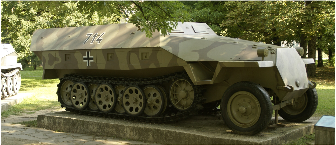
Rafał Białecki, September 2008