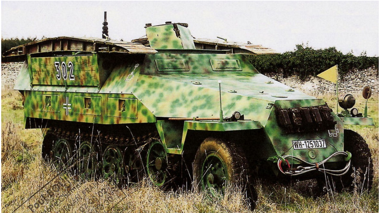
Véhicules Militaires Magazine, Mai 2005