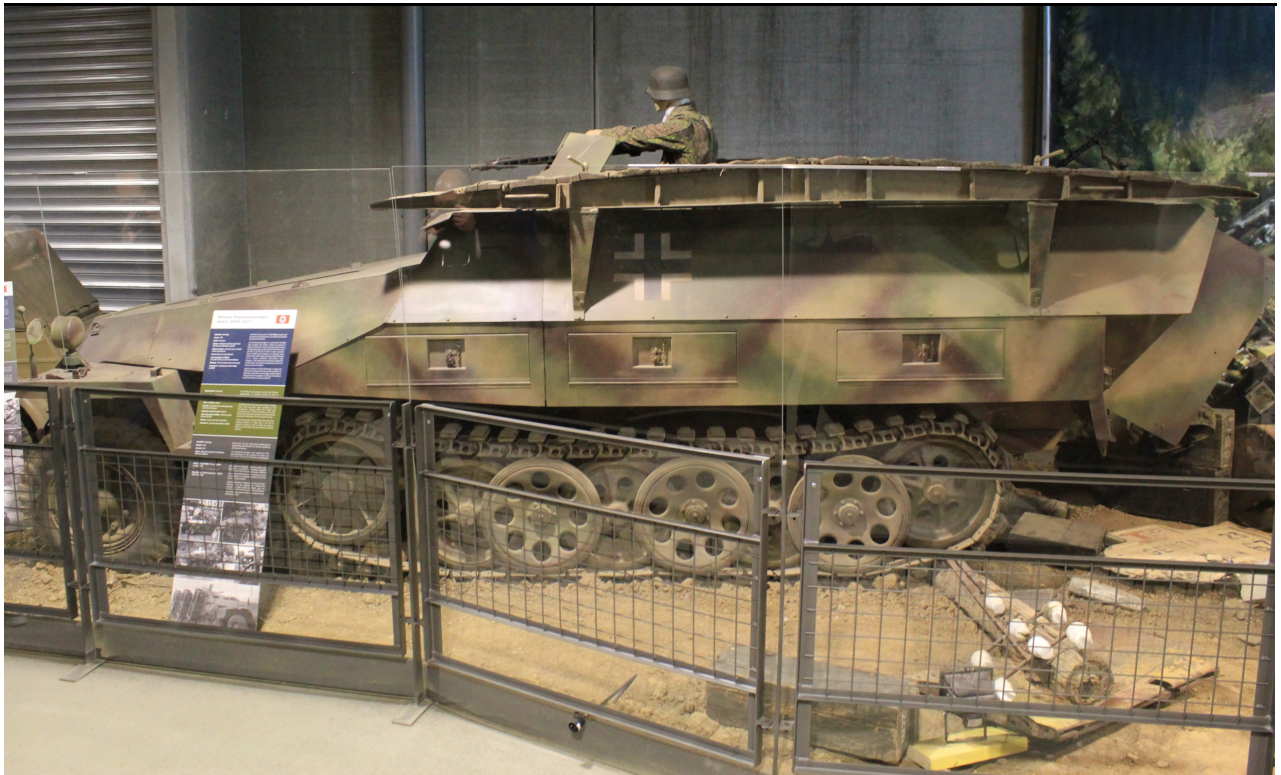
Didier Bouvy, June 2014

This Half-Track was used in some movies, like "Effroyables jardins" (José Figueres)