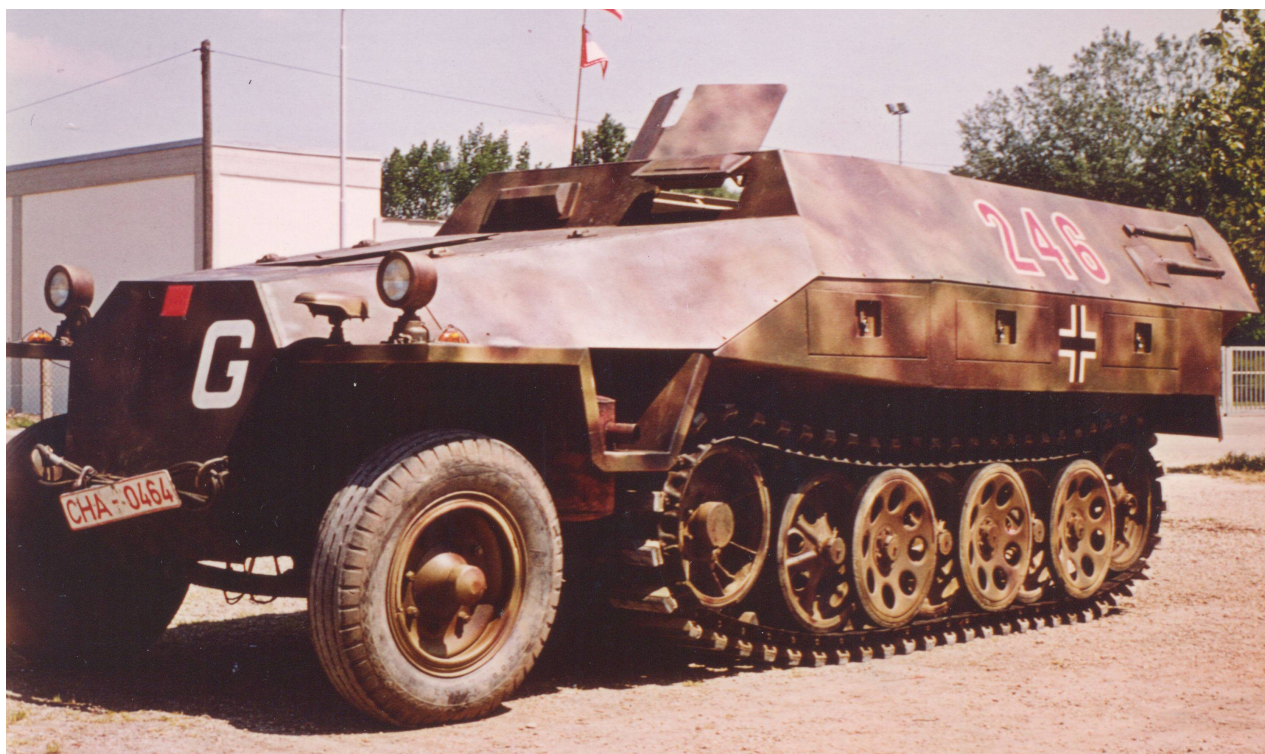
SdKfz. 251/1 Ausf. D – Militärhistorisches Museum, Dresden (Germany) – running c.

"270862", July 2015 - https://www.flickr.com/photos/131561895@N06/20524800411/in/album-72157656907522941/