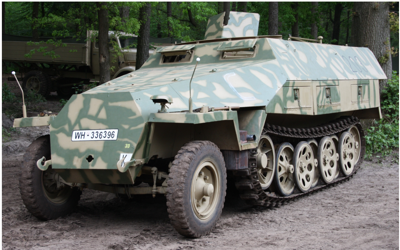
Walter Schwabe, May 2015