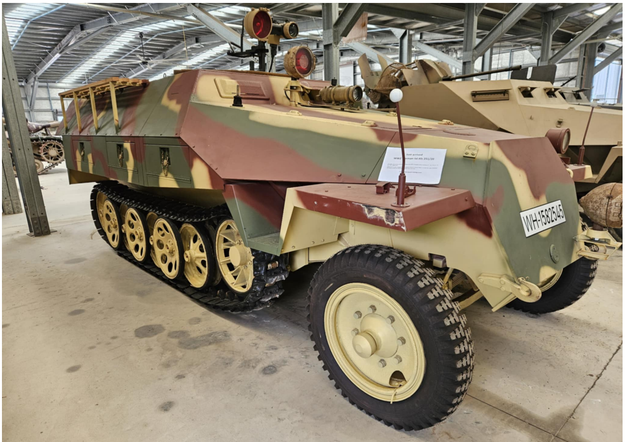
Graham Newbury, January 2025

Formerly displayed in the museum in Bras, near Bastogne. This vehicle was previously stored at the depot of the Tank Museum in Kapellen, Belgium. The chassis has been discovered in France (Stefan De Meyer). The museum restored it as a SdKfz 251/10, the complete 37mm gun is still attached to the upper armour. All the original body parts, including the soft metal parts of the stowage bins are present. The drivers cab was hit at some point and is partly cracked. The chassis was once mated with a mockup body (style SdKfz 7) and was used as a movie prop, that's why the steering wheel was altered (Rudi Schoeters)