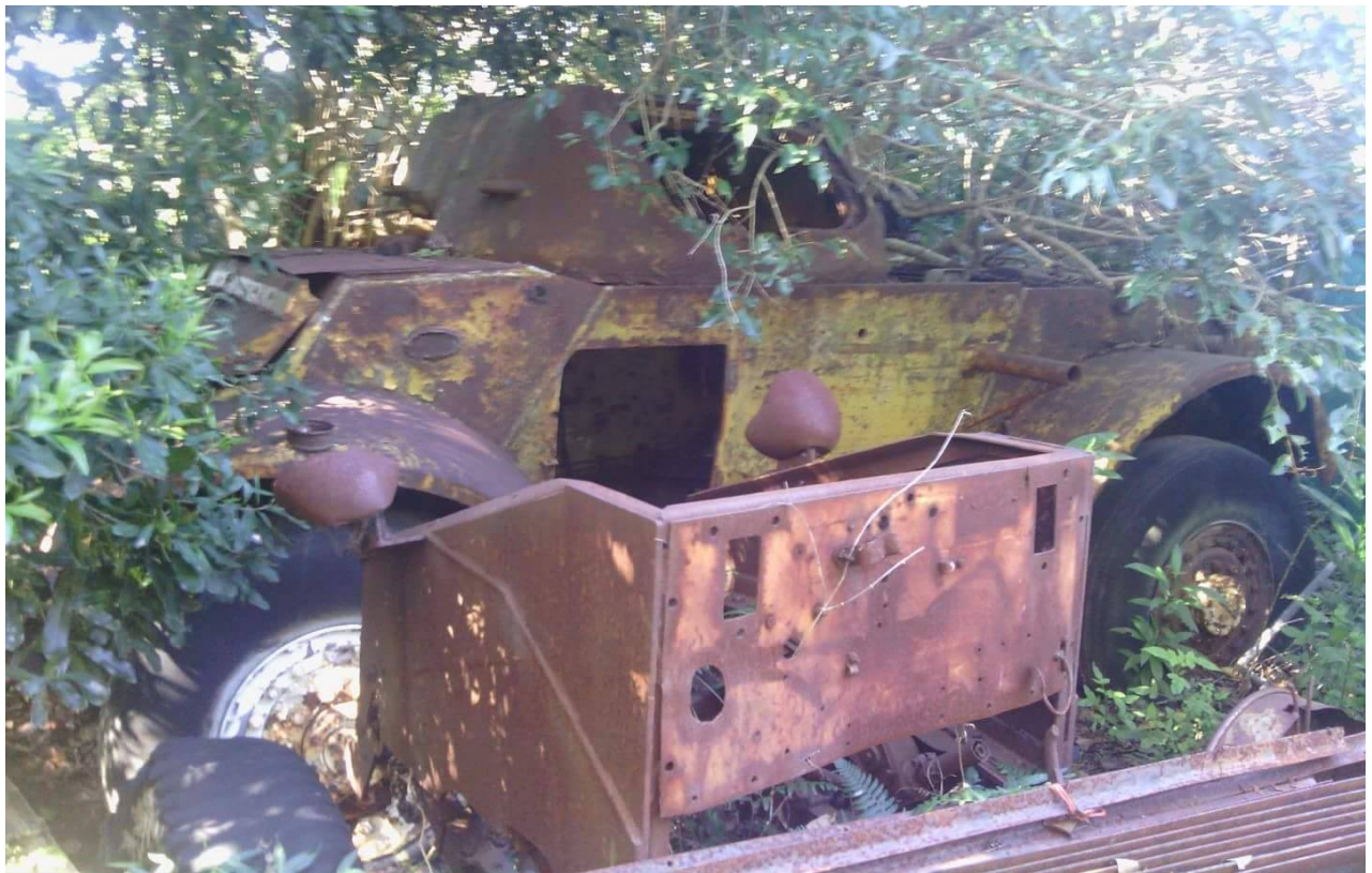
T17E1 Staghound – Unknown exact location (Australia)

https://www.facebook.com/downunderrust/photos/a.198643513952071.1073741828.198634573952965/274873472995741/