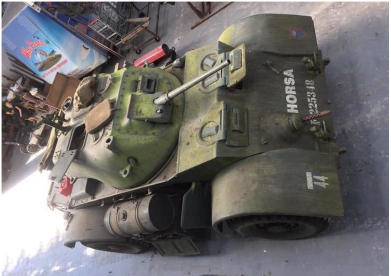
T17E1 Staghound