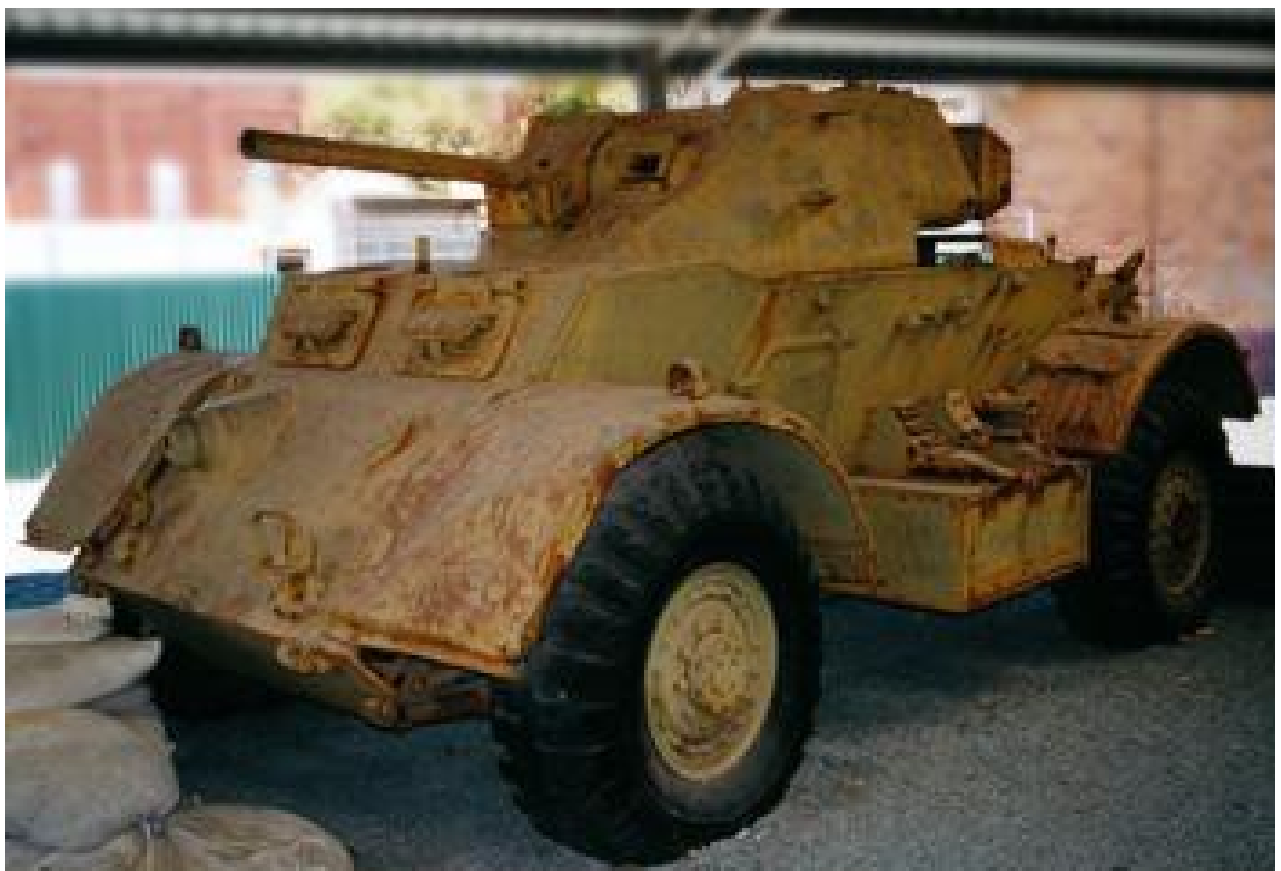
T17E1 Staghound – Army Museum of Western Australia, Fremantle, WA (Australia)

http://www.nullarbornet.com.au/towns/kalgoorlie.html