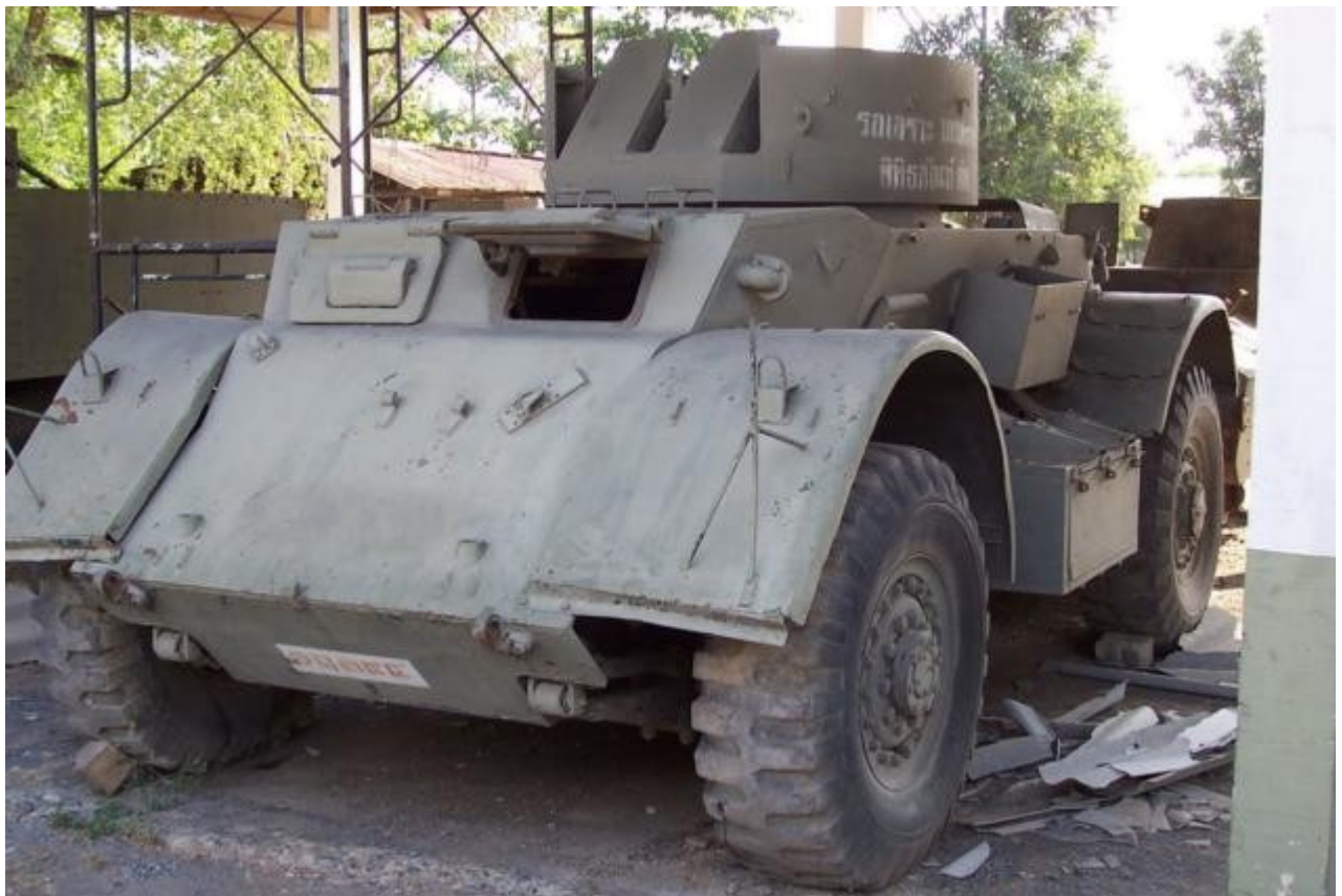
"sjashford", October 2003 - http://s204.photobucket.com/albums/bb210/sjashford/Thailand/?action=view&current=100_0250.jpg