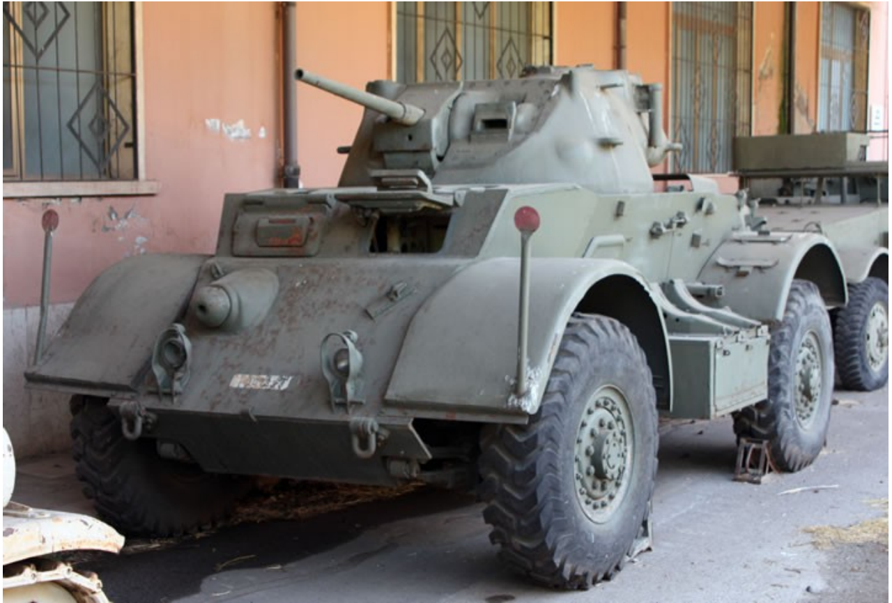
Massimo Foti, July 2009

T17E1 Staghound – Museo della Motorizzazione Militare della Cecchignola, Rome (Italy)