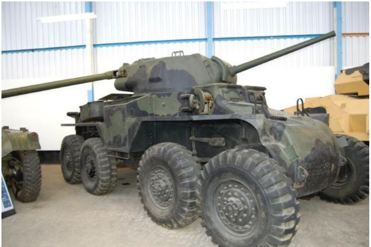
Dennis Trowbridge - http://www.warwheels.net/T18E2BoarhoundArmoredCarTROWBRIDGE.html