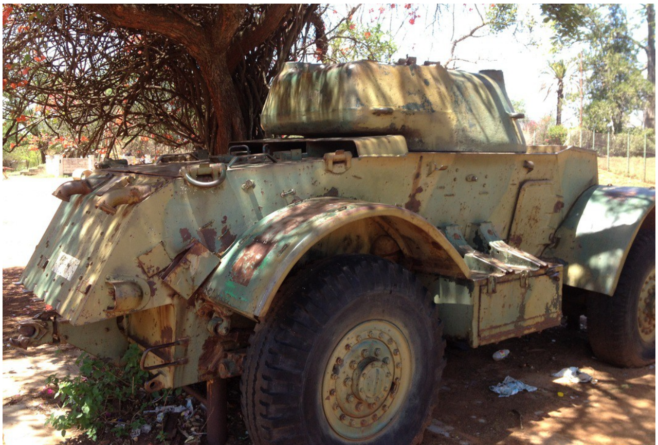
T17E1 Staghound – Gweru Military Museum (Zimbabwe)

http://musicwithoutborders.weebly.com/blog/the-road-west-part-i-bulawayo