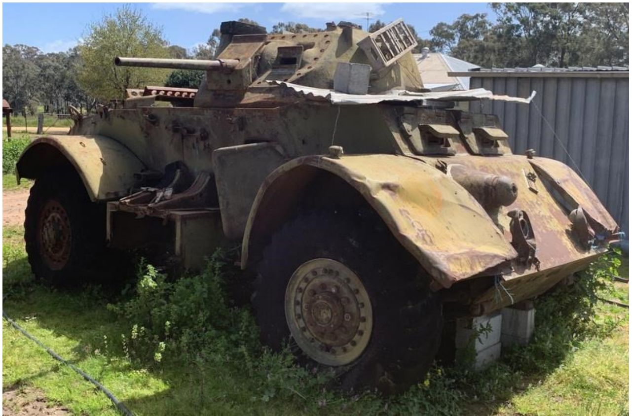
T17E1 Staghound – Gate guardian, Army Unit, somewhere in VIC (Australia)

https://www.lloydsonline.com.au/LotDetails.aspx?smode=0&aid=29131&lid=3330165&pgn=1&pgs=15