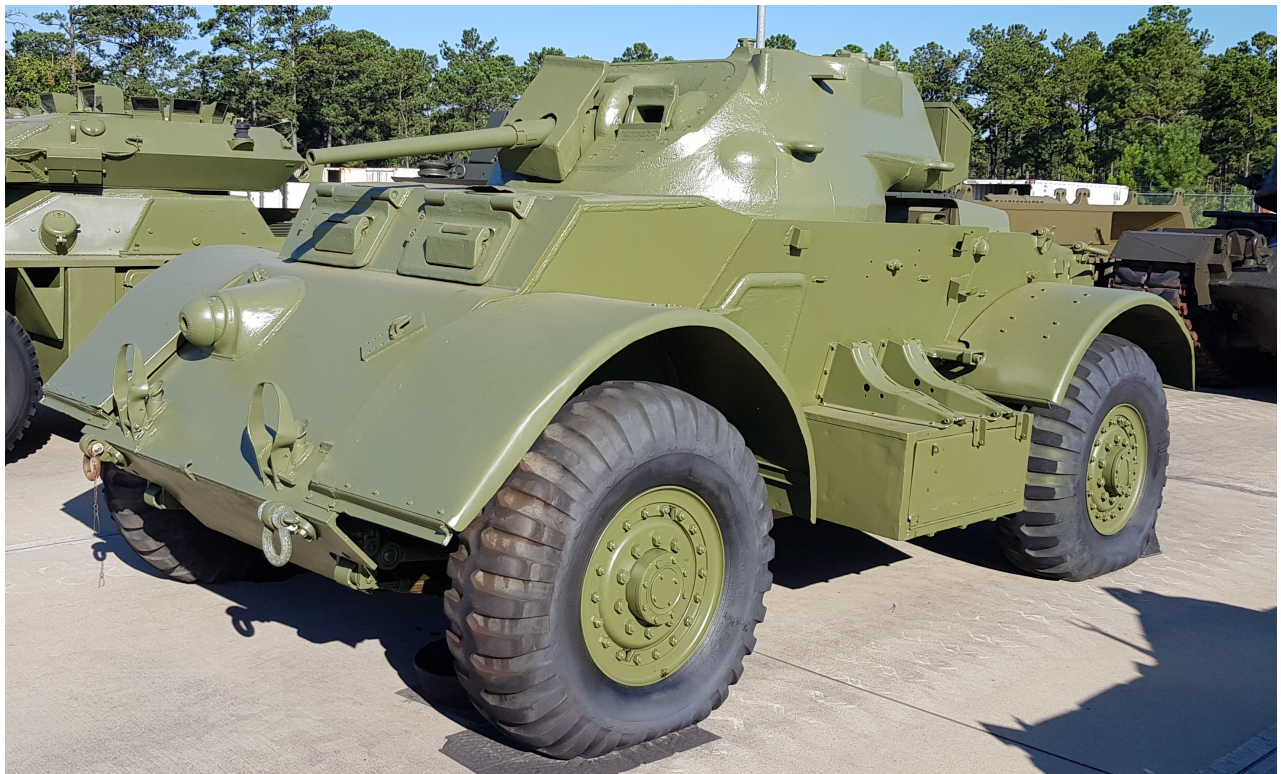
David Hobbs, September 2018