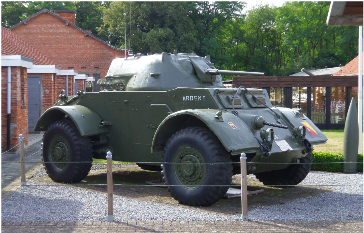
Pierre-Olivier Buan, September 2013