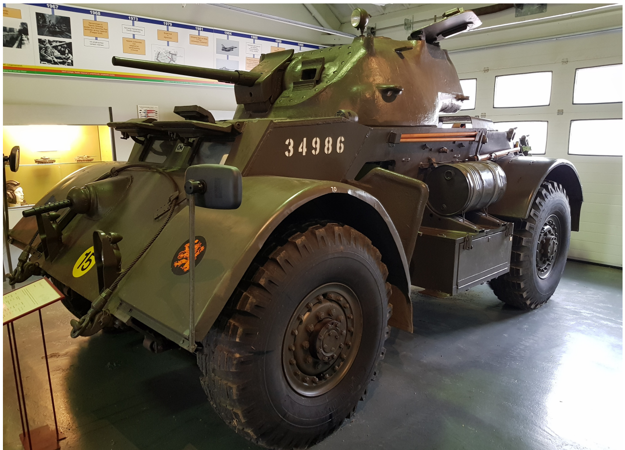
Pierre-Olivier Buan, October 2022

T17E1 Staghound – National War and Resistance Museum, Overloon (Netherlands)