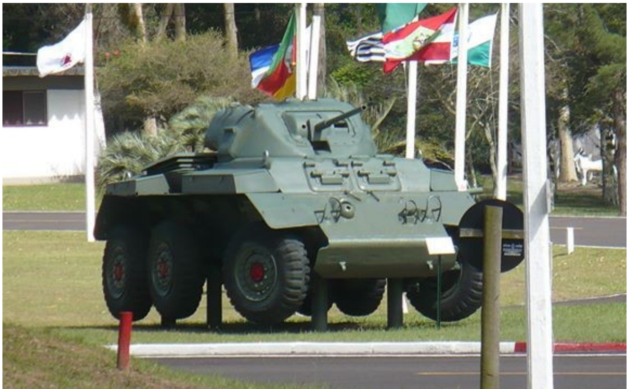
T17 Deerhound – Museu do Exército do Comando Militar do Sul, Porto Alegre (Brazil)

https://www.armedconflicts.com/T17-Deerhound-obrneny-automobil-t145872