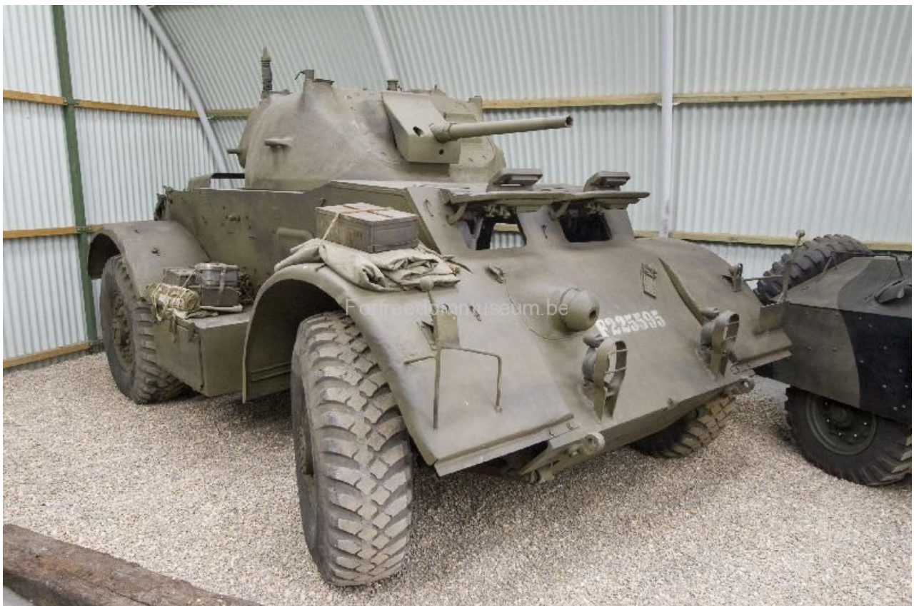
T17E1 Staghound – Reparto Storico Polizia di Stato, Autocentro di Torino, Torino (Italy)

http://www.forfreedommuseum.be/wp-content/gallery/voertuigen/mg_1037.jpg