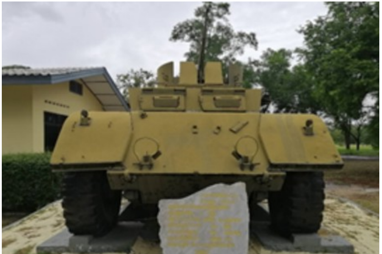
T17E2 Staghound AA – Artillery Museum, Mueang District, Lopburi Province (Thailand)

http://www.cavalrycenter.com/former-tanks/index.php?option=com_content&view=article&id=129:4&catid=102:2021-05-25-03-15-28