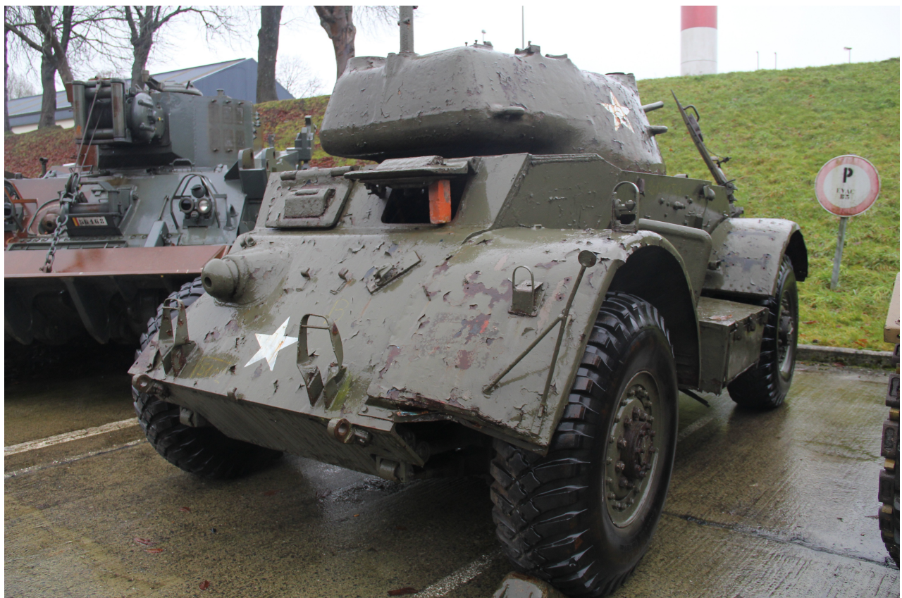
T17E1 Staghound "Audemer" – Heintz Barracks, Bastogne (Belgium)