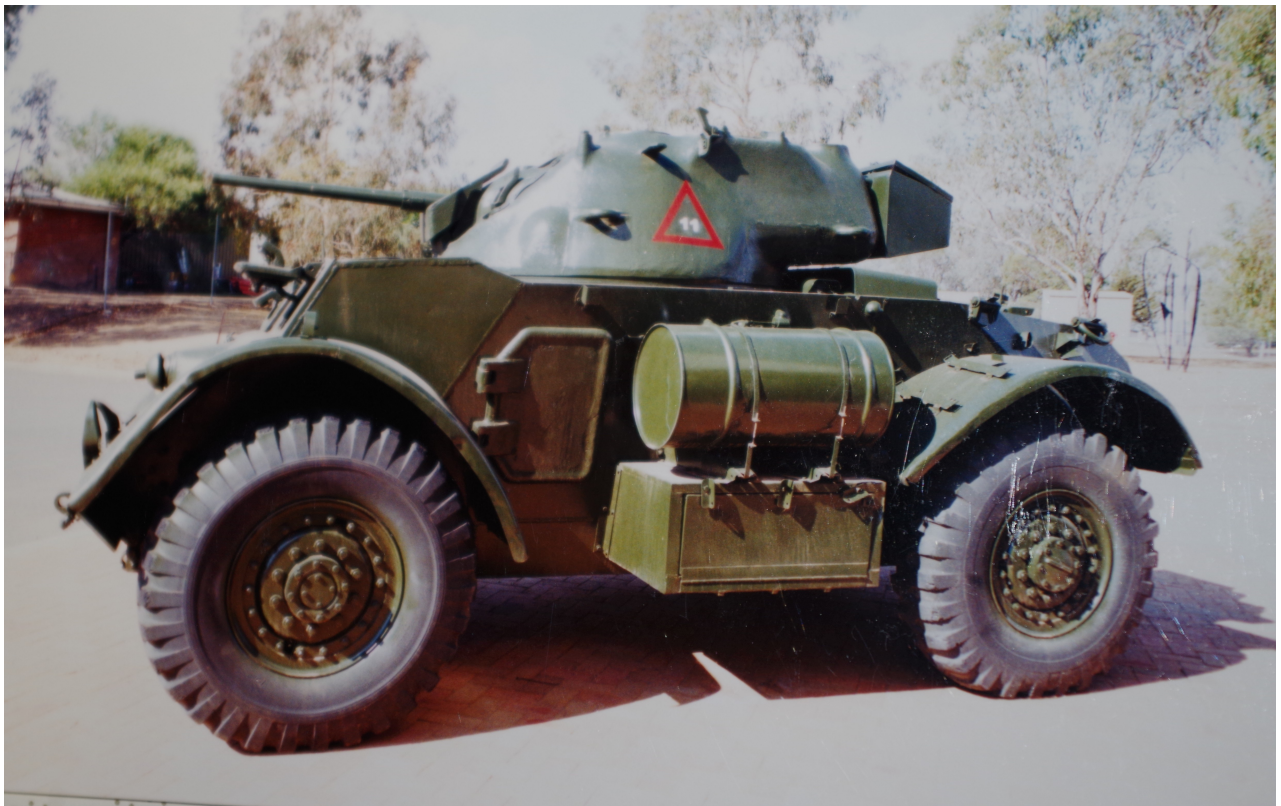
T17E1 Staghound – Bandiana Army Museum, VIC (Australia)

"yewenyi", April 2008 - http://www.flickr.com/photos/yewenyi/2574648471/