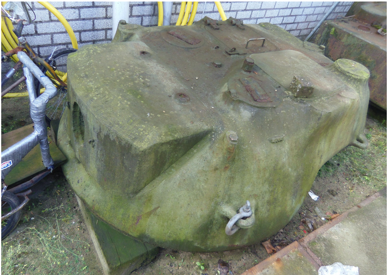
T17E1 turret – Bovington Tank Museum (UK)

Pierre-Olivier Buan, June 2014 - https://www.flickr.com/photos/13963542@N08/14386647257/in/set-72157645512102875