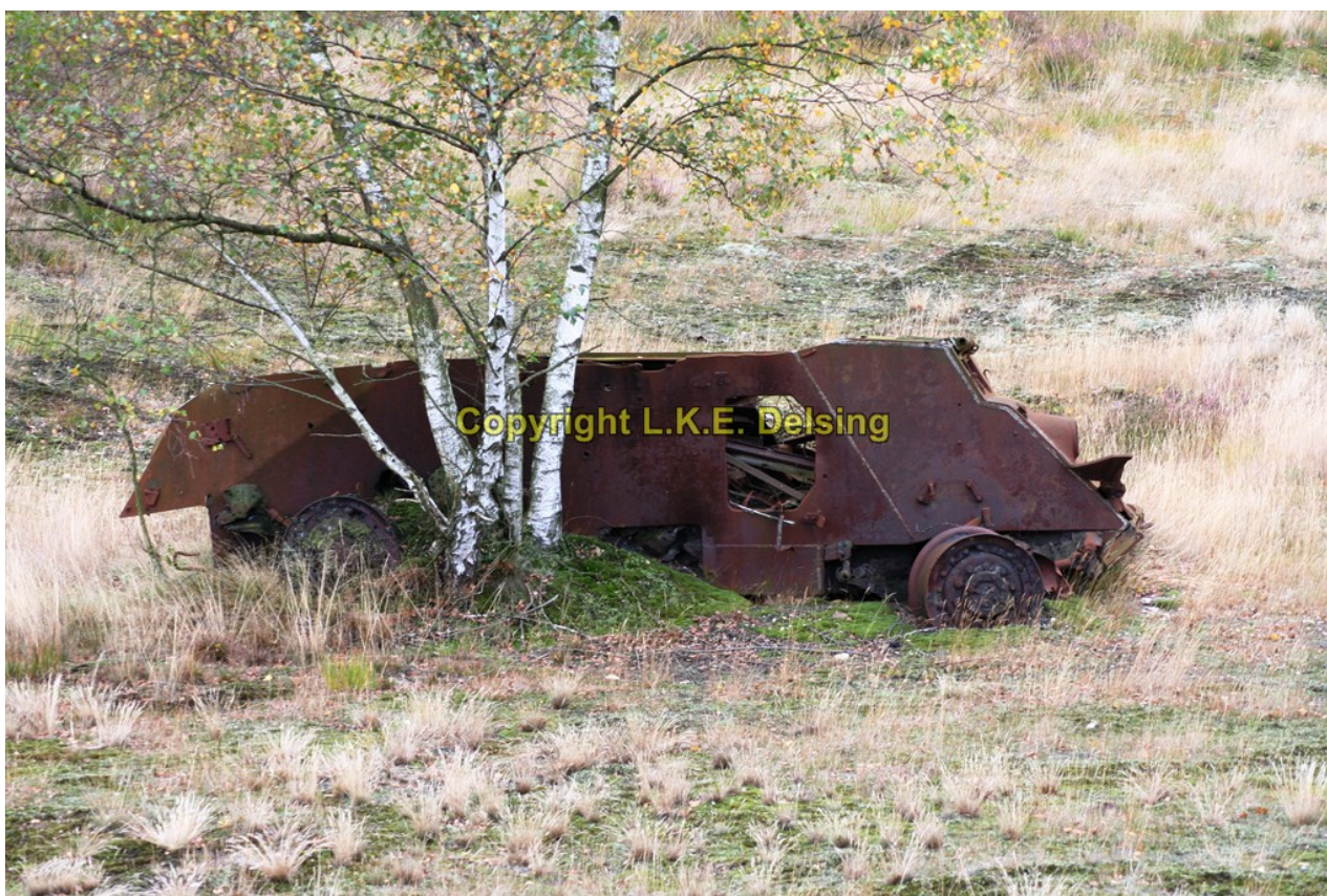
T17E1 Staghound pillbox – Ronse / Renaix (Belgium)