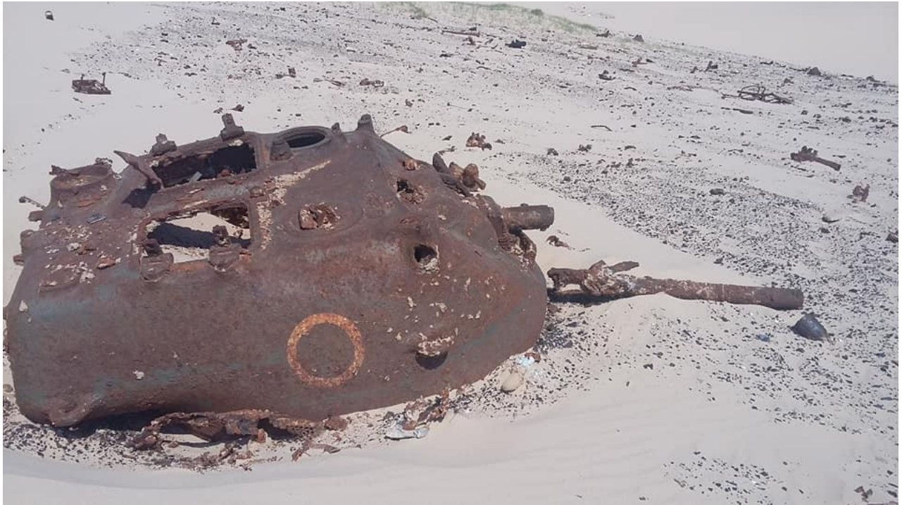
Laurence Penman, January 2020