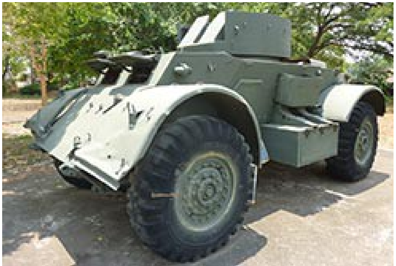
T17E2 Staghound AA – Infantry Museum, Thanarat Camp, Khao Noi Pran Buri Province (Thailand)

http://ki43.on.coocan.jp/oversea/huahin/huahin.html