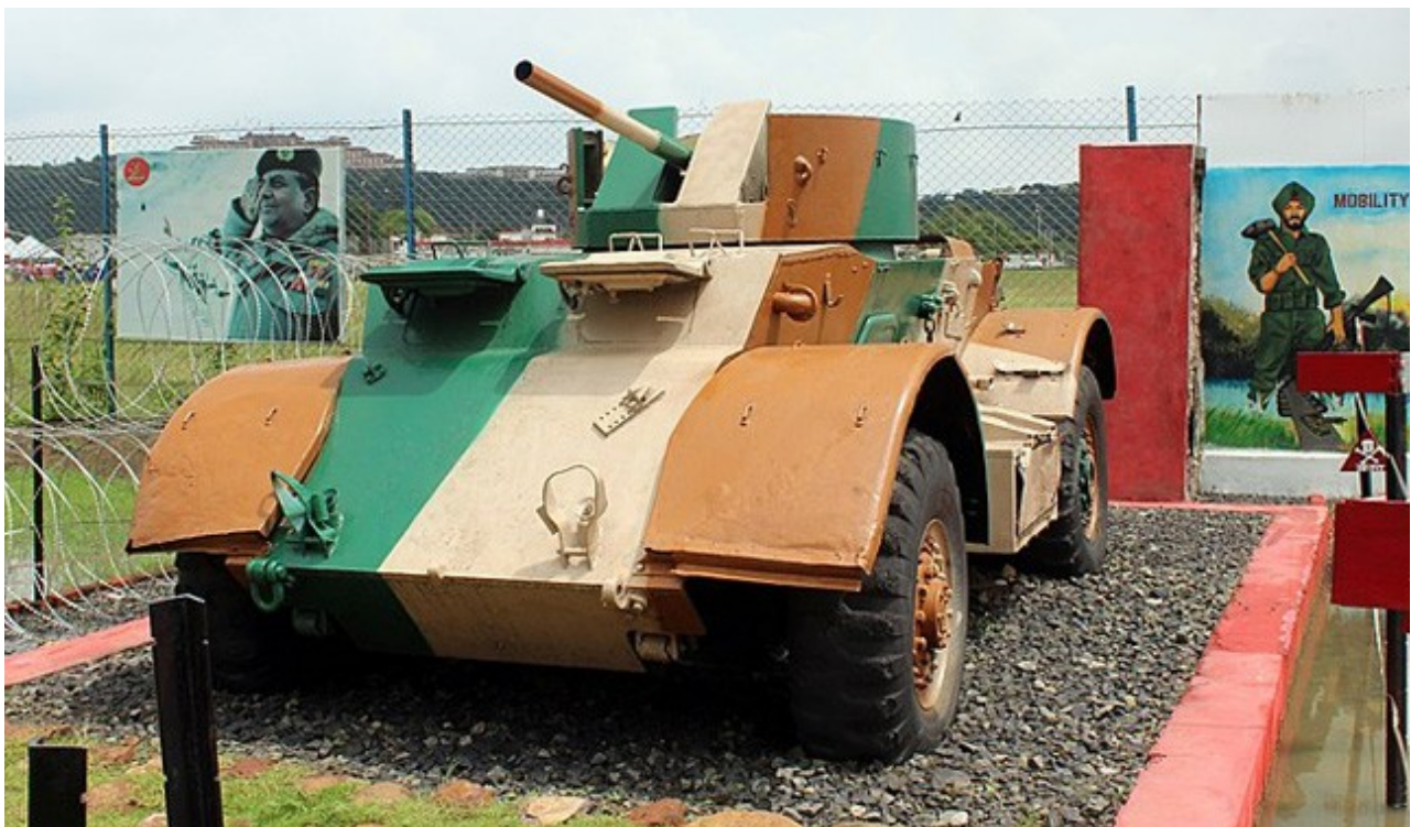
Three T17E2 Staghound AA – Pachaiyappa's College, Chennai (India)

https://commons.wikimedia.org/wiki/File:Yoddhasthal_Permanent_Exhibition_Southern_command_Indian_Army_Bhopal_(60).jpg