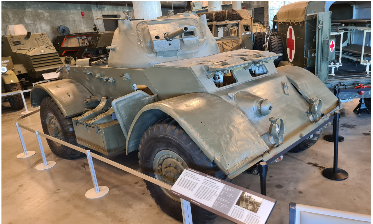
Pierre-Olivier Buan, September 2024

This is a range target that comes from Australia