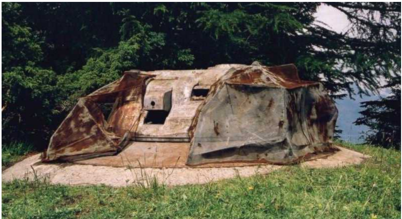
T17E1 turret – Brigade Piron memorial, Antwerpsesteenweg, Leopoldsborg (Belgium)

http://www.festung-oberland.ch/Waffen/Prototypen/Prototypen.html