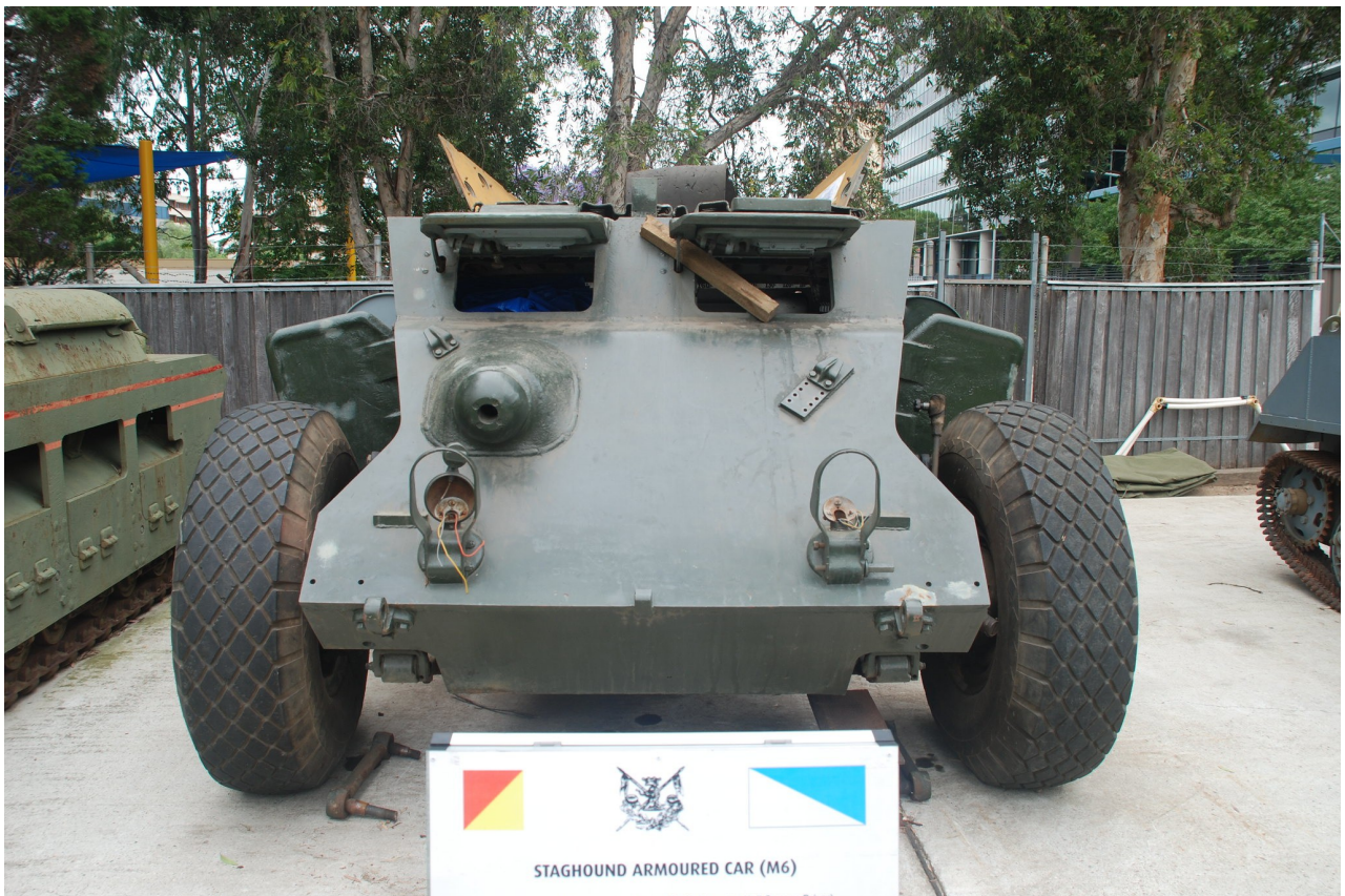
"TMA_0", November 2008 - http://www.flickr.com/photos/39568612@N08/3642705783/in/set-72157619895388361/