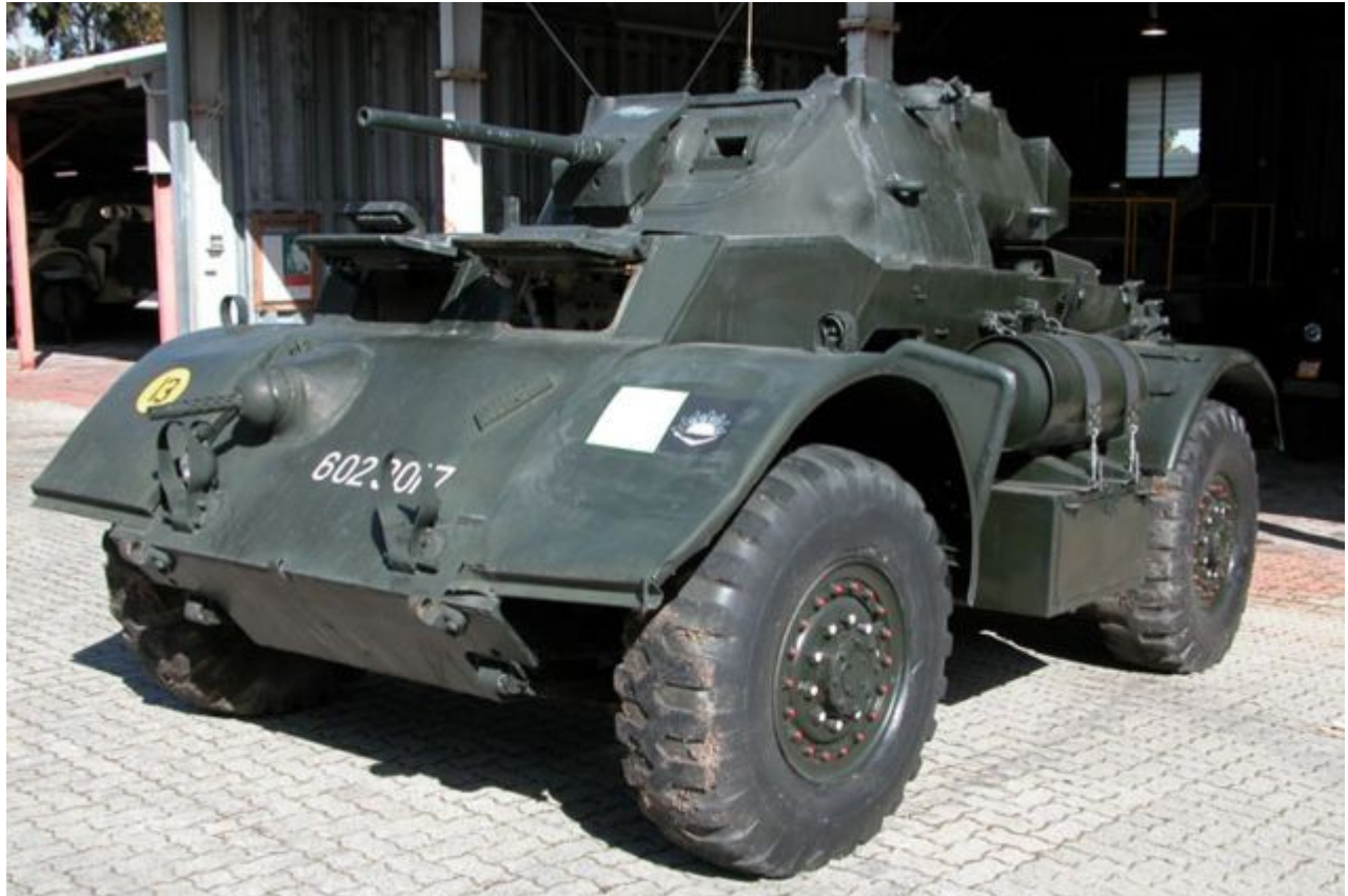
First T17E1 Staghound – Royal Australian Armoured Corps Tank Museum Puckapunyal, VIC (Australia)

http://anzacsteel.hobbyvista.com/Armoured%20Vehicles/staghoundph_1.htm