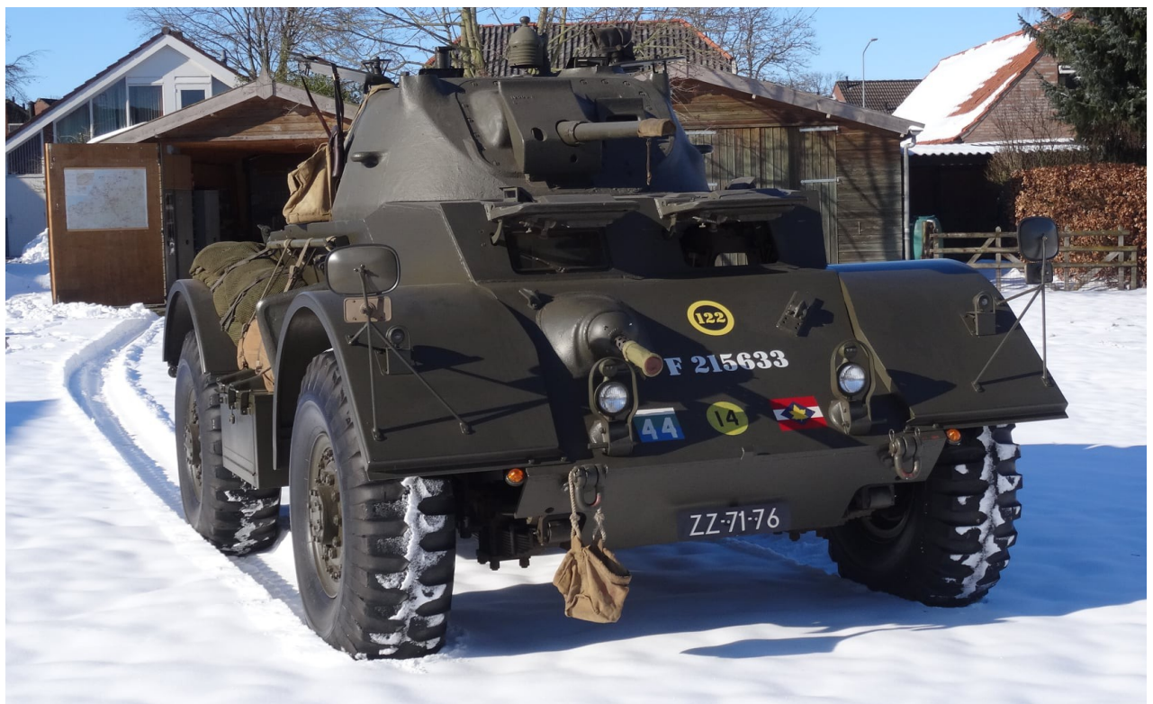
T17E1 Staghound – Legermuseum depot, Grave (part of the Legermuseum, Delft - Netherlands)

https://www.facebook.com/photo?fbid=2852043748407264&set=pcb.2852044295073876