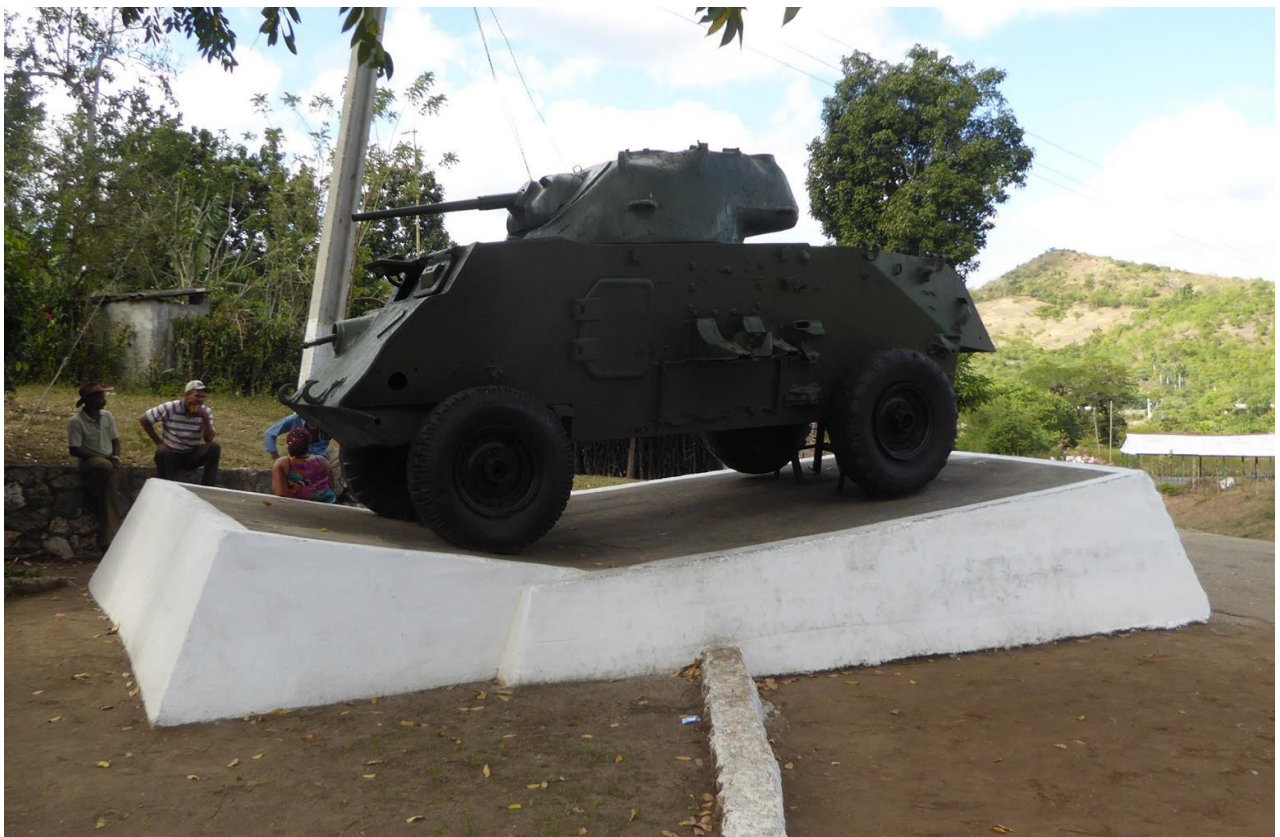
T17E1 Staghound – Havana University, Havana (Cuba)

https://www.facebook.com/photo.php?fbid=10211571494668811&set=gm.720743168075988&type=3&theater