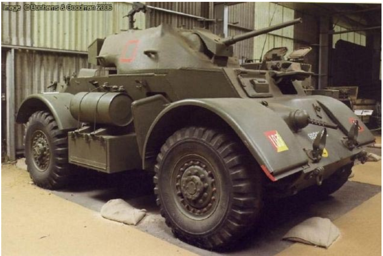
Bonhams & Goodman, 2006 - http://www.ammssydney.com/content/CntArtGen_PH_MTM_AFV.html

This vehicle is currently stored and is not publicly visible