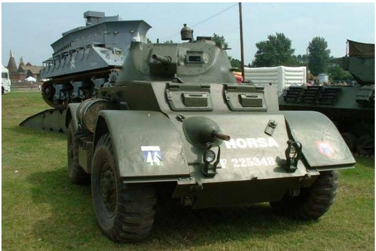
T17E1 Staghound – Bovington Tank Museum (UK)

Ian Sadler - http://www.warwheels.net/staghound1_Sadler.html