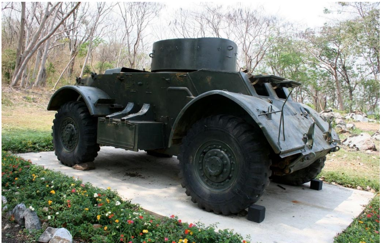
T17E2 Staghound AA – The Cavalry Centre, Fort Adison, Saraburi (Thailand)

"rudy.rijen Dav", March 2008 - https://plus.google.com/photos/110835723186713435585/albums/5456695858092323745?banner=pwa