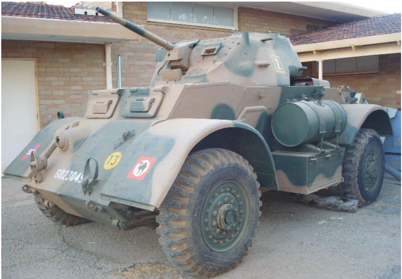
T17E1 Staghound – Goldfields War Museum, Boulder / Kalgoorie, WA (Australia)

http://www.nullarbornet.com.au/towns/kalgoorie.html