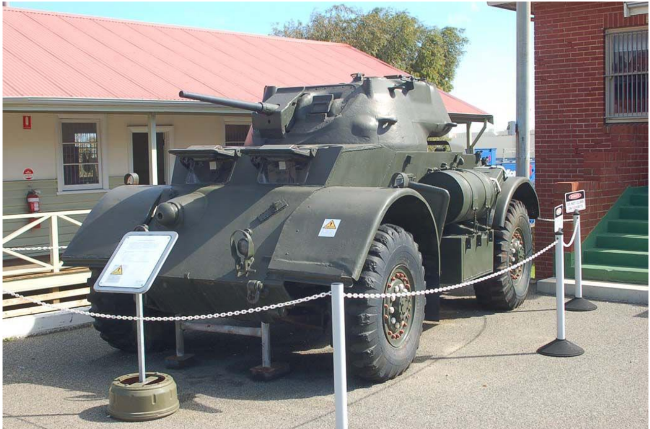
Second T17E1 Staghound – Royal Australian Armoured Corps Tank Museum Puckapunyal, VIC (Australia)

http://www.militarymodelling.com/news/article.asp?a=7094