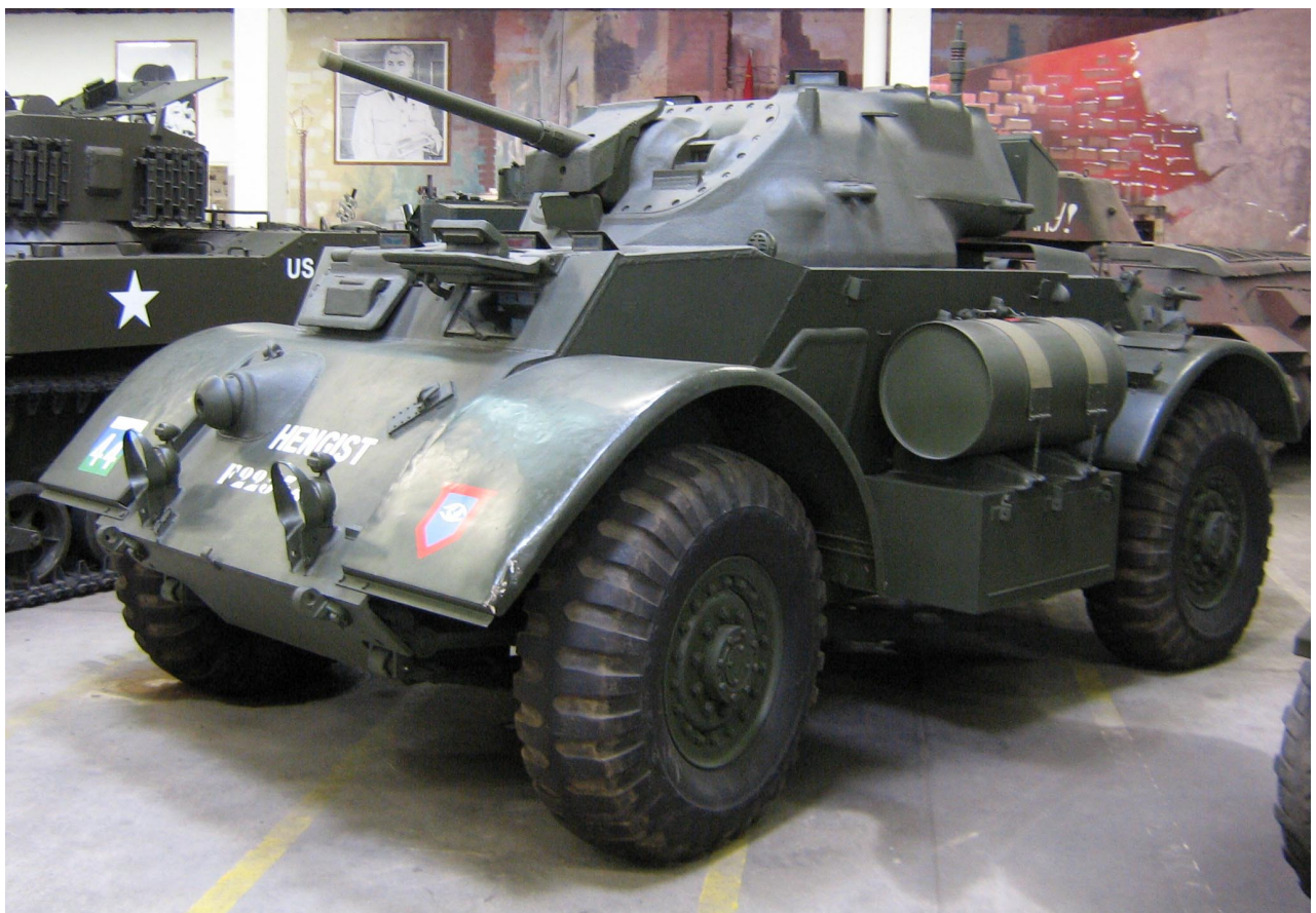
T17E1 Staghound – For Freedom Museum, Knokke-Heist (Belgium)

http://www.forfreedomuseum.be/wp-content/gallery/voertuigen/mg_1037.jpg