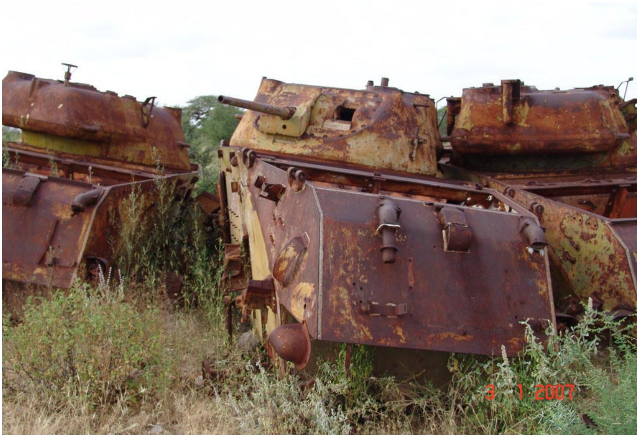
T17E1 Staghound wreck – Molotov Cocktail fire range, Leopoldsburg (Belgium)