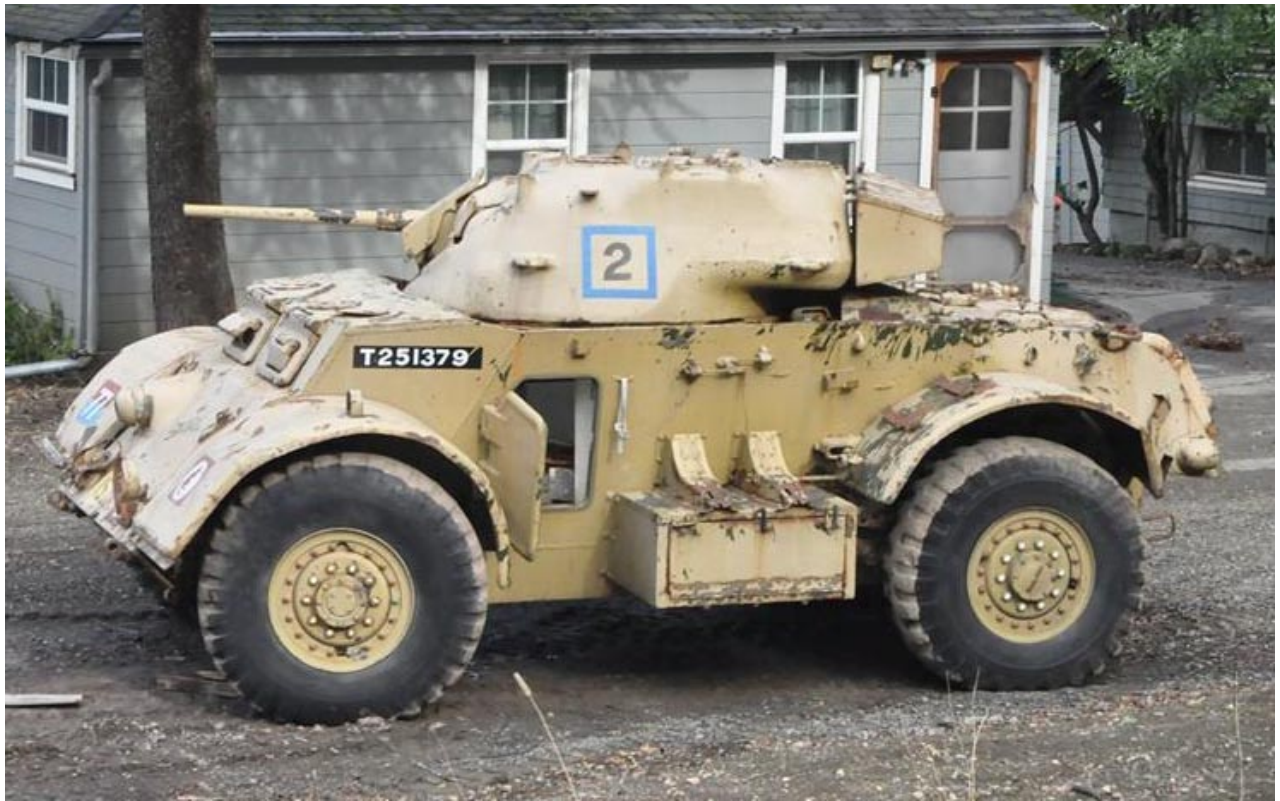
Chris Hughes, February 2014 - https://www.facebook.com/