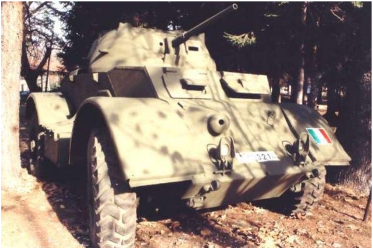
Filippo Cappellano - http://digilander.libero.it/pmq/contributi/censimento/15_m6_bel.htm