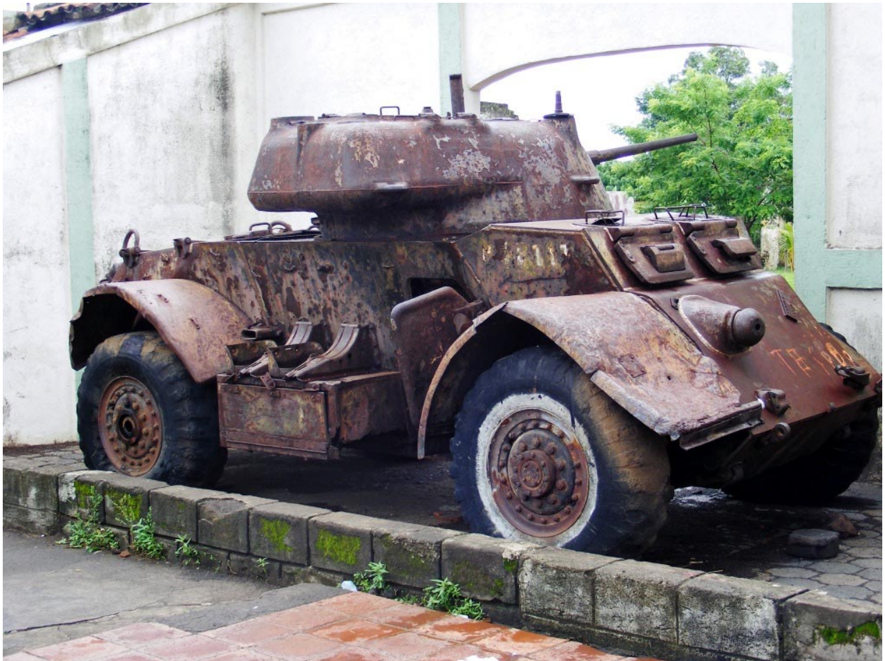
T17E1 Staghound – Havana University, Havana (Cuba)