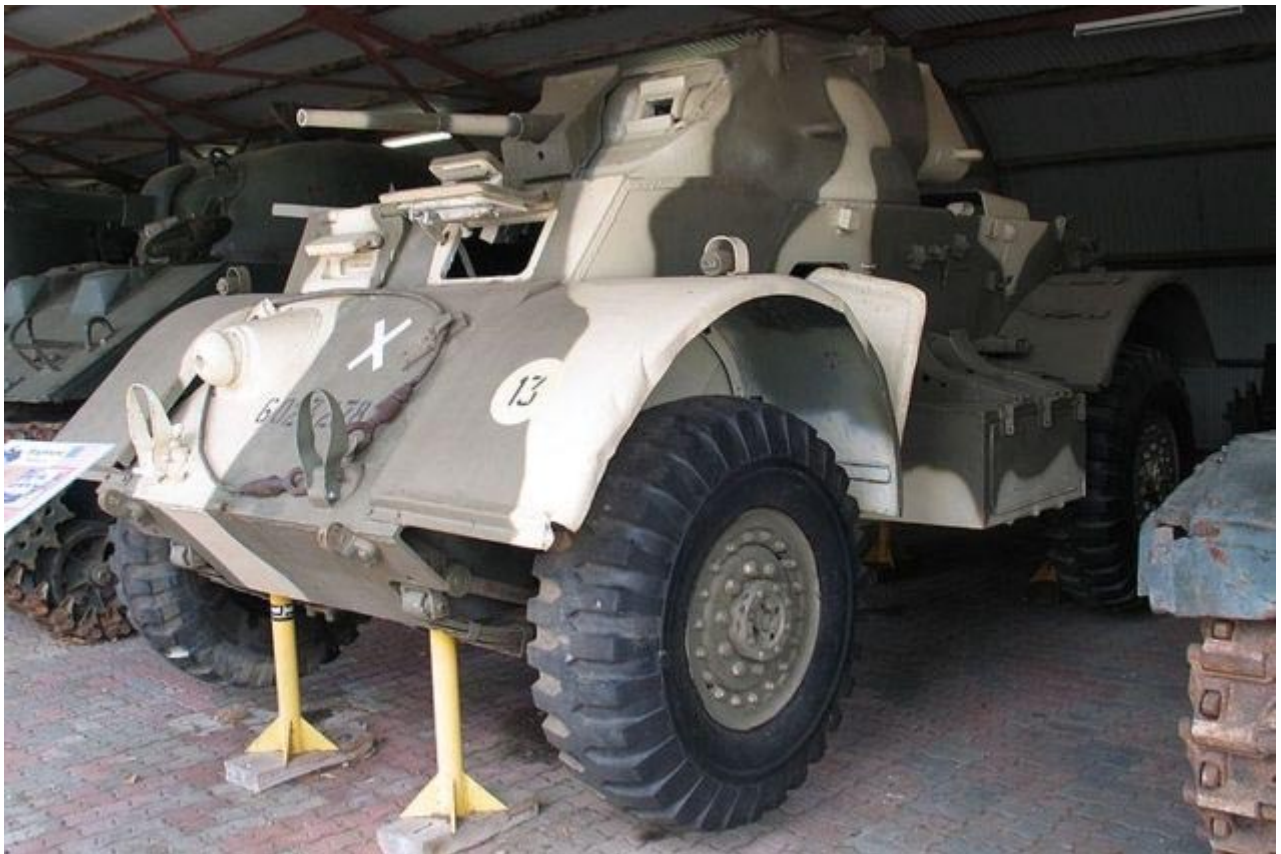
T17E1 Staghound – Gweru Military Museum (Zimbabwe)

"Bukvoed", January 2007 - http://commons.wikimedia.org/wiki/Image:Puckapunyal-T17E1-Staghound-1-2.jpg