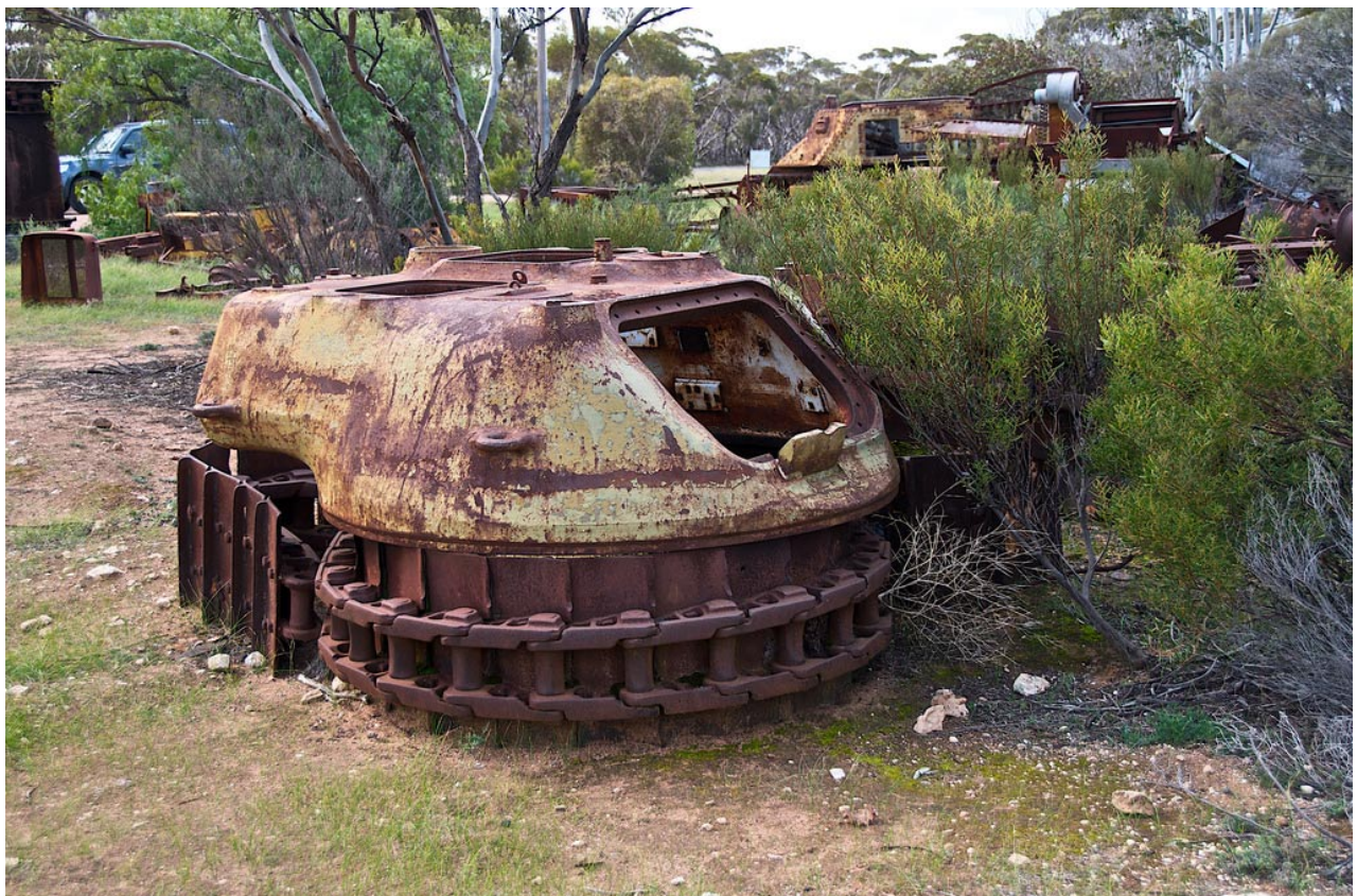
T17E1 Staghound turret on Matilda Mk ?? (A12) tank chassis – Beck Aviation and Military Museum, Mareeba (Australia)

Dirk Spennemann, July 2009 - http://www.flickr.com/photos/heritagefutures/3782432639/in/set-72157621801985831/