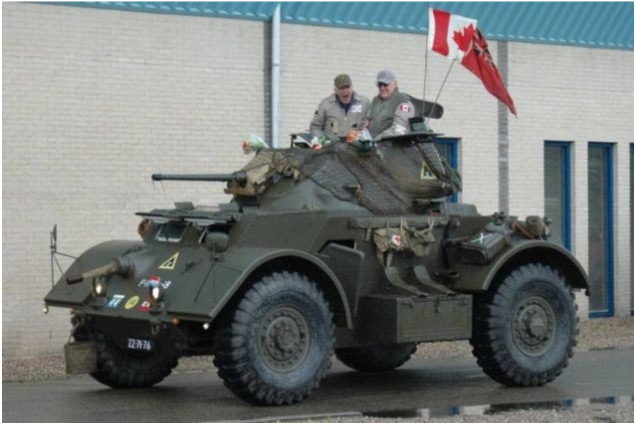
T17E1 Staghound – Legermuseum depot, Grave (part of the Legermuseum, Delft - Netherlands)

http://www.surfacezero.com/q503/showphoto.php?photo=42045&title=zz7176&cat=all