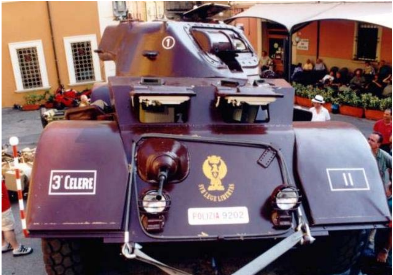
Pierantonio Farina - http://digilander.libero.it/pmg/contributi/censimento/19_m6_pol.htm

T17E1 Staghound – Reparto Storico Polizia di Stato, Autocentro di Torino, Torino (Italy)