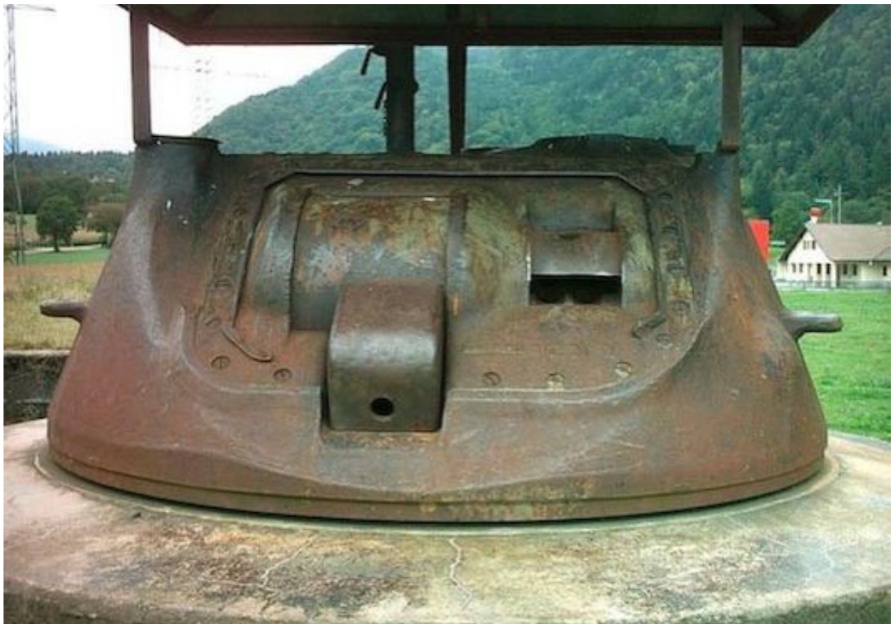
T17E1 Staghound turret – Dailly (Switzerland)

http://www.festung-oberland.ch/Waffen/Prototypen/Prototypen.html