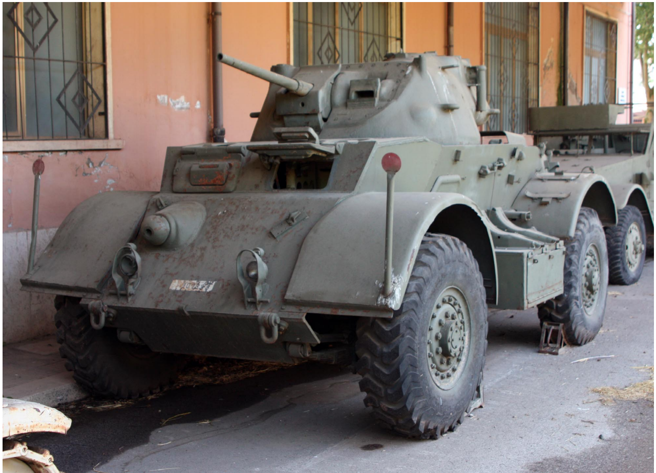
Massimo Foti, July 2009