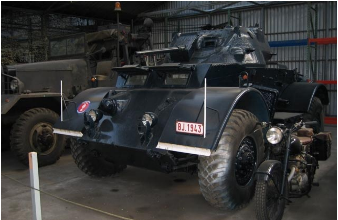
William Testaert - http://www.warwheels.net/images/staghound1_belgianPoliceTESTAERT1.jpg