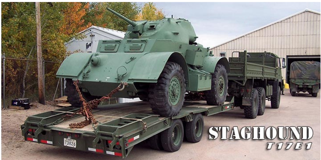
T17E1 Staghound – Canadian Forces Base, Borden (Canada)

http://www.dragoons.ca/vehicle_restoration.html