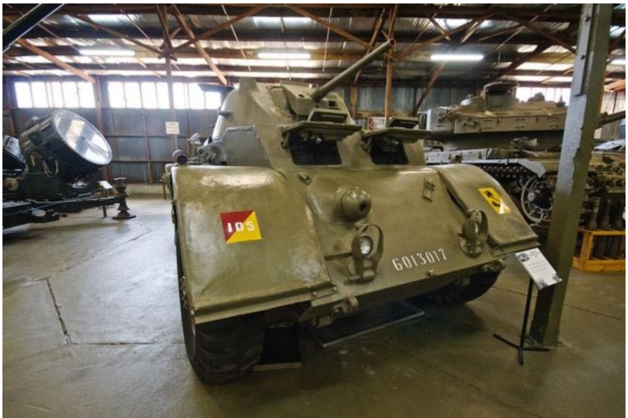
T17E1 Staghound – Private collection, NSW (Australia)

"yewenyi", April 2008 - http://www.flickr.com/photos/yewenyi/2574648471/