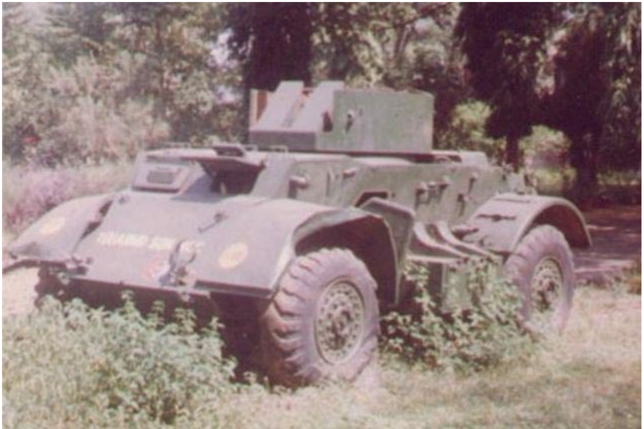
Four T17E2 Staghound AA – Veermata Jijabai Technical Institute, Matunga (India)

http://relics.warbirds.in/AndhraPradesh/Hyderabad/NCC/