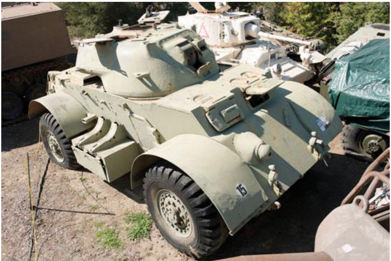
T17E1 Staghound – The Shopland Collection, Clevedon, Somerset (UK)

http://www.shoplandcollection.com/armour/61-t17-e1-staghound-armoured-car-m6