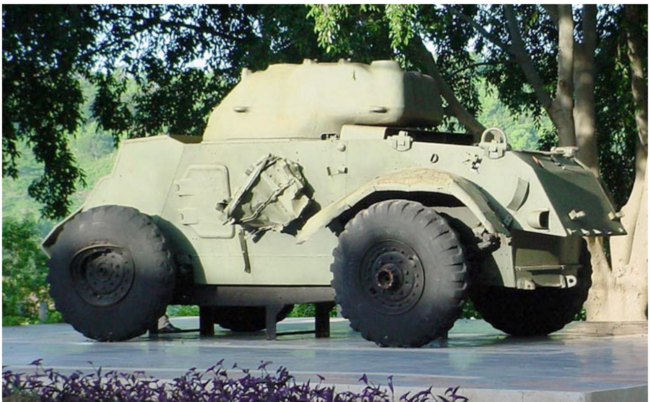
T17E1 Staghound – Reg Hodgson Collection, Alberta (Canada)

Luis Carlos Palacios Leyva, 2002 - http://www.flickr.com/photos/palaciosfotos/4017427280/in/photostream/