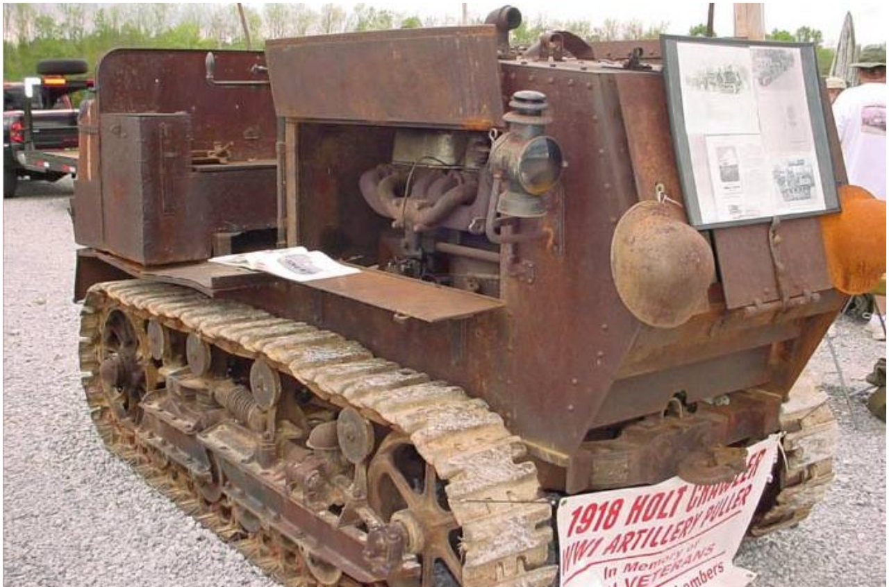
Ken Crane, April 2007 - http://www.usmilitariaforum.com/forums/index.php?showtopic=4875