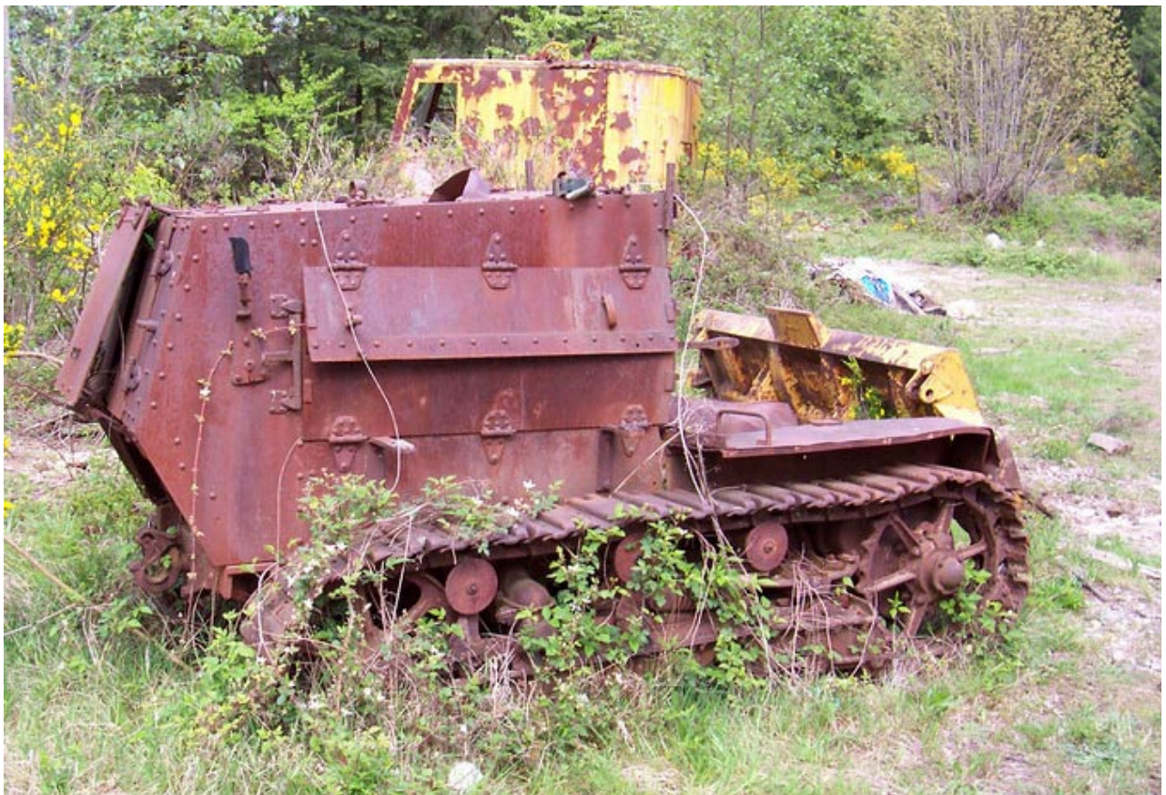
5 ton Artillery Tractor Model 1917 – Pioneer Village, Minden, NE (USA)