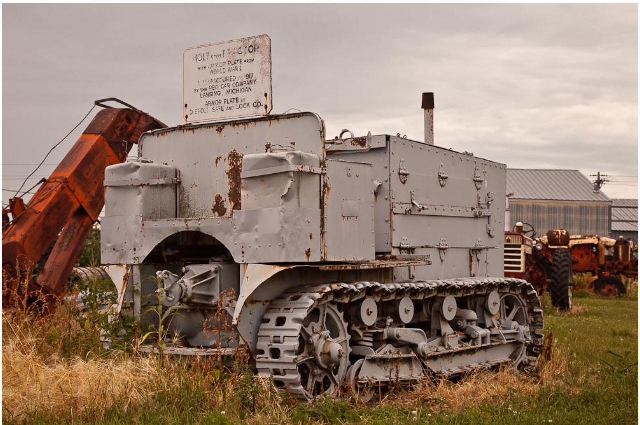
10 ton Artillery Tractor Model 1917 – Heidrick Ag History Center, Woodland, CA (USA)