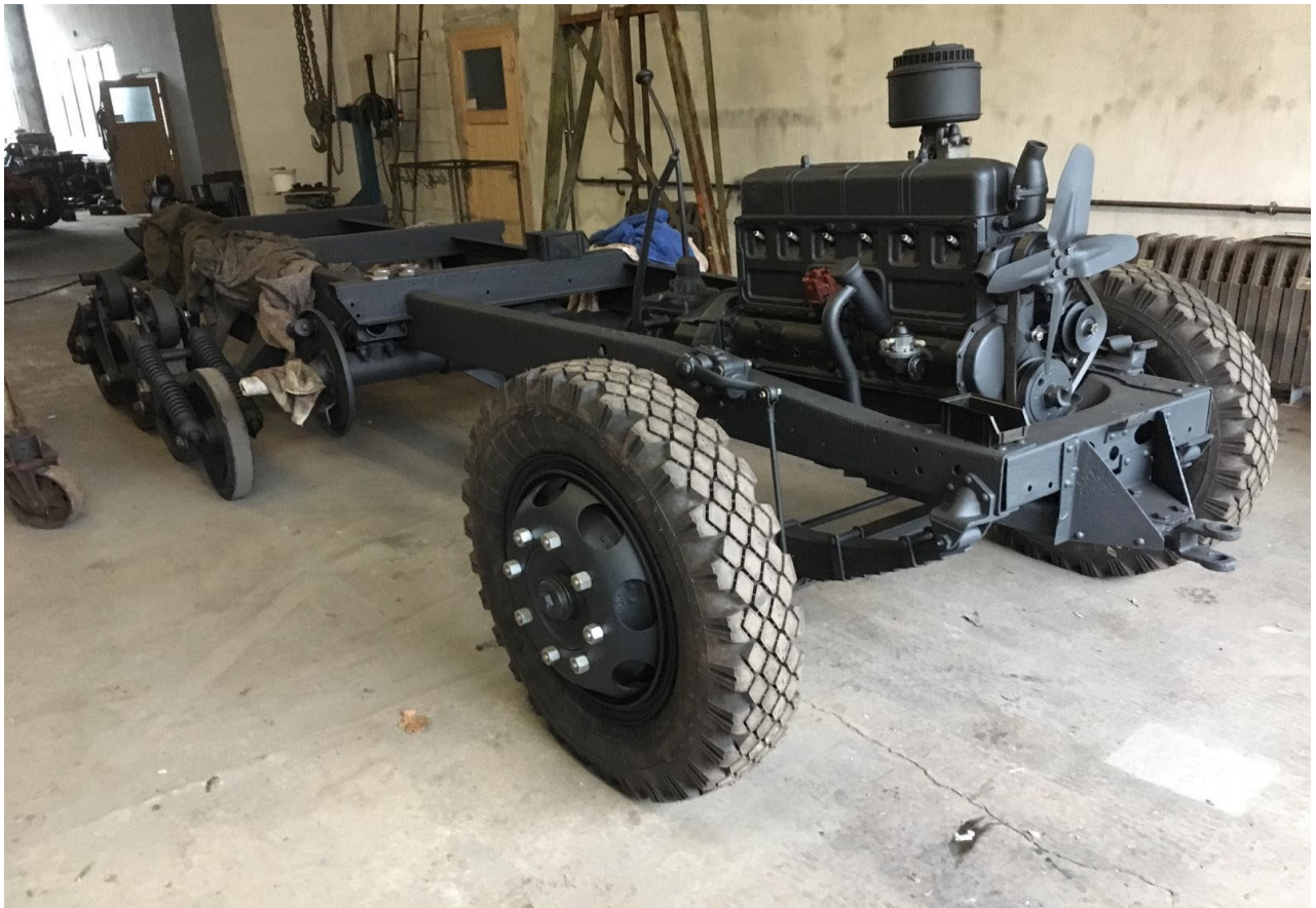
August 2019