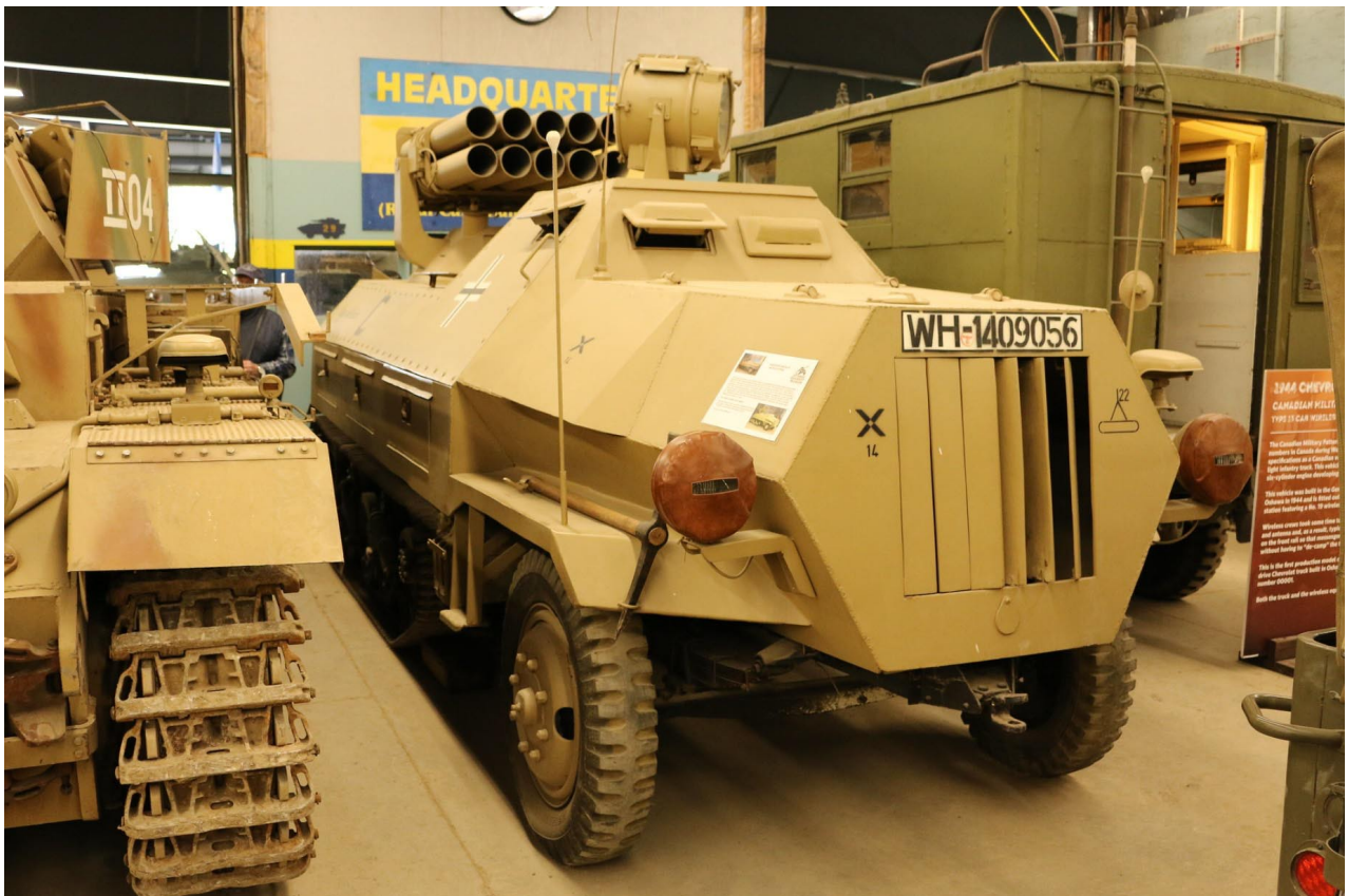
www.facebook.com , May 2019