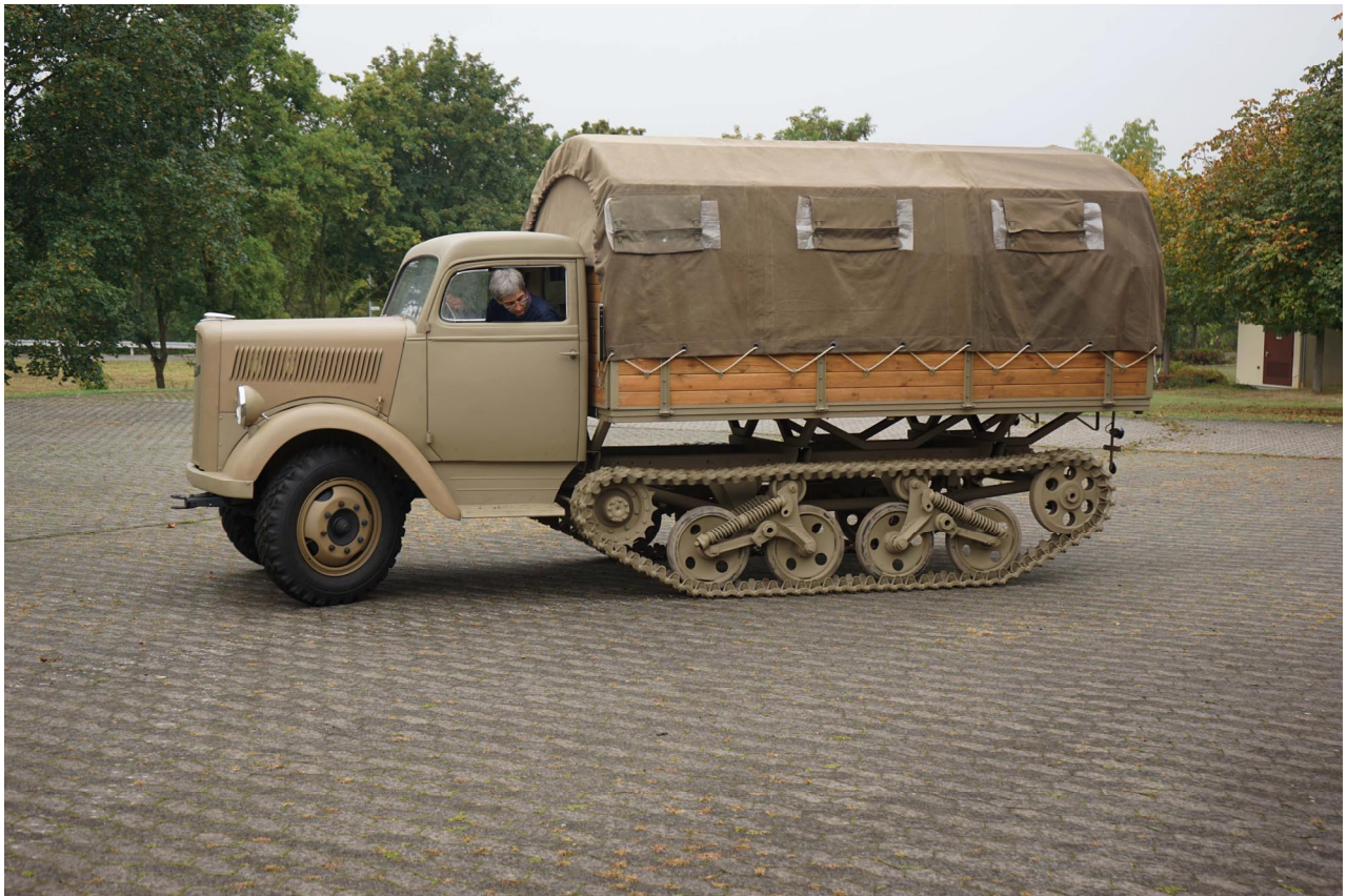
October 2016