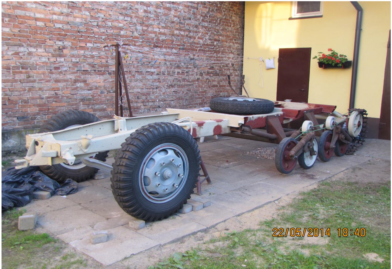
Picture provided by the owner, May 2014