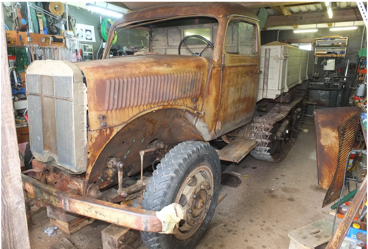
www.facebook.com , July 2019