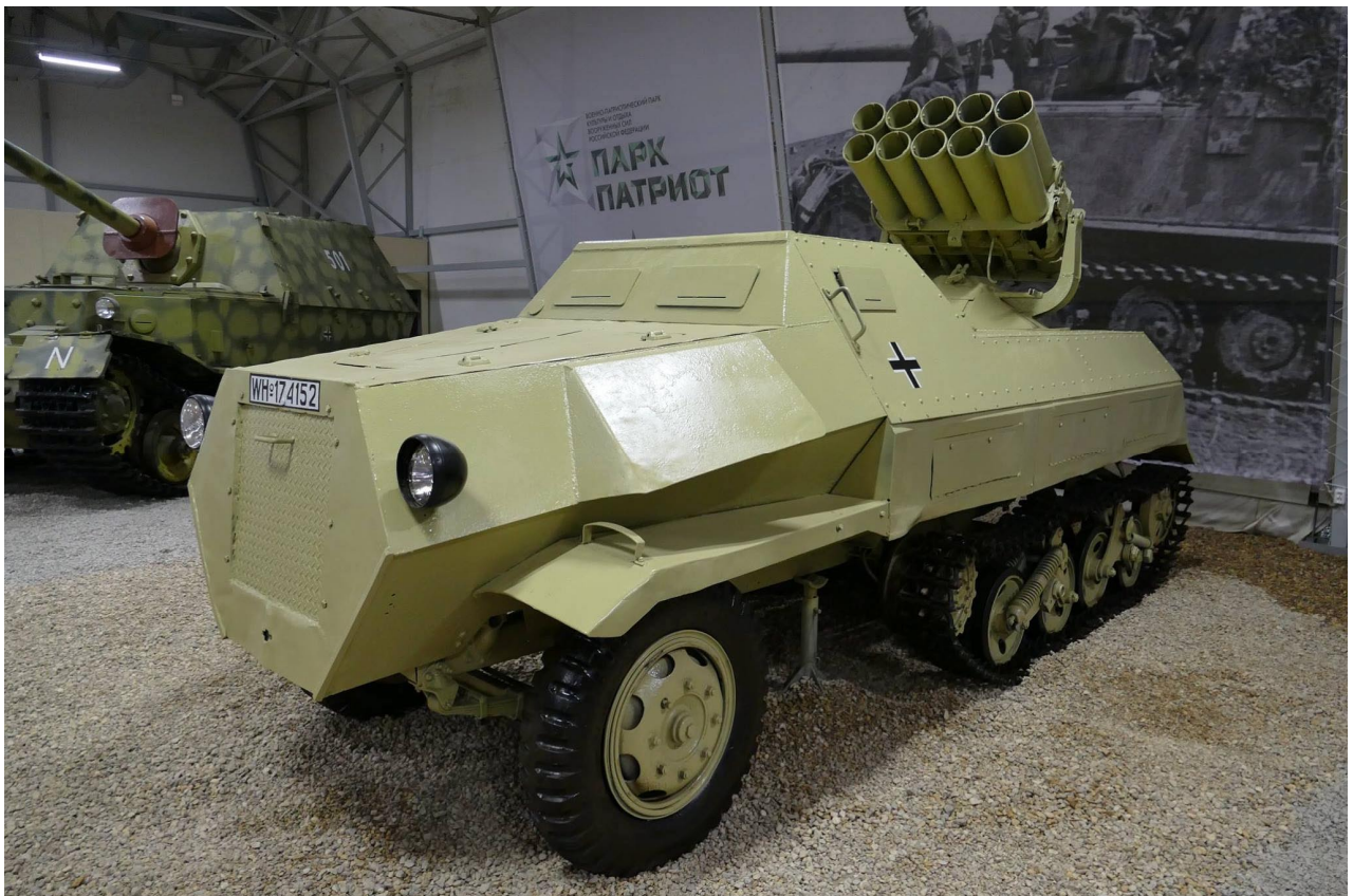
Sdkfz. 4/1 15cm Panzerwerfer 42 auf Maultier – Musée des Blindés, Saumur (France)