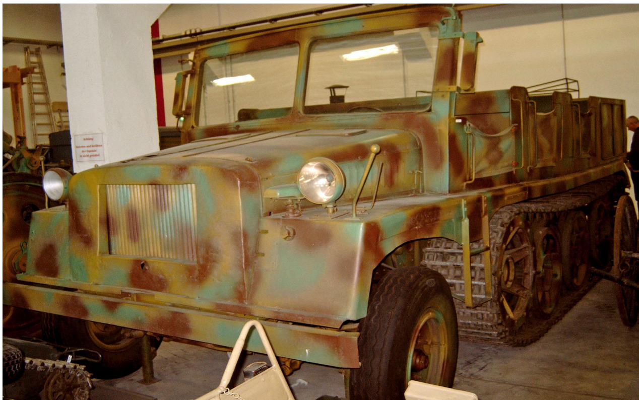
Falk Springer, March 2007 - http://fahrzeuge-der-wehrmacht.de/Artikel/SWS.html

This is one of the 5 Versuch Vehicles that were built. Fahrgestellnummer 2021, built by Büssing-Nag