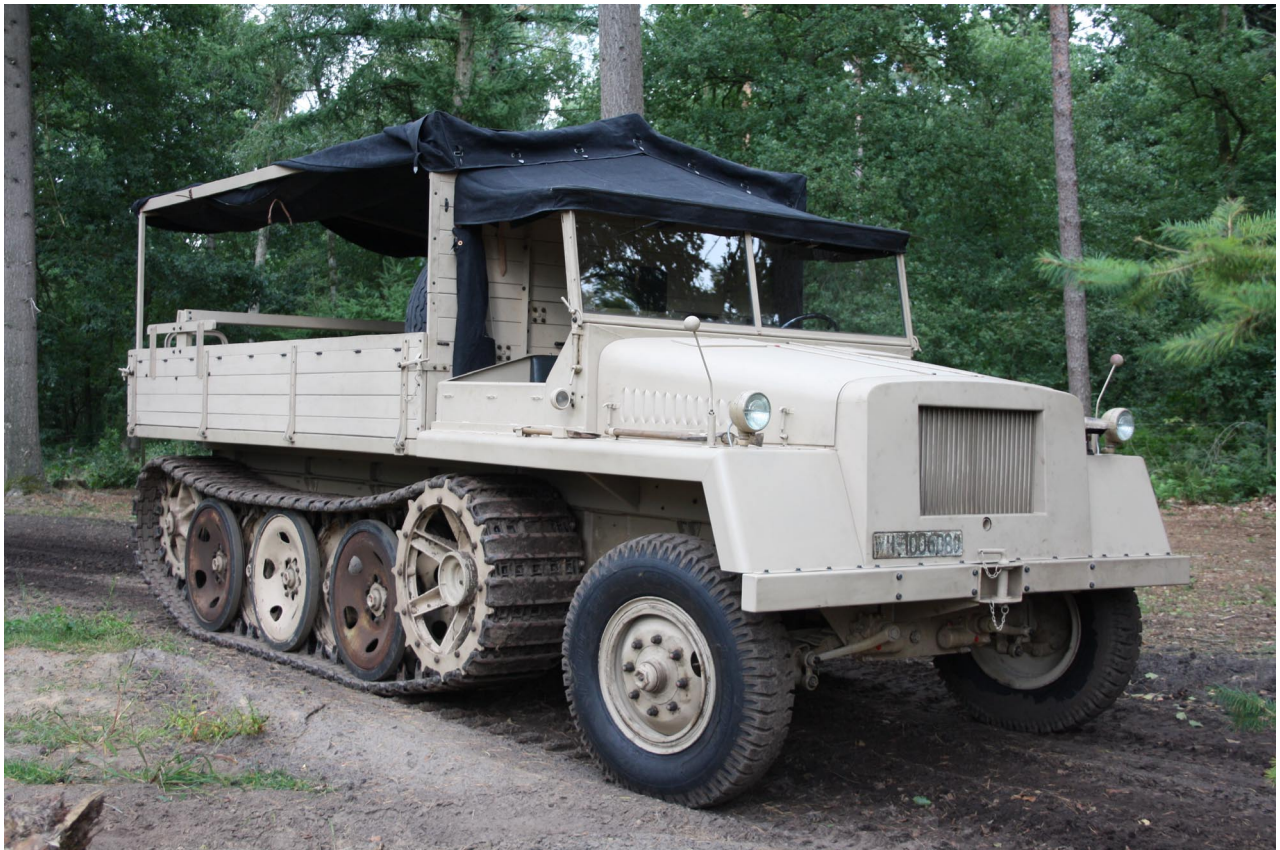
Walter Schwabe, Sept 2017