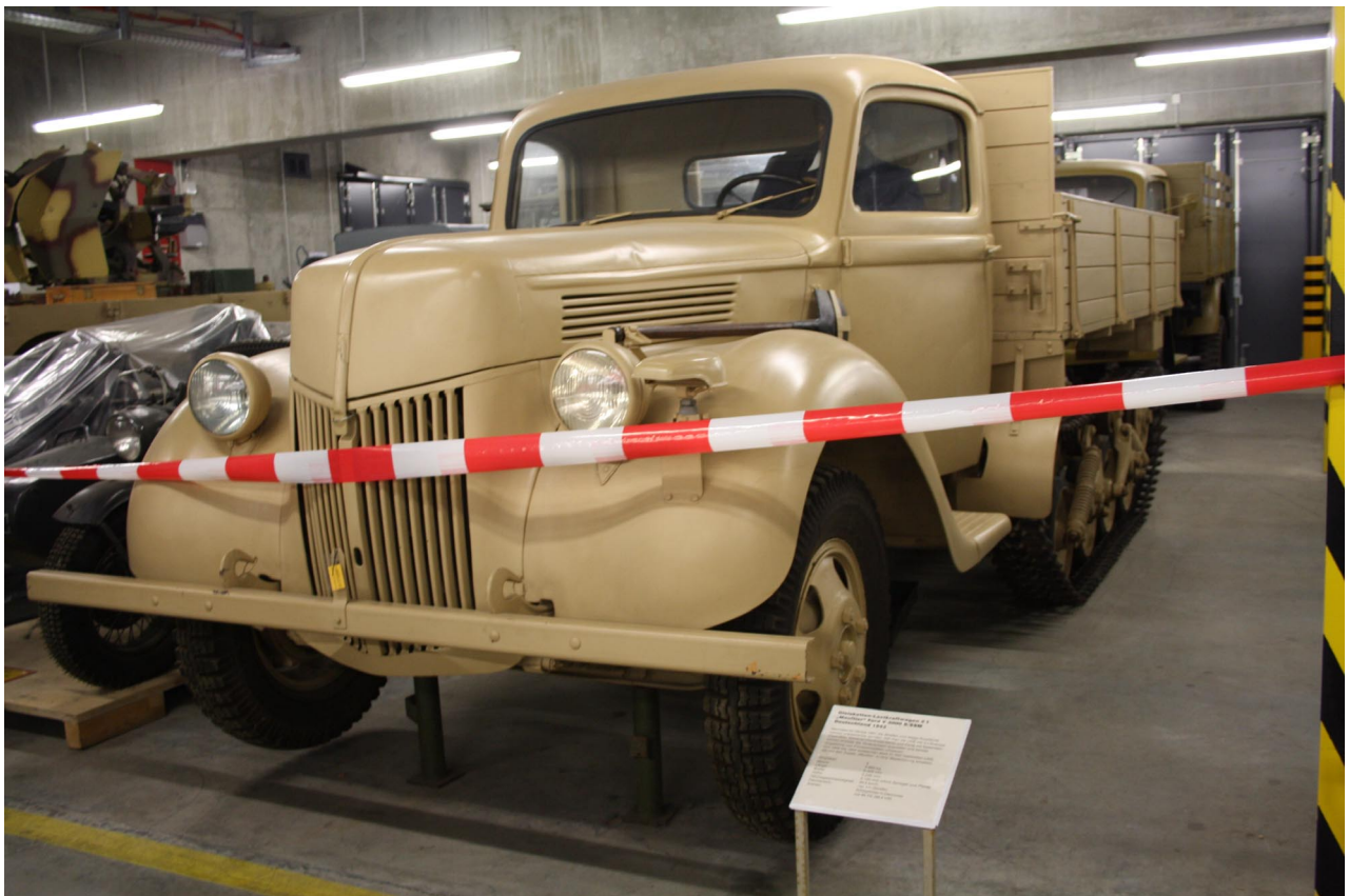
Walter Schwabe, July 2015

Ford Maultier – Kevin Wheatcroft Collection (UK) – running condition