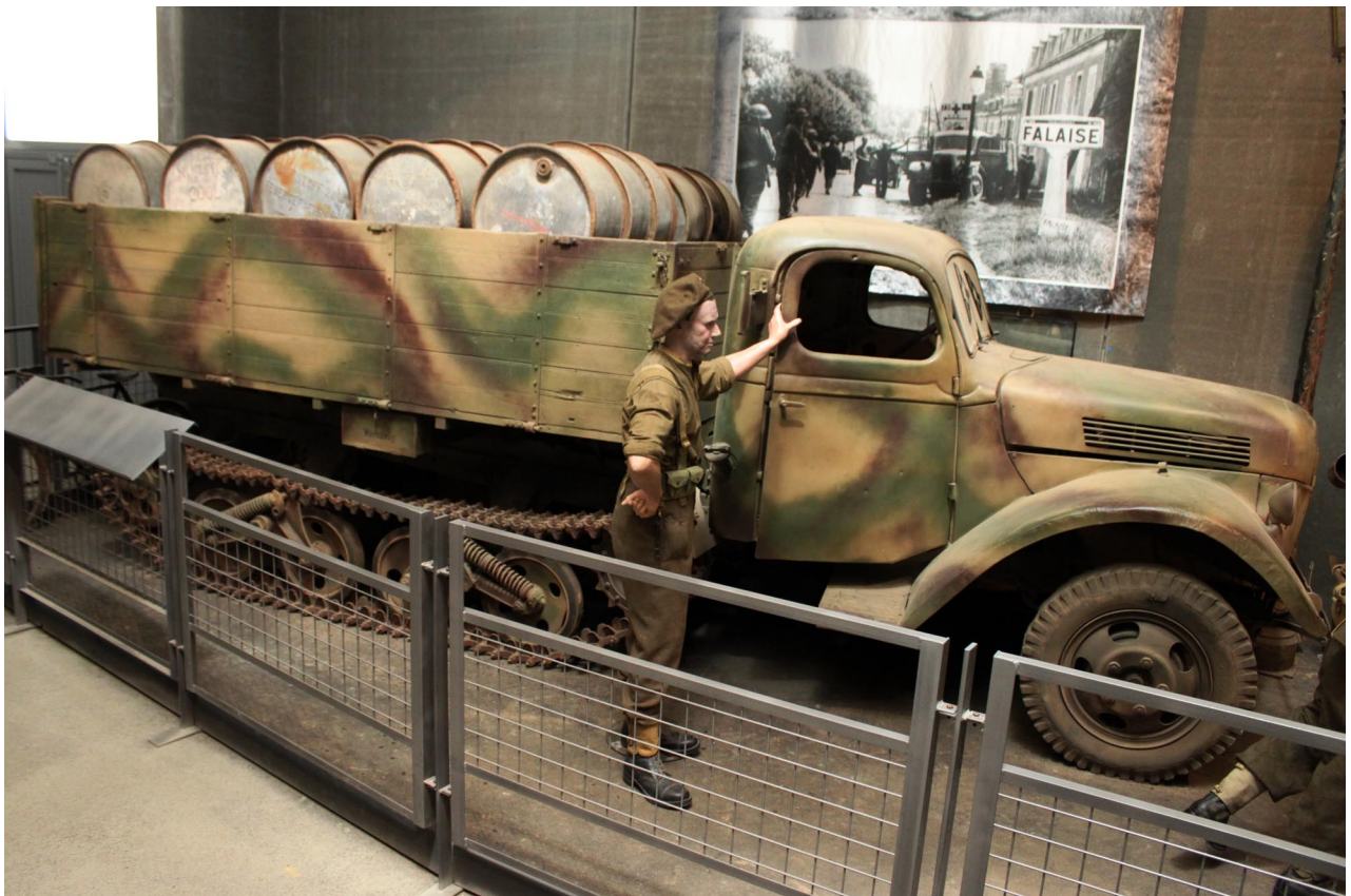
Ford Maultier – MM Park, La Wantzenau (France) – running condition

February 2013 - http://www.asphm.com/vehicules/SdKfz_3B_FORD_V3000_Maultier/SdKfz_3B_FORD_V3000_Maultier.php